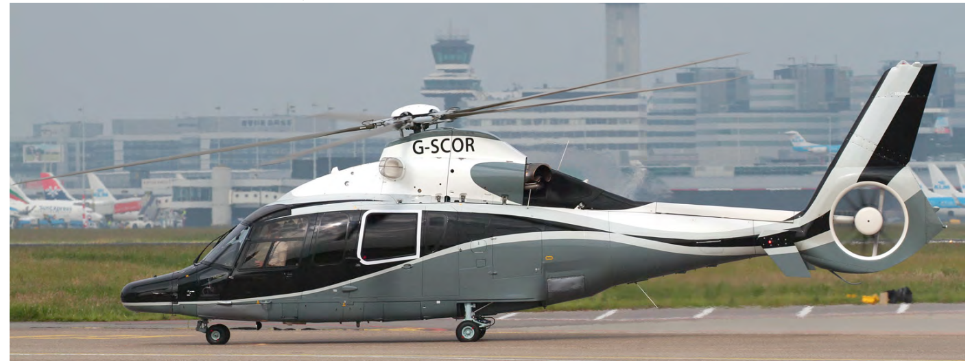
In 2014 this EC155B1 was registered to Starspeed. It operated two flights in the country before it departed to France. The helicopter has the same colours as Airbus A319CJ M-KATE which is registered to the Sophar Property Holding, a company linked to Dmitry Rybolovlev. (Amsterdam - Schiphol, 3 June 2018,)