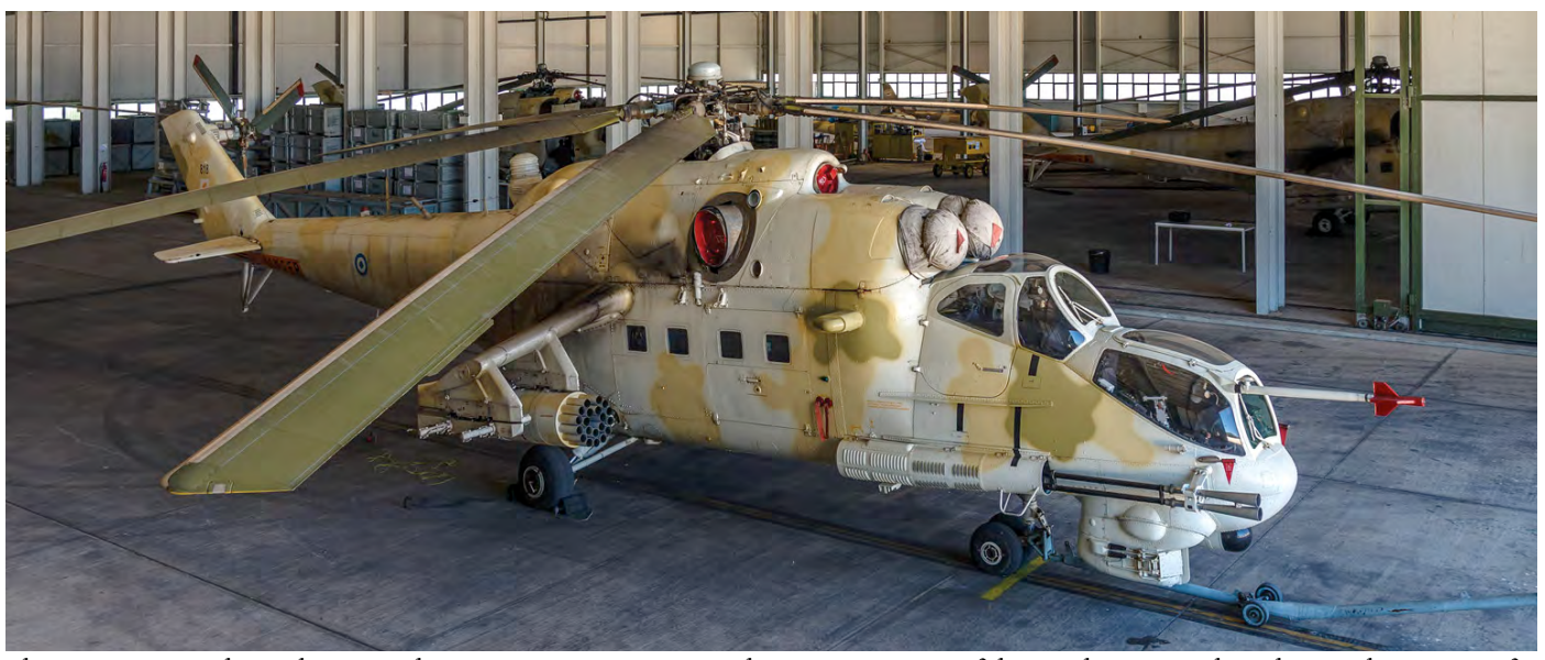
The Cyprus National Guard Air Wing has some interesting types in their inventory. One of them is the Mi-35. Hilco Schiqt paid a visit to Pafos on 6 June 2018 and was lucky to photograph one of their Hinds.