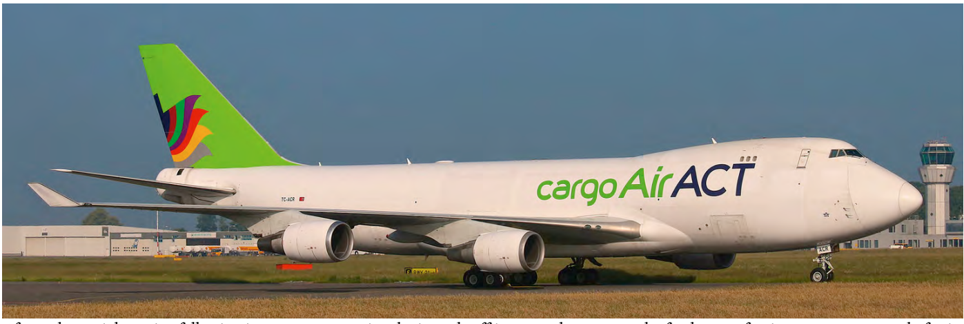
After substantial repairs, following its runway excursion during takeoff in November 2017, and a fresh coat of paint TC-ACR was ready for its first flight in these ACT Cargo colours. Pascal Lamberiks was able to take this photo while the Boeing 747 was doing engine runs three days before it took to the air again. (Maastricht - Aachen, 6 June 2018)