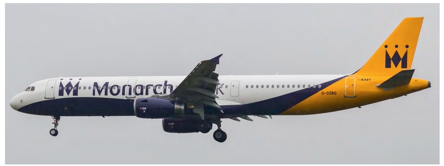
This Airbus A321 was delivered to Monarch Airlines until the company went bust in October 2017. The aircraft was registered to Archway Aviation (Ireland) on 18 January 2018 but deregistered on 28 June 2018. G-OZBG is most probably destined for Ural Airlines. (Woensdrecht, 1 June 2018)