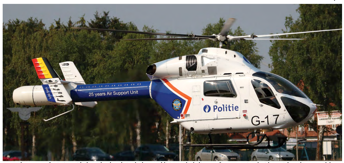
To mark 25 years of aviation with the Federale Politie, the latest addition to the helicopter fleet was painted with special markings to celebrate this occasion. (Genk/Zwartberg, 24 July 2018, Toon Cox)