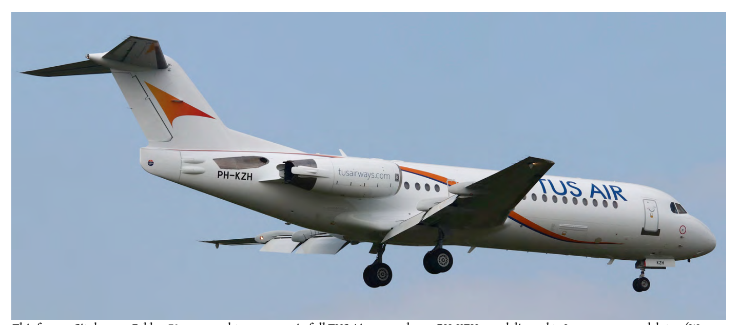
This former Cityhopper Fokker 70 was caught on camera in full TUS Airways colours. PH-KZH was delivered to Larnaca one week later. (Woensdrecht, 5 June 2018, Rick ten Broek)