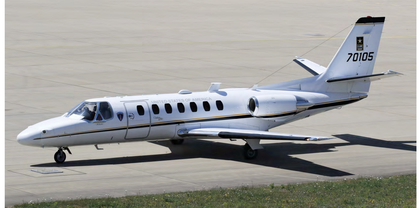
The US Army still has four UC-35s based in Europe with 1/214th AVN at Wiesbaden. Therefore they are regularly seen in Europe. (Eindhoven, 20 July, Martin Uleman).