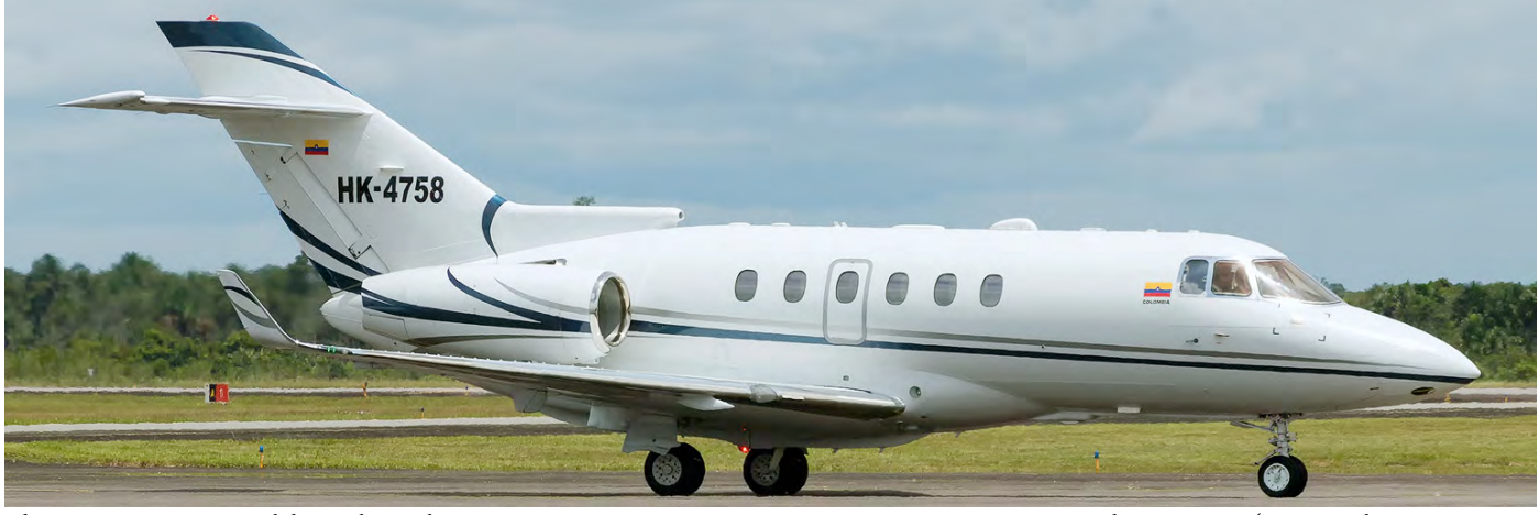
This BAe125-900XP was delivered to Helistar in January 2011 as N6409A. In June 2011 it was reregistered to HK-4758. (Paramaribo, 21 June 2018,)

SLM managed passenger services with their own aircraft this month so no nice hired in aircraft. The Roraima aircraft on the 3rd came to bring passengers to connect on SLM. On the 19th the first ever visit of an Indian head of state for a three