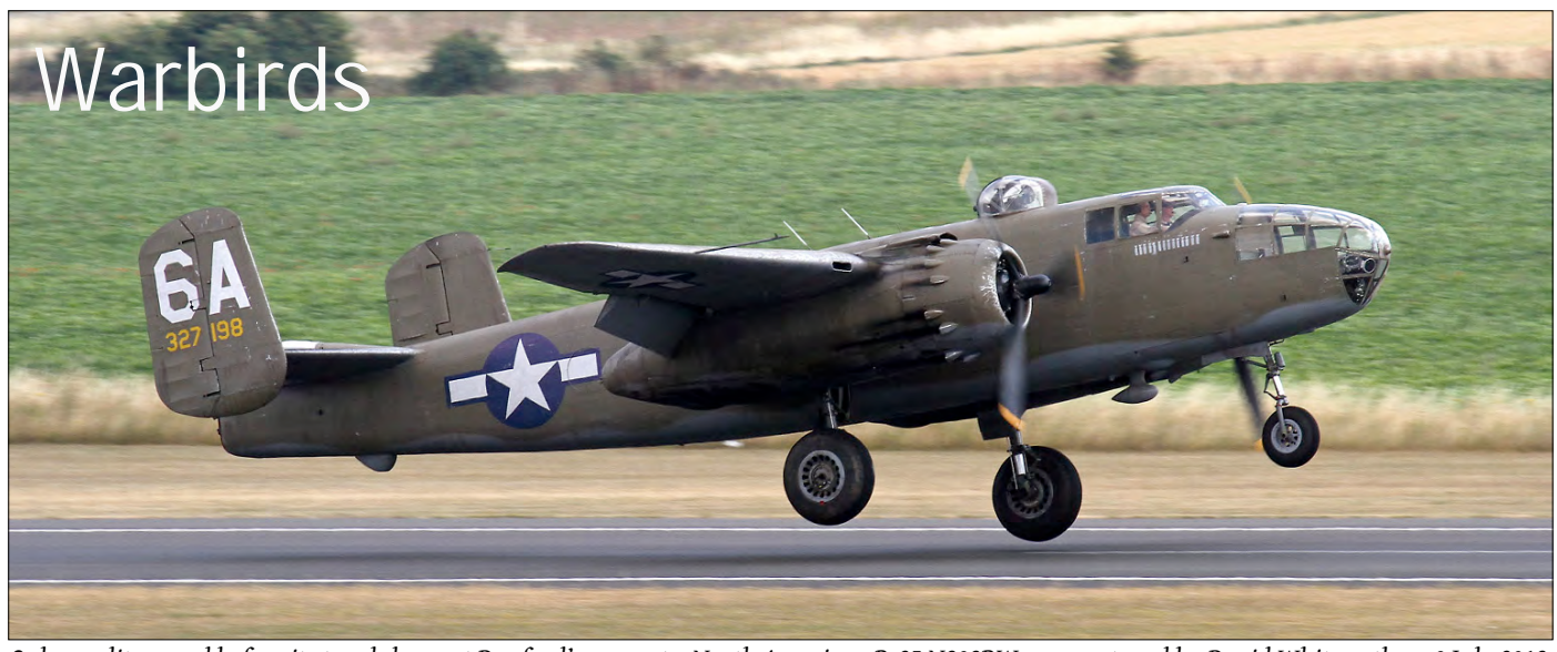
Only a split second before its touchdown at Duxford's concrete, North American B-25 N898BW was captured by David Whitworth on 9 July 2018. The vintage bomber owned by the Tri-state Warbird museum was used in the filming of a remake of the Seventies movie 'Catch 22'. In contrast to the original movie this time only two Mitchells were used, the second one being N3675G 'Photo Fanny' owned by Planes of Fame. But without any doubt, more computer animated B-25s will appear in the new 'Catch 22'.