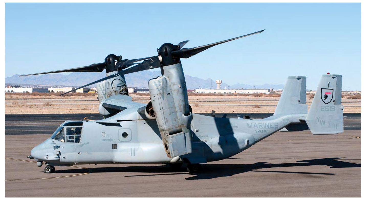
For the military spotters; civil airports in the United States are always worth a look as they are visited by miltary aircraft once in a while. Joost de Wit was lucky to catch one of the MV-22Bs of VMA-165 during taxiing at El Paso (TX). (23 January 2018)

Northwest of El Paso, a few miles across the state line, the Dona Ana County International Jetport can be found. As the name might suggest, quite a lot of bizjets are based at this airport. Most of them are parked inside the hangars on the east side. The museum and airport management office are located in the centre area, whereas the Francis Aviation FBO is located on the far west side. Apron access was not a problem here either and I used my car to check out the dozen rows of hangars. The Invader is stored on the east side, whereas the Super DC-3 can be found on the main apron. The three museum aircraft are parked on the main apron as well, in front of the museum building. The old Apache was stored right next to a hangar without rotor blades, while the new