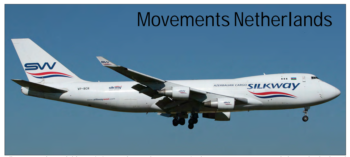
Silkway West Airlines took delivery of a former Malaysia Airlines Boeing 747 freighter in May 2018. VP-BCR was only decorated with titles and a tail logo. (Amsterdam - Schiphol, 30 June 2018, Robert Eikelenboom)