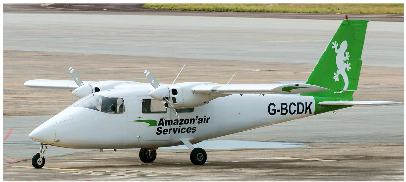
This Partenavia P68B was first registered in the UK in 1984. In June 2016 G-BCDK was registered to Amazon'Air Services in France, operating actually in France Guyana. (Paramaribo, 21 May 2018,)