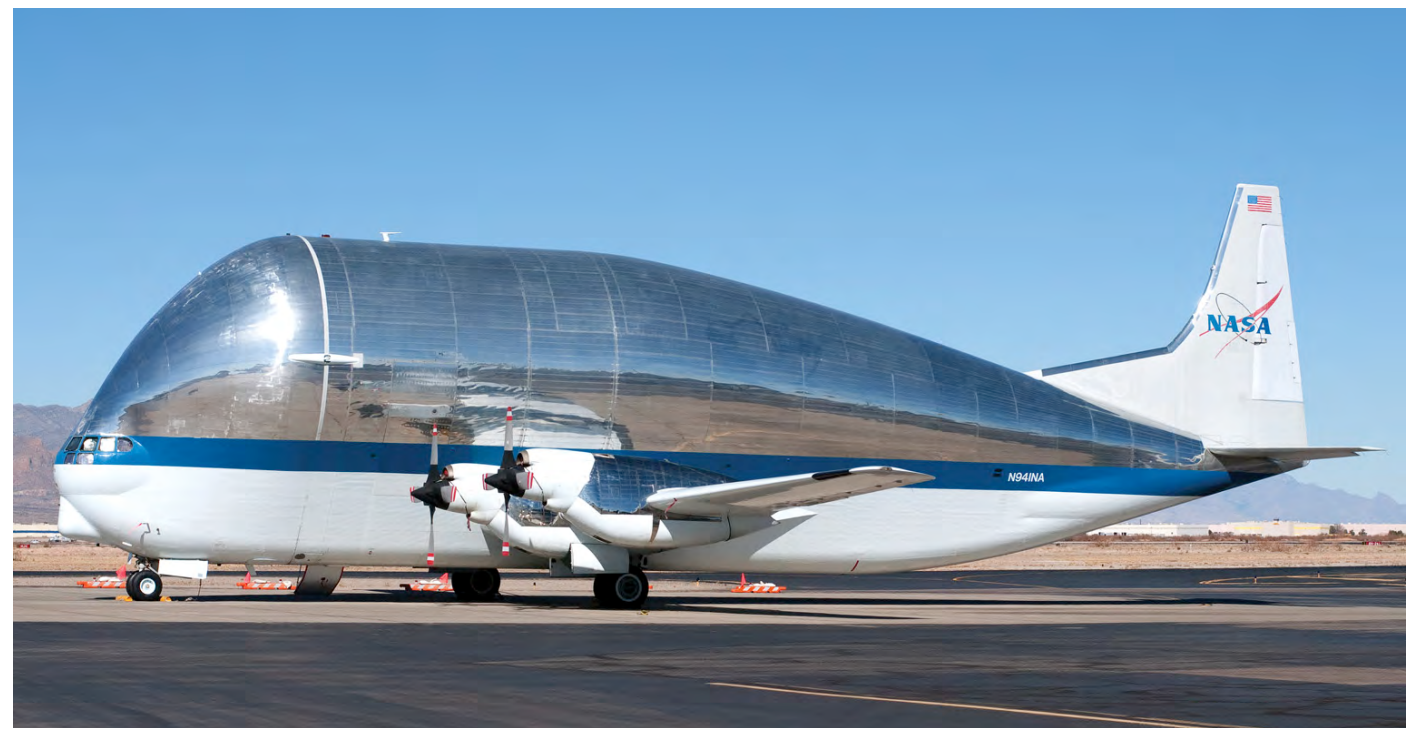
NASA's N941NA is the last operational Super Guppy left in the World. This example was built for Airbus and flew for them as F-GEAI / No.4 until 1997 when NASA bought the aircraft to use it for the transportation of parts of the International Space Station. (El Paso (TX), 23 January 2018, Joost de Wit)

be photographed best in the morning. Southwest Aviation and Francis Aviation are the two FBOs; the latter is located inside the main terminal building and willing to grant airside access (I didn't ask or need it at Southwest Aviation). Just east of the Francis Aviation apron there is a hangar of the Army National Guard, which is no doubt the reason of the frequent military visitors. Due to the type of traffic at this airport, it is always a surprise if and what you will catch, but spending at least one afternoon here should be worthwhile.