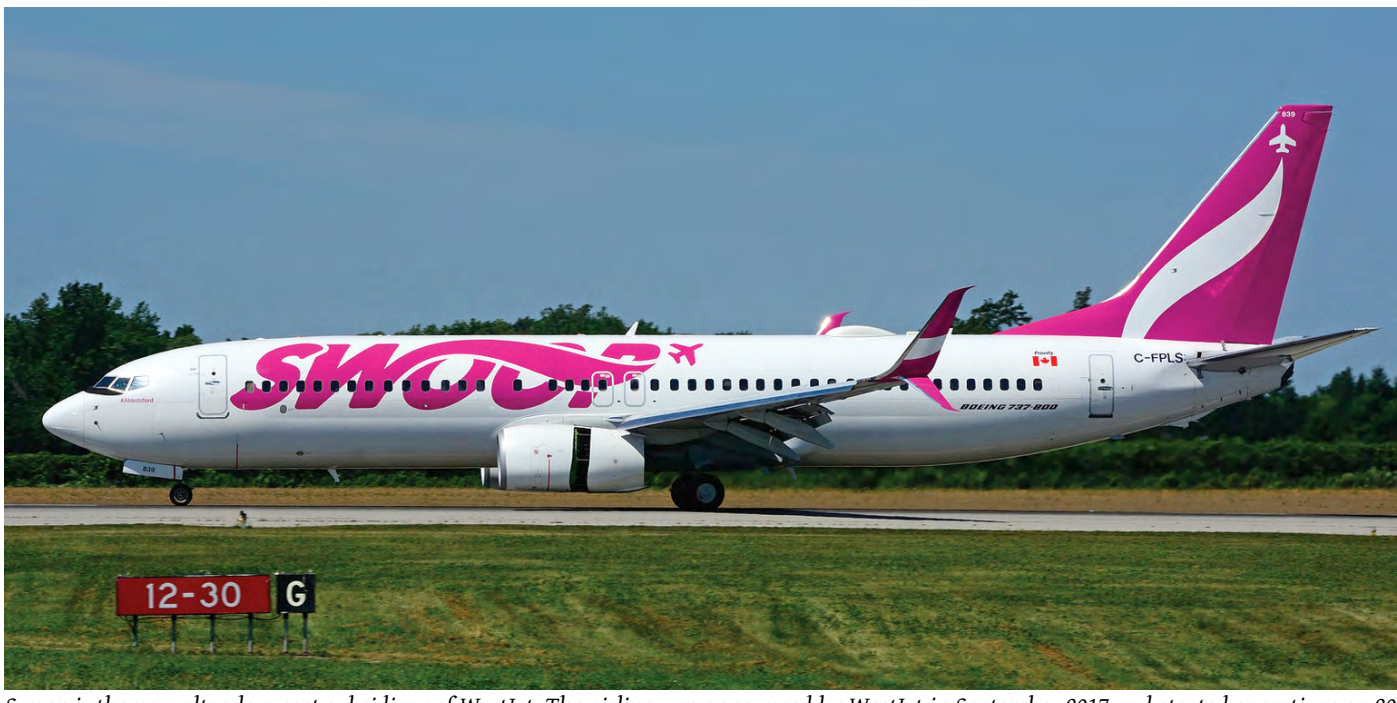
Swoop is the new ultra-low-cost subsidiary of WestJet. The airline was announced by WestJet in September 2017 and started operations on 20 June 2018. The airline is based in Calgary (Alb.) and was named after WestJet's desire to "swoop" into the Canadian market with a new business model. Swoop started operations with two 737-800s, which were transferred to the airline from parent WestJet. C-FPLS is one of them and is seen here on John C. Munro Hamilton International Airport, near Mount Hope (Ont.) on 15 July 2018.