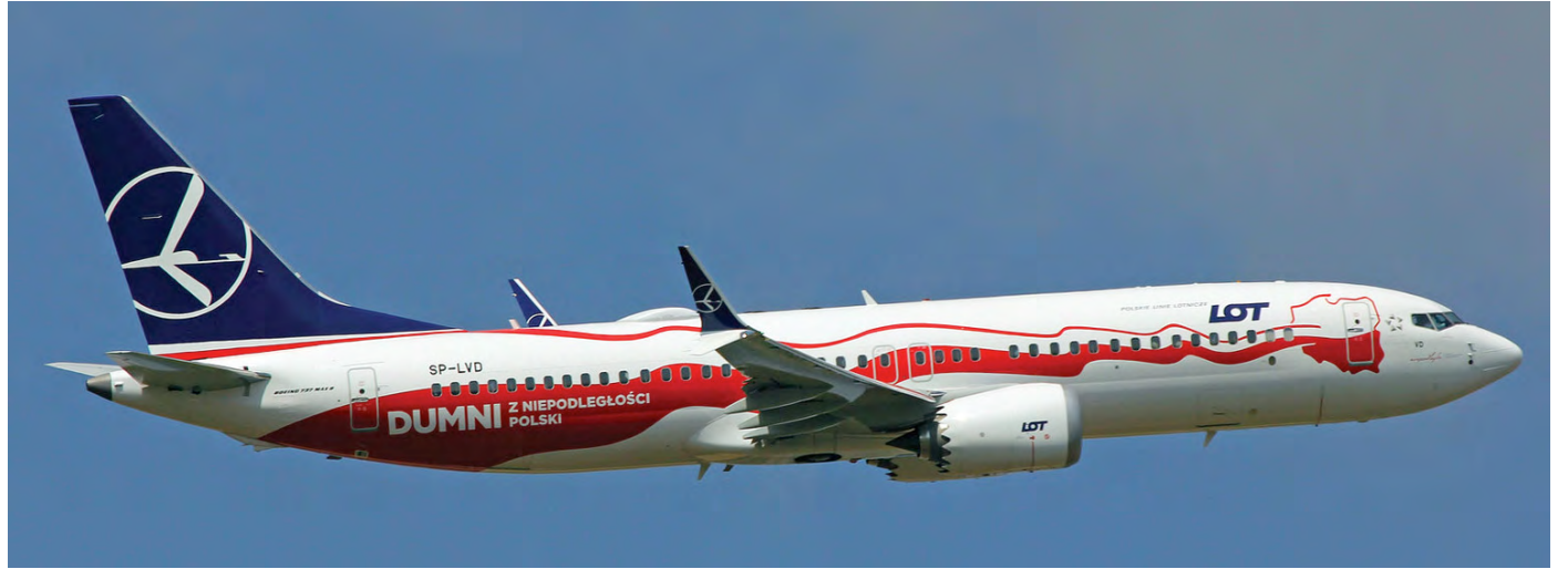
The fourth 737-8 delivered to LOT Polish Airlines wears a special colour scheme to celebrate 100 years of Poland's independence. A hundred years ago Poland regained independence from the German, Austrian and Russian empires on 11 November 1918, after World War I came to an end. The fourth Polish 737-8 is registered as SP-LVD and was delivered to Warsaw on 27 June. (Amsterdam-Schiphol, 21 July 2018, Pino Tome)

During a press conference at the Farnborough Airshow, the Minister of State of Aviation of Nigeria announced the new national carrier of the country to the world. The new airline will be named <u>Nigeria Air</u> and it is planning to start opera-