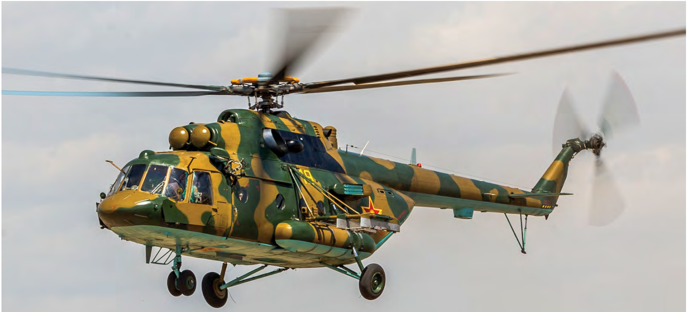
The Mi-17V-5, like this '19y', is the backbone of the KADF. Up to 24 of this Kazan built Mi-8 variant are known to have been delivered the past decade. The KADF is currently receiving a number of Ulan Ude built Mi-171Sh. (Astana, 25 May 2018,)