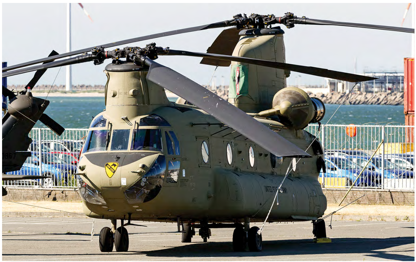
The various transits of US Army helicopters to and from Europe deliver a lot of updates for the Scramble US Army database. Dino van Doorn was in Zeebrugge to take a few photographs of the helicopters just after they arrived from Spangdahlem Air Base (2 July 2018).