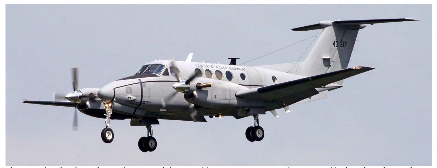
The C-12V is based on the Beech 200 and is an upgraded version of the C-12R. C-12V 94-00317 is being operated by the 2nd Battalion, 228th Aviation Regiment part of the 244th Expeditionary Combat Aviation Brigade. (Rotterdam -The Hague, 3 June 2018,)