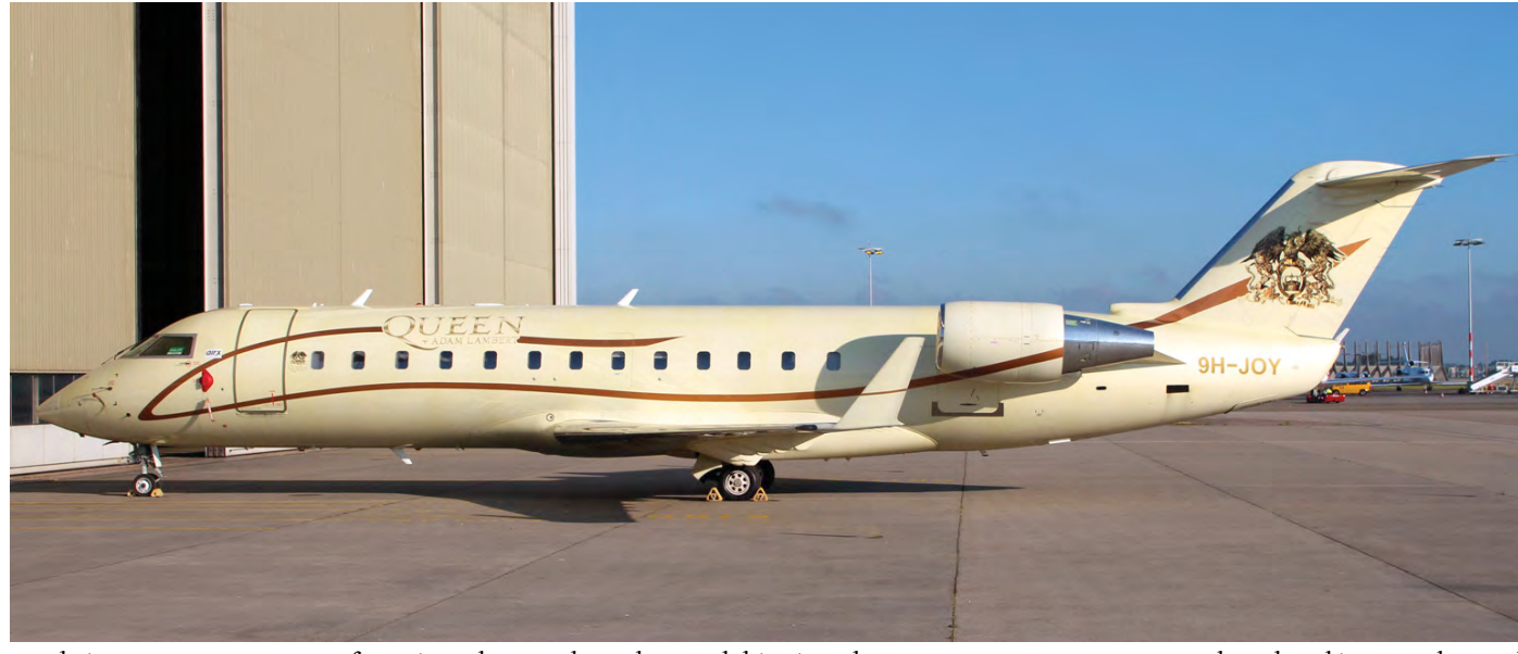
For their European Tour, Queen featuring Adam Lambert chartered this Air X Charter CRJ200 9H-JOY. On 27 June they played in Rotterdam and on 29 June they did their gig in Antwerp. During these days the aircraft was parked at Amsterdam-Schiphol. (29 June 2018,)

<u>Credits</u>: Airfleets, Airline-List, Flightglobal, Planespotters and Skyliner.