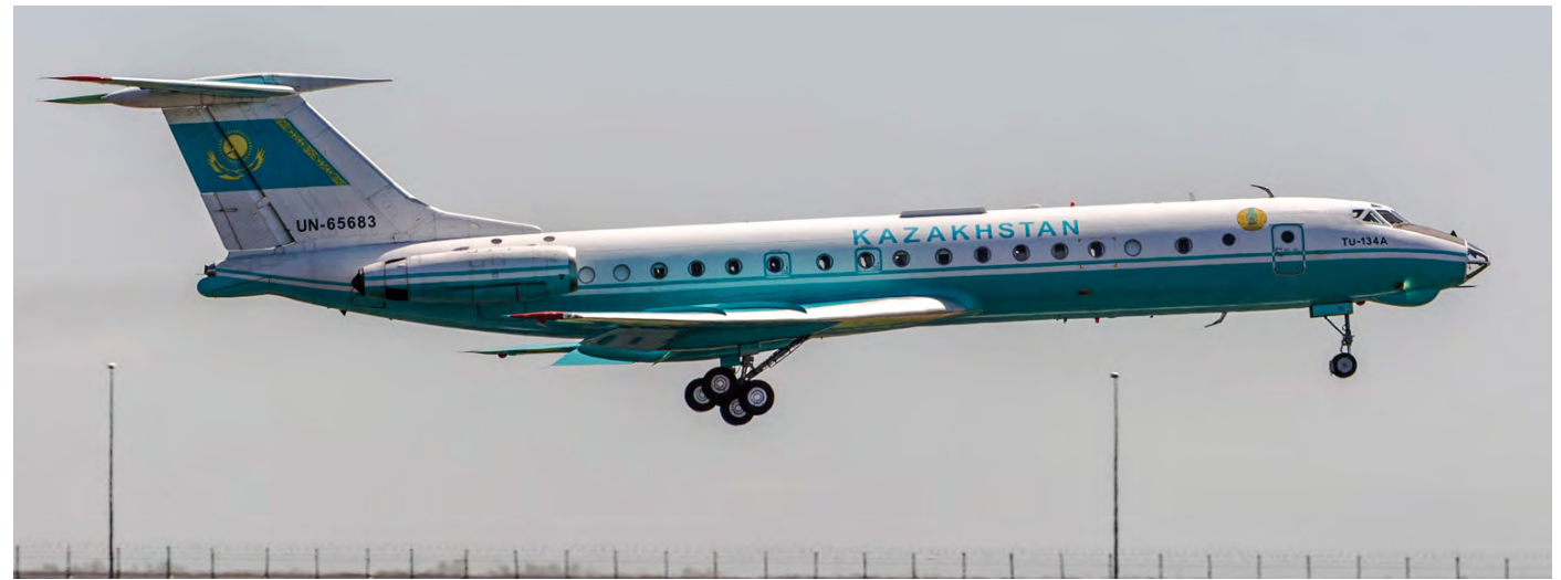
The number of Soviet era Tupolevs is gradually decreasing. The Kazachstan government operates Tu-134 UN-65683 that departed and arrived from a trip to Almaty during KADEX, much to the delight of the spotters present. (Astana, 26 May 2018)