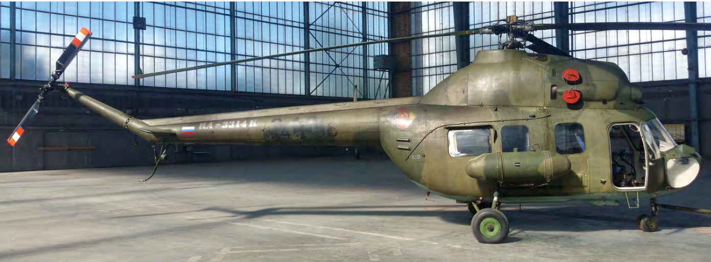
Former Werneuchen Mi-2 94+56 is now parked in the large hangar at Neuhardenberg. Its former NVA serial 310 is still visible and it is also marked with the no longer valid RA-3314K registration (2 July 2018, Tim Jones)

94+56 Mi-2 RA-3341K 56824114 jul18 Ex Werneuchen Mi-2 is parked in the large hangar.