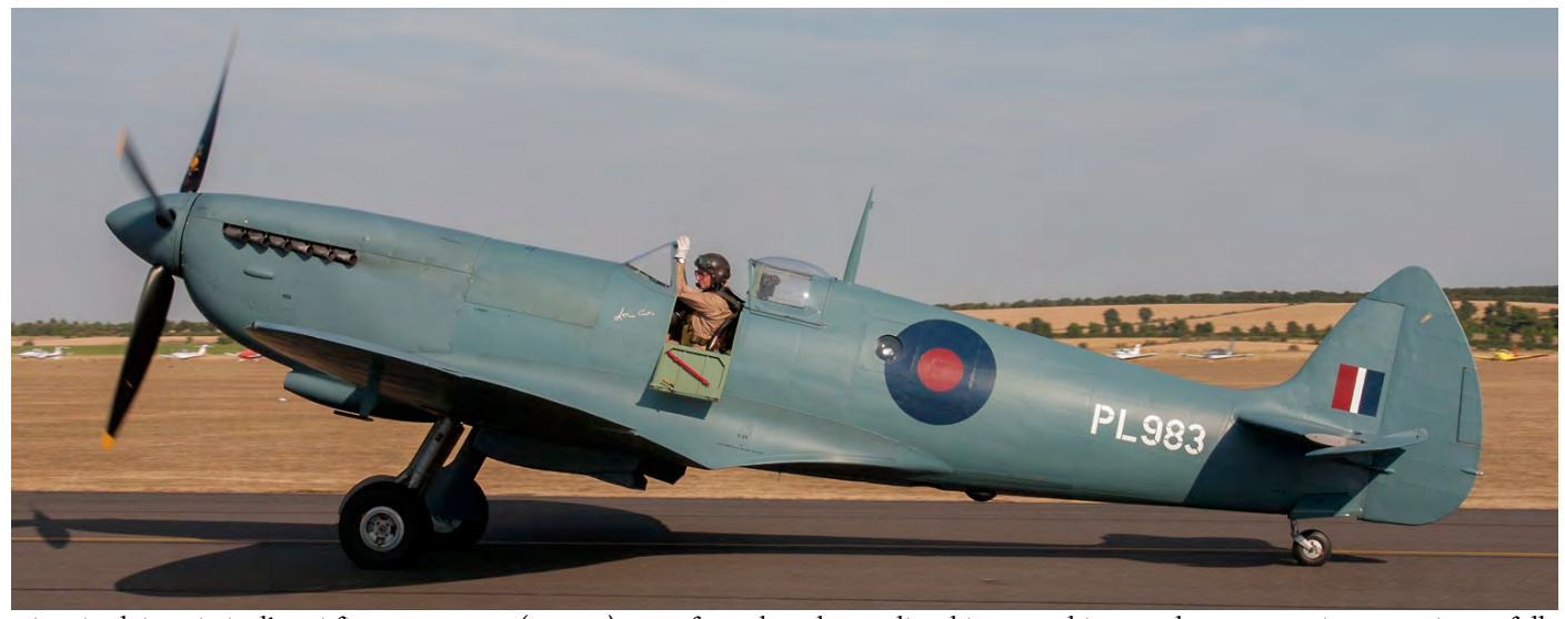
Historic Flying Limited's Spitfire PR.XI PL983 (G-PRXI) arose from the ashes earlier this year. This rare photo reconnaissance Spit was fully restored by HFL after it crashed in Rouen, France in June 2001. (Duxford, 15 July 2018,)

as N3093K and sent it to Duxford for a full restoration which started in 2003!