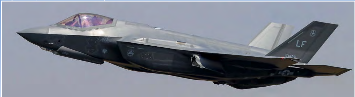
Not to be missed at any major airshow in Europe, the USA and many other places for the next decades is the Lockheed-Martin F-35. F-35A 15-5125/LF operated by 56th Fighter Wing was one of them at the RIAT. (Fairford, 13 July 2018, Steward Jack)