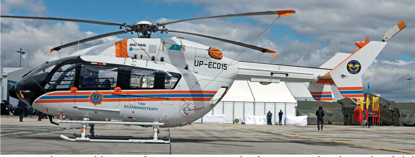
Kazaviaspas is the air wing of the Ministry of Emergency Situations. A number of EC145s was manufactured in Kazachstan for both Kazaviaspas and the Kazachstan Air Defense Forces. (Astana, 23 May 2018, Paul van der Linden)