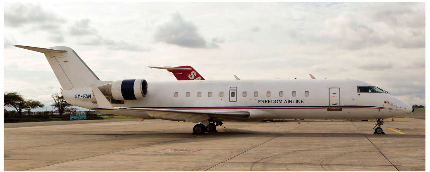
This ex-Lufthansa Cityline Bombardier CRJ200 5Y-FAN belongs to the fleet of Kenyan Freedom Airline Express. Freedom Airline Express is a low cost airline in Kenya which operates a short-haul domestic network and charter services out of Jomo Kenyatta International Airport and Wilson Airport in Nairobi – Kenya. Besides this CRJ200 their fleet consists of another CRJ200, six Embraer Brasilias, two Fokker 50s and one Eurocopter EC120. (Nairobi, 15 March 2018,)