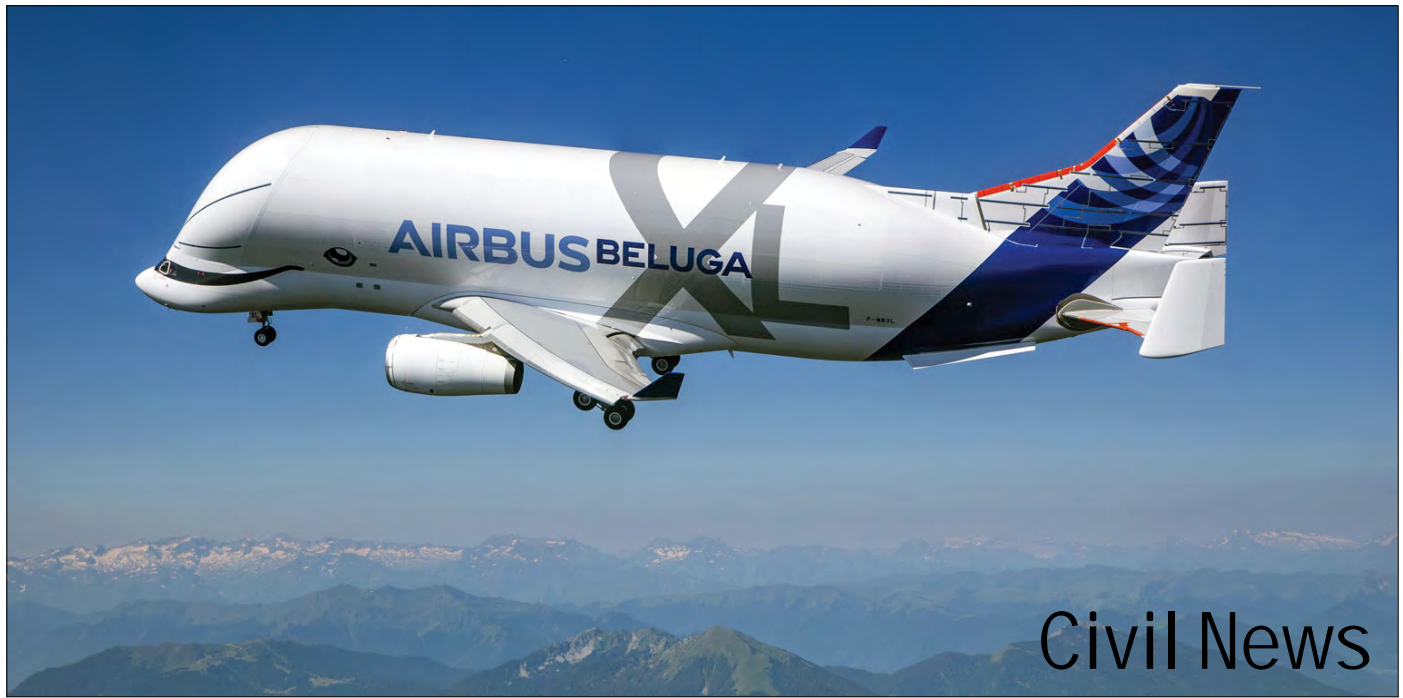
On Thursday 19 July 2018 the new Airbus BelugaXL made its first flight. The BelugaXL is based on the Airbus A330-200 and is officially designated as A330-700L. Airbus is planning to build four BelugaXLs, which will replace the current five BelugaSTs in their fleet. The test aircraft was registered as F-WBXL and sported special "White Whale" markings. (In flight, 19 July 2018).