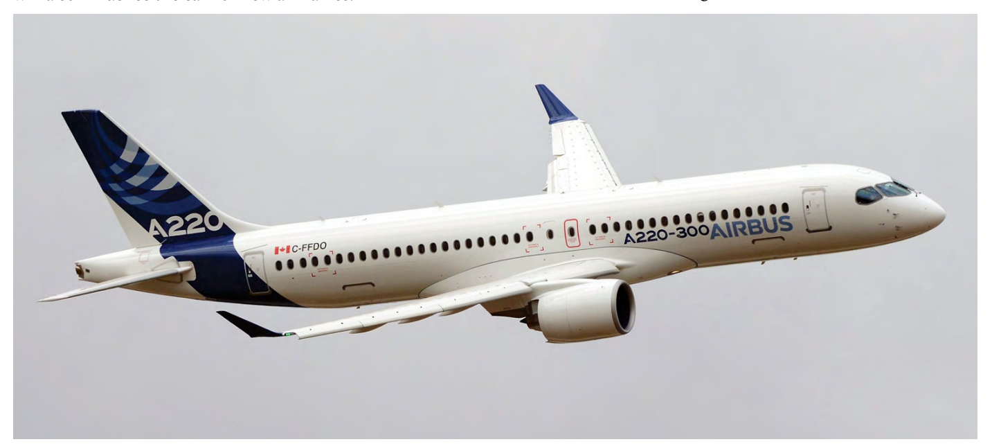
Early July Airbus and Bombardier closed their CSeries deal, in which Airbus will take a majority stake in the CSeries Aircraft Limited Partnership. As a result the CSeries is now formally added to the Airbus Commercial Aircraft Portfolio and renamed as A220-100 (CS100) and A220-300 (CS300). Farnborough marked the public debut of the re-named aircraft with A220-300 C-FFDO at the static and flying display, showing the Airbus house colours. (Farnborough, 17 July 2018, Coen Capelle)

Since the static display at the Paris Air Show in 2017 the MRJ90 has been kept in the shadows. Working their test programme out of Moses Lake (WA), prototype FTA-3/JA23MJ was flown into Farnborough last month to attend the flying display. Graced in the colours of launch customer ANA, the MRJ90 was flown from Washington State towards the UK with two