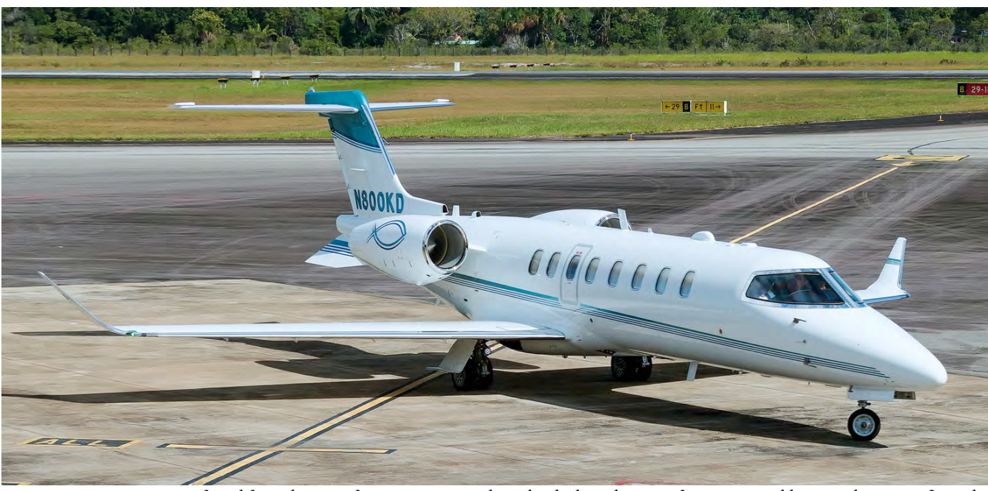
Learjet 75 N800KD was transferred from the manufacturer in 2017. Judging by the logo the aircraft is a recent addition to the ITC-CS fleet who operates it for SOL Petroleum and complements the two Learjets already in their fleet. (Paramaribo, 27 June 2018,)