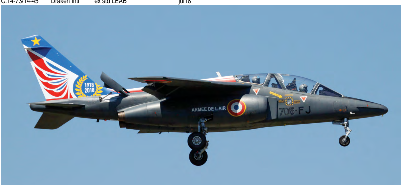
Alpha Jet E E33 705-FJ was decorated with a special tail commemorating the end of the first World War. (Solenzara, 19 June 2018,)

J-3056 pres Luzern ex std LSME L1056 jun18