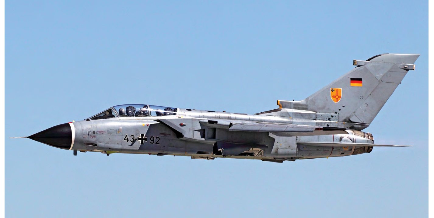
Tornado IDS 43+92 is seen here taking off for a testflight after an ASSTA 3.1 upgrade, hence the clean look. Judging by the badge on the tail, it is a former GAFFTC example. The GAFFTC is scheduled back home to Germany from Holloman mid-2019. (Manching, 2 July 2018, Dietmar Fenners)