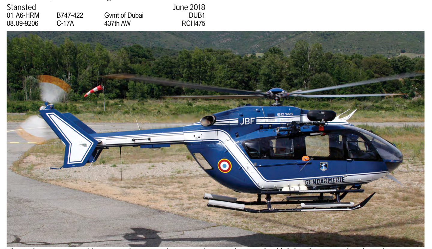
The Gendarmerie operates fifteen EC145s from various bases around France. This example is likely based at Ajaccio, the only Gendarmerie aviation base on the island. (Corte, 11 June 2018, Ron Bijsterbosch)