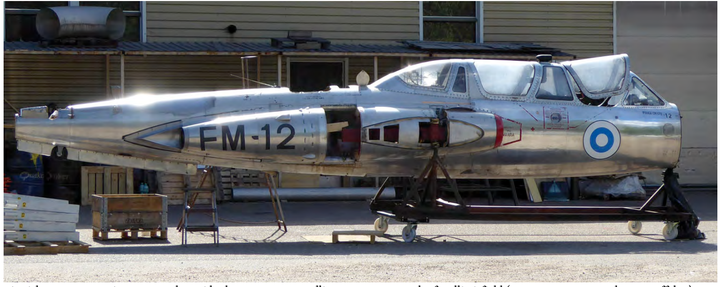
Finnish Fouga FM-12 is now stored outside the Rempsun Metalli Oy company, south of Halli airfield (16 June 2018,)