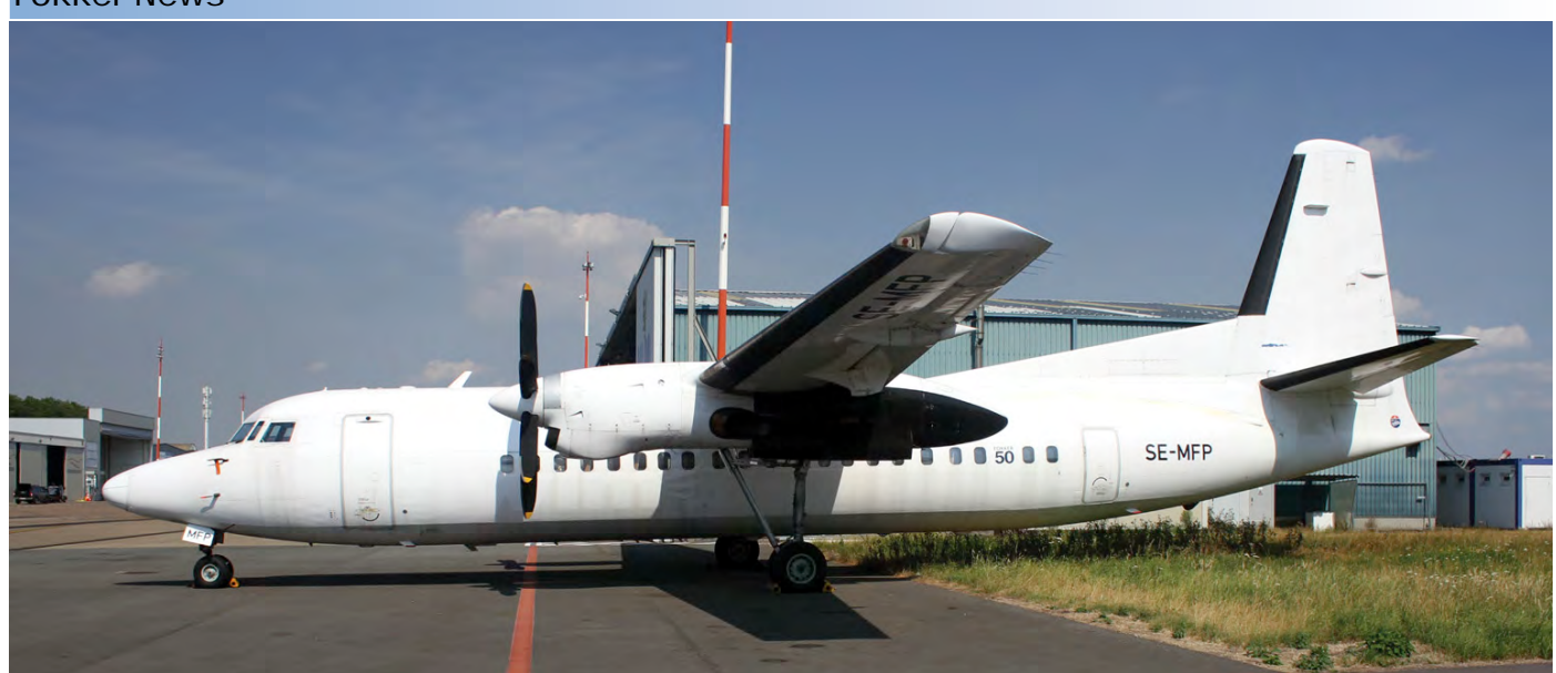
Fokker 50 SE-MFP, former OO-VLJ of VLM Airlines, is seen here in a pretty dull all white colourscheme, on 19 July 2018 at Antwerp-Deurne, It had been stored there since March 2015 until Amapola Flyg recently decided to acquire this one, plus OO-VLO.