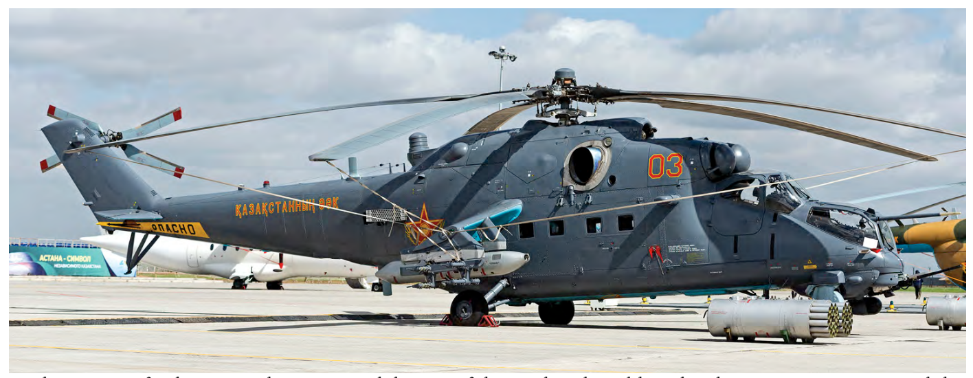
Another new type for the KADF is the Mi-35. Four helicopters of the type have been delivered to date. However, it was reported that the KADF is also upgrading some of the orgial Mi-24s. (Astana, 23 May 2018,)