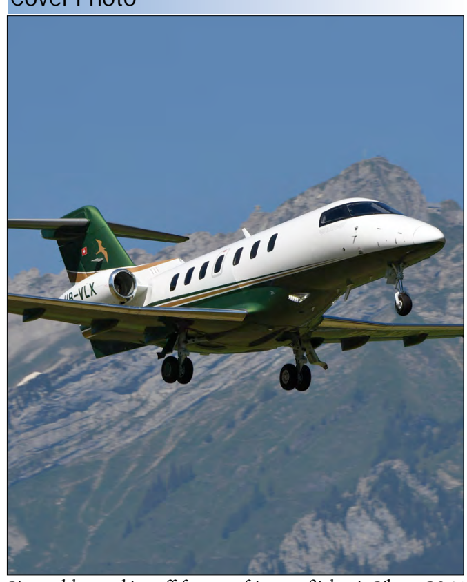
Pictured here taking off for one of its test flights is Pilatus PC-24 HB-VLX. Seen in the background is the famous Swiss mountain the aircraft manufacturer is named after. Pilatus' base at Buochs is located close to the mountain Pilatus which features as an impressive backdrop. HB-VLX has c/n 108 and made its first flight on 15 June. (Stans, 20 June 2018, Stephan Widmer)