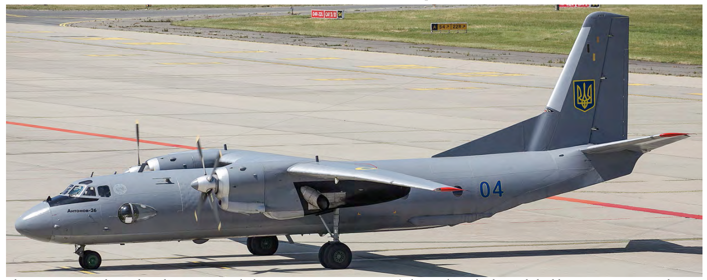
This Antonov 26 with serial 04 Blue is active with the State Emergency Service of Ukraine (SASU). The English abbreviation SASU translates to DSNS. (Liège, 26 June 2018,)