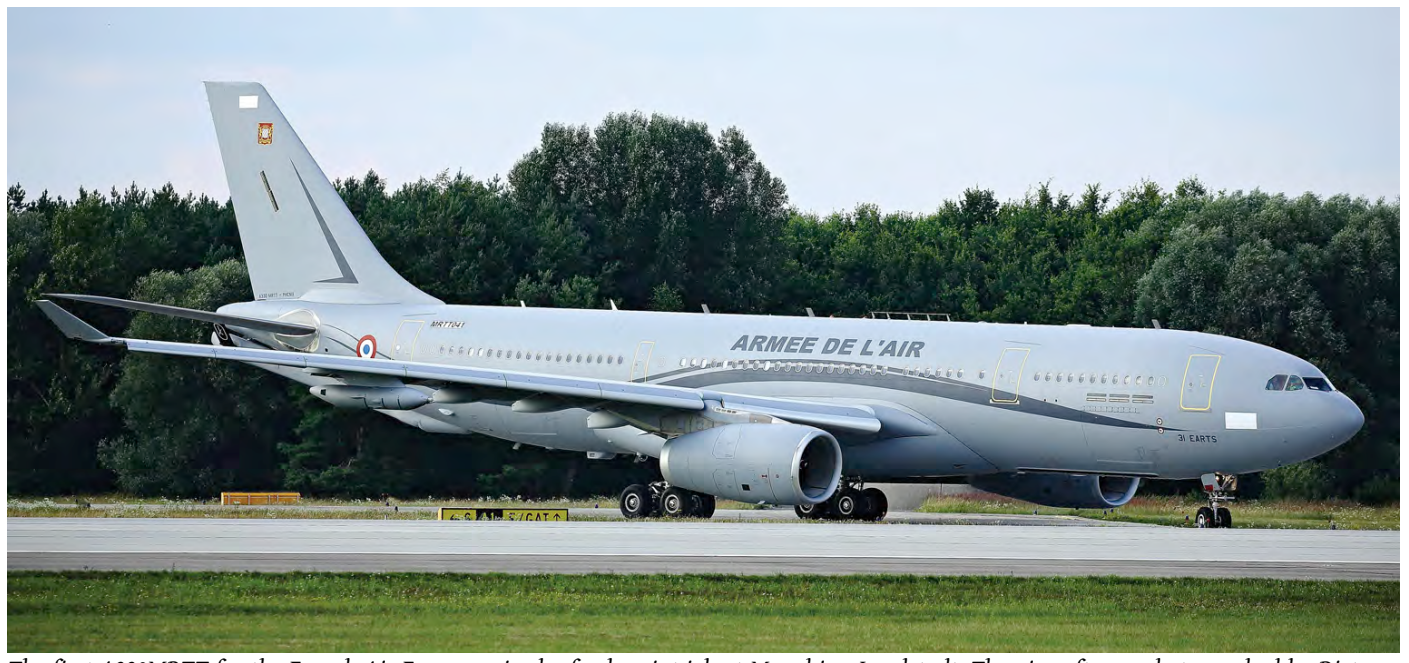
The first A330MRTT for the French Air Force received a fresh paint job at Manching-Ingolstadt. The aircraft was photographed by Dietmar Fenners just before take-off to Torrejon. (6 July 2018)