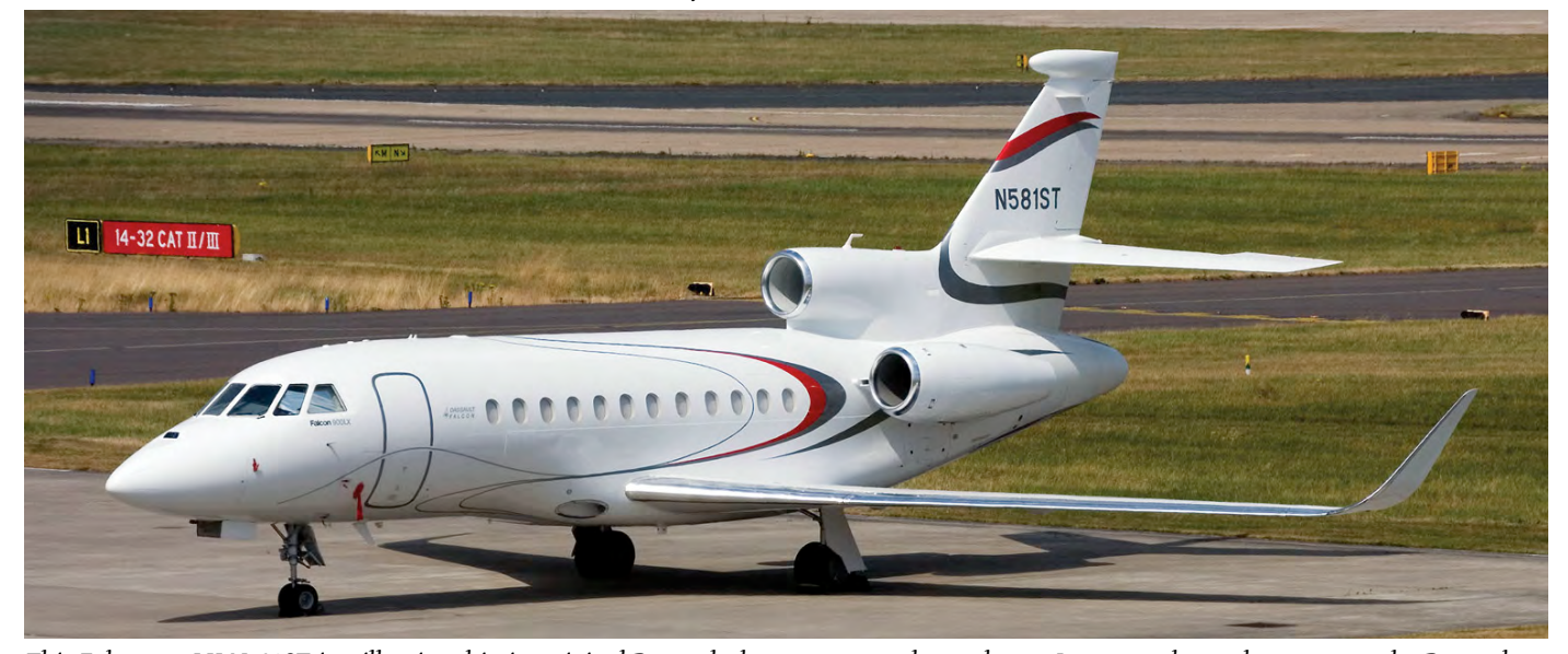
This Falcon 900LX N581ST is still painted in its original Dassault demonstrator colour scheme. It was used as a demonstrator by Dassault as F-HVDA for more than a year. It was registered to Oakwood Books on 9 March. (Leeds-Bradford, 19 July 2018,)