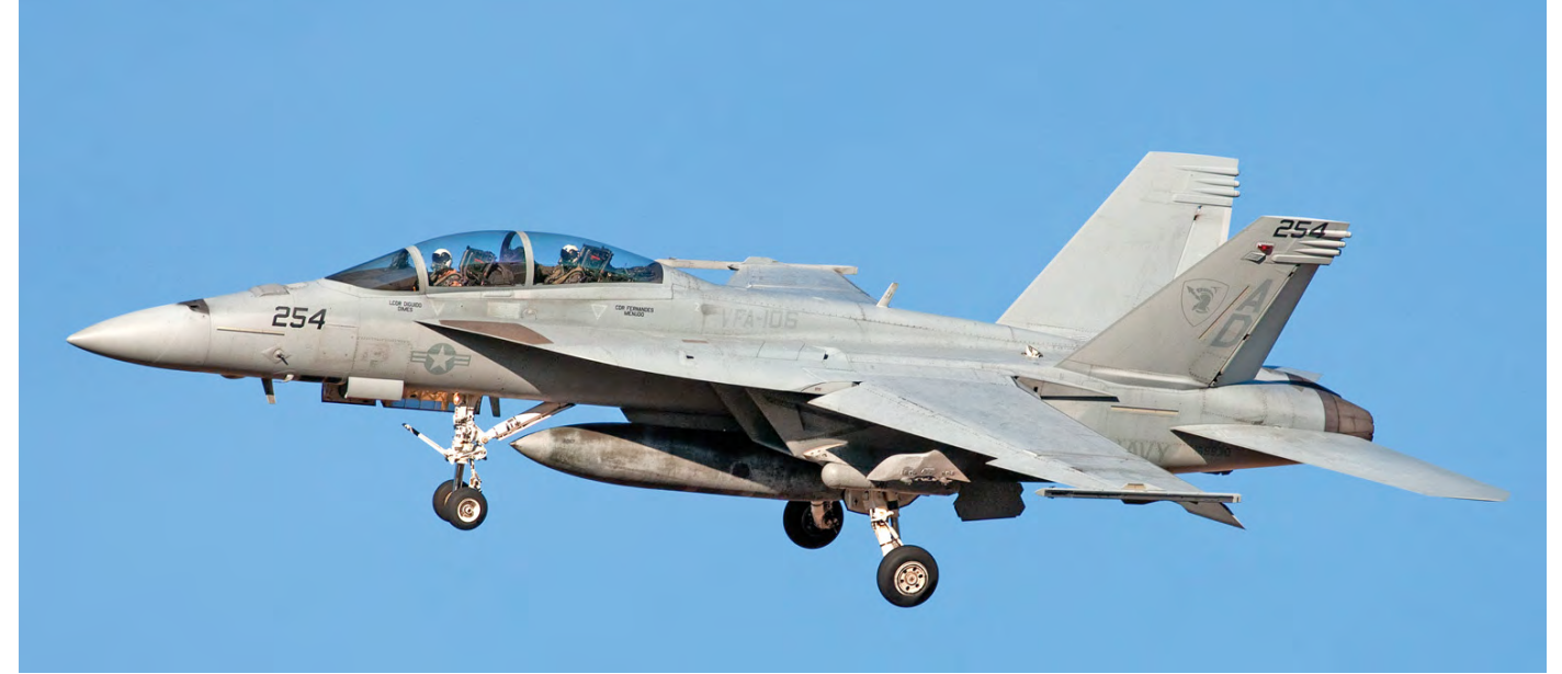
Although no aircraft units are based at El Centro, a lot of Navy units use this airbase for training purposes. For example, one of these units which visit this airbase quite regularly is VAQ-130 (29 January 2018, Joost de Wit)