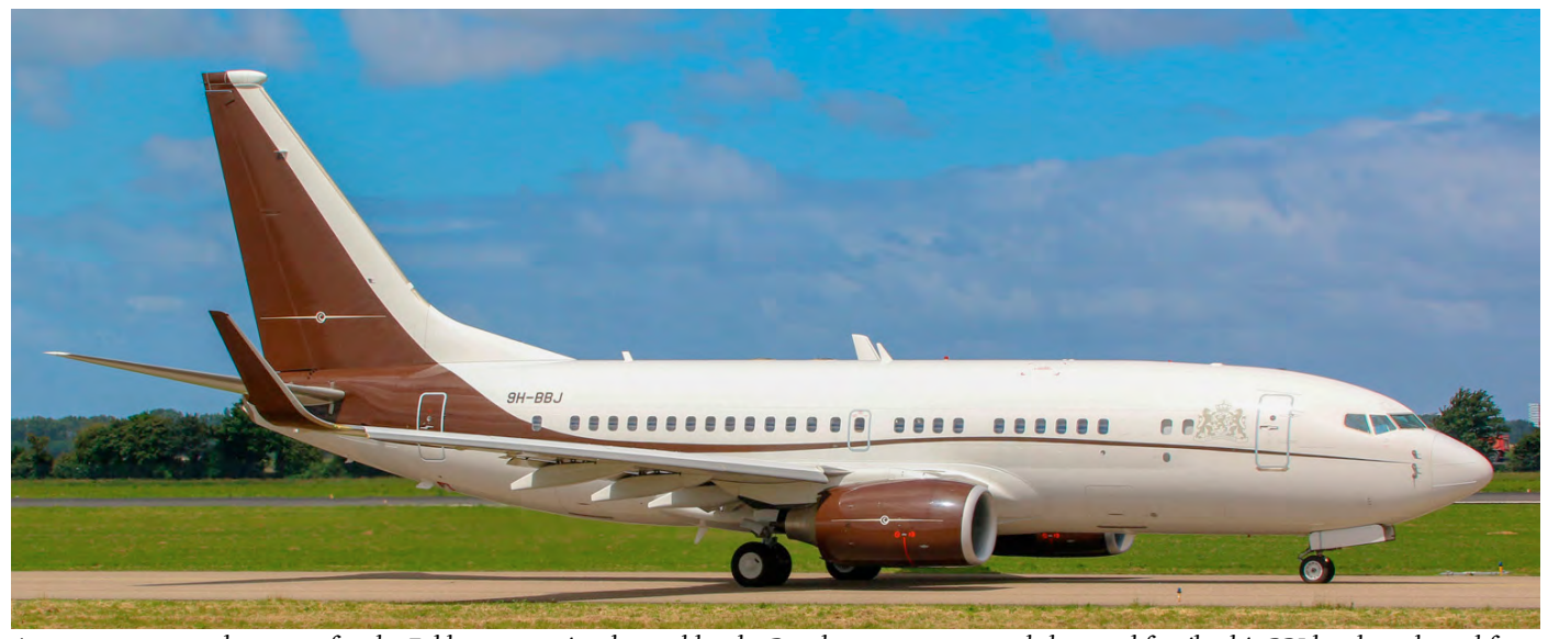
As a temporary replacement for the Fokker 70 previously used by the Dutch governement and the royal family this BBJ has been leased from February 2018. Privajet operates 9H-BBJ until PH-GOV is being delivered. The royal seal was added to the aircraft in April 2018. (Rotterdam -The Hague, 21 June 2018,)