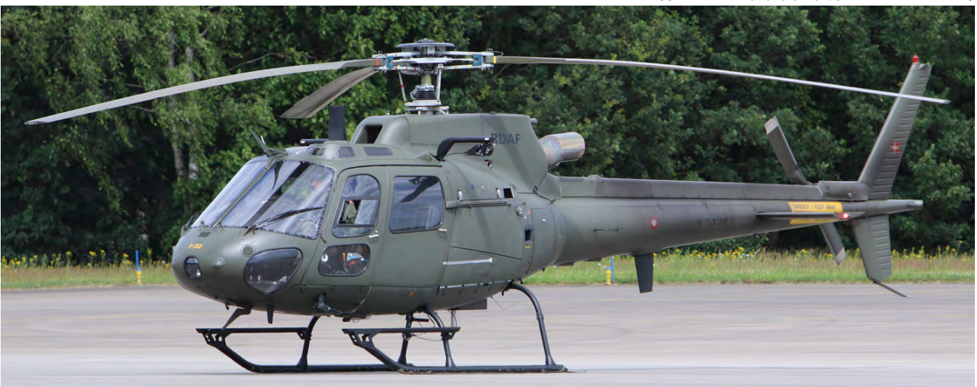
Danish Fennec P-352 operated by Esk724 was heading to Weston-super-Mare to attend the Weston air festival which took place on 23 and 24 June 2018. (Volkel, 21 June 2018)