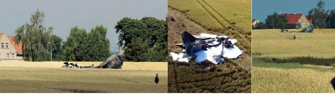
A Polish Air Force (Siły Powietrzne) MiG-29, 4103 based at 22. Baza Lotnictwa Taktycznego near Malbork and part of 41. Eskadra Lotnictwa Taktycznego, crashed under unknown circumstances during a night training exercise near Paslek, Poland, on 6 July 2018.