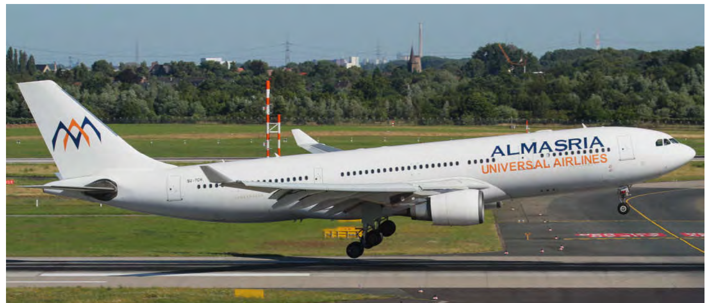
Almasria Universal Airlines took delivery of their first wide-body aircraft in February 2018. Airbus A330-200 SU-TCH is a former EVA Air aircraft and was intended to be leased to VIM Airlines after EVA Air phased out the aircraft. However VIM Airlines went banktrupt and the aircraft was subsequently ferried to Teruel for storage in October 2017. On 16 february 2018 the aircraft was ferried to Cairo to enter service with Almasria Universal Airlines. (Dusseldorf, 1 July 2018,).