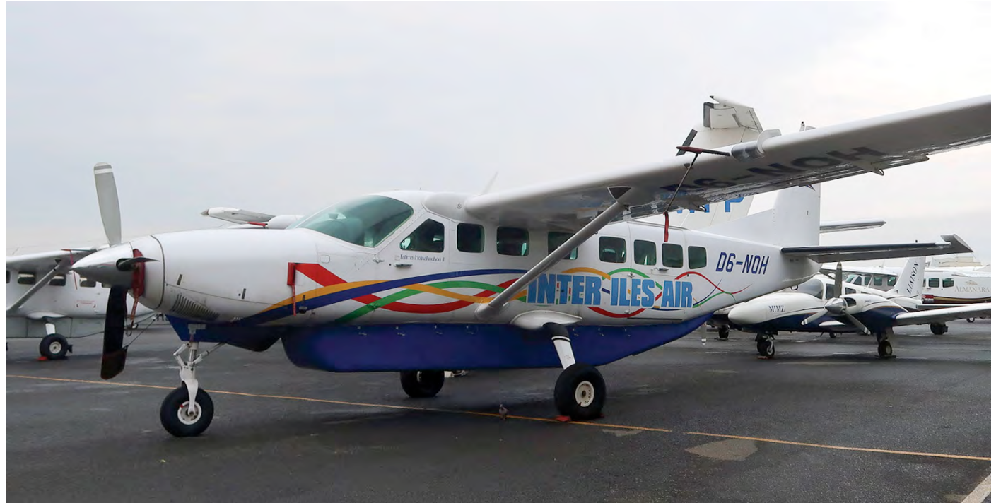
D6- is a rare prefix to come across, it belongs to the Comores which is a group of Islands close by the coast of Mozambique in the Indian Ocean. Int'Air Iles / Inter Iles Air operates two Cessna Caravans of which D6-NOH is one of them. It was photographed at Nairobi Wilson Airport where it probably was on a maintenance visit. (18 March 2018,)