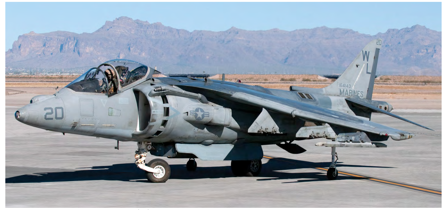
If you are in the neighborhood of Phoenix (AZ) you definitely have to pay a visit to Phoenix-Mesa Gateway Airport. The US Navy and Marine Corps visit this airport on a regular base, especially during the weekends. Besides that, photo opportunities are excellent as shown in this picture of Joost de Wit. (27 January 2018)

The main terminal is located on the north side of the field along E 32nd Street and photo opportunities are limited here.