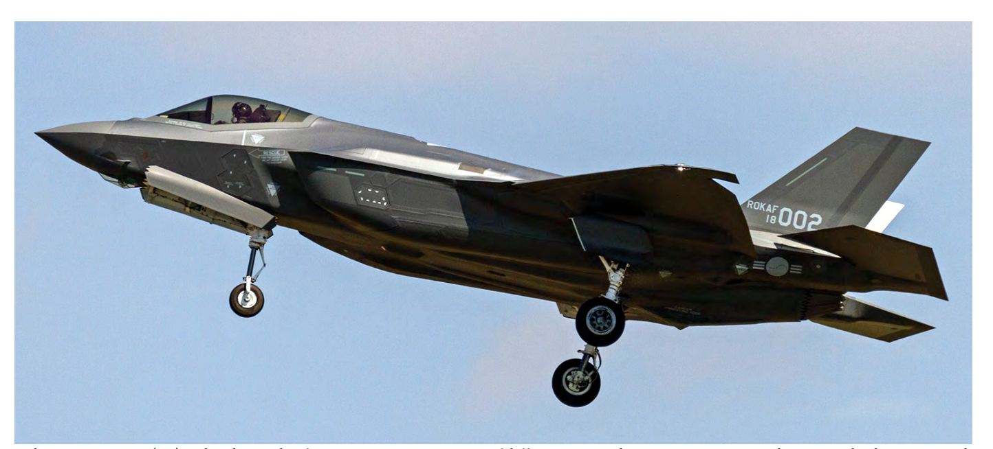
Luke Air Force Base (AZ) is the place to be if you want to spot a variety of different F-35s. The newest countries with F-35s at this base are South Korea and Turkey. South Korean 18-002 was photographed during landing at Luke. (18 July 2018)

improve the availability of its small yet critical F-22 fleet, and support combatant commander air superiority needs in high threat environments.