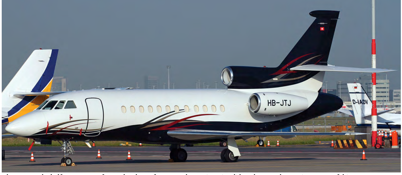
About one and a half years ago we featured a photo of OO-SCR. That registration did not last very long as in January of this year OO-SCR was first noted as HB-JTJ. The Falcon 900 still kept its stunning paint scheme. (Amsterdam-Schiphol, 6 June 2018,)