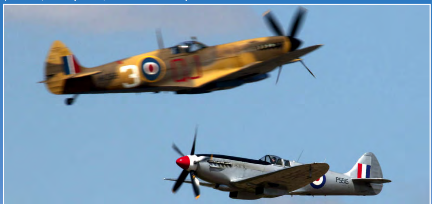
Not to be missed at almost any military event in the UK is the Battle of Britain Memorial Flight. At Fairford Spitfire MK356 and Spitfire PR Mk. XIX PS915 were two of the BoBMF contribution this year. From 1957 to 1984 Spit PS915 had been Gate Guard at various RAF bases and MK356 performed ground display duties around the UK between October 1945 and 1997. (Fairford, 15 July 2018,)