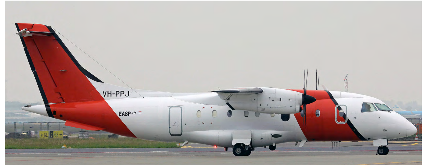
Operated by AeroRescue Australia for the Australian Maritime Safety Authority, Dornier 328 VH-PPJ was ferried to the Netherlands via a short visit to Aerodata, Braunschweig. The aircraft returned to Braunschweig on the 4th for maintenance. On 27 June it was ferried to Oberpfaffenhofen where 328 Support Services is located for use at the Farnborough International Airshow. EASP AIR is a Schiphol-based service provider of airborne operations with Special Mission Aircraft. (Amsterdam - Schiphol, 2 June 2018,)