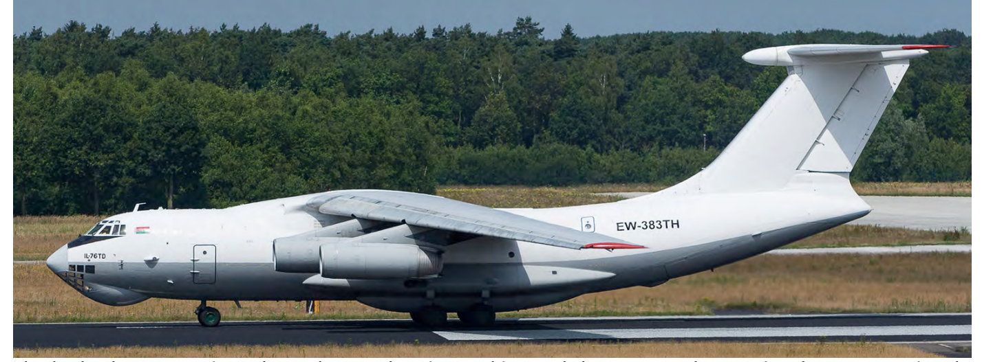
This Ilyushin Il-76 was manufactured in 27 july 1991 and was first noted five months later at Maastricht in Aeroflot colours. Operating for Ruby Star it was noted in 2014 in all-white colours with a grey underside and no titles as EW-383TH. (Eindhoven, 17 June 2018, Wout Goossens)