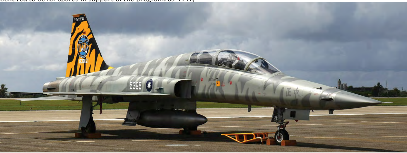
Quite a large number of F-5F aircraft are still active with the Republic of China Air Force. Reinier Schreurs photographed this 7th FTW F-5F at the Open Day of Taitung with a special "Tiger" tail. (14 July 2018)