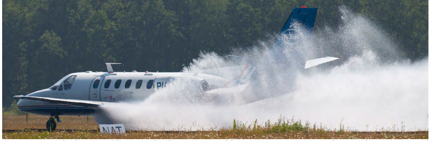
Cessna 550 PH-LAB has been part of the Nationaal Lucht- & Ruimtevaartlaboratorium inventory since March 1993. Brake tests were carried out as part of the European Future Sky Safety programme. The aim of the programme is to reduce a certain type of accident caused by runway excursions. 76,000 liters of water were needed for a day of testing. (Twente, 6 June 2018, Remco de Wit)