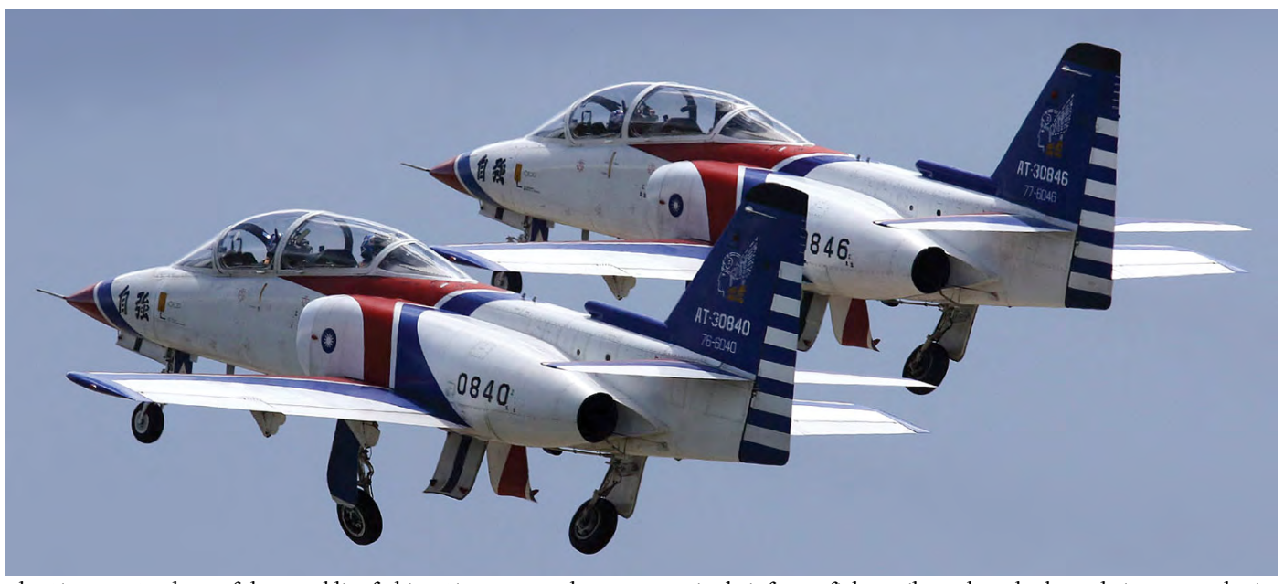
The Air Force Academy of the Republic of China Air Force use the AT-3 to train their future fighter pilots. They also have their own aerobatics team with AT-3 aircraft. Reinier Schreurs photographed the "Thunder Tigers" during take off at the open day at Taitung. (14 July 2018)