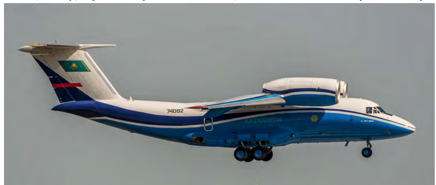
For STOL high speed tactical transport the Kazakhstan Border Guards operate a few An-74s including this An-74TK-200D 74082. (Astana, 25 May 2018, Hilco Schigt)