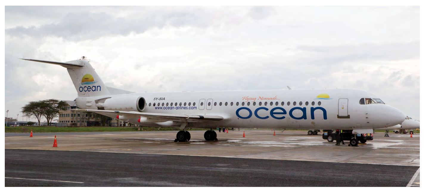
Ocean Airlines is an airline from Somalia. It operates only one aircraft; this Fokker 100 5Y-SIA which is leased from Jetways Airlines from Kenya. The aircraft is registered as 5Y-SIA and former operators of this Fokker are: TAT, Deutsche BA, Air Liberté, Régional and Alpi Eagles. (Nairobi, 16 March 2018, Andre Alders)