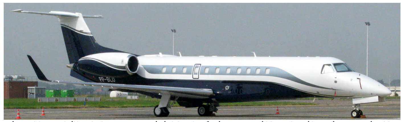
Hahn Participacoes Eireli is active in management and administration of real estate. Larger bizjets registered in Brazil are not regular visitors in Europe. Embraer PP-BLO was delivered to the company in May 2017. (Brussels, 8 June 2018,)