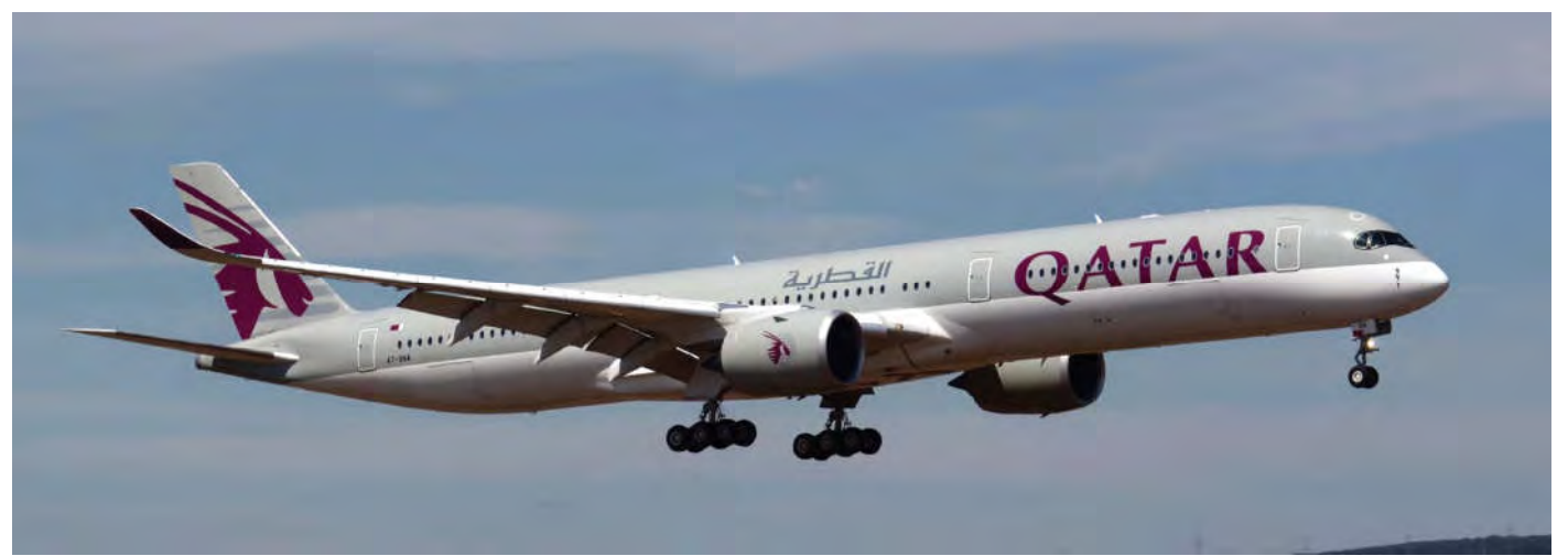
On 20 February 2018 Airbus delivered the first A350-1000 to its launch customer Qatar Airways. The aircraft, registered A7-ANA, is seen here on finals at Frankfurt. The second one was delivered in June. At this moment the pair is mainly used on flights to London, Frankfurt and some destinations in the Middle East and the United States. (Franfurt-Main, 9 July 2018, Frank Schuchardt)