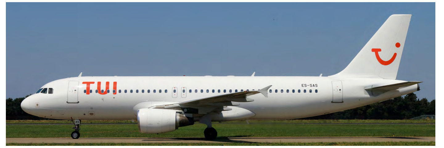
Delivered to USA 3000 in 2002, this Airbus A320 was delivered to VivaColombia ten years later. On 6 June 2018 the Airbus departed for Riga on delivery to SmartLynx Estonia as ES-SAS. The aircraft has been leased to TUI Belgium for this summer. (Rotterdam -The Hague, 30 June 2018, Cor Mout)