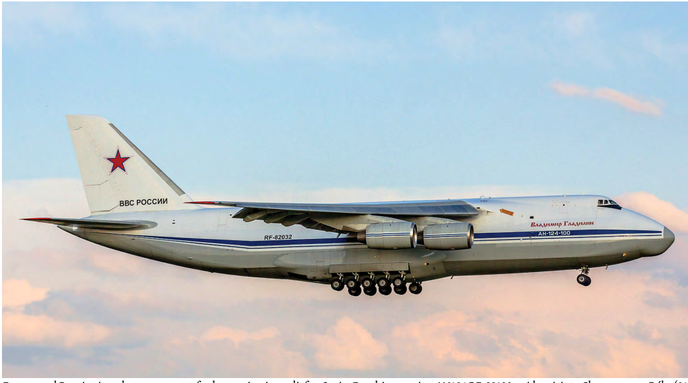
France and Russia signed an agreement for humanitarian relief to Syria. For this occasion AN124 RF-82032 paid a visit to Chateauroux-Déls. (21 July 2018,)