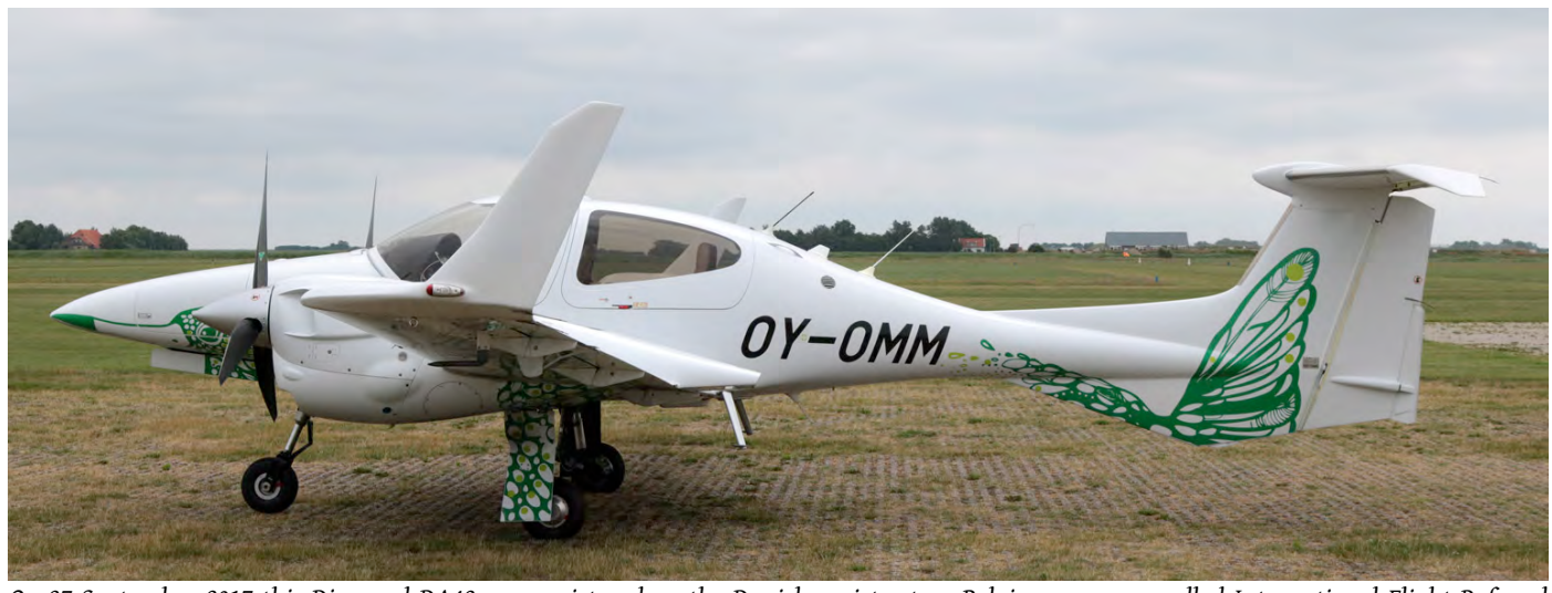
On 27 September 2017 this Diamond DA42 was registered on the Danish register to a Belgian company called International Flight Referral although it is not the actual operator. (Texel, 10 June 2018,)