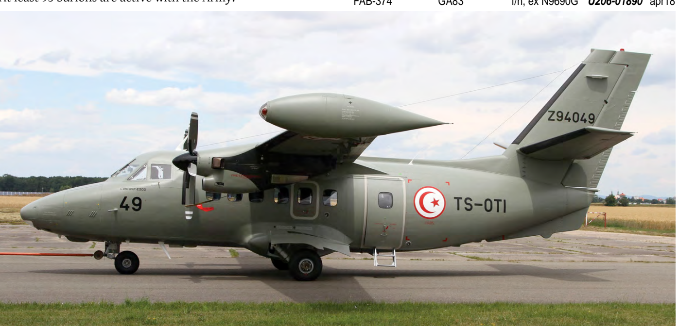
This Tunesian Air Force L-410 with serial Z94049 changed its colours from yellow to full camo Tunesian Air Force markings. Dirk Peisker photographed this aircraft just after the paint job at the Kunovice LET factory. (22 June 2018)

FAB-374 GA83 f/n, ex N9690G U206-01890 apr18