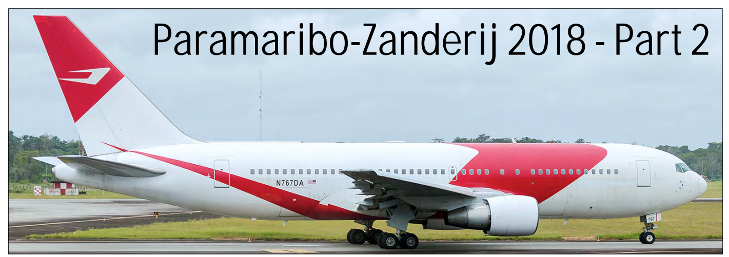
Dynamic Airways has formally transitioned to Eastern Airlines in June 2018 following a Chapter 11 bankruptcy reorganization. That is the reason for the missing Dynamic titles on Boeing 767 N767DA.