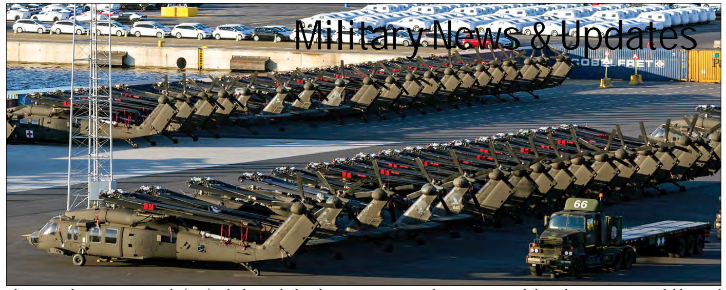
The 1st Combat Aviation Brigade (CAB), which was deployed to Europe since October 2017, returned their choppers via Spangdahlem and Zeebrugge to their home in Texas. Dino van Doorn sent some nice overview pictures to give us an impression of the huge amount of H-60s at Zeebrugge. Next to those, also Chinooks and Apaches were present. (2 July 2018)

Because of our standardization we sometimes use type, unit and serial presentations that may strongly differ from those used by the manufacturer or user. It is therefore possible that the information sent by you can deviate from the information we publish.