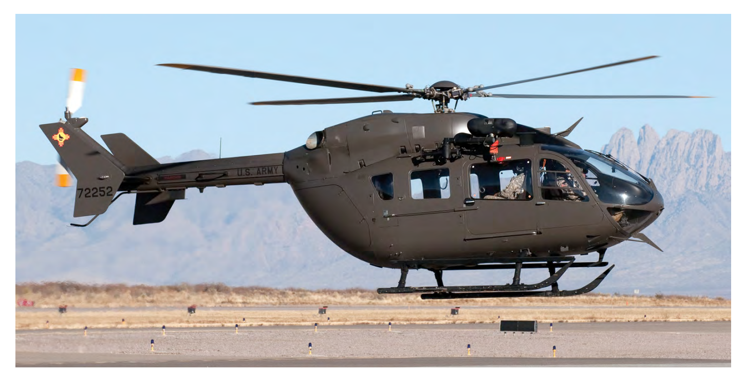
Although the UH-72A Lakota cannot beat the famous UH-1 it is still an impressive helicopter. Almost 400 UH-72As are on strenght with the US Army. UH-72A 12-72252 of the New Mexico Army National Guard is one of them and was photographed at Las Cruces-International (NM). (24 January 2018)

one was conducting some flight training on the runway.