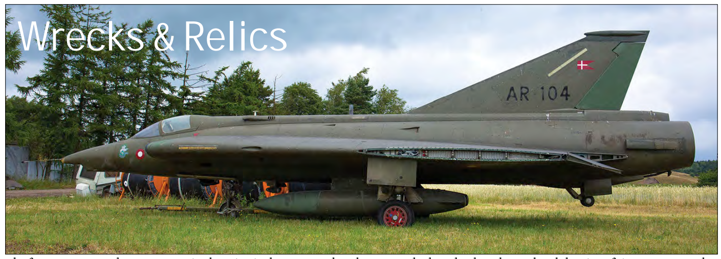
The former Grena Draken AR-104 arrived at Bjerringbro, Denmark, to be scrapped. That plan has changed and the aircraft is now preserved at the scrappard (18 June 2018,)