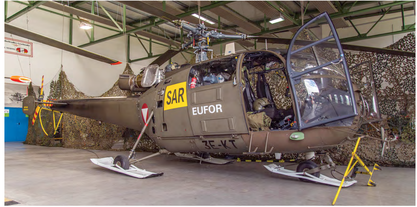
Adorned with additional SAR and EUFOR titles, this Austrian Air Force (Österreichische Luftstreitkräfte) Alouette III 3E-KT was hit by tailwind, touched down hard at Plöckenpass-Wolayersee and suffered a dynamic rollover on 29 June 2018. (Aigen, 22 September 2017, Hilco Schigt)

09jul18 Mi-8MTV w/o While attempting to rescue a Japanese climber in the Issyk-Kul region of <u>Kyrgyzstan</u>, a Mi-8 of the <u>Armed Forces</u> crashed