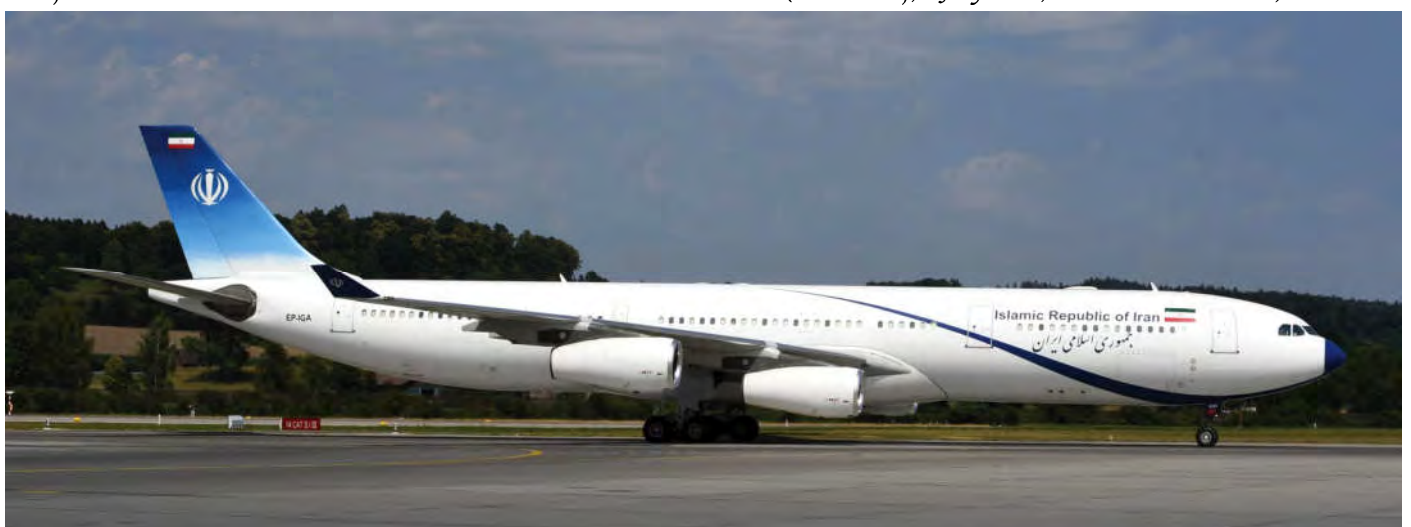
This Airbus A340-300 was originally delivered to Air Canada in February 2009. After that the aircraft was operated by Air Jamaica, Turkish Airlines and Pakistani AirBlue. After AirBlue the aircraft ended up in Iran in September 2015 and it has been operated for the Iranian Government since then by three different airlines, each time changing the registration. The last registration is EP-AGA which was first noted in June 2018.