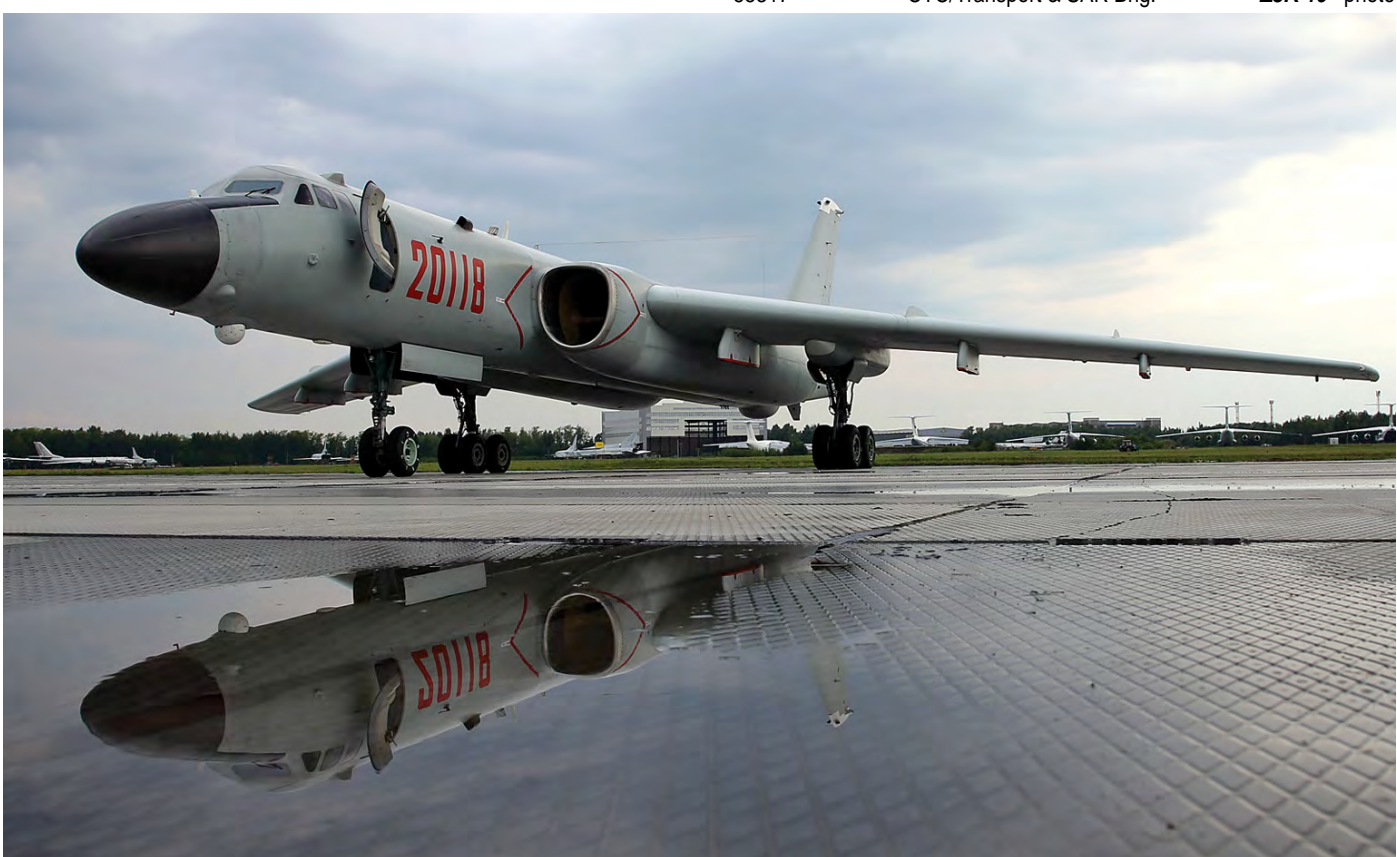
A very impressive aircraft within the People's Liberation Army Air Force is without doubt the Xian H-6. Dmitriy Pichugun photographed this H-6 during the International Army Games at Dyagilevo Air base. (20 July 2018)