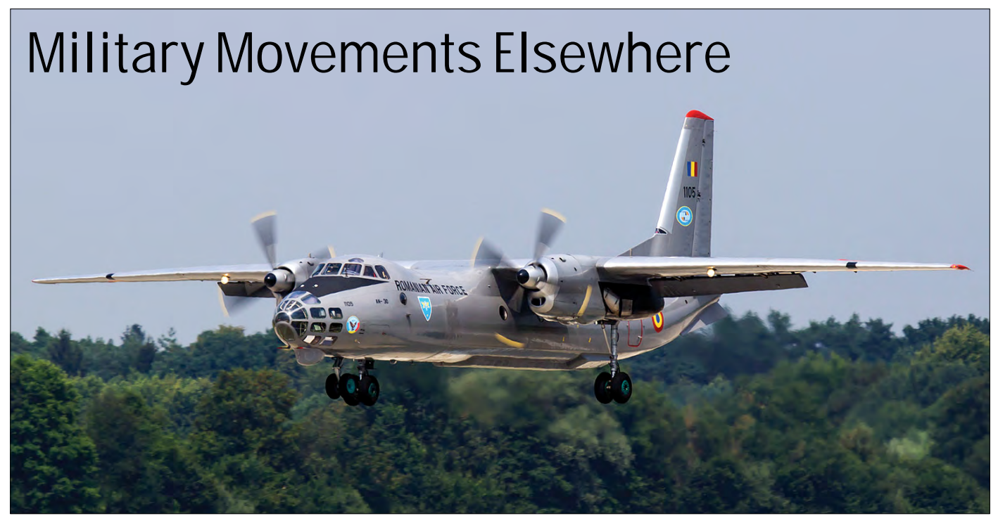
At the end of July, the Romanian Air Force deployed one of its two active An-30s to Manching for some Open Skies missions. 1105 is the Antonov that is dedicated to the Open Skies flights. (23 July 2018,)