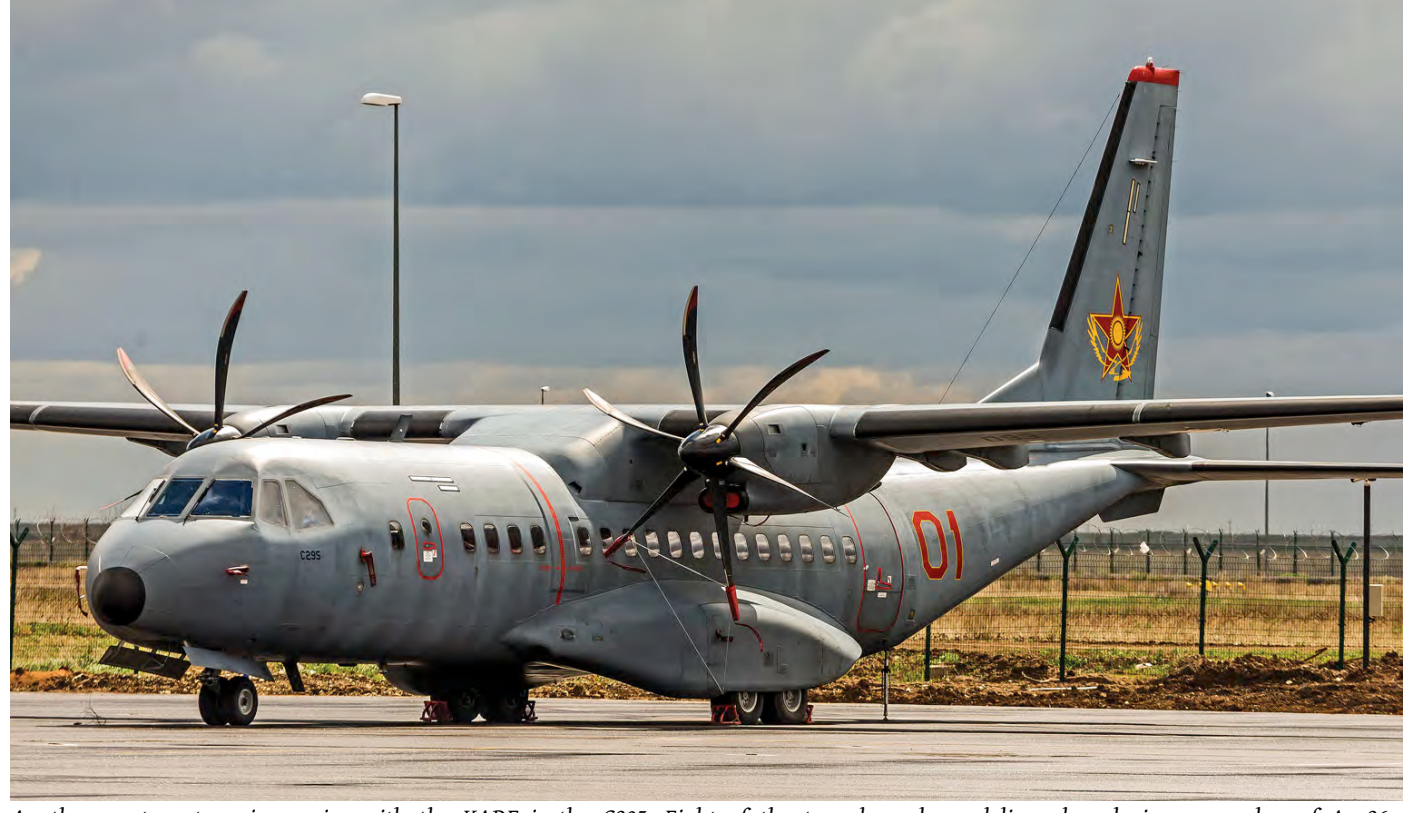
Another western type in service with the KADF is the C295. Eight of the type have been delivered replacing a number of An-26s. Despite this, one An-26 was seen visiting Astana during the event. (Astana, 23 May 2018,) Personal copy