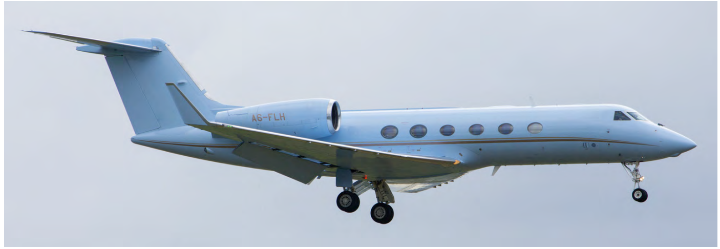
Falcon Aviation Services took delivery of this G450 in June 2009. It was first noted in this new colour scheme on the last day of 2016. A6-FLH is currently one of three G450s operated by Falcon Aviation Services. (Amsterdam-Schiphol, 9 July 2018,)