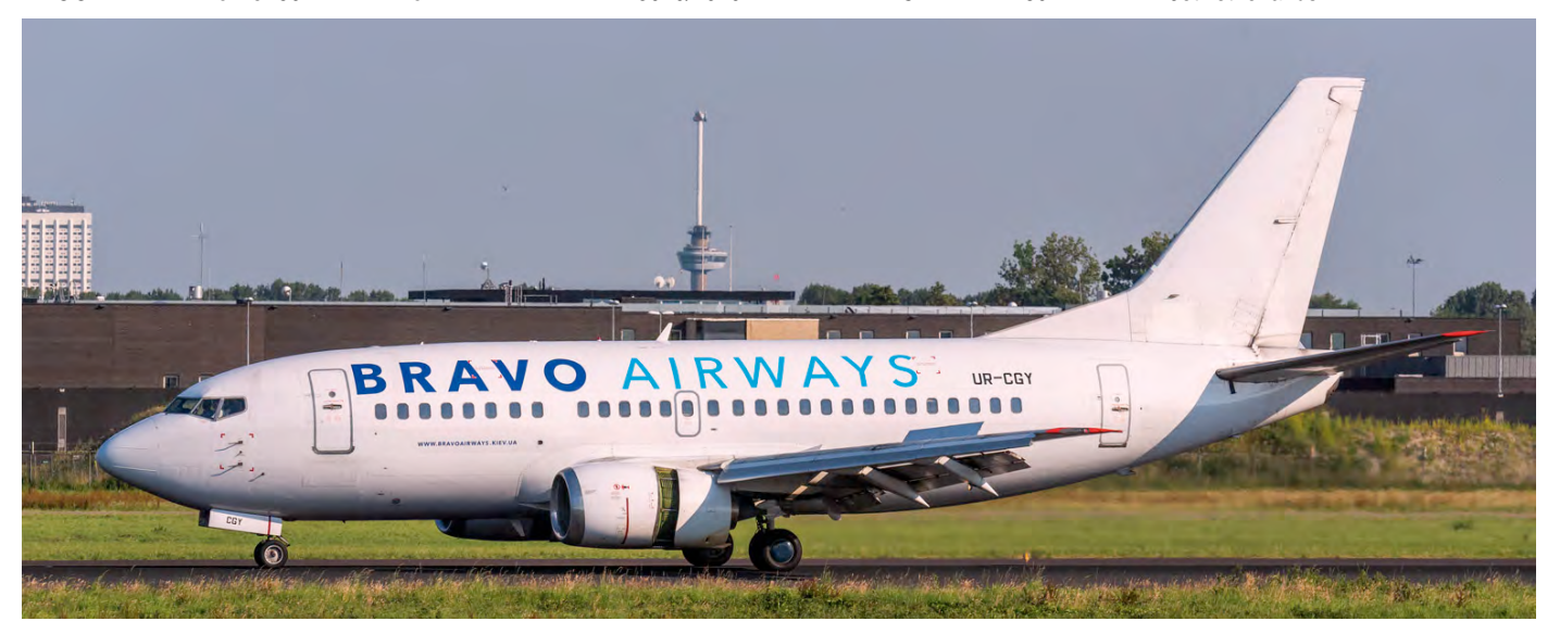
The first flight from Erbil to Rotterdam via Kiev took place on 28 June 2018. The flights are being operated by Bravo Airways. Boeing 737 UR-CGY is not a stranger to Dutch skies as it was delivered to Aer Lingus in 1992. (Rotterdam -The Hague, 28 June 2018,)