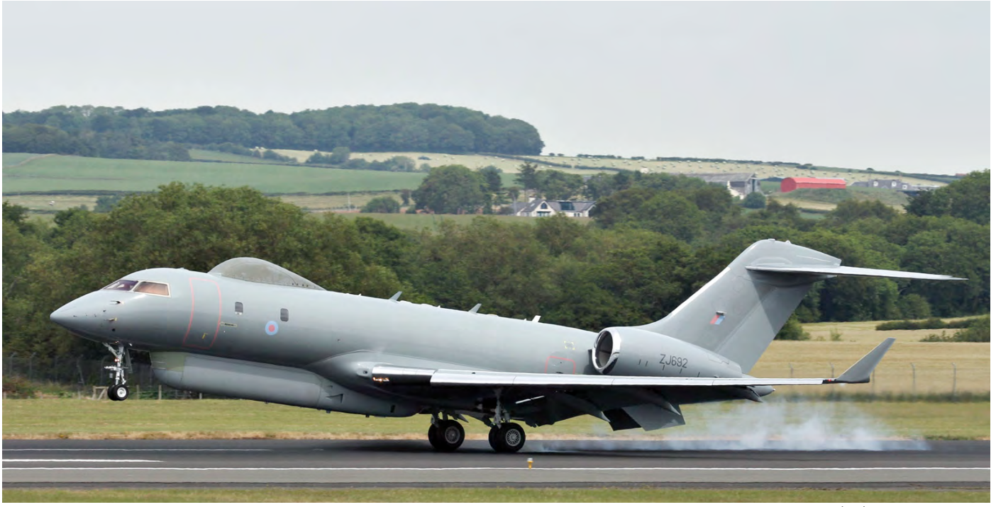
RAF Sentinels are quite rare beasts, since they are often deployed overseas. ZJ692 is one of five Sentinel R1s assigned to 5(AC) Squadron at RAF Waddington. (Glasgow-Prestwick, 26 June 2018, Douglas Connery)