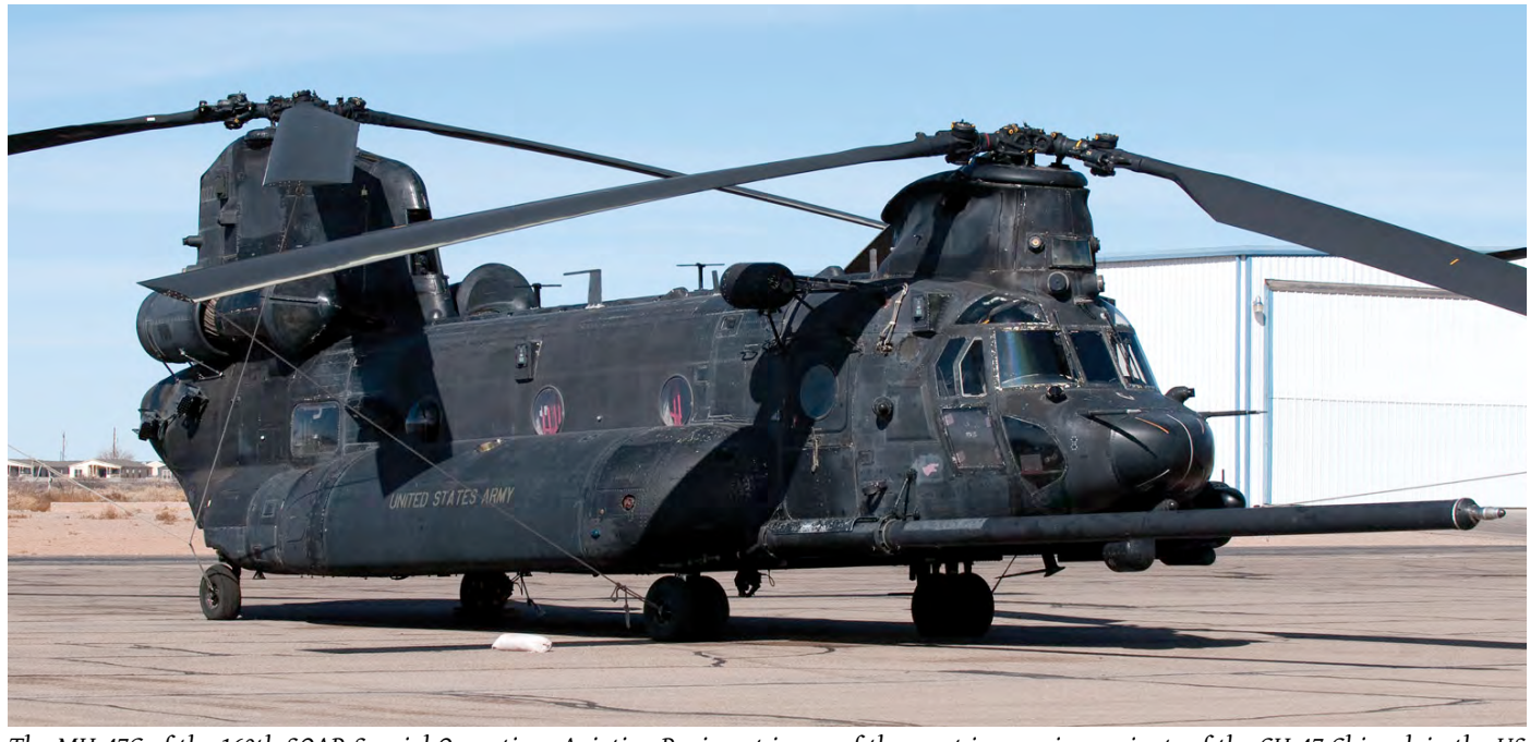
The MH-47G of the 160th SOAR Special Operations Aviation Regiment is one of the most impressive variants of the CH-47 Chinook in the US Army. These helicopters are deployed quite often, so they are not seen that much in the United States itself. (Alamogordo-White Sands Regional (NM), 22 January 2018, Joost de Wit)

This General Aviation airport is located west of the city. At highway I-10, take exit 132 and drive northbound until you reach the field. There are three runways and all hangars and aprons are located along the south side, hence you will have the sun in your back most of the day. The stored Harpoon can