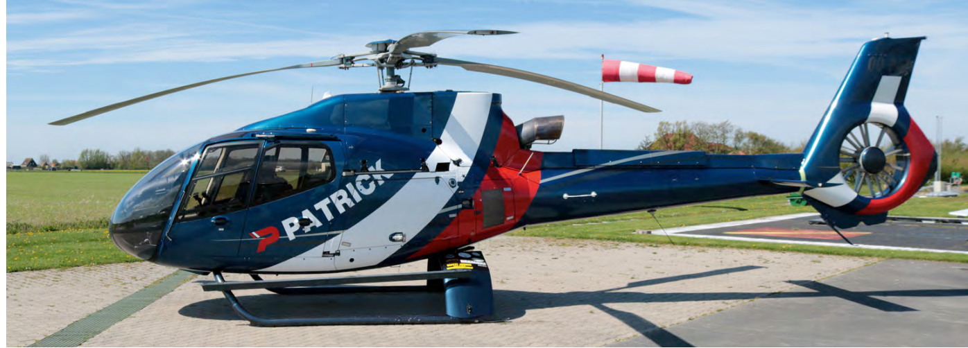
This EC130B4 was registered as G-ECBO to Eurocopter UK in july 2007. In February 2008 it was registered to a company called WH Smith & Sons (Tools). It was transferred to Belgium in December 2011 but registered as OO-PAT on 3 January 2012. Although officially registered to SB Logistic a search on the web leads to the Cortina Group as current user. (Texel, 2 May 2018,)