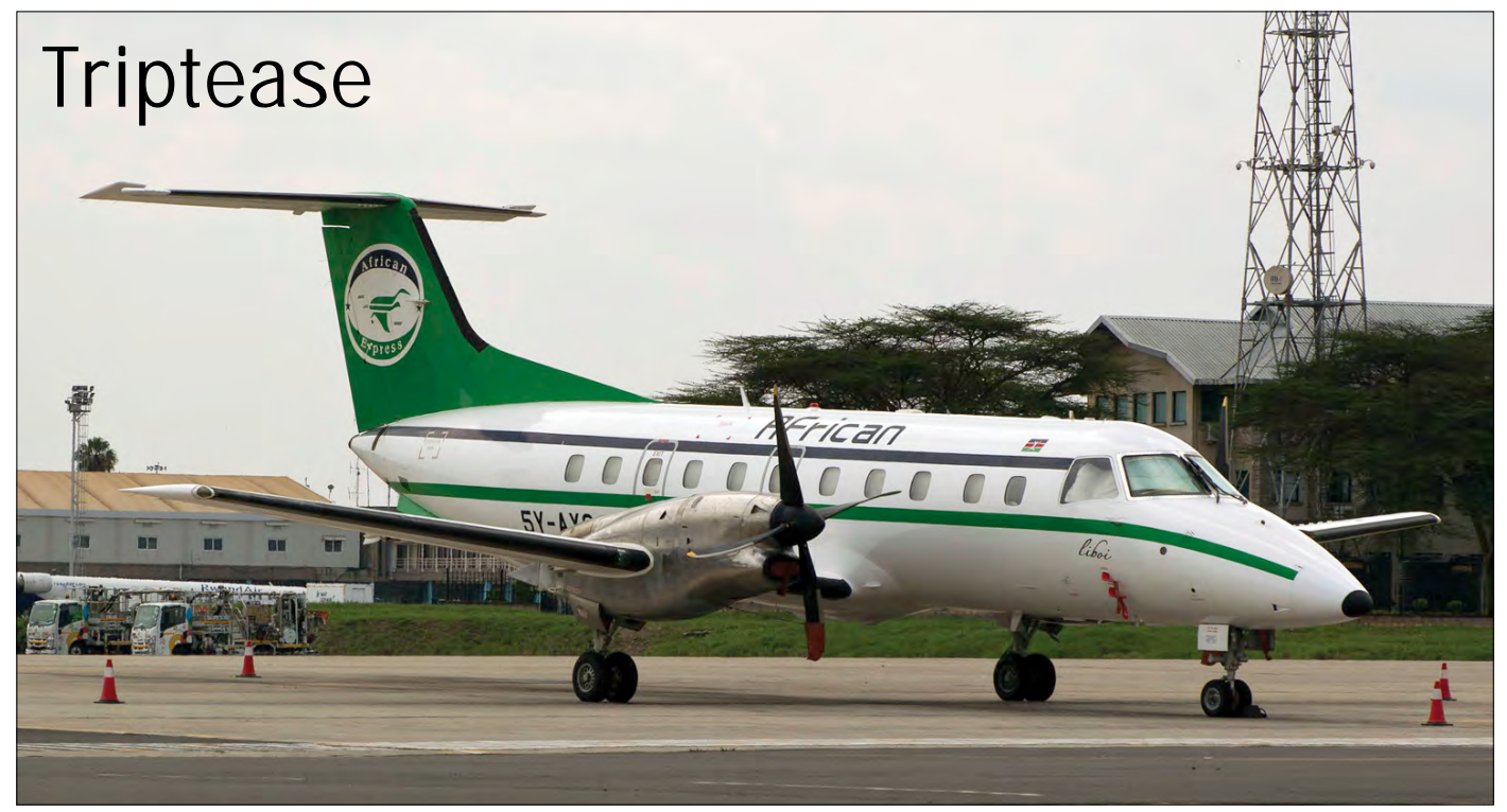
This 1991-built Embraer 120 found its way to Africa after a career with Comair in the USA. Since early 2013 5Y-AXO has been flying for African Express Airways on regional routes out of Nairobi in Kenya. (Nairobi International, 18 March 2018)