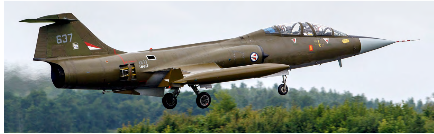
Former 104637 was withdrawn from use by the Norwegian Air Force on 1 April 1983. Today CF-104D LN-STF is registered to the Starfighterens venner, "Friends of the Starfighter" in English. The association was founded in Bodø on 16 January 2003. The Starfighter was placed on the Norwegian civil register in November 2011.