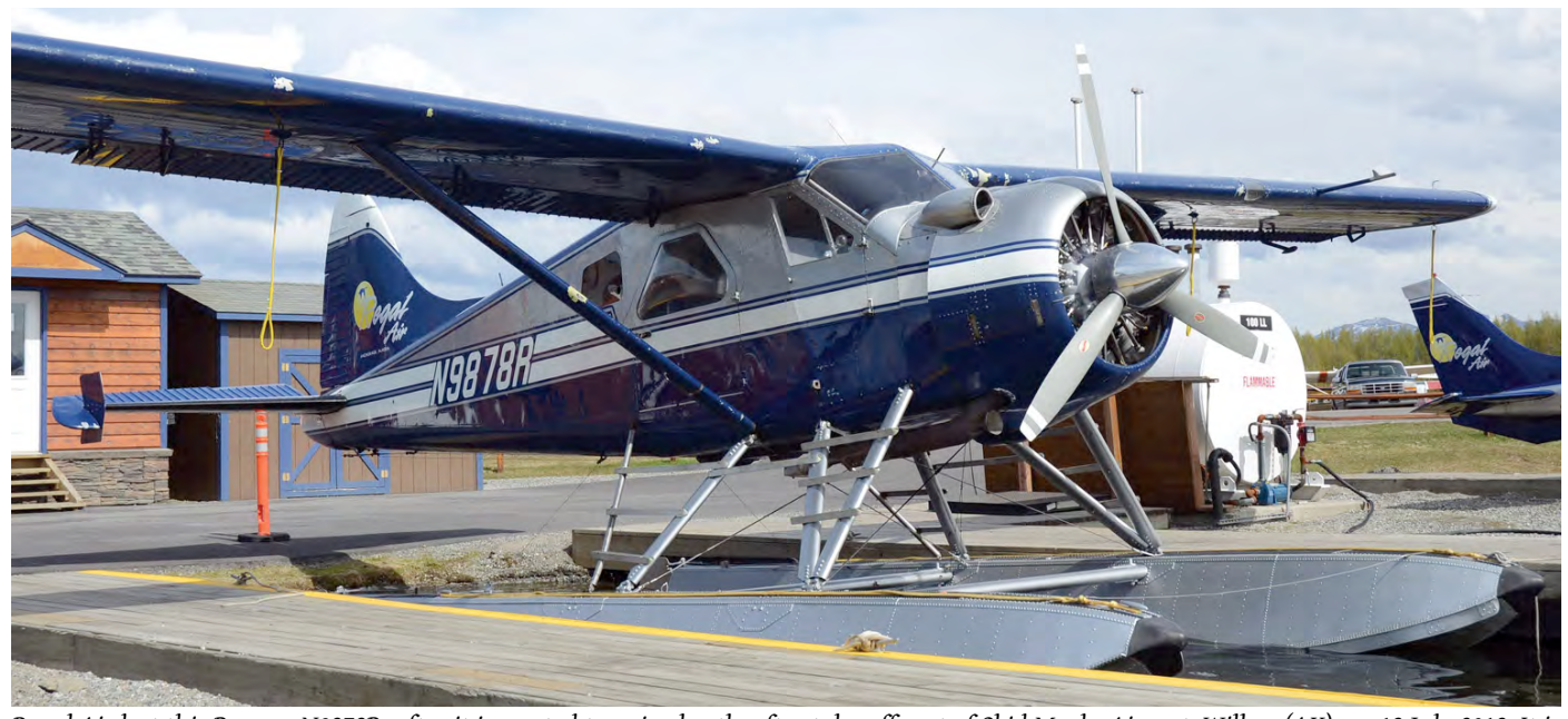
Regal Air lost this Beaver, N9878R, after it impacted terrain shortly after take-off east of Skid Marks Airport, Willow (AK), on 18 July 2018. It is seen here moored at Anchorage-Lake Hood SPB (AK) on 10 May 2015 by Niels Linthout.

20jul18 UP-AN611 An-26B 11404 dam A Kaz Air Trans Antonov, on flight KUY9554 from Kiev, Ukraine, to El-Alamein, Egypt, was nearing El-Alamein when the aircraft disappeared from radar screens prompting El-Alamein tower to notify Egypt's search and rescue centre. A search located the aircraft about 48 miles from the aerodrome. Egypt's Ministry of Transport reported all six members of the crew were rescued uninjured and are safe. The reason for the