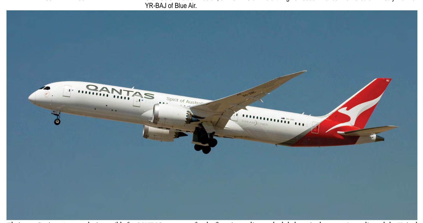
Their new Boeing 787-9s make it possible for QANTAS to operate for the first time a direct scheduled service between Australia and the United Kingdom. QANTAS flight QF9 departs from Perth International at 18:45 and after a 17 hours and 20 minutes long flight lands at London-Heathrow. VH-ZNC is seen here at London after take-off for the return flight QF10 to Down Under. (15 July 2018, Simon Titchmarsh)