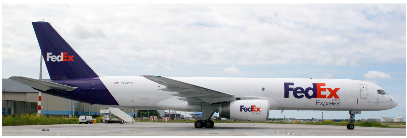
This former Britannia/Thomson Boeing 757 was converted to a freighter and subsequently delivered to Federal Express in 2013. N927FD is one of the FedEx aircraft currently based in Europe. (Amsterdam - Schiphol, 23 June 2018,)