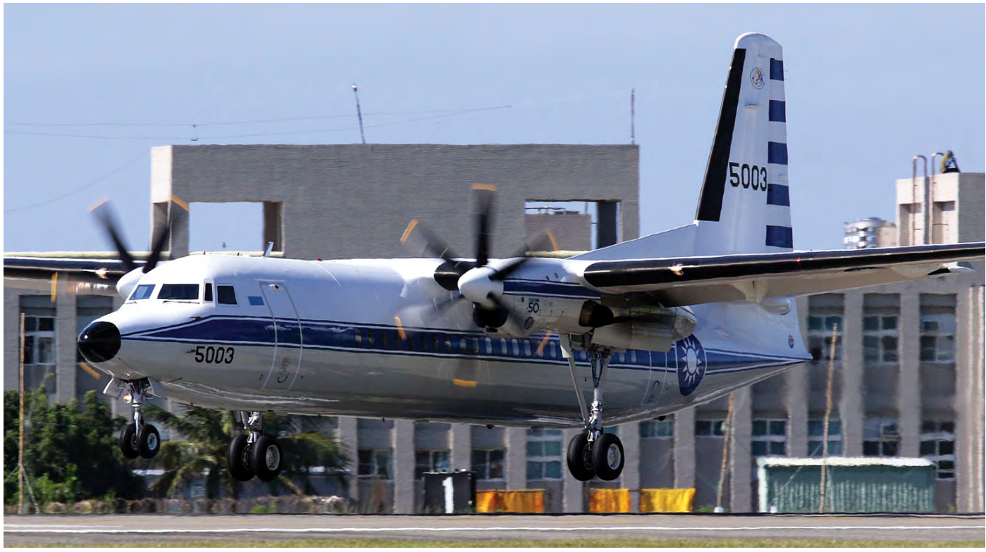
The Special Transport Squadron at Shuangshan have three Fokker 50s on strenght for VIP duties. During the Open Day at Taitung, Fokker 50 5003 was used to bring in some VIPs. (14 July 2018, Reinier Schreurs)

at Mesa Gateway, Arizona on 3 December awaiting air transport. They duly arrived in Indonesia on 20 December 2017. After the other five were delivered by ship, they were officially taken on charge on 16 May 2018 with Skadron Udara Angkatan Darat 11 / Heli Serbu (in short SkUAD11 or like they do themselves: Skadron11/Serbu).