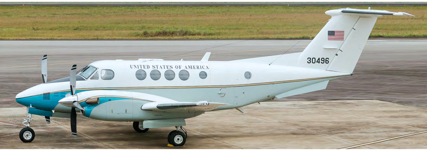
Huron 83-0496 is a regular visitor in South America. Based at Andrews Air Force Base this C-12D mostly operates diplomatic flights. (Paramaribo, 31 May 2018,)

Credits: Danny de Kiewit