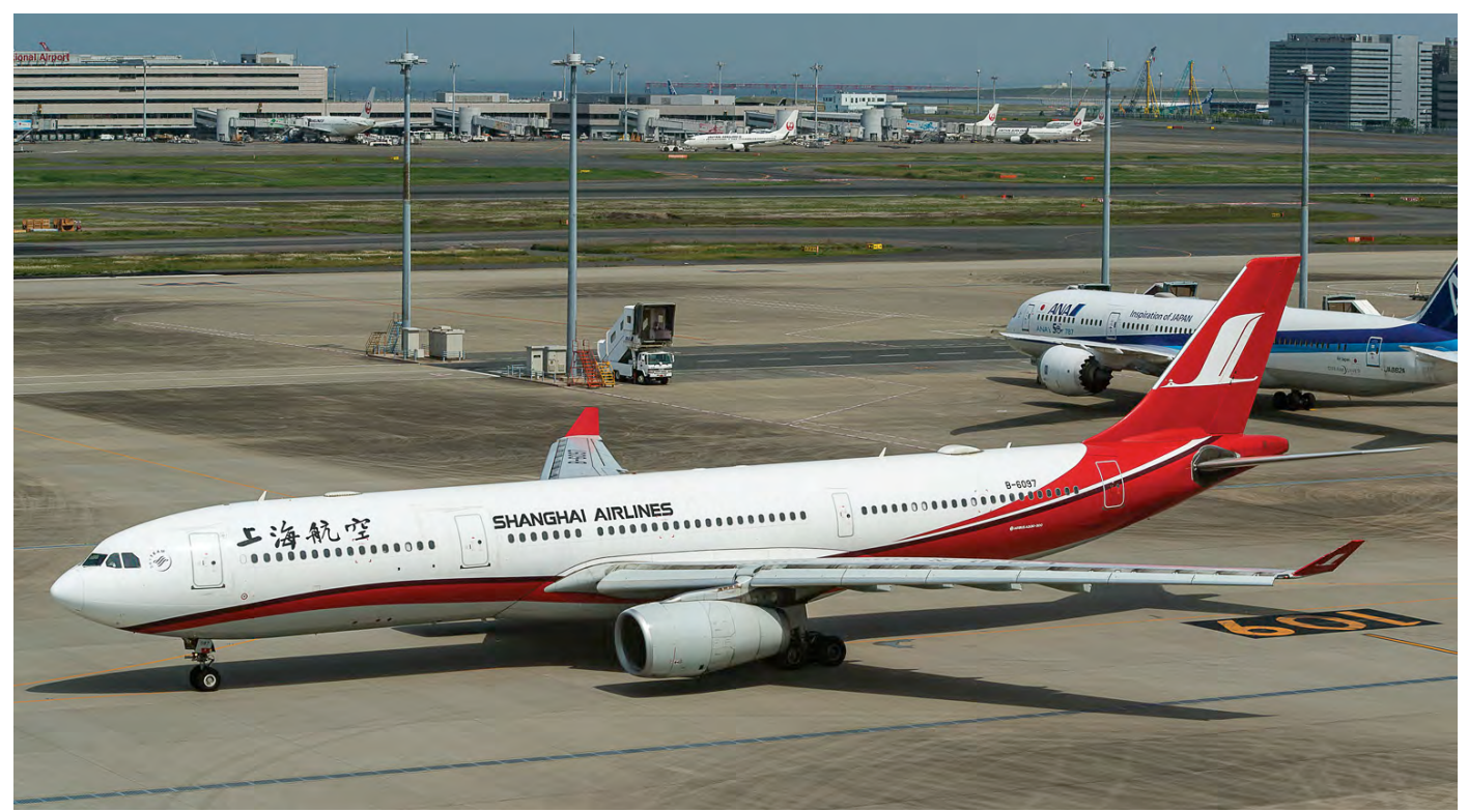
B-6097 is one of the three A330-300s in the fleet of Shanghai Airlines. The airline also has three of the shorter 200 variant on strength. This particular aircraft was delivered to China Eastern Airlines in September 2017 and was transferred to Shanghai Airlines in November 2013. (Tokyo-Haneda, 1 May 2018, Leo Hoogerbrugge)