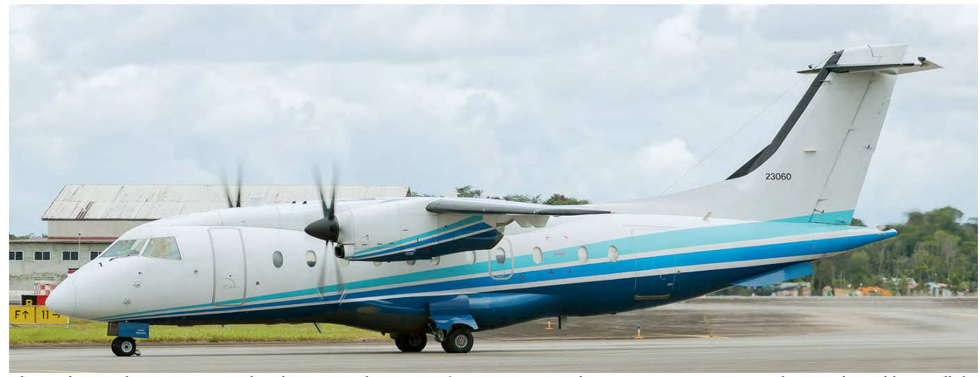
The 524th Special Operations Squadron has operated a variety of types since 1941. This Dornier 328, or C-146A as the US Military like to call the aircraft, was transferred to the squadron as 12-3060 in 2012. (Paramaribo, 21 June 2018,)