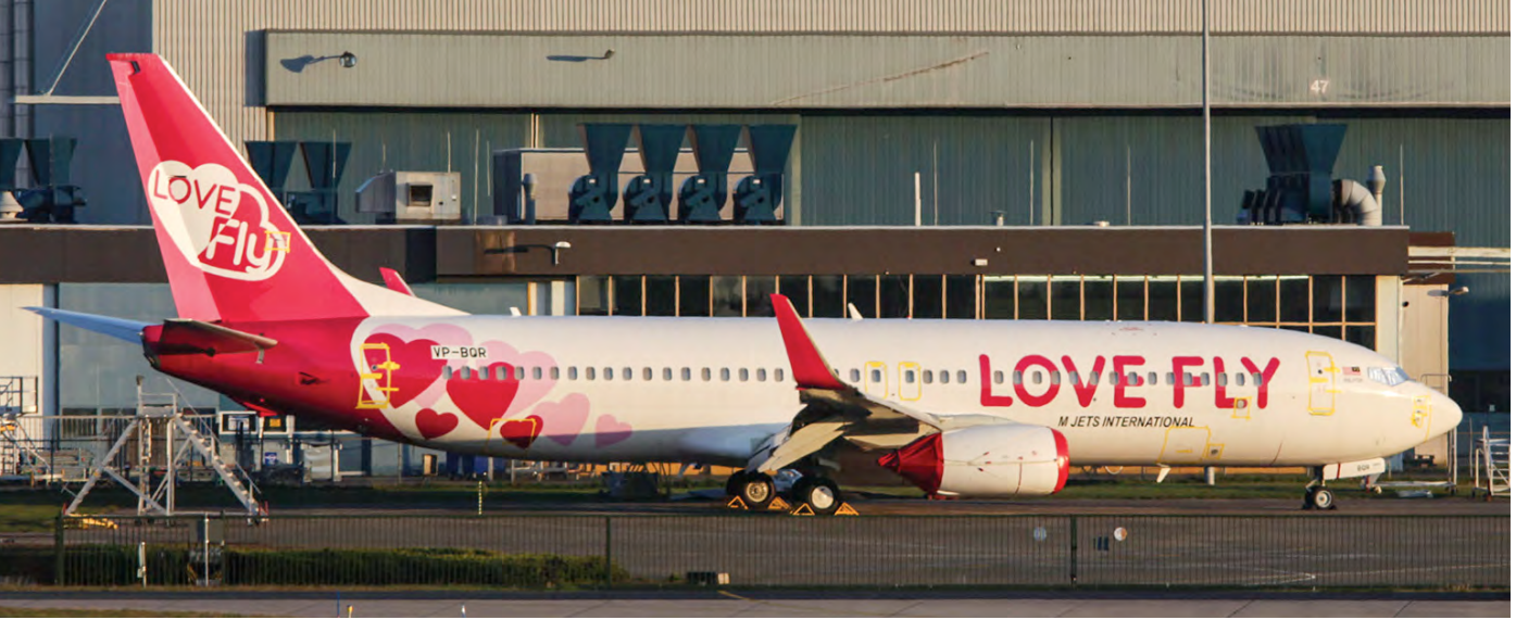
This former Ukraine International Boeing 737 was ferried to Woensdrecht 19 June 2019. Jordy Belde was able to photograph the aircraft registered as VQ-BQR at Woensdrecht on 24 March 2020 in the colours of its future operator Love Fly.