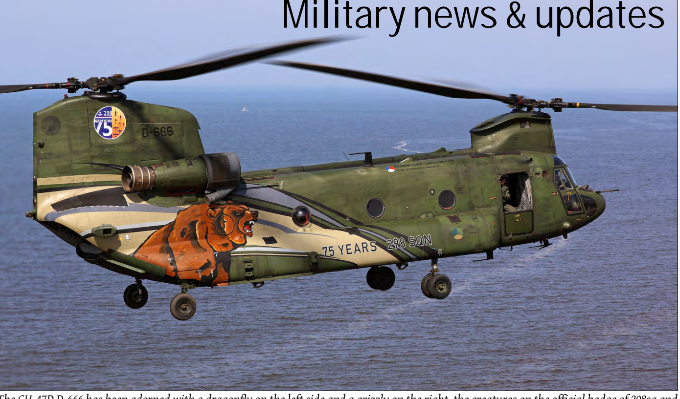
The CH-47D D-666 has been adorned with a dragonfly on the left side and a grizzly on the right, the creatures on the official badge of 298sg and its current symbol, respectively. The squadron's 75th anniversary was to have been celebrated more extensively, but for obvious reasons a commemoration flight was all that could be done. (Scheveningen, 16 April 2020, Ralph C. Blok)

Because of our standardization we sometimes use type, unit and serial presentations that may strongly differ from those used by the manufacturer or user. It is therefore possible that the information sent by you can deviate from the information we publish.