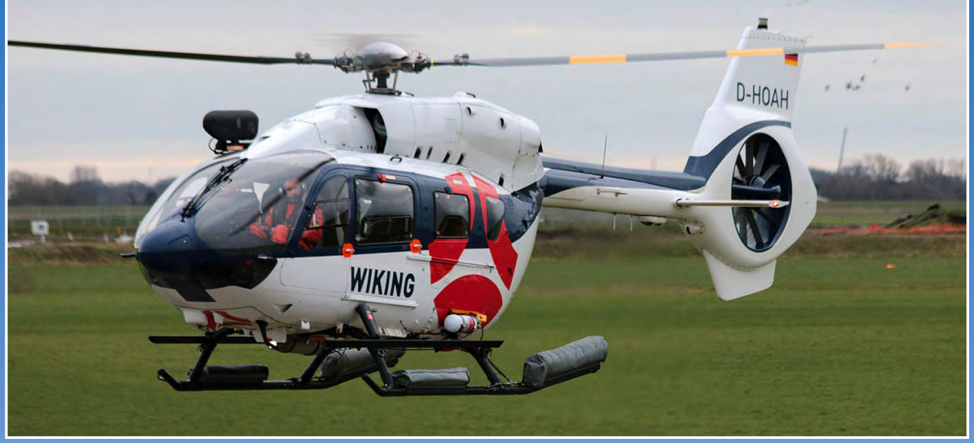
Wiking Helikopter Service has a fleet of eight consisting of the AW139 and H145. H145 D-HOAH made a stop at Texel on its way to his new base Wick in Scotland. (Texel, 14 February 2020,)