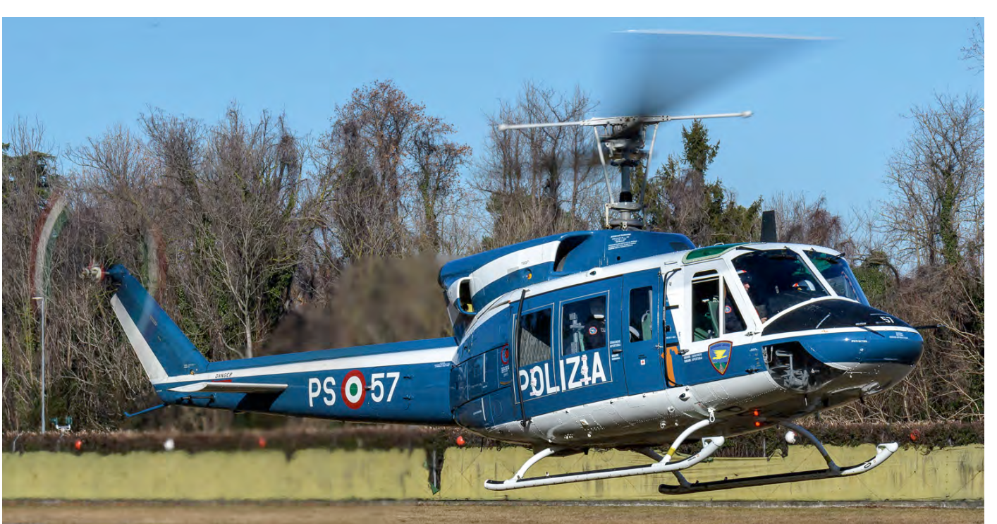
Contrary to previous info, AB212 MM80757/PS-57 is on loan to 2° Reparto Volo and remains assigned to 7° RV. Due to an emergency landing of AB-212 PS-81 not far from Lecco on 24 December 2019, the 2° RV had no more AB-212s available. To continue operations and crew training, an AB-212 from 7° RV, based at Oristano on the island of Sardinia, is temporary assigned to the Malpensa based unit. (Case Nuove, 6 February 2020, Marco Muntz)