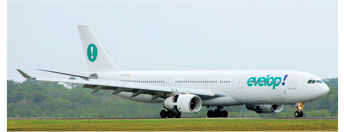
This Airbus A330 as initially delivered to Singapore Airlines as 9V-STT in March 2013. It was added to the fleet of Evelop Airlines in April 2019 as EC-NBP. It has been operating flights for Surinam Airways on a regular base since January 2020. (Paramaribo, 19 February 2020,)