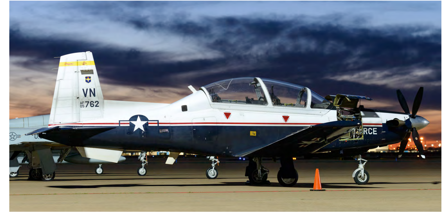
The USAF use approximately 450 Texans for the training of future combat fighter pilots. These Texans are regularly seen at small airports in the United States during their navigation flights. For example, T-6A 05-3762 was photographed at Fort Worth Alliance Airport (TX). (29 February 2020)