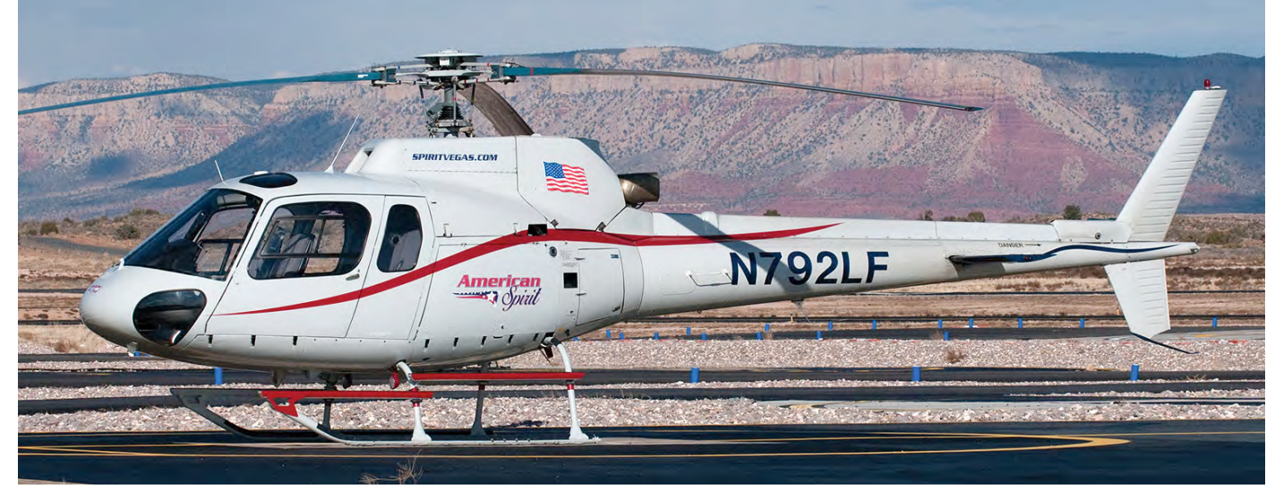
AS350B Ecureuil N792LF of American Spirit is seen with the majestic Grand Canyon in the background. (Joost de Wit, Grand Canyon West (AZ), 25 November 2019)

I logged a few additional stored aircraft here compared to my visit three years earlier. The Westwind Ce208 that I logged on the 25th was a substitute for the daily Ameriflight package/ mail service.