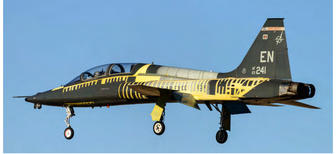
Last T-38C on this page is 63-8241/EN, in desperate need of a paint job! This is an aircraft regained from Taiwan were it flew as 3839 for a while in the nineties. (Sheppard AFB (TX), 25 February 2020,)