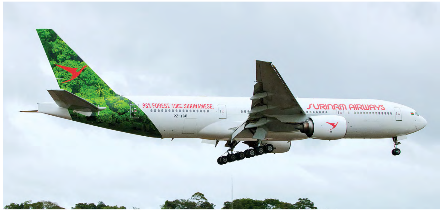
After its arrival from Frankfurt on 20 December 2019 this Boeing 777 was parked on the apron awaiting certification by the Surinamese government. At the end of January the green forest decals and additional titles were applied to the aircraft. On 29 and 31 March 2020 the aircraft performed several local test flights. (Paramaribo, 29 March 2020,)