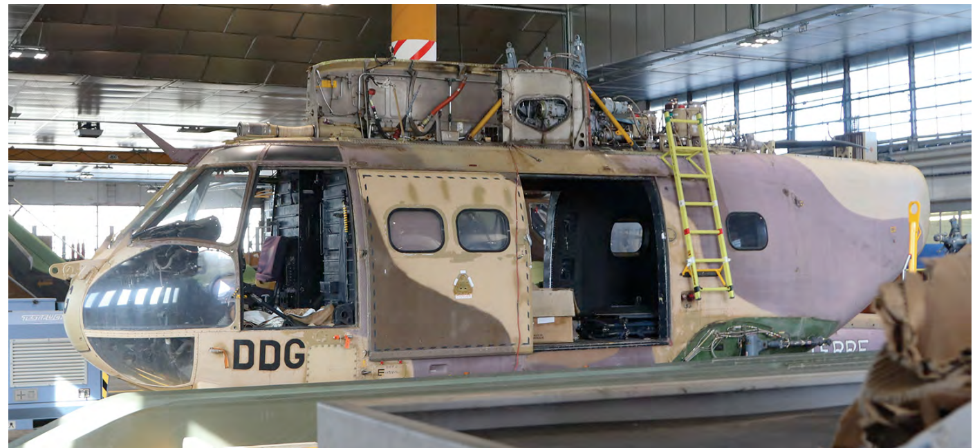
SA330B 1222/DDG was noted in an ALAT hangar at Montauban on 3 March 2020 where it was being stripped of useful spares. It will move on to a yet unknown training area.

The preserved MiG-17 has been closely inspected in March 2020 and the serial looks like 54 with c/n 0907 on its tail.