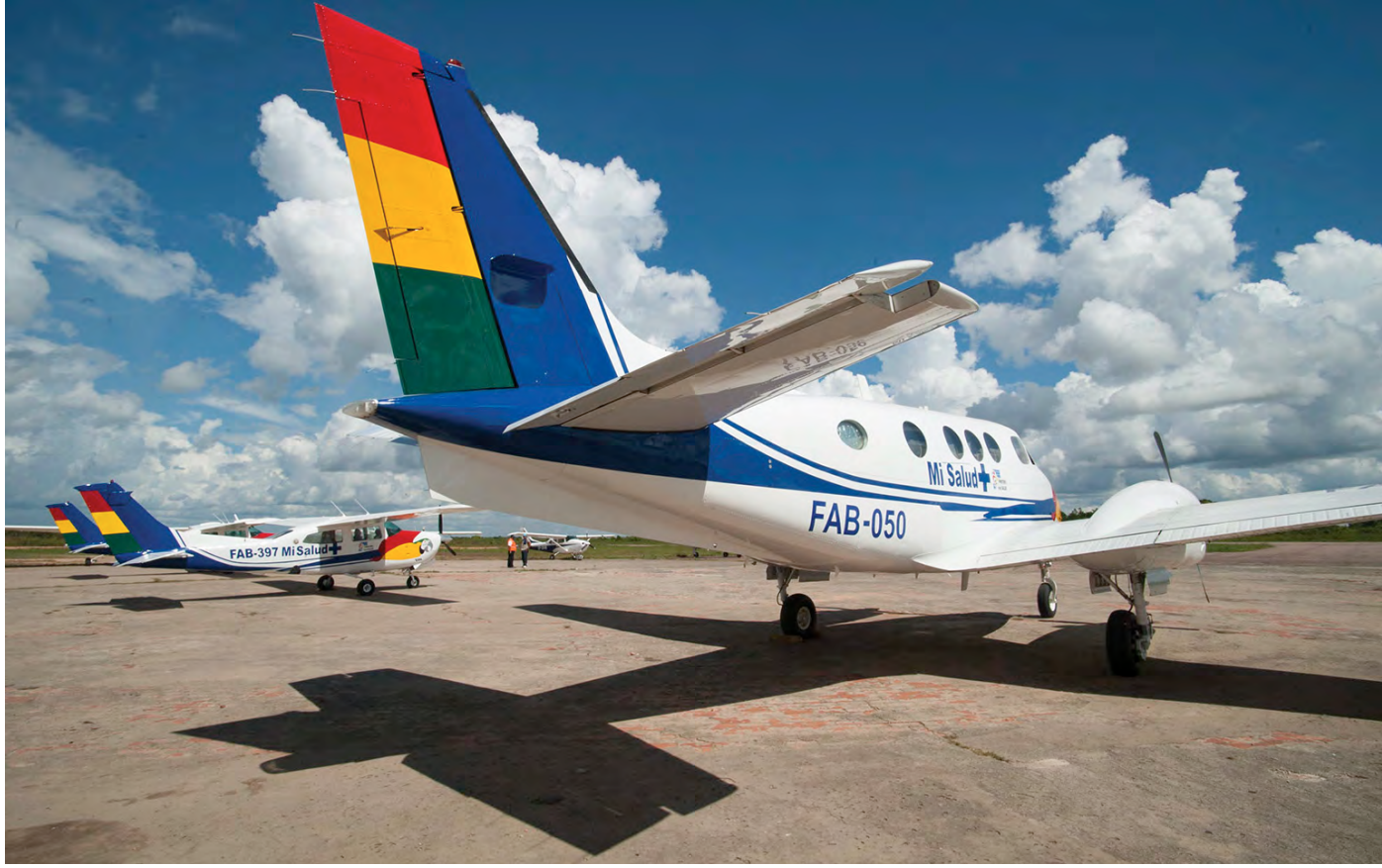
In 2015, the air force incorporated four Cessna 210s and one Beech 90 for use by the department of Health, the Ministerio de Salud. Seen here is FAB-050, the Beech C90 involved and currently busy providing medical support to combat Covid-19. (Beni, 14 October 2015)