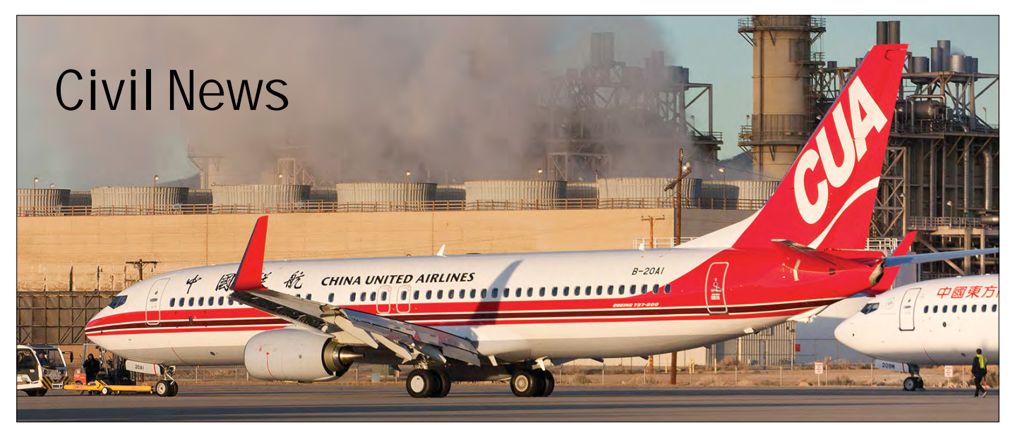
Boeing 737-800 B-20A1 (63087 / line # 7417) is the last commercial Boeing 737NG delivered to an airline. Together with its sister ship B-20A8 (63088 / line # 7522) it was delivered to China United Airlines on 5 January 2020. Both aircraft had already been built in the first quarter of 2019 and had been placed in storage at Boeing Field in Seattle (WA) and finally Victorville (CA) before their delivery flight to China took place. The final Boeing 737NG that came off the production line, also a 737-800, is KLM's PH-BCL (63264 / line # 7542), but this aircraft was already delivered in December 2019. (Victorville (CA), 3 March 2019, Paul Daly)