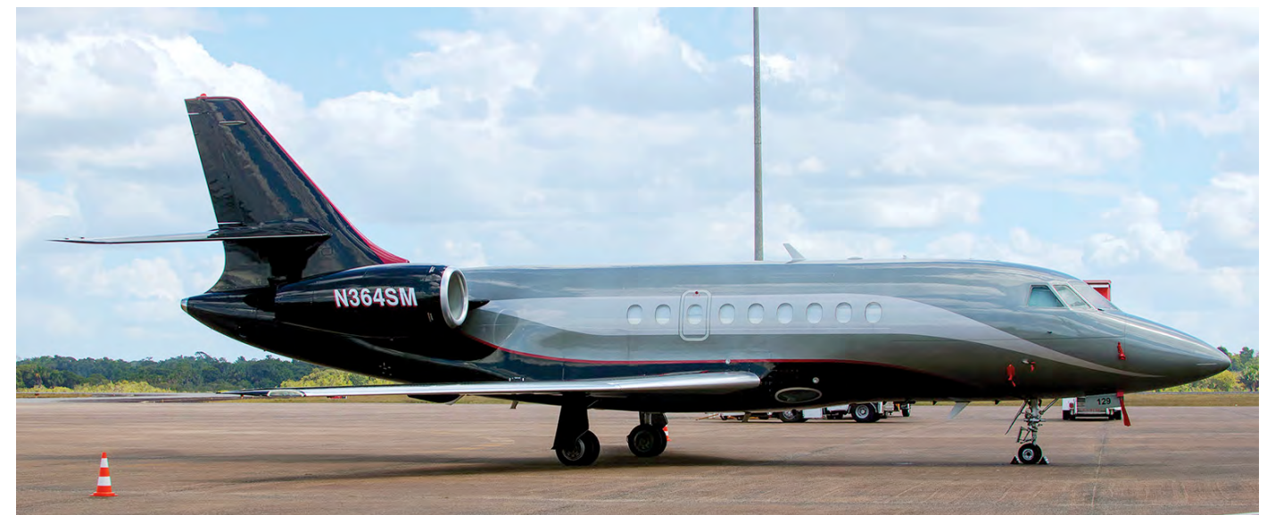
Previously with NetJets as N229DS this Falcon 2000 was acquired by the Dumont Aviation Group in 2018. N364SM is being operated by their Dumont JETS division. The two other divisions are Dumont MRO and Dumont Parts. (Paramaribo, 11 March 2020,)