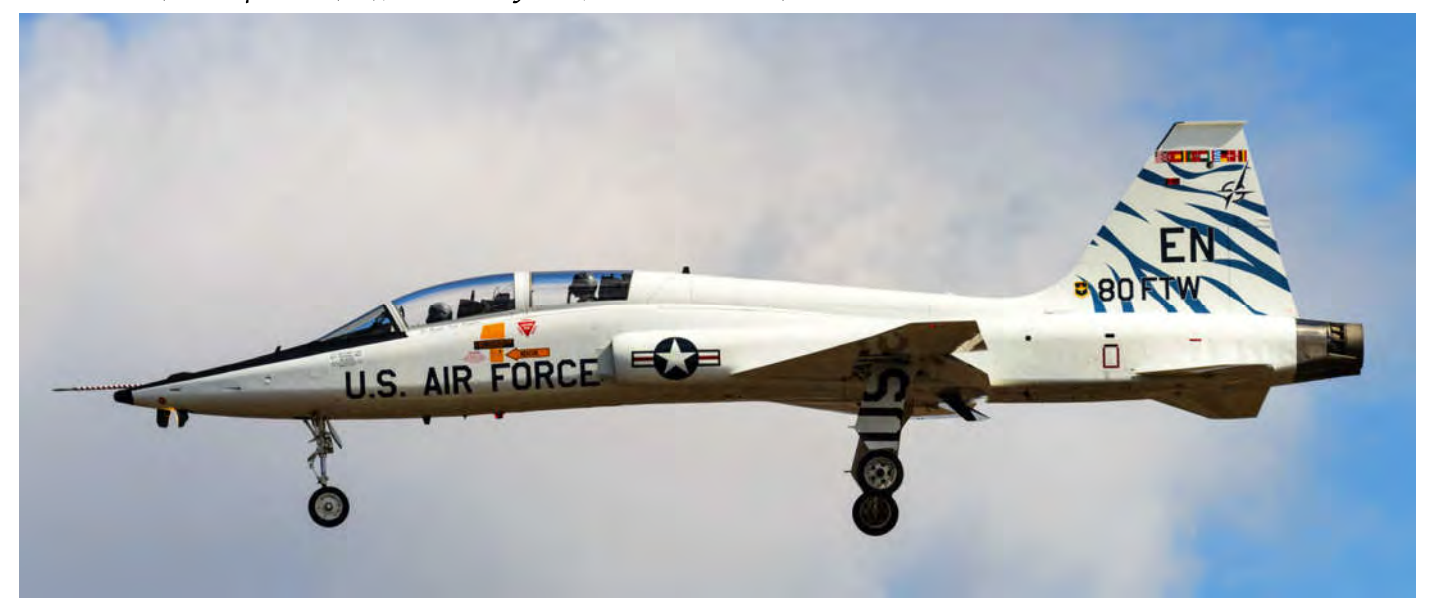
Fourteen small flags are lining the tail of this legacy white commander's aircraft of the 80th Flying Training Wing. Many foreign pilots have passed through Sheppard AFB (TX) to receive their training. (66-8380, 25 February 2020,)