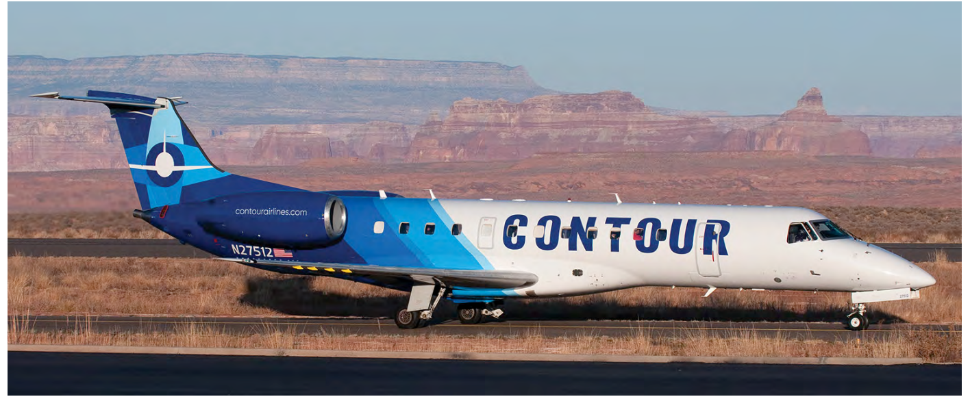
Contour Airlines, a divsion of Contour Aviation, which was formaly known as Corporate Flight Management, is small airline based in Tupelo (MS). Their fleet contains several Embraer 135s and 145. Embraer 135 N27512 is seen here at one of their destinations, also with a gorgeous background, Page (AZ). (22 November 2019)

Since the airport management doesn't offer photo tours anymore, I tried to get to the south side of the field to take some photos along the perimeter fence. This turned out to be a very bad idea because the unpaved desert road was much softer than I expected and thus unsuitable for my standard sedan.