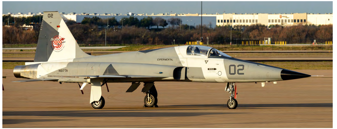
This month's military news features quite some birds with civil registrations. But as long as they look like this F-5E N617TA operated by Tactical Air Support we have no objections at all! Although it looked even better when it was still 1736 of the RJAF... (Fort Worth/Alliance (TX), 29 February 2020, Ronald Stevelink)