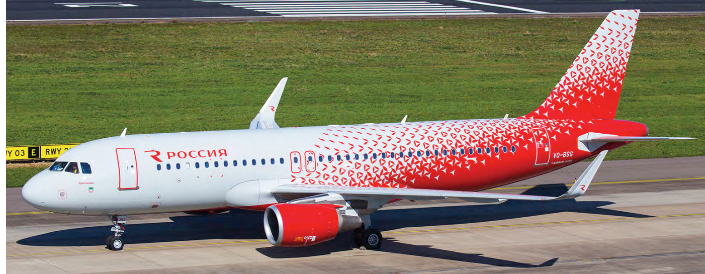
This spring two Aeroflot Airbus A320s will be transferred to its subsidiary Rossiya. These aircraft are VQ-BSG (MSN 6017) and VQ-BRV (MSN 5967). Both aircraft were repainted at Maastricht. These new additions to Rossiya's fleet can be easily identified, because they are the only two Airbuses in the fleet with Sharklets. (Maastricht-Aachen, 6 April 2020, Bjorn van der Velpen)

On 24 March, <u>Miami Air International</u> filed for Chapter 11 bankruptcy protection. While in Chapter 11, the airline wants