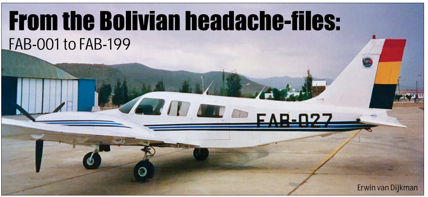
We have one sighting only of this PA-34 FAB-027, luckily with a photo to prove it! With so many type identification mistakes in the past, every photo like this is valuable. (Cochabamba, 13 October 1994)

Recently, we have been trying to sort out the serials of the Fuerza Aerea Boliviana (FAB) in our database. That is not straightforward for a number of reasons. Firstly, the trip reports are few and far between. Older reports focus on propliners and the smaller airfields are seldom visited. Also, everything pre-dating internet, specifically social media, is ill-covered elsewhere. Also, the Bolivian Air Force has impounded a huge amount of aircraft used for drug traficking. These were allocated a serial while sometimes the aircraft never made it out of the storage yard, let alone be used operationally. Lastly, the enormous variety in aircraft types meant a lot of them were falsely identified and featured twice or even three times in the list. Trying to sort this out is an arduous affair, even with photographs the correct subtype is not always easy to tell. So from the Corona-era with love and some headaches, we present the fruits of our research in chunks. This is the first part, bringing some colour to you!