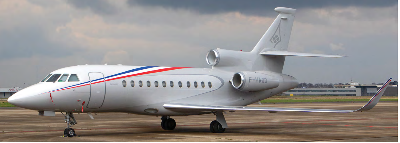
Originally built as a Falcon 900EX this bizjet was converted to a Falcon 900LX in 2019. F-HAOD is owned by Olivier Dassault and operated by Dassault Falcon Service. (Maastricht - Aachen, 6 March 2020,)