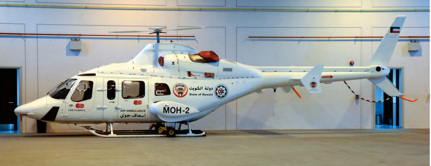
The State of Kuwait operates two Bell 430s as aerial ambulances from al-Sabah heliport near Sabah maternity hospital. Seen here is MOH-2, 'Life Flight-2'. (17 January 2020, Raymond van Dijkhuizen) RJNA = Nagoya/Komaki ATS = Kyoiku Kokutai nmks = no tail unit-number

wfu RJTA hulk under blue covers 1063 mar20 8263 Was photographed at Atsugi, dumped next to an Orion wing section.