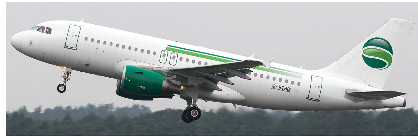
Previously with Hi Fly Malta and Germania this Airbus A319 performed a local test flight registered as 2-WTBB. The aircraft is destined for Croatia Airlines as 9A-CTN. (Woensdrecht, 6 March 2020,)