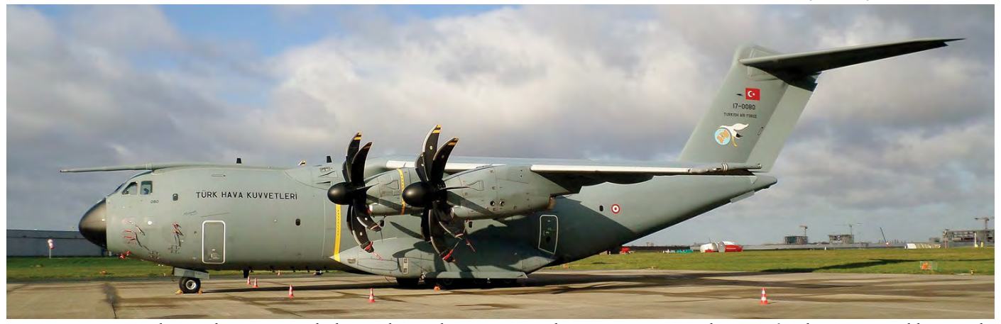
A400M 17-0080 visited Brussels prior to Turkish President Erdogan's visit to the European Union. The aircraft is being operated by 221 Filo. (Brussels, 9 March 2020, Yves Deliens)