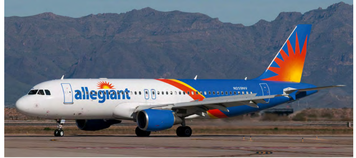
Allegiant Air Airbus A320 N259NV was delivered to the American ultra low cost carrier in August 2018. Before joining the Allegiant fleet it flew for Saudi Arabian as HZ-AS12. (Phoenix-Mesa Gateway (AZ), 19 January 2019)