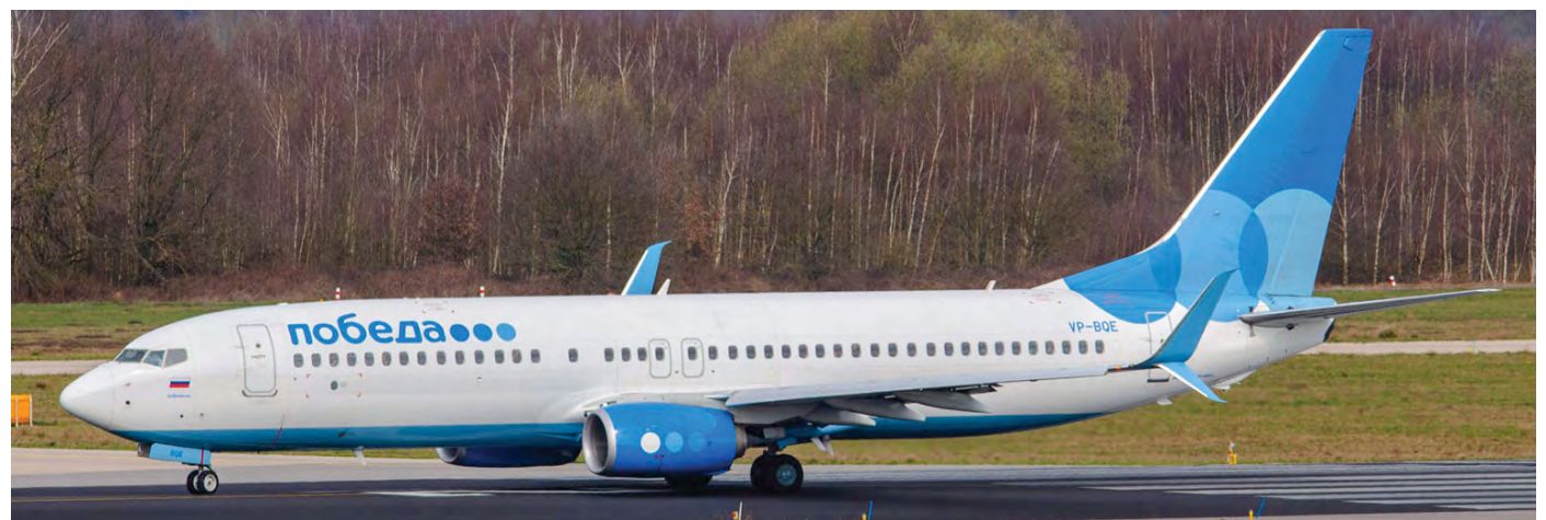
On 21 December 2018 Pobeda began operating flights to Eindhoven. The Aeroflot subsidiary operated its final flight with VP-BQE on 16 March 2020 when.

Eindhoven started March with a Spanish C-130H, arriving from Spain and heading towards Riga. Continuing with a formation of Alpha Jets E110/705-AH was wearing SPA161, ESE 04.011 markings, E114/705-RR was wearing Alpha Jet Solo Display c/s, Alpha Jet E153 was sporting EIV03.004 markings on the left tail and 1e GC I/9 markings on the right tail surface.