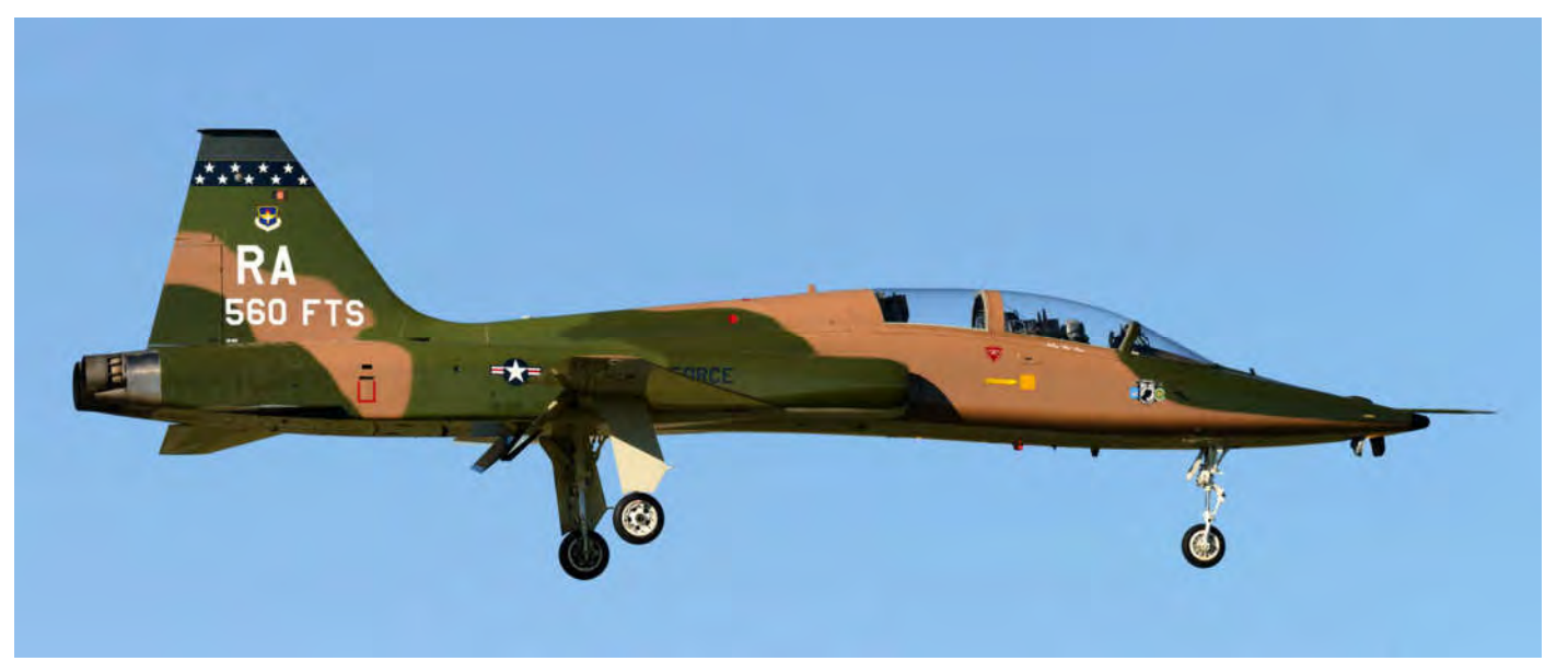
Beautiful study of this stunningly camouflaged T-38C "560FTS" 68-8191/RA, although this scheme seems a bit out of place on this trainer. (Randolph AFB (TX), 27 February 2020, Ronald Stevelink)