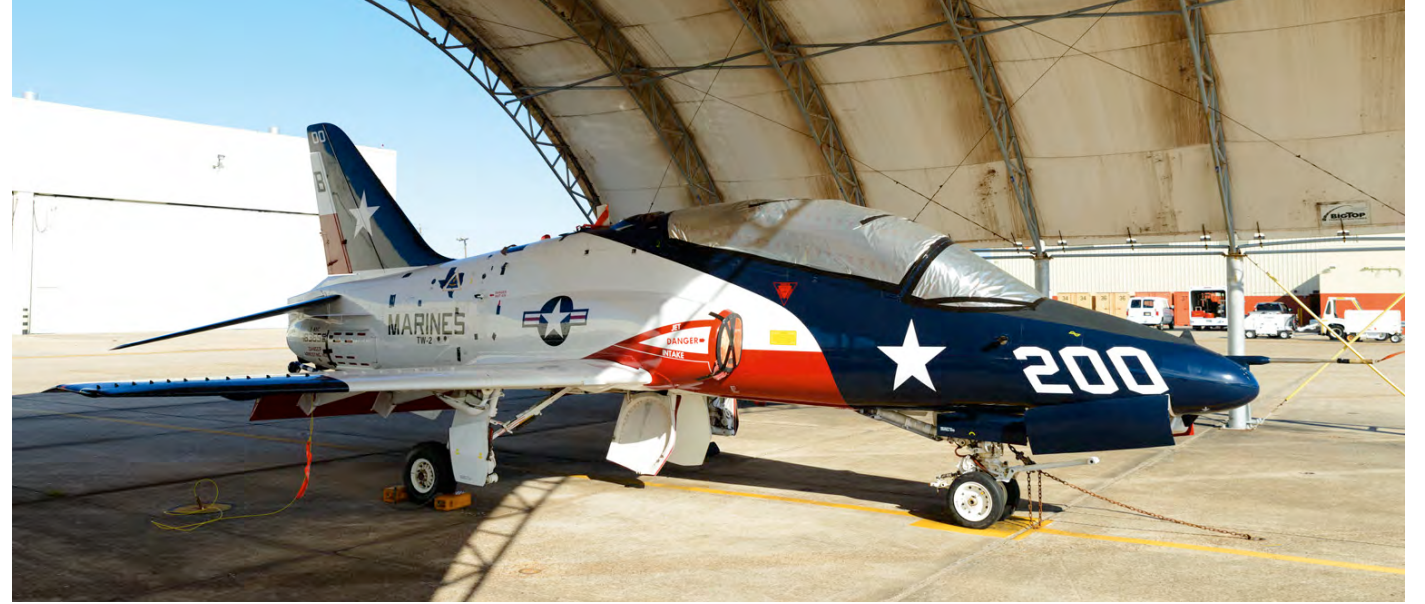
The T-45C Goshawk has been around for a while, and you may just guess in which US State 163656/B-200 is based! (Kingsville NAS, 26 February 2020,)

Personal copy - Distribution to a third party is not allowed