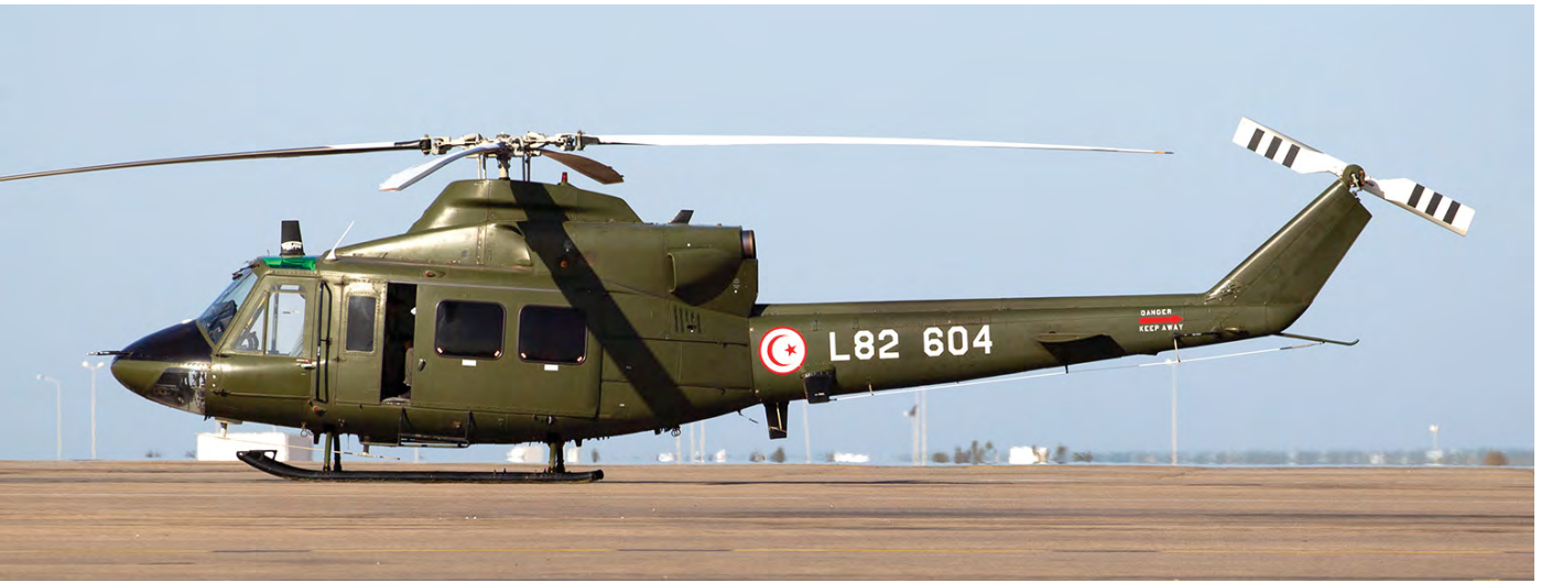
One of two AB412 of the Tunisian Air Force is L82-604 of 35 squadron, which is normally based at Tunis-Carthage. Unfortunately the msn could not be checked because it was parked on the flightline and not on the static. (Djebra-Zarzis, 4 March 2020,)