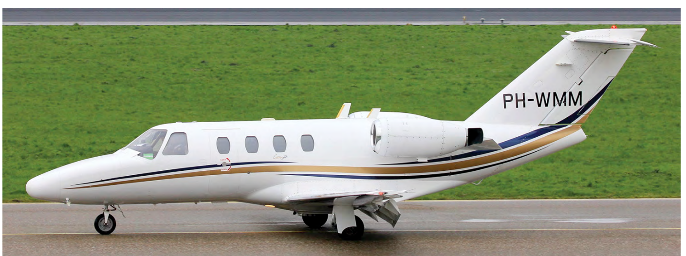
Cessna 525 D-IRWR was registered with ASL as OO-EUR in June 2019 and based at Rotterdam. Early February 2020 it operated its last flight and two weeks later it was seen registered as PH-WMM. It operated its first flight with that registration on 5 March 2020 still being operated by ASL. (Rotterdam- The Hague, 6 March 2020, Henk Wadman)