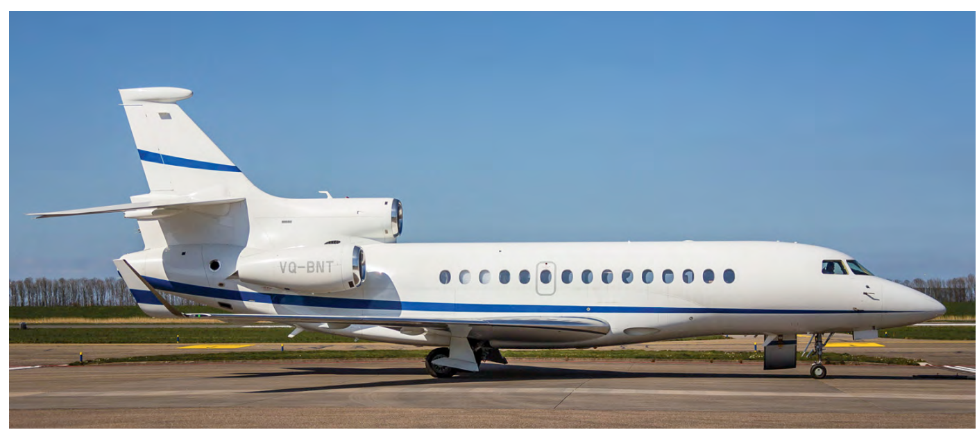
This Falcon 7X has been for sale since May 2017. It arrived from Geneva for attention by local painter SATYS. VQ-BNT is registered to Planair Enterprises. (Lelystad, 28 March 2020,)