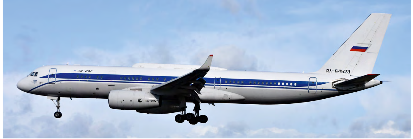
Paris-Le Bourget was visited by the Russian flying command-post Tu-214VPU RA-64523. The federal plane, operated by the FSB, has a livery similar to the classical Soviet paint scheme. (26 February 2020,)