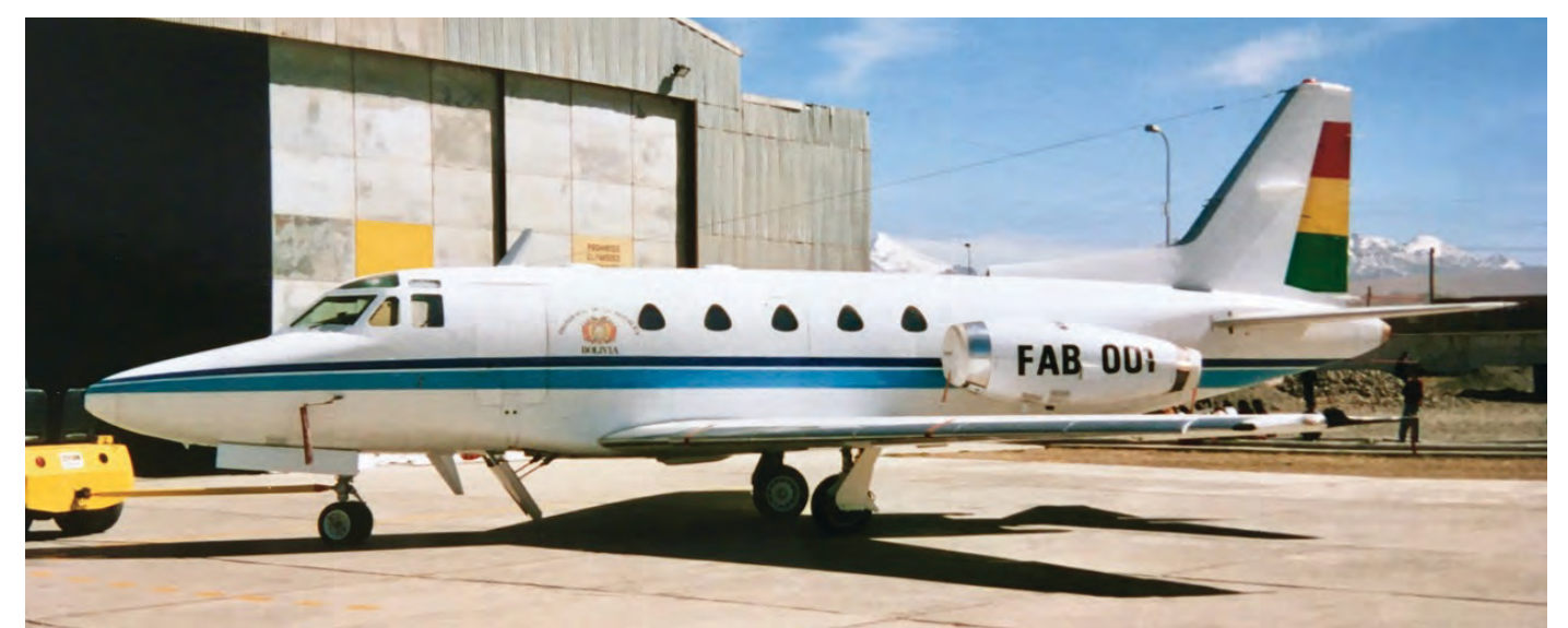
Probably Bolivia's most enigmatic "Air Force One" was this Sabreliner FAB-001, nowadays registered as FAB-005 after a short spell wearing FAB-002! ( 306-115, La Paz, 3 October 1994,)