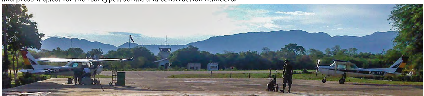
Typical scene at Villamontes, a hot and humid village in the Tarija department. The Grupo Aéreo Táctico 63 has its domicile here and apart from the odd photo on their Facebook page, not many sightings emerge. (CeA152 FAB-130 and FAB-133, Villamontes, 12 June 2016, GAT63)