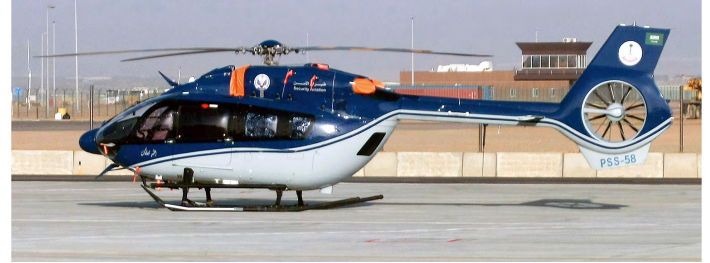
Most of us will not frequently visit Al Ula, Prince Abdul Majeed Bin Abdulaziz Airport, let alone take photographs there. This fairly recently delivered Saudi Presidency of State Security forces' H145T2 PSS-58 was captured there. (5 March 2020,)

There has been doubt over several T-33 tie-ups. In particular the former French ones that were not ferried over but delivered after the dozen that went through Glasgow in 1985. At least three of these five were stored and never took up their assigned serial. It seems they were revived and circulated through the upgrade program at Kelowna (BC), Canada in 2000-2001 though. The recent publication, "Canadian Silver Stars: The CL-30 T-Bird in Canadian and overseas Service",