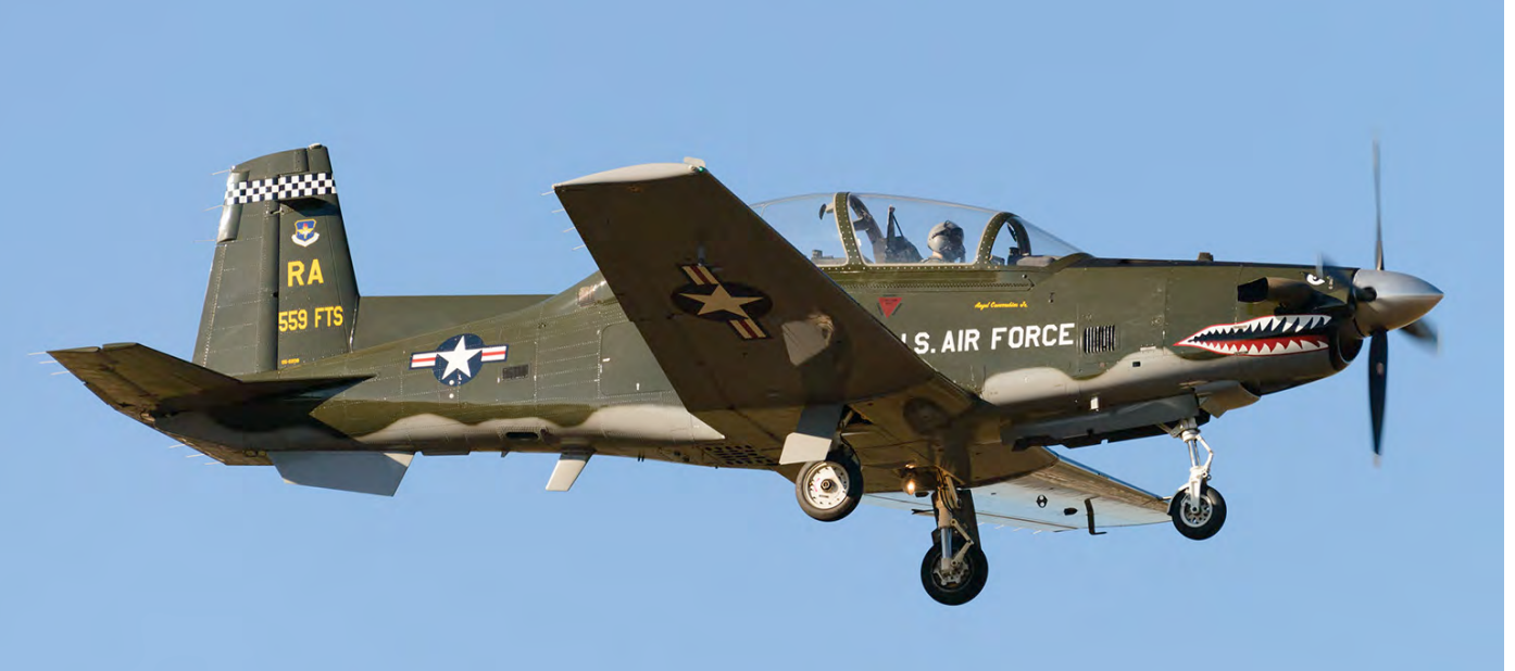
Seen in a special colour scheme is this T-6A 05-6208/RA.