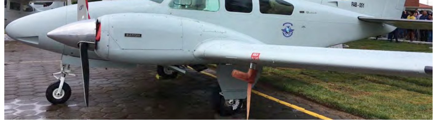
Not many air forces start using the Beech B55 in 2018. Alas, grey livery and small serials is the norm nowadays even in Bolivia. This impounded ex-drug running FAB-051 is now on charge with GAT72. (Santa Cruz, 31 May 2018,)