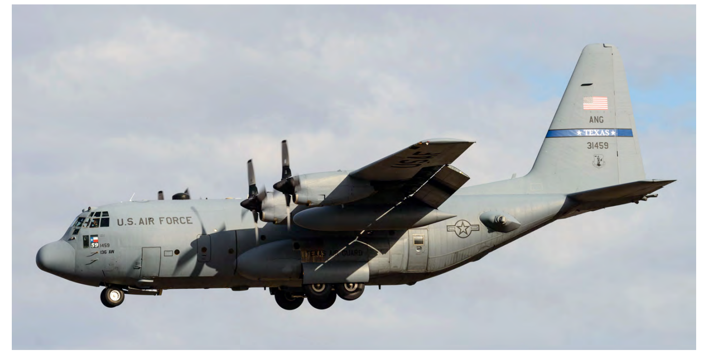
The 181st AS is one of the few units still operating with the old "H" variant of the Hercules. C-130H 93-1459 is one of those and was photographed during landing at its home base Fort Worth NAS JRB (TX). (26 February 2020,)