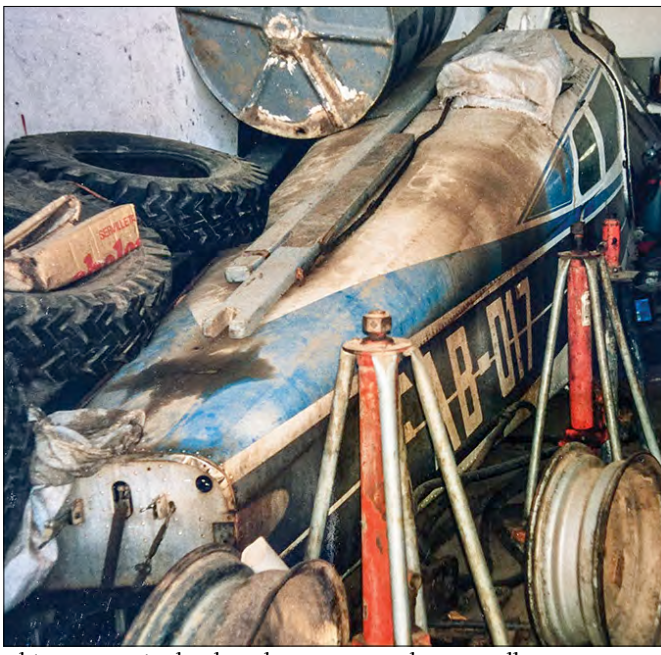
This FAB-017 is clearly a, hmm, yes surely, a... Well a Cessna 310D probably! This is the shot that started the hunt!