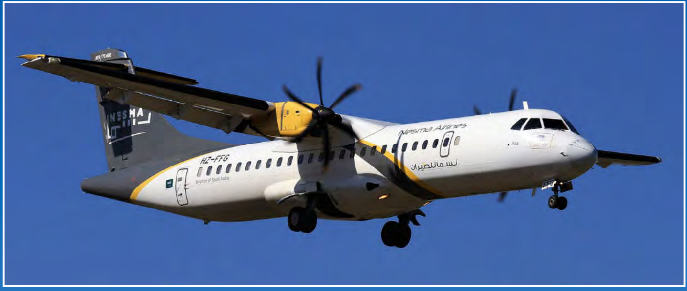
Nesma Airlines has phased out all ATR72s. The last one is HZ-FFG which was ferried to Woensdrecht and arrived on 23 March 2020. (Woensdrecht, 23 March 2020,)