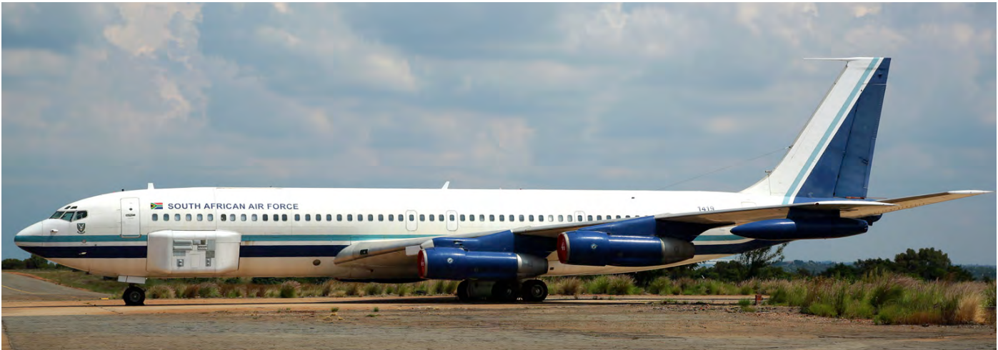
After about twelve years in retirement, this Boeing 707 of the South-African Air Force is still in very good shape despite being parked outside at Swartkop. (1419, B707-328C, Robert Eikelenboom, 10 February 2020)

20sq A photo of this crashed Mi-17 was found on Facebook. The Mi-17 was in the UN white colour scheme and had the registration with the ET-prefix as ET-2021, like all Ethiopian Air Force helicopters have when they are operating for the United Nations.