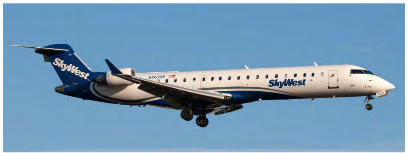
CR701 N767SK is now flying in the attractive company colour scheme of SkyWest Airlines, but in the past you may have seen it as Delta Connection or United Express. (Phoenix (AZ), 31 January 2019)