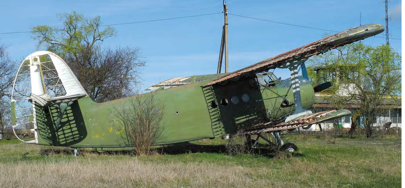
Visits to Moldova are rare, so pictures from there are welcome. The An-2T 36 yellow (allocated registration ER-AIC not carried) was noted stored at the airfield of Ceadîr Lunga in the southern autonomous republic of Gagauzia. (15 March 2020)