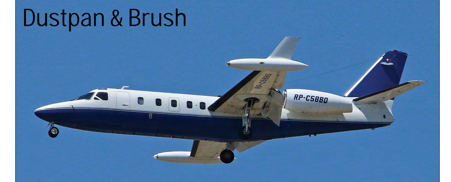
On 29 March 2020 this Westwind II of Lionair was operating an ambulance flight (carrying one Canadian patient with Covid-19 and medical staff) to Tokyo-Haneda, when during take-off from runway 06 at Manila-Ninoy Aquino Airport the aircraft went out of control and crashed near the runway end. The aircraft was destroyed and all eight occupants were killed. (Denpasar, 24 December 2019, Pascal Simon)