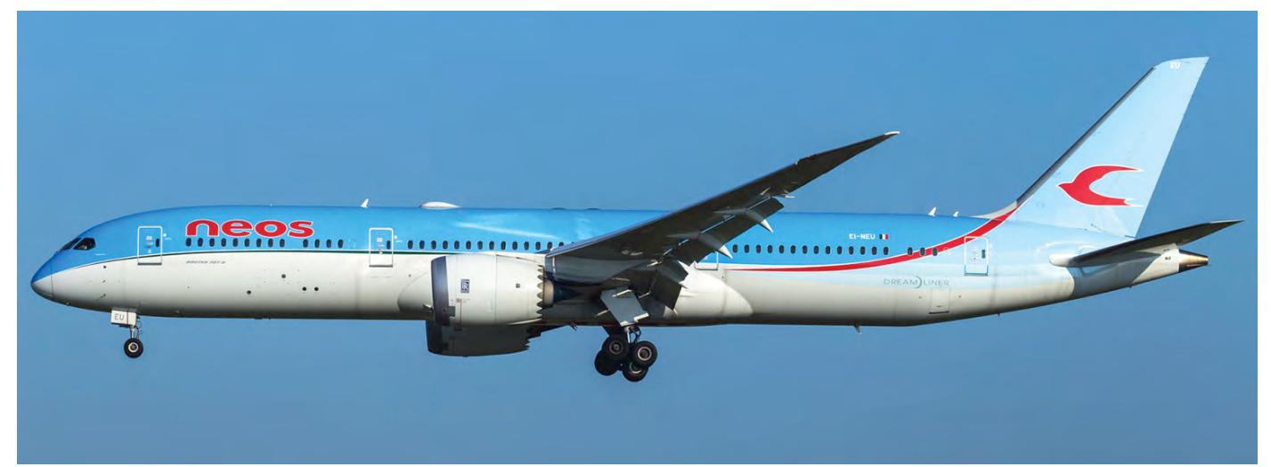
Each year Neos operates a charter from Brussels to Guadeloupe and vice versa. This year Boeing 787 EI-NEU was used twice for the flight. (Brussels, 7 March 2020,)