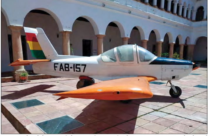
During the delivery of their 18 factory fresh A-122As, one crashed and was replaced with a new one taking up the same serial. This batch was registered FAB-160 to FAB-177 and delivered from 9 May 1974 onward. These were followed by six ex Brazil Air Force T-23A (A-122B) in September 1986, FAB-154 to FAB-159. Fifteen ex-aeroclub A-122A/B were donated by the Brazilian government in 1994, FAB-178 to FAB-192. The A-122B has a distinctive teardrop canopy. (FAB-157, Museo Historico Militar de la Nacion, Sucre, March 2020, Christian Lopéz)