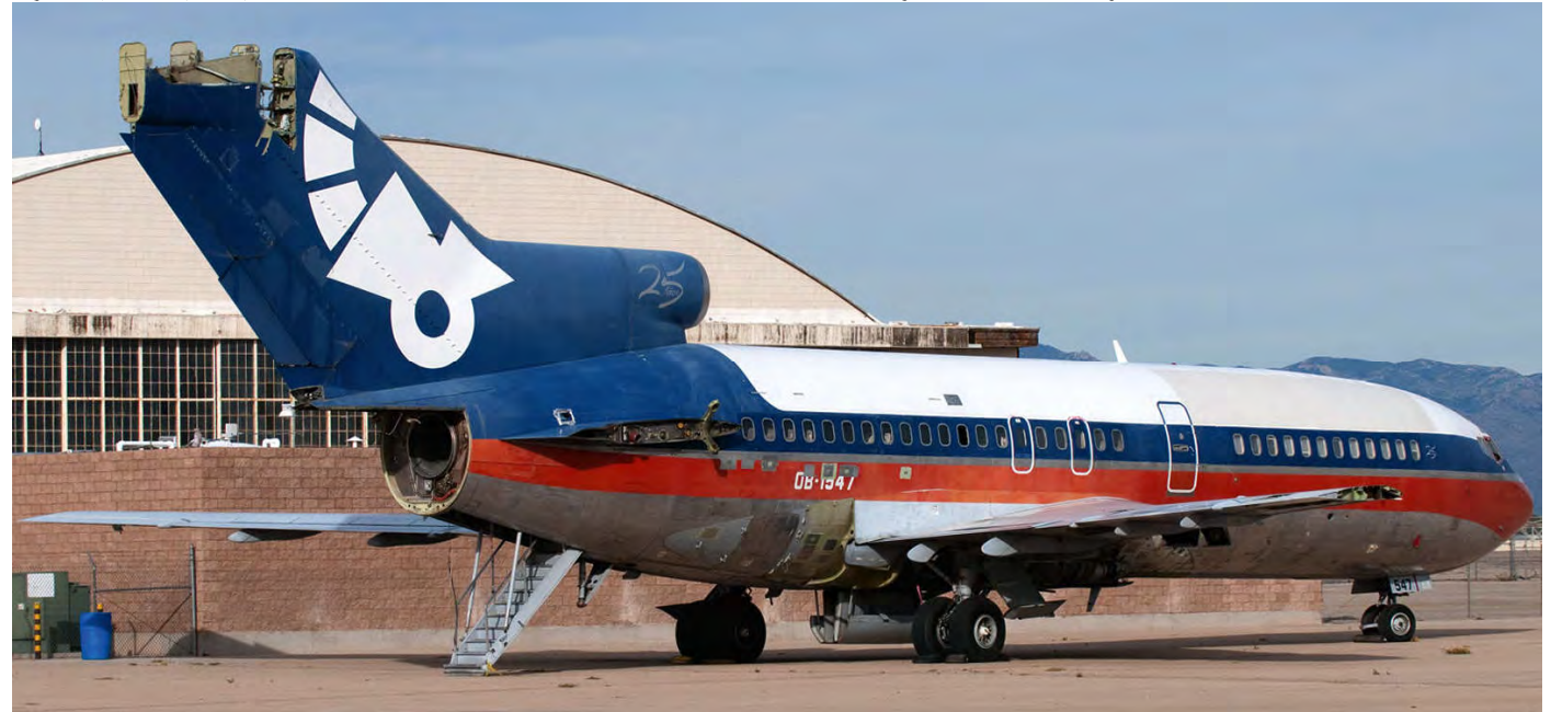
This airframe was built in 1967 and delivered to United Airlines and it ended up as an instructional airframe at Pima Community College Aviation Tech, Tucson (AZ). The Boeing 727 can still be found there, as OB-1547 in the colours of Aero Perú. (20 January 2019, Joost de Wit)