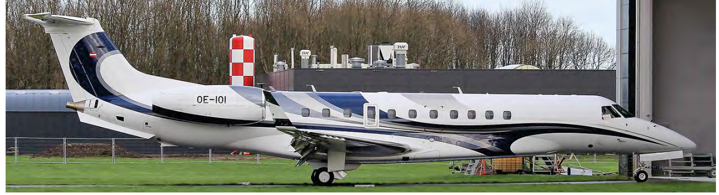
This Embraer ERJ135BJ was registered as OE-IOI on 20 January 2020 to a company called 360 Aviation. It was flown from Bremen to Lelystad for painting. (Lelystad, 13 March 2020,)