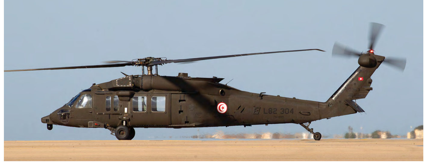
The IADE at Djerba-Zarzis in Tunisia was not an event for the quantity but definitely for the quality. Among some of the newest hardware present was this UH-60M L82-304/TS-SRT of 36 squadron, with US serial 27363 in the tail. (4 March 2020,)