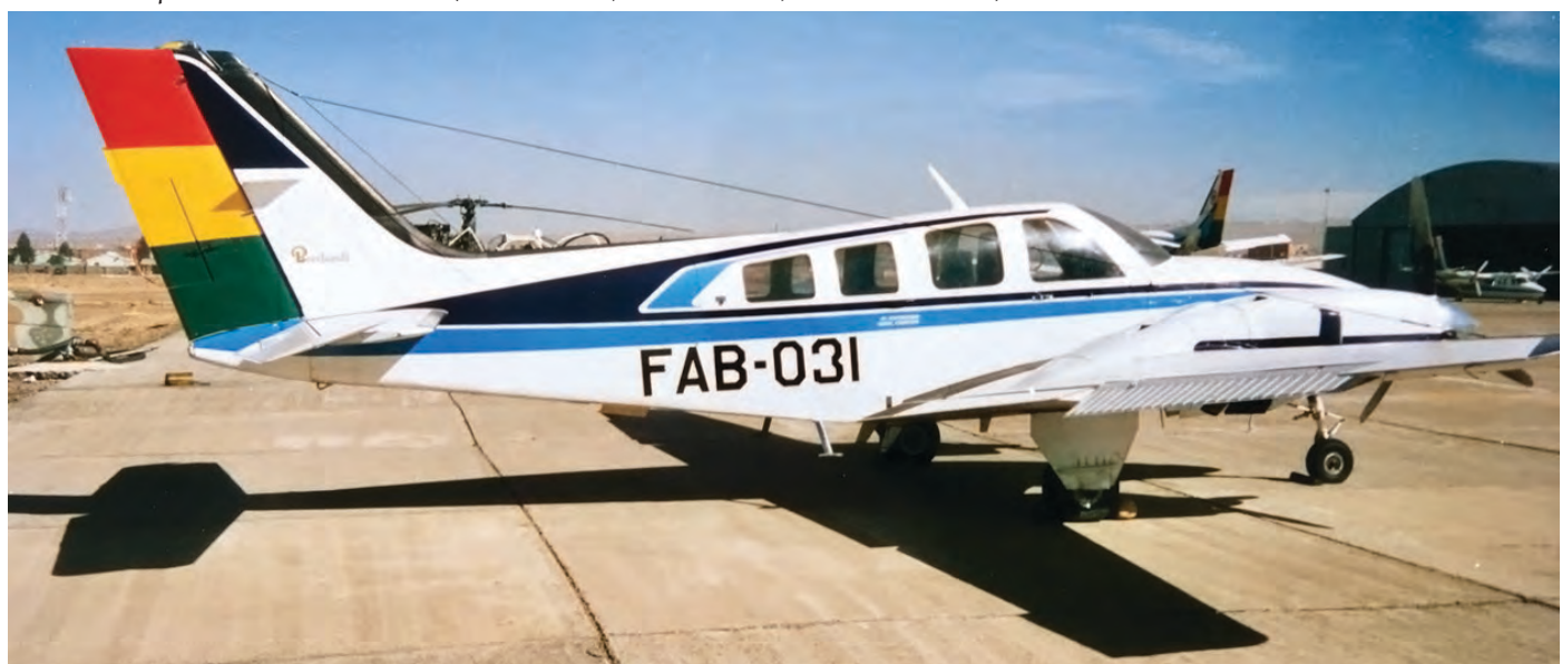
This Beech 58P is no longer with us unfortunately as it crashed on 31 July 2004. It was operated by the Grupo Aéreo de Caza 31, also at the time this photograph was taken. (La Paz-El Alto, 3 October 1994,)