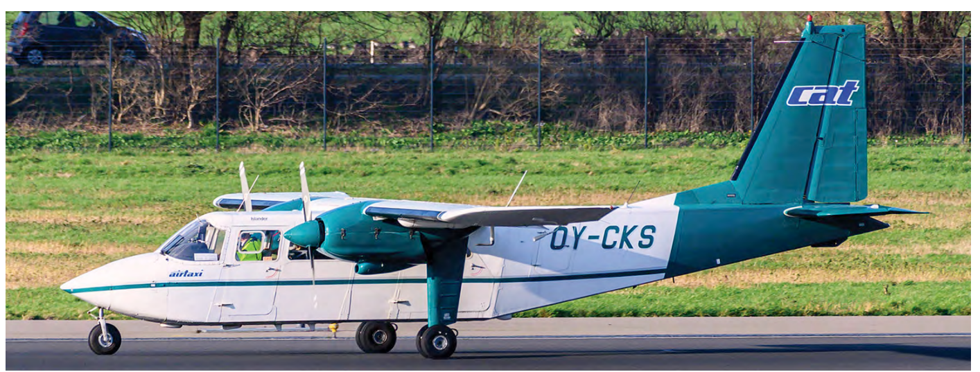
This former Belgian Air Force Islander was acquired by COWI Aerial Services in 2008. It was registered as OY-CKS shortly after. In April 2018 the BN-2B was transferred to the AOC of Copenhagen AirTaxi. (Rotterdam- The Hague, 6 February 2020,)