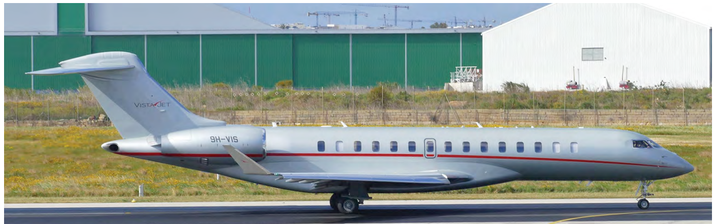
VistaJet took delivery of their first Global 7500 at the end of March. It is registered as 9H-VIS and carried c/n 70024. An unknown amount of the jet was ordered way back in 2012, as part of a large order of Global jets. (Malta, 25 March 2020,)