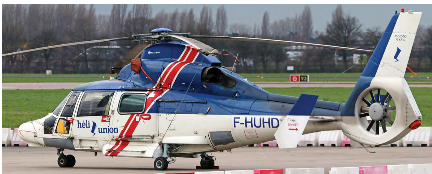
Previously in the French register with Heli Union as F-GZAE this Dauphin was transferred to Cameroon as TJ-HAA in July 2015. The AS365 was photographed at Toussus-Le-Noble as TJ-HAA on 30 January 2020. Registered as F-HUHD is was ferried via Rotterdam to Scandinavia most probably for maintenance. (Rotterdam- The Hague, 20 February 2020,)