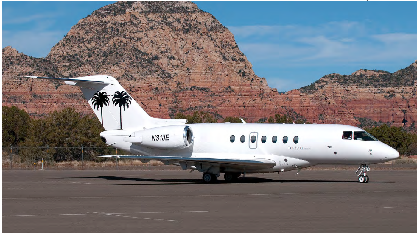
Raytheon 4000 N31JE, operated by Talon Air, was at Sedona (AZ) on 23 November 2019.

I spent the remainder of the day at North Las Vegas airport. The two AS350s were parked at the helipads along N Rancho Dr at the western end of the field near runway 7.