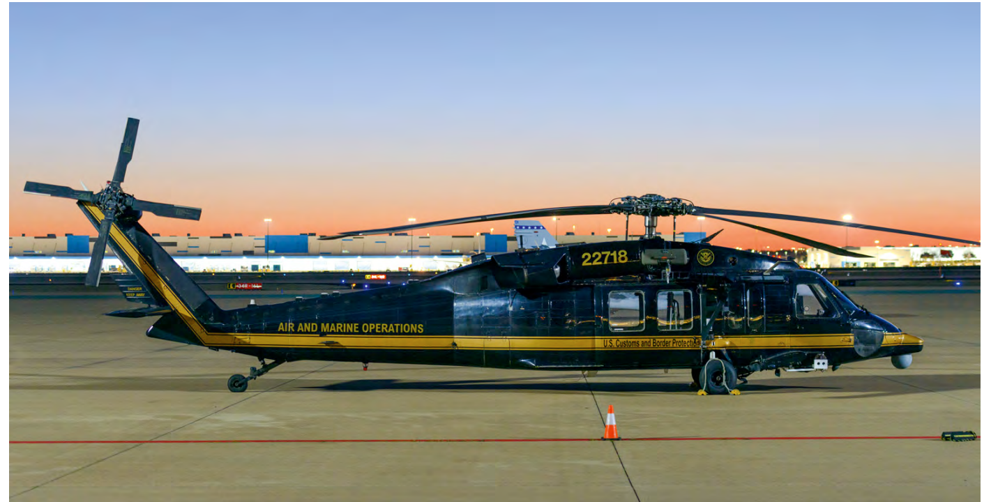
The United States Customs and Border Protection unit has a home base in the city of Kingsville. For their border protection duties, the unit operates a couple of ex USAF UH-60s including this UH-60A 77-22718. (Kingsville NAS (TX), 26 February 2020)