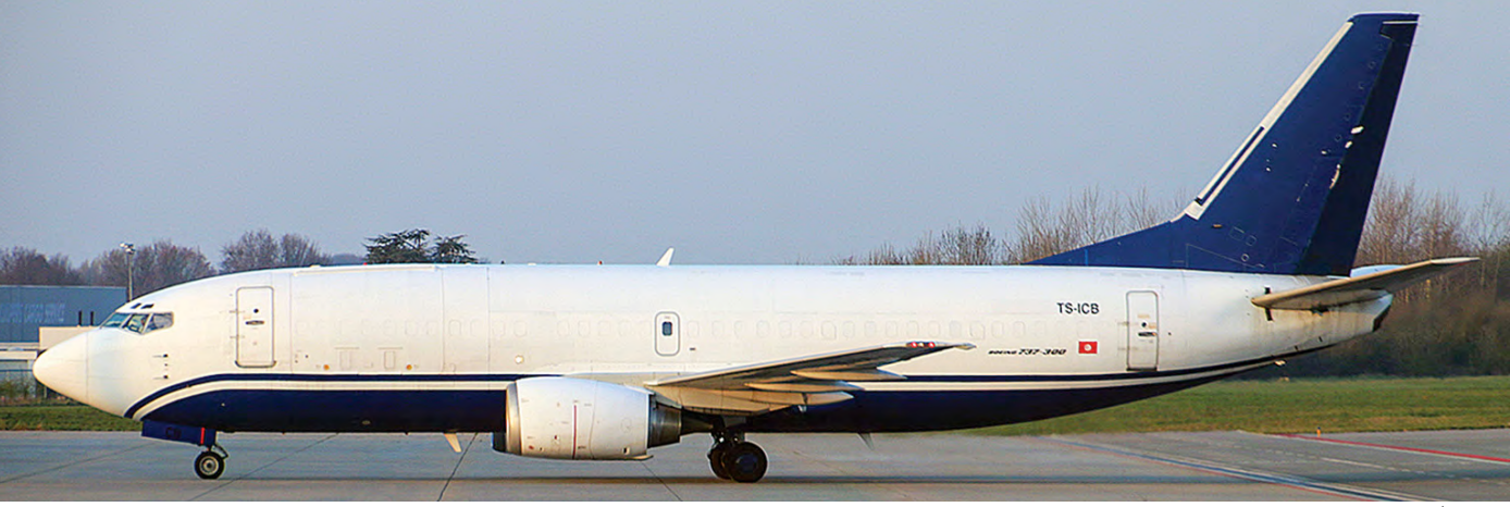
Express Air Cargo acquired this former Texel Air Boeing 737 in May 2017. TS-ICB still carries the basic colours of its previous operator. (Maas-tricht - Aachen, 27 March 2020, Leo Remmel)