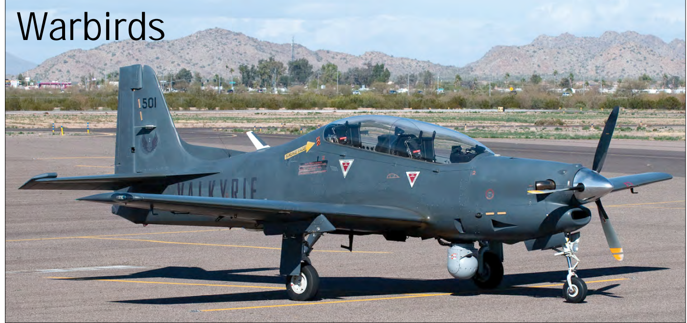
This is probably not the "classic" warbird you would expect, but interesting by all means: Valkyrie Aero owns and operates a large fleet of former French EMB 312F and Shorts built 312S aircraft specifically converted for training and support of JTAC's and the contract close air support mission (CCAS). Their Tucanos all utilize the L3 Wescam MX-15DiA designator which allows for the identification, ranging, auto tracking, illumination and guidance of precision munition. Originally built for the French Air Force and flown as 312-UT, this Embraer became N501VK. (Casa Grande (AZ), 21 January 2019)