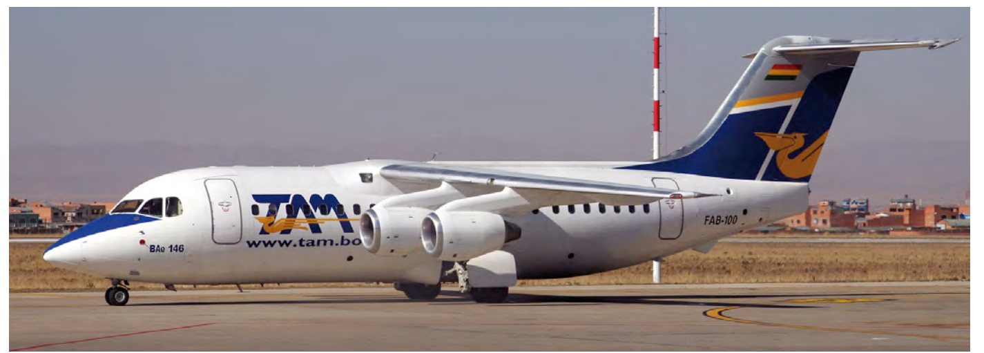
FAB kept a flying service, Transporte Aéreo Militar (TAM). The aircraft with a TAM-prefix are not included, but quite a few got FAB-serials. TAM had ceased operations July 2018 and a restart in 2019 fell through as well. (BAe146 FAB-100, La Paz, 25 September 2009)