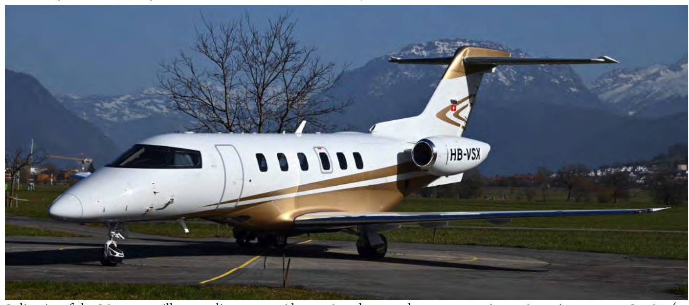
Deliveries of the PC-24 are still proceeding at a rapid pace. Seen here on the compass swing at Stans is msn 217 HB-VSX. (25 February 2021, Stephan Widmer)