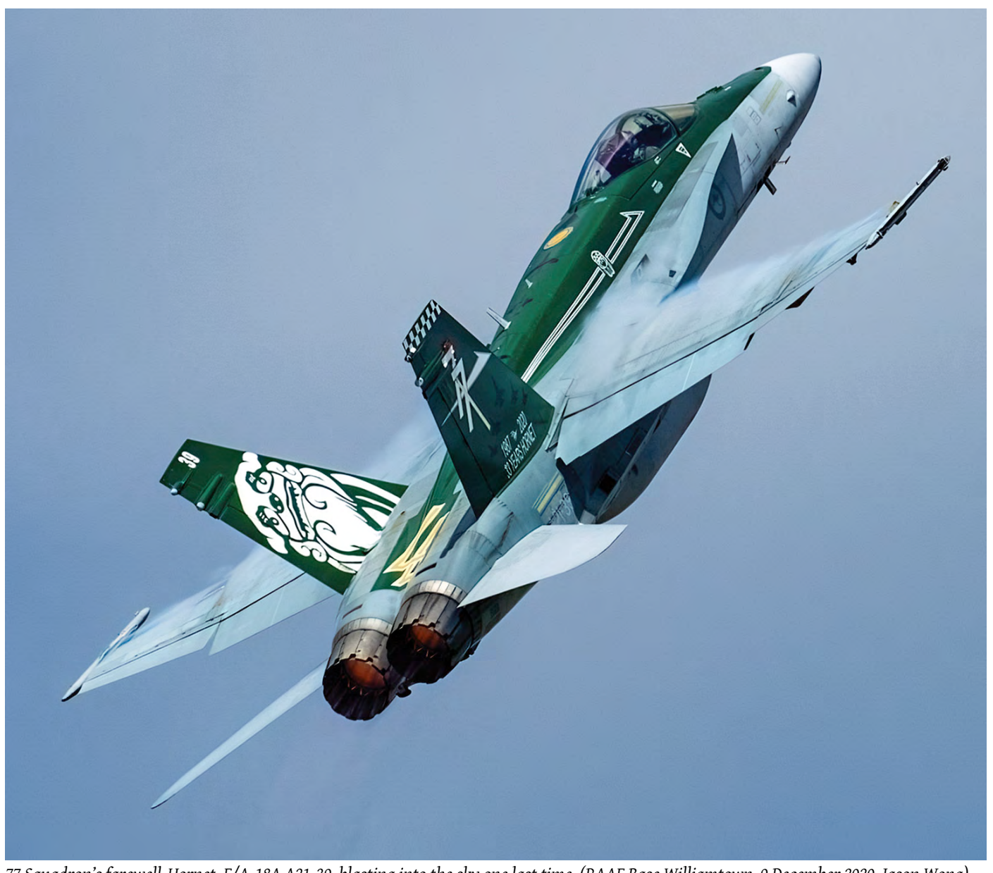
77 Squadron's farewell-Hornet, F/A-18A A21-39, blasting into the sky one last time. (RAAF Base Williamtown, 9 December 2020, Jason Wong)

the museum's elevated platform and around the end of its threshold to bid farewell to such a classic jet. A simple flying display was on the schedule, but with a bit of weather in the way, the flying commenced later than planned. Nonetheless, as planned, eight Hornets took off and formed up as an eightship to do one last display over Newcastle and the Hunter region. The formation made multiple passes over the base as a whole, and then split into two four-ship teams. The typical four-ship display flew a few passes as well before the base went silent. For the final pass, the squadron really brought the noise, four pairs flew at 100ft and 500 knots, screaming straight over the crowd making the base 'thunder down under'.