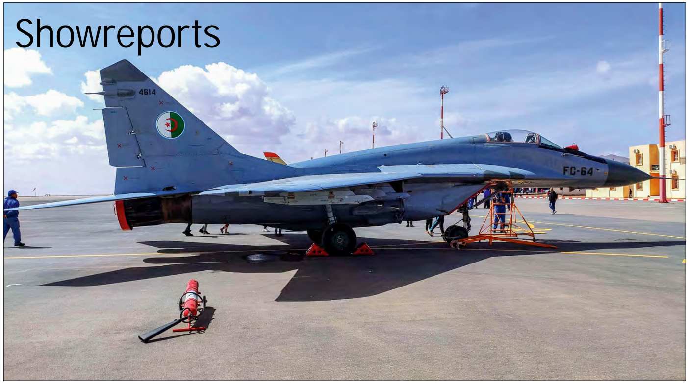
The small Portes Ouvertes at Mecheria provided an opportunity to photograph some airplanes we do not see too often. MiG-29 FC-64 belongs to the 3ème Escadre de Défense Aérienne. (Mecheria, 5 March 2021, Fulcrum/Forcesdz)