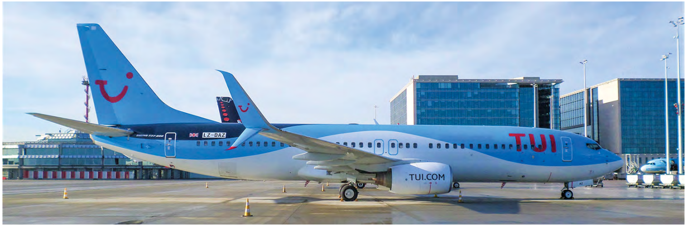
Delivered to Thomson Airways/TUI Airways in March 2009, as G-FDZR, this Boeing 737 was ferried to Brussels for end-of-lease main-tenance, on 10 January 2021. The aircraft was reregistered to LZ-DAZ for DAE Capital and subsequently ferried to Ostrava on 4 February.