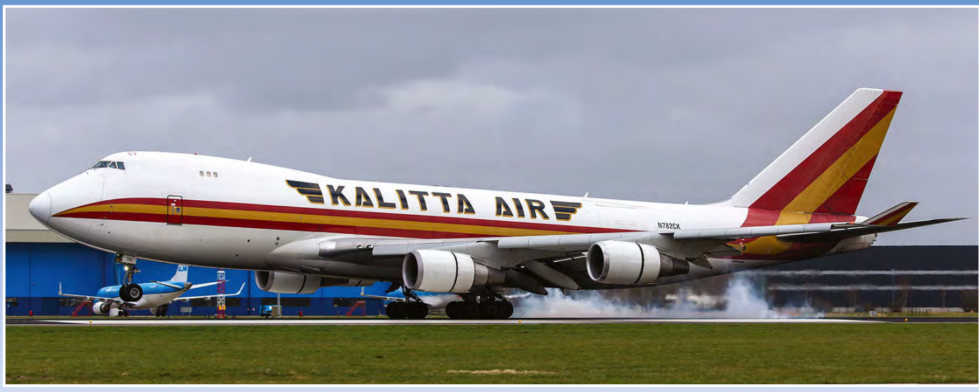
Kalitta Air Boeing 747-400ERF N782CK is the last Boeing 747-400 built. It was built in 2009 for LoadAir Cargo of Kuwait, but that company already went out of business before it started operations. So, after two years of storage at Marana (AZ) it was picked up by Kalitta Air in 2011. (Amsterdam-Schiphol, 21 March 2021,)