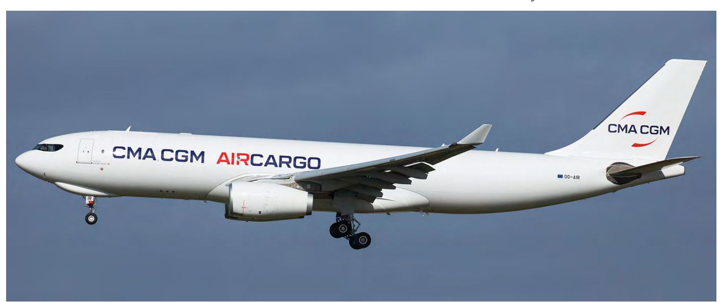
In Scramble 502 (page 52) we showed a picture of one of the four A330-200F aircraft that will be flying for the French logistic company CMA – CGM Air Cargo, being operated by Air Belgium. In that picture the aircraft was still painted in a basic Qatar Airways colour scheme. In this picture we show the result of the paintjob which took place at Dublin. The second A330-200F of CMA-CGM Air Cargo is seen here landing at Brussels, arriving from Dublin in the new colours. Unfortunately the colour scheme of the new French-Belgian cooperation is not very colourful, as the aircraft is all white and only wears CMA-CGM titles and logos. The cockpit however shows the Zorro-mask, which is a small resemblance to the A340s in Air Belgium's fleet. (11 March 2021, Jochem Jottier)

<u>Air Canada</u> has decided to alter its Capacity Purchase Agreements for regional aircraft and will consolidate all of these aircraft with <u>Jazz Airways</u>. As a result, <u>Sky Regional Airlines</u>, which operates 25 ERJ175s for <u>Air Canada Express</u>, will have ceased all operations at the end of March and its fleet transferred to Jazz Airways. Sky Regional Airlines was founded in 2011 and launched operations on 1 May 2011 using a fleet of DHC-8-400s. In 2013 the ERJ175 was introduced. The airline