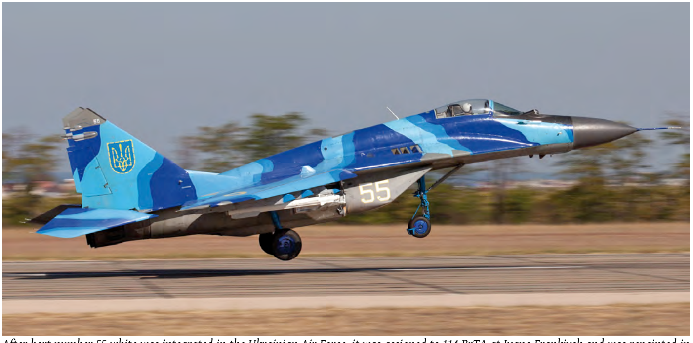
After bort number 55 white was integrated in the Ukrainian Air Force, it was assigned to 114 BrTA at Ivano Frankivsk and was repainted in this three tone blue camouflage pattern around June 2011. Bort number 55 white was last noted operational in March 2014. (Marco Dijkshoorn)

<u>... MiG-29 2960731244 29dec90 ? 114 VAP Ivano-Frankivs'k</u> Assigned to 114 VAP Ivano-Frankivs'k as; no reports.