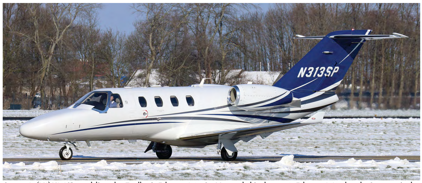
Cessna 525 (M2) N313SP was delivered to Tradlux in February 2017. Cor Mout took this photo on 10 February 2021 when the Cessna arrived at Rotterdam - The Hague from Reims. It is destined to become 9H-KOM for K.O.M. Activity.