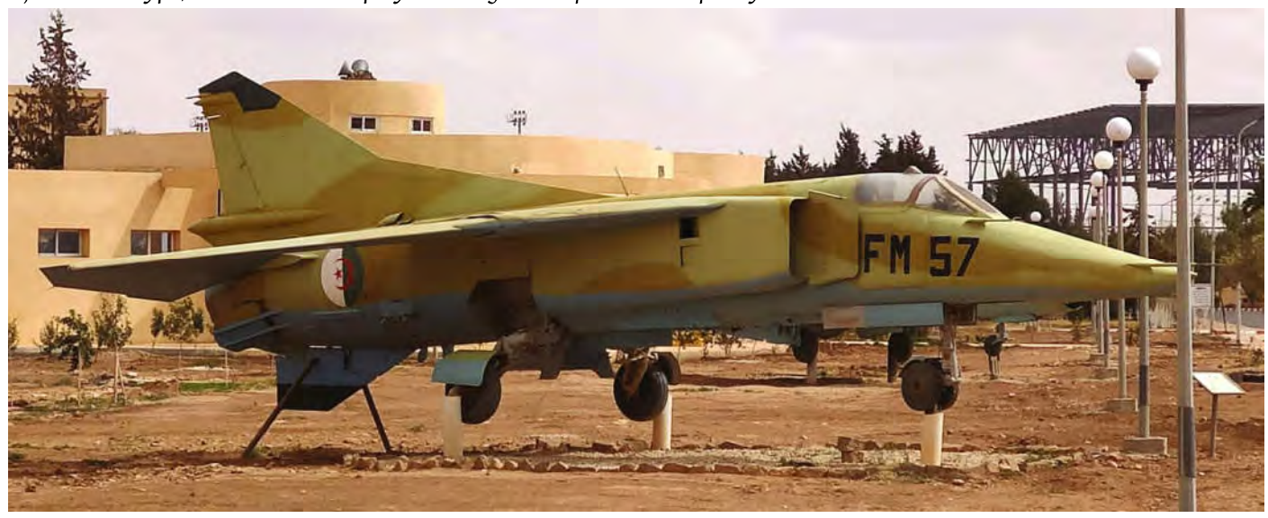
On display behind the base's main gate since 2019 is MiG-23BN FM-57. Other jets on struts there include MiG-21 FD-49.