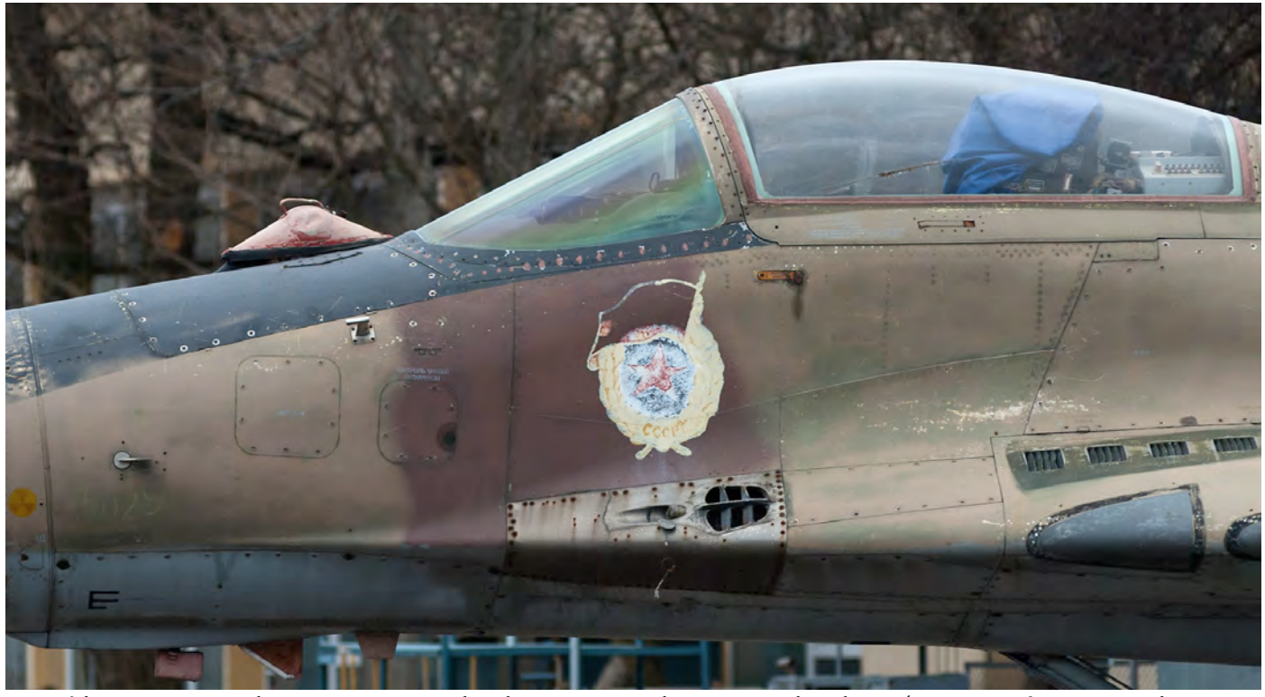
Most of the MiG-29s assigned to 642 VAP Voznesens'k and 161 VAP Limans'ke were painted in a brown/green camouflage pattern. The majority of these aircraft spent a considerable time stored at DPOAZ Odessa. (Patrick Roegies)