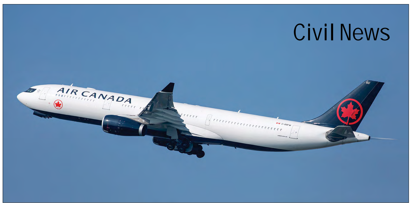
In 2019, Air Canada purchased four second-hand Airbus A330-300Es. All four of these planes were acquired from TAP Air Portugal, which actually acquired these planes from Singapore Airlines in 2017. However, TAP Air Portugal took delivery of a whole bunch of brand-new Airbus A330-900 aircraft in 2019 and 2020, so they no longer needed these ex SIA A330s and therefore sold the aircraft to Air Canada, before they entered TAPs fleet. So, these aircraft were never part of TAP and were never registered in Portugal. One of these four is C-GOFW, which was delivered to Air Canada on 20 February 2021. (Amsterdam-Schiphol, 24 March 2021, Walter Heukensfeld)