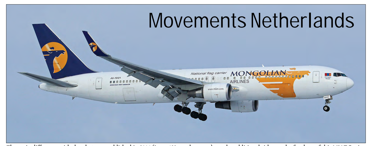
The main difference with the photo we published in 2014 (issue 423, on the cover) are the additional titles on the fuselage of this MIAT Boeing 767. JU-1021 visited Amsterdam for the first time on the day this photo was taken. (Amsterdam - Schiphol, 10 February 2021)