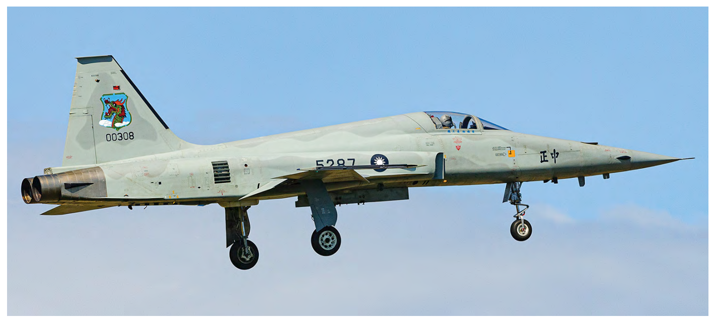
22 March 2021 was a sad day for the Republic of China Air Force, as it lost two F-5II Tigers, after they collided with each other and crashed in the sea off the coast of Pingtung County, 37.5 miles southeast of Taitung/Jhihhang Airport, where the 7th Flight Training Wing is based. Sadly one pilot did not survive, while the other was found and unconscious. Erik Sleutelberg saw Tiger 5287/00308 at Taitung on 25 November 2009.

collided in mid-air and crashed in the sea off the coast of Pingtung County, 37.5 miles southeast of Taitung/Jhihhang Airport, where the 7th Flight Training Wing is based. They were part of a four-ship that took off from at 14:30 hours