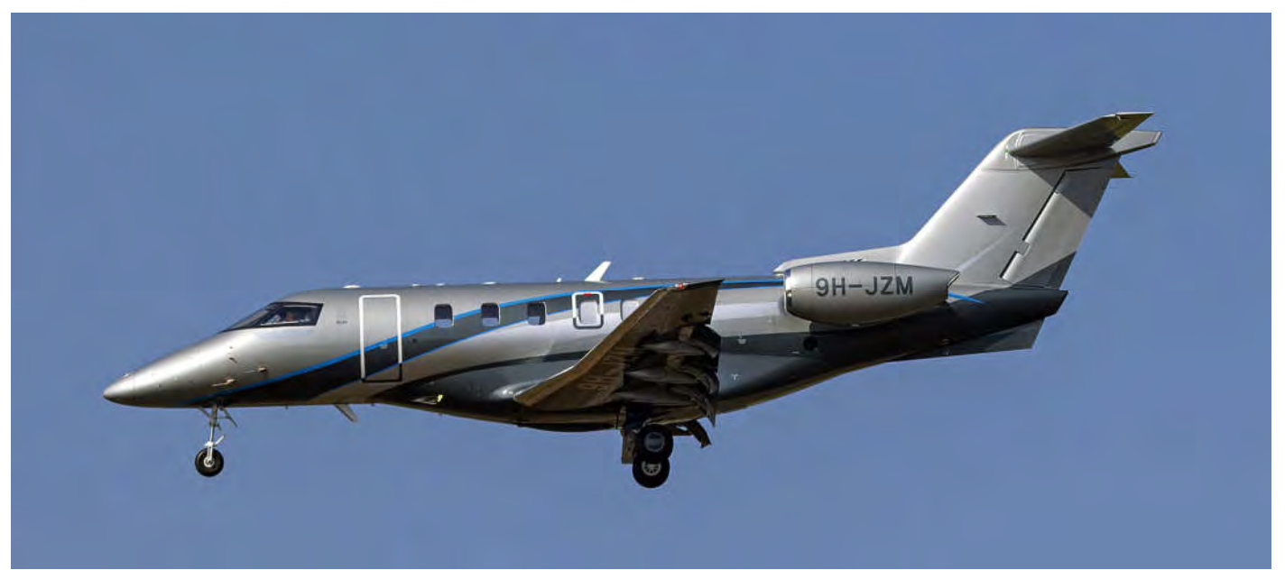
PC-24 9H-JZM was delivered in April 2020 and is currently operated by Albinati Aviation. (Zürich, 2 March 2021,)