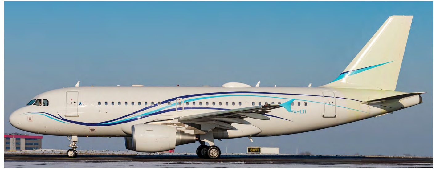
Global Jet Luxembourg became the operator of this Airbus A319 corporate jet in March 2020. LX-LIZ was transferred to Liza Transport International in November 2020 as P4-LTI. The company is based in Burkina Faso and headquartered at Ouagadougou.