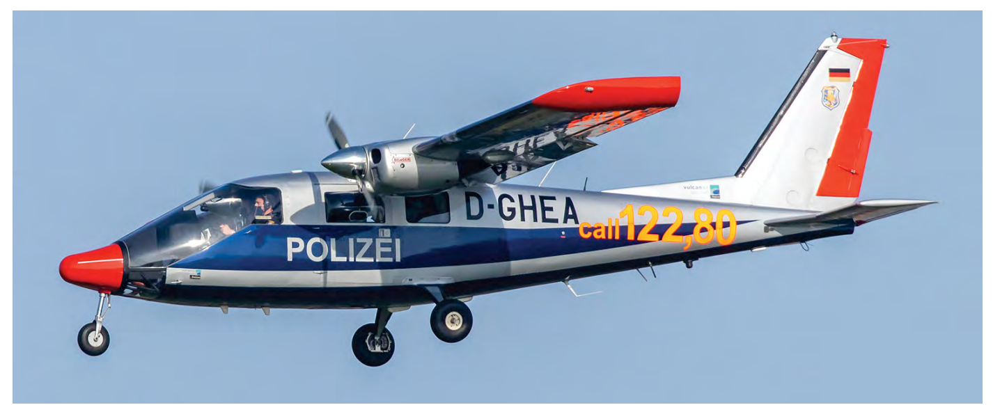
The Hessen police squadron took delivery of its fixed-wing VulcanAir P68 Observer 2 reconnaissance aircraft in March 2012. Maarten Visser Sr was able to capture D-GHEA when it made a visit to Rotterdam - The Hague on 19 February 2021.

easyJet continued to occupy the local paint shop this month. The Skyline Albatros on the 4th operated several flights from Maastricht till the 11th. Two Amsterdam diversions on the 7th. The Dash 8 on the 9th arrived in basic HM Airways colours. Former EI-RDJ was noted in basic Alitalia colours with registration G-CLVH applied on the 10th. CityJet changed aircraft at SAMCO on the 12th. On that same day a former FlyBe Dash-8 arrived. Former EI-RDK was noted in basic Alitalia colours with registration G-CLVK applied on the 18th. On the 19th another CityJet Canadairjet arrived but this time in full Scandinavian colours. The Dash-8 on the 20th departed in full (new) FlyBe colours on delivery to Conair. The Longtail Aviation Boeing 747 on that same day diverted to Liège after take-off due to an engine failure. The month ended with some more Amsterdam diversions.