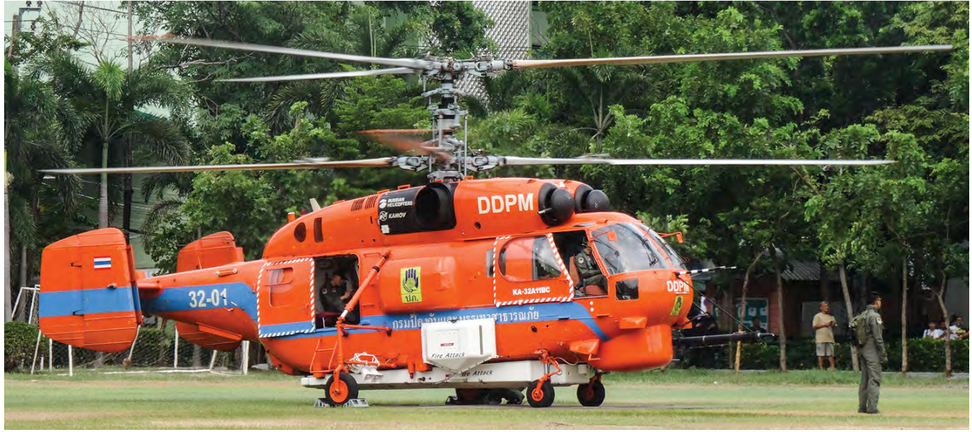
On 27 June 2019 two Kamov Ka-32A11BC's, with serials 32-01 and 32-02, were delivered to the DDPM, the Thai Department of Disaster Prevention & Mitigation using Il-76 RA-78765 to U-Tapao. They are currently flown by the Army on behalf of the DDPM and their main base is Lop Buri-Sa Pran Nak, although they have been operating nationwide over the last year or so. They were both seen and photographed on an exercise at the Islamic College of Thailand in Bangkok on 30 August 2020. Although their c/n's are still unknown, the production details known to us show a gap for line numbers 100-19 and 100-20, so it is possible these two line numbers went to Thailand. (Tom Milliken)