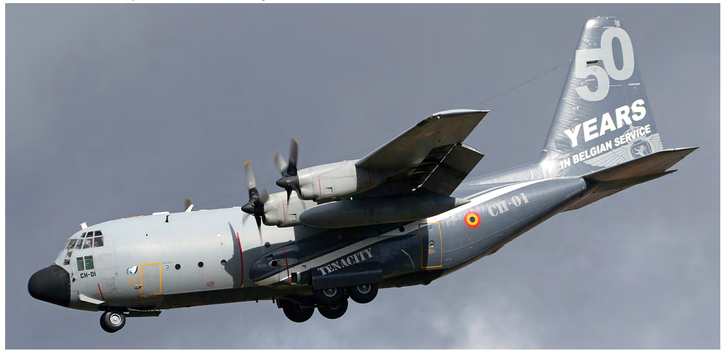
The Belgian Air Force celebrates 50 years of Hercules operations C-130H CH01 in these special markings, before it will be taken out of service later this year. (Melsbroek, 15 March 2021,)

The contract also contained an option for two more Bell 505s