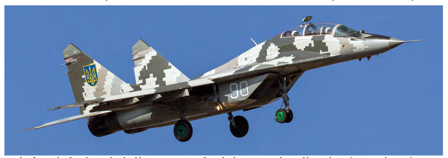
Another fine study of 90 white outlined in blue, a 40 BrTA aircraft resplendent in its grey bits and bites scheme.