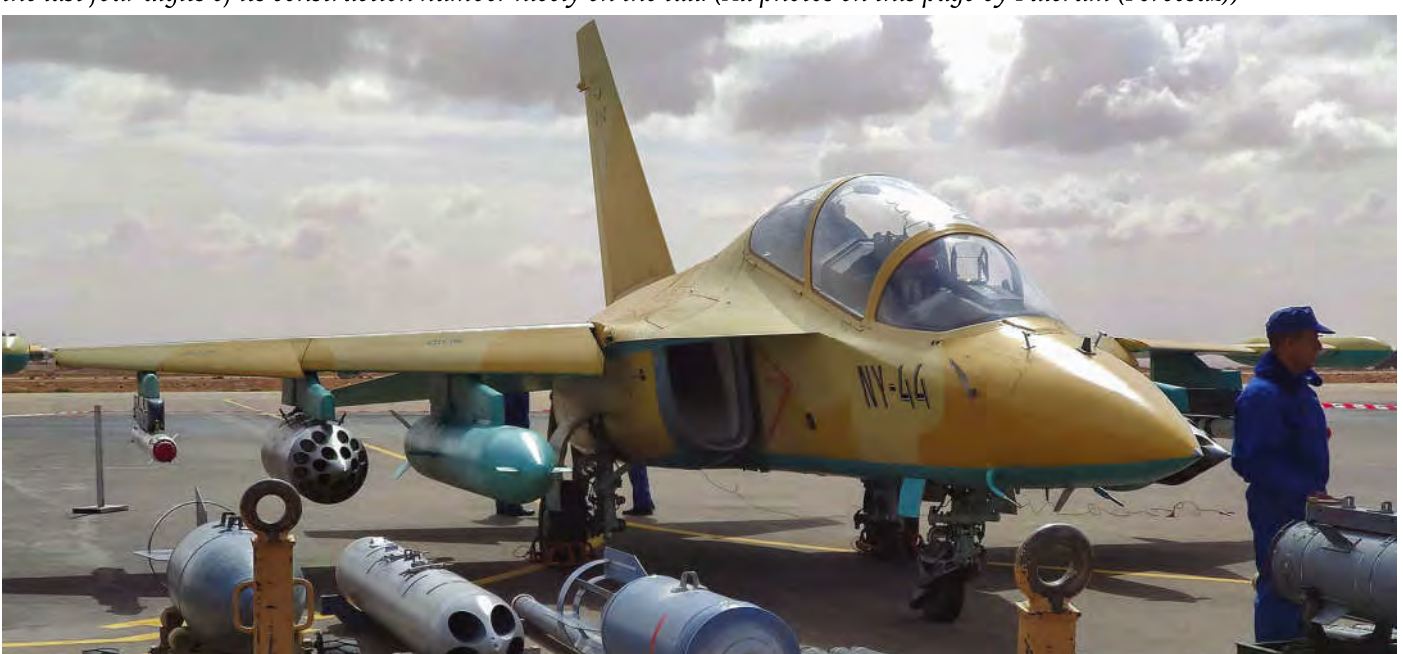
Resident 620ème Escadron d'entrainement Avancée (620th Advanced Training Squadron) is equipped with L-39s and Yak-130s. Of the latter type, NY-44 was on display boasting its weapons load capacity.