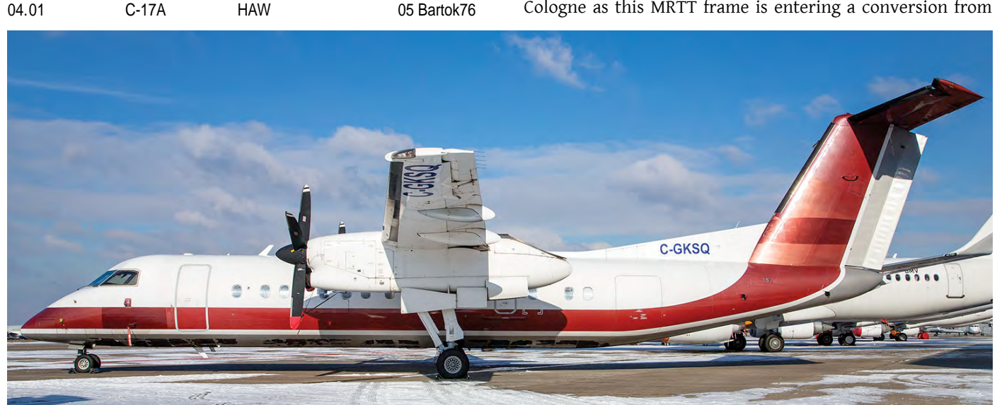
Initially delivered to Heli Malongo in September 2005 as D2-EYM, this Dash 8 was added to the fleet of TopBrass Aviation as 5N-TBC in December 2011 while leased from a company called Seagold Investment. The Dash-8 was photographed in basic HM Airways colours, registered as C-GKSQ, while on its way back to Canada. (Maastricht - Aachen, 10 February 2021, Björn van der Velpen)