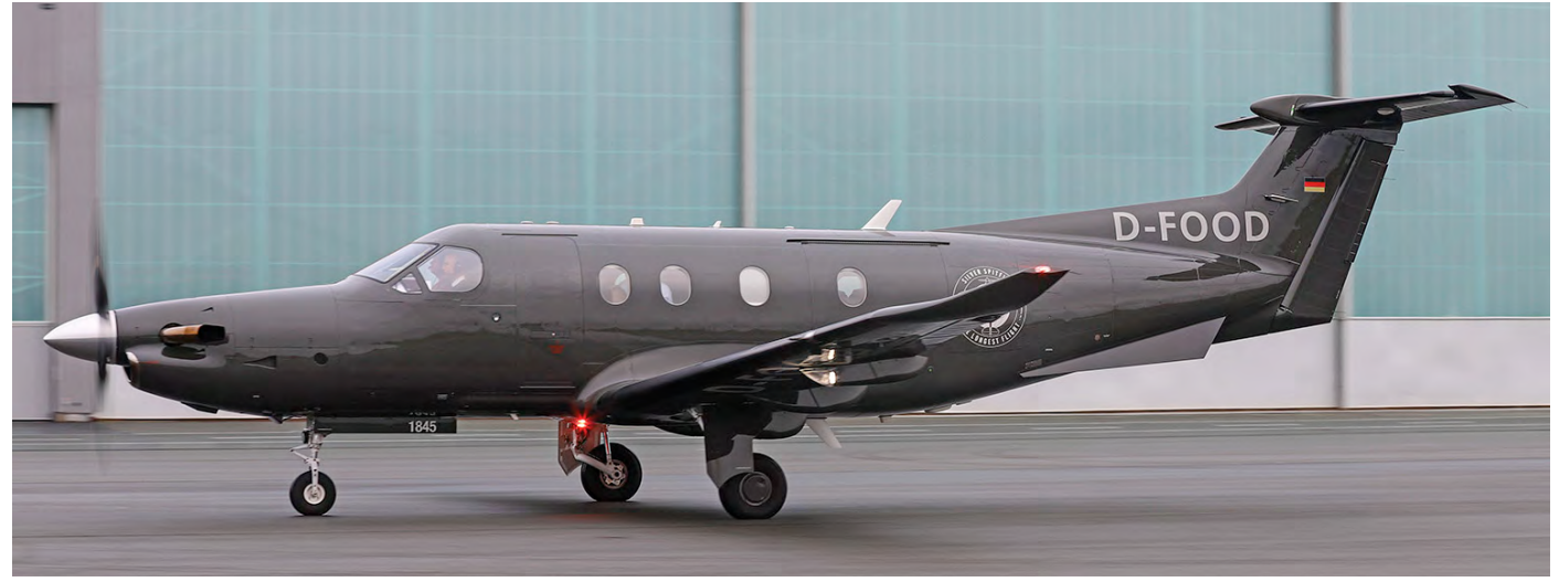
This Pilatus was delivered to Blackbird Air Charter in January 2019 registered as OY-THP. The PC-12/47E changed its registration in August 2020 to D-FOOD but its operator remained the same. (Ostend, 5 February 2021, Nik Deblauwe)

Credits: Replo.be, Nik Deblauwe, Andre Deblauwe.