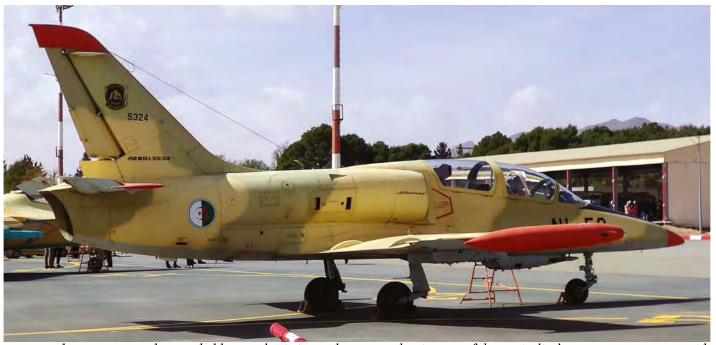
On 5 March 2021, an open day was held at Mecheria in northwestern Algeria. Part of the static display was L-39ZA NL-59, with the last four digits of its construction number nicely on the tail.