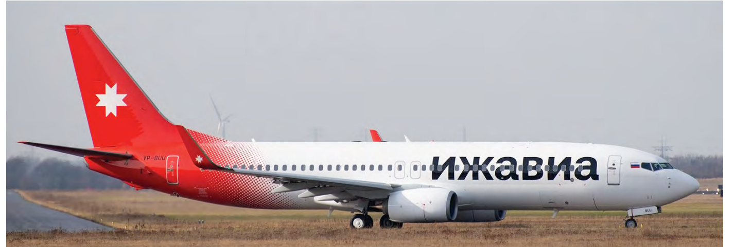
Initially delivered to Jet Airways as VT-JFZ in October 2014, this Boeing was added to the Vistara fleet, as VT-TGC, in June 2019. This lease already ended in January 2020 and the Boeing 737 was ferried to Woensdrecht, registered as 2-BTTA, destined for El Al as 4X-EKN. Unfortunately that lease was not taken up. As VP-BUU the aircraft has been leased to Izhavia, the national airline of the Udmurt Republic of Russia. (Woensdrecht, 19 February 2021,)