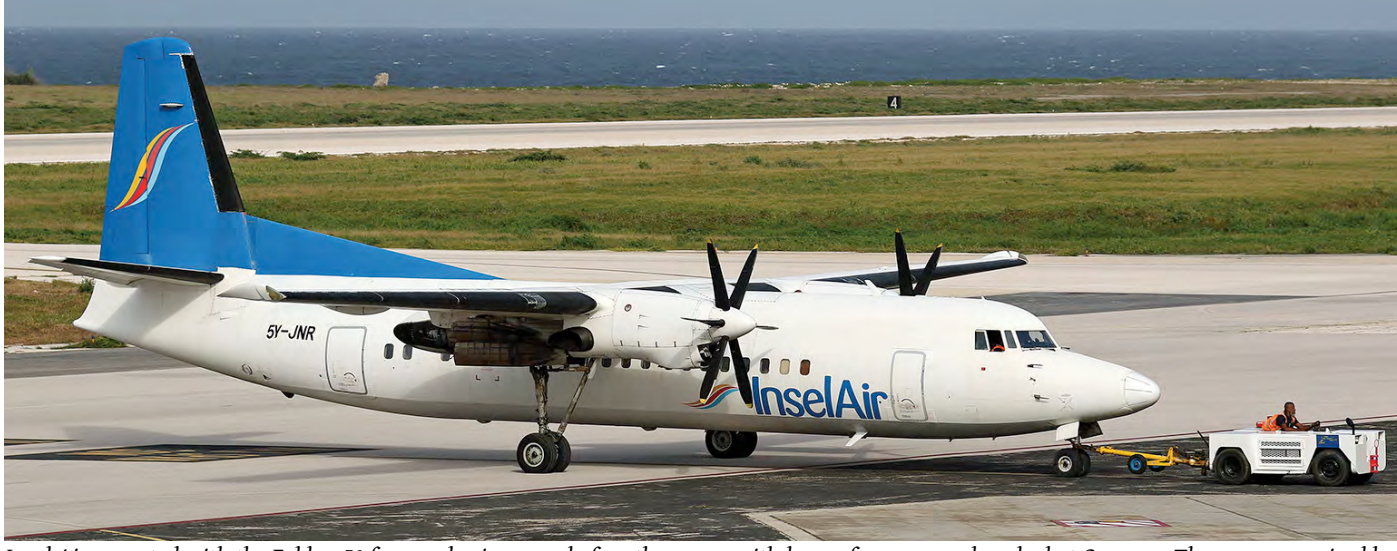
Insel Air operated with the Fokker 50 for nearly six years, before they were withdrawn from use and parked at Curaçao. They were aqcuired by VGAS Aircraft Procurement and received a paper 2- registration, but that was never applied. Former Fokker 50 PJ-KVM (msn 20288) got picked up by African operator Silverstone Air Services, which gave it the registration 5Y-JNR. It is seen here leaving Curaçao-Hato (still in full Insel Air colours) on 1 February 2021, by Larry Every, for the long journey to another tropical climate.