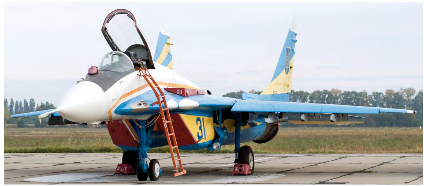
The Ukrainian Falcons used two-digit bort codes in last instance. This 31 blue became bort 31 white in a digital colour scheme. (Patrick Roegies)