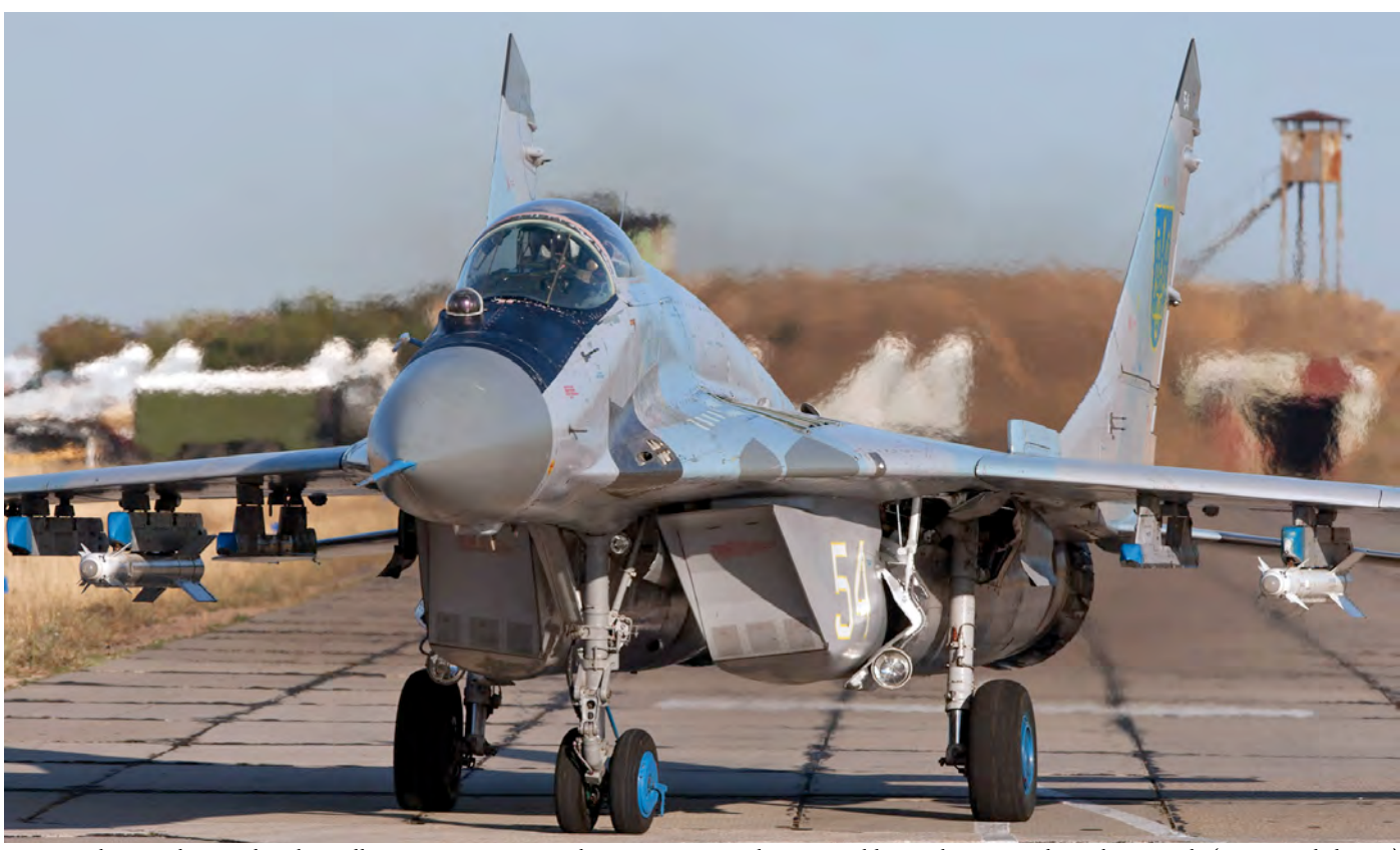
Bort number 54 white outlined in yellow, so a 114 BrTA machine, taxies out. It became 54 blue and is currently under rework. (Marco Dijkshoorn)