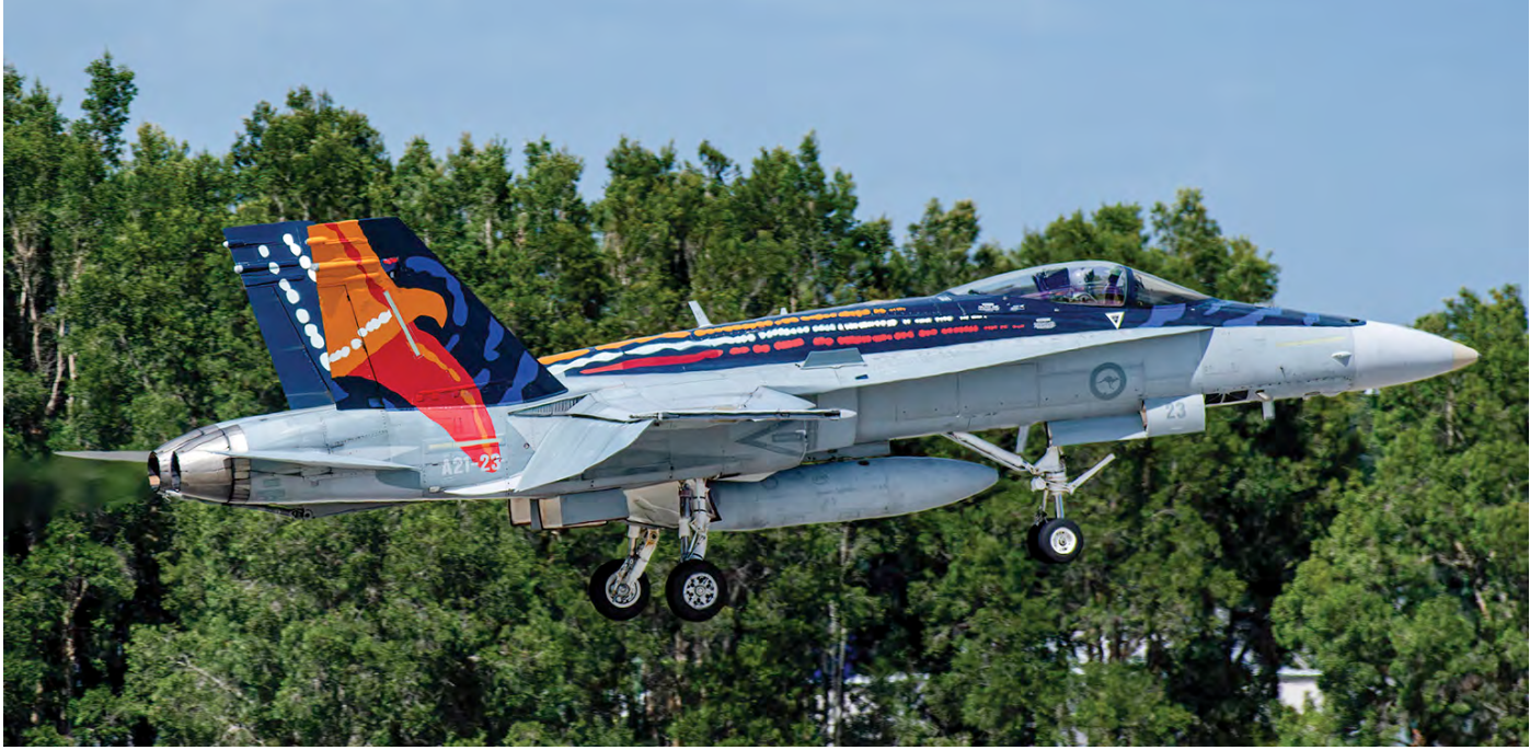
F/A-18A A21-23, nicknamed the Worimi Hornet, also took part in the celebrations. The paintscheme is a tribute to the indigenous population of Australia, the Aboriginal people. (RAAF Base Williamtown, 9 December 2020,)

The last day of operations was as gloomy as the mood that surrounded the base. Hundreds of spectators gathered at