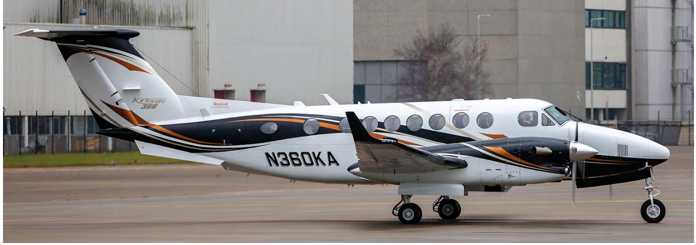
Textron only introduced the King Air 360 in August 2020, but in March 2021 prototype N360KA has been performing demonstration flights across Europe. (Amsterdam Schiphol, 25 March 2021)

Registered to Pilatus Flugzeugwerke in January, later sold to: