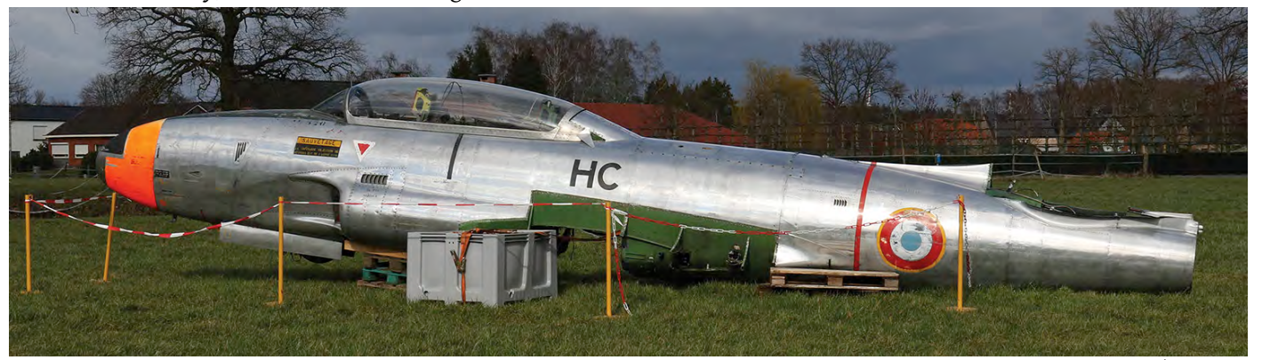
Former Baarlo T-33A 16520 is a recent addition to the aircraft collection owner of the Foets company at Tessenderlo and Schoots. (17 March 2021,)

7 Yak-17UTI preserved aug20 After restoration the all blue Yak was unveiled on Decem-