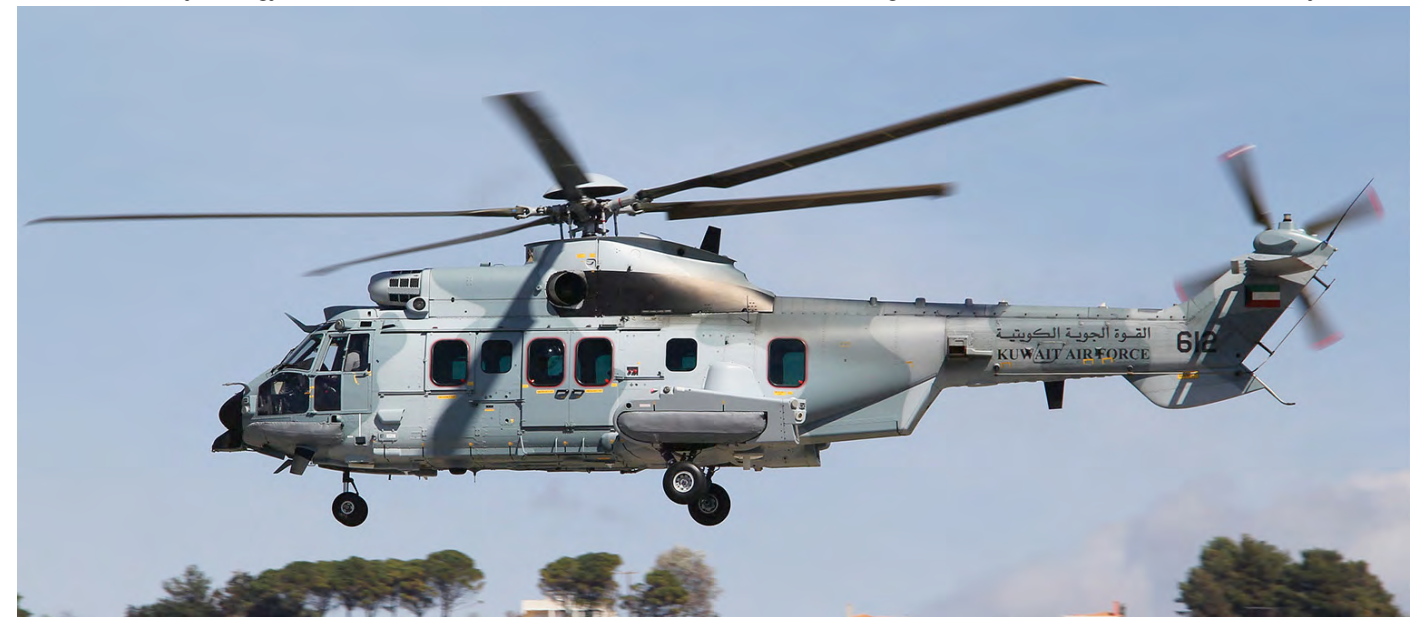
Apart from Marseille, Kefalonia is the place to be to see Kuwaiti H225Ms. Illustrated is 612, together with 611 this was delivery number six and seven through the Greek island Kos. Others were 602/603 on 13 December and 608/609/610 on 27 January. After this scheduled night stop, the next port of call is usually Paphos and then on to Egypt an Kuwait. (12 March 2021, Philipp Vallianos)

Of note, the 309th already has seventeen B-1Bs in storage, so later this year 31 Lancers can be found at the Boneyard. The following seventeen were confirmed in January 2021 as