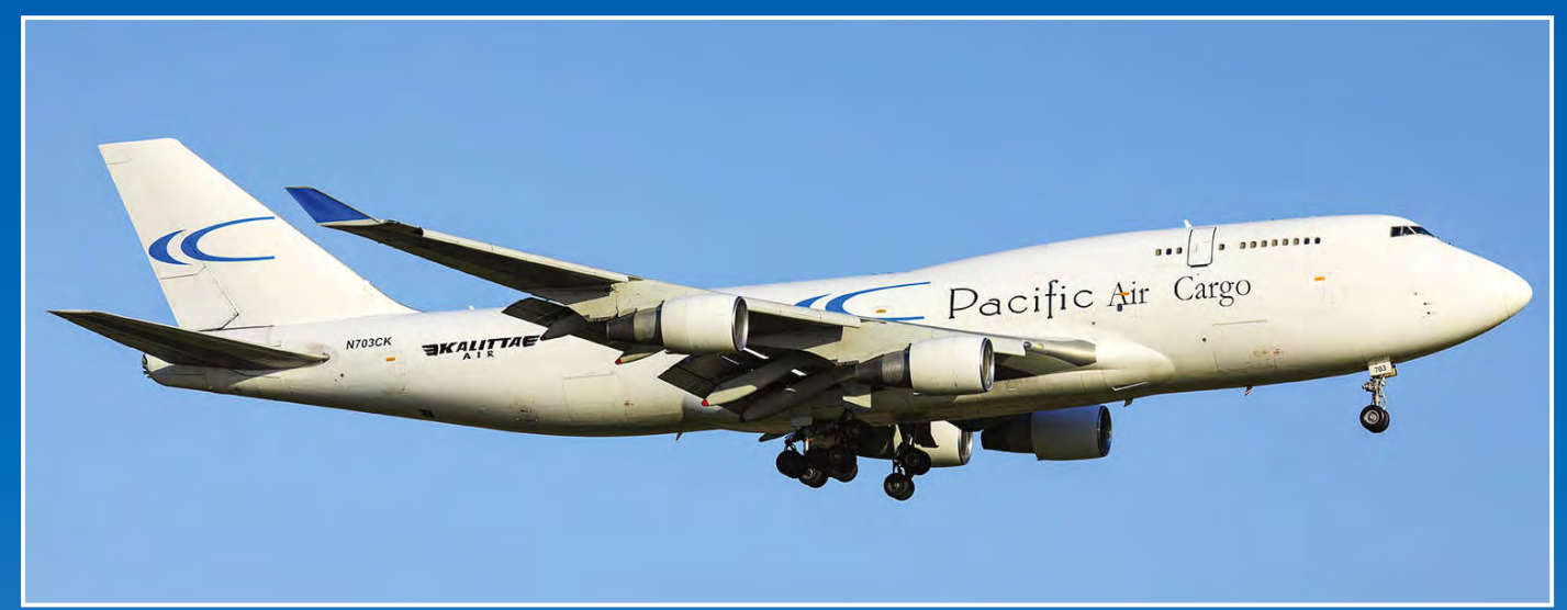
Pacific Air Cargo is a company specialised in air freight between mainland USA and Hawaii. For these flights it leases this Kalitta Air 747-400BCF N703CK. It did a New York-JFK (NY) – Amsterdam-Schiphol return trip on 21 February.