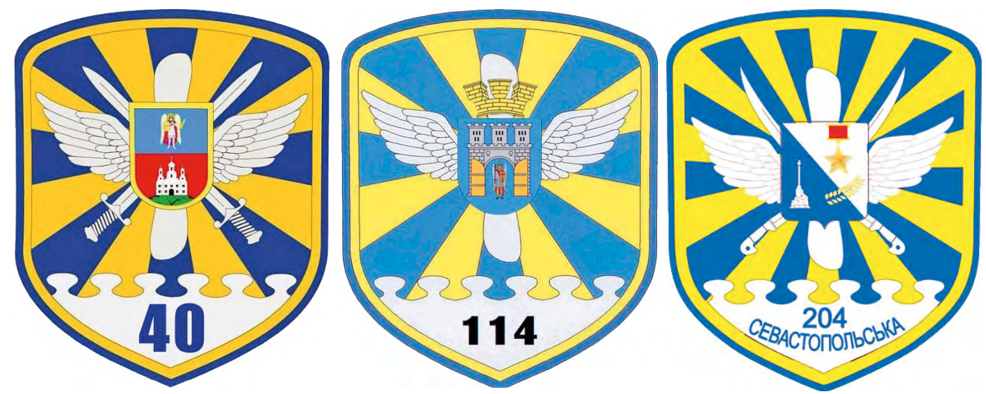
The badges of the three current units, from left to right, 40th Tactical Aviation Brigade (40-ва Бригада Тактичної Авіації - 40 BrTA), 114th Tactical Aviation Brigade (114-та Бригада Тактичної Авіації - 114 BrTA) and, the 204th Tactical Aviation Brigade (204-та бригада тактичної авіації - 204 BrTA.) Meanwhile, the 40th and 204th have an alternative badge too, but we do not know if those are official.