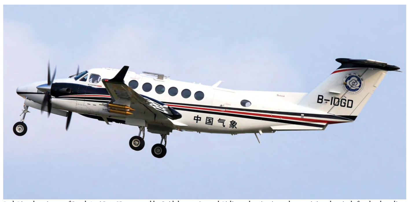
Jack Li took a picture of Beech 350i B-10GD, operated by Beidahuang General Airlines, showing its pods containing chemicals for cloud seeding. It crashed on 1 March 2021, in the region of Ji'an, China.

11mar21 XA-UVQ EC145 9497 dam Returning from an offshore oil and gas installation (located in the Gulf of Mexico), the Transportes Aéreos Pegaso EC145 (commercial name for the BK117C-2) suddenly descended from a height of ten metres, in the port of Dos Bocas, resulting in the skid gear breaking. Two of the six crew members to be transferred to the Pemex Hospital in the Municipality of Paraíso.