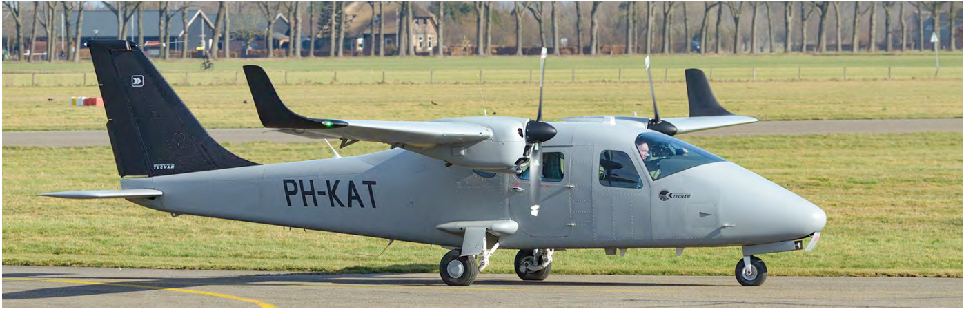
PH-KAT is the second Tecnam P2006T that is being operated by surveying company Kavel 10. It was delivered to its home base Eelde in October 2020.

regular MRTT to Medevac configuration and is destined to operate from this base here afterwards. The Belgian A400M visited for 2 touch and go's, the Danish C-130J-30 arrived from Aalborg and the Cougar formation was part of the 25 years Cougar jubilee. The German A400M arrived for EATC celebrations. TUI Belgium and Smartwings operated military charters on the 4th, 15th and 16th. TUI Belgium operated a charter to Athens for PSV on the 17th. The team returned from Athens on the 19th. On the 24th Aegean Airlines transported Olympiakos to Eindhoven.