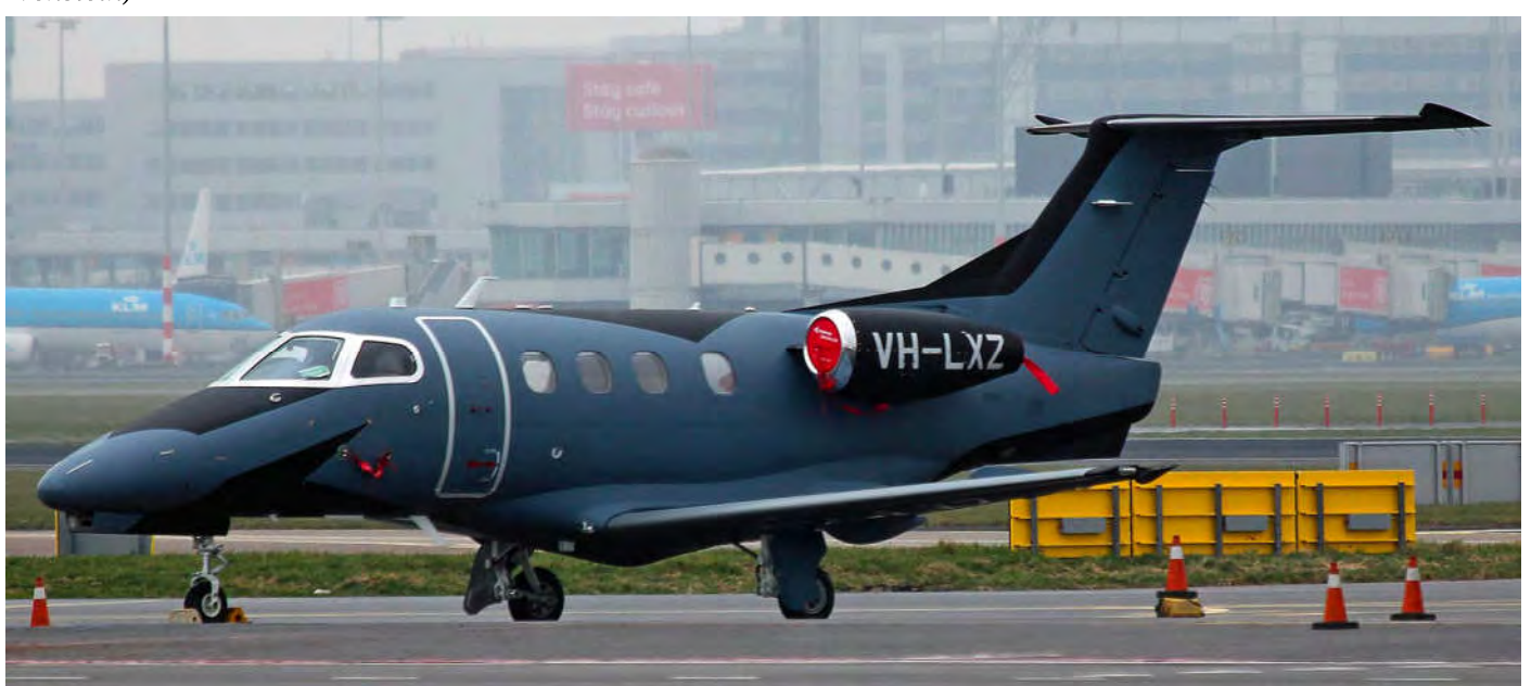
Small Australian bizjets are very rare in Europe, and therefore it was a unique sight to have EMB500 of Navair Flight Operations on delivery from the factory in Melbourne (FL). (Amsterdam-Schiphol, 10 March 2021, Pino Tome)