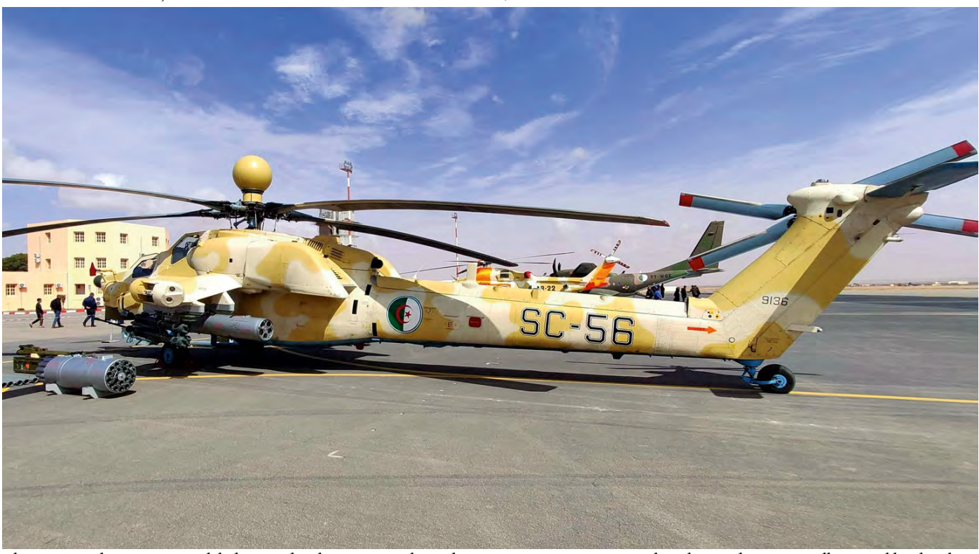
The Mi-28 Night Hunter attack helicopter has been exported to only two countries. One is Iraq, the other is Algeria, as is illustrated by the photo above. Mi-28NE SC-56 belongs to the 14ème Régiment d'Hélicoptères de Combat. (Mecheria, 5 March 2021, Fulcrum/Forcesdz)