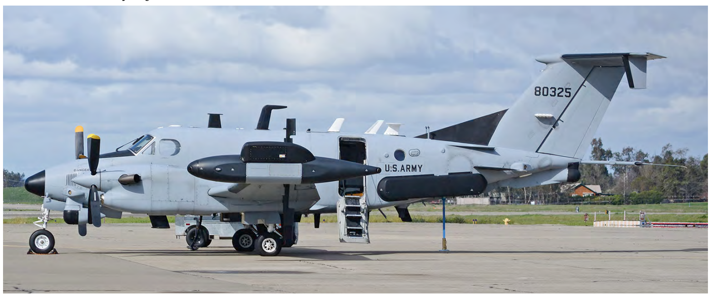
Assigned to the 204th MI Bn at Fort Bliss, Texas, US Army Beechcraft RC-12X 88-00325 Guardrail is seen on March 15, 2021 undergoing maintenance at McClellan Field in Sacramento, California. McClellan is the location of the former Northrop Grumman facility that conducted modification work on Guardrails until the completion of the final aircraft in November 2019.

So far, 68 TH-73As of the contract of 130 are actually purchased (January 2020, 32 helicopters in the initial contract (USD 176,5 million) and 12 November 2020 36 helicopters, USD 171 million). The TH-73A will rapidly replace the ageing TH-57B/C Sea Rangers of the training wing in a USD 648,1 million contract. Within four years, all Sea Rangers are expected to be replaced. The US Navy plans to sundown the TH-57B/C fleet in Fiscal Years 2022 through 2024 (so by September 2024 latest). The TH-73As are expected to operate within TAW-5 for some thirty years. The first instructor pilot training began in June 2020, Initial Operating Capability (IOC), when