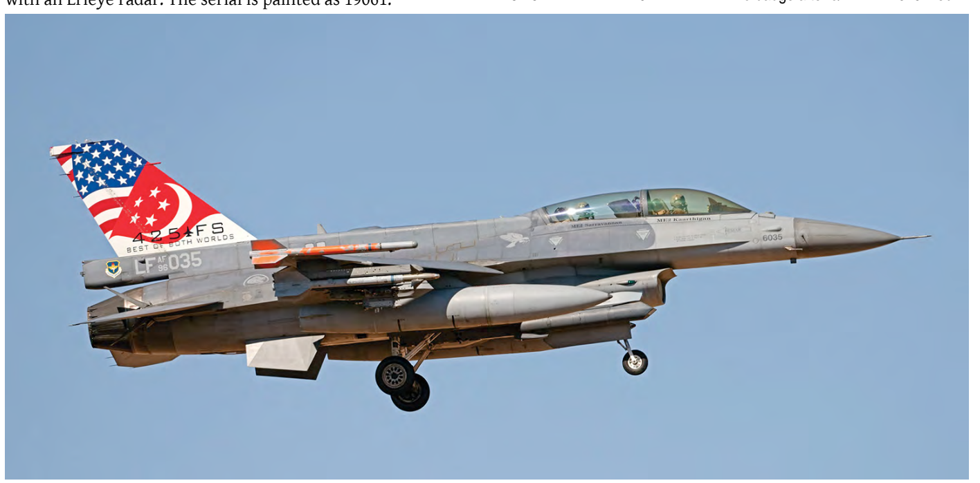
F-16D "Humpback", 96-5035 comes in to land. It has the United States and Singapore Flags, and also markings for 425 FS and 'The best of both worlds' marked strikingly on the tail. (Luke AFB, 17 March 2021)