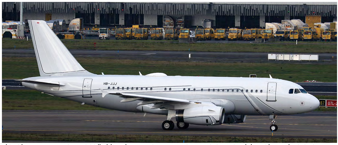
This Airbus A319 corporate jet was initially delivered to Aravco in May 2005. Via TAG Aviation UK it ended up with Nomad Aviation in November 2018 registered as HB-JJJ. (Brussels, 5 February 2021,)