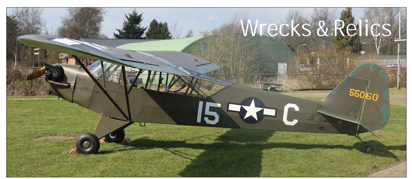
One of the two recently arrived L-4Js at Hoogeveen is 45-5060/N1227N. (26 March 2021,)