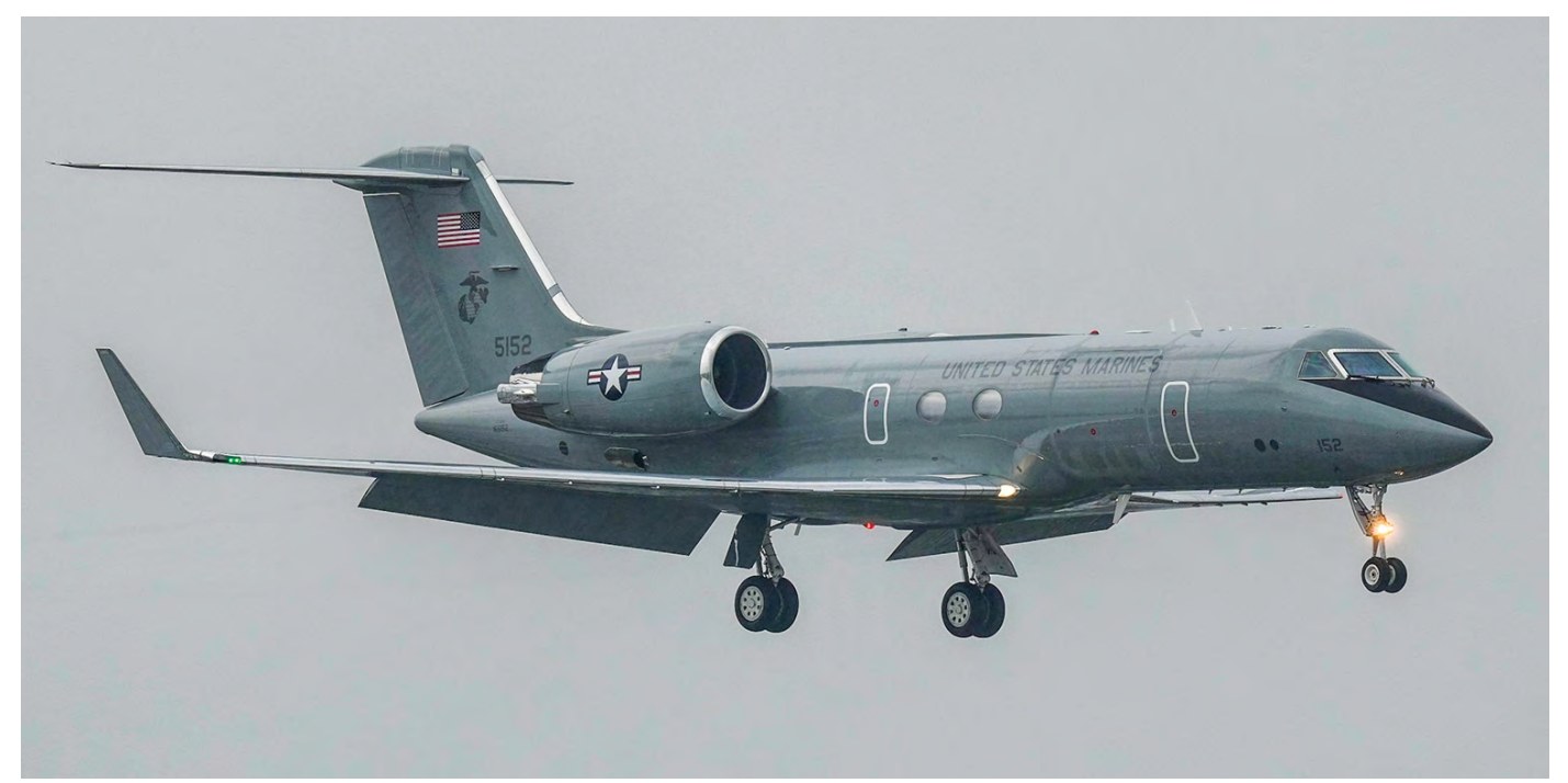
The Fleet Logistics Support Wing of the US Marines operates this C-20G from a detachment at Kanehoe Bay, Hawaii. (165152, Paya Lebar, 7 March 2021,)