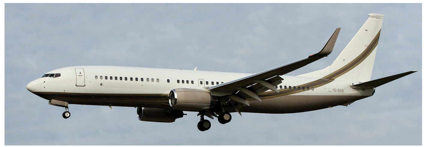
VQ-BOS is a B737-800 that had arrived from the Seychelles on 5 February 2021. The departure of this BBJ2 hit a snag on the day this photo was taken but two hours later the Bayham Holdings bizjet eventually departed to Stansted. (Woensdrecht, 19 February 2021, Ralph Hamaker)

Two arrivals for AELS this month. On the 3rd a former Brussels Airlines Airbus arrived for disposal, followed by a British Airways minibus arriving on the 17th. The ADAC helicopter on the 25th stopped by for some fuel.