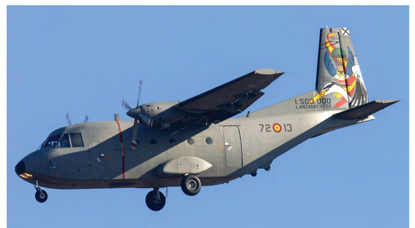
Spring is knocking on our door and special tail colours of this Aviocar T.12B-13/72-13 come out fine with the blue skies over Cuatro Vientos. The colours celebrate the milestone of no less than 1.5 million parachute jumps facilitated by Escuadrón 721 (10 March 2021, Paco Rivas).