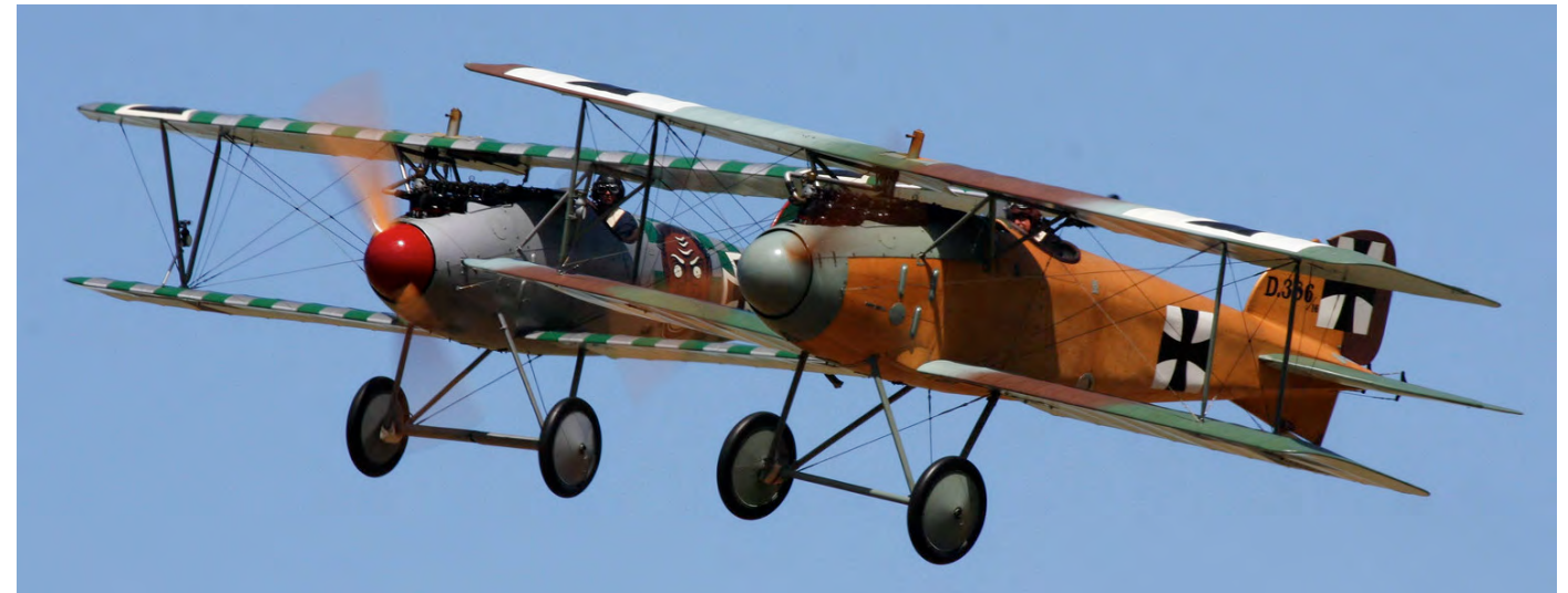
In the past twelve months New Zealand was hardly affected by COVID-19, so Wings over Wairarapa 2021 was one of the few airshows that was not cancelled in this period. Seeing two Albatross D.V fighters, replicas built by TVAL (The Vintage Aviator Limited) is a fascinating sight! (Masterton-Hood Aerodrome, 27 February 2021,)

After spending some 25 years in storage at High Wycombe (UK) Vickers Supermarine Spitfire Mk.XIVc RM694 (6S/432268) will finally get a restoration to airworthy condition. Although registration G-DBKL was already secured on 30 March 2009, it was not before early this year that the aircraft was transported to the Biggin Hill Heritage Hangar. The expertise of the local Spitfire Company (Biggin Hill) Ltd. is a guarantee for a quality restoration of this project. RM694 was built in the Chattis Hill shadow factory in Hampshire and rolled out on 22 October 1943. It was operated by No. 91 (Nigeria) Squadron from the Advanced Landing Ground (ALG) of Deanland in Sussex, flying over 30 V-1 interception missions in the summer of 1944. Passed on to No. 402 (Winnipeg Bear) Squadron of the Royal Canadian Air Force, RM694 was relocated to B.70/Deurne near Antwerp, Belgium on 30 September 1944. Soon the Spitfire was substantially damaged in a forced landing and sent to the UK for repair. After the war had ended, it became a ground instructional airframe at RAF Locking (maintenance number 6640M). It later served as a guardian at RAF Hornchurch from 1950 to 1963. It was then sold to a garage owner for display for only GBP 250! Since 1966 the project was sold to the USA twice, only to ultimately return to the UK for storage at High Wycombe in 1995.