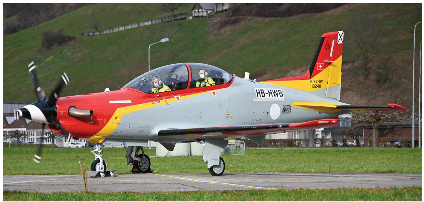
Not many Pilatus products leave for their new owners from Buochs without being caught on camera by Stephan Widmer. To proof this, PC-21 E.27-02/HB-HWB was photographed on 4 March 2021, way before its delivery to Spain.

handed over to the Indian Embassy in the US between June and September 2021.