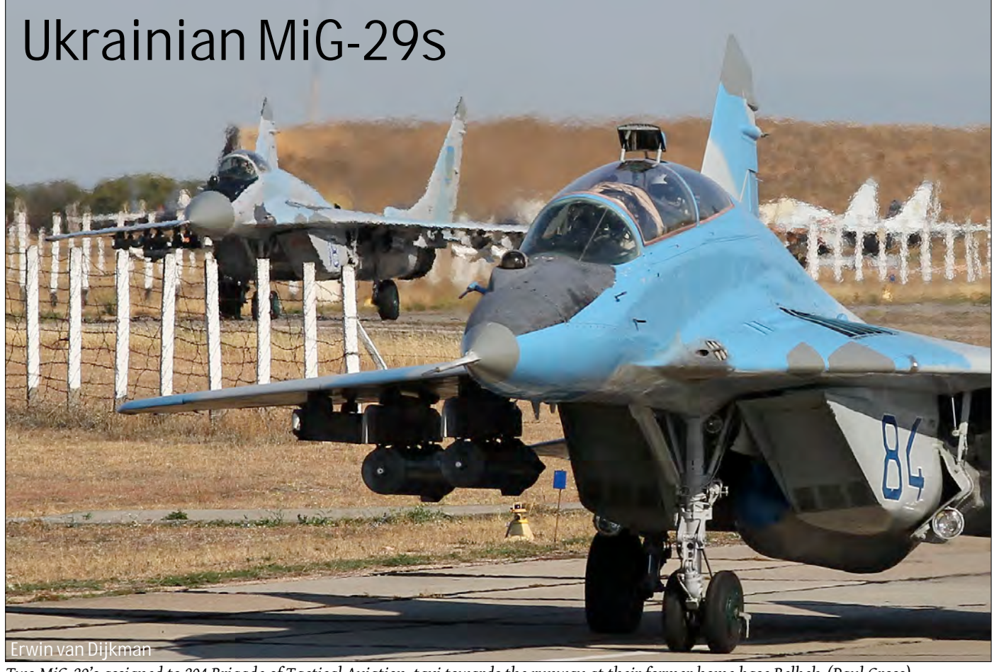
Two MiG-29's assigned to 204 Brigade of Tactical Aviation taxi towards the runway at their former home base Belbek.

Ukraine became an independent nation on 24 August 1991 and by the end of 1992 it is estimated the Ukraine Air Force had over 220 MiG-29 aircraft at its disposal. The Ukrainian government received a substantial number of ex-Soviet Air Force MiG-29s as a debt payment from the Russian government on 27 March 1992. All the aircraft in the inventory are Izdeliye 9.12 (MiG-29 Fulcrum A), Izdeliye 9.13 (MiG-29 Fulcrum C) and Izdeliye 9.51 (MiG-29UB Fulcrum B) aircraft. References to Ukrainian MiG-29S are wrong.