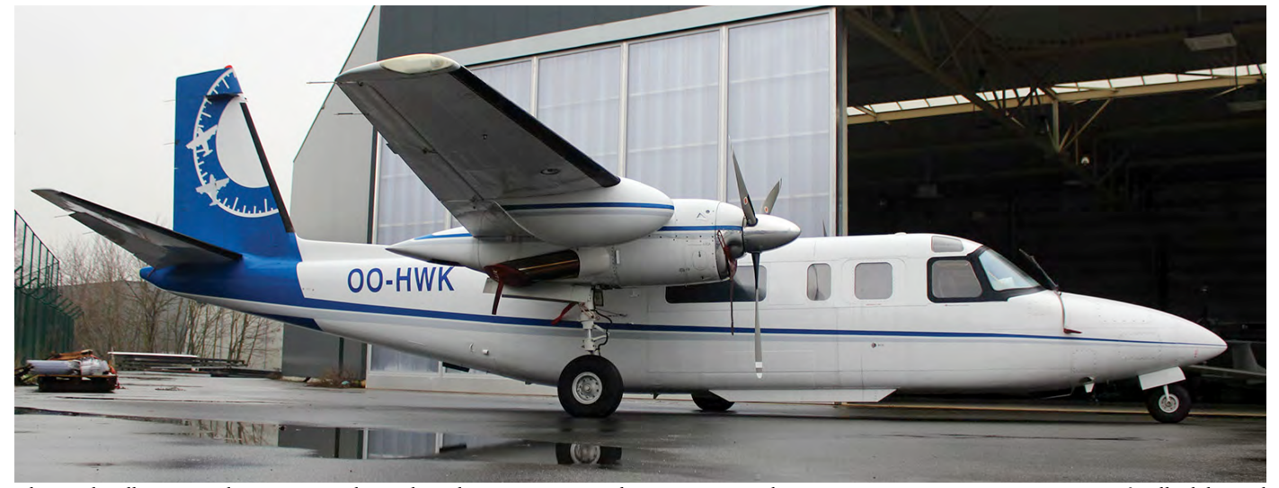
This Rockwell Commander was entered into the Belgian register in July 2020, registered to Reni Aviation. RC690A OO-HWK was finally delivered to Antwerp on 31 January 2021. The next day it was briefly seen outside. (Antwerp, 1 February 2021,)