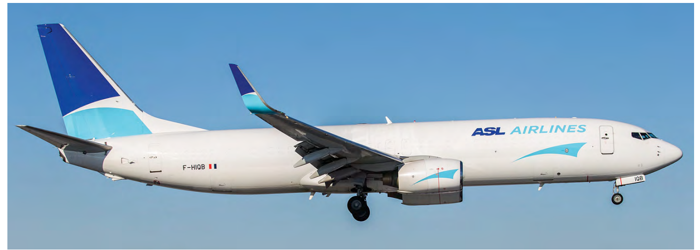
Before being converted to a freighter this Boeing 737 served with Ryanair and Pegasus Airlines. F-HIQB was delivered to ASL Airlines France in November 2020. (Liège, 11 February 2021,)