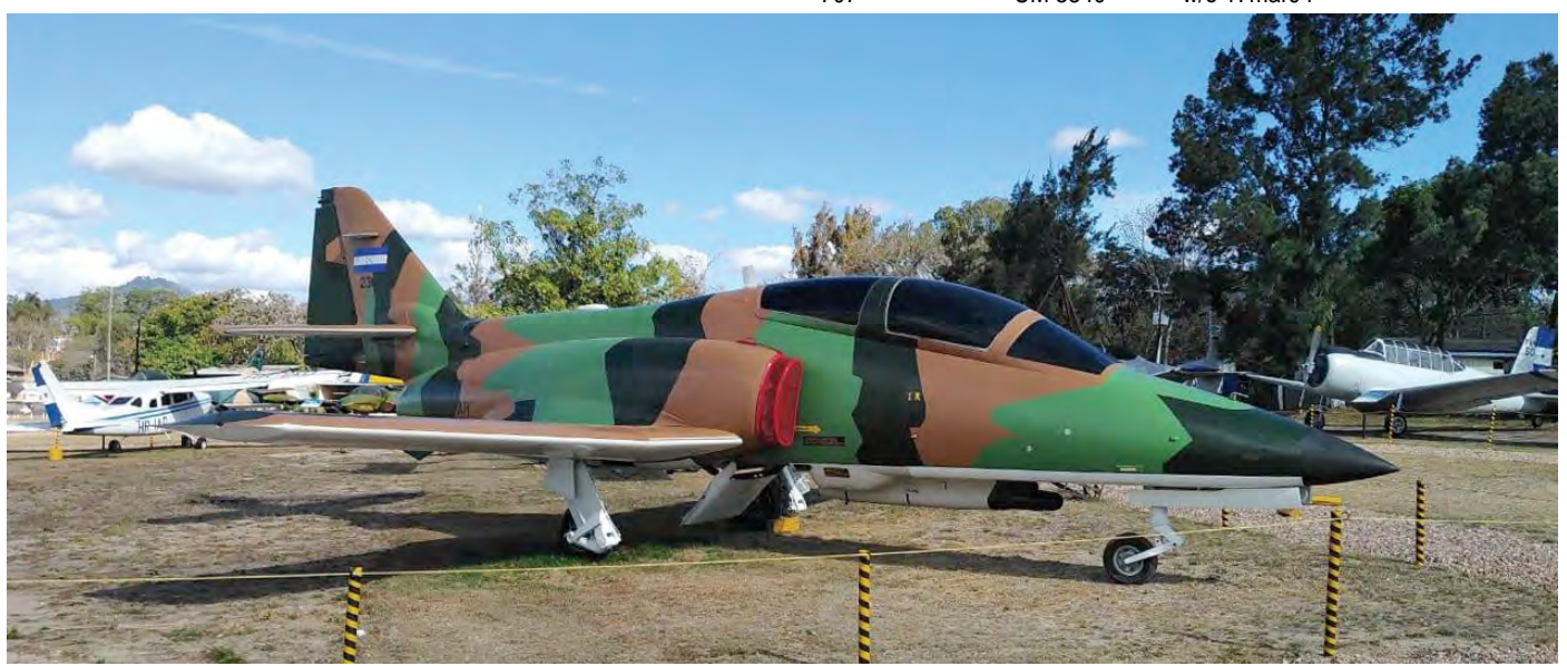
Mere twenty years after the type's retirement, the Honduran Air Force has finally released a CASA 101 Aviojet to the Museo del Aire in Toncontín, after refreshing its colours to the original paint scheme. (236, C101BB, 5 March 2021)

706 std MUSA for preservation A1038407 jan21 707 UM 3840