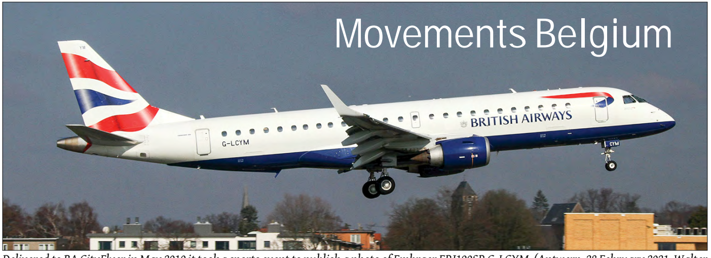
Delivered to BA CityFlyer in May 2010 it took a sports event to publish a photo of Embraer ERJ190SR G-LCYM. (Antwerp, 28 February 2021,)