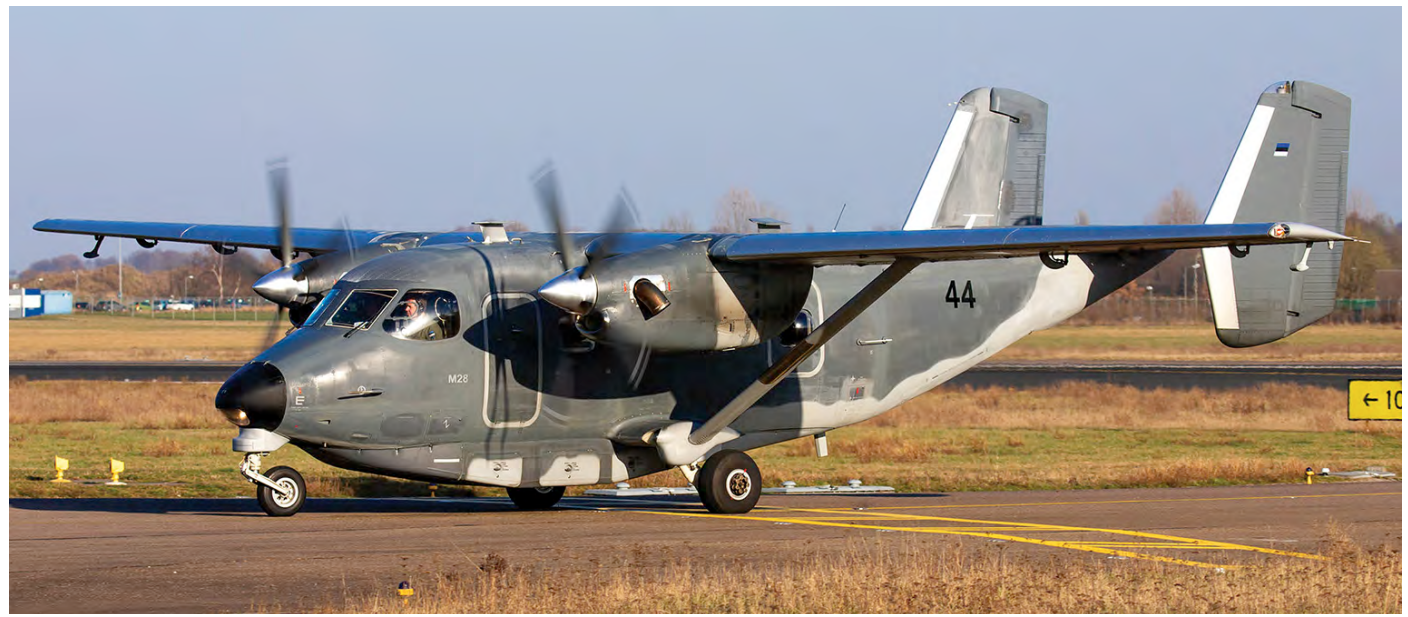
The Estonian Air Force sent 44 black, a PZL M28-05, or C-145A if you wish, to Maastricht-Aachen on 2 March 2021, where Bjorn van der Velpen enjoyed glorious sunlight on this rare visitor.

the aircraft used by demonstration team The Red Arrows, the remaining aircraft will be retired by 2025. Recently it was already announced that 736NAS would cease to exist end-2021, which leaves 100sq as the sole user of this type. It is unclear what the future of this squadron will be after 2025. The 100sq Hawks are used for air defence training in the so-called aggressor role. Since 2020, also the Typhoons of IX(B)sq are used in this role. With the planned reduction of the Typhoon fleet and retirement of the Hawk T1 it is also unclear how this role will be fulfilled in the future.