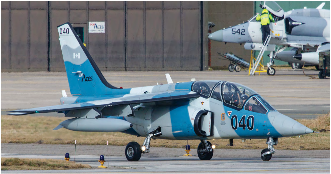
During corona nearby trips are still feasible and Wittmund provides ample variation. The camouflaged former German Alpha Jets, like this ex 40+40 operated by Top Aces, are a pleasant sight. (C-GITA/040, 24 February 2021)

stored with the 309th AMARG. In order of serial, code, arrival date and former unit with nickname.