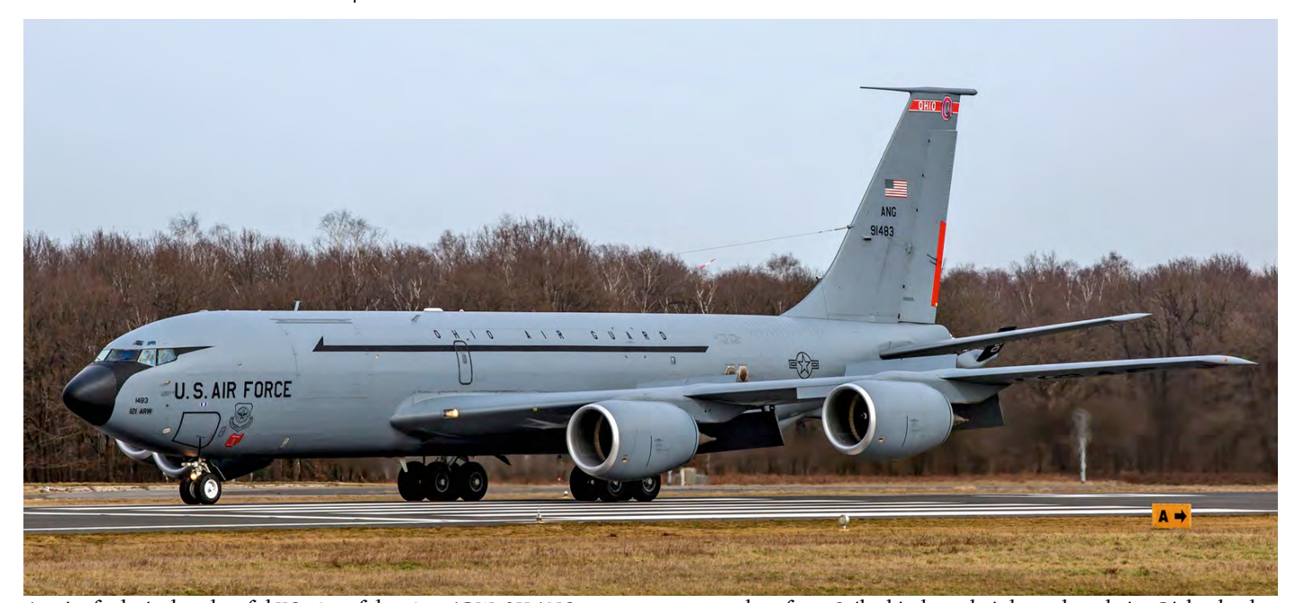
A pair of relatively colourful KC-135s of the 121st ARW, OH ANG was on temporary duty from Geilenkirchen, their home base being Rickenbacker ANGB (OH). Above 59-1483 and 63-7993 were seen by Arjen Sleeuwenhoek on 26 February 2021, and captured in great light while vacating runway 27.