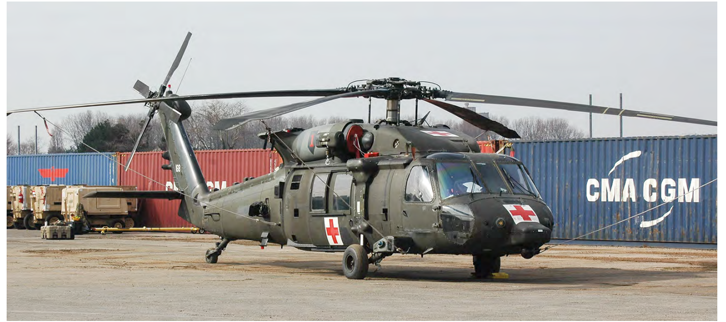
Four out of the total five flights of Air Ambulance Charlie Company, 2nd General Support Aviation Battalion, 1st Aviation Regiment consisting out of three HH-60M medical evacuation helicopters were offloaded in France.