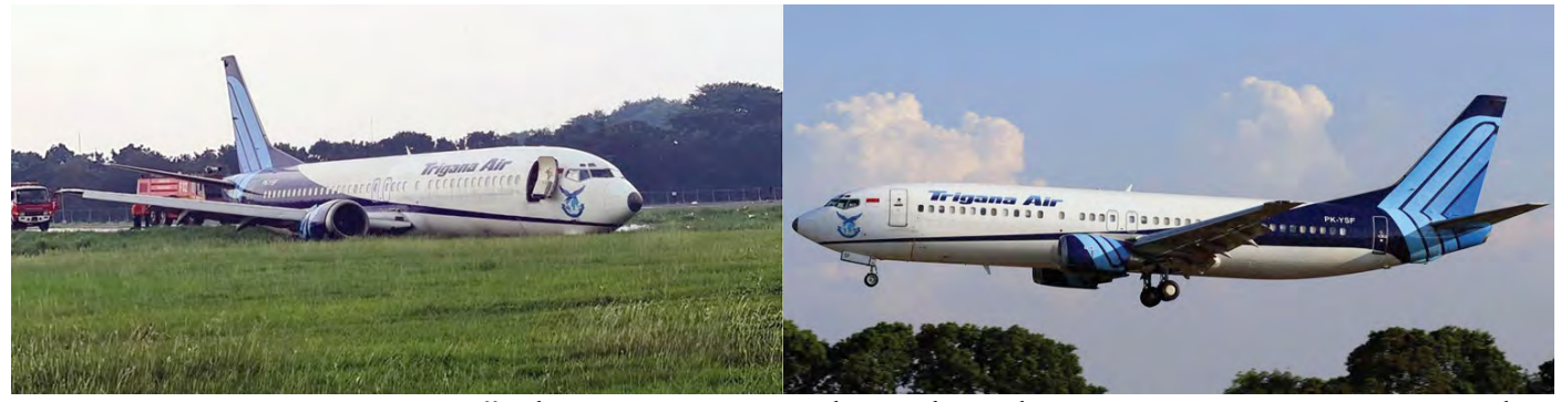
Trigana Air Service Boeing 737 PK-YSF suffered a runway excursion at Jakarta-Halim Perdana Kusuma Airport's runway 24. It turned out that a gear problem was the reason the crew decided to return to Halim, having taken off from there not long before. The landing itself was carried out nicely, but eventually the Boeing skidded to a stop on the left main gear and right hand engine pod. Damage was substantial, and the aircraft has already been scrapped.

local time, and around 15:06 the Tigers disappeared from the radar screen. It is reported that both pilots managed to eject. A RoCAF Black Hawk and Coast Guard and other rescue ships were scrambled to search the area for the missing pilots. One of the pilots (5287) was found and unconscious, the other (5286) sadly did not survive the accident. This is the second crash within five months involving an F-5E Tiger II. On 29 October 2020, the same unit also lost an F-5E Tiger II during a training mission in which the pilot was killed. The 7th FTW comprises of the 44th Tactical Fighter Squadron, 45th TFS and 46th TFS, all operating Tigers.