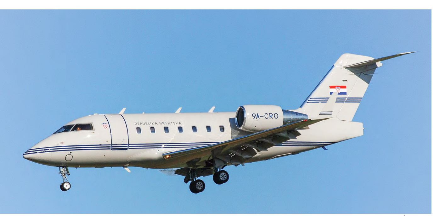
Registration 9A-CRO has been used for the VIPs for a while, although this is the second use, a CL-604 with construction number 5322. (Brussels, 13 June 2021,)