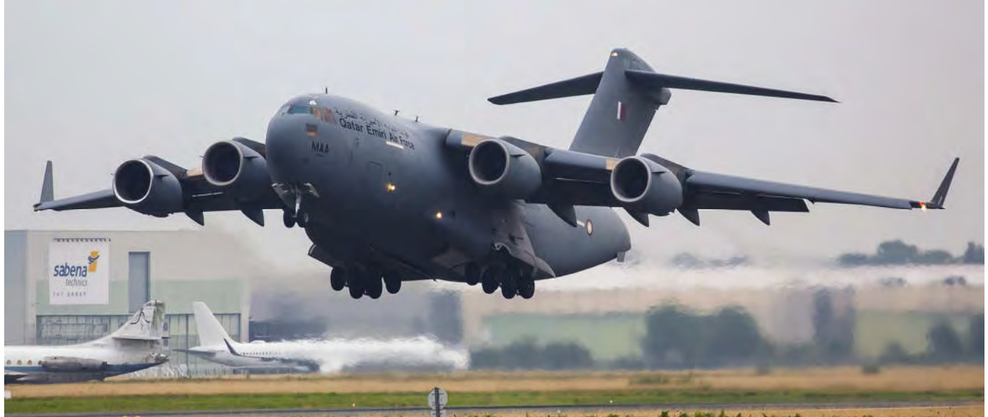
Globemaster A7-MAA supported the sixth delivery batch of Qatari Rafales that left Bordeaux for Istres on 27 July for onward delivery to Tamim air base. Involved were single ships QA228 to QA230 and straggler dual Rafale DQ QA207. This leaves nine of this order. (27 July 2021,)