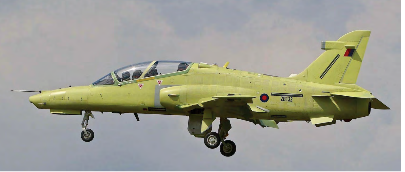
The second Hawk Mk167 for Qatar, ZB132 (QA02), flew for the first time on 27 May 2021 from BAE Systems Warton Aerodrome, United Kingdom. ZB133 flew the day before and ZB131 followed early June. As can be seen the first flight(s) take place unpainted, just so called primer colors.

became available for COVID-19 measurements. This year new budget has been found however.