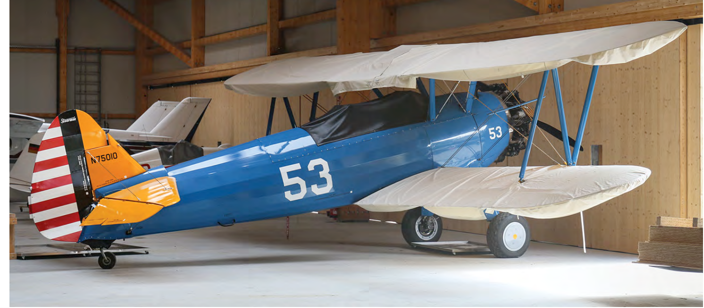
Stearman 41-8741/N75010 is a new resident in the Quax Flieger hangar at Nauen-Bienenfarm. It used to be based at Reinsdorf. (3 July 2021,)

Kecel48MiG-21bisstored, ex Papa 75081501 apr21The forward fuselage of the MiG is stored on a pallet at the