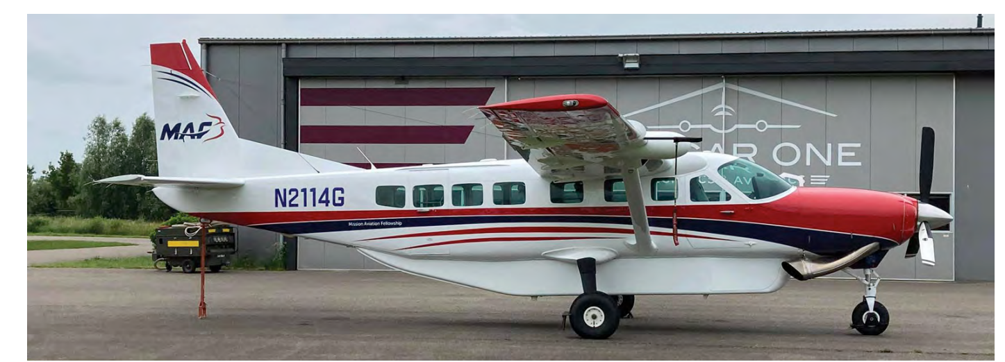
After a lengthy stay at Teuge this Cessna 208 finally departed Dutch soil shortly after maintenance at Teuge and a repaint at Lelystad in the well know MAF colours. N2114G arrived from Mongolia on 4 Februari 2020 as JU-2114 and departed to Guinea on 29 June 2021 for a new Mission Aviation Fellowship programme. (Teuge, 24 June 2021,)