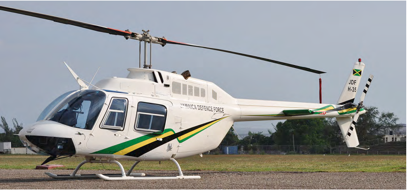
On 9 June 2021, Bell 206 JDF H-35 of the Jamaica Defence Force, made an emergency landing near Dunbeholden, St Catherine and was substantially damaged. The occupants were not injured. (Kingston-Up Park Camp, 9 May 2011, Wim Sonneveld)

16jul21 RA-28728 An-28 1AJ007-13 dam A <u>SILA Siberian Light Aviation</u> Antonov 28, flying a Russian domestic route from Kedrovy to Tomsk with four crew members and fifteen passengers, was enroute about 100 west of Tomsk when radio and radar contact was lost. Later an ELT signal was picked up in the vicinity of the village of Bachkar, and the coordinates established at N57.38 E80.38. Search and rescue teams made their way to the site where they located the Antonov upside down, however, everybody survived. One of the pilots received a serious injury (broken leg), all others escaped with minor or no injuries. According to initial information the crew did not report any problems or anomalies with the flight. The crash site is in an area of dense forest which hinders the search as nothing appears to be visible from the air. According to preliminary information the crew performed a forced landing in an open area following at least one failed engine.