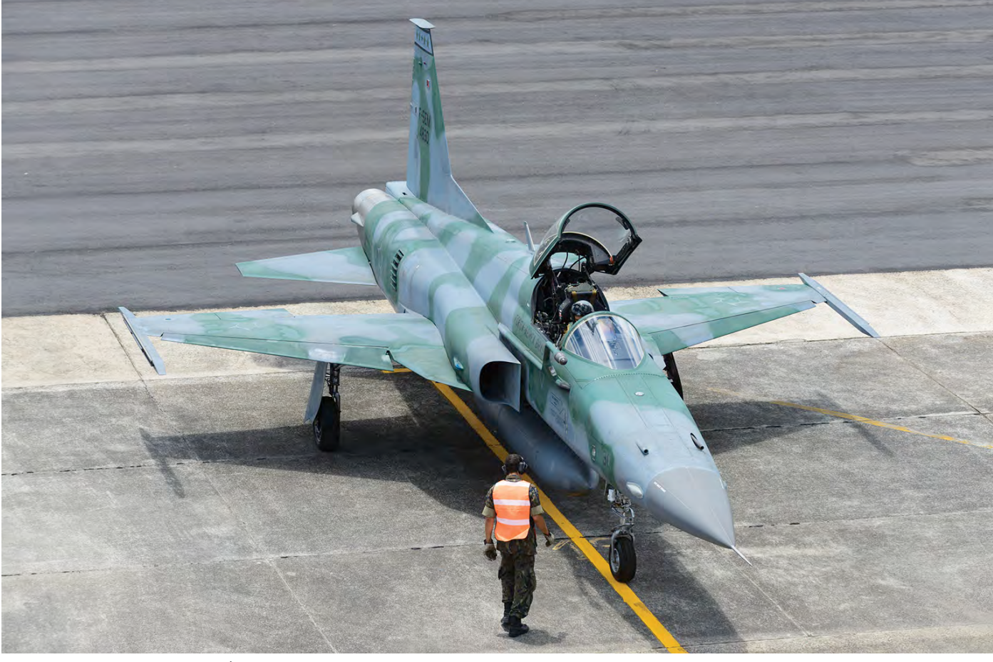
F-5EM 4830, then operated by 1°/14° GAv of the Força Aérea Brasileira, is greeted by its crew chief upon completion of a mission during CRUZEX Flight 2013. It crashed on 31 May 2021 and at that time was part of the inventory of 1°GAvCa. (Natal, 8 November 2013, Erik Sleutelberg)

<u>Credits</u>: ASN, Aviation Herald, B3A, Leo Hoogebrugge, de Telegraaf, Leeuwarder Courant, FAA, JACDEC, FlightRadar24, Jalopnik.com