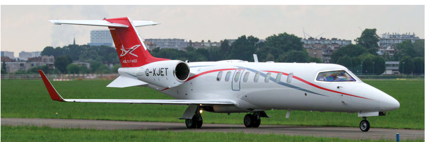
Scheduled to become OO-MED this Learjet is one of two aircraft recently delivered to a new offspring of the ASL Group at Antwerp. ASL Med Air will be the name judging by the tiles on the tail of G-XJET. (Antwerp, 24 June 2021,)