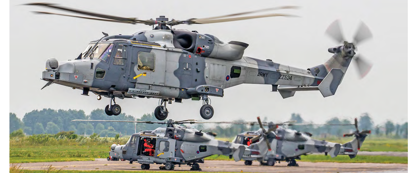
Wim Houquet was able to get three out of four Wildcats in one photo during a fuel stop at Koksijde Air Base on 22 June 2021, with AH1 ZZ524 being the center of attention in this picture.