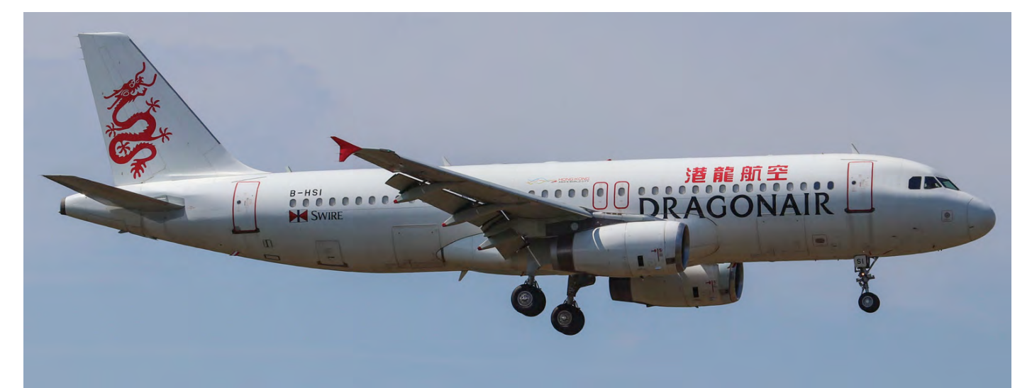
The 18th aircraft to be dismantled by AELS was caught on camera by Tim Volmer when it arrived at Twente Airport on 16 June 2021. A320 B-HSI arrived from Hong Kong with stops in Bangkok and Dubai.