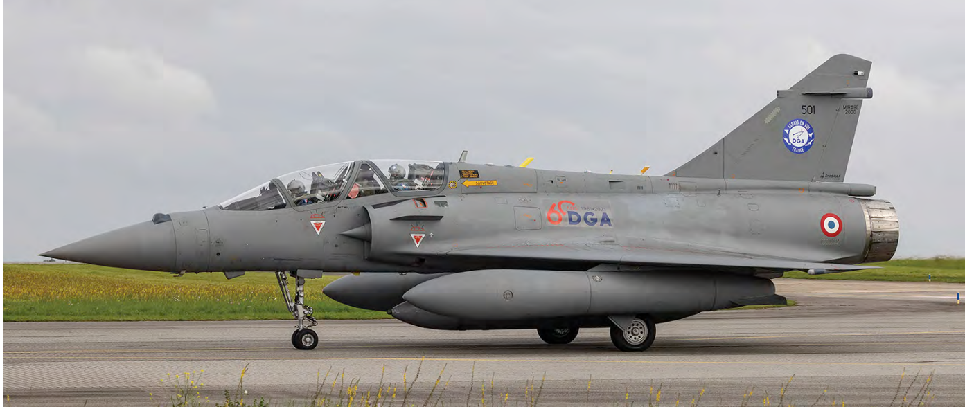
Mirage 2000B 501 of the DGA-EV is of special interest, besides having extra markings, it is also fitted with a Rafale nose-cone. at Evreux for the 14 July flypast.