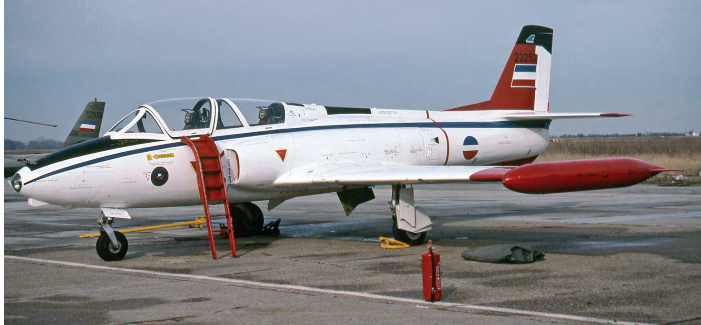
Late 2003, N-60 Galeb 23252 was the last one in use by VOC, the air force of Serbia & Montenegro's flight test centre. It wore the colours of the successor state of Yugoslavia, during a visit to Batajnica. (30 December 2003, Erwin van Dijkman)

However, as late as recently, serials of helicopters appear to be related not to the designation system, but to the common designation of the type, with H145Ms serialled from 14501, and Mi-35M from 35101.... Not one theory seems to hold here!