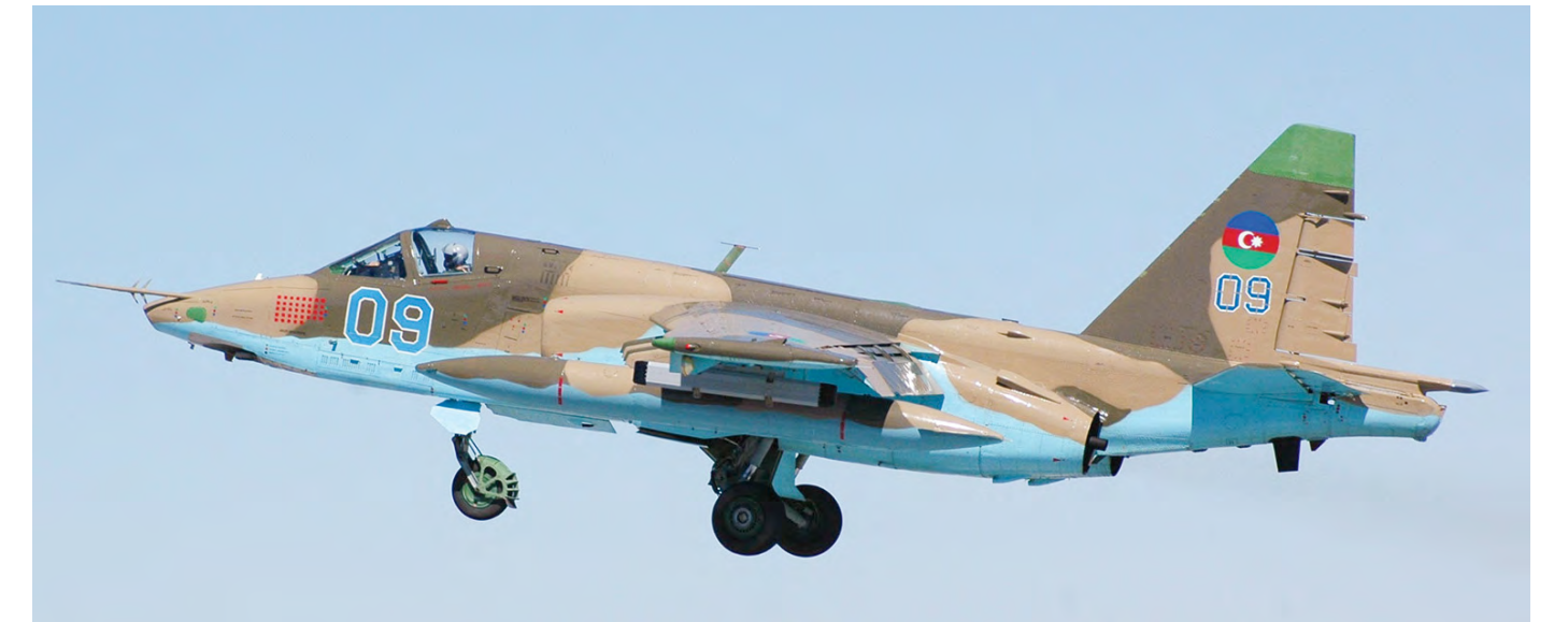
Rare Azerbaijan Air Force Su-25BM 09 blue takes off for the second AE mission of the day. It wears 37 'kill' mission marks on the nose, reminding of the recent war against Armenia. (30 June 2021,)