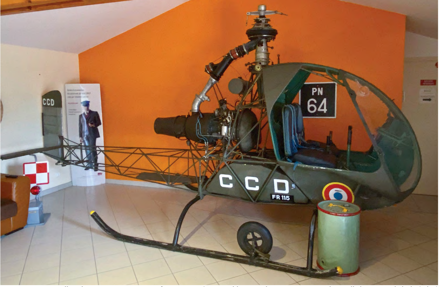
Camping Le Haut Village has S01221S Djinn FR115/CCD in one of its rental houses. The camping is at a place called Saint-Michel-Chef-Chef, which is near Saint Nazaire. (23 July 2021,)