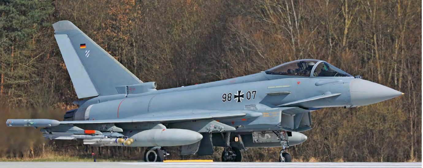
EF2000 98+07 is operating for Airbus at Manching and among its underwing load is the Brimstone missile it is testing. Dietmar Fenners captured the Eurofighter at Manching on 26 March 2021.