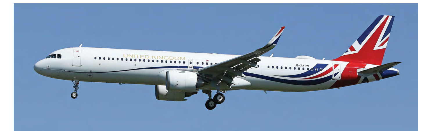
In Scramble 504 we published a nightly photo of this Titan Airways Airbus G-XATW. René Verschuur provided us with a photo of the A321 taken during day time on 14 June 2021 at Brussels.