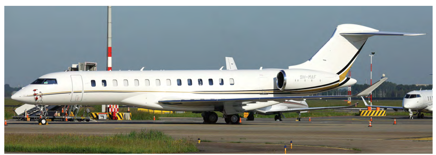
Global 7500 9H-MAF was factory fresh delivered to Hyperion Aviation in July 2019. (Amsterdam - Schiphol, 10 June 2021)