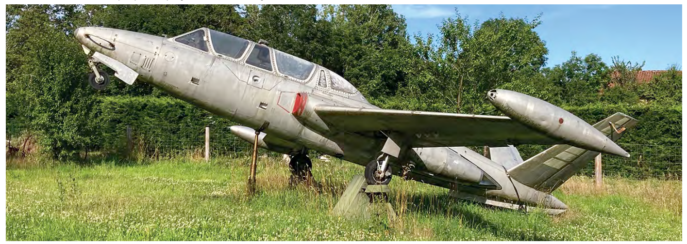
CM170 168 is displayed outside a small museum at Saulgond-Rouffiganc, which is east of Limoges. (11 July 2021, Leonard van Teeffelen)

Personal copy - Distribution to a third party is not allowed