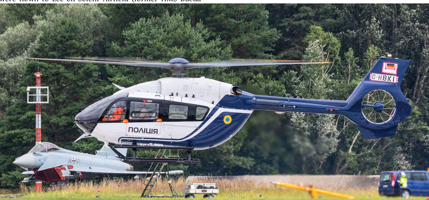
This factory fresh H145 was making test flights at Manching. The new 07 code is just visible on the white engine cowling. It is destined for the Ukraine Police force. Also of interest is the WTD61 Typhoon 98+07 doing full throttle engine tests in the background at the same time.

Lockheed Martin UK provided an update to the UK parliament on various defence projects, including the F-35B programme. In this update it was stated that the slowed delivery of the first forty-eight aircraft (due to financial constraints) will most likely delay the stand up of the second frontline squadron with three years. Currently 207sq acts as the F-35B Operational Conversion Unit (OCU), and 617sq is the first frontline squadron. They were planned to be joined by 809NAS in 2023, but this is now probably delayed until 2026.