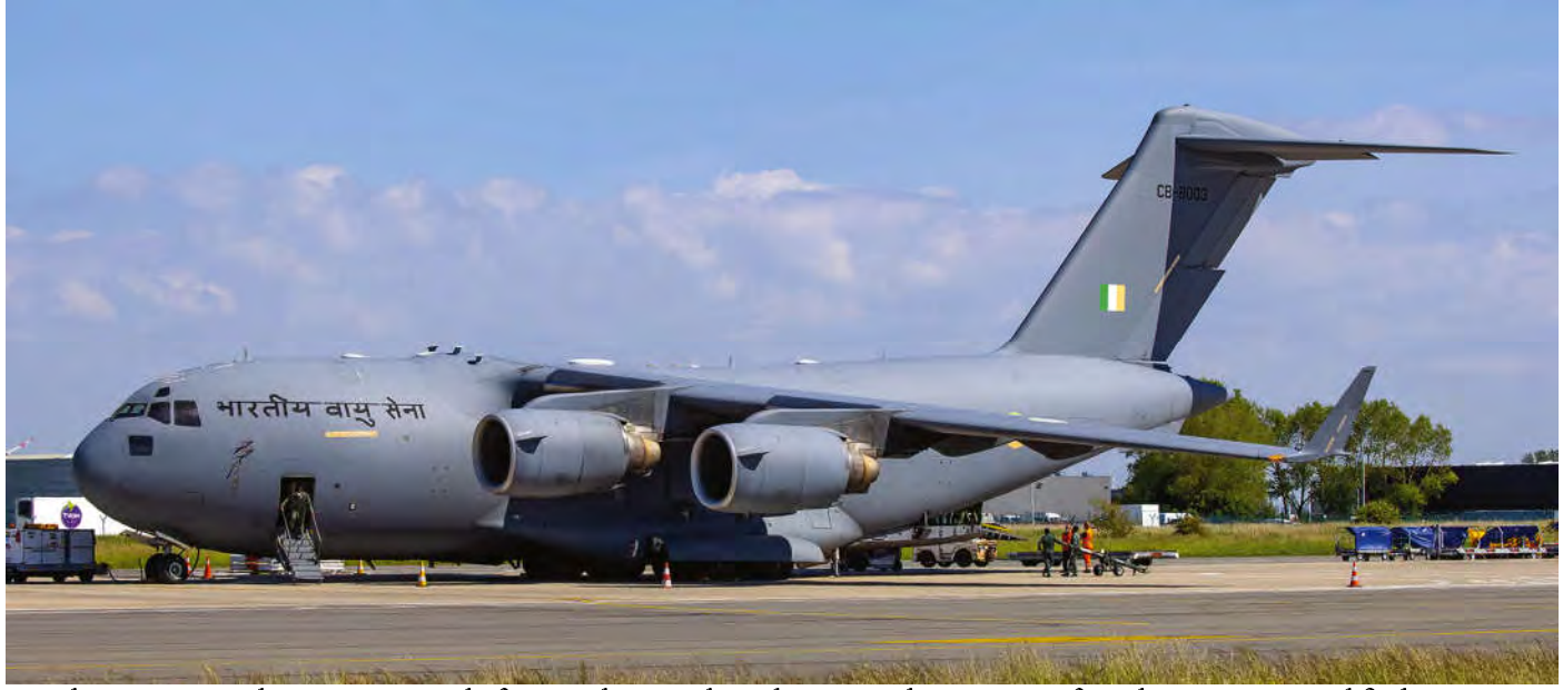
Covid-support to India was apparently frequently given by Belgium. Or they were too frugal to use comerical flights. Anyway, many flights with C-17s came to Oostende for us to enjoy. (10 June 2021, Dino van Doorn)