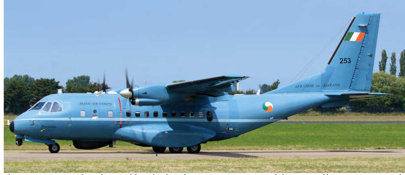
This CASA CN235M-100 with serial 253 was delivered to the Irish Air Corps in 2018. It is currently being operated by 101sq in a Maritime role. In this case however it was used as an air ambulance for a baby in need of medical attention. (Rotterdam - The Hague, 24 June 2021, Pieter Bes)