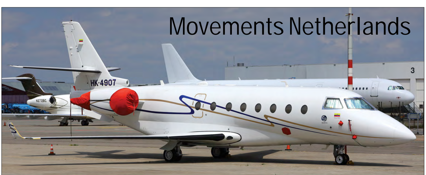
A well known frame to the European spotters as this Gulfsteam G200 was previously being operated with registrations OE-HFC and HB-JKD. The aircraft is residing in Colombia as HK-4907 since December 2012, being operated by Servicio Aéreo de Capurganá (Searca). (Amsterdam -Schiphol, 24 June 2021,)