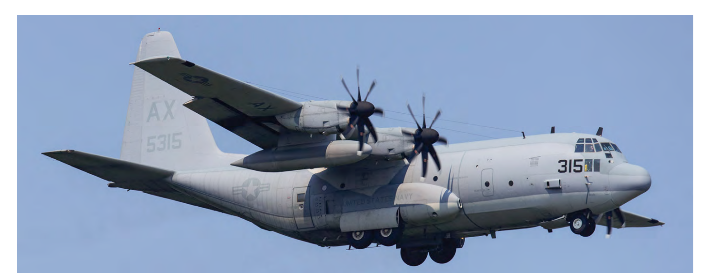
AX-coded VR-53 C-130T165315 was recently transferred to the Us Navy from Marines unit VMGR-452/NY. It is seen here landing at its home base. (Andrews AFB/NAF Washington, 6 July 2021,)