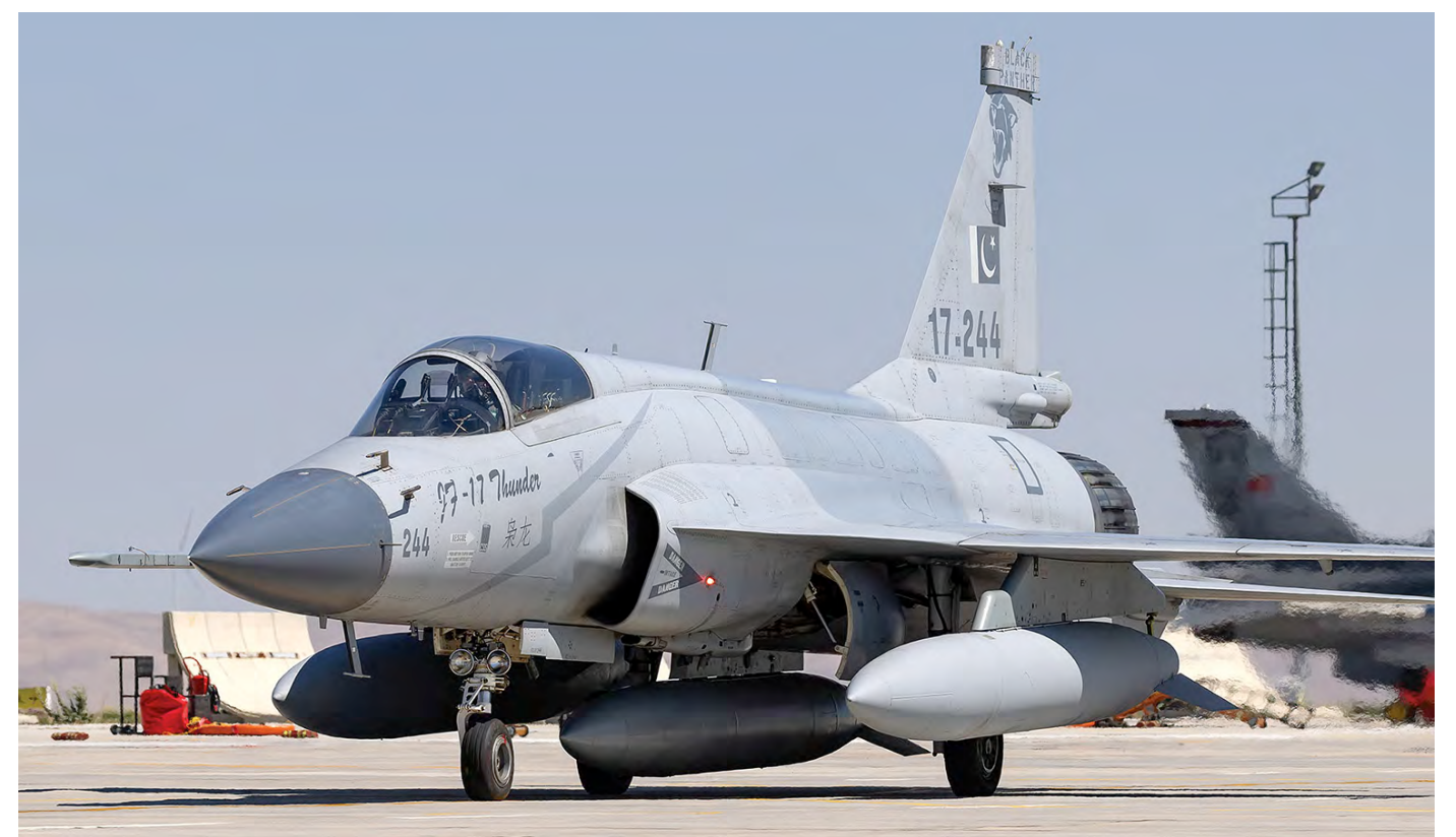
The 16 (Multi Role) Squadron "Black Panthers" of the Pakistan Air Force delegated five JF-17 Thunders to this year's Anatolian Eagle exercise. Among them was 17-244, seen here taxiing past the flightline.