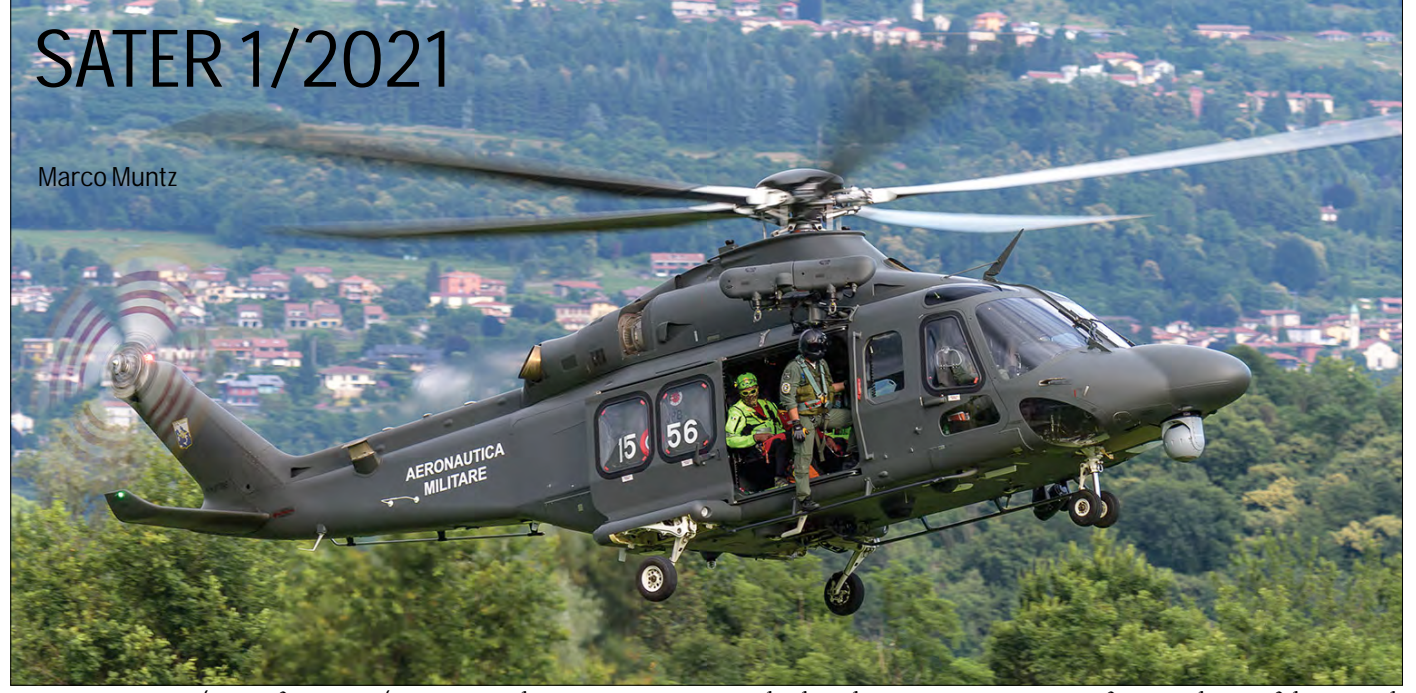
HH-139B MM81986/15-56 of 83° CSAR/15° Stormo takes CNSAS rescue teams back to the Posto Base Avanzato after completion of their search and rescue mission. At this PBA, ground staff assisted at the designated landing zone.

The region of Lombardy hosted this year's first edition of the Italian national search and rescue (SAR) exercise SATER on 23 June. The mountainous area just south of Lake Como, known as the Triangolo Lariano, was selected as exercise area in remembrance of the crew involved in an incident with an AB212AM (Matricola Militare MM81146/-) from the Squadriglia Collegamento e Soccorso di Milano-Linate (MI) on 26 April 2005. The helicopter impacted Monte Palanzone within the Triangolo Lariano on a training flight costing the life of five crew members. This SATER exercise in the province of Como was already planned for last year in coincidence with the 15th anniversary of the AB212AM mishap, but due to the COVID pandemic it had to be postponed. The paraglider landing field of the Monte Cornizzolo Aero Club at Suello (LC), 10 kilometers southwest of Lecco (LC), was chosen as the Posto Base Avanzato (PBA) or remote operating base for the duration of the exercise. SATER 1/21 (SATER - Soccorso Aereo TERreste) was organised by the Comando Operazioni Aeree (COA) of the Aeronautica Militare (AM) - Italian Air Force based at Poggio Renatico (Ferrara) in cooperation with the the Corpo Nazionale Soccorso Alpino e Speleologico (CNSAS) of Lombardy.