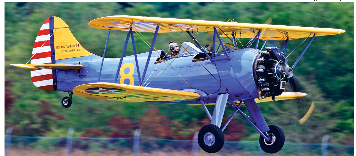
Blending into the formation of Stearmans was N2291, a rare Waco PT-14, one of 14 built and was the aircraft that lost the primary trainer contract to the Stearman in 1939. (Culpeper-Regional, 25 September 2020)

Picturesque late summer northern Virginia weather was in place as aircraft arrived ahead of the event. Then, the skies began to turn ominous. Formation practice day, Thursday, 24 September, saw all the aircraft go aloft in a dry run of the Friday flyover within rural northwest Virginia airspace.