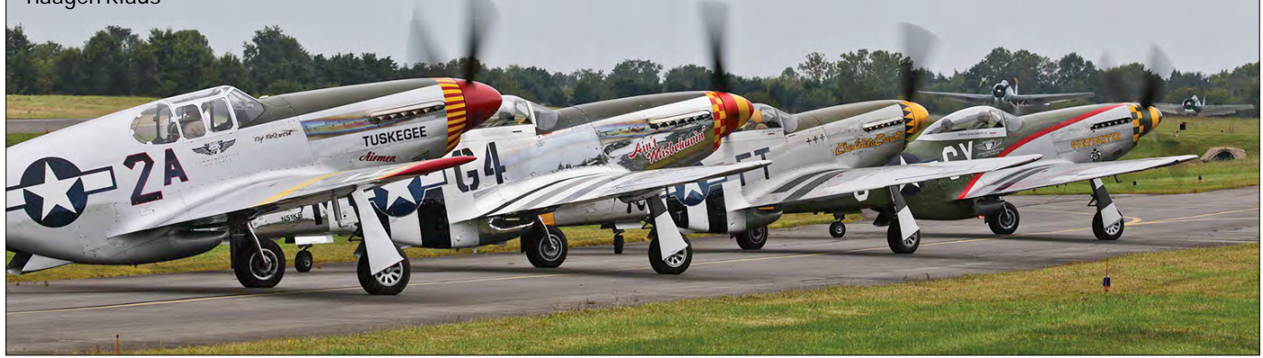
The volume of aircraft being launched often made for packed taxiways. Here, the P-51C and three P-51Ds of the Little Friends, Big Fight formation await clearance. (Culpeper-Regional, 24 September 2020)