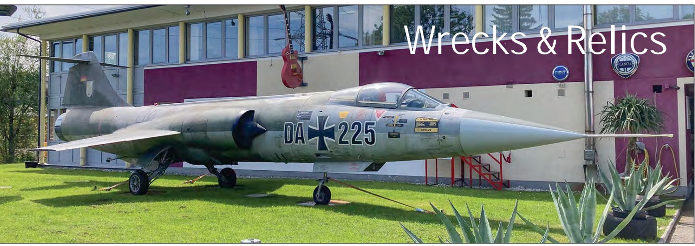
F-104G 21+60 was painted at Baarlo as DA+225 for a German movie. It went via Salzburg to its current location at Koppl-Habach, Austria. (4 July