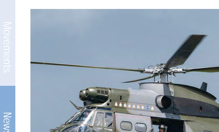
On 7 July 2021, the RAF flew a ten ship formation around the UK to celebrate the 50th Anniversary of the Puma in RAF service. Here is XW224, the anniversary aircraft, landing at RAF Scampton for the first fuel stop of the flypast. (MartinFox)