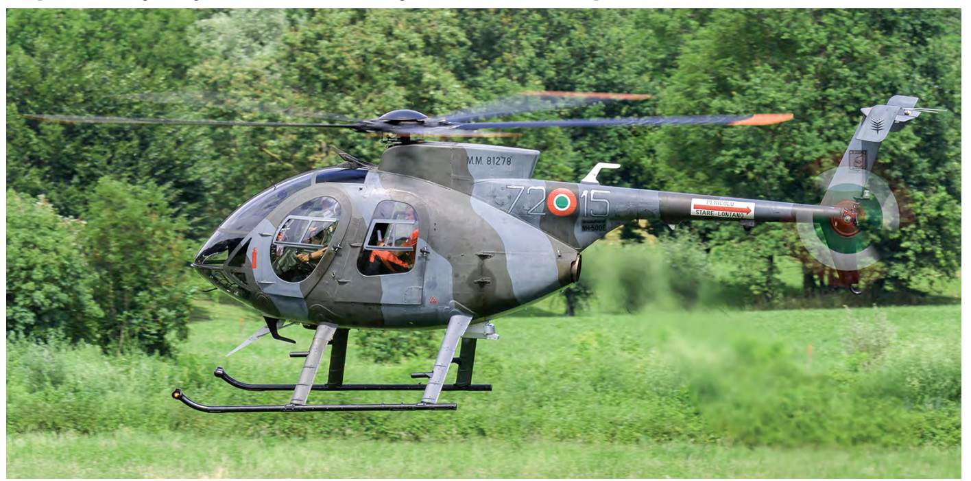
The first helicopter to take CNSAS rescue team members up into the mountains in the Triangolo Lariano was NH500E MM81278/72-15 of the Squadriglia Collegamento di Milano-Linate. The NH500E has only limited space and can just take up to two members of a rescue team at once but the helicopter's velocity is highly appreciated when a quick intervention is necessary.

The Italian national search and rescue exercise SATER is usually being organized three times annually covering north, central and south Italy. The region where and the season when the exercise takes place changes every year to add more training value due to various weather conditions and the presence of different kinds of high terrain. The shift of region also gives more different crew the opportunity to participate in SATER. Main objective of the SATER exercises is to develop the right sinergy and cooperation between assets of the Corpo Nazionale Soccorso Alpino e Speleologico and Aeronautica Militare while constantly improving techniques and procedures to be ready for any possible SAR mission, day and night. This is being achieved by the simulation of real situations in order to be fully prepared when each other's expertise, knowledge and assistance are required to either recover the crew of a crashed military aircraft or the search for missing persons in mountainous terrain with support from helicopters of the Italian Armed Forces.