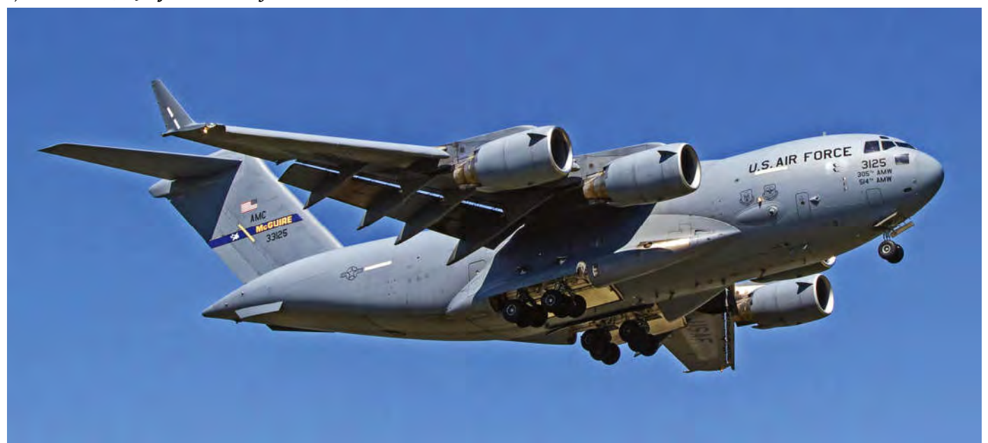
Team McGuire sent C-17A 03-3125 to Geneva on 11 June 2021.