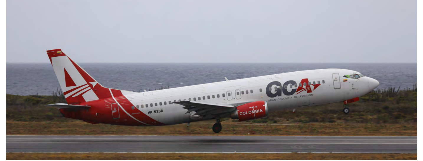
Gran Colombia de Aviación is the current operator of this former Air Busan Boeing 737. HK-5288 was delivered to GCA Air in July 2018. (Curaçao, 6 June 2021,)