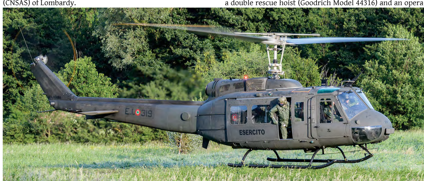
The first helicopter to arrive at the Posto Base Avanzato (PBA) at Suello was AB205 MEP MM80690/E.I.319 of Venaria Reale based 34° Gruppo Squadroni AvEs. This Gruppo, "Toro", is part of 4° Reggimento "Altair"AVES, primarily operating in Alps and Dolomites mountains.

The XIX Delegazione Lariana of the CNSAS is responsible for search and rescue operations in the Triangolo Lariano area and was therefore closely involved in the planning of the exercise. Main scope of the exercise was to enhance the synergy and cooperation between the Italian Armed Forces and CNSAS units involved. The exercise provided all participants with the opportunity to train and improve procedures and methods to execute a SAR mission in mountainous terrain in the most effective way possible. Three helicopters were dispatched to Suello to support this year's SATER exercise in Northern Italy, the Esercito Italiano sent Agusta-Bell AB205 MEP MM80690/E.I.319 from 34° Gruppo Squadroni "Toro" based at Venaria Reale (Torino) while the Aeronautica Militare provided Breda-Nardi NH500E MM81278/72-15 assigned to the Squadriglia Collegamento di Milano-Linate (MI) and a brand new Leonardo HH-139B, MM81986/15-56, from 83°Centro CSAR at Cervia (RA). The latter was only delivered to 15° Stormo on 11 December 2020 and this was the first participation of a HH-139 'Bravo' in such an exercise. The HH-139B has improved operational capacity compared to the 'Alpha' version, differences include the availability of a double rescue hoist (Goodrich Model 44316) and an opera-