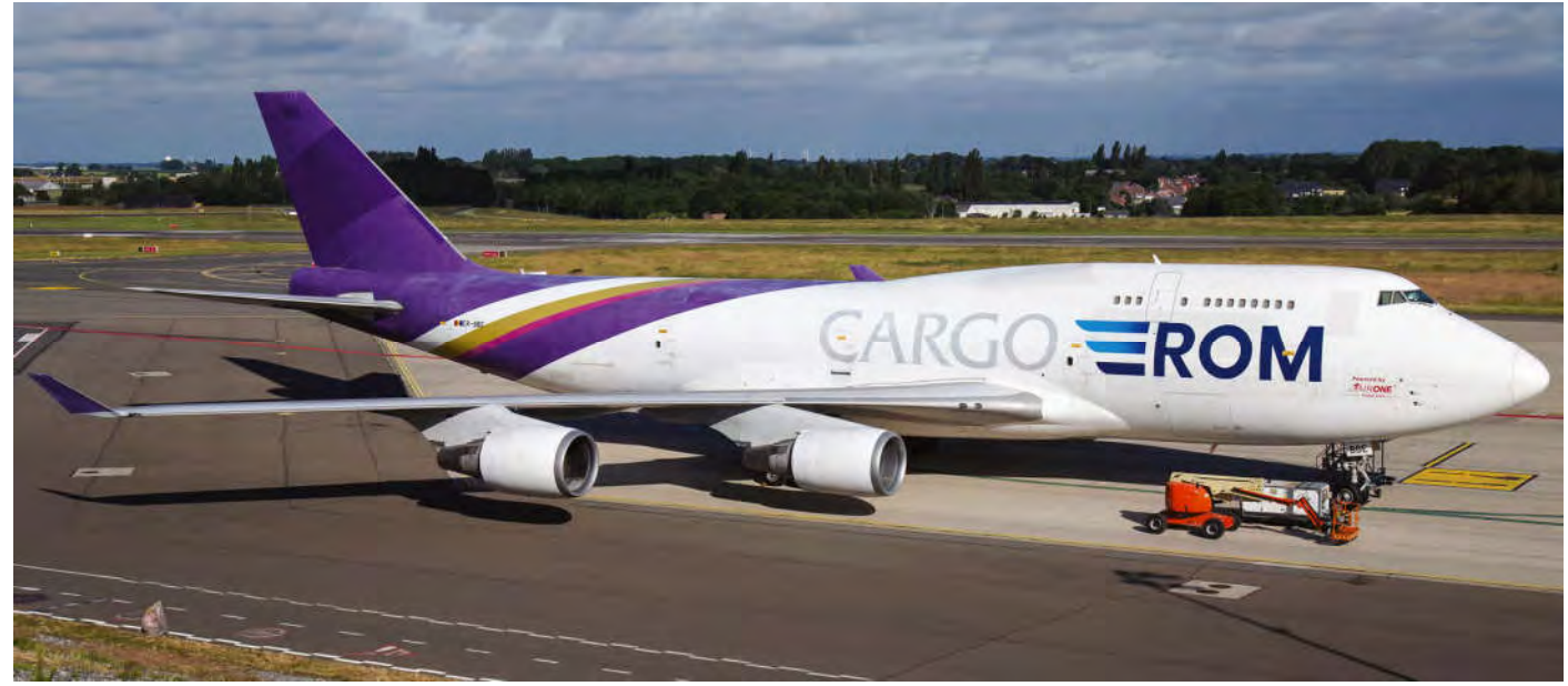
It is not hard to guess who the previous operator of Boeing 747 ER-BBE was. Even the Cargo part of the titles are the one of Thai Airways International. Since may the freigher is operated by Aerotranscargo of Moldovia and according the small titles on the nose, powered by Exclusive Global Sales Agent. (Liège, 19 June 2012,)