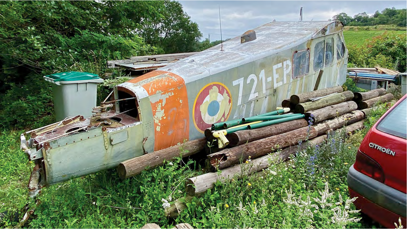
Bonave is a small village south of Ville sur Jarnioux. Stored dismantled behind a barn is MH1521M 015/721-EP, which used to be preserved at a museum at Perpignan. (17 July 2012, Hans van der Vlist)