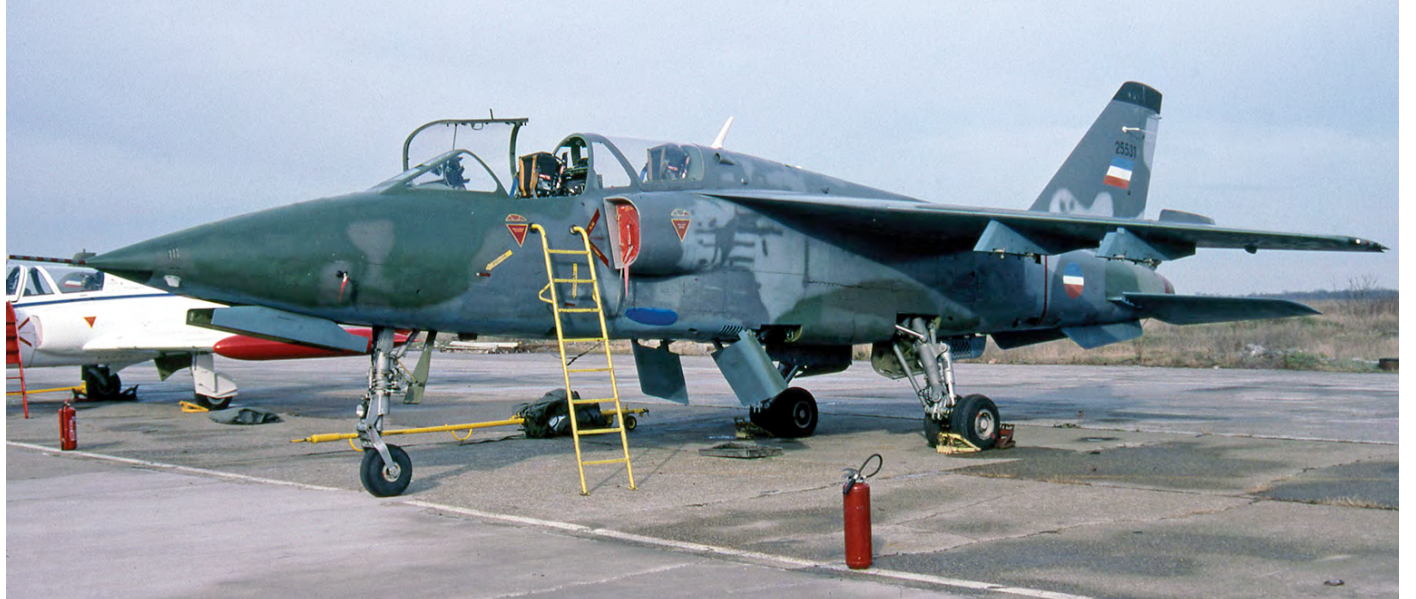
The Orao is one of the fruits of the Yugoslav aeronautical industry and is still in use in today's Serbia. NJ-22 25531 is seen here on the flightline of Batajnica as part of the then Serbia & Montenegro air force. (30 December 2003, Erwin van Dijkman)