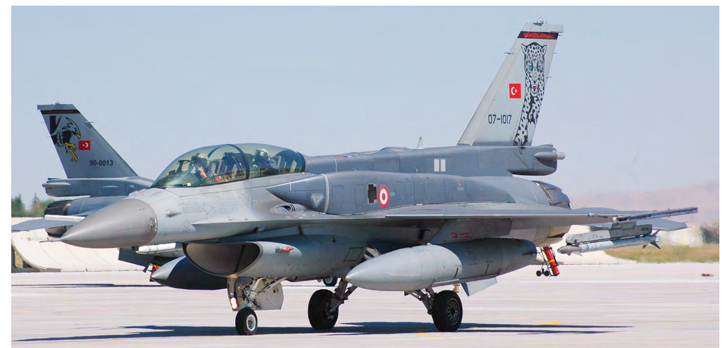
The Turkish F-16s with their large coloured squadron marks are among the most beautiful F-16s in Europe. Here 181 Filo F-16D Block50+ 07-1017 with conformal tanks is taxing out for its next mission. (30 June 2021, Marijn van der Burgt)