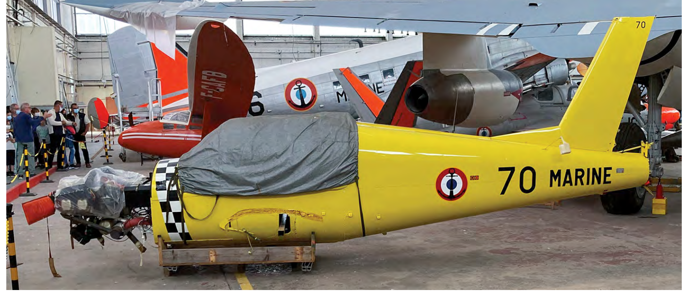
Although Morane MS893-100S 70 is in the display hall of the Musée de Tradition de l'Aéronautique Navale at Rochefort-Soubise it still needs some work to become a proper display aircraft. (13 July 2021, Leonard van Teeffelen)