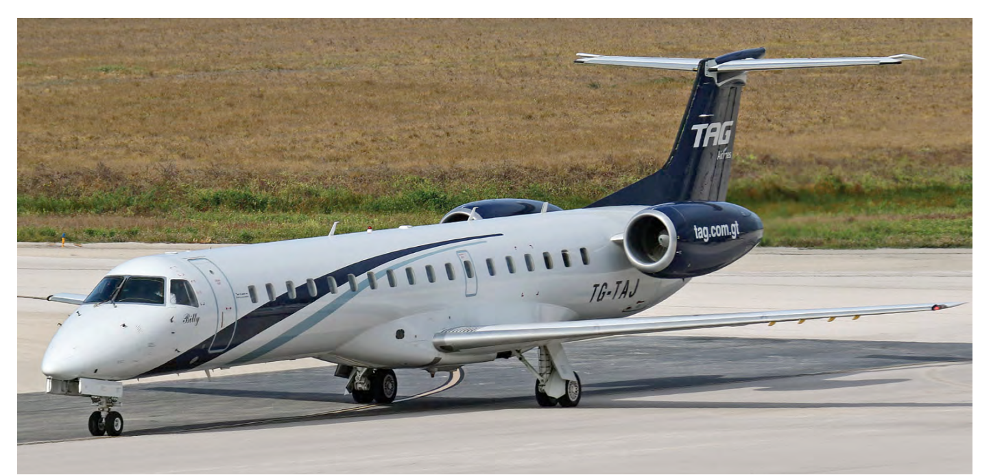
Transportes Aéreos Guatemaltecos took delivery of this Embraer in December 2017. ERJ145LR TG-TAJ is a former ExpressJet Airlines aircraft. (Curaçao, 5 June 2021,)