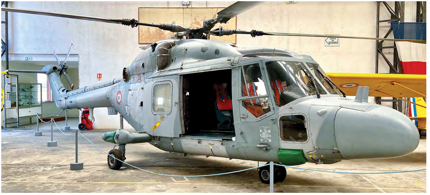
French navy Lynx HAS2(FN) 276 is a new arrival in the French army museum at Dax. Haditechnikai Park.