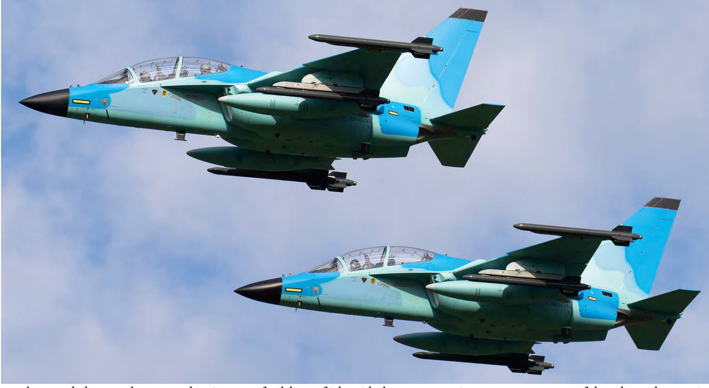
In July several photographs appeared on internet of a delivery flight with these two stunning M346s. Assessment of the colour scheme points toward Turkmenistan as customer. (Varese/Venegono, 19 July 2021).

62-7475 wings to 02-7969, cockpit pvt.collector 227-90 jan67 62-7475/COMP. to US Navy as 553905(= wrong ID) 256-89 nov81 as 62-7475 (COMP.) 256-89 02-7969 reregistered 78 A wing-swap puzzle solved? F-86F 62-7475 (former USAF 55-3905) was stored at Gifu in January 1967. It is believed it donated its wings to the fuselage of 02-7969 during 1979. For unknown reasons this composite frame (wings 475/fuselage 969) instead of retaining its fuselage serial, adopted the serial of its wings, 62-7475. After this composite was retired in November 1981, it returned to the US DoD and according to US Navy records became a QF-86F target drone with serial 553905. So, unless during the wing-swop also the construction number plate was swopped, the QF-86F was using the wrong former USAF ID, that of the wings. One could say the