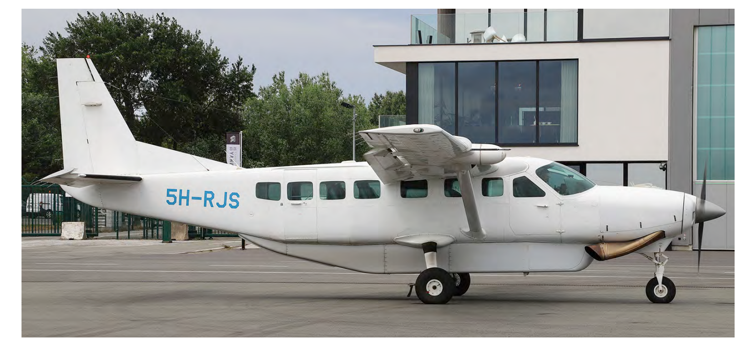
5H-RJS is officially being operated by Air Excel since March 2019. The Cessna 208 was caught on camera at Ostend by Nik Deblauwe on its ferry flight back to the USA on 23 June 2021.