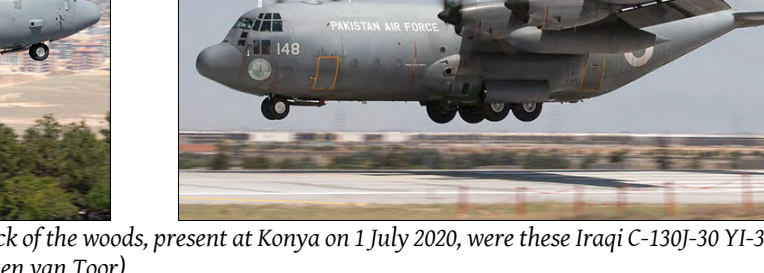
Two of the special C-130s, not very often seen in these neck of the woods, present at Konya on 1 July 2020, were these Iraqi C-130J-30 YI-304, seen on the left, and Pakistani C-130E 4148, on the right. (Jurgen van Toor)