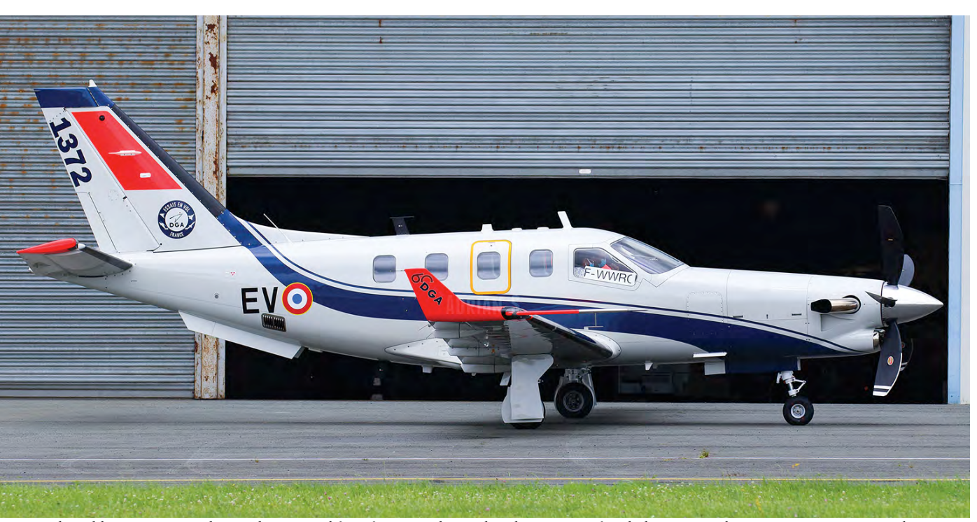
Toussus-le Noble near Paris is almost always good for a few special French military aircraft or helicopters. Adrian Stürmer encountered TBM-940 F-WWRC, destined to become 1372/EV of the DGA-EV on 14 July 2021.

A couple of months ago, we mentioned the purchase of six C-130J Hercules transporters for the German Air Forces. This deal comprises three stretched C-130J-30s and three KC-130Js (refuelling variant).