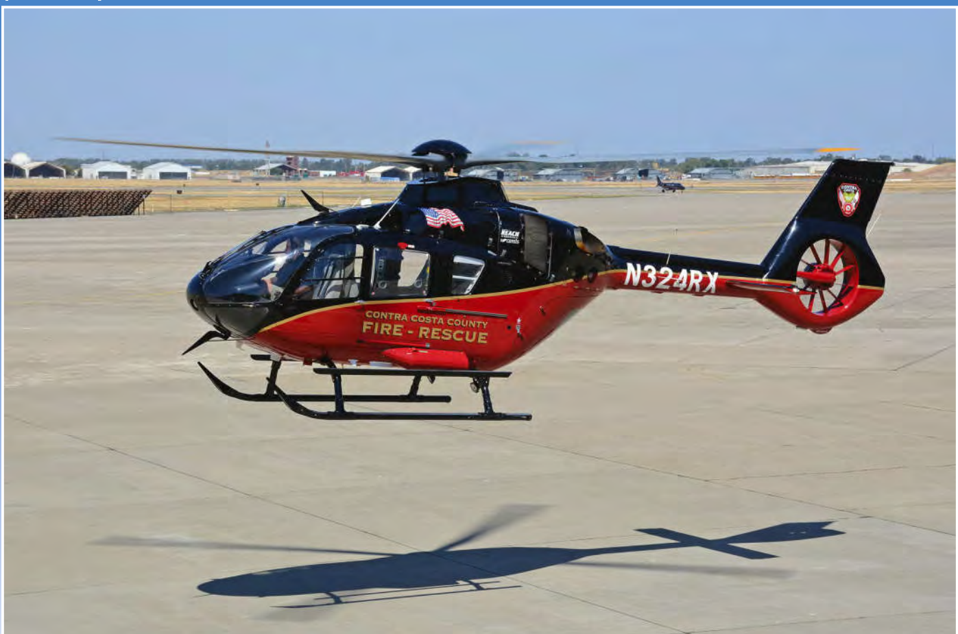
Owned and operated by Reach Air Medical Services for Contra Costa County, California, N324RX registered EC135P3, is seen on 15 July 2021 departing the Reach maintenance facility at McClellan Field in Sacramento, California.

All three of the DC-10-30 firefighting aircraft with the new livery of 10 Tanker Air Carrier are seen on 3 July 2021 at McClellan Field in Sacramento, California. Tanker 910, N612AX, is departing to make a run on the East Fork Fire near Markleeville, California. Previous registrations of this Tri-holer were HS-TMB (Thai Airways International) and N239NW (Northwest Airlines and Omni Air International).