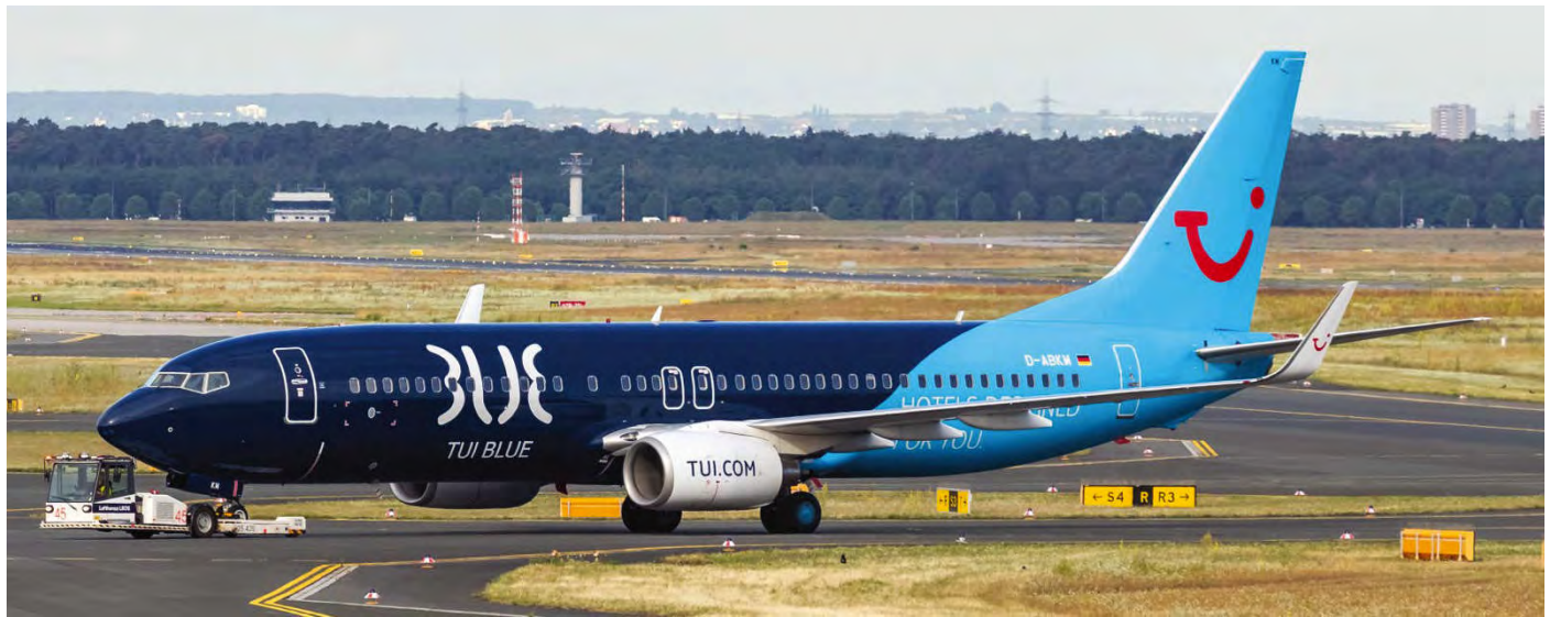
Boeing 737 D-ABKM of TUI fly Germany flew in the colours of Eurowing until last May. Since then it flies in special TUI BLUE colours to promote the hotel chain of this tour operator. (Frankfurt-Main, 7 July 2021, Anton Homma)