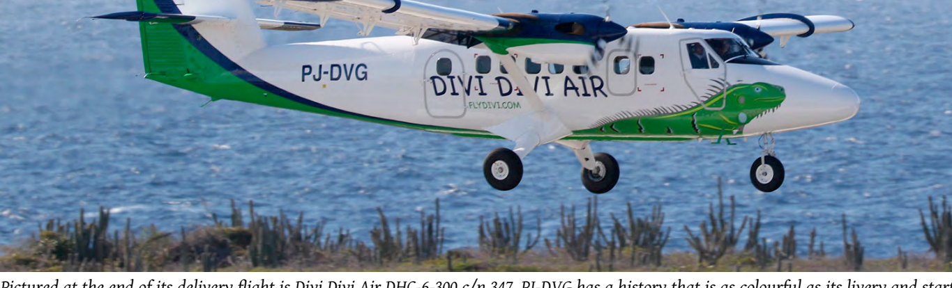
Pictured at the end of its delivery flight is Divi Divi Air DHC-6-300 c/n 347. PJ-DVG has a history that is as colourful as its livery and started its life in 1972 as VP-FAQ of the British Antarctic Survey. Speaking of the livery, an iguana is prominently featured on the fuselage of PJ-DVG. (Curacao, 25 June 2021,)

Personal copy - Distribution to a third party is not allowed