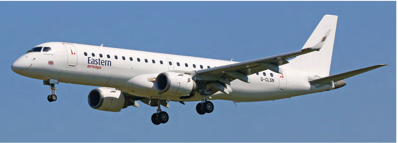
G-CLSN is the latest addition to the Eastern Airways fleet and their first Embraer 190. The ERJ190LR was previously in service with Air Moldova as ER-ECC. (Rotterdam - The Hague, 10 June 2021,)