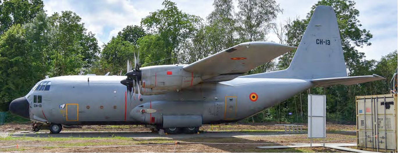
Belgian C-130H CH-13 arrived on 21 April 2021 for preservation at the 1st Wing Historical Centre at Beauvechain. (29 June 2021,)