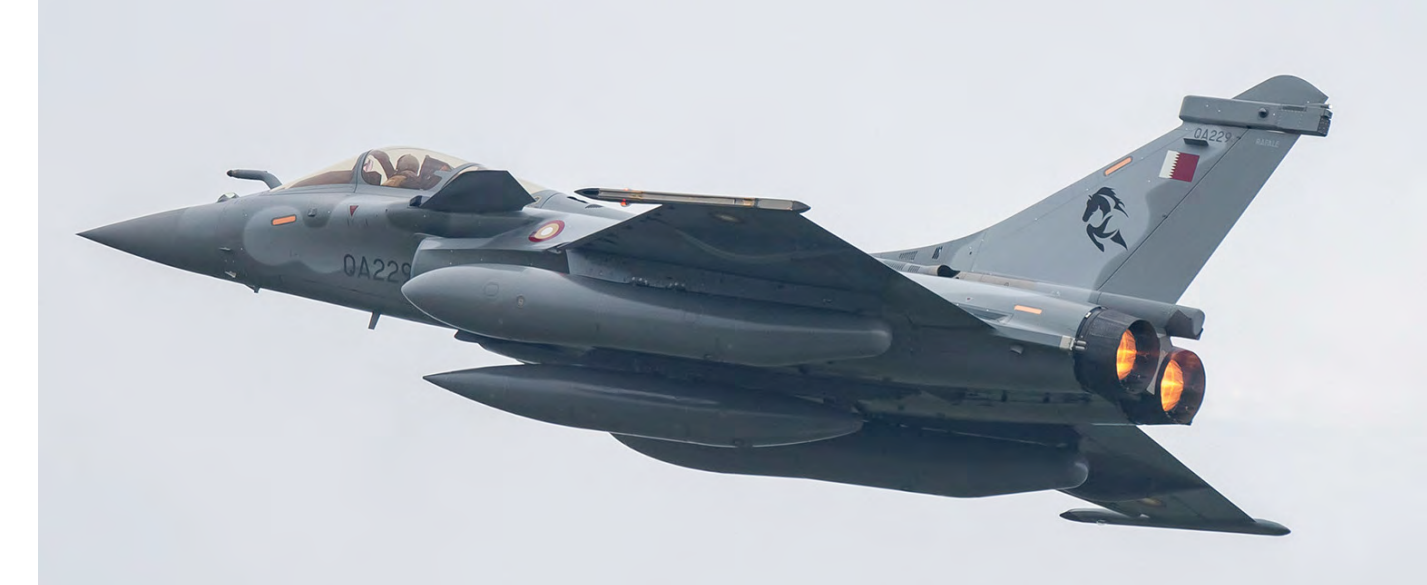
The sixth delivery of Qatari Rafels involved a dual and three singles, QA229 was one of these. Nine more are to be delivered. (Bordeaux, 27 July 2021, Maciej Swiderski)