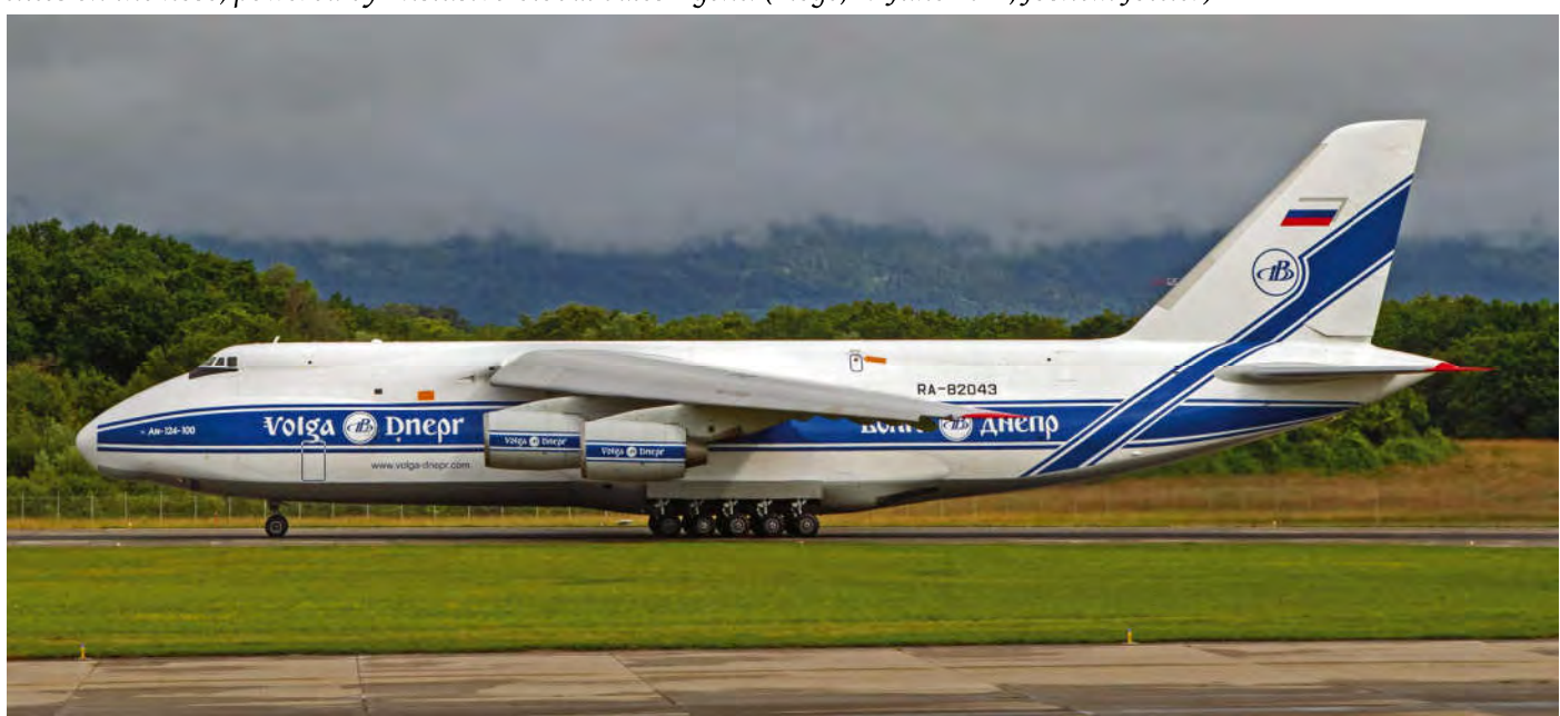
It is not only (exotic) bizjets at Geneva. Antonov 124 RA-82043 of Volga-Dnepr visited the airport on 6 and 7 July 2021. It came in from Abu Dhabi and departed the next day to Hahn. (7 July 2021,)