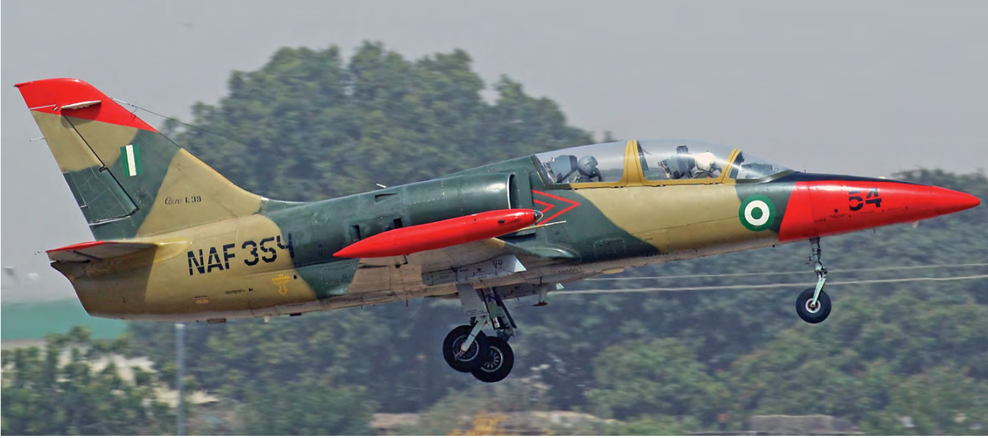
We don't see many photographs of African country's air force jets in their natural habitat but Teemu Tuuri was able to capture this Aero L-39ZA of the local 403 FTS (Flying Training School), serial NAF354 at Kano/Mallam Aminu on 23 February 2021.