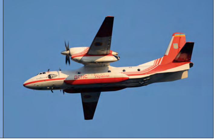
Another Antonov used by DSPS is this fire fighting An-32P, "31" black. With its high visibility white and red colours it forms a nice contrast to all the (digital) grey. (Erwin van Dijkman)