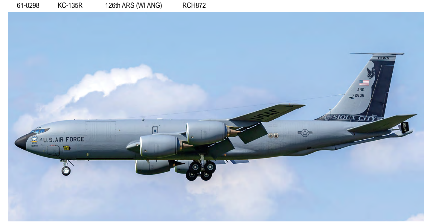
Starting 9 August 2021, the 174th Air Refueling Squadron/Iowa Air National Guard deployed two KC-135Rs to Geilenkirchen. 57-2606 was photograpehed on 11 August 2021.