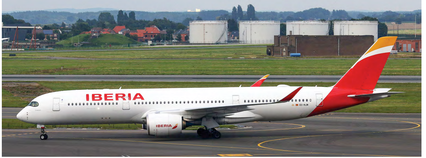
Iberia widebody aircraft do not often visit Brussels, but if they do it is mostly an Airbus A330. A350-941 EC-NJM was caught on camera by Paul Sanders when it operated a cargo flight to Brussels on 4 August 2021.