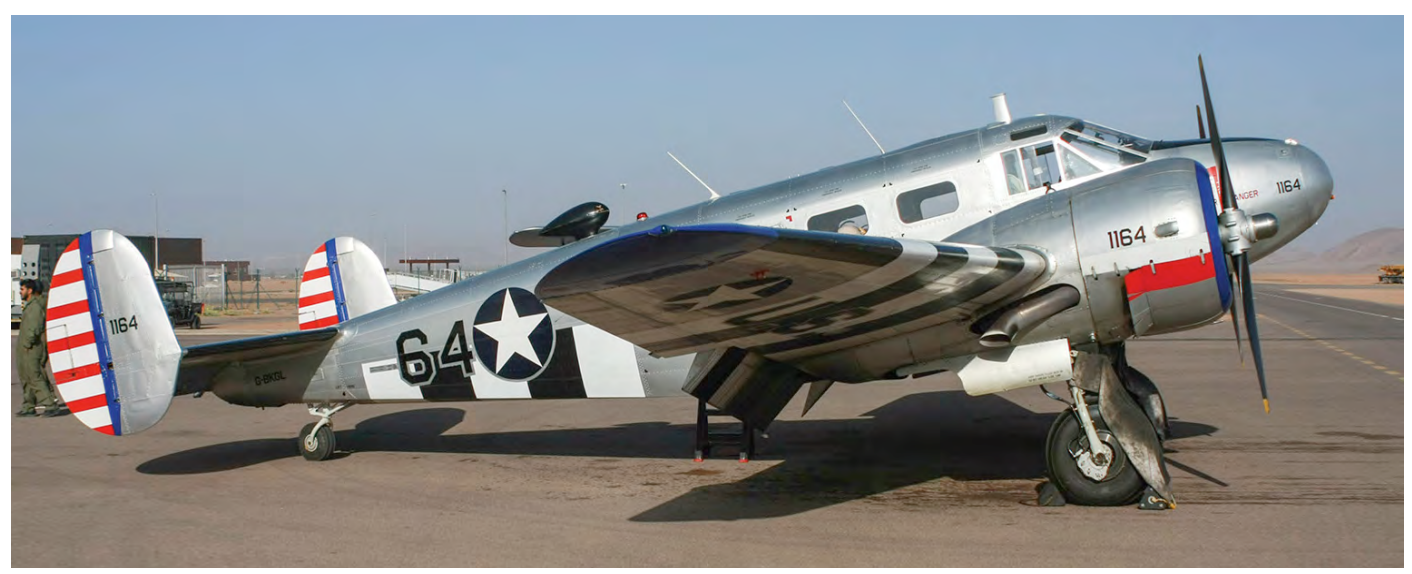
Twin Beech 3TM G-BKGL was leased to the Royal Commission of Al Ula, in 2019. This was to perform pleasure flights and be part of an air show during the "Winter at Tantora"- cultural festival in Al-Ula, Saudi Arabia. The festival ran from November 2019 until March 2020. Days after the festival ended, the COVID virus triggered the Saudi government to prohibit all international flights in and out of the Kingdom. The whole fleet of warbirds was parked inside the small hangar that was constructed for the temporary operation. By early 2021, when international travel was slowly beginning to resume, the fleet was to be returned to the UK. During the ferry back the Twin Beech encountered problems in Croatia and Corsica. After fixing an engine problem in Bastia, Corsica, the Beech 18 crashed shortly after take-off. This photo was taken after a pleasure flight over the Saudi desert town of Al Ula, during the final week of the festival. It must have been one of the last flights of this wonderful airplane. (Al Ula, 5 March 2020)