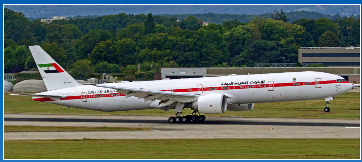
Three different widebodies from the Abu Dhabi Presidential Flight are the theme of this cover. We kick-off with the largest one. Boeing 777-300ER BBJ A6-SIL. Delivered at Abu Dhabi in January 2011.