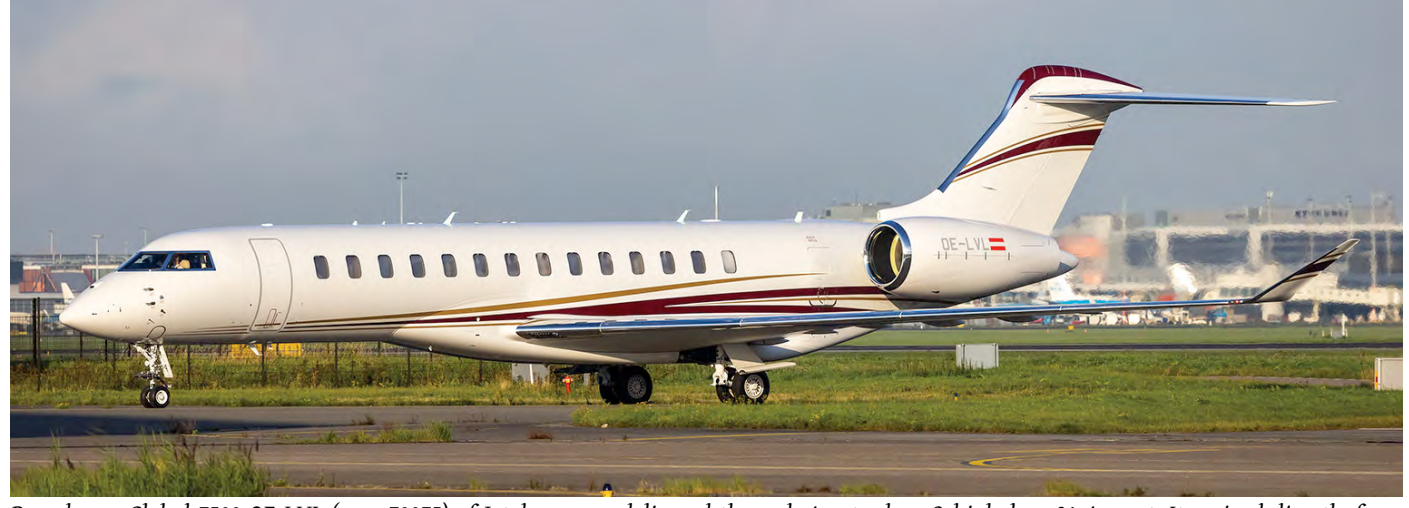
Brand-new Global 7500 OE-LVL (msn 70075) of Jetology, was delivered through Amsterdam-Schiphol on 31 August. It arrived directly from Montreal-Trudeau (Que.) in the morning.