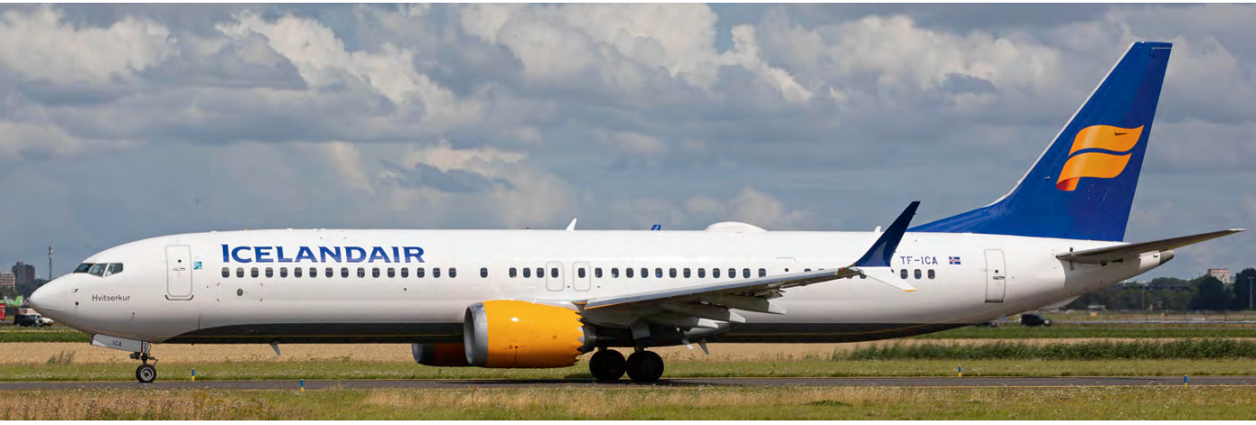
Although delivered to Icelandair in February 2019 Boeing 737-9 paid its first visit to Amsterdam - Schiphol on 2 August 2021.