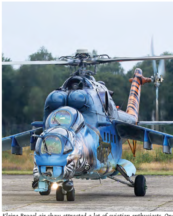
Kleine Brogel air show attracted a lot of aviation enthusiasts. One of the special painted aircraft was this Czech Air Force Mi-35 serial 3369. (Kleine Brogel, 11 September 2021, René Verschuur)

If you would like to subscribe to our digital magazine, go to www.pocketmags.com and search for "Scramble"