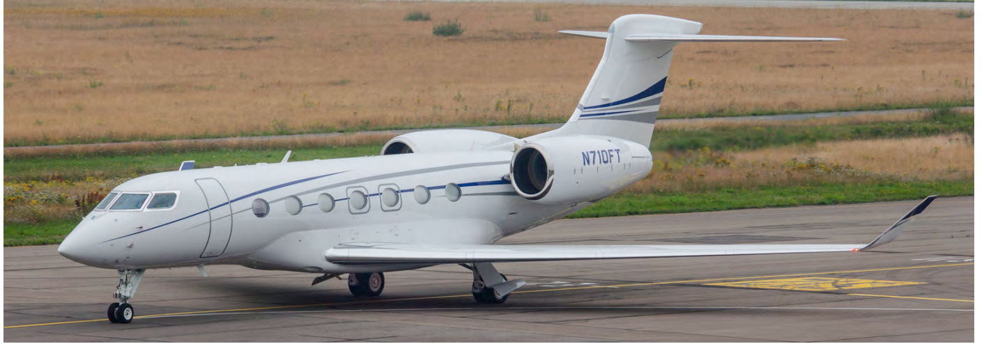
Previously operated by EJS Aviation Services Gulfstream G500 N710FT is currently being operated by Solairus Aviation. (Eindhoven, 13 July 2021, Luca Neggers)