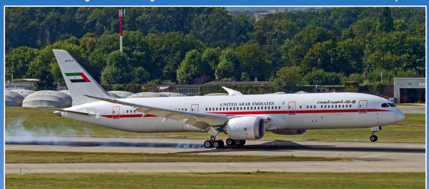
Second is this 787-9 BBJ A6-PFG. Delivered at Abu Dhabi in September 2019.