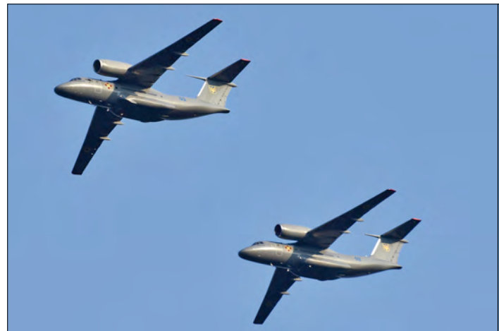
Kyiv houses the Antonov plant at Gostomel. The National Guard and Ministry of Emergency service both use the An-72 as transport. Seen here are "03" and "02" blue of the National Guard.