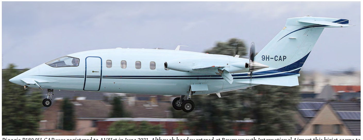
Piaggio P180 9H-CAP was registered to AV8Jet in June 2021. Although headquartered at Bournemouth International Airport this bizjet seems to be based at Rotterdam. (Ostend, 6 August 2021,)