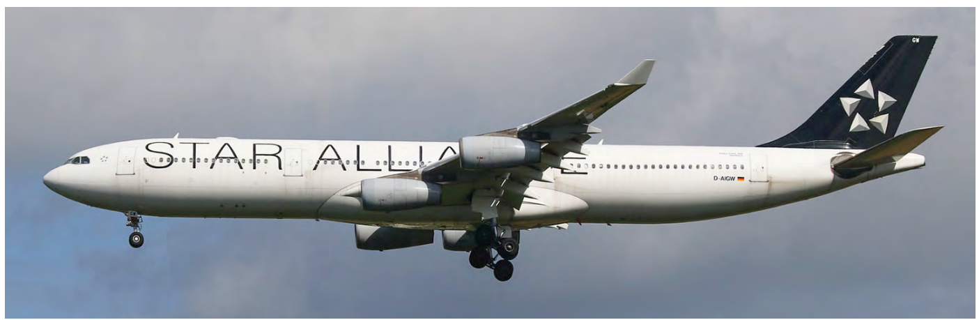
This Airbus A340-313X was delivered to Lufthansa in March 2000. In June 2015 the aircraft was repainted in these Star Alliance colours. D-AIGW has been operated by Lufthansa CityLine since November 2015. (Brussels, 7 August 2021,)