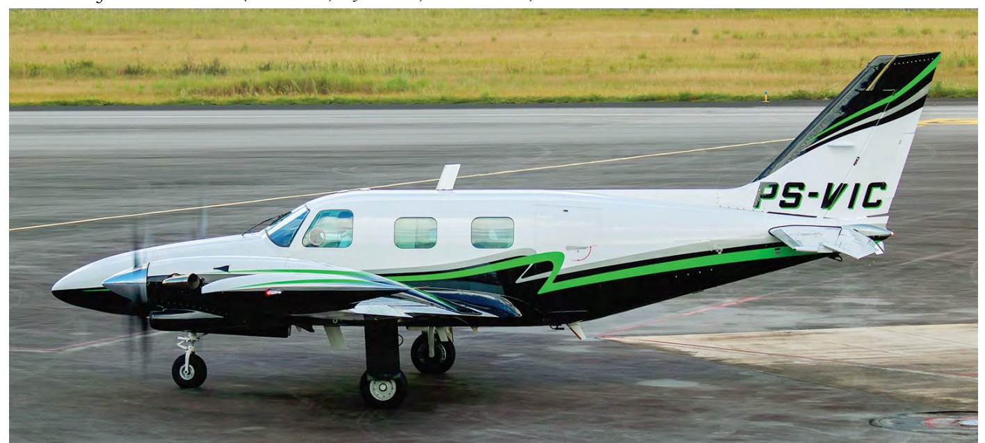
This Piper PA-31T1 was acquired by Vitoria Trading in May 2021. The aircraft was officially transferred to the Brasilian register on 14 June 2021. Vitoria Trading offers detailed knowledge and import experience for raw materials, industrial and consumer goods, food exports and most other diverse products. (Paramaribo, 29 June 2021,)