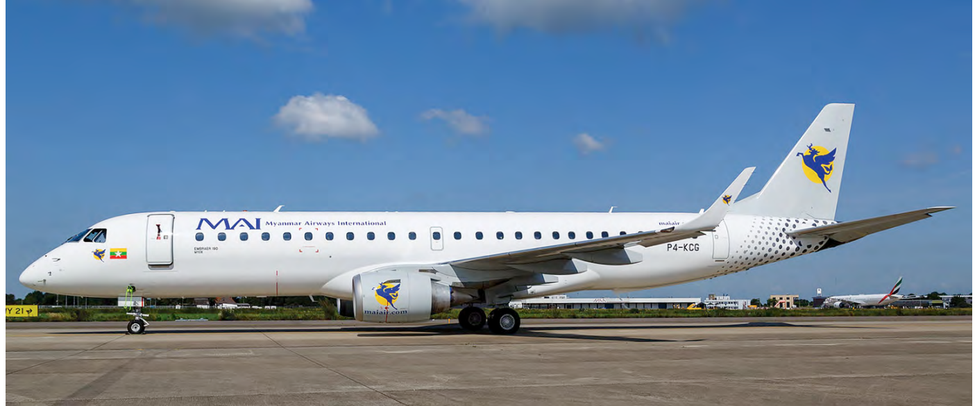
For nine years, between April 2011 and April 2020, Air Astana operated a fleet of nine Embraer ERJ190s. P4-KCG was one of them and was withdrawn from use in March 2020. In December 2020, the aircraft was ferried to Maastricht for storage. This summer a new operator for this aircraft was found and in the near future it will be delivered to Myanmar Airways International. The aircraft is seen here still wearing its old Kazakhstan registration, but already in full Myanmar colours. It will become the third ERJ190 in Myanmar's fleet once delivered. (24 August 2021,)