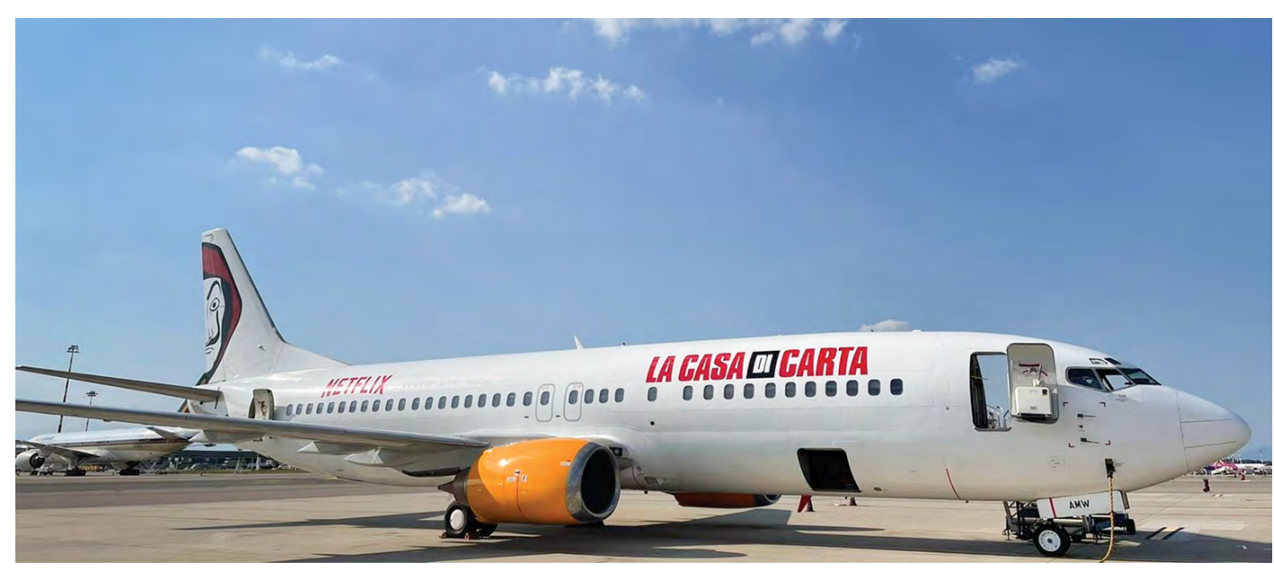
Maltese / Spanish airline Air Horizont had one of its Boeing 737-400s painted as a Netflix logo jet for less than 72 hours, early September. The aircraft, registered 9H-AMW, was adorned in this special livery to promote the fifth season of La casa di carta (La casa de papel). Among English-speaking Netflix aficionados this is better known as "Money Heist". The aircraft only flew in these colours for promotional purposes from Genoa Airport in Italy, with just over 100 guests onboard the 168-seat aircraft. The VIPs were then given an exclusive preview of the fifth season, while overflying the Tyrrhenian Sea from Genoa and back. The Boeing airliner usually conducts a number of charters on behalf of Italian tour operators from Milan. (Genoa, 3 September 2021, Chris Chauci)

will add B777-200EFs (EF stands for Express Freighter), B777-200EREFs and B777-300EFs to the fleet that will be converted to fully utilize "the entire volume of the main deck cabin to hold low-density, express freight cargo". Eastern hopes to receive the STC by the end of this year and operate its first Express Freighter in the first quarter of next year. The airline will offer general cargo sales, cargo charters, ACMI/wet-leasing and dry leasing. Currently, Eastern has three B777-200ERs in its fleet, all of them parked. Next to these it also has three B767-200s, one B767-200ER and five B767-300ERs.