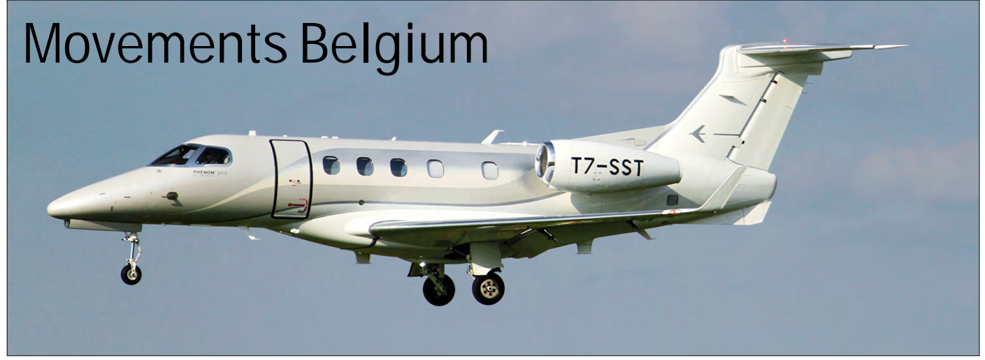
Titan Aviation San Marino was founded in 2017 as a subsidiary of Dubai based Titan Aviation. Embraer EMB505 T7-SST was added to the fleet in April 2021.