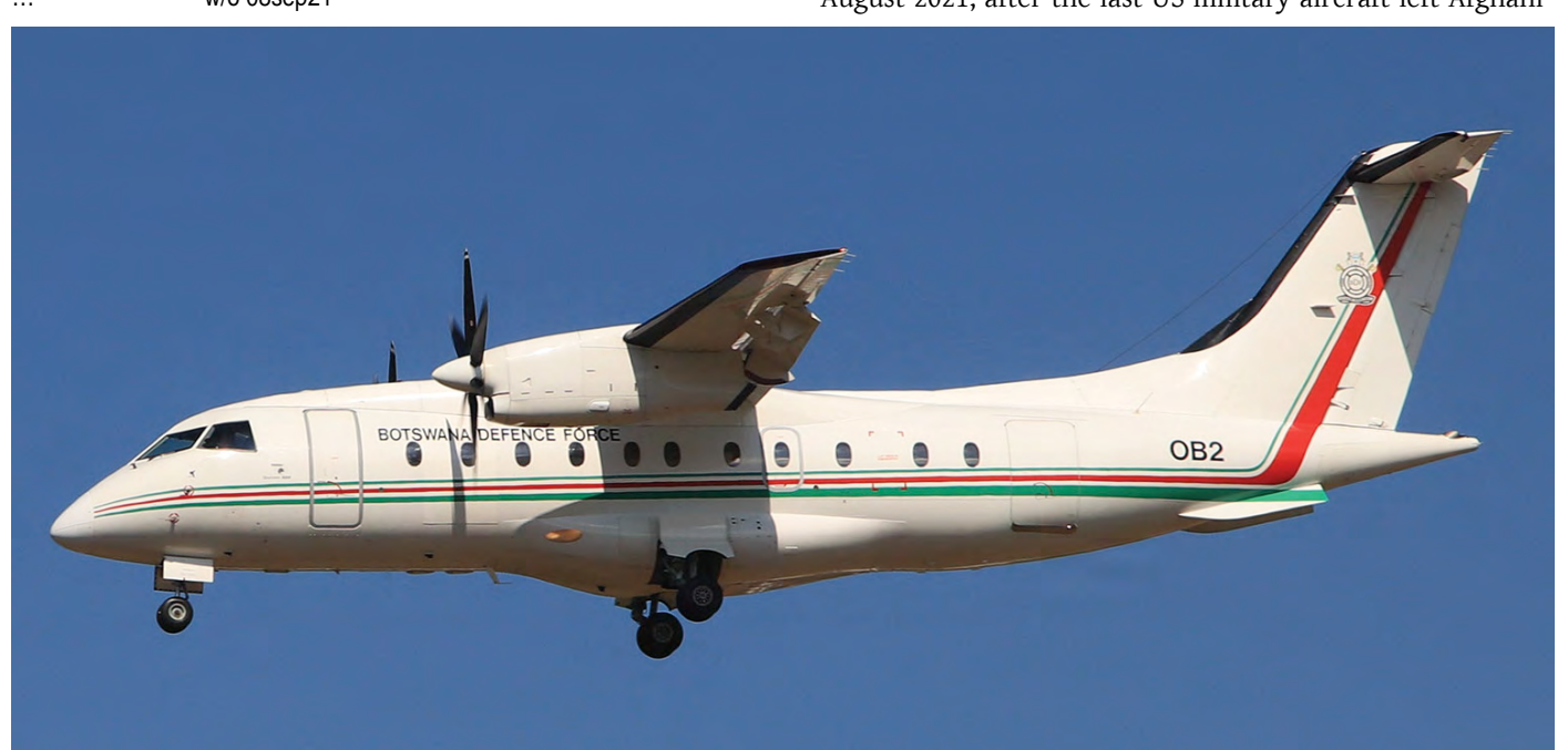
The Botswana Defence Force brought its Dornier 328 OB2 to Oberpfaffenhofen for maintenance. Felix Lutz photographed it in landing configuration on 4 September 2021.

With the withdrawal of US and Coalition Forces from Kabul International Airport, a large number of Afghan Air Force aircraft and helicopters were disabled by the US military. On 31 August 2021, after the last US military aircraft left Afghani-