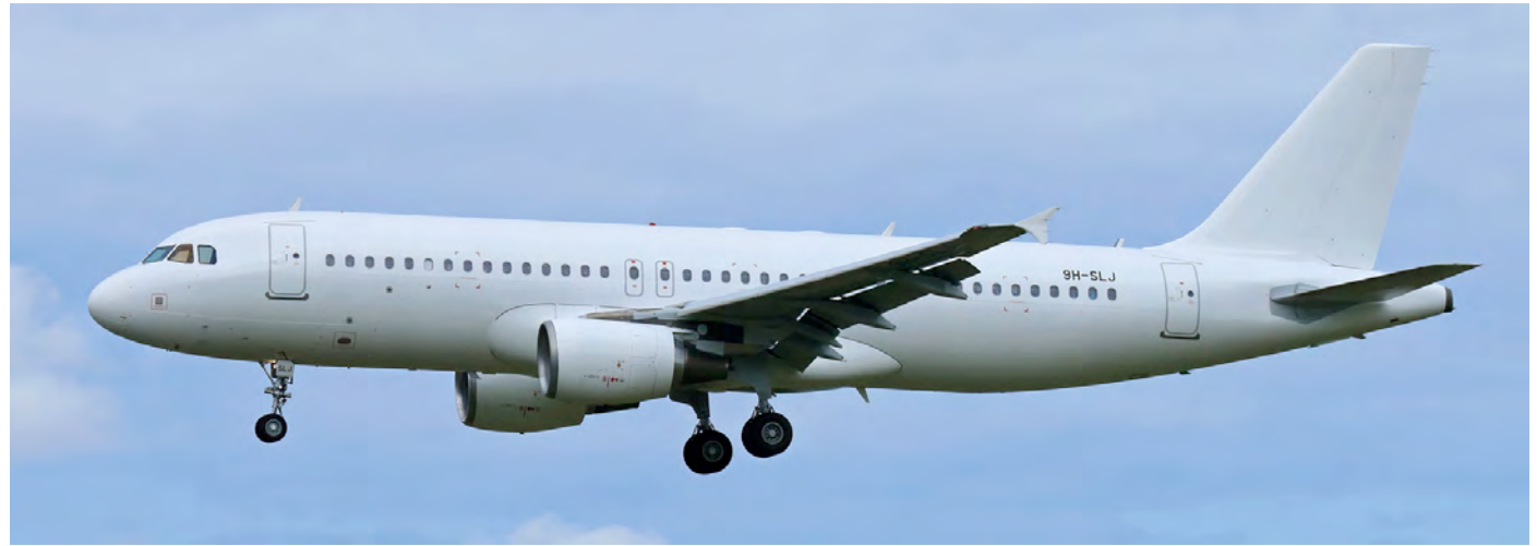
This former S7 Airlines A320 is a very recent addition to the SmartLynx Malta fleet. Airbus 9H-SLJ has been leased to TUI Netherlands for this summer. (Rotterdam - The Hague, 2 August 2021, Cor Mout)