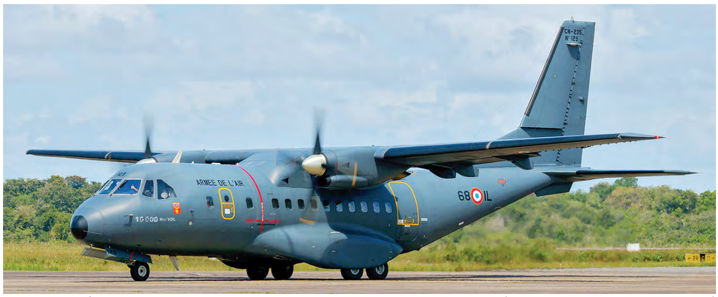
CN235M-200 129/68-IL is currently based in French Guiana. The CASA is being operated by ET01.062. (Paramaribo, 29 June 2021, Andrew Muller)