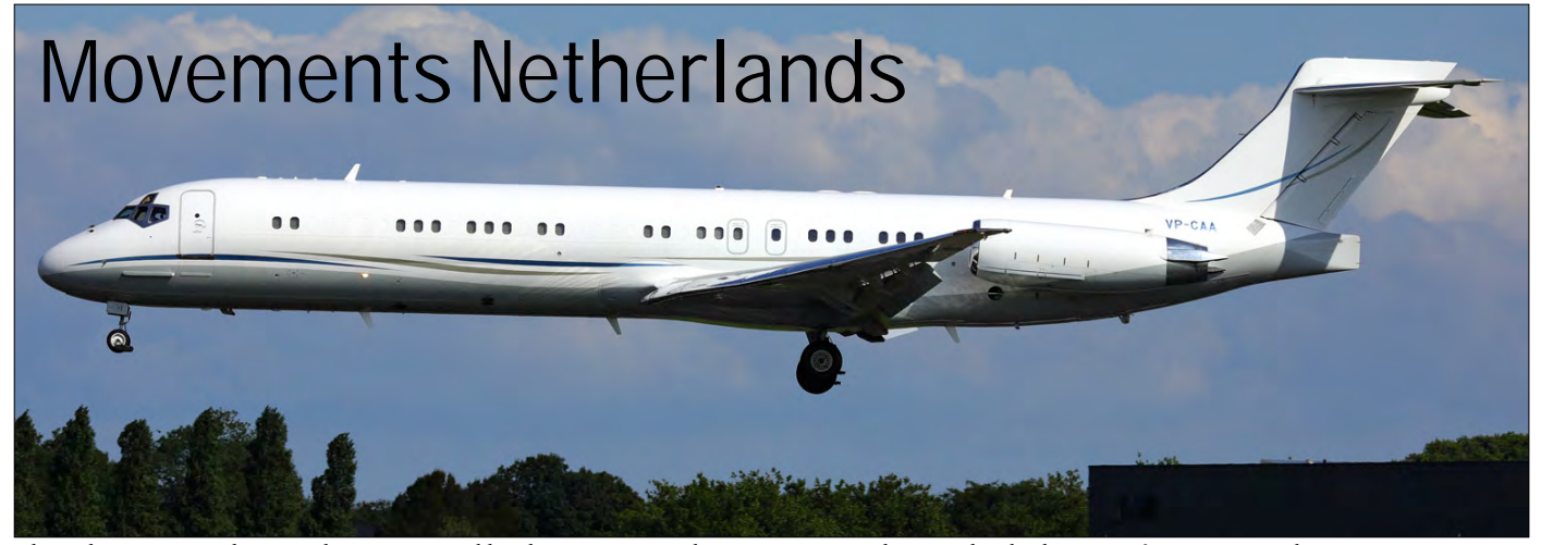
The only commercial service being operated by this MD-87 was during its time with Aero Lloyd. The aircraft was operated in a corporate capacity since it let the fleet of the German airline. Since March 2020 it has been operated as VP-CAA by a company called Augusta Aviation (Cayman). (Amsterdam - Schiphol, 24 August 2021,)