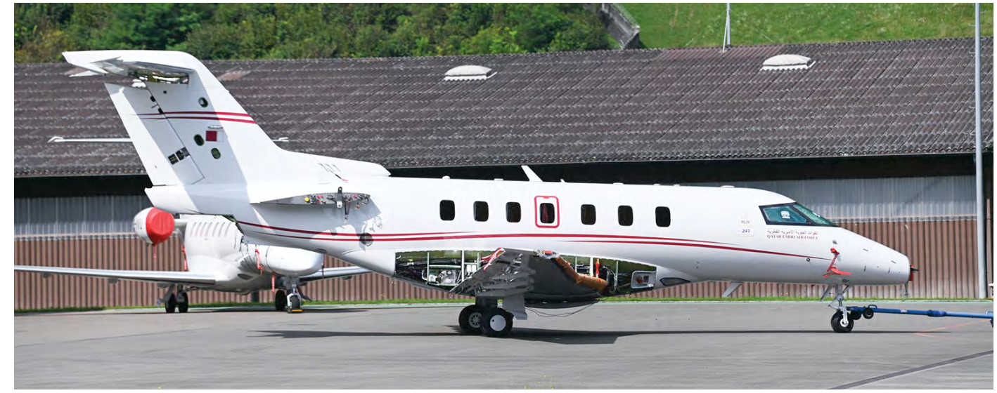
In 2020 the Qatar Emiri Air Force ordered two PC-24s. The first one was noted outside at Buochs on 15 September 2021. The construction number in this case is 247. (Stephan Widmer)

21-035 LockheedMartin not yet noted AW-35 21-036 LockheedMartin f/n Ft. Worth, TX AW-36 aug21