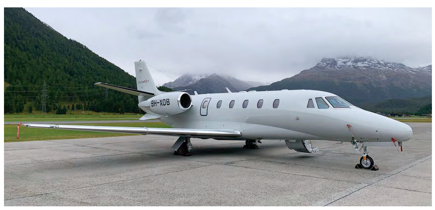
The first Cessna Citation 560XLS for VistaJet has been outfitted in Malta and has commenced flying. Registration is 9H-XOB (msn 560-5621), formerly known as NetJets Europe CS-DXI. (Samedan, 20 September 2021)