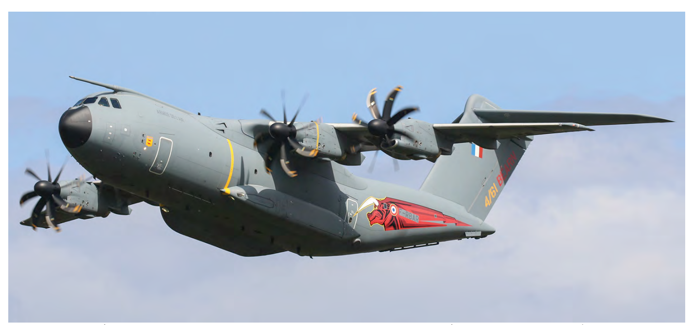
Airbus A400M 0110/F-RBAM received extra markings to commemorate the forming of unit 4/61 Bearn at Orléans-Bricy. (28 August 2021, Otger van der Kooij)