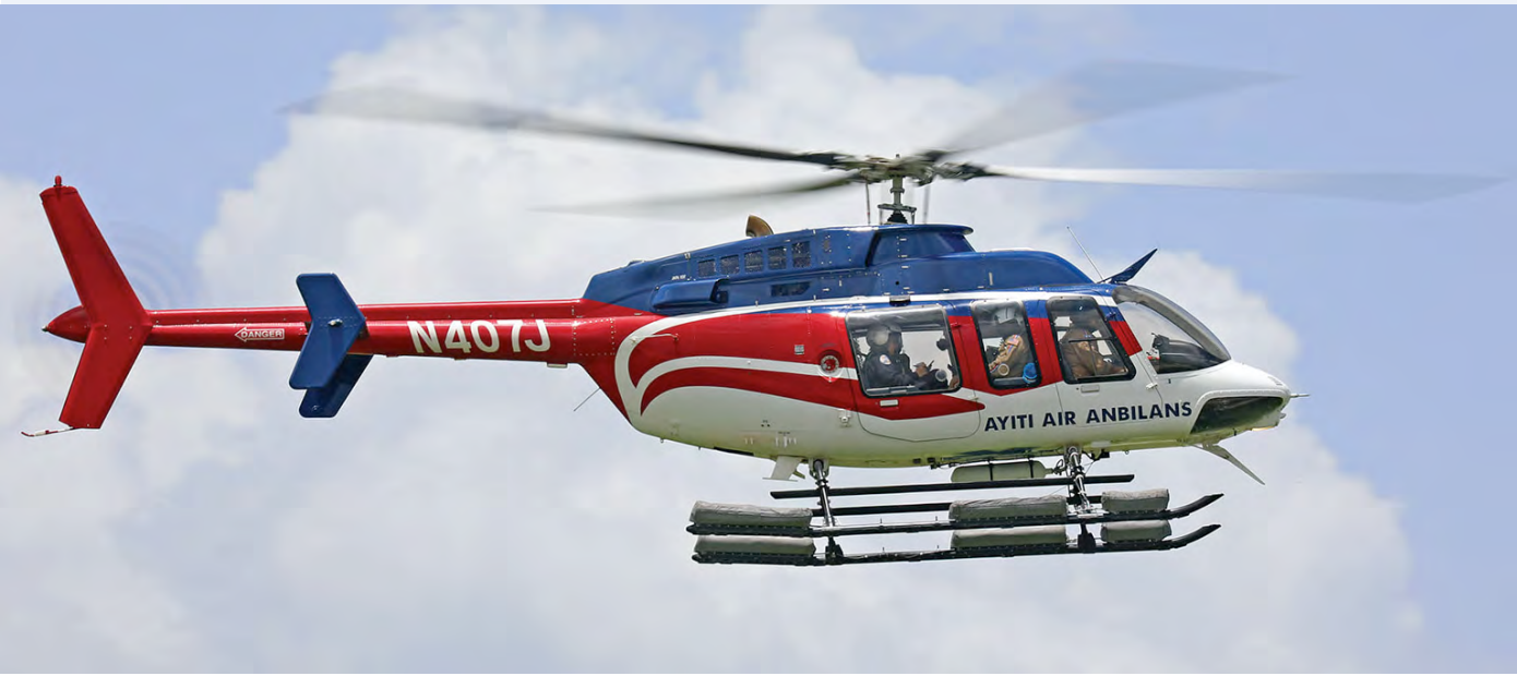
Bell 407 N407J is being used by the Ayiti Air Anbilans (Haiti Air Ambulance). (Port-au-Prince, 20 August 21, Larry Every)

On 14 August 2021 at 08:29:09 EDT, a magnitude 7.2 earthquake struck the Tiburon Peninsula in the Caribbean nation of Haiti. It had a 10-kilometre-deep hypocenter near Petit-Trou-de-Nippes, approximately 150 kilometres west of the capital, Port-au-Prince. The following photos were taken in the aftermath of this event.