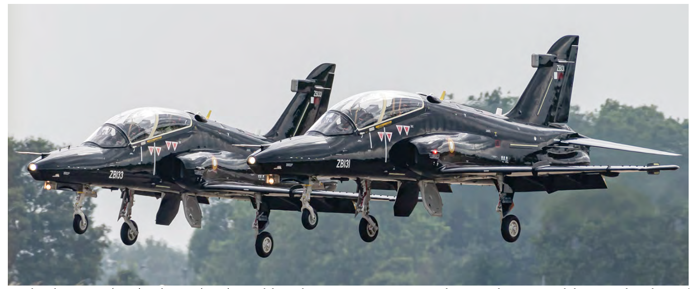
Hawks Mk167 ZB131 (QA01) and ZB133 (QA03) were delivered to RAF Leeming on 1 September 2021. The jets carried the national markings of Qatar but not the Qatari serials. These two are the first of 9 new built jets to be delivered to the new squadron being set up at RAF Leeming to deliver fast jet training to QEAF. (Martin Fox)