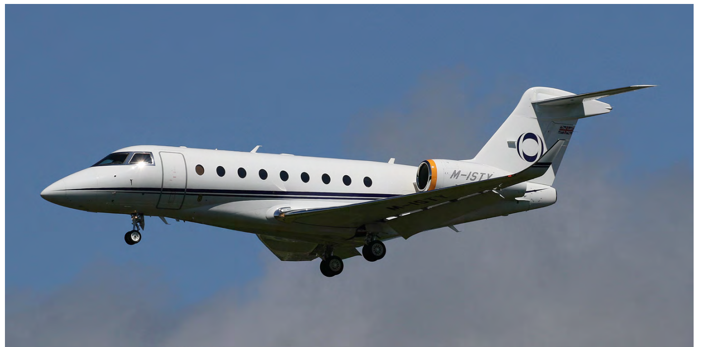
INEOS Aviation Gulfstream 280 M-ISTY suffered a hard landing at Genève-Cointrin's runway 22, on 23 June 2021, and was last seen in September, not having flown since, with its registration, logo and country flag taped over. That must have been a really hard landing for it be AOG (Aircraft On Ground) for so long! (Geneva, 29 May 2018,)

As a result of low visibility (brown out conditions), a Super Puma of Babcock MCS Spain crashed into a tree near Sierra Bermeja, Malaga, during take-off. The nineteen occupants were not injured. The helicopter was operated on behalf of the Servicio de Extinción de Incendios Forestales de Andalucía (INFOCA). It was attempting to fight the fire raging in the Sierra Bermeja.