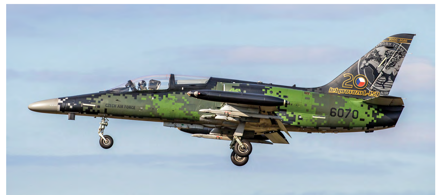
Kecskemét also got a visit from L-159A 6070 of the Czech Air Force's Cáslav's based 212.lt. It is painted in a special colour scheme, commemorating twenty years of Let 159 operations. (27 August 2021,)