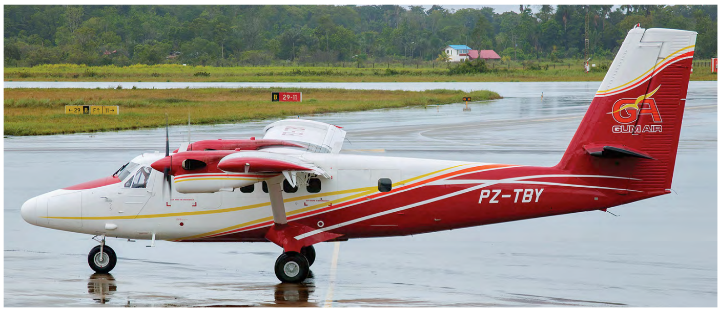
Delivered to Desert Sand Aircraft in November 1979 as N7015A, she was immediately leased Surinam Airways as PZ-TCD until 2005. The DHC-6-300 has been in service with Gum Air, Surinam as PZ-TBY since 2006. Around February 2021 the aircraft received this fresh coat of paint at National Aerotech in Thomaston (GA). (Paramaribo, 11 May 2021,)