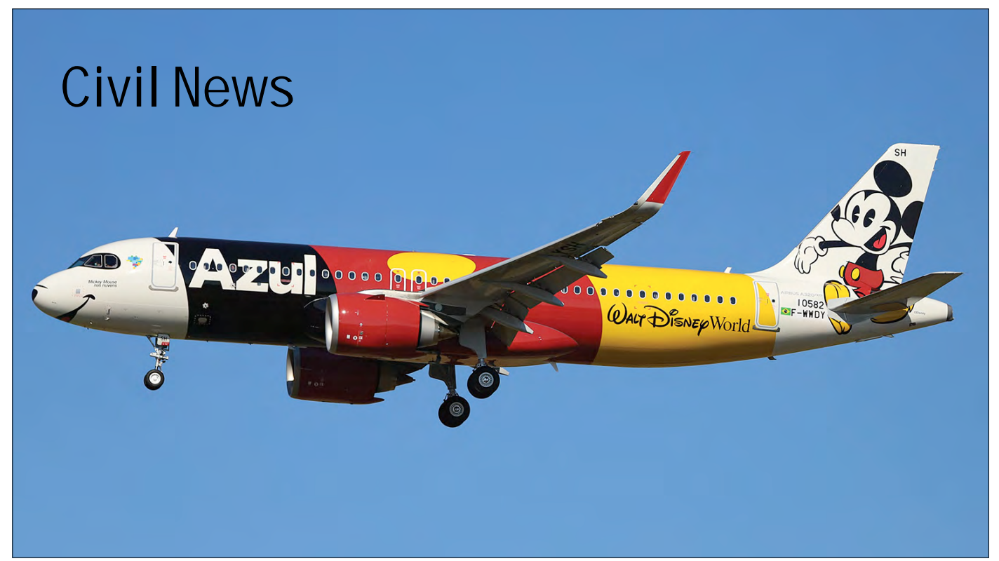
Azul's latest Airbus A320neo is painted in a special Mickey Mouse livery to support Disney World in Florida. Msn 10582 is seen here during a test flight, still wearing test registration F-WWDY. It was delivered to Brazil on 21 September, and is now registered as PR-YSH. (Toulouse-Blagnac, 31 August 2021, Nik Deblaauwe)