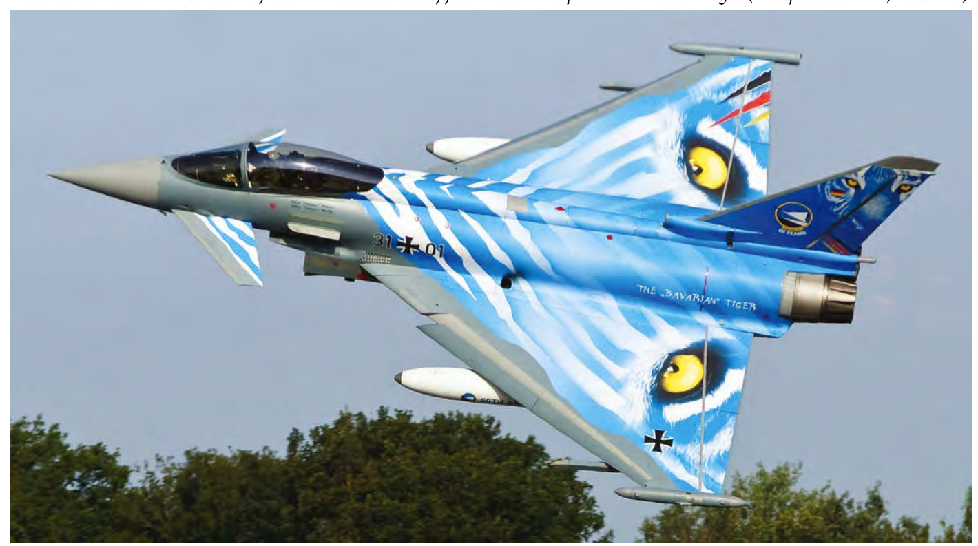
Right time, right place. The Bavarian Tiger showed its eyes to his colleagues at the ground and of course to the public. (Kleine Brogel, 13 September 2021,)