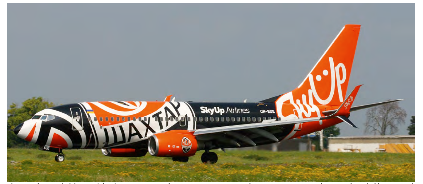
SkyUp Airlines took delivery of this former Xiamen Airlines Boeing 737-700 in April 2019. UR-SQE is painted in special FC Shakhtar Donetsk colours. (Maastricht - Aachen, 4 August 2021, Guido Wolfs)