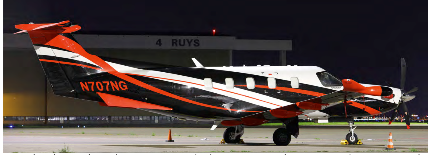
Former Pilatus Flugzeugwerke PC-12/47NGX HB-FSV was transferred to its US counterpart Pilatus Business Aircraft as N707NG in September 2020. (Amsterdam - Schiphol, 10 August 2021,)