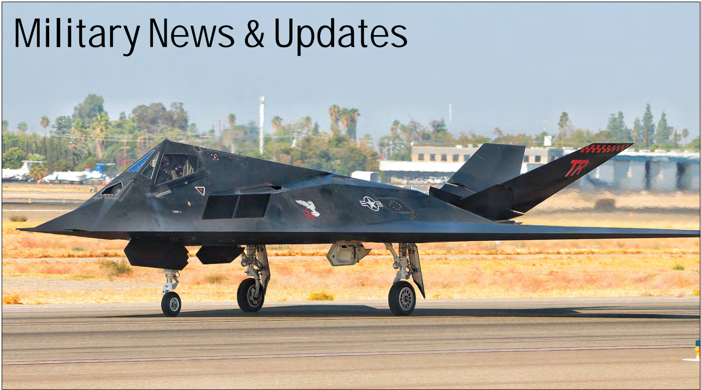
Misael Ocasio photographed some F-117 action at Fresno-Yosemite International (CA) on 16 September 2021. Two aircraft, serials 84-0811 and 88-0841, flew missions with the local F-15 unit.

Because of our standardization we sometimes use type, unit and serial presentations that may strongly differ from those used by the manufacturer or user. It is therefore possible that the information sent by you can deviate from the information we publish.