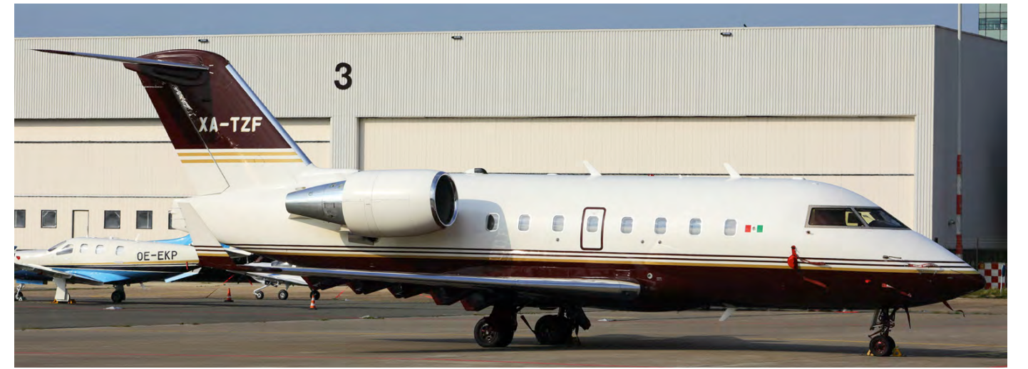
while the jet was parked at Schiphol-East on 12 August 2021. XA-TZF is being operated by Aero Tomza.