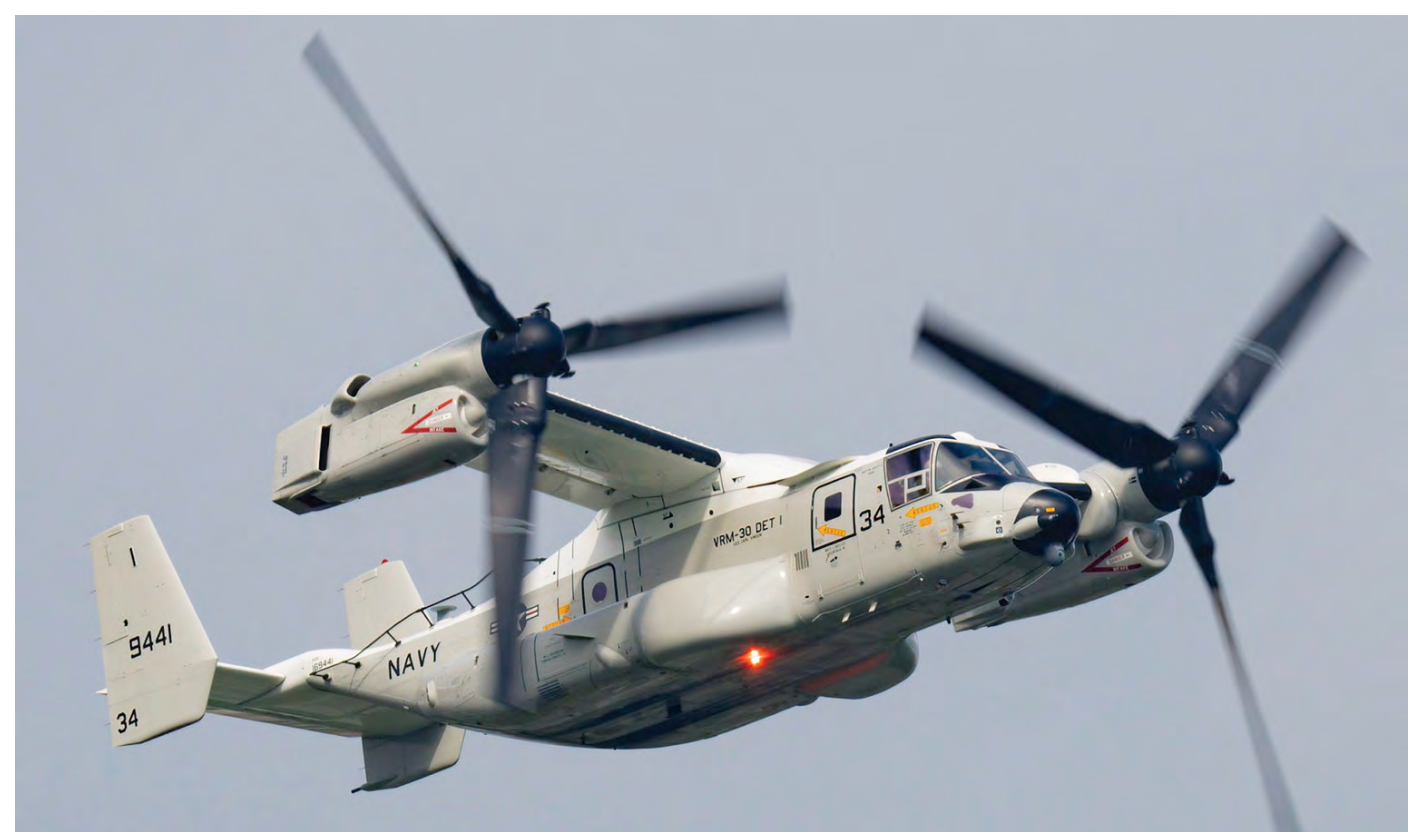
On the maiden deployment of the type onto the USS Carl Vinson, CMV-22B 169441 made a surprise visit to Singapore. Ground time was about one hour after which she went off towards the South China Sea.

Scramble assesses the Kuwaiti Super Hornets are currently at Naval Air Weapons Station (NAWS) China Lake in California for training but we would like to see confirmation of that. Over half of the new Hornets have not been reported yet. Regarding the construction number above, a close-up picture of F/A-18F serial 884 revealed KAF/F-04 on the nosewheel link. Obviously just a sequential number.