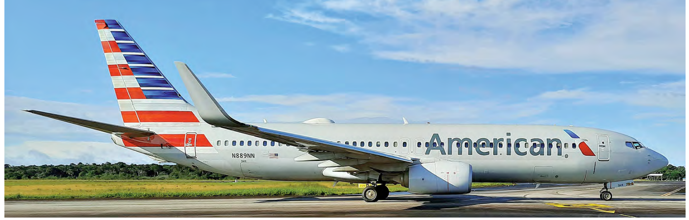
Boeing 737-823 N889NN was delivered to American Airlines on 3 April 2012. (Paramaribo, 30 June 2021,)