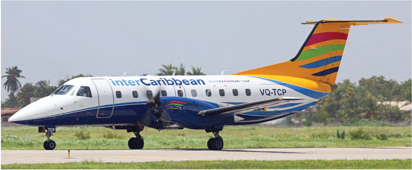
Former SkyWest Airlines (United Express) EMB120ER VQ-TCP was acquired by InterCaribbean Airways in November 2020. (Port-au-Prince, 20 August 21,)