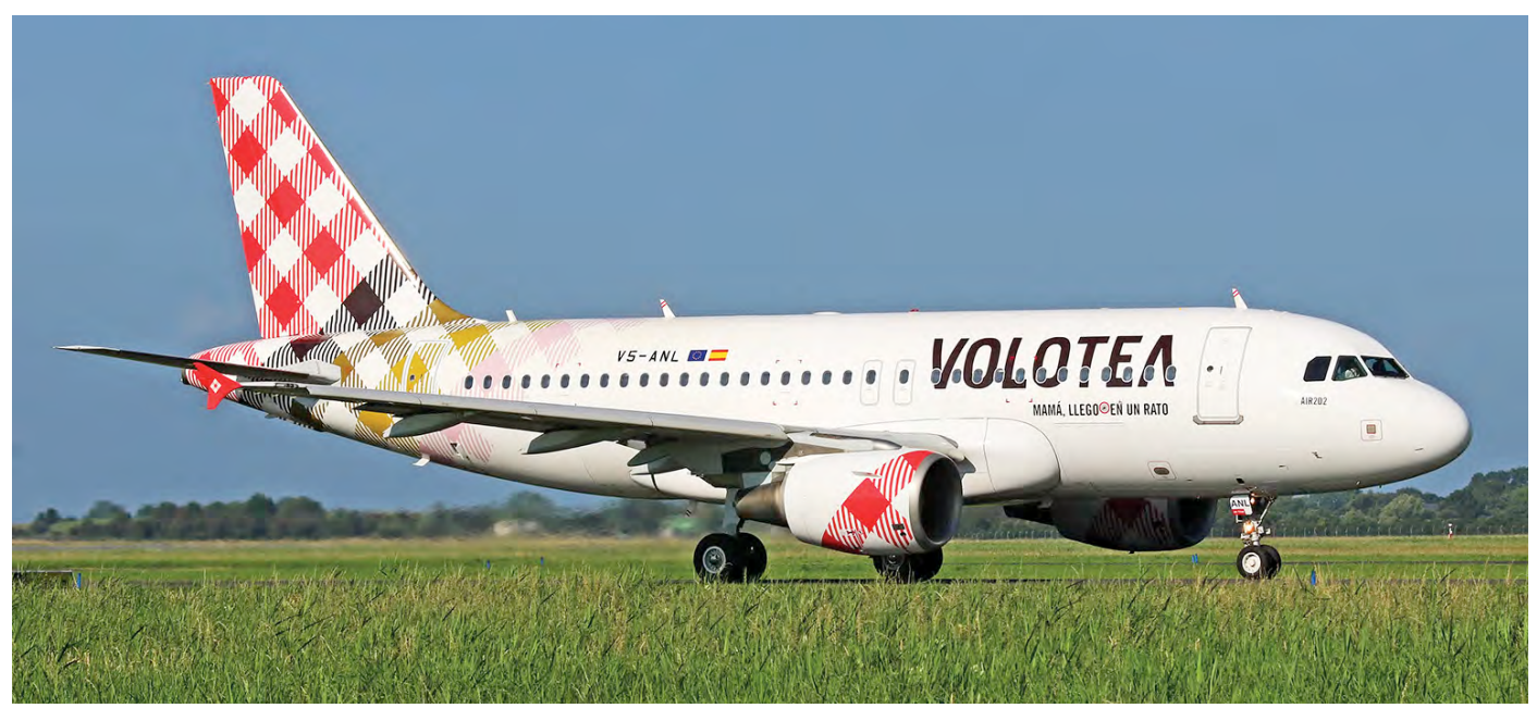
This ex-Air Namibia Airbus A319 V5-ANL is seen here taxiing out at Shannon for a flight to Ciudad Real, where it would be placed in storage. The aircraft was supposed to go to Volotea as EC-NHQ, but in the end it was not taken up by the Spanish carrier. So, the shiny Volotea colours on this aircraft are in fact a waste of paint. (25 August 2021, Malcolm Nason)

its flights in 1991 as Air Dolomiti. Its first aircraft was the DHC-8-300 of which they operated three. Over the years, the airline also operated sixteen ATR42s, thirteen ATR72s, five CRJ200s, one BAe146-200, five BAe146-300s and two Fokker 100s. In January 1999, Lufthansa acquired 26% of the airline, increasing this to 52% in April 2003 and to 100% in July 2003.