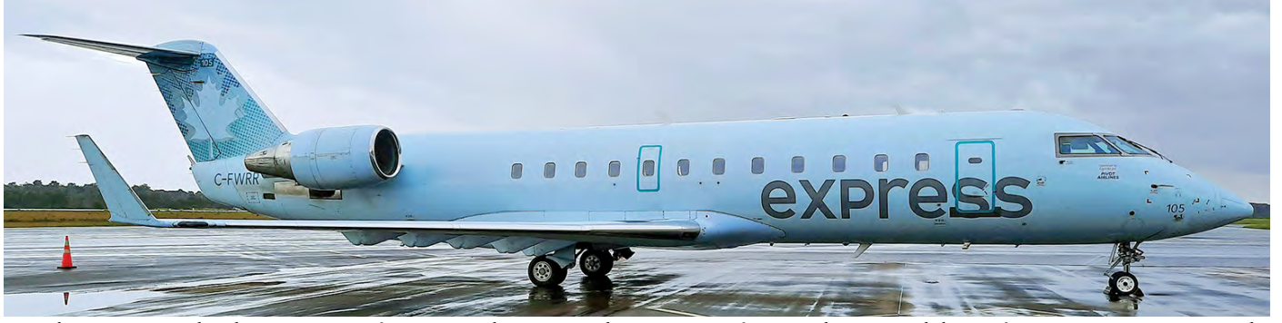
Canadairjet C-FWRR has been operating for Air Canada since April 1996 in some form until it was withdrawn from use in January 2020. The CRJ100ER was acquired by Pivot Airlines in August 2020. Pivot Airlines is a regional and charter airline based in Toronto, Canada. It is owned by Calgary, Albert based private equity firm Binder Capital Corporation.

Not many visitors due to the Corona pandemic still heavily impacting Surinam. Air Belgium kept operating for SLM. The Terraquest Beech operated quite some flights in May. The Zimex on the 11th did some ILS testing. It operates for Aerologistics Suriname, all white.