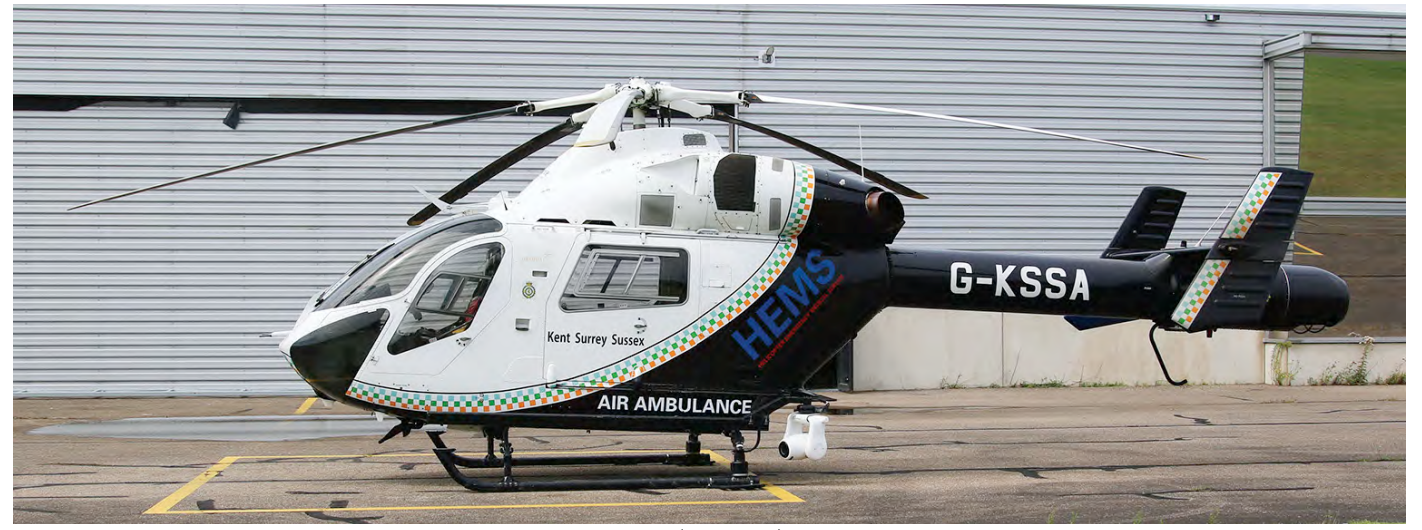
This MD900 was operated by California Shock Trauma Air Rescue (CALSTAR) as N902CS from 2008 till 2012 when it was exported to the UK. Specialist Aviation Services became the operator as G-KSSA with 'KSSA' referring to the Air Ambulance Kent Surrey Sussex. (Genk-Zwartberg, 13 August 2021,)