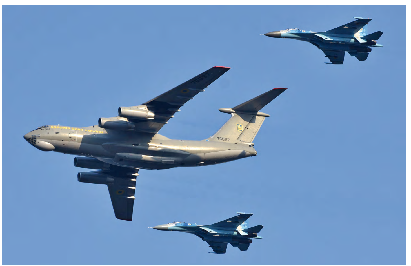
Two of the six Su-27 that participated "21" and "48" blue, escorted Il-76MD 76697. This is not a tanker but one of a few survivors of the huge transport regiment based at Melitopol. (Wim Sonneveld)