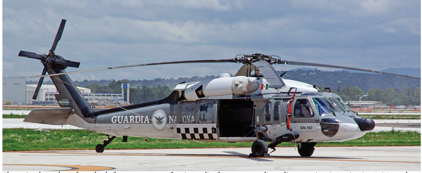
The national guard was formed only few years ago out of various police forces to streamline police operations in Mexico. S-70A GN-107 shows the stunning colours applied by the national guard, after the take-over of this helicopter from the federal police.