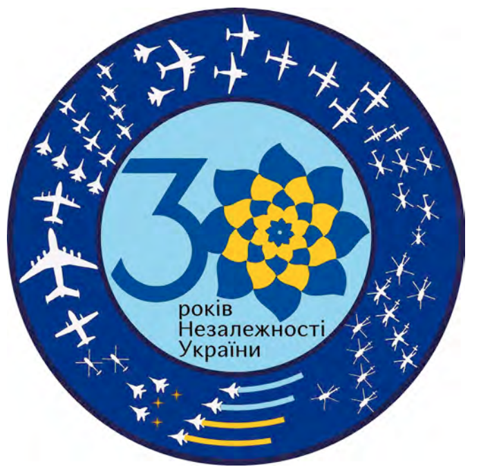
The parade badge shows all participants and the 30 year logo.

Independence Day is celebrated as a national holiday in Ukraine on 24 August, sometimes with a military parade in Kyiv (Kiev). This year, a huge military parade was held to commemorate the 30th anniversary of independence from the Soviet Union. The independence of Ukraine was proclaimed during that fateful week in August 1991, which saw a coup against the Soviet-leadership, which eventually led to the dissolution of the Soviet Union later that year. Not surprisingly, the parade was held near Independence Square, the aircraft following Hrechatik Street and the Dnepr River from South to North. Smaller events were held in Odessa and nearby, on the Dnepr River in Kyiv, featuring naval forces with air support. Foreign allies were present with aircraft as well, like Poland, Slovakia, the United Kingdom, and the United States. Full dress rehearsals were held on 18, 20 and 22 August, mainly outside business hours to limit disruption of normal live, and traffic, in Kyiv. In the days and weeks leading up to mid-August smaller formations of aircraft could already be seen practising over Kyiv.