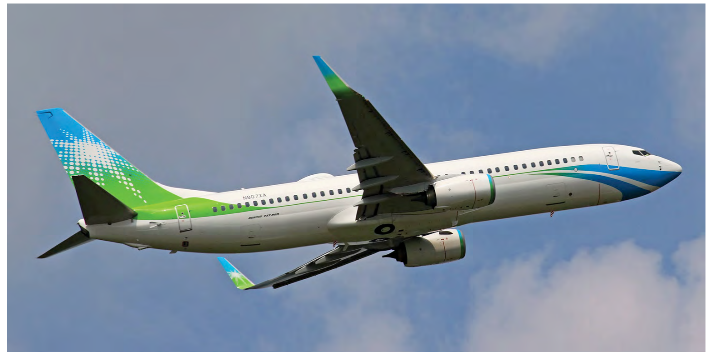
Boeing 737-800 N807XA (msn 63406) is the latest addition to the fleet of Saudi Aramco Aviation. The aircraft was built as one of the last-of-the-line 737-800s early 2018, and delivered to Ukraine International Airlines in March of that same year. Already after two years the aircraft was withdrawn from use by the Ukrainians, in June 2020. After storage at Tallin and Shannon it was delivered to Saudi Aramco Aviation in July 2021. It is the seventh 737-800 in their fleet which besides these 737-800s also consists of one 767-200 as well as helicopters. Saudi Aramco (Saudi Arabian Oil Company) (formerly Arabian-American Oil Company)) is a Saudi Arabian public petroleum and natural gas company based in Dhahran. (Shannon, 23 July 2021, Malcolm Nason)