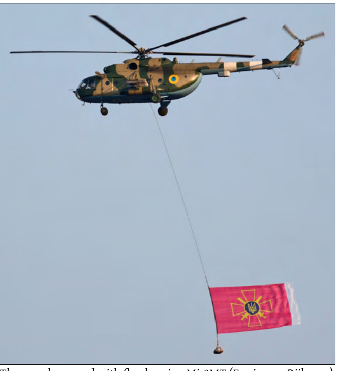
The parade opened with flag bearing Mi-8MT (Erwin van Dijkman) 31 bk An-32P DSNS (Min of Emergencies) Formation 11: 02 bl, 03 bl An-72 ANG (national guard) Formation 12: II-76MD 76697 25 trab 21 bl, 48 bl Su-27S1M 39 brta Formation 13: 16 bl, 32 bl, 36 bl Su-25M1 299 brta Su-25UBM1 63 bl 299 brta Formation 14: 08 wh, 20 wh, 41 wh, 44 wh Su-24M 7 brta Formation 15: 39 bl, 56 bl, 59 bl Su-27P1M 831 brta 67 bl Su-27UBM1 831 brta Formation 16: 02 bl An-70 ANG (national guard) Formation 17: UR-82060 An-225 Antonov DB Formation 18: 7640, 7641 UH-60M vrtulnikove kridlo