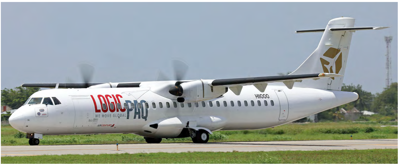
ATR72 HI1000 was delivered to Air Century via Wick in November 2017. Logic Paq is a freight forwarder in the Dominican Republic. (Port-au-Prince, 20 August 21, Larry Every)