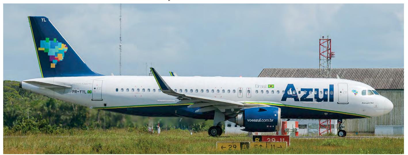
This A320-251N was delivered to AVIANCA Brasil as PR-OBD in October 2016. The aircraft was withdrawn from use in April 2019 prior suspension of flights on 24 May 2019 and the company was officially declared bankrupt on 14 July 2020. Azul Linhas Aéreas Brasileiras took delivery of the Airbus in August 2019 as PR-YYL.