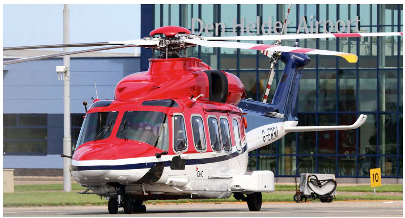
CHC Scotia has ferried this AW189 to Den Helder for offshore operations. G-ERBA was transferred to the Dutch Aircraft register as PH-EUL at the end of August 2021. (Den Helder, 12 August 2021,)

his service. On 31 August the fifth A330 MRTT tanker arrived as Multi70 and one of 298sq latest CH-47Fs made its first visit to the GLV-V prior to delivery at Gilze-Rijen. Wizzair needed some extra capacity, so this month you will notice additional aircraft operating for Wizzair. The first three B737-8-200 for Malta Air also visited Eindhoven this month.