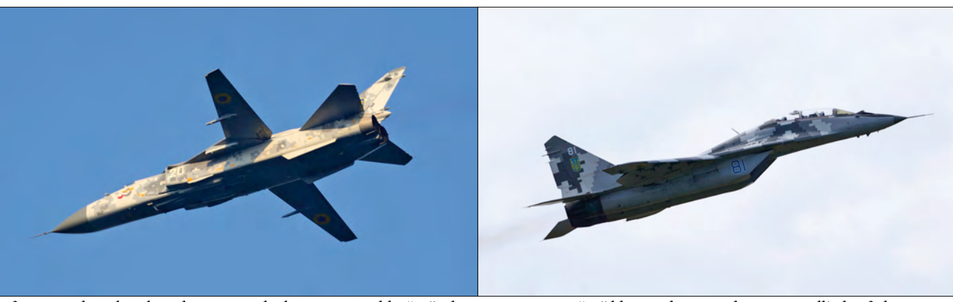
Of course, when that digital grey is applied to a Su-24M, like "20" white, or MiG-29UB, "81" blue, we have no objection at all! The fighters came almost overhead during rehearsal on the 20th. Therefore we went to Vasylkiv the 24th for the MiGs. (Erwin van Dijkman)