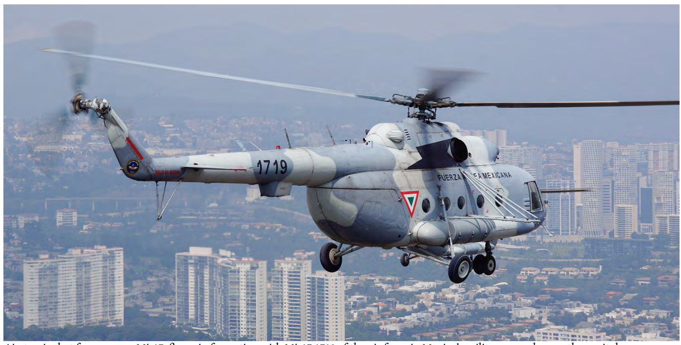
Air-to-air shot from a navy Mi-17, flown in formation with Mi-17 1719 of the air force in Mexico's military parade over the capital.