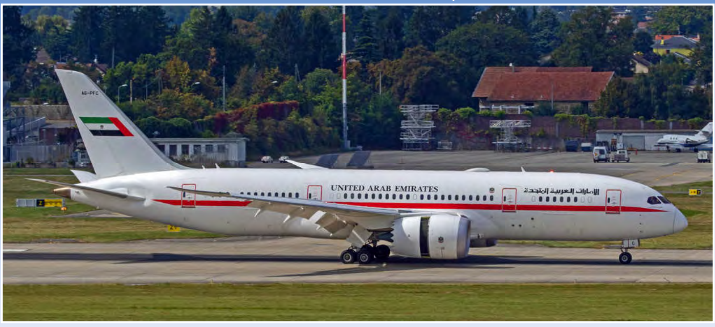
Number three is the smallest one, Boeing 787-8 BBJ. Delivered at Abu Dhabi in January 2014.