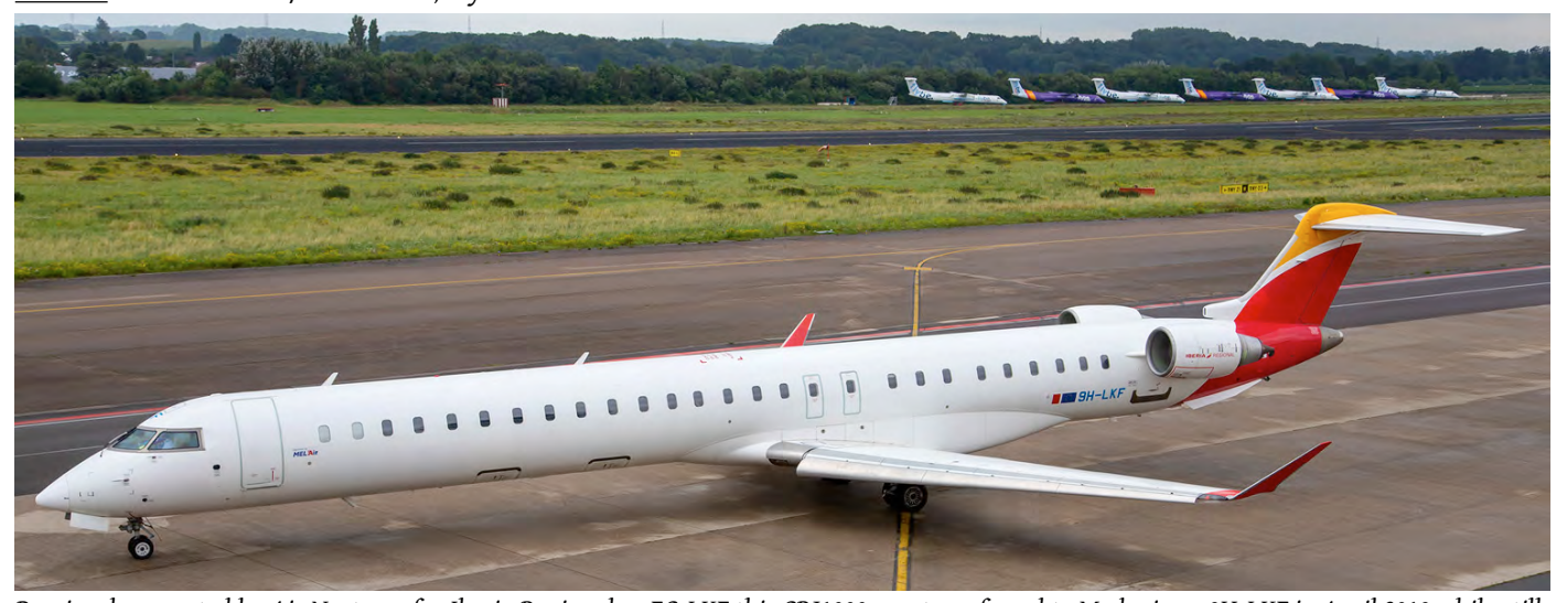
Previously operated by Air Nostrum for Iberia Regional as EC-LKF this CRJ1000 was transferred to Medavia as 9H-LKF in April 2019 while still being operated for Iberia Regional. Recently Medavia was rebranded to Mel Air. (Maastricht - Aachen, 28 August 2021,)