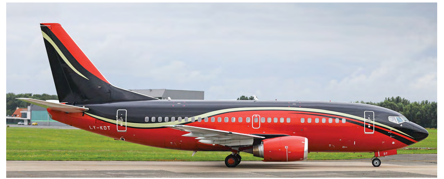
Previously in service with United Airlines, CanJet Airlines and airBaltic this Boeing 737 was added to the KlasJet fleet in December 2018 as LY-KDT. The aircraft was photographed while operting a charter for KAA Gent. (Ostend, 18 August 2021,)