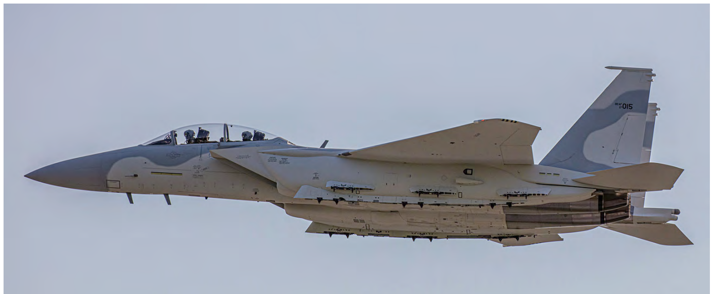
F-15QA QA017 showing the new black serial presentation. See the explanation in the news item in this section. (St. Louis (MO), 10 September 21, Alex Farwell)

The exact variant of the 24 additional aircraft was not revealed, but this might be a mix of single seat and dual seat aircraft.