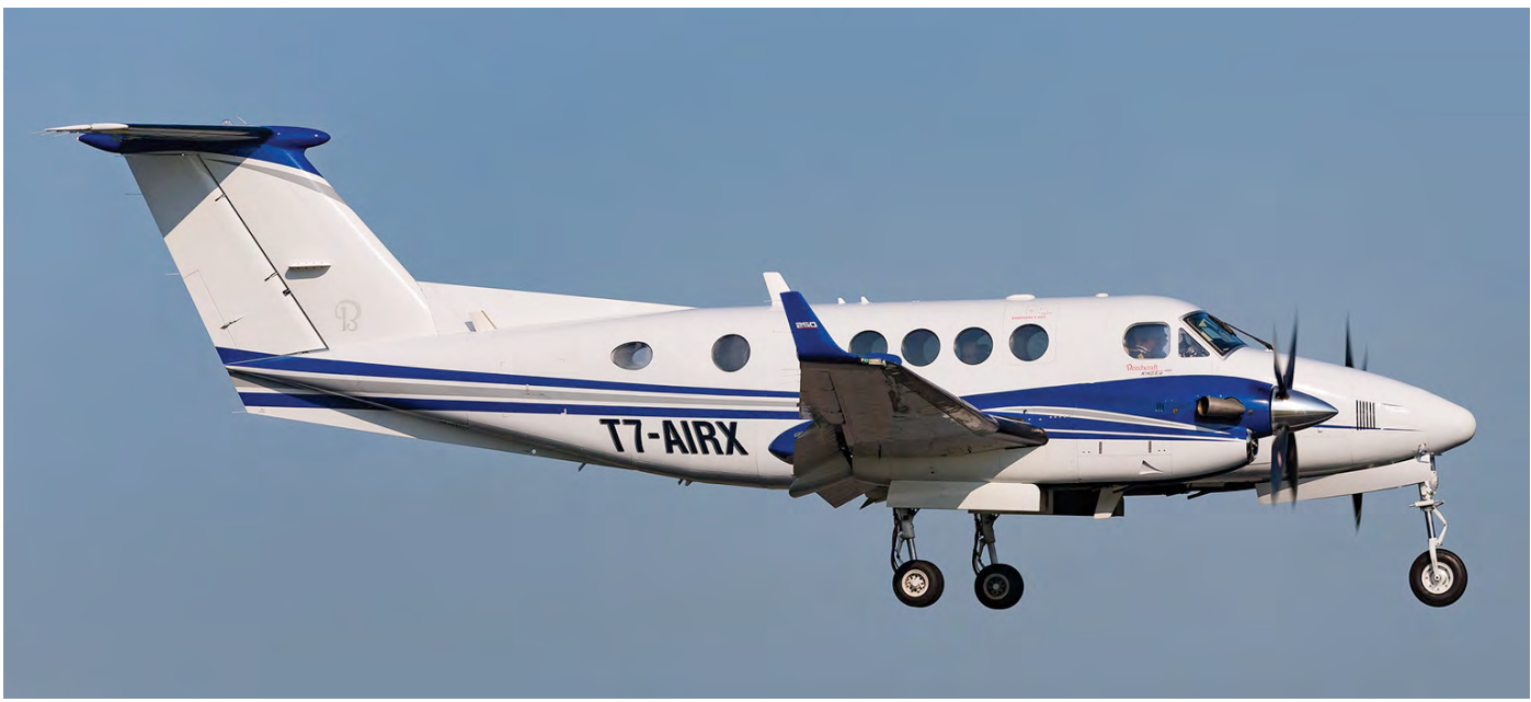
This Beech 250 was added to the San Marino civil aircraft register in December 2020. T7-AIRX seems to be based in Mariehamn, Finland although its operator is still not known. (Liège, 24 August 2021,)