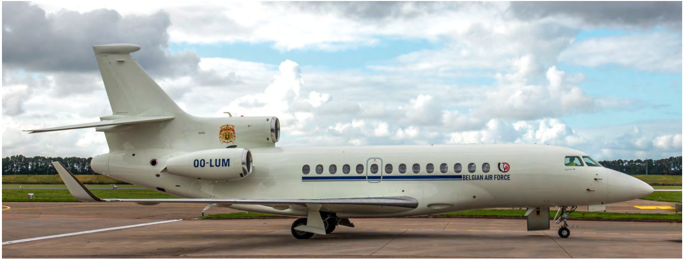
One of the Luxaviation Belgium Falcon 7X bizjets currently operating for the Belgian Air Force finally received its new coat of paint. (Lelystad, 27 August 2021, Richard Poeser)

Woensdrecht movements on the military side show the test flights of NH90 N-327, returning to the skies after a period of storage. A new CH-47F for 298sq was prepared on 24 August and delivered on 31 August. On the civil side a large number of A330 are passing by. Saudi based flynas acquired two former Turkish Airlines A330-300 through Avlon with HZ-NE24 already arriving in full colours on 9 August while HZ-NE25 still arrived as TC-LOK on 27 August. Wamos Air picked up a former Thais AirAsia X A330, arriving in full Wamos colours on 9 August, becoming EC-NOG eventually. Russian carrier Nordwind Airlines took over two ex Jet Airways A330-300s, both sporting a hybrid Jet Airways/Nordwind scheme with VP-BUH departing for Moscow on 9 August as well and 2-VJWU was performing a test flight prior to handover. Flyr