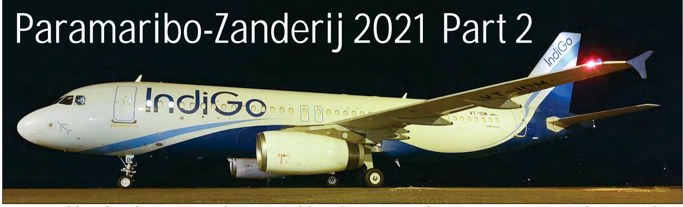
VT-IDM was delivered to IndiGo in June 2015. The A320 was withdrawn from use in November 2020. Future PS-TCS was caught on camera during a fuel stop on its delivery flight to Itapemirim Transportes Aéreos. (Paramaribo, 14 June 2021, Sherween Nannan)