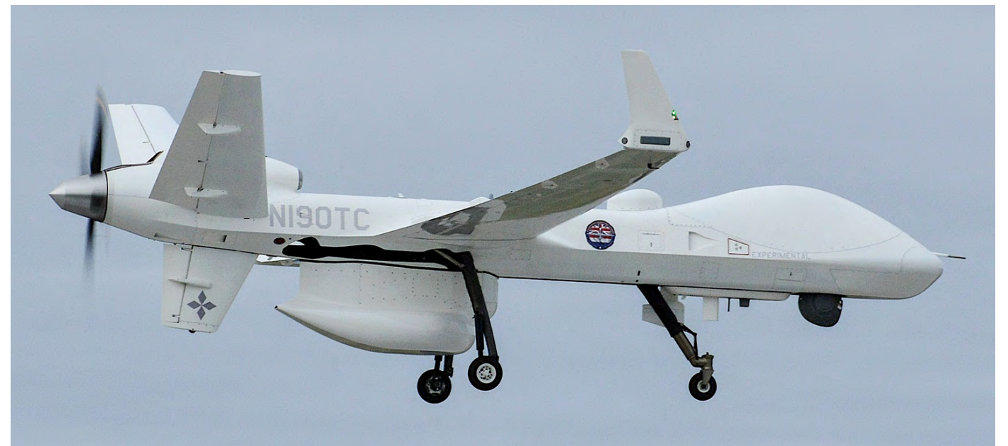
MQ-9B Skyquardian N190TC arriving into RAF Lossiemouth for Joint Warrior. The MQ-9 transited up from RAF Waddington, it did two wheels up approaches/go-arounds and landed on its third. (12 September 2021,)