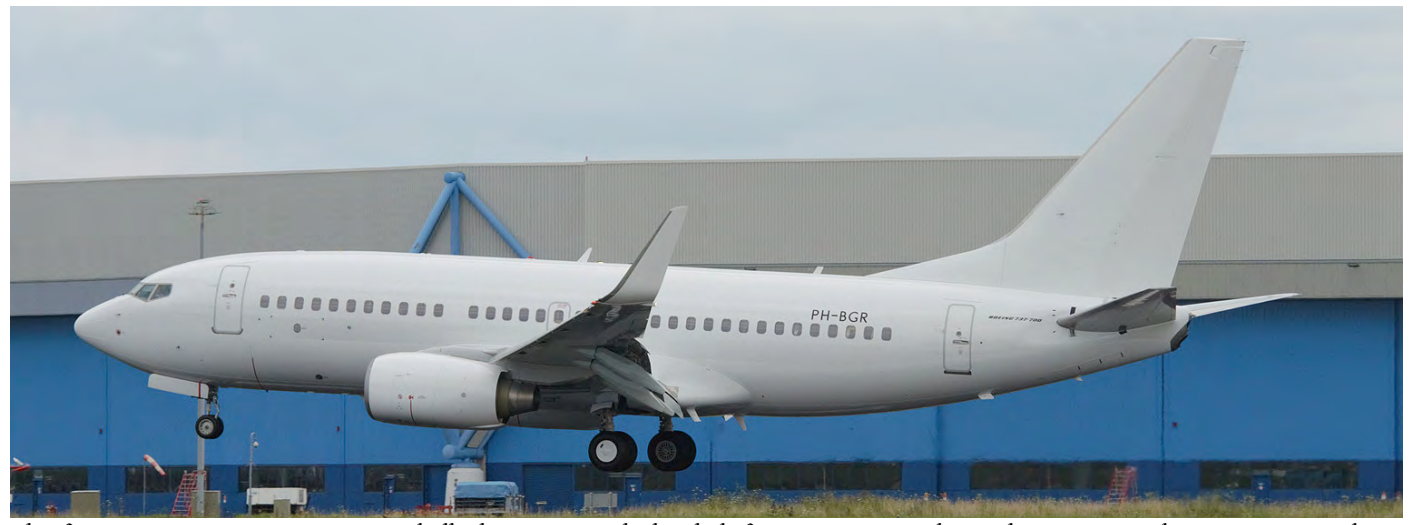
This former KLM Boeing 737 was painted all white at Norwich shortly before it was returned to its lessor. PH-BGR became OE-IBZ and was registered to Avolon. (Amsterdam - Schiphol, 3 August 2021,) HK-4907 G200 Searca 16 N4096Q G650ER Ubquiti f/v 18 TWY420