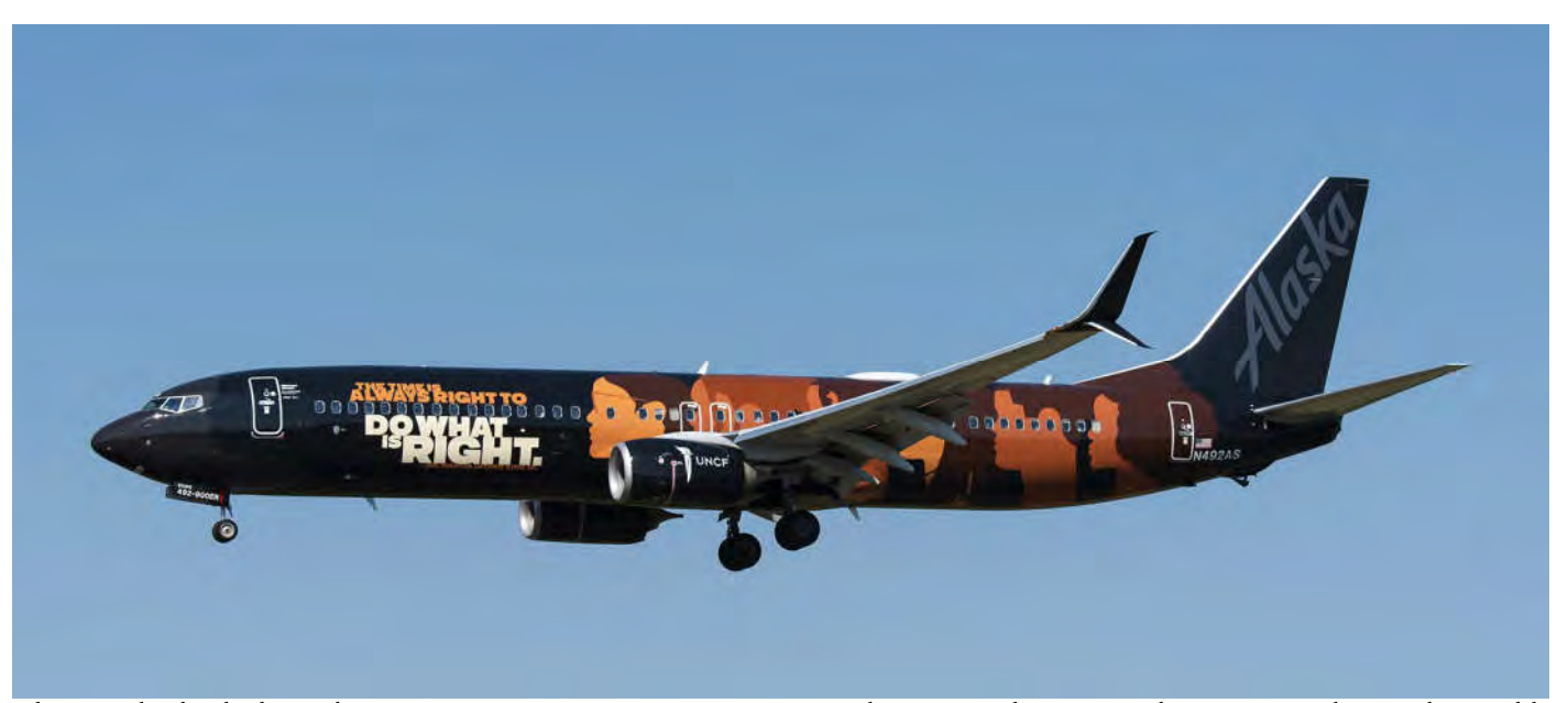
This 2015 built Alaska Airlines Boeing 737-900ER N492AS was painted in a special "UNCF - Education can change the World" colour scheme in spring 2021. (Baltimore-Washington (MD), 19 May 2021,)