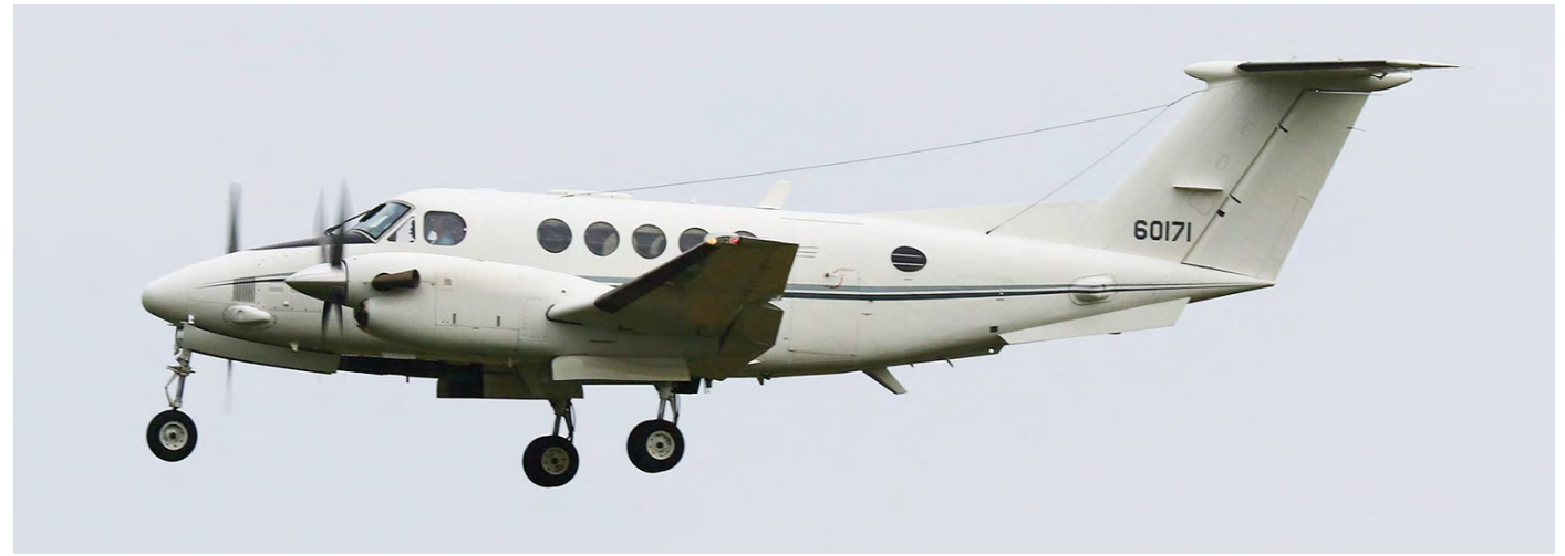
Huron 76-0171 was previously active with the US Embassy (USE) Rabat. The C-12C is currently active with the USE Oslo. (Brussels, 30 August 2021,)