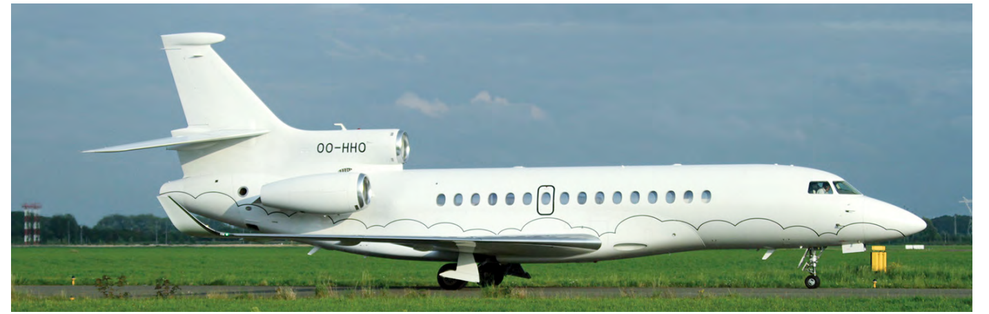
Falcon 8X 00-HHO was already delivered to Abelag Aviation (trading as Luxaviation Belgium since 2016) in November 2017. (Antwerp, 20 August 2021,)