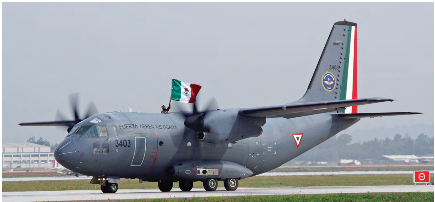
Proudly displaying the national flag's green, white and red, C-27J 3403 is arriving at Santa Lucia on Mexican Independence Day.