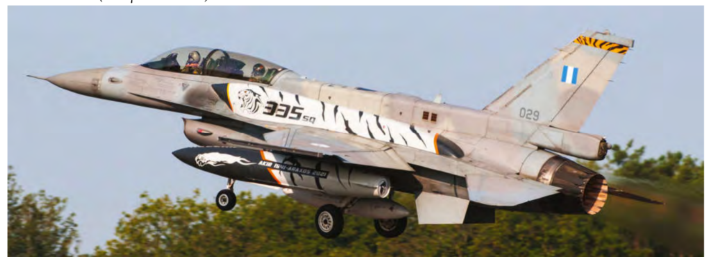
Hellenic Air Force F-16C serial 029 from 335 Mira was one of four Greek F-16s present at Kleine Brogel. (13 September 2021, Oscar Vis)