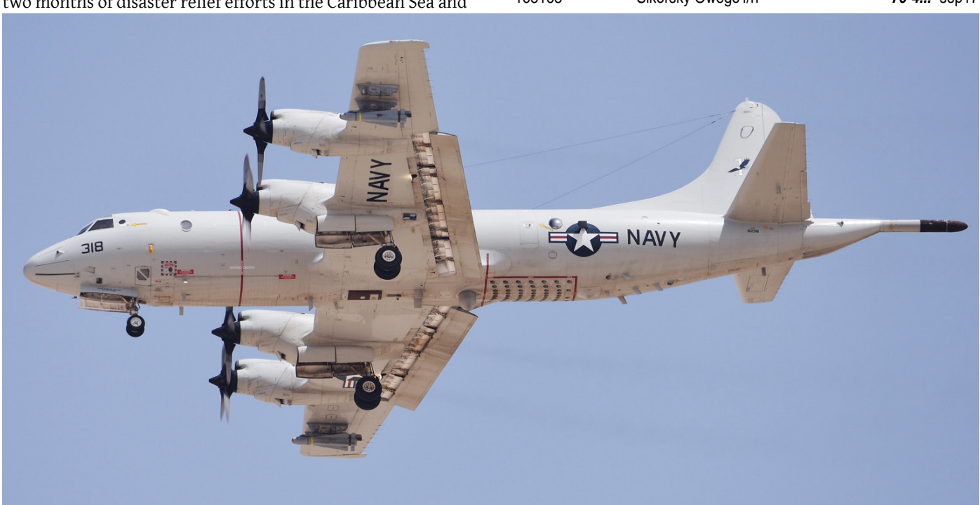
We do not regularly see Orions with underwing armament so this photograph of P-3C 162318 is worth publishing. The subhunter is seen here carrying AGM-65E Maverick missiles on its pylons. (Al Udeid, 21 March 2017,)