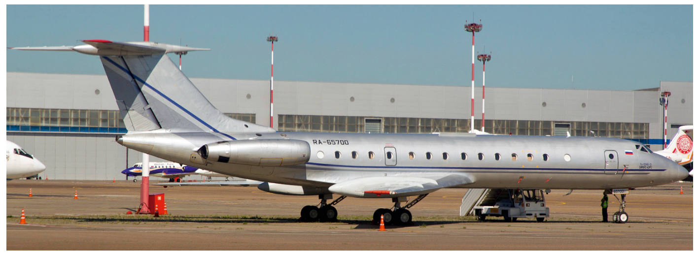
This Tupolev Tu-134 is operated by Sirius-Aero, the largest Russian business aviation airline. The airline provides 24/7 VIP-quality services and is based at Moscow-Vnukovo airport. The current fleet includes 10 business jets. 1983 built RA-65700 is one of them and features a 28-seat VIP interior. (Moscow-Vnukovo, 16 August 2017, Andre Alders)