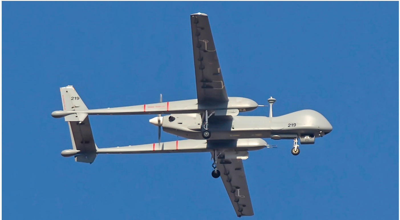
This will be most likely the future of military aircraft spotters, UAV's. The IAI Eitan "Steadfast", also known as Heron TP, is an unmanned reconnaissance aircraft developed in Israel by the Malat division of Israel Aerospace Industries. The aircraft is a newer version of the IAI Heron. (Tel-Nof/Ekron AB, 6 November 2017,)

The development of the SANG's aviation capabilities has been in progress since the concept was first created in 2008. The 2nd Aviation Brigade will follow at Hofuf, on the east coast, in 2019, and the 3rd Aviation Brigade near Jeddah in 2021 with more AH-64E, AH-6i and UH-60M helicopters on order. 4th Aviation Brigade is being stood up at Dirab, south-southwest of Riyadh and will most likely receive the MD 530F training helicopters.