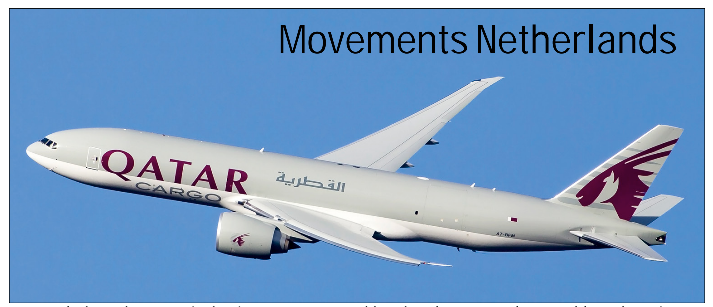
A7-BFM is the thirteenth Boeing 777 freighter for Qatar Airways. It was delivered to Doha on 30 September 2017 and departed on its first commercial flight on 3 October 2017. (Amsterdam - Schiphol, 8 December 2017, Maarten Visser Sr)