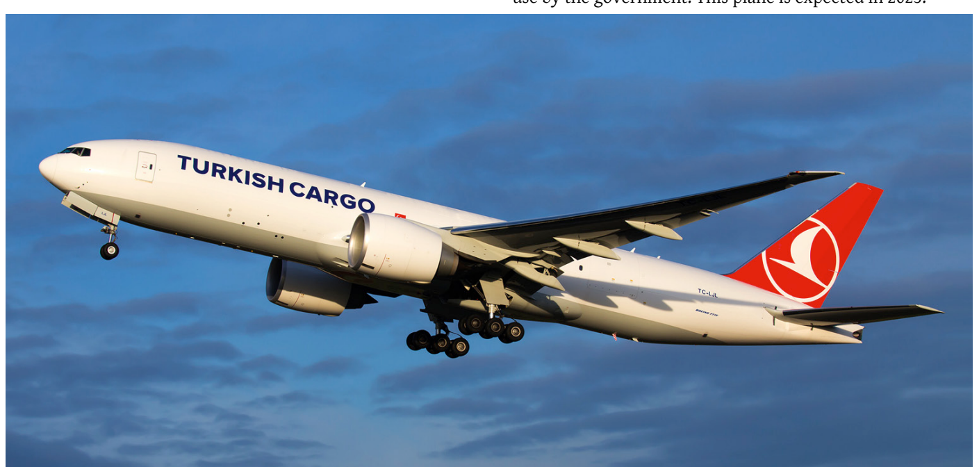
Turkish Airlines took delivery of its first Boeing 777 Freighter TC-LJL on 30 November 2017. The second one was delivered three weeks later on 22 December 2017. Both these aircraft were ordered in the summer of 2013. Probably Turkish Airlines was so happy and impressed with with the performance of these freighters that after their entry into service, they immdediately ordered three more 777 Freighters on 30 December 2017. These three 777 Freighters will be delivered in the summer of 2018. (Maastricht-Aachen, 29 December 2017, Björn van der Velpen)

The government of Congo has ordered two ARJ21-700s at COMAC, which are to be used by government owned <u>Air Congo</u>. Both are to be delivered this year. A third ARJ21-700 was also ordered, but this one would be a VIP-variant for the use by the government. This plane is expected in 2023.