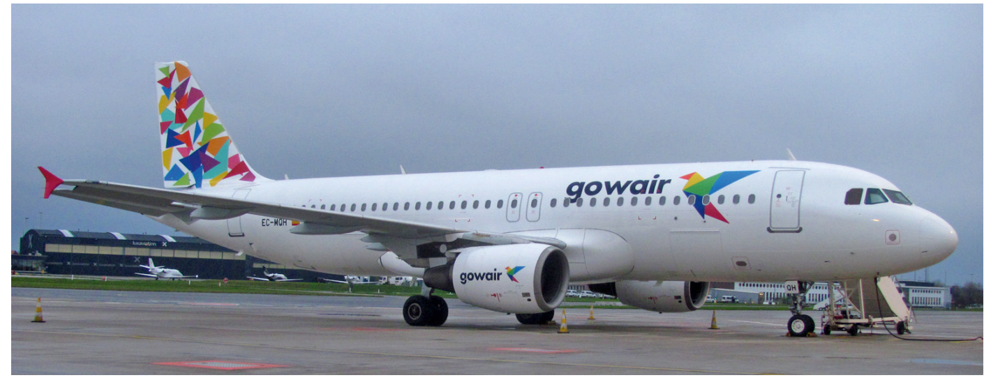
Gowair Vacation Airlines is a Spanish airline created by tour operator Gowaii. They took delivery of its first aircraft on 13 July 2017. EC-MQH is a former Zhejiang Airlines/Air China Airbus A320. (Brussels, 7 December 2017, Eric Vangeel)