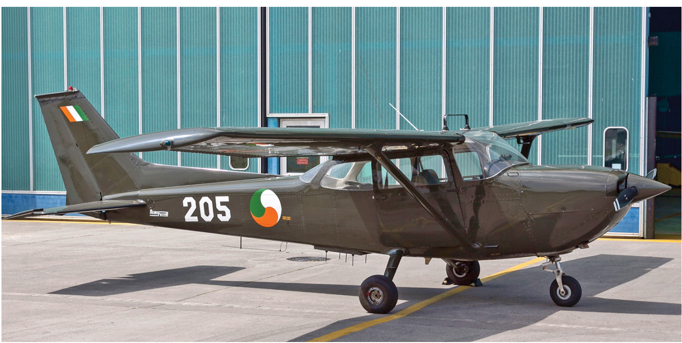
Ireland placed an order for three PC-12NGs on 20 December 2017 to replace the last five operational Cessna FR172Hs, like this 205 of 104 Squadron. The Cessnas are operating within the IAC since 1972. (Baldonnel, 3 June 2009, Dino van Doorn)

MT55217/ex 61-13/Leonardo Leonardo nov17 MT55219/61-20 ex Leonardo 7092/B0014/0060 sep17 212° Gruppo MT55223/61-22 Leonardo on order dec17 MT55224/61-23 Leonardo on order dec17 In November 2017, Aermacchi T-346 MT55217 attended the Dubai Airshow 2107 with 'M-346FA Fighter Attack' titles on its tail. These titles were previous worn by the T-346A MT55219,