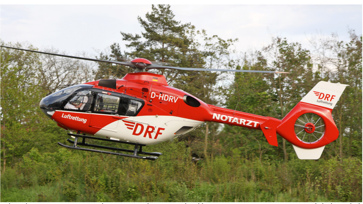
Airbus Helicopter EC135P2+ D-HDRV and its two crewmembers met a truely sad fate on 23 January. During a routine training flight the 2008 built helo collided mid-air with Piper Cherokee Arrow HB-PGF. The cause of this accident is to be investigated. The pilot of the Piper was informed of the presence of the EC135, and the visibility was clear and cloudless at the altitude of the collision. (Zwickau, 11 May 2017, Michiel van Herten)

pines. It is unclear why the aircraft landed at Legazpi, which is still under construction. It is located six kilometres to the south-west of the current Legazpi Airport, which also has a single runway, so the pilots may have been confused.