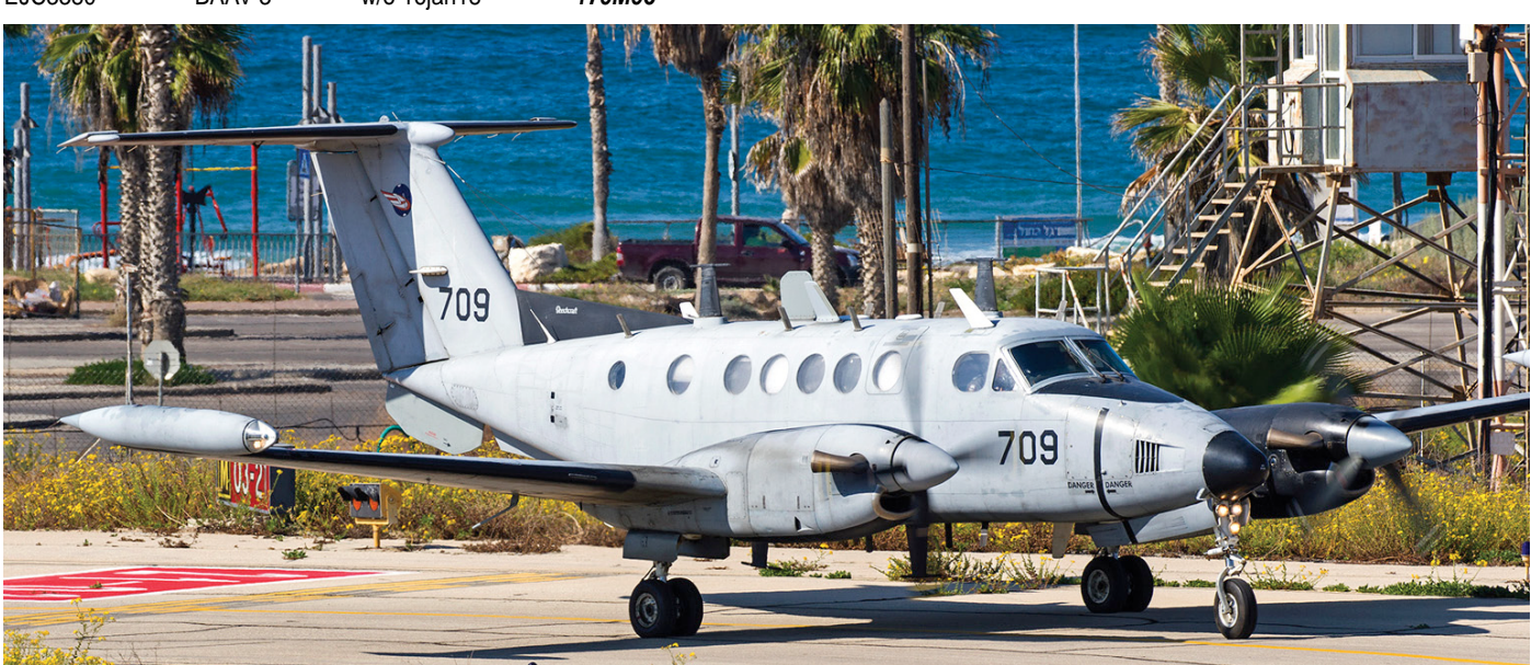
Many variants of the Beech 200 light transporter are in use with the Israel Air and Space Force and they all are based at Sve Dov. The five Beech B200CT Zufit-3's, like this 709 of 135 squadron, are used for IMINT duties. (Tel-Aviv/Sde Dov, 6 November 2017, Dino van Doorn)

The Kingdom of Bahrain and the United States government have agreed to move forward with the sale of F-16 Block 70 aircraft for the Royal Bahraini Air Force. Bahrain is now set