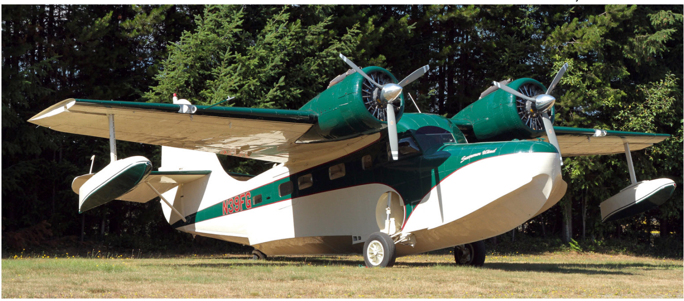
Near the hangar of Sealand Aviation at Campbell River located at Vacouver Island Robert Eikelenboom noted this G-21A Goose in a very good condition on 25 August. The N39FG is owned by an American construction company called Devcon Construction Inc.