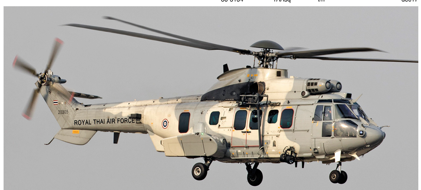
National Children's Day in Thailand, also known as 'Wan Dek' is celebrated every year on the second Saturday in January. Many Government offices are open to children and their family; this includes various military installations. For spotters it is an excellent oppertunity to photograph the RTAF aircraft. The H225M H11-5/59 20305 of 203Sqn was captured by Jurgen van Toor on 13 January 2018 at Don Mueang.