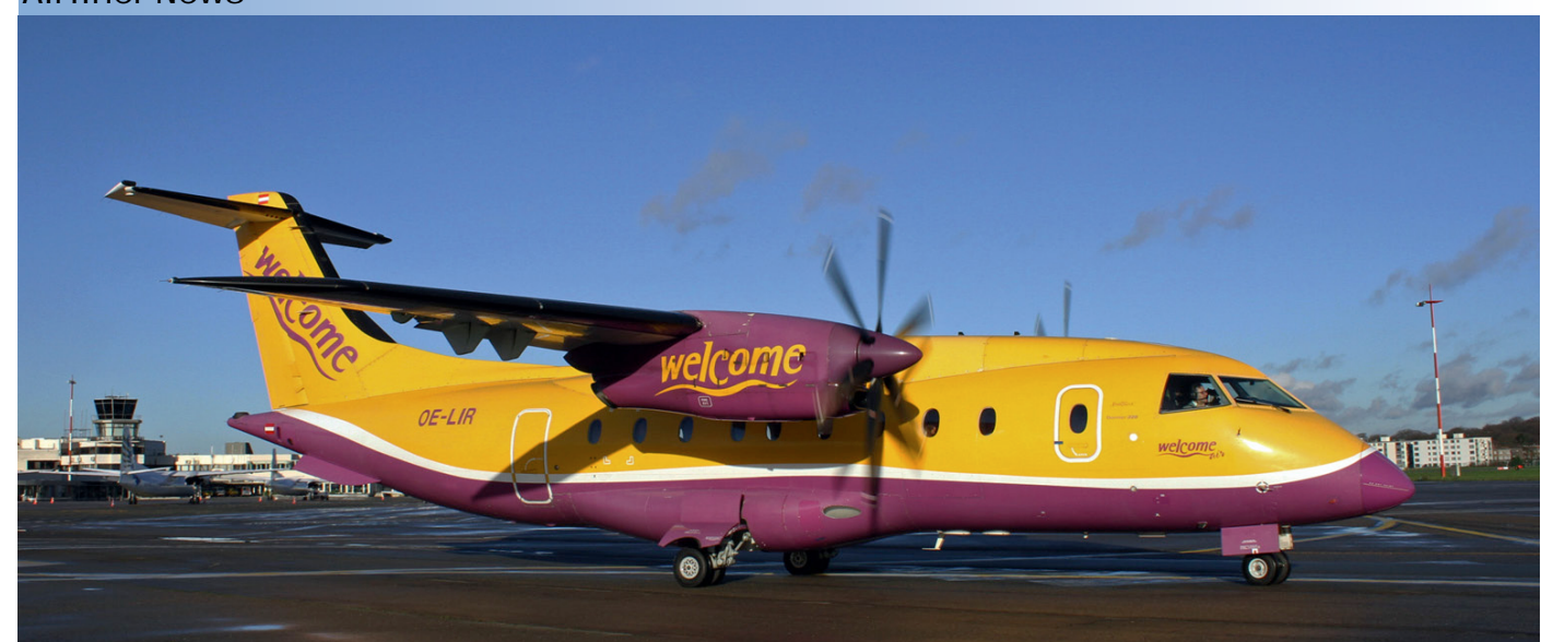
Welcome Air operated its last commercial service with its one remaining Dornier 328 aircraft on 26 December 2017. Walter van Brempt pictured OE-LIR on that day at Antwerp, which was probably the last flight for the company. Welcome Air's Air Ambulance flights will be taken over by Tyrol air Ambulance.