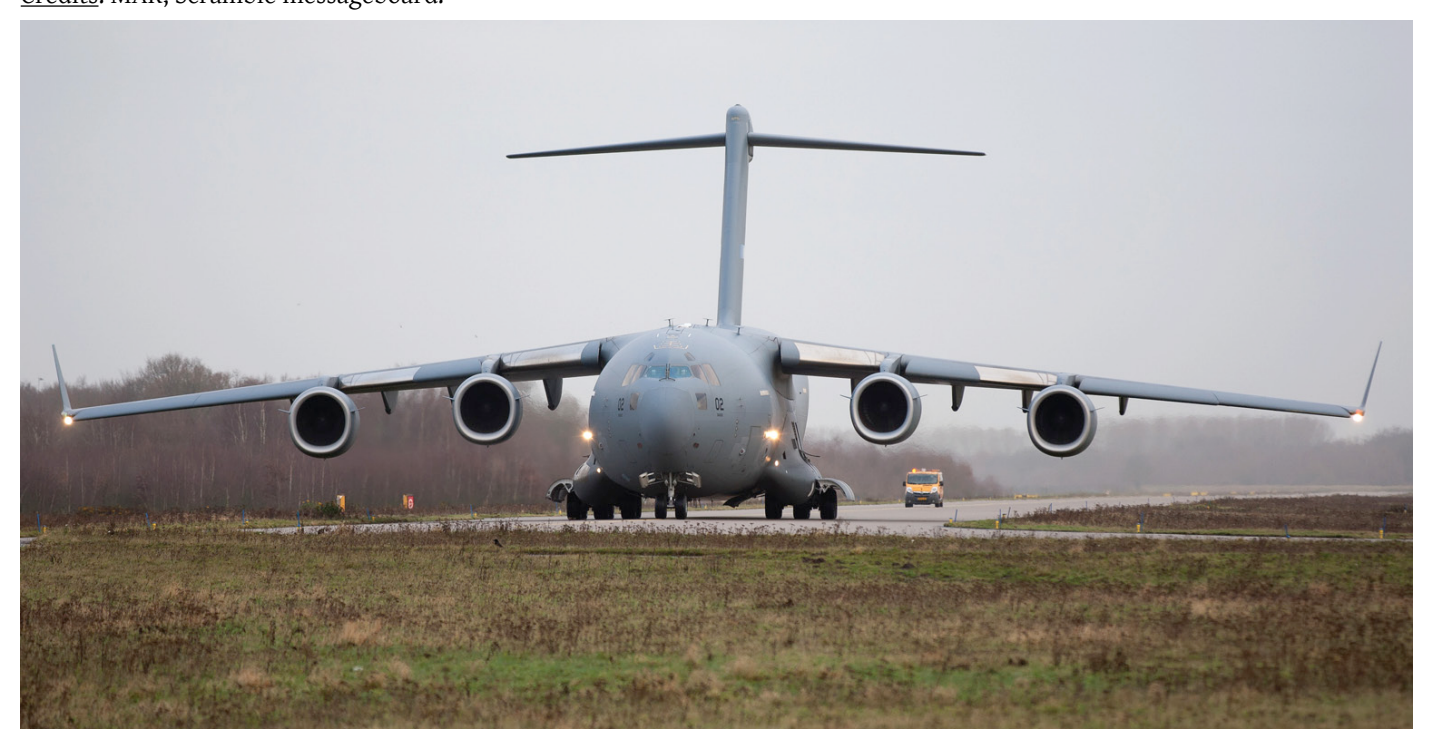
A C-17 is an impressive sight, in the air, as well as on the ground. In this shot it looks like the HAF C-17 with registration 02 is taxiing into the lens of Manolito's camera. (Eindhoven, 18 December 2017,).