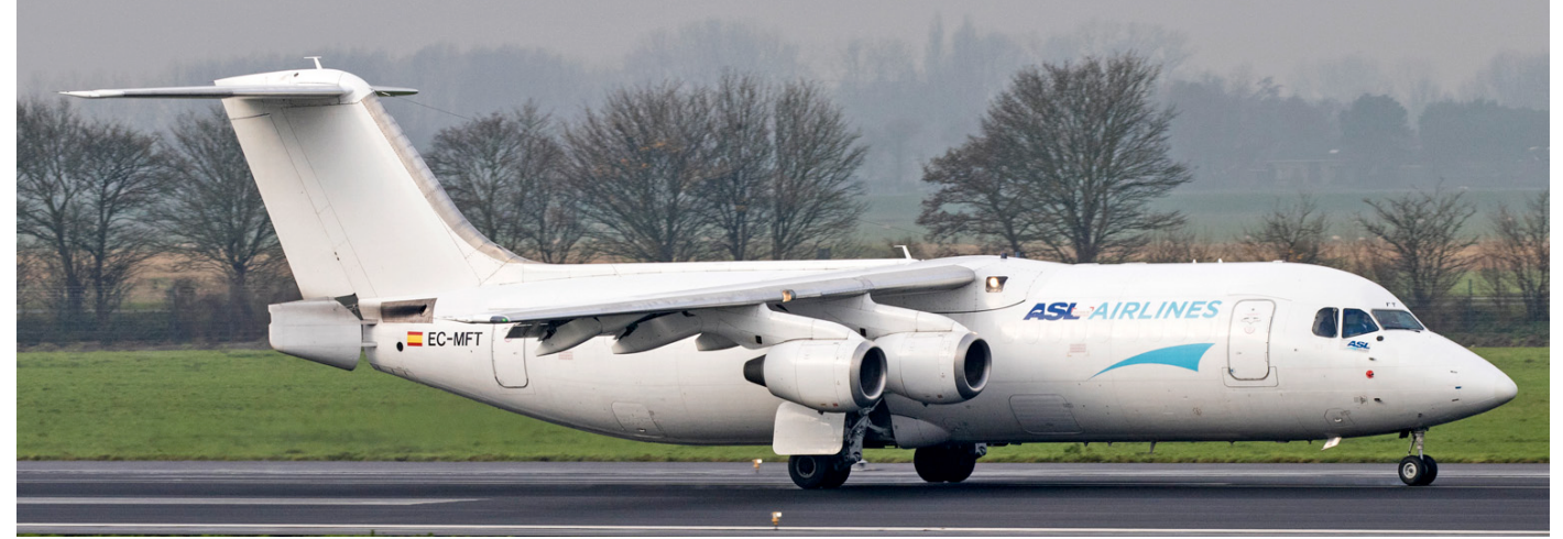
This 'Quiet Trader' was built as a passenger airframe. The conversion into freighter took place in 1991. It was delivered to TNT in that same year as G-BSUY but operated by Air Foyle. That contract ended in 2000 when it was reregistered as OO-TAE and operated by TNT Airways. It was transferred to Spain based Pan Air in April 2015 all white and reregistered to EC-MFT. It is one of nine Jumbolinos still active with the Spanish airline, since 2016 renamed to ASL Airlines Spain. Mid 2017 the aircraft received the ASL titles. (Rotterdam - The Hague, 1 December 2017,)