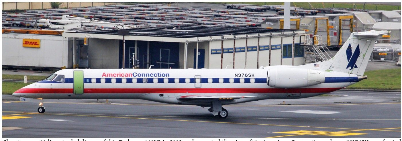
Chautauqua Airlines took delivery of this Embraer 140LR in 2002 and operated the aircraft in American Connection colours. N376SK was ferried from Nashville via Bangor and Goose Bay to Keflavik. From there it was flown to Brussels for a night stop. The next day the aircraft continued via Turkey and Egypt to South Africa on delivery to Airlink. The registration was cancelled on 8 December 2017. (Brussels, 5 December 2017, Paul Sanders)