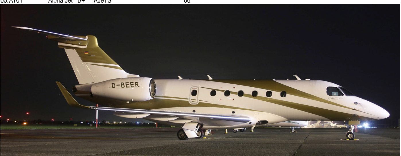
Delivered to the Mandalay Resort Group as N729MM in December 2015 it was transferred to Embraer Executive Aircraft one year later. Air Hamburg Private Jets took delivery of the Embraer 550 in March 2017 as D-BEER but retained the colours of its previous owners. (Ostend, 12 December 2017,)