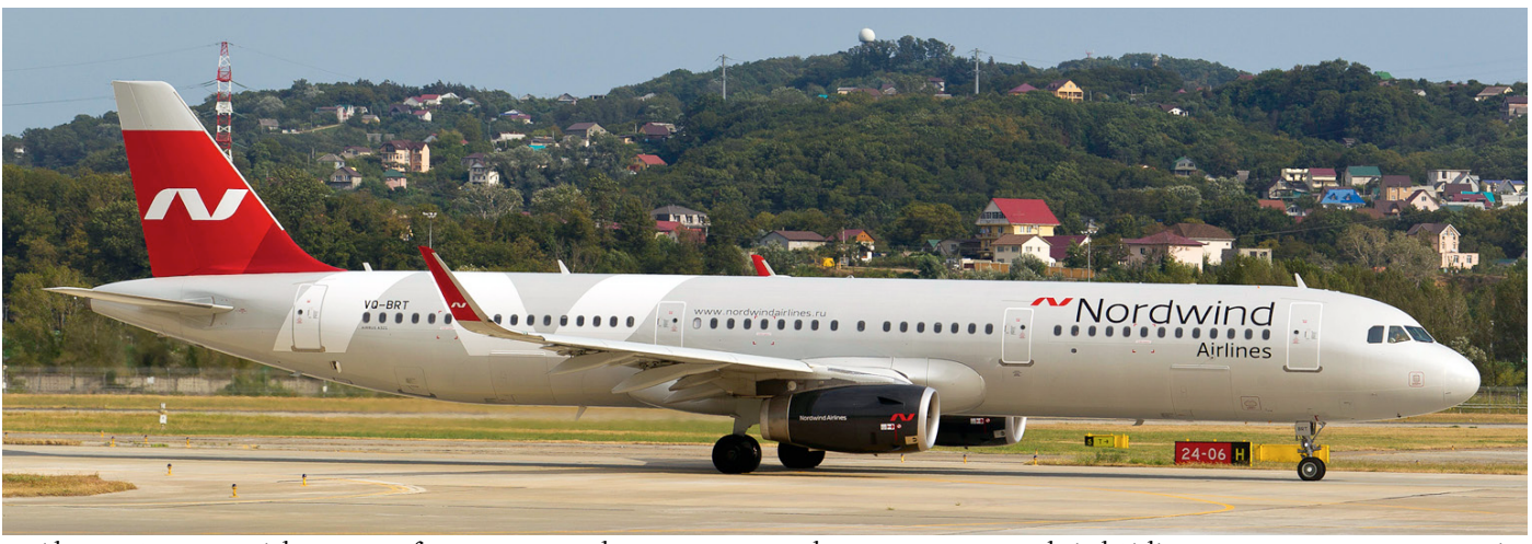
Besides two A330-200s, eight 737-800s, four 767-300ERs, three 777-200ERs and two 777-300ERs, Nordwind Airlines operates seven A321-200s. Five of them were acquired on the used market, while in May 2017 they took delivery of two brand-new A321 aircraft. VQ-BRT is one of the factory fresh aircraft and was delivered from Hamburg-Finkenwerder on 22 May 2017. (Sochi International, 17 August 2017, Andre Alders)