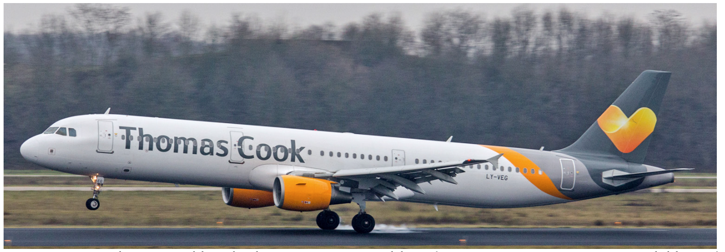
In January 2004 an Airbus A321 was delivered to Iberia as EC-ITN. It was withdrawn from use in January 2017. Avion Express took delivery of the aircraft in April 2017 for sublease to and in the colours of Thomas Cook registered as LY-VEG. (Eindhoven, 23 December 2017,)