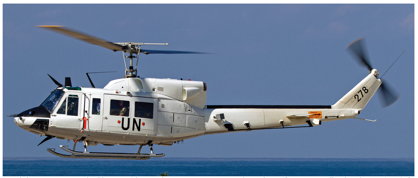
Founded in 1979, ITALAIR is the oldest unit of the United Nations Interim Force In Lebanon (UNIFIL) mission, as well as the only inter-force flight department deployed by Italy in a foreign Operational Theater. The crews of the Army, Navy and Air Force, with the six AB212 helicopters, are ready to take off in less than 30 minutes to carry out different types of missions throughout the Operations Area and in particular along the Blue Line, the demarcation line between Lebanon and Israel. 278 is most likely its UN-code and it is MM-serial is unknown for the moment (Tel-Aviv/Sde Dov, 6 November 2017, Dino van Doorn)

maintained extensive relations with Saudi-Arabia, which has provided substantial financial assistance for the purchase of military equipment. Ditto for Israel who helped Morocco in securing its wall of sand between Algeria and Morocco (through Belgian companies) and modernizing the Moroccan F5 Tiger 3 format.