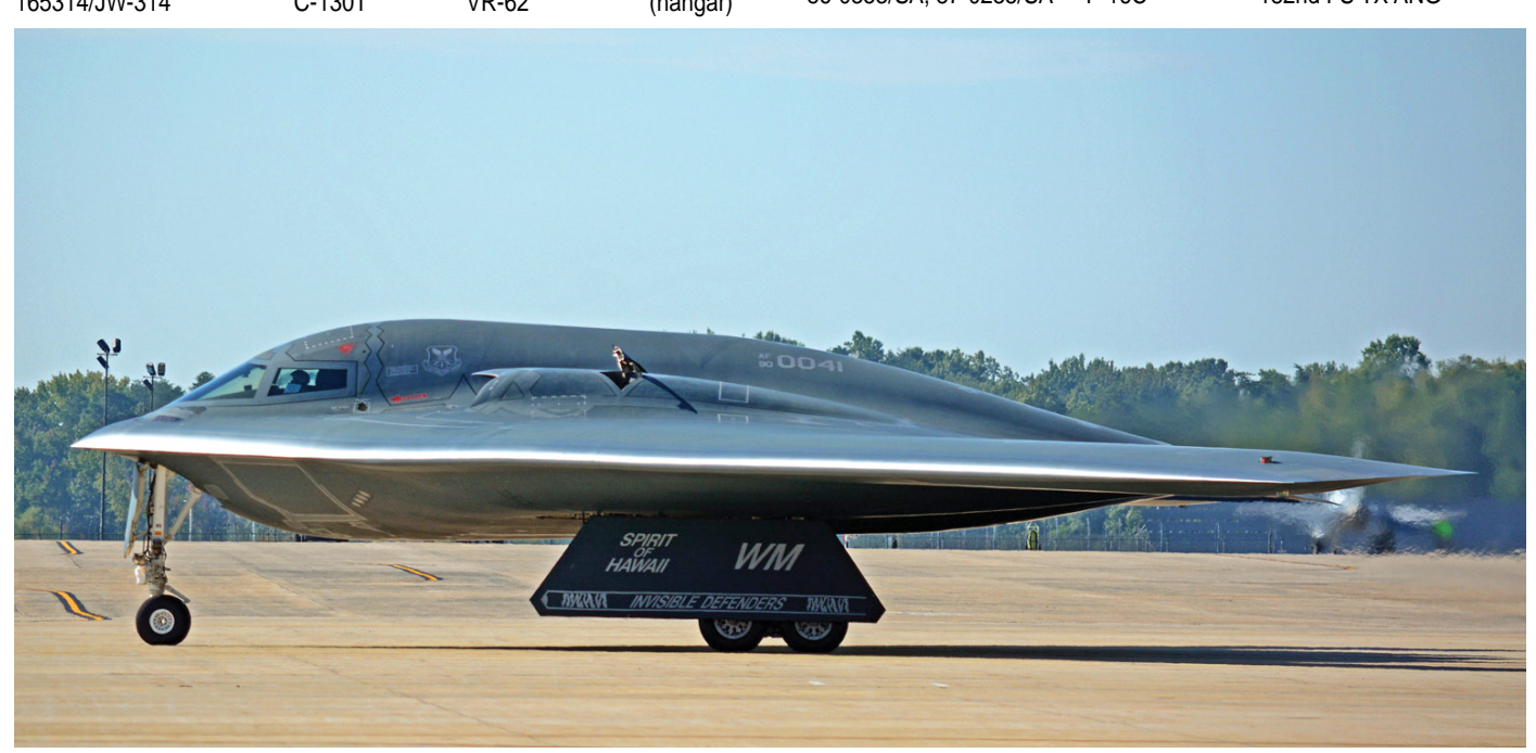
Many people think it is a great looking aircraft, others say it is ugly. No matter if you like it or not, it is an impressive and unique shaped aircraft with a high Starwars grade. This 90-0041, coded WM, (Spirit of Hawaii) was pictured during the open day at Andrews AFB (MD). (Andrews AFB, 16 September 2017, Jonathan Verschuuren)