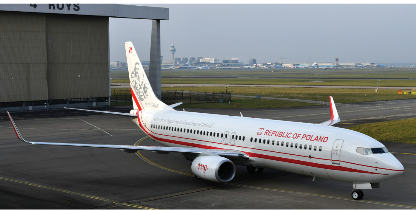
The latest addition within the Polish Air Force is this Boeing 737-86X 0110 of 1.BLTr. It visited Amsterdam-Schiphol already a few times as part of training missions. (9 January 2018, Ben Uffen).

aircraft like A-50s airborne warning and control systems and Il-78 tankers.