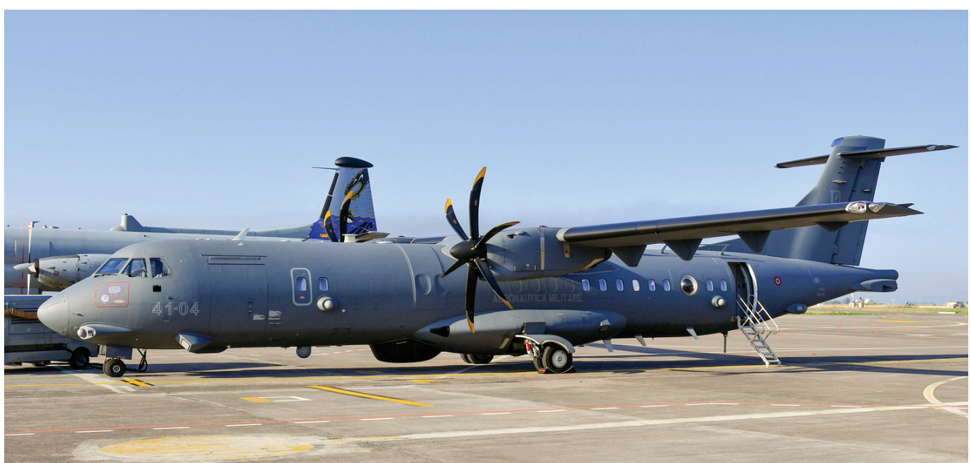
During the farewell ceremony of the Br.1150, on 21 September 2017, its successor, the P-72A, was officially introduced within the Aeronautica Militare. The P-72A, a Leonardo ATR-72MP, MM62281/41-04 operating with the 41° Stormo 'Athos Ammannato / 88° Gruppo. (Sigonella, 20 October 2017)

In 2017 the Novosibirsk Aviation Plant named after V.P. Chkalov (NAZ) PJSC «Company» Sukhoi "delivered to the Russia sixteen front-line bombers Su-34. Ten of them entered the 277th Bomber Aviation Regiment of the 303rd Mixed Air Division of the 11th Krasnoznamennaya Army Air Force and Air Defense of the Eastern Military District at Khurba airfield (near Komsomolsk-on-Amur, Khabarovsk region), allowing