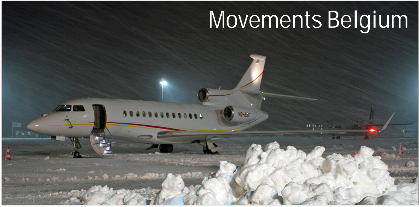
This Falcon 7X was delivered to the Empire Aviation Group in September 2011 as VP-CSJ. It was returned to Dassault Aviation in August 2014 as F-WHLU. Shell Aircraft took delivery of the Falcon in February 2015 as VQ-BSF. The bizjet was caught on camera in rather snowy circumstances. (Antwerp, 11 December 2017, Walter Van Brempt)