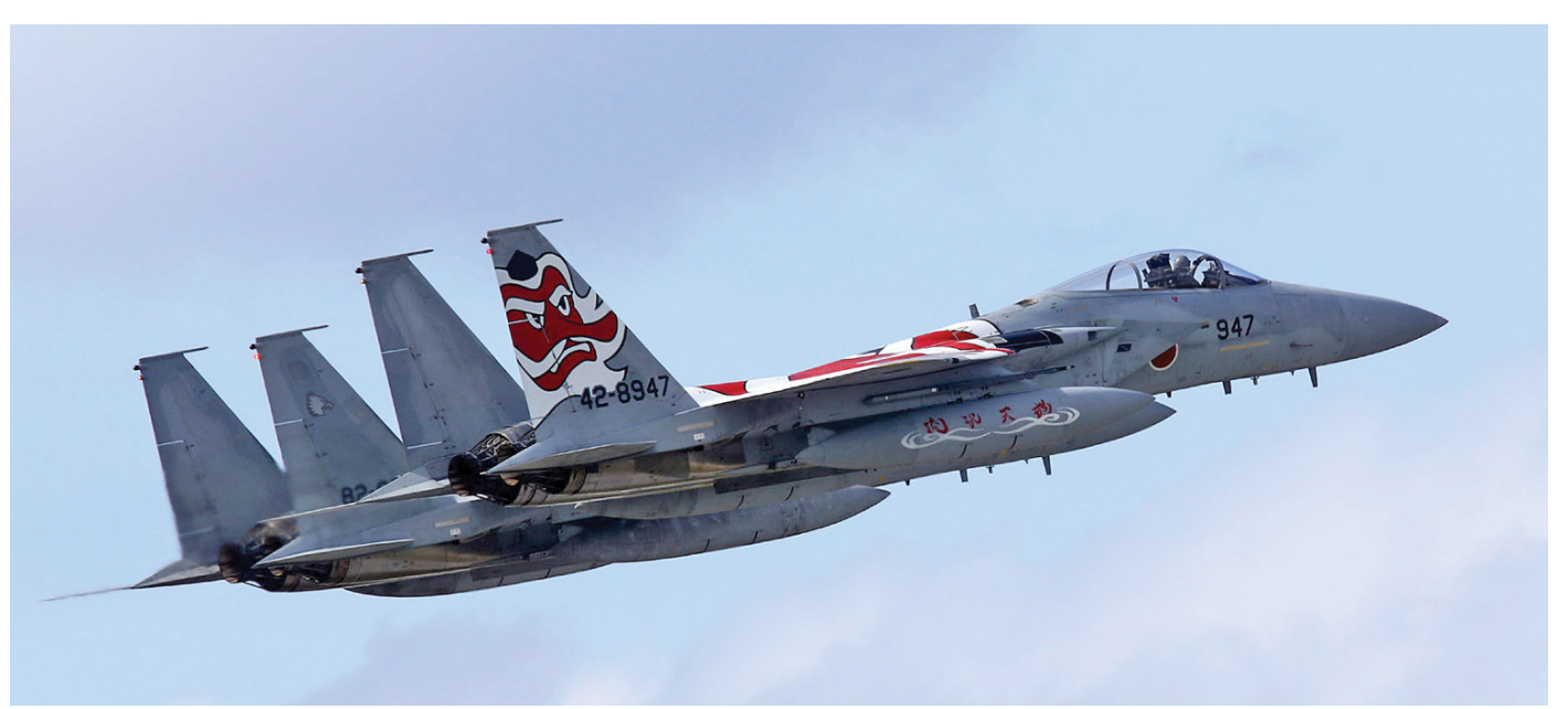
In Japan it is a habit to paint one or more aircraft of a squadron into a special colour scheme in case of a celebrational event. Last year is was also the turn of 304 Hikotai, based at Tsuiki, to paint an F-15CJ in special colours, proven by this picture. (Naha, 9 December 2017, Reinier Schreurs)