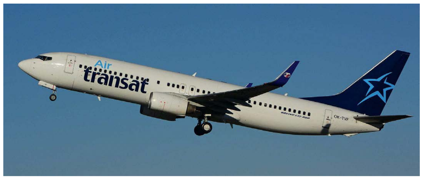
This Travel Service Boeing 737 has gone on winterlease to Sunwing Airlines since the winter of 2011 but this summer the aircraft has been leased to Air Transat. OK-TVF has retained its Czech registration during its time in Canada. (Hamilton (Ont.), 1 December 2017,)