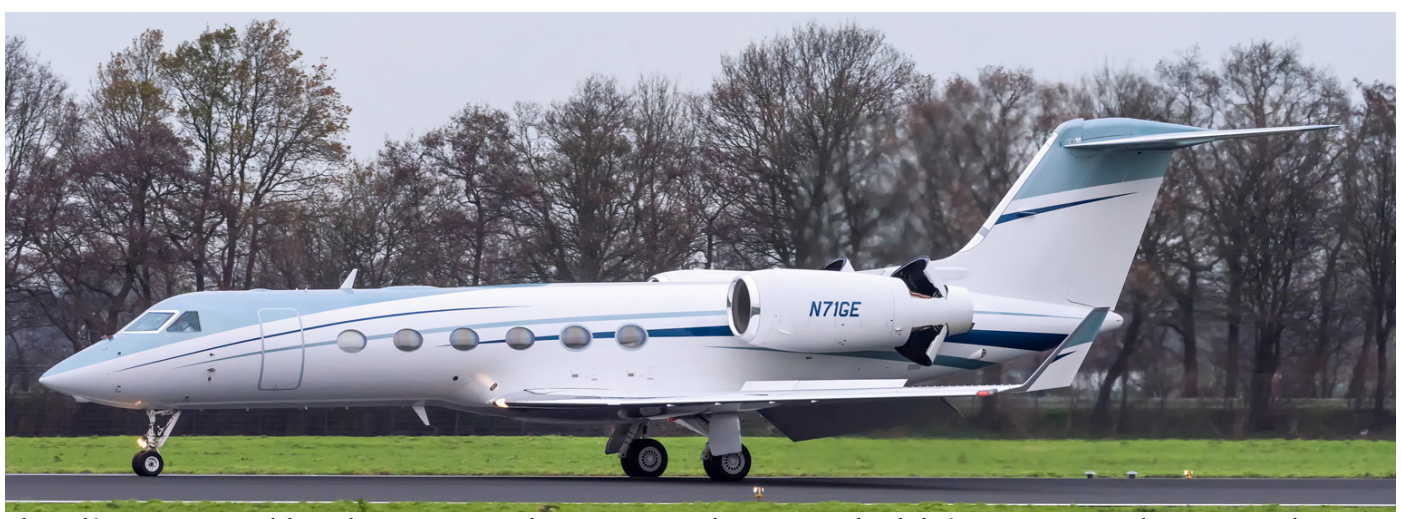
This Gulfstream G450 was delivered to NasJet in March 2014. It was caught on camera shortly before returning to Dubai via Luton where it was subsequently reregistered to N125GG. (Rotterdam - The Hague, 6 December 2017,)