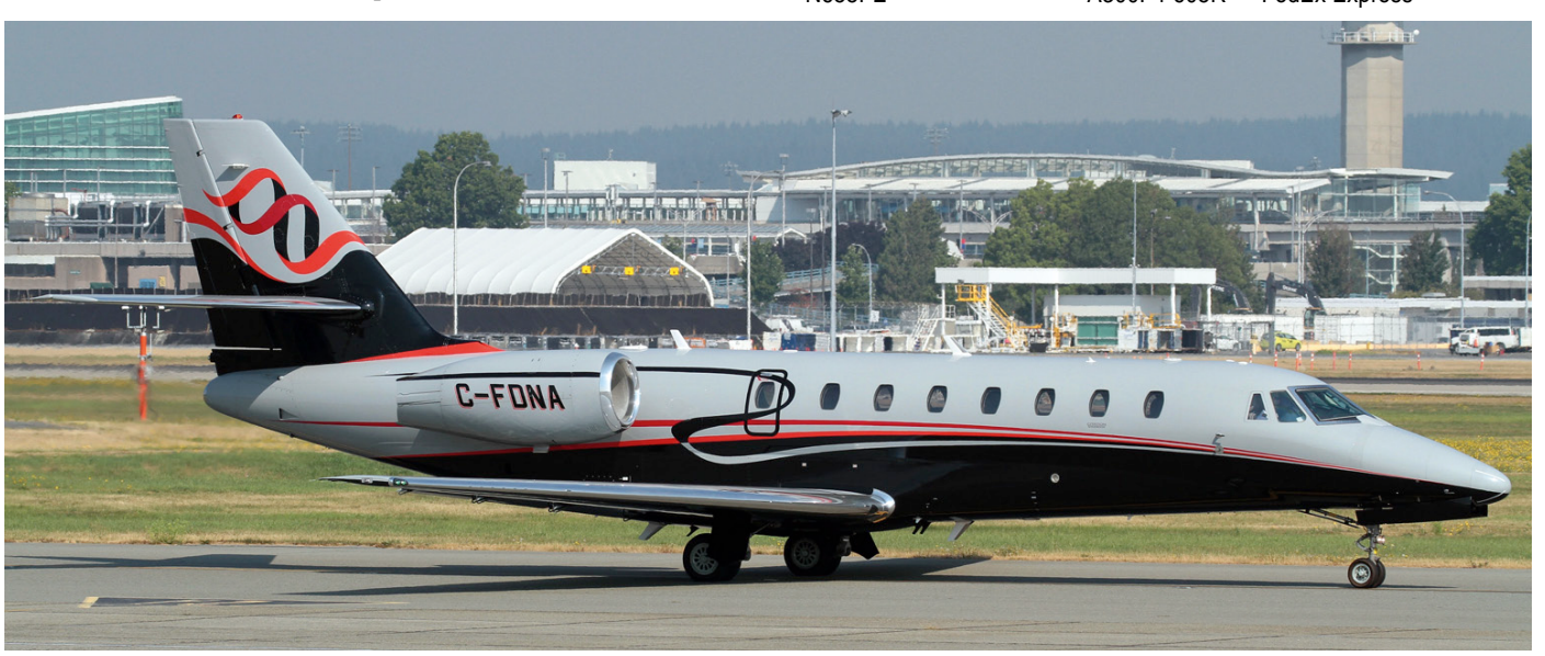
Cessna Citation 680 Sovereign was built in 2006 and delivered to Brazil as PR-SPR in 2007. Seven years later it moved to Canadian corporate aircraft operator Execaire as C-FDNA. (Vancouver, 29 August 2017, Robert Eikelenboom)

C-GCJB B727-225F Cargojet N655FE A300F4-605R FedEx Express