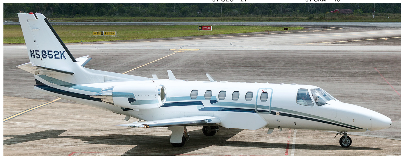
This Cessna 550 is being operated by Heritage Aviation Management since June 2016. (Paramaribo, 3 October 2017,)