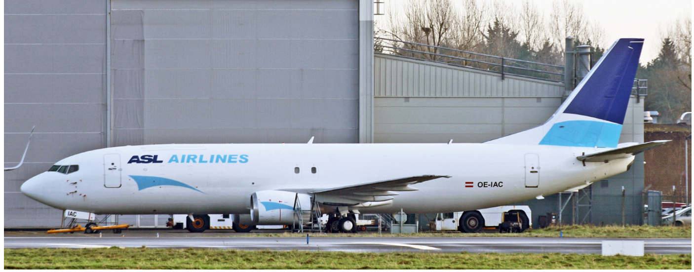
Aeroflot was the first operator for this Boeing. They took delivery of, then registered as VP-BAI, in May 1998. Via Garuda and Japan it ended up with Aero Contractors of Nigeria in August 2012 as 5N-BPR. In December 2016 that adventure ended and owned by GECAS it was converted to freighter. After conversion is was flown from Dothan to Shannon as N494CS. Three days before being flown to Liège for delivery to ASL Airlines Belgium as OE-IAC it was caught on camera. (Shannon, 18 December 2017,)