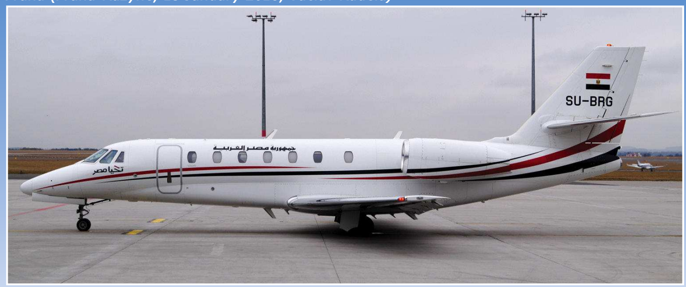
Cessna 680 SU-BRG/942 was the second (of two) Sovereigns to be used by the Government. Government aircraft are based at Cairo/Almaza AFB. (Praha-Ruzyně, 8 January 2018, Václav Kudela)