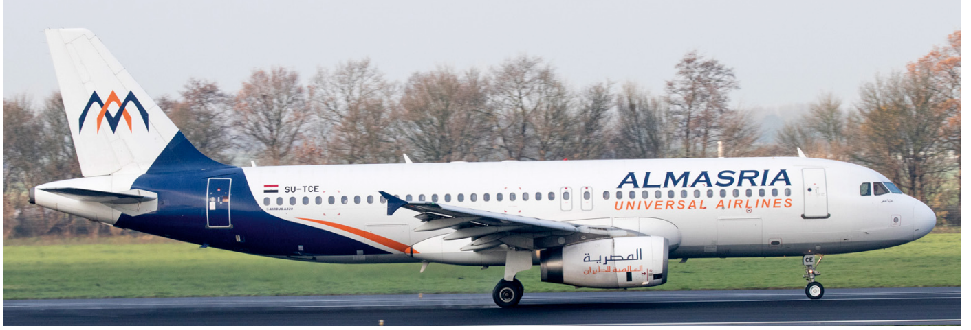
AlMasria Universal Airlines operates schedule and charter services from Egypt. Although there were plans to expand the fleet rapidly, its current fleet only holds two aircraft. Airbus A320 SU-TCE was added to the fleet in January 2013. (Rotterdam - The Hague, 1 December 2017, Maarten Visser Sr)