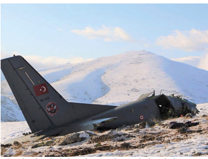
After the skies had cleared again, this crashed Turkish Air Force CN235M 98-148 was soon found. Seeing the damage to its fuselage, one can easily understand that the three members have not survived the impact. (Hodulluca Mevkii, 19 January 2018, Internet)

16jan18 S2-AAX BAe748 Srs2A 1767 dam <u>Bismillah Airlines</u> was unlucky as their BAe748 suffered substantial damage after the left hand main gear collapsed while