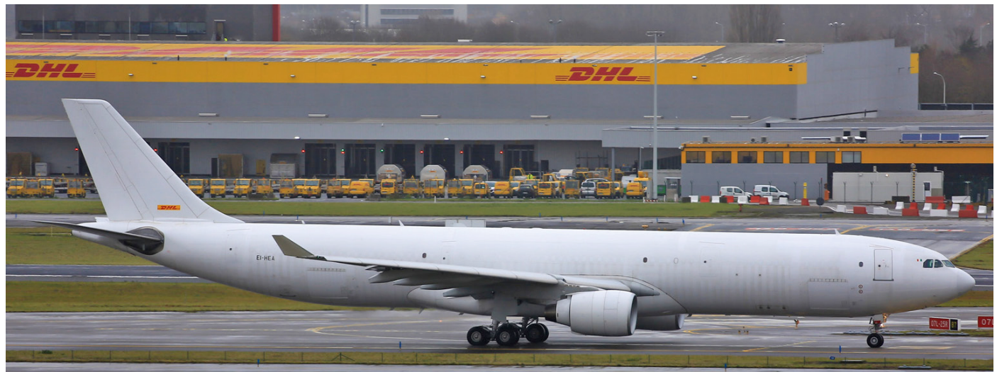
This former Malaysia Airlines Airbus A330 was withdrawn from use in September 2012. It was acquired by the Apollo Aviation Group in March 2015. In 2012 the A330P2F conversion program was launched. This is a collaboration between ST Aerospace, Airbus and their joint venture Elbe Flugzeugwerke (EFW). After conversion the Airbus took to the air on 5 October 2017 registered as D-AAEA. EI-HEA was delivered to ASL Airlines Ireland on 12 December 2017, making ASL Ireland the first airline in the world to take delivery of an Airbus A330-300 Passenger-to-Freighter (P2F). It will be operated for DHL Express, hence the small DHL sticker on its tail. (Brussels, 18 December 2017, Bart Massart)