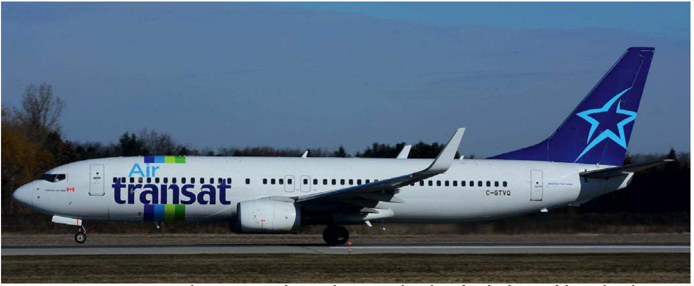
Transavia France Boeing F-GZHB began its winter lease with CanJet Airlines but after the demise of that airline there was a need to look for other oportunities. These where found with Air Transat starting with the winter of 2014. This is the first winter the aircraft has taken up Canadian registration C-GTV