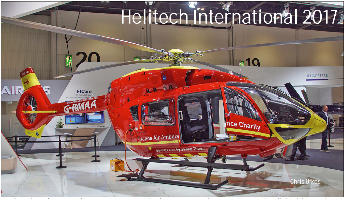
Listed to Airbus Helicopters UK this BK117 D-2 was registered in the UK on 20 September 2017. G-RMAA was formally handed over to the Midlands Air Ambulance Charity. Known as H145 it will be operated by Babcock Mission Critical Services Onshore (formerly Bond Air Services). (London Excel, 5 October 2017,)

Helitech 2017 took place this year at the London ExCeL International Exhibition Centre. From 3 till 5 October 2017 the rotorcraft community was able to attend the exhibition and conference.