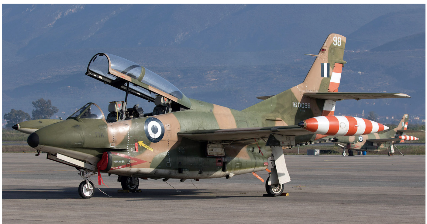
The Greek Air Force is the last user of the North American T-2 Buckeye trainer in Europe. They unfortunately lost T-2E 160098 on 3 January as the result of an engine malfunction. Peter Heeneman was lucky enough to have caught this vintage Buckeye that was flown by 120 PEA. (Kalamata, 7 November)

A Gulfstream G200 of <u>Air Taxi</u>, hired by the Bangko Sentral ng Pilipinas (BSP), suffered a runway excursion after landing at the unopened Legazpi-Bicol International Airport, Philip-