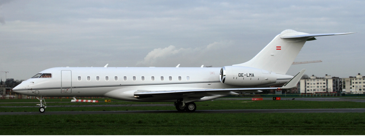
The Austrian civil register concerning business jets is still expanding although many of these are not based in Austria but somewhere else. Exception to the rule is this example, a brand new Global 6000 of Global Jet Austria with registration OE-LMA.(Antwerp, 22 January 2018,)