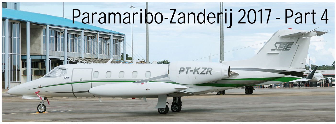
Líder Taxi Aéreo was established on 12 November 1958 in Belo Horizonte. In 1971 Líder was appointed by Learjet as its sales agent in Brazil but Lider terminated its sales agreement with Learjet in favour of a new relationship with the Raytheon in 1995. Learjet 35A PT-KZR is based at Congonhas airport. (Paramaribo, 29 November 2017,)