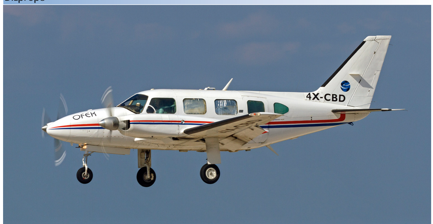
One of the smallest bizprops, which is kept up-to-date in the Scramble civil database, is the Piper PA-31-325. This fine landing shot of this over forty years old 4X-CBD of Hasson Plastics Co. (Afula) Ltd. was taken by Dino van Doorn. (Sde Dov, 6 November 2017)