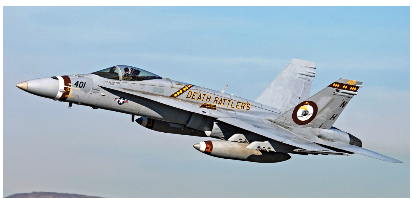
VMFA-323 Death Rattlers managed to make something out of one of their basic grey F/A-18C Hornets! On 28 December 2017, our friend Dan Stijovich took this fine shot of 164881/NH-401 (assigned to CVW-11/USS Nimitz) during the take-off from SanDiego (CA) as some Marines were getting in some late flying hours.

During November 2017, a number of UH-60M helicopters were seen at the BEST facility in Huntsville (AL). This facility is best known for its maintenance work on older UH-60A helicopters which are being passed on to other US government agencies or sold on the civil market. Most likely these newer UH-60M helicopters were present for maintenance or upgrade work. The helicopters reported were: 20077, 20250, 20275, 20276, 20314, 20324, 20553, 20741, 20743, 20744 and 20745.