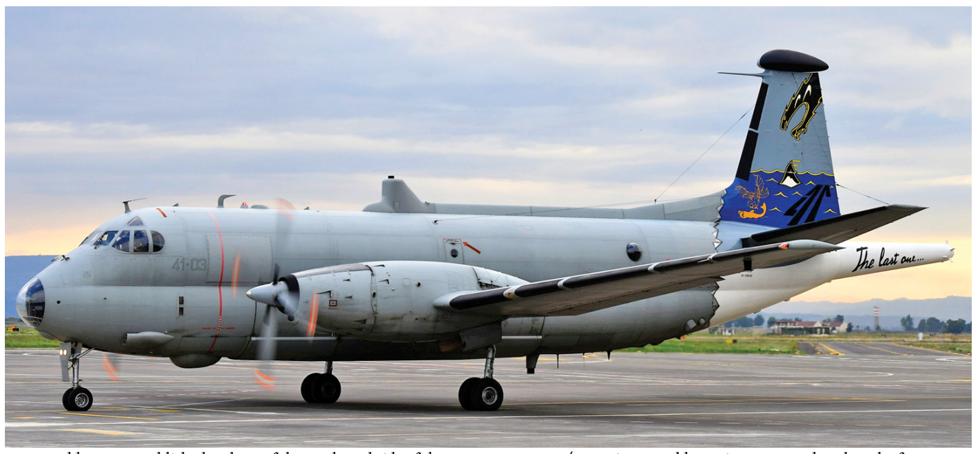
In Scramble 463 we published a photo of the starboard side of the Br.1150 MM40118/41-03, in Scramble 464 it was even placed on the front cover and now we show you the port side of the same aircraft. If you want to see the aircraft by yourself, it is soon possible, because it will be transferred to the excellent Air Force Museum at Vigna di Valle. (Sigonella, 19 October 2017, Alfonso Mino)

which was delivered to the 212° Gruppo at Lecce (LE).