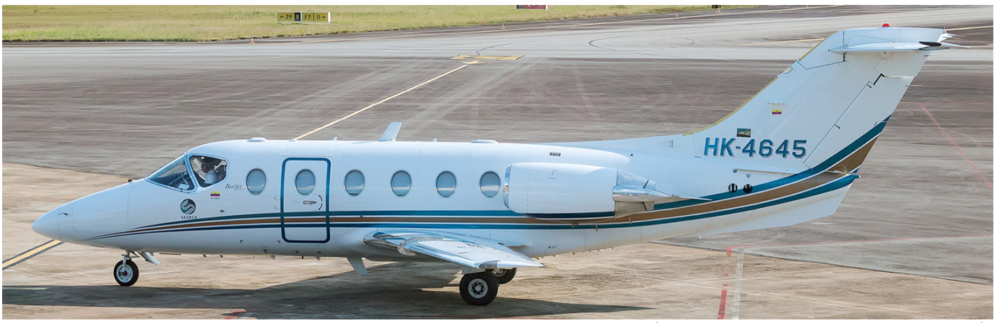
Servicio Aéreo de Capurgana is the current operator for Beech 400A HK-4645 since June 2009. (Paramaribo, 23 November 2017,)