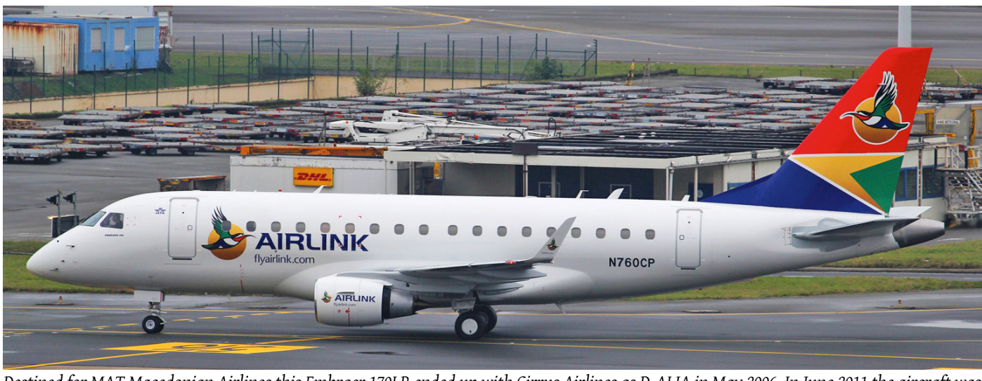
Destined for MAT Macedonian Airlines this Embraer 170LR ended up with Cirrus Airlines as D-ALIA in May 2006. In June 2011 the aircraft was withdrawn from use and although repainted in the colours of California Pacific Airlines and reregistered to N160CP by October 2012 it never operated for that company. The aircraft followed the same delivery route as Embraer N376SK, already repainted in the colours of Airlink. N160CP was also cancelled on 8 December 2017. (Brussels, 5 December 2017, Paul Sanders)