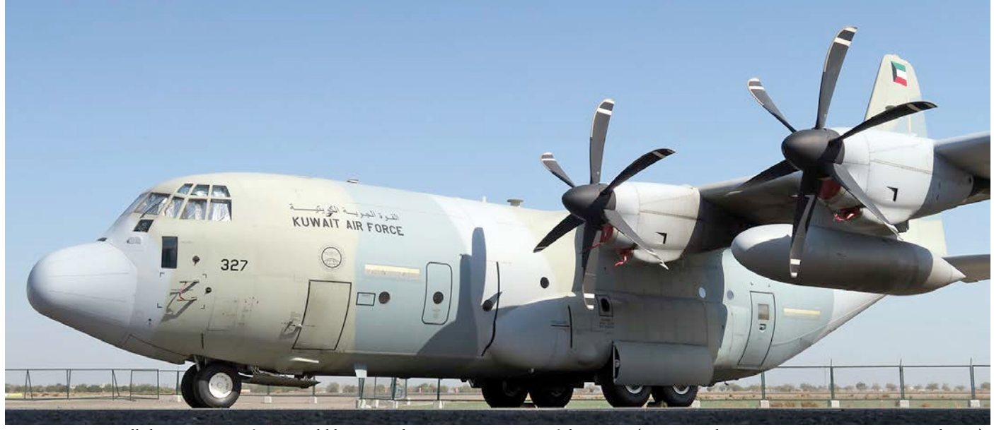
During KAS2018 all three KC-130J of 41sq could be seen. This KAF327 was part of the static. (Kuwait Intl, 17 January 2018, Erwin van Dijkman) Personal copy