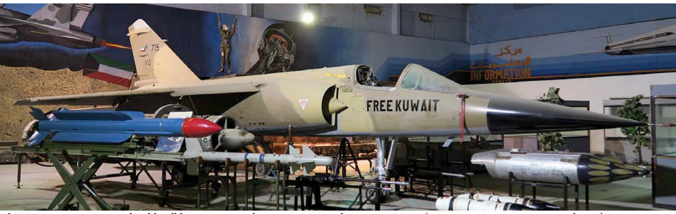
The surviving Mirage F1s should still be in Kuwait. This F1CK 715 is in the KAF Museum. (19 January 2018, Erwin van Dijkman)