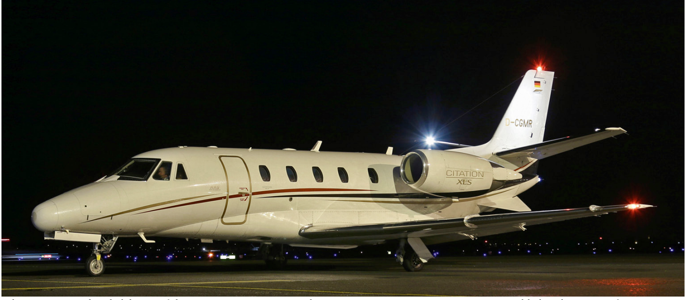
Pilot International took delivery of this Cessna 560XLS in December 2005 as N593XL. In August 2006 it was added to the Jetnova fleet as EC-JXI. Windrose Air Flugcharter acquired it as D-CCEA in March 2008. It finally ended up with Atlas Air Service as D-CGMR from May 2016.