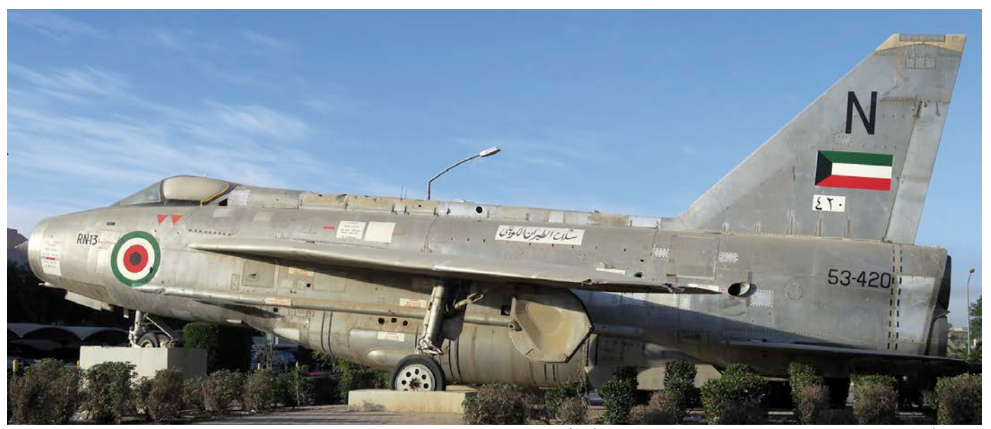
One of many Lightnings still to be found is Shuwaikh Educational Center's 53-420/N. (Kuwait City, 17 January 2018)

07-7176 C-17A 436th AW 17 The tankers flew missions and above does not represent a full report of their movements. Another C-17A departed Friday morning the 19th, around 07:30.