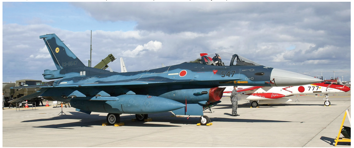
One of the interesting visiting aircraft on the static of the Naha airshow last year was this Mitsubishi F-2 with registration 93-8547 and a nice two tints of blue camouflage of 6 Hikotai, based at Tsuiki. (Naha, 9 December 2017,)