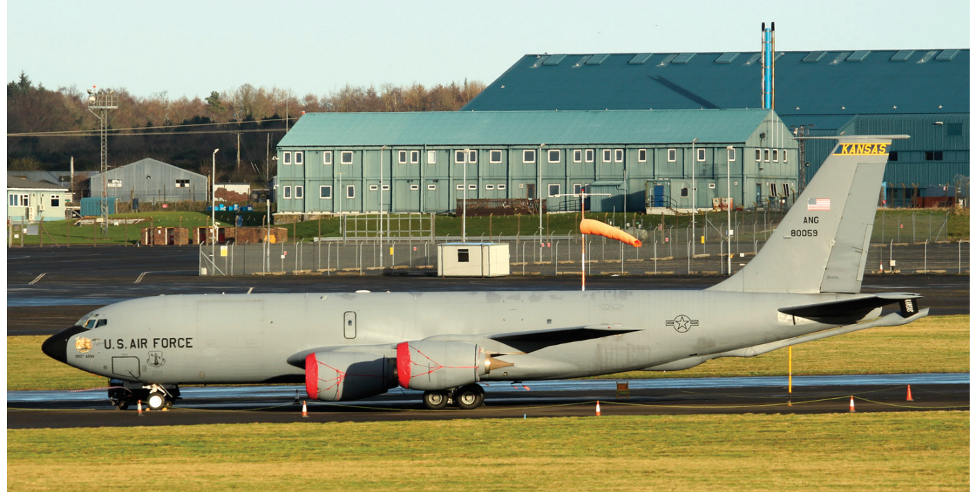
Prestwick is approximately halfway the Middle East and the USA, making it a very interesting place for a good night's rest and/or a fuelstop. For that reason almost daily U.S. military aircraft visit this station. On 27 December 2017 this KC-135R of 117th ARS of the Kansas Air National Guard arrived and stayed until 3 January 2018, giving Douglas Connery the opportunity to take a picture on 28 December. (Prestwick, 28 December 2017, Douglas Connery)