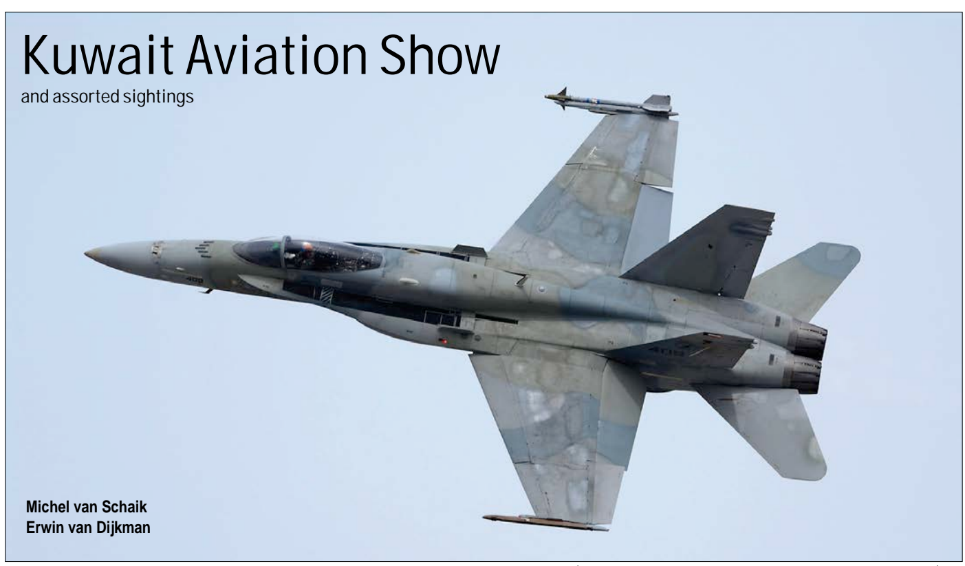
One of KAF's single seat Hornets breaks away after a pass. Four featured in a fly-by. (409, Kuwait Intl, 17 January 2018, Erwin van Dijkman)

From 17 to 20 January 2018, the inaugural Kuwait Aviation Show was held. Venue for this was Kuwait City International airport, the ramp adjacent to the Amiri VVIP flight terminal to be exact. Kuwait is not visited by many tourists, let alone aircraft enthusiasts. So frankly, we did not know what to expect. It turned out to be rather more laid back than we expected. Security was in place, but the whole atmosphere was far more relaxed than in Bahrain for example.