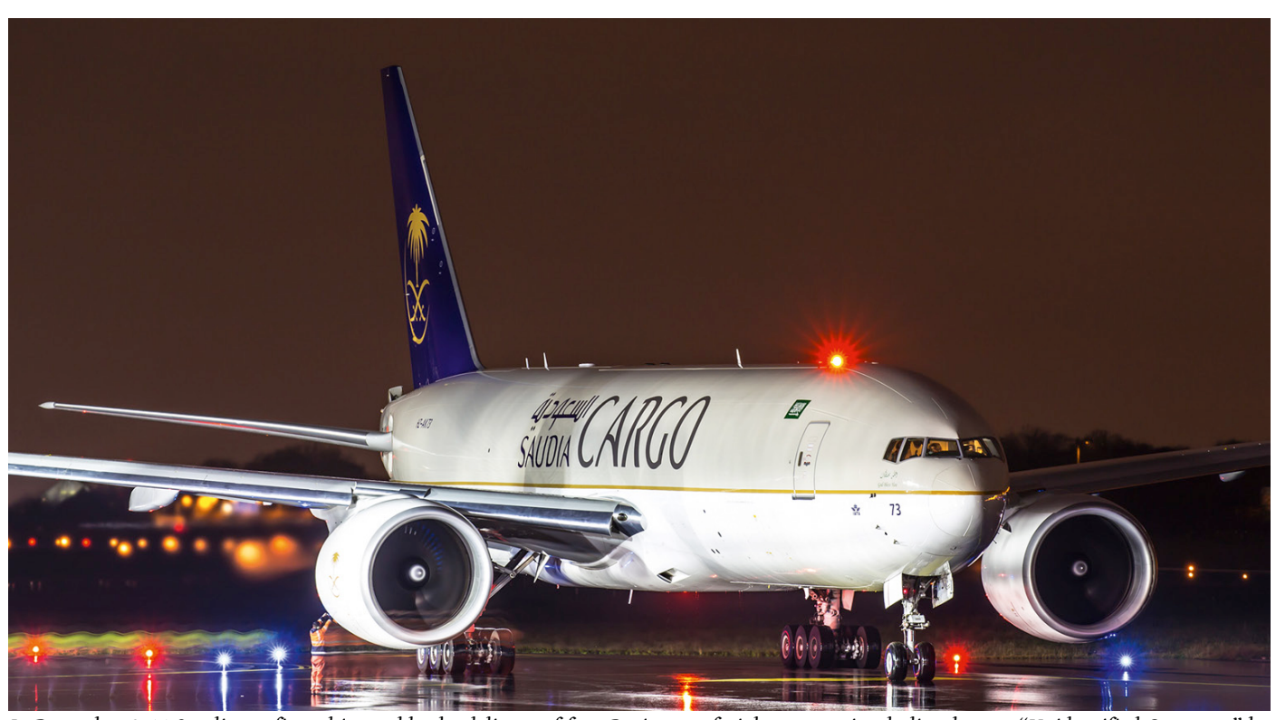
In December 2014 Saudia confirmed it would take delivery of four Boeing 777 freighters, previously listed as an "Unidentified Customer" by Boeing. The first was delivered in April 2015 and the last in December 2015. HZ-AK73 was the third freighter and was added to the fleet in November 2015. (Maastricht - Aachen, 14 December 2017, Bjorn van der Velpen) Personal copy

December 2017 01.PH-FJK Ce525B JetNetherlands