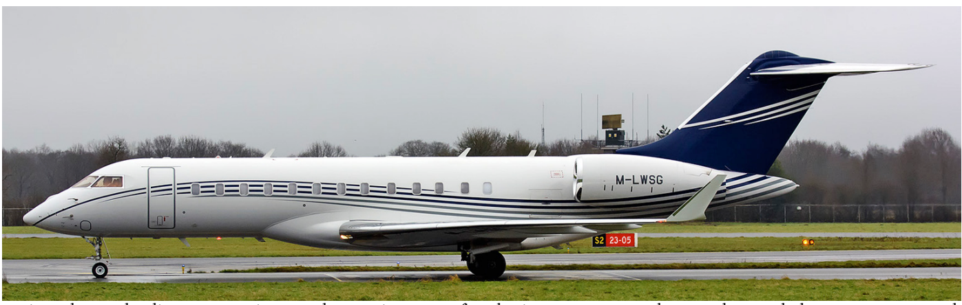
Registered to Bombardier as C-GVXG in September 2013 it was transferred to its US counterpart almost twelve months later as N116SF. As such this bizjet was delivered to Alten Consulting. Since June 2017 the Global 6000 is registered as M-LWSG with Lynx Aircraft as owner. (Groningen-Eelde, 21 December 2017, Simen Dorschman)