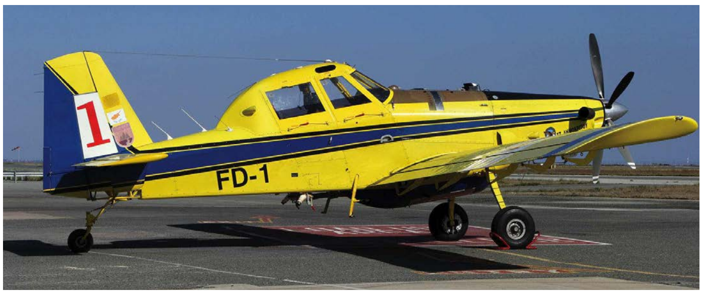
This photopage is dedicated to the little but important forest fighters of the south eastern part of Europe. FD-1 is an Air Tractor AT-802F operated by the Department of Forests, branch of Cypriot Ministery of Agriculture. (Larnaca, 9 November 2017, Frank Kramer)