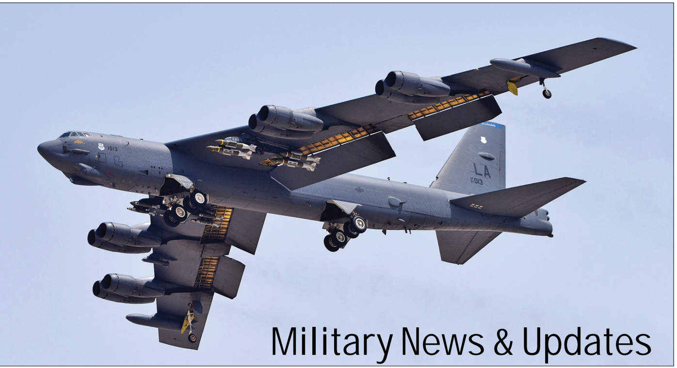
The B-52H Stratofortress, 61-0013/LA, assigned to the 69th Expeditionary Bomb Squadron, normally asigned to the 20th BS based at Barksdale AFB (LA), operating out of Al Udeid Air Base (Qatar) became the first B-52 in the U.S. Air Force to employ the conventional rotary launcher upgrade in combat operations on 18 November 2017. The upgrade enables a bomber to carry eight additional smart munitions inside its bomb bay, in addition to those that are carried on the wings as visible on the photo made by Taff Evans on 26 July 2017 at Al Udeid.