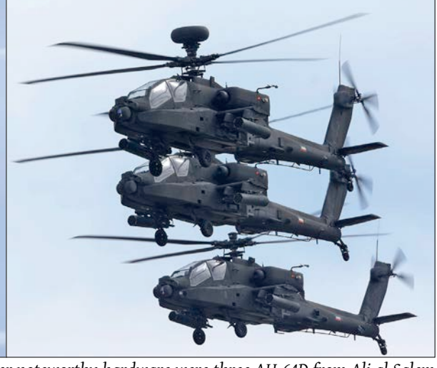
Soloturk did his magic at KAS2018 with an energetic aerial demonstration. Other noteworthy hardware were three AH-64D from Ali al Salem Air Base that performed a flypast at the show's opening. (Kuwait Intl, 17 January 2018,)