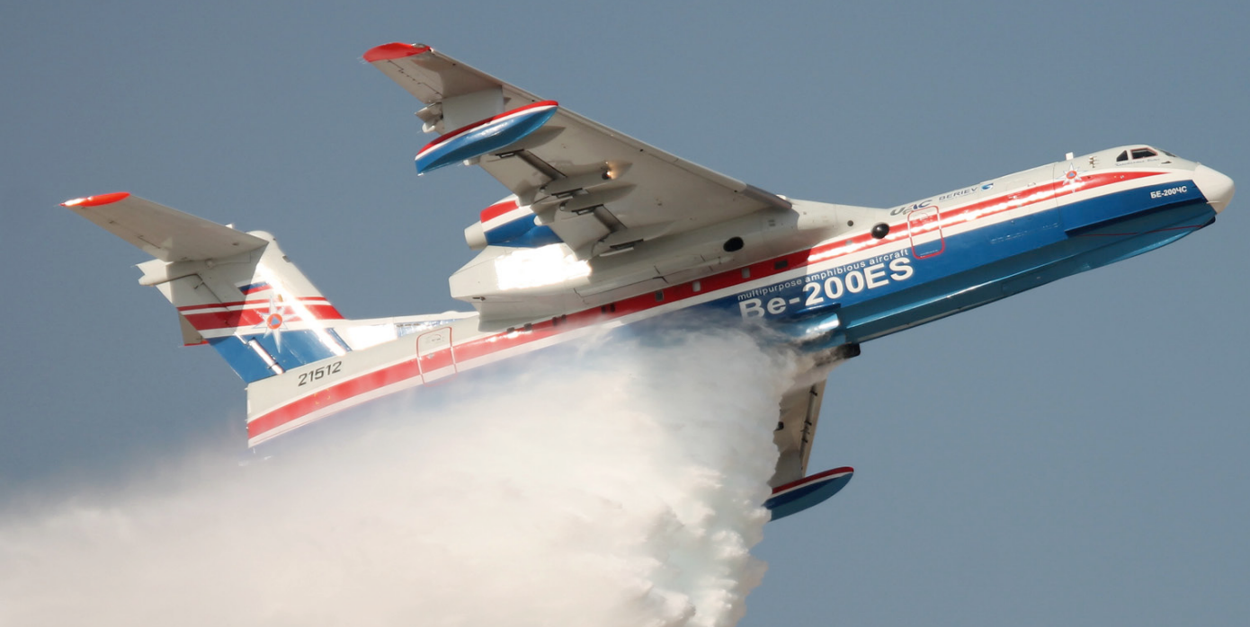
The Beriev Be-200 Altair is a multipurpose amphibious aircraft designed by the Beriev Aircraft Company and manufactured by Irkut. The name Altair was chosen after a competition amongst Beriev and Irkut staff in 2002/2003. The Be-200ChS variant, or Be-200ES (Emergency Situations), is the Multirole model fitted to the requirements of the Russian Ministry of Emergency Situations. The aircraft on the photo made its first flight on 27 August 2002 as RA-21512. It was logged as RF-21512 while operated by SoREM (Società Ricerche Esperienze Meteorologiche) in Italy in August 2004. Two years later the aircraft was being operated by TANTK (Taganrogskiy aviatsionnyy nauchno-tekhnicheskiy kompleks) for Portuguese Serviço Nacional de Bombeiros. In 2008 the Beriev was modernised to production standard. At the recent held "Dubai Airshow 2017" (12-16 November 2017) the aircraft was flying as 21512. (Dubai World Central, 15 November 2017, Jan Gerrits)