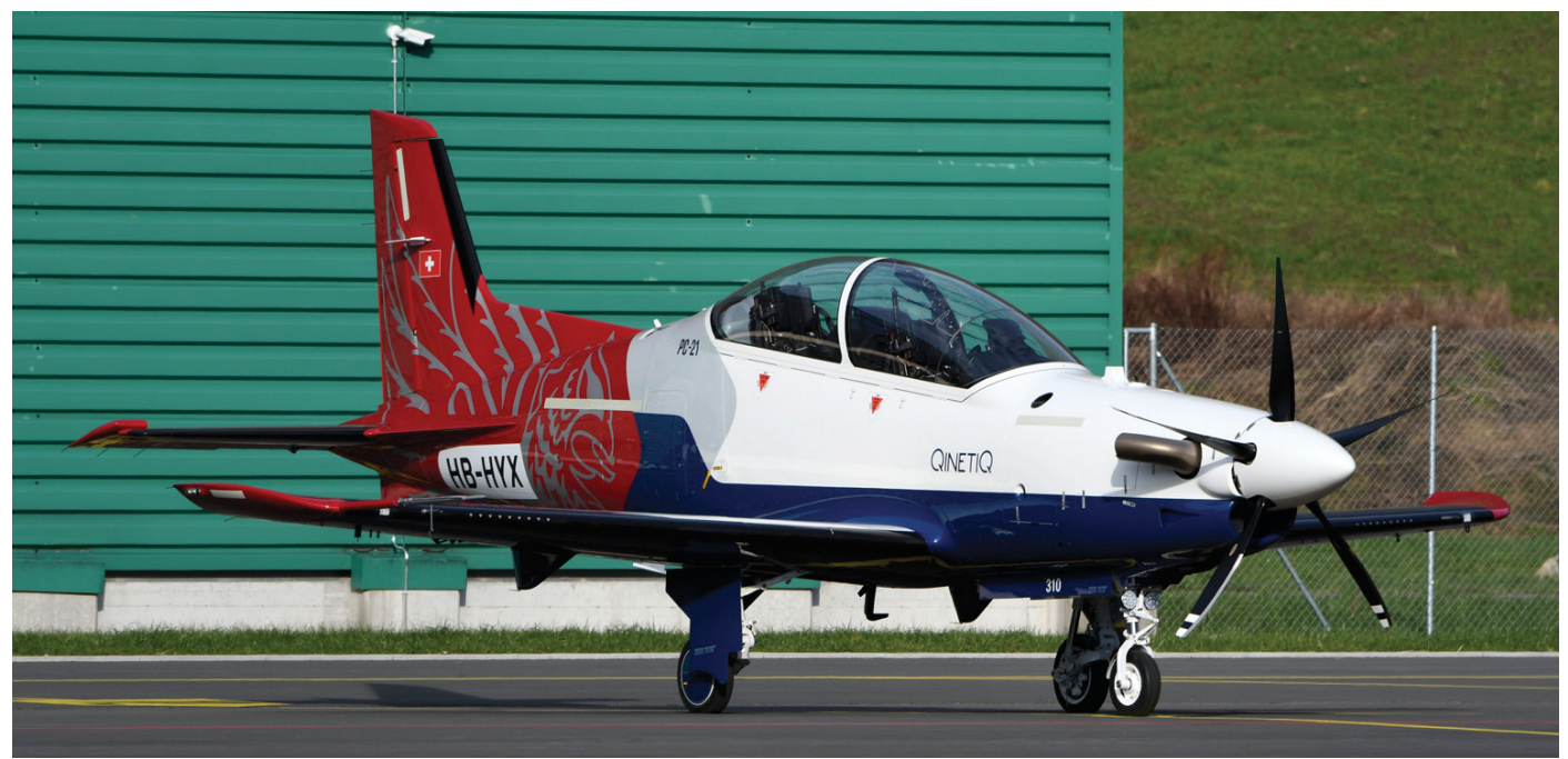
On Monday the 15th of January 2018 the the first PC-21 for QinetiQ made its first flight. For this it used test flight registration HB-HYX but will finally become the G-ETPA (Stans, 15 January 2018,)

The Serbian Ministry of Defense is planning to purchase S-300 long-range surface-to-air missile systems and seven Mikoyan MiG-29 fighter jets from Belarus. The deals were to be signed in November 2017 during an official visit by Serbian President Aleksandar Vucic to Minsk, where he would meet with