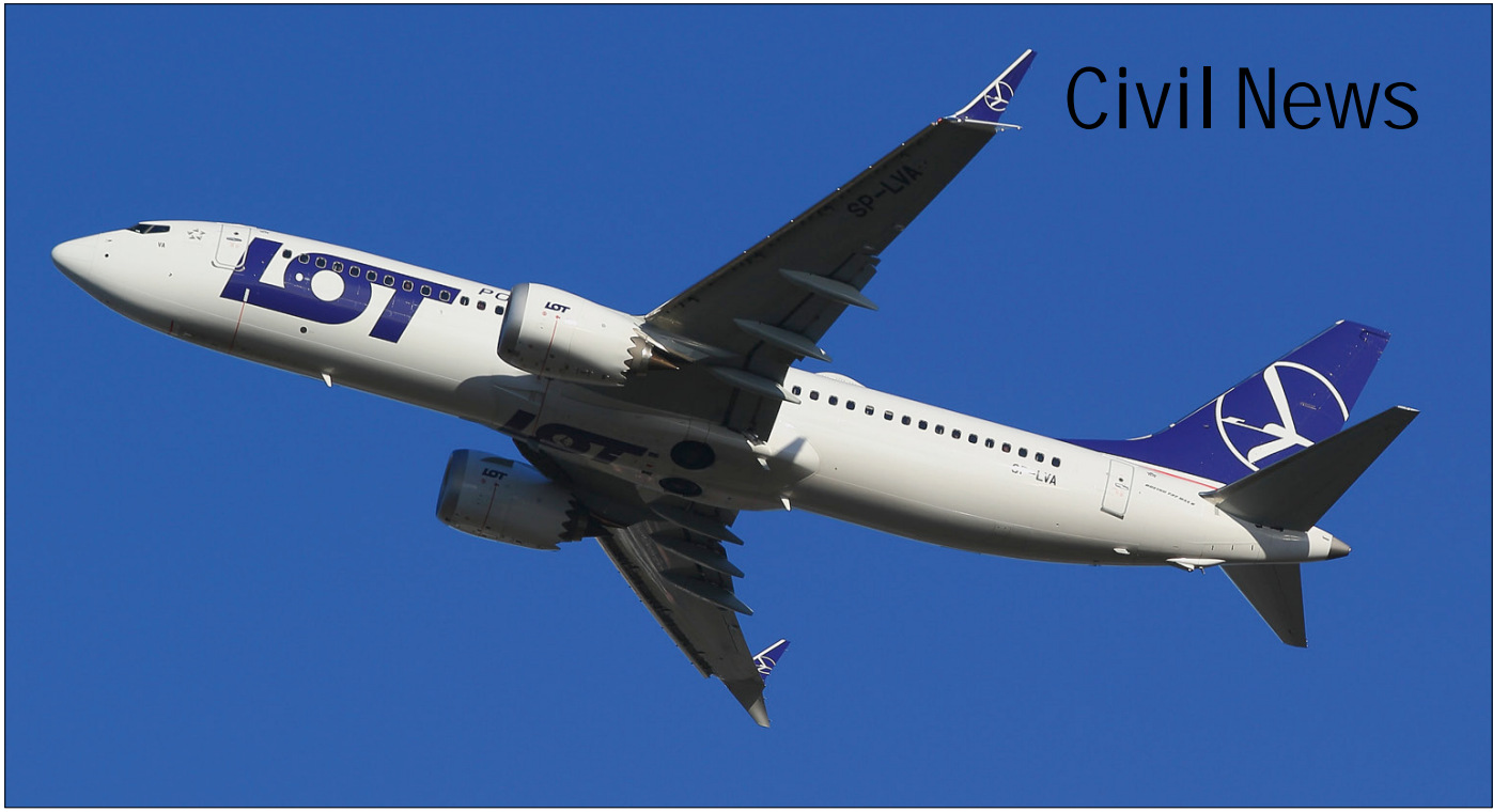
Last December LOT recieved its first two Boeing 737-8 aircraft. SP-LVA was the first one and was ferried from Seattle (WA) to Warsaw on 1 December. Sister ship SP-LVB followed two and half weeks later. Four more 737-8s will follow in the coming two years This picture of SP-LVA taking off from a sunny London-Heathrow, clearly shows the new tail cone design, the new ATP-winglet and the serrated engine cowlings, which distinguish a 737-8 from a 737-800 from the outside. (28 December 2017,)