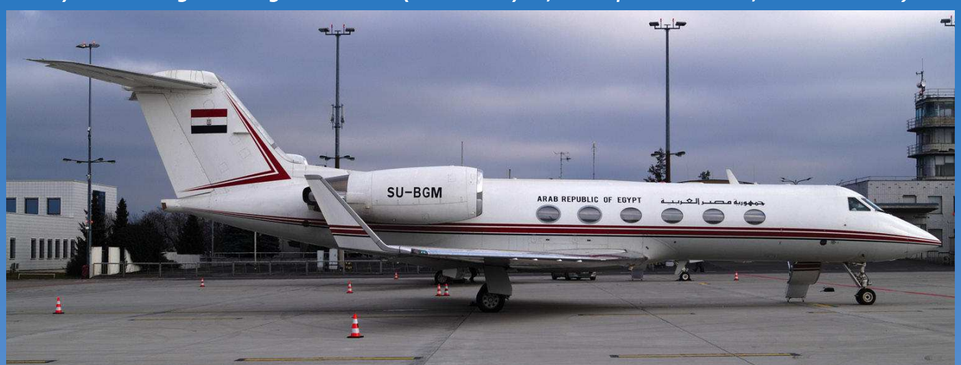
During its 30 years of operation on his Governments Service, also this Gulfstream IV SU-BGM/921 is hiding its true military identity, as was revealed on the Flight Plans when flying to Praha (Praha-Ruzyně, 13 January 2018,)