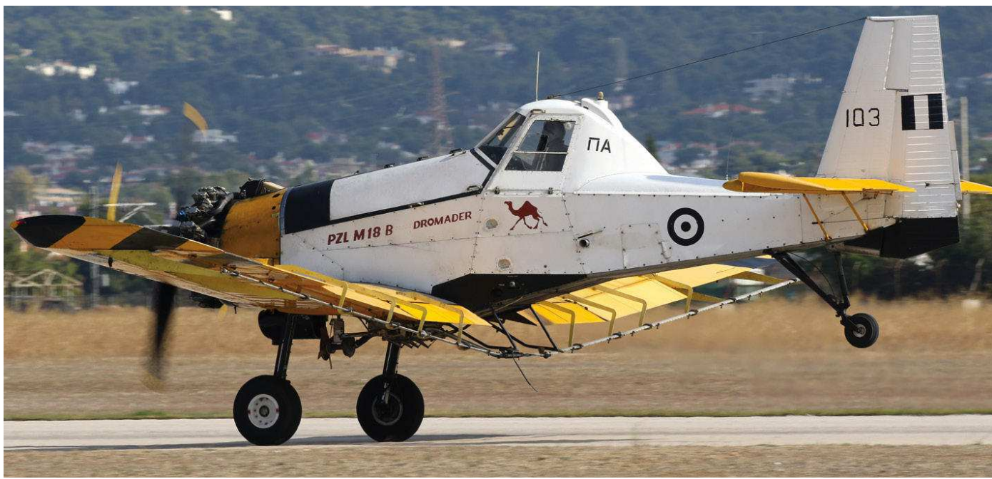
Up north in Greece, the initial forest fires are detected and suppressed by a fleet of PZL-Mielec M18B Dromadar like this 103. (Tatoi, 6 November 2017, Frank Kramer)

Personal copy Distribution to a third party is not allowed