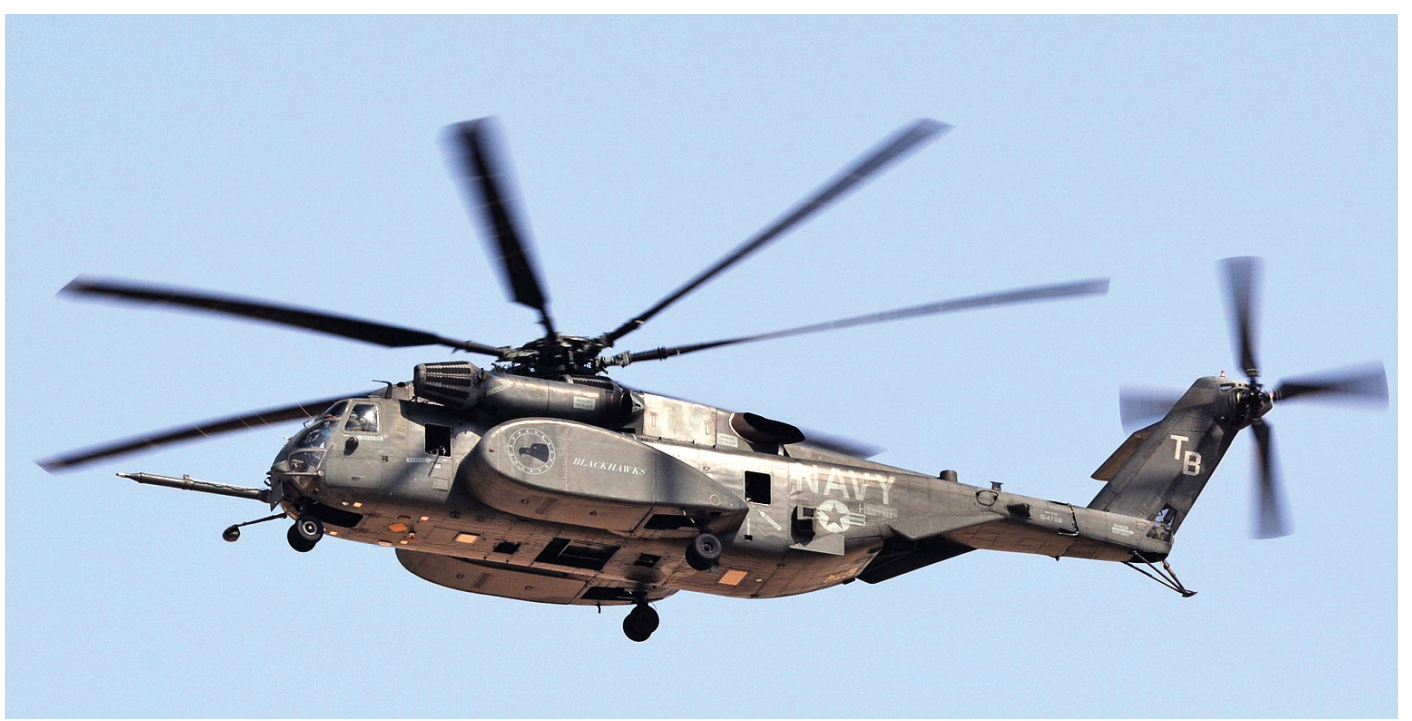
HM-15 is a Helicopter Mine Countermeasures Squadron that flies the MH-53E Sea Dragon. These guys must have some envy on US Army UH-60 helicopter pilots, as they like to call themselves 'the Blackhawks' But they do not have to feel setback as the MH-53 is much more impressive than its army counterpart. 164768 was seen over Al Udied by Taff Evans on 29 February 2016.