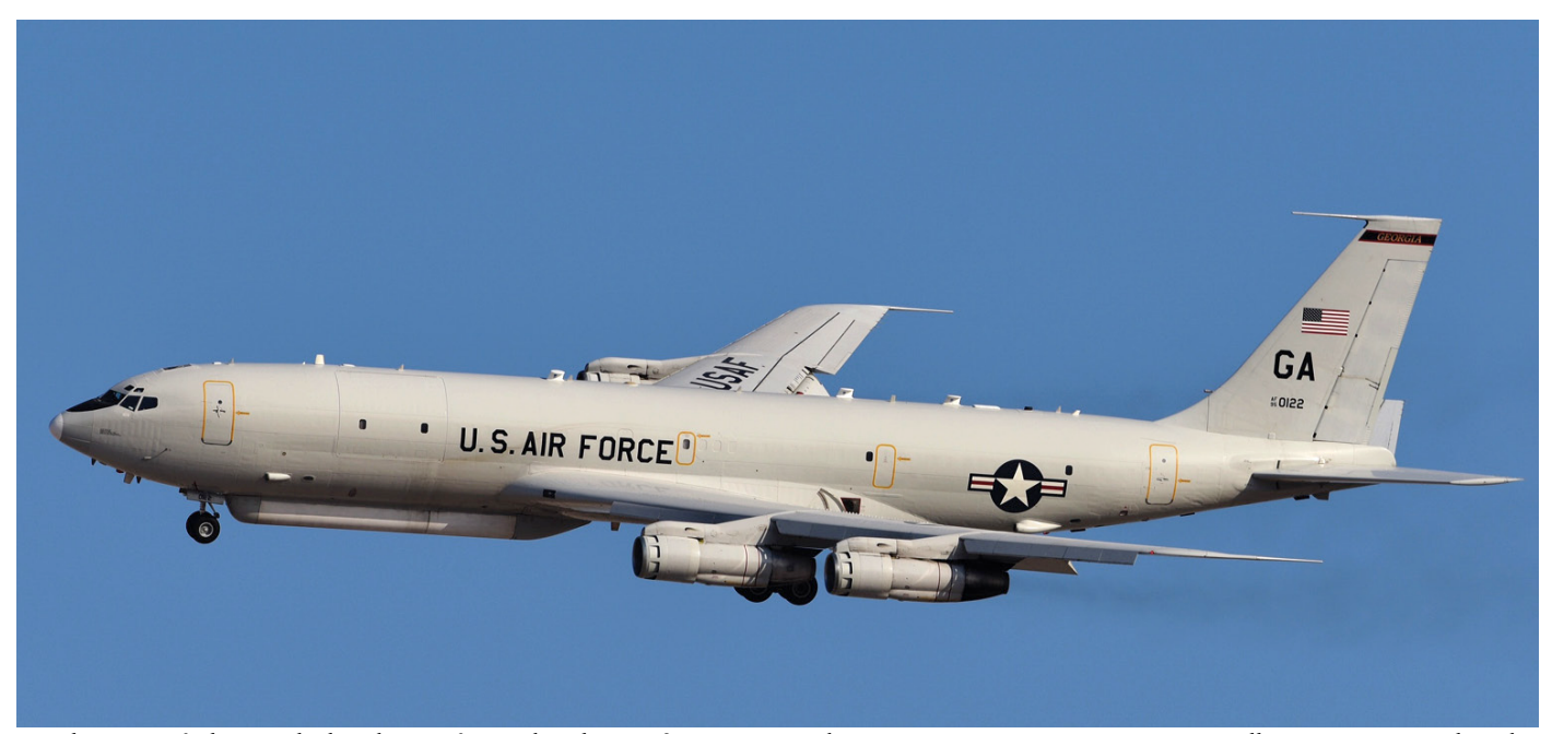
Another aircraft that can be handy on a forward air base is flying command post Boeing E-8 JSTARS or Joint Surveillance Target Attack Radar System. And although originating from fiscal year 1995 it is still powered by real environment unfriendly Pratt & Whitney TF33 PW-102 turbofans 95-0122.

Already being deployed since the end of August 2017 as the 493rd Expeditionary Fighter Squadron (EFS), the 493rd Fighter Squadron, part of the 48th Fighter Wing, handed over the transfer of authority for NATO's Baltic Air Policing (BAP) mission to a Danish F-16 unit at Siauliai Air Base in Lithuania on 8 January 2018. Having lead the 45th rotation of the BAP mission, the 493rd EFS was scrambled in the Baltics for almost sixty times. The Lakenheath squadron specifically, conducted approximately thirty real intercepts over the course of the deployment. The four LN coded F-15Cs dedicated to the BAP mission completed a total of roughly 3,000