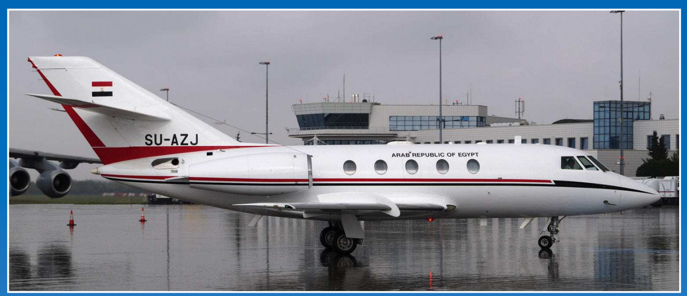
This month the backpage of Scramble is devoted to the navigation training flights the Egypt Air Force conducts to Praha airport. The first one, Falcon 20 SU-AZJ/910, is going to celebrate its 40th year working for the government. (Praha-Ruzyně, 17 September 2017, Václav Kudela)