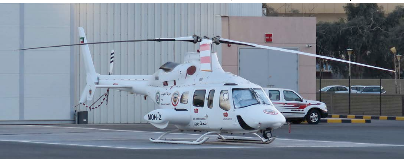
The emergency services use four helicopters that are based at a heliport inside the Al Sabah hospital complex on the coast. Two Bell 430 and two brand new Bell 429 are on strength. (Kuwait City-Al Sabah, 18 January 2018, Erwin van Dijkman)