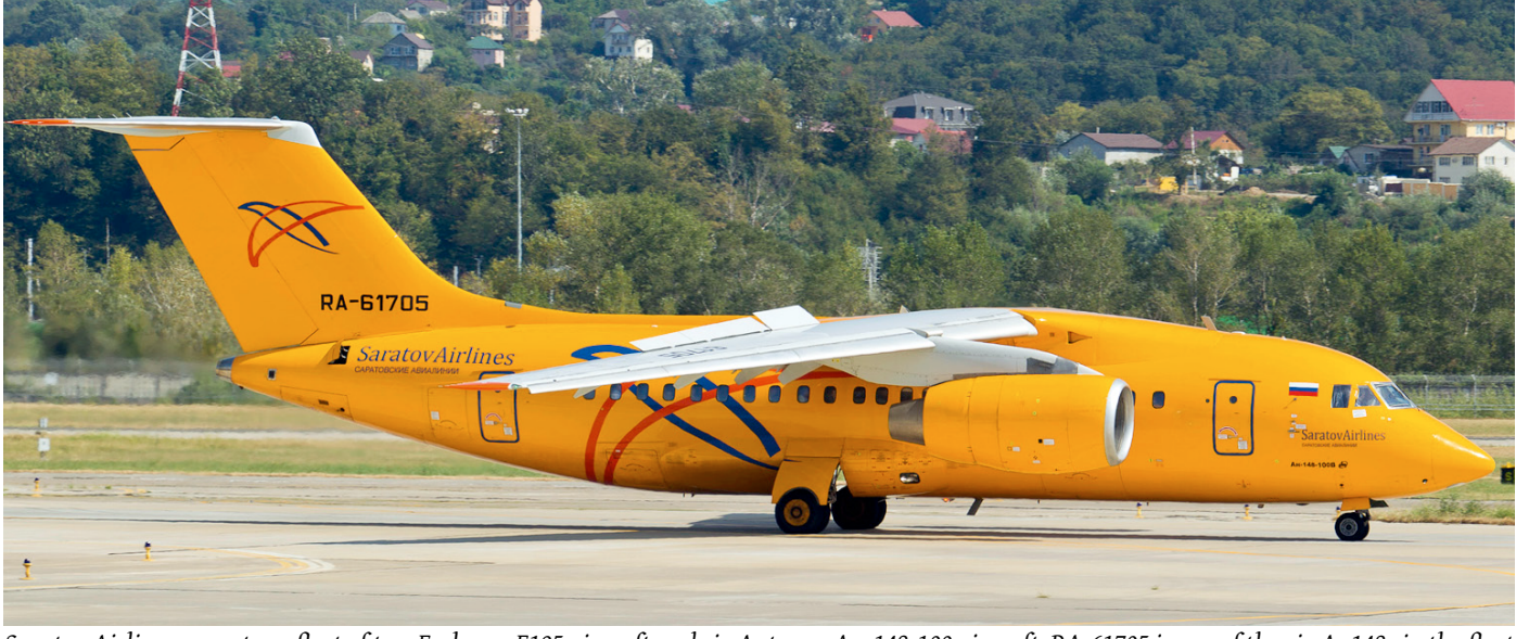
Saratov Airlines operates a fleet of two Embraer E195 aircraft and six Antonov An-148-100 aircraft. RA-61705 is one of the six An148s in the fleet and is seen here at Sochi International. (19 August 2017, Andre Alders)