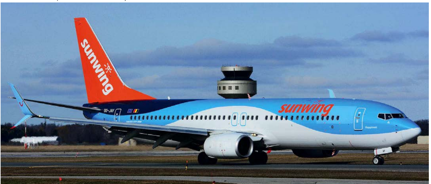
Jetairfly has been a winter partner for Sunwing Airlines for a long time now and the name change to TUI Airlines Belgium did not change that. Boeing 737 OO-JAV is a first timer as it operates in Canada this winter for the first time. (Hamilton (Ont.), 26 January 2018,)