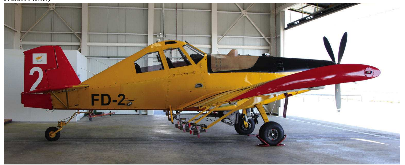
FD-2 being an Ayres Thrush S2RHG-T65 complements the two-aircraft fleet of the Dept. of Forests. (Larnaca, 9 November 2017, Frank Kramer)