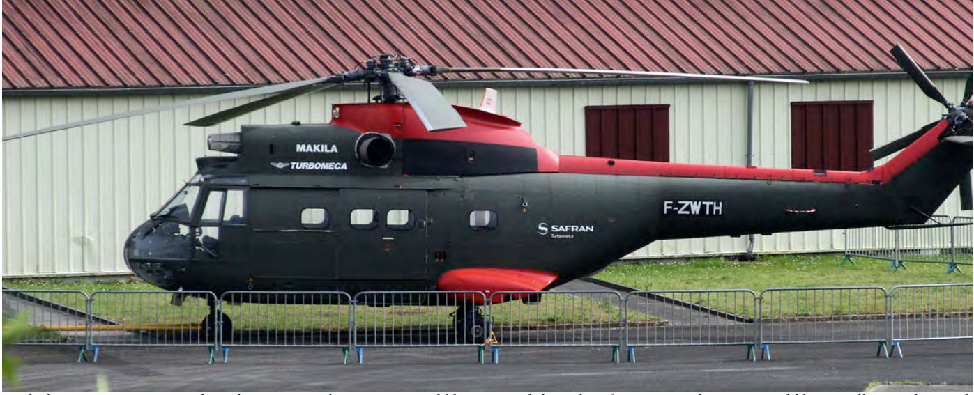
With the NATO Tiger Meet taken place at Mont de Marsan it could be expected that a lot of aviation enthusiasts would be travelling in the South of France. Noted parked outside the Musée de l'Aviation Légère de l'Armée de Terre at Dax is SA330B 1200/F-ZWTH, an aircraft which was used by the engine factory for tests. (16 May 2019,)