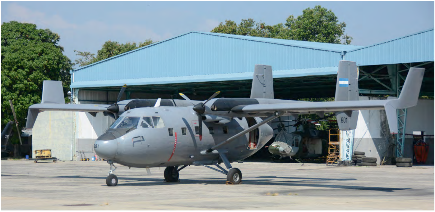
Always a great catch is an IAI Arava, especially when it is an operational one. IAI202 801 of the air force of San Salvador was caught on the Ilopango apron on 19 Februay 2019.