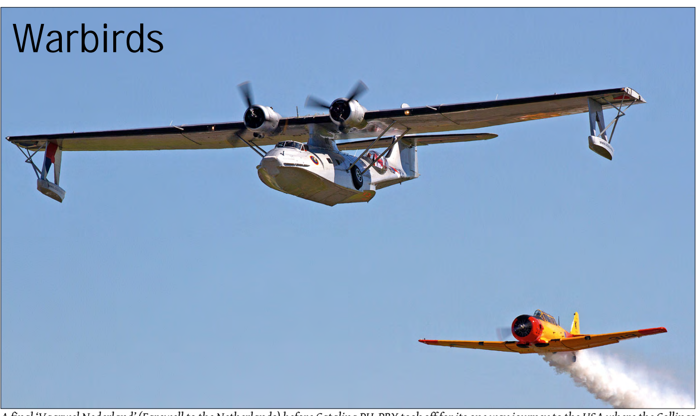
A final 'Vaarwel Nederland' (Farewell to the Netherlands) before Catalina PH-PBY took off for its one way journey to the USA where the Collings Foundation will, from now on, take good care of her. We're gonna miss you, Cat! (Lelystad, 29 May 2019,)