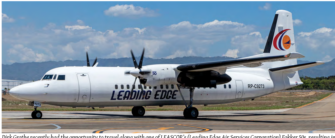
Dirk Grothe recently had the opportunity to travel along with one of LEASCOR's (Leading Edge Air Services Corporation) Fokker 50s, resulting in some beautiful pictures! RP-C9273 (msn 20258) was delivered last December and was seen on 17 April 2019 at Clark AFB (or Lapu-Lapu Mactan International Airport), Philippines.