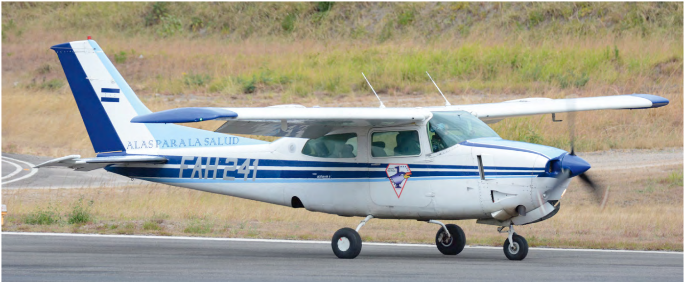
Cessna T210N, serial 241, with Alas Para Salud titles is one of the impounded aircraft with the Fuerza Aerea Hondurena. The aircraft has an 1 Grupo Tactico badge on the door. (Tequcigalpa-Toncontin, 21 February 2019)