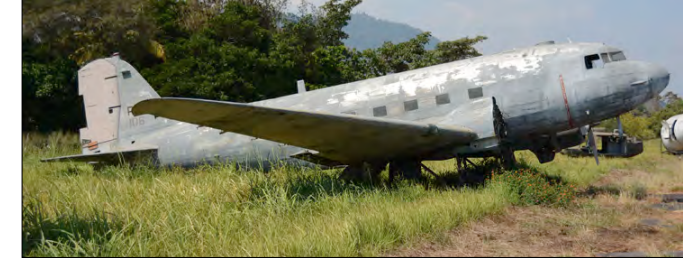
Stored on the old runway, 106 is one of several C-47s slowly fading away at Ilopango. (19 Februay 2019)