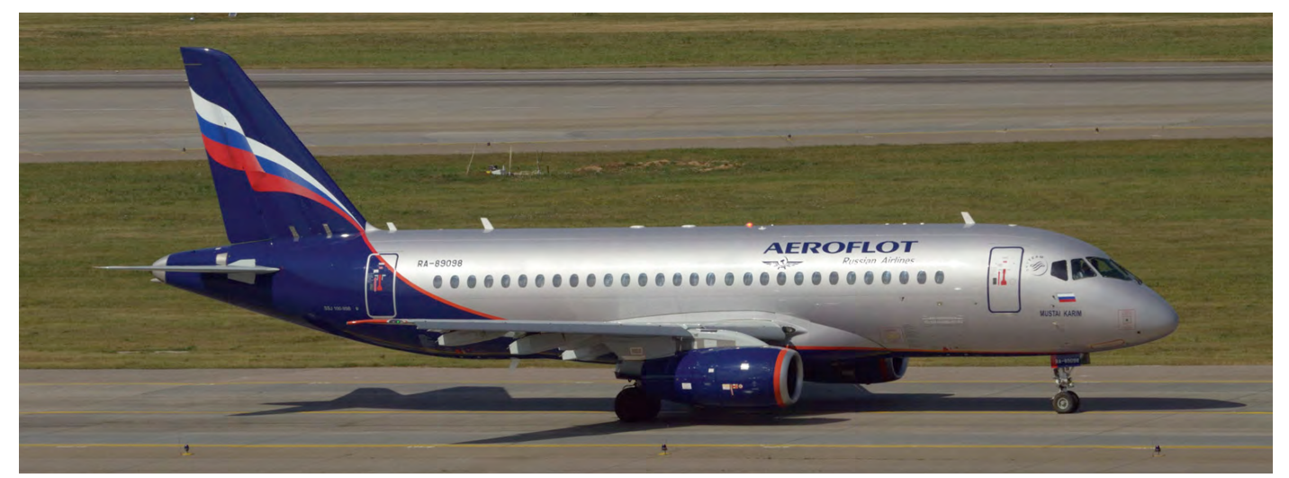
Aeroflot RRJ-95B RA-89098 was destroyed after it encountered a lightning strike during the climb out from Moscow-Sheremetyevo. This resulted in the loss of the radios and autopilot, among others. The crew wisely decided to return to SVO, but during the landing things went haywire, eventually resulting in the loss of the airframe. Ron Frijlink captured the Sukhoi SuperJet at Sheremetyevo on 28 August 2018.

The circumstances were not exactly clear why the <u>SPC Leasing</u> Piper Seneca V impacted airport terrain when taking off from Anderson Municipal Airport-Darlington Field (IN). The pilot was seriously injured and airlifted to hospital while the Piper was destroyed.