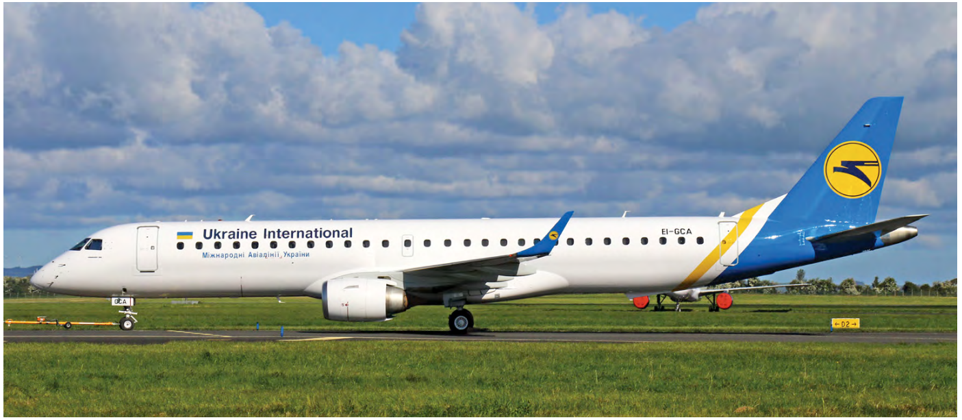
Embraer 195 EI-GCA was delivered 21 May 2019 to Ukraine International Airlines, registered as UR-EMF. This aircraft started flying back in 2007 as G-FBEC with Flybe. In July 2015 it became TC-YAO of AnadoluJet and thereafter Borajet Airlines. (Shannon, 11 May 2019,)