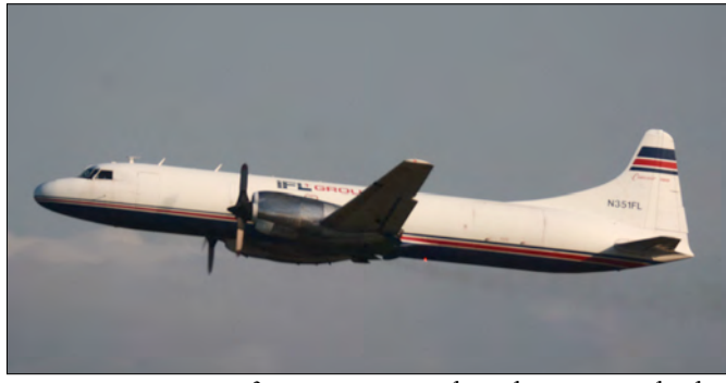
Convair 5800 N351FL of IFL Group is seen here departing in the distance from San Pedro Sula, on 26 February 2019.