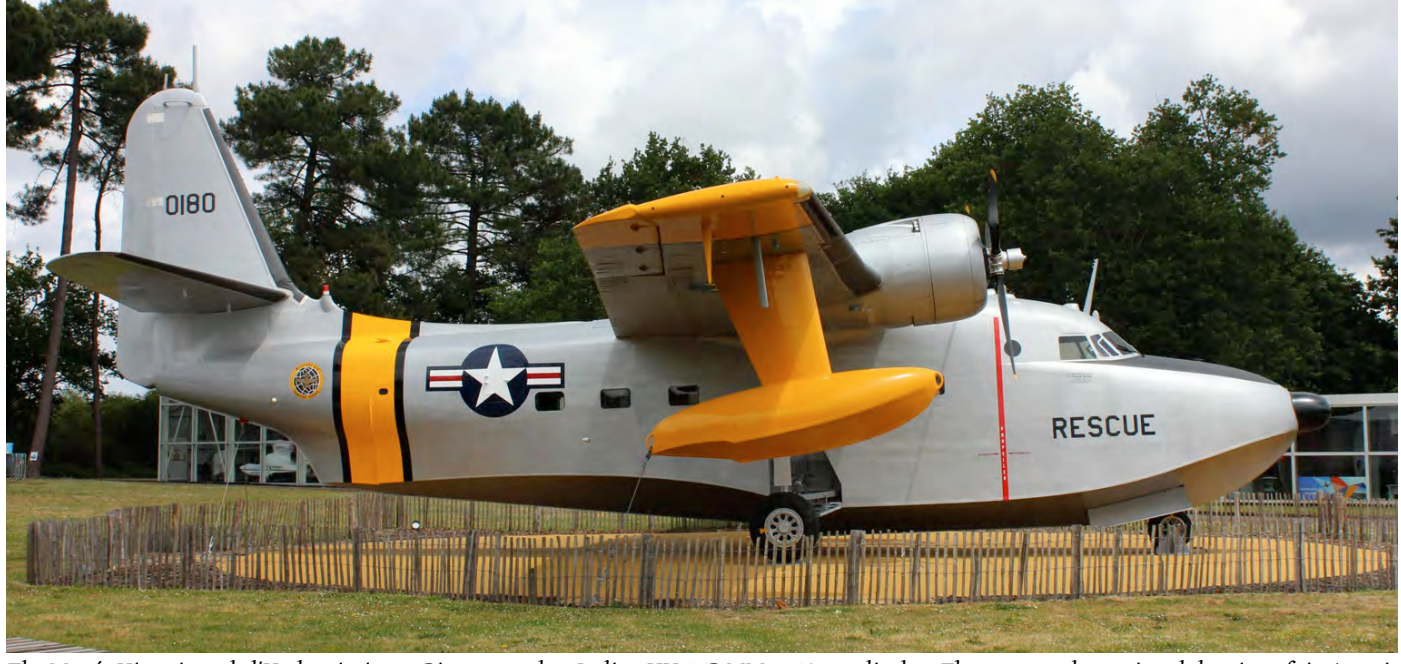
The Musée Historique de l'Hydraviation at Biscarrosse has Italian HU-16B MM50-180 on display. The museum has painted the aircraft in American markings. (May 2019, Daniele Mattiuzzo)