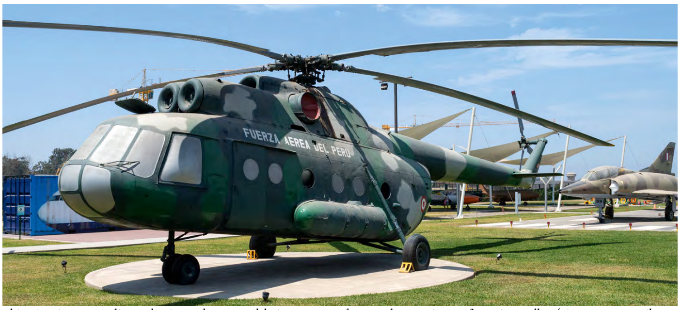
This Mi-8T is 633 according to the sign at the Parque del Aire near Las Palmas. In that case it came from Lima-Callao. (Lima-Surco, 7 April 2019, Walter Vallejos)