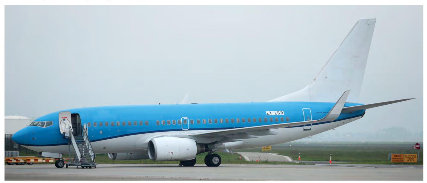
KLM has already started to phase out the 737-700. Two aircraft (PH-BGD and PH-BGE) have left the fleet and found a new home in Luxembourg with Luxair. PH-BGD is seen here on the morning of its departure to Kanaus for probably some re-delivery maintenance prior entering service with Luxair. It is still painted in the full KLM colours but without titles and already wearing its new registration LX-LBR. (Amsterdam-Schiphol, 21 May 2019,)