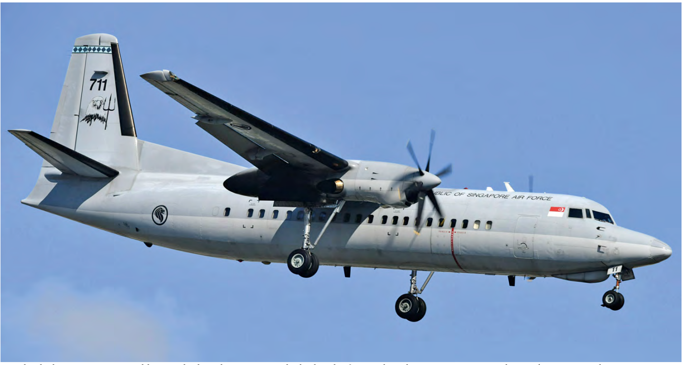
We think the Singaporean Fokker 50s look rather smart with the bright flag and Brahminy Kite unit markings. (711, Paya Lebar, 24 May 2019,)