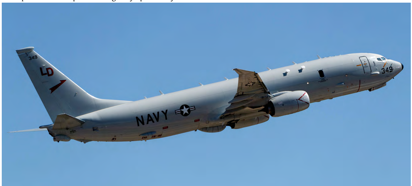
This VP-10 Poseidon 169349/LD-349 is seen climbing out of Rota Naval Air Station, near sunny Cadiz in Spain. (27 May 2019, Patrick Roegies)

The Initial Operational Capability of the MQ-25 is expected in 2024, but when the programme runs as expected, that could be accelerated too. It is expected that the MQ-25As will be paired with the US Navy's E-2C/D Hawkeye community, likewise the MQ-8 Fire Scout Unmanned Aerial Systems are paired with the MH-60R Seahawk community. To fulfil this job, Hawkeye pilots and naval flight officers will crosstrain to operate the MQ-25A from the carrier. The Navy is