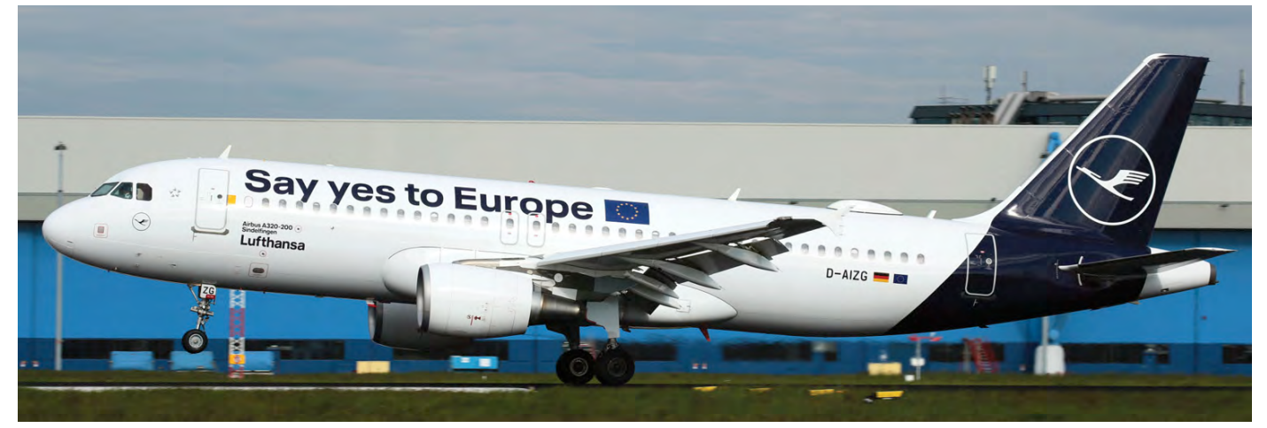
To support the European elections and the European Union in general, Lufthansa painted "Say yes to Europe" titles on this Airbus A320 D-AIZG. We had a quick look at the aircraft's flight history and we wonder if it is a coincidence that since these pro-European titles have been applied, the aircraft has flown to all regular destinations in Lufthansa's European network except for those in England. Fear for Brexiters? (Amsterdam-Schiphol, 16 May 2019,)