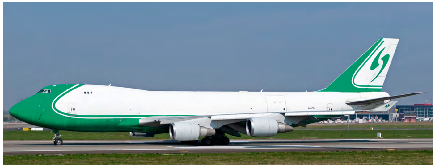
Originally delivered to Jade Cargo International in August 2007 this Boeing 747 was acquired by Cargo Air Lines in January 2019. 4X-ICD still carried the basic colours of the former Shenzhen based airline. (Liège, 7 April 2019, Jesse Vervoort)