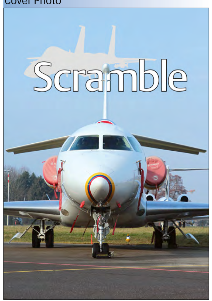
Dassault 7X FAE-052 of Ala de Transportes No.11/Escuadrón de Transporte 1114 provided Ecuadors VIP transport during this years WEF. (Zurich-Kloten, 23 January 2019)

If you would like to subscribe to our digital magazine, go to www.pocketmags.com and search for "Scramble"