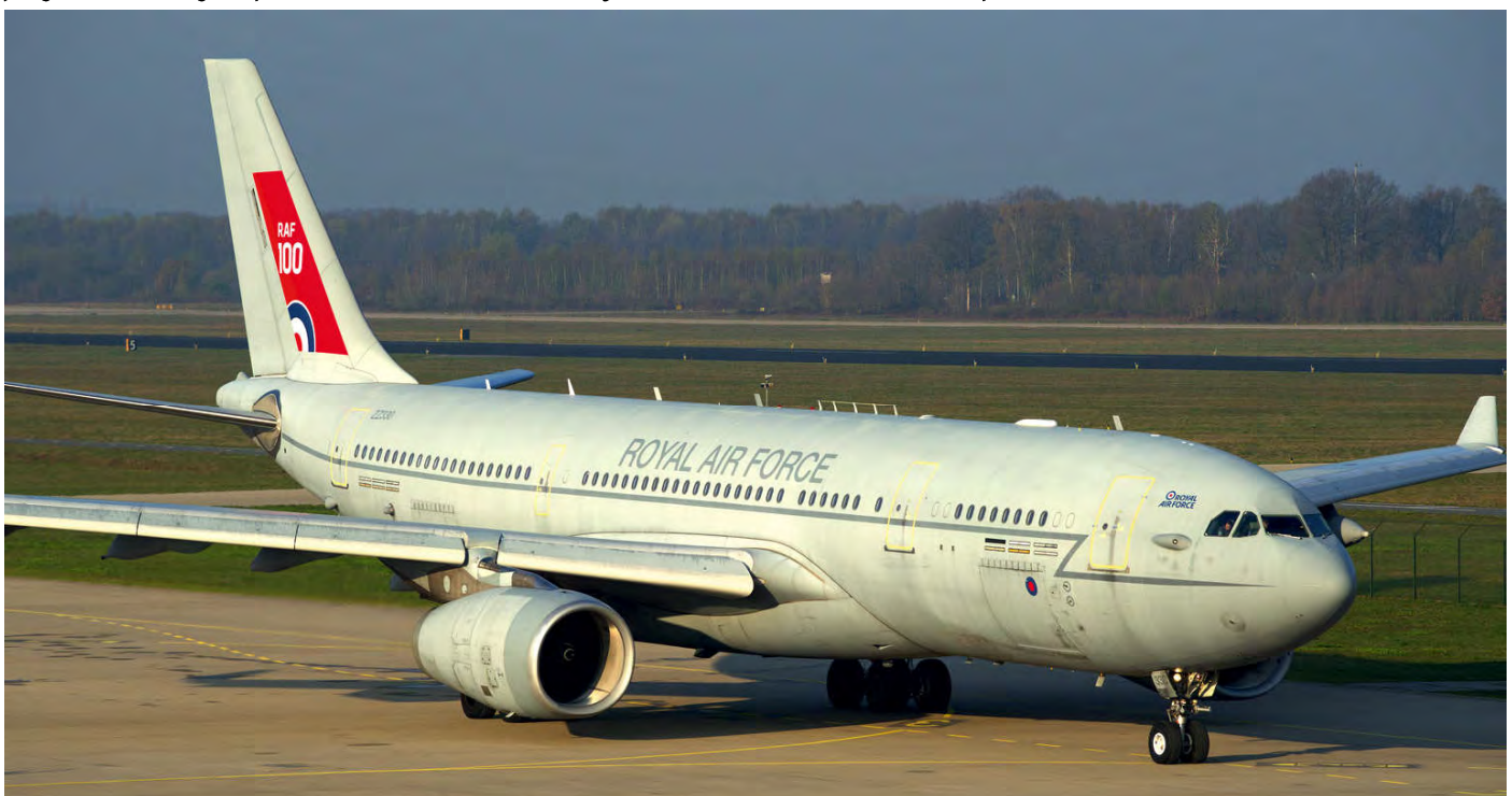
The Royal Air Force already operates a fleet of no less than twelve Voyagers. Voyager KC2 with serial ZZ330 attended this year's EART edition. It is the first Voyager which was delivered to the Royal Air Force back in 2011. (Eindhoven, 7 April 2019, Robert Flinzner)