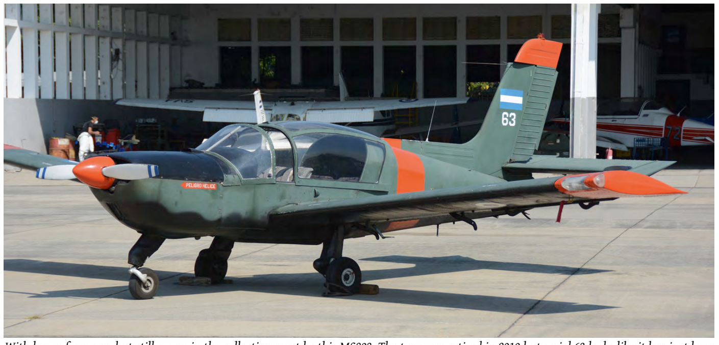
Withdrawn from use, but still a gem in the collection must be this MS893. The type was retired in 2010 but serial 63 looks like it has just been prepared for another flight. (Ilopango, 19 Februay 2019)