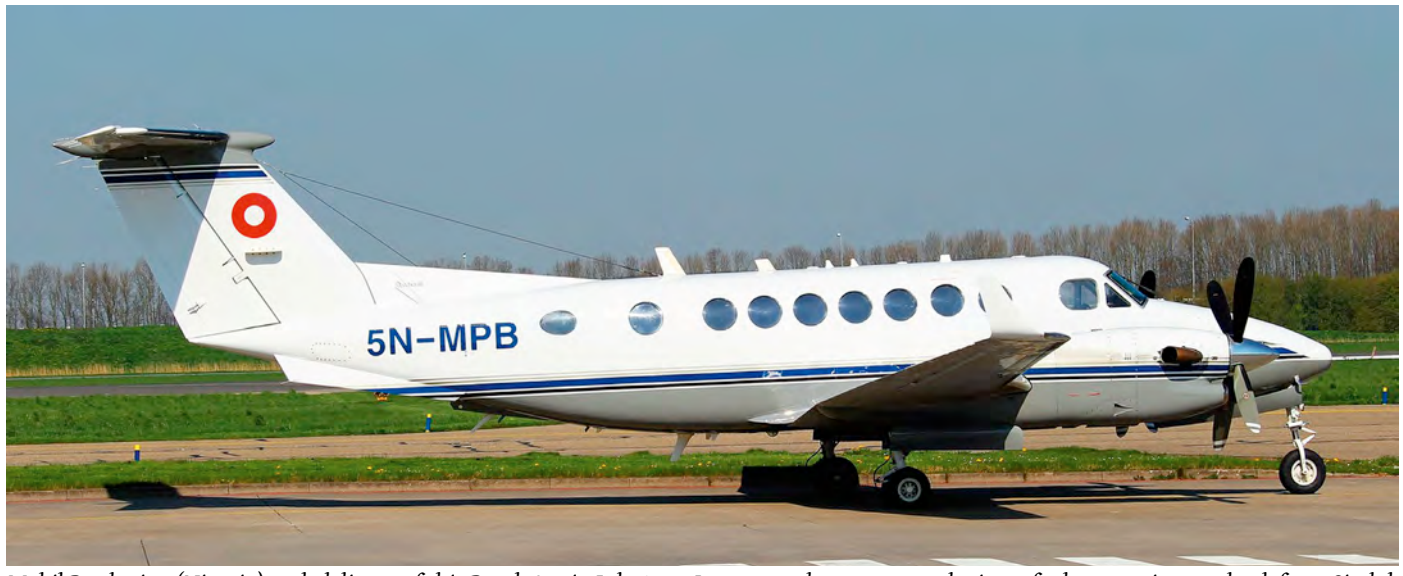
Mobil Producing (Nigeria) took delivery of this Beech 350 in July 1999. It was caught on camera during a fuel stop on its way back from Sindal, Denmark to Lagos, Nigeria. (Lelystad, 8 April 2019, Jan Bekker)