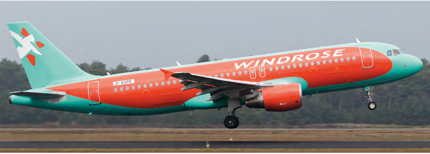
This former Small Planet Airlines Germany Airbus A320 was photographed during a local test flight. D-ASPK was reregistered to UR-WRW early May and delivered to Windrose. (Woensdrecht, 17 April 2019,)