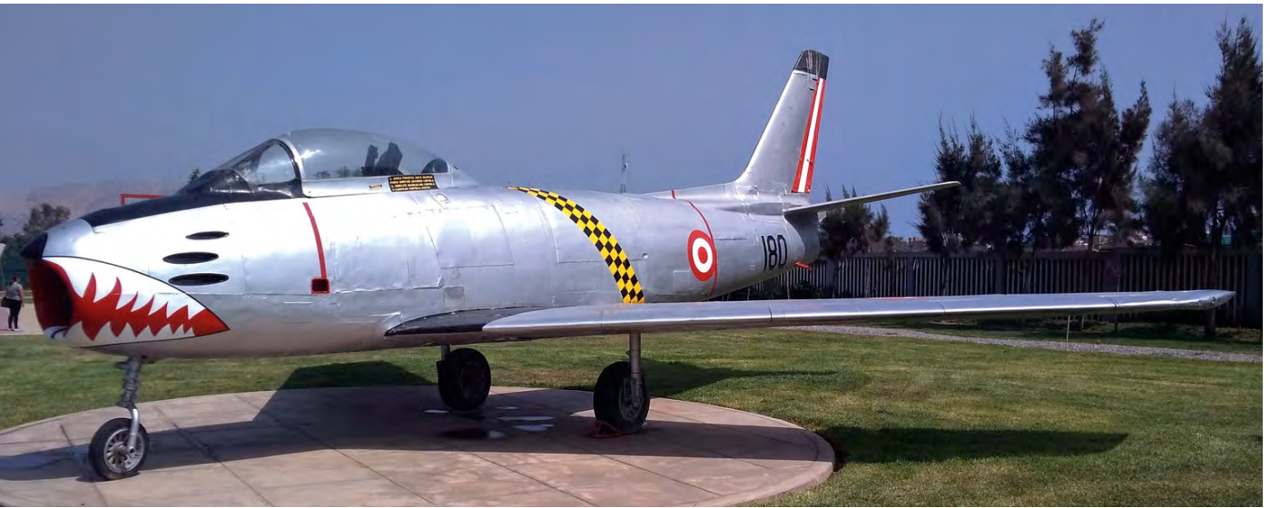
During 2018, the Parque del Aire, just west of Las Palmas air base, was landscaped. It received a dozen aircraft from the now defunct Museo Aeronautico at the base itself. This F-86F 180 was one of them. (Lima-Surco, 18 May 2018, Jose Antonio Camacho Beas)

455/'450' Parque del Aire ex Mus. Aeron. SPLP apr18