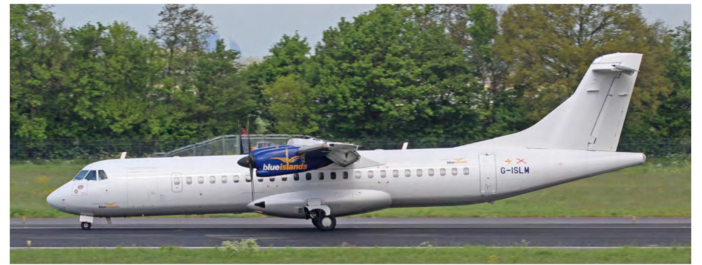
ATR72 G-ISLM replaced ATR42 G-ISLF in the Blue Islands fleet. This ATR72 was added to the fleet in 2018 and is being operated in these mostly white colours. (Rotterdam -The Hague, 28 April 2019)