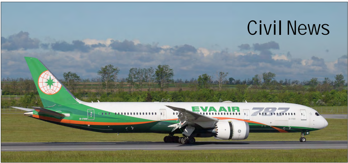
EVA Air is one of the latest operators of the Boeing 787. It received its first 787-9 early October 2018 and today all four ordered 787-9s have been delivered to the Taipei based airline. However, besides these four 787-9s, EVA Air has twenty 787-10s on order from which the first will be delivered in June.