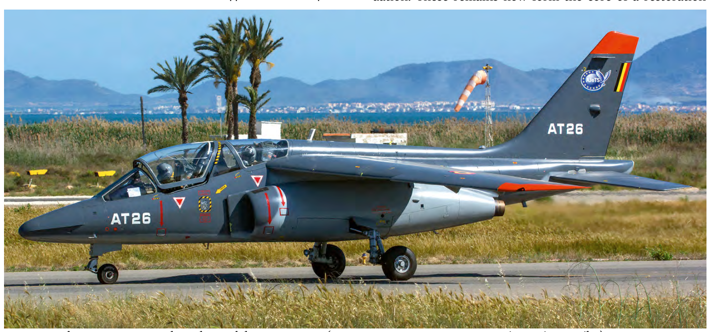
Seen in a rather exotic setting is this Belgian Alpha Jet 1B+ AT26. (Murcia-San Javier, 15 May 2019, José Damián González)

To celebrate the 75th anniversary of the Royal Norwegian Air Force, an F-16BM (serial 691) received a special paint scheme with the aircraft painted in the colours of a Spitfire the air force once used. That special aircraft involved is Spitfire IX, PL258 FN-K, of 331 (Norwegian) Squadron. This particular aircraft has a Norwegian wartime history. FN-K crash landed on 29 December 1944 near Tubbergen, in The Netherlands. The aircraft landed on its belly in a field. Remains of the wreckage were located by a team of the Norwegian Spitfire Foundation. These remains now form the core of a restoration