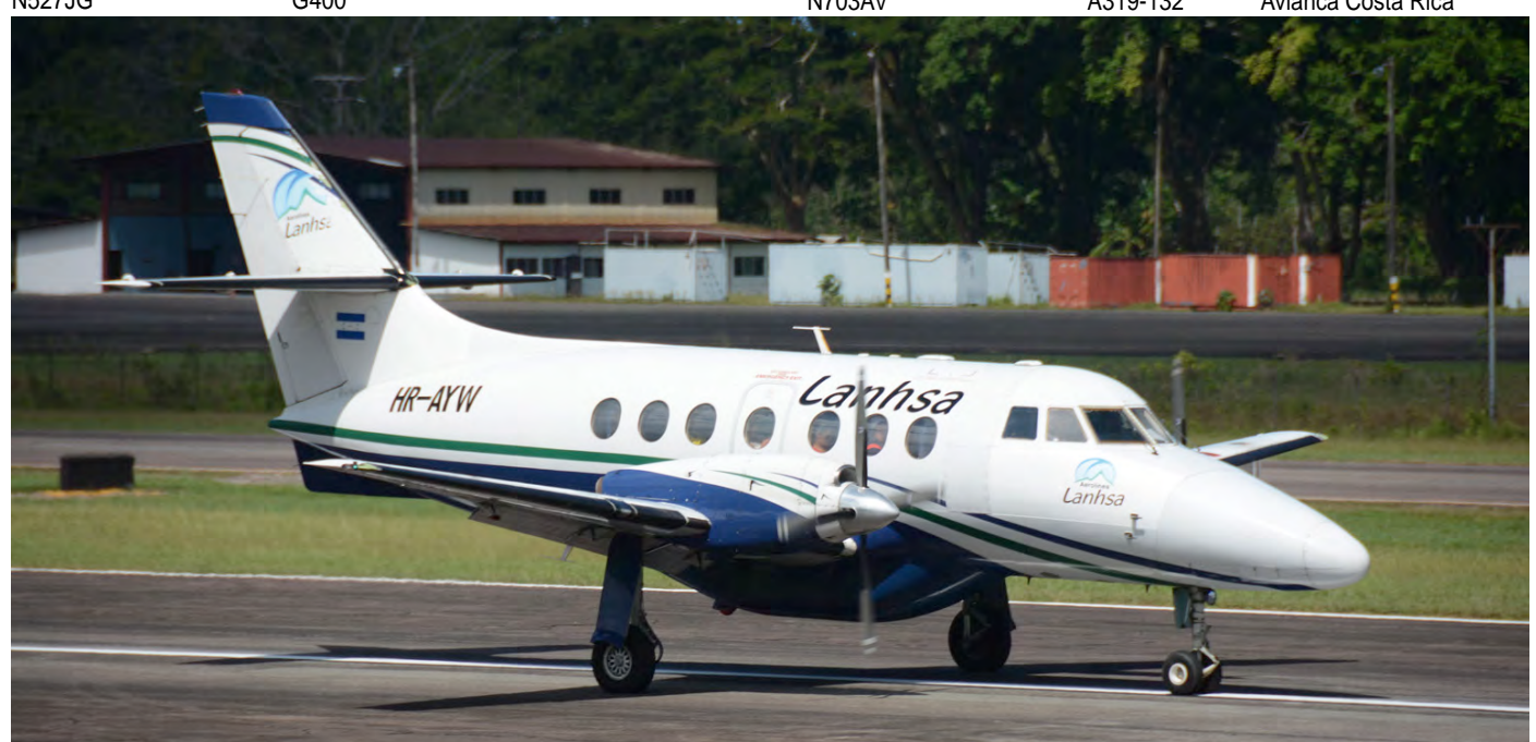
Lanhsa (Línea Aérea Nacional de Honduras S.A.), is an airline in Honduras operating scheduled and charter service, using the venerable BAe3100 on its routes. Pictured here is BAe3201 HR-AYW, which resided for most of its life in North America (first in the US, then Canada) before moving to sunnier locations in Latin America, per September 2017.