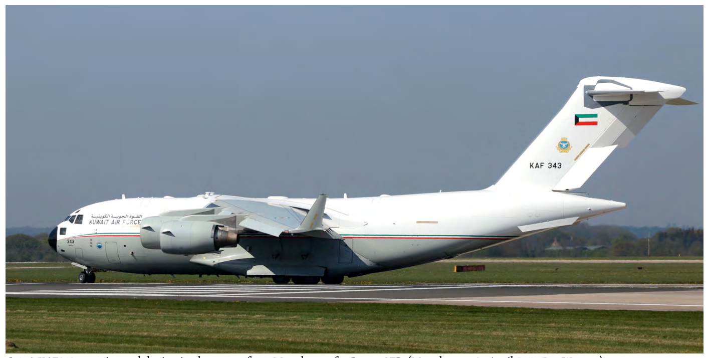
C-17A KAF343 was pictured during its departure from Manchester for Dover AFB. (Manchester, 20 April 2019, Ian Watson)