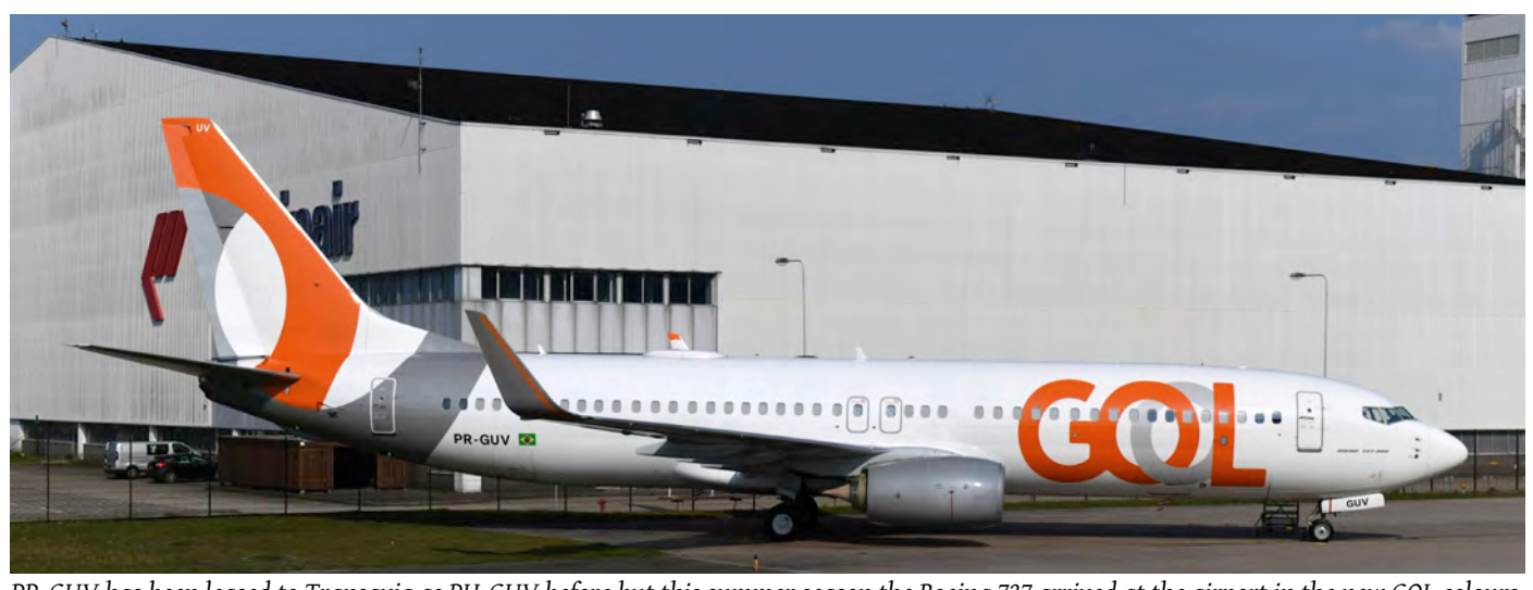
PR-GUV has been leased to Transavia as PH-GUV before but this summer season the Boeing 737 arrived at the airport in the new GOL colours. (Amsterdam - Schiphol, 14 April 2019)