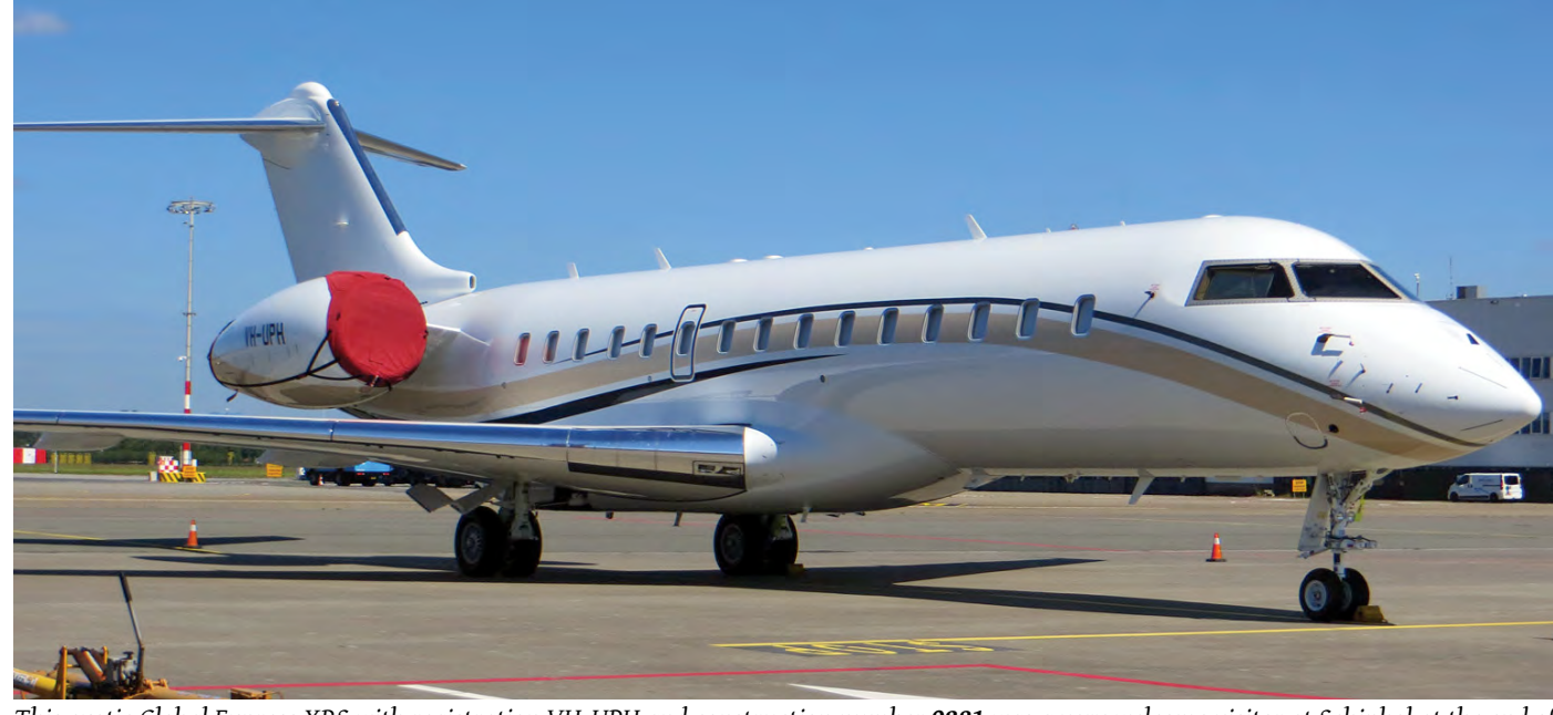
This exotic Global Express XRS with registration VH-UPH and construction number 9281 was a very welcome visitor at Schiphol at the end of May this year. It was registered in October 2017 and has been operating for Bluefield ever since. (Amsterdam - Schiphol, 29 May 2019,)