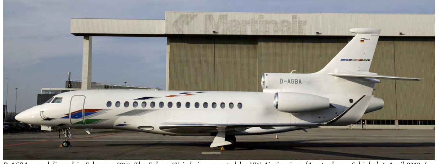
D-AGBA was delivered in February 2017. The Falcon 8X is being operated by VW Air Services. (Amsterdam - Schiphol, 5 April 2019, Leo Hoogerbrugge)