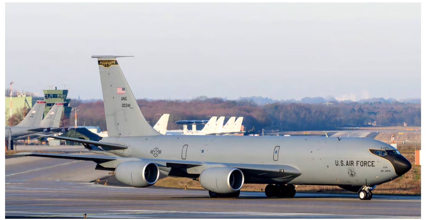
KC-135R 60-0341 of the 153rd AS visited Geilenkirchen in February 2019 and was photographed during his departure on 13 February 2019.