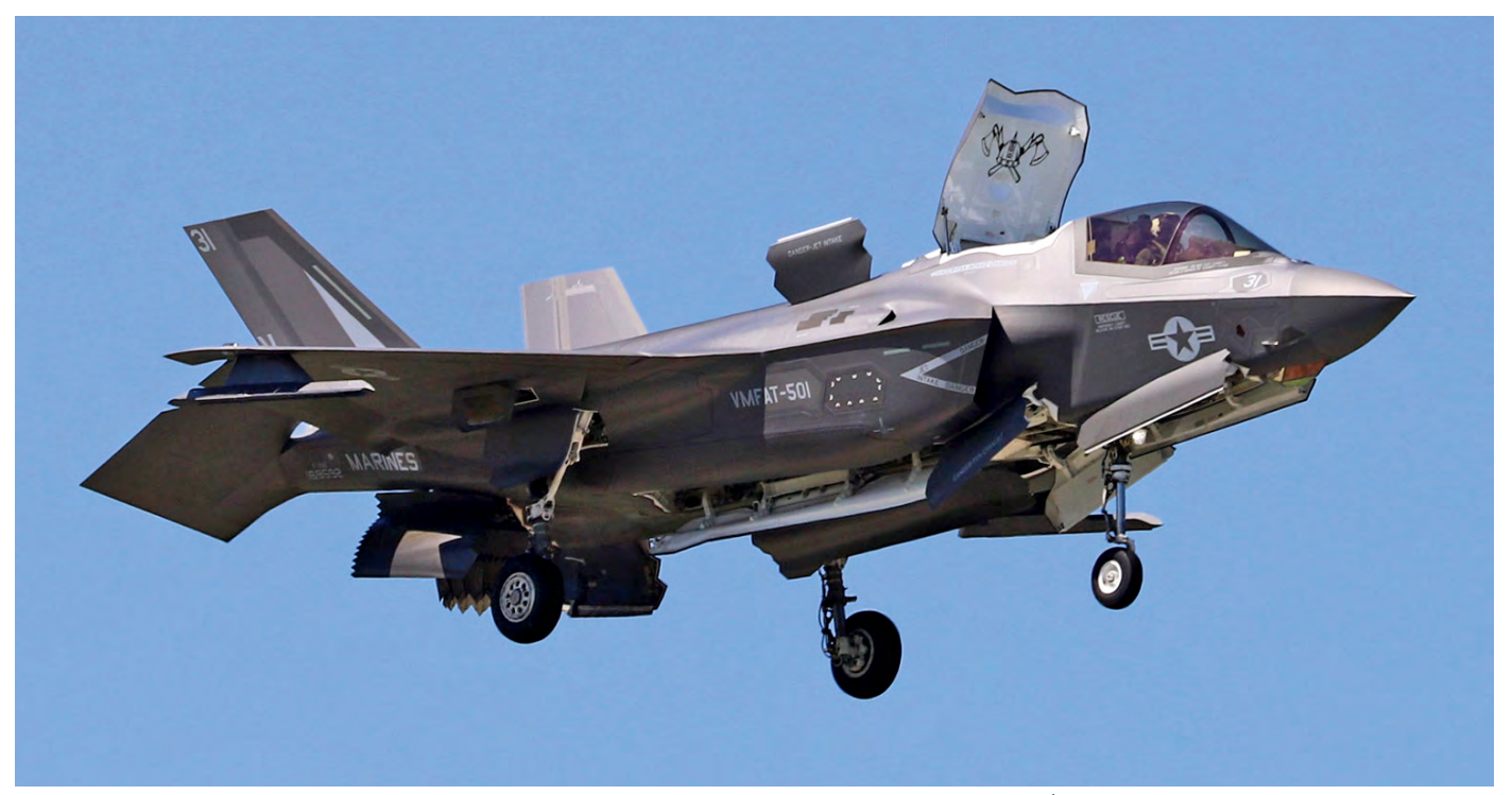
Not to be present at their own air show is not an option. VMFAT-501 F-35B Lightning II, serial 169592/VM-31, presented it's hovering skills under perfect weather conditions. (Beaufort MCAS, 27 April 2019, Hans van Herk)