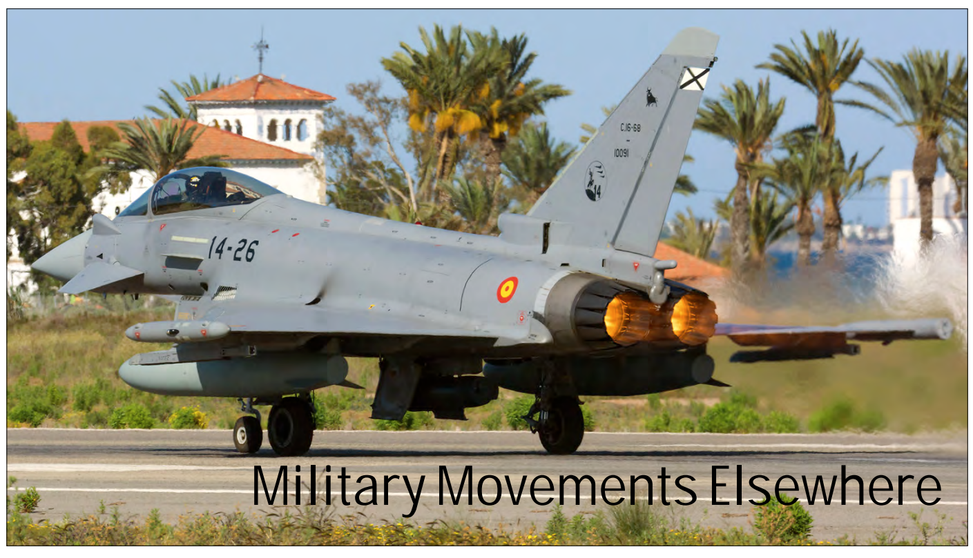
EF2000 C.16-68 is normally based at Albacete but visited the Murcia San Javier training school base on 22 May 2019.