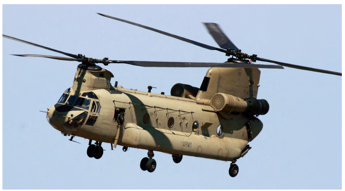
This Australian CH-47F is gunned-up, even with a shell disposal unit like you can see on the US versions too sometimes. (A15-302, Avalon, 2 March 2019,)

also upgrading four aircraft carriers with the Unmanned Carrier Aviation Mission Control System (UMCS) to operate the MQ-25As from the carrier. USNI reported that the USS George H.W. Bush (CVN-77) will be the first carrier to be upgraded with the UMCS. The USS Dwight D. Eisenhower (CVN-69) will be next.