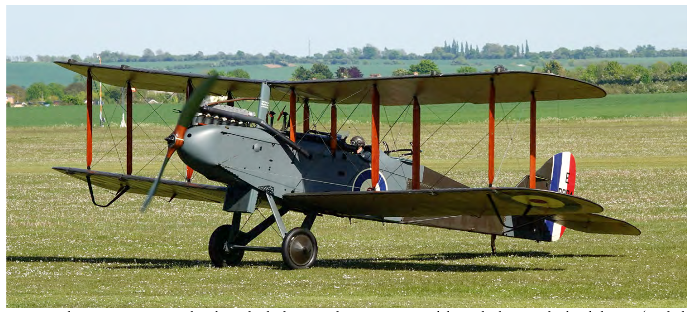
On 13 May, this Airco DH.9 G-CDLI took to the air for the first time after many years. Read the Warbirds section for the whole story. (Duxford, 13 May 21019,)