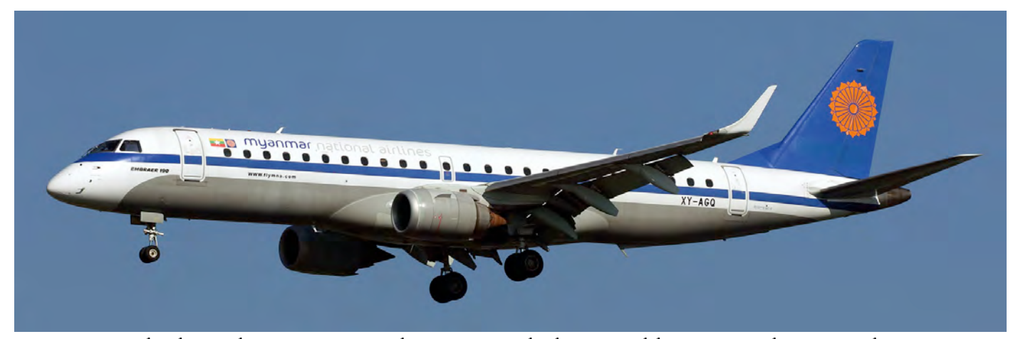
Myanmar National Airlines Embraer 190 XY-AGQ made a nose-gear up landing at Mandalay International Airport, resulting to quite some damage to the aircraft. Everybody onboard flight UB103 evacuated without injuries. (Yangon International Airport, 16 January 2017)