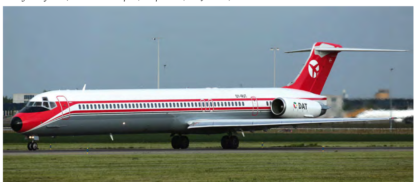
Danish Air Transport (DAT) is one of the last operators of the MD-80 series in Europe. OY-RUT was taken over from Meridiana in late 2017. It was recently repainted in these semi-retro colours. (Amsterdam-Schiphol, 18 May 2019,)