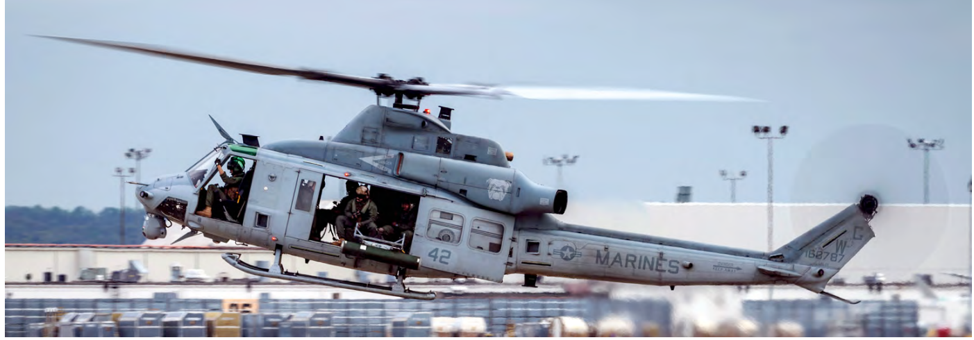
USMC UH-1Y 168787/WG-42 of HMLA-773 hovers above the runway at Louisville ANGB before taking off to perform a flyby over downtown Louisville, (KY). (13 April 2019, Rob van Disseldorp)