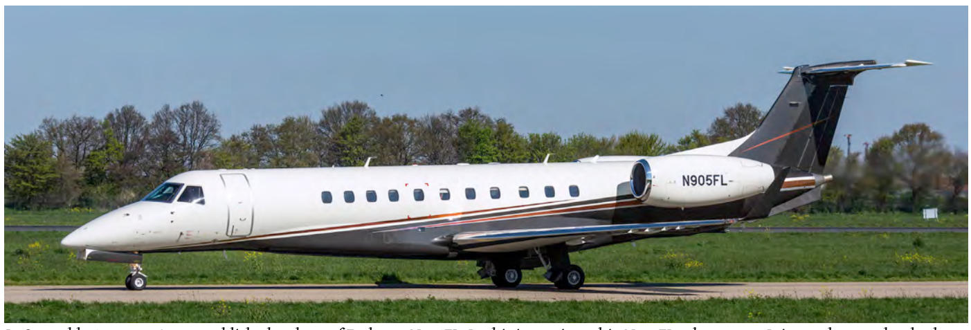
In Scramble 479, page 37, we published a photo of Embraer N904FL. In this issue sistership N905FL takes a spot. It is now known that both are destined for Sirio. Early 2018 Flexjet acquired a controlling interest in Sirio via the company's European affiliate. (Rotterdam -The Hague, 10 April 2019,)