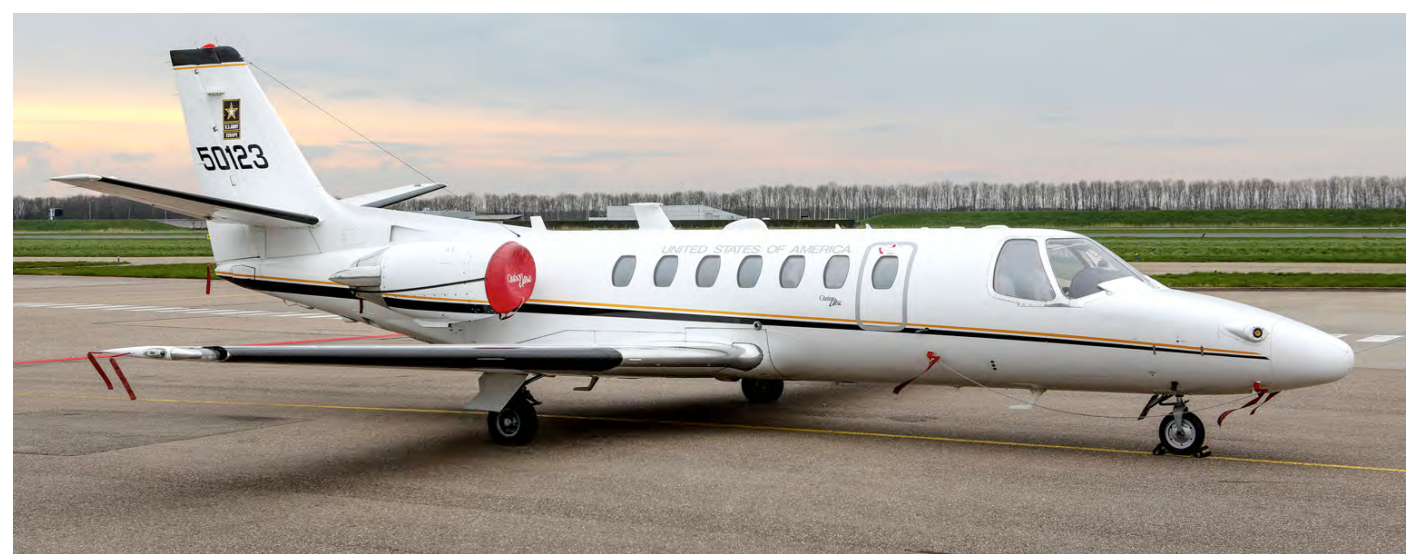
Much speculation but no facts to be heard about the reason for the visit to Lelystad of this UC-35A CitationJet 95-0123, that is based at Wiesbaden. (Lelystad, 4 April 2019, Berend Jan Floor)