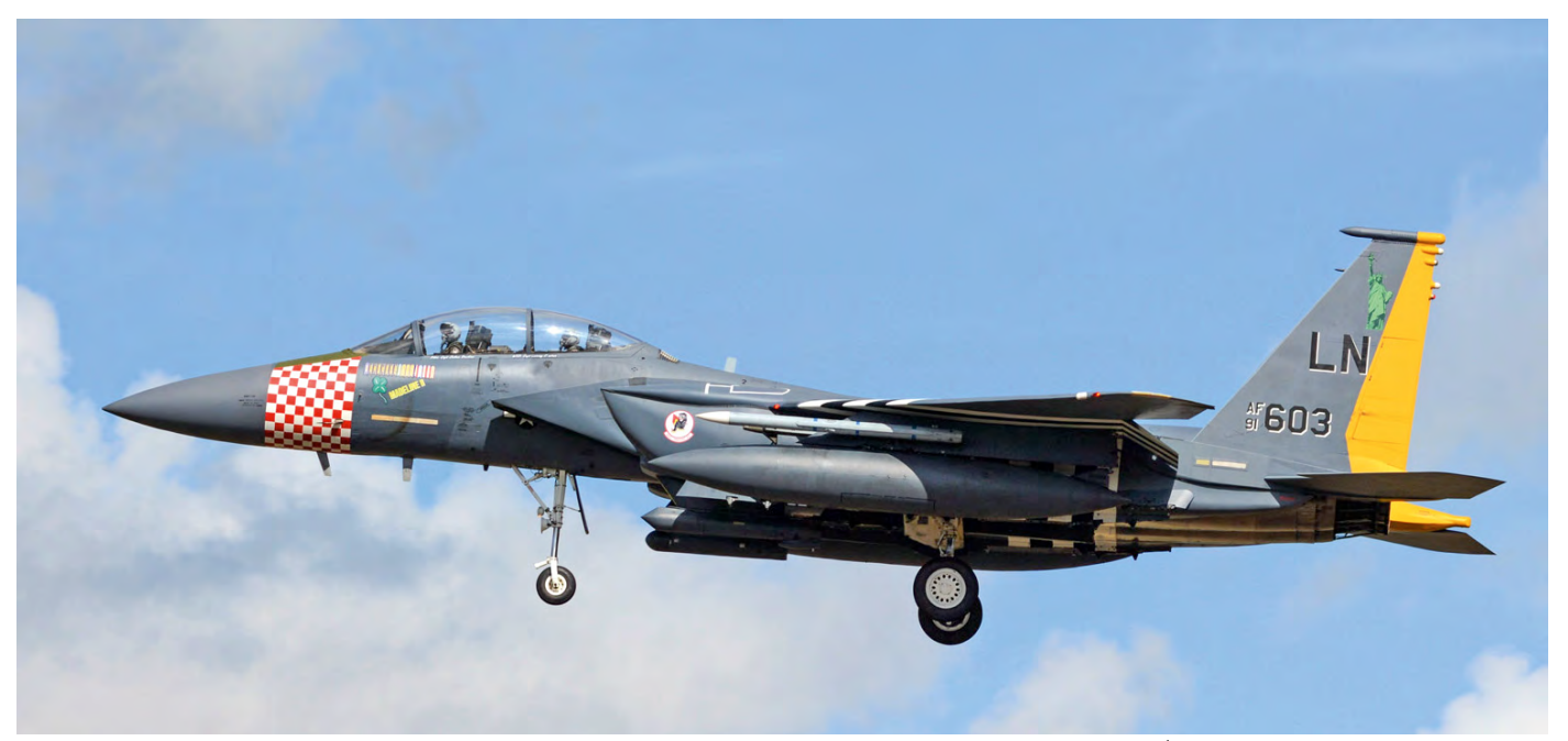
Three F-15Es from Lakenheath are adorned with special D-Day remembrance colours. Strike Eagle 91-0603/LN is captured here on its very first flight, brought forward because a 'regular' Eagle went unserviceable. (RAF Lakenheath, 26 April 2019, Coen Capelle)