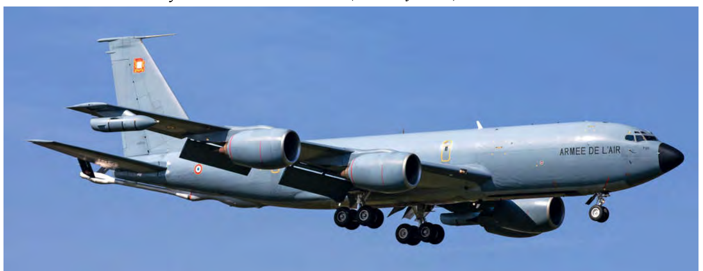
C-135FR with serial 736 was the third French C-135 which attended the EART exercise this year. The other two aircraft were plagued with engine problems which was like last year's edition... (Eindhoven, 5 April 2019, Manolito Jaarsma)