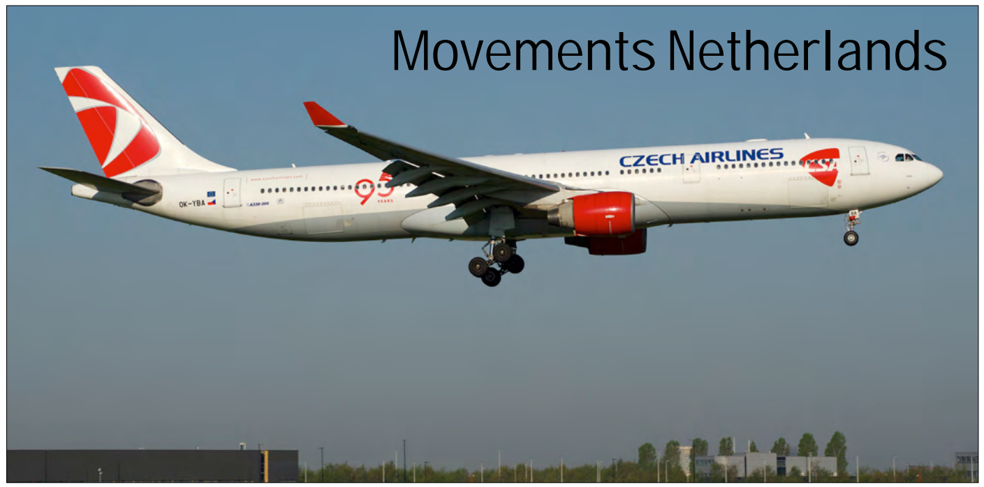
Previously with Korean Air this Airbus A330 was added to the CSA Czech Airlines fleet in May 2013. OK-YBA was used on the regular service a few times this month. (Amsterdam - Schiphol, 20 April 2019,)