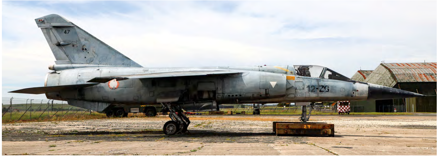
Former Rochefort Saint Agnant Mirage F1C 47/12-ZG is parked outside on a ramp at Cognac Chateaubernard. What the plan is for this aircraft at Cognac is not quite clear. (16 May 2019, Eddy Wierenga)

side), Mirage F1CR 601 (ECE01.030 area), Mystère 4A 234 (HQ building)