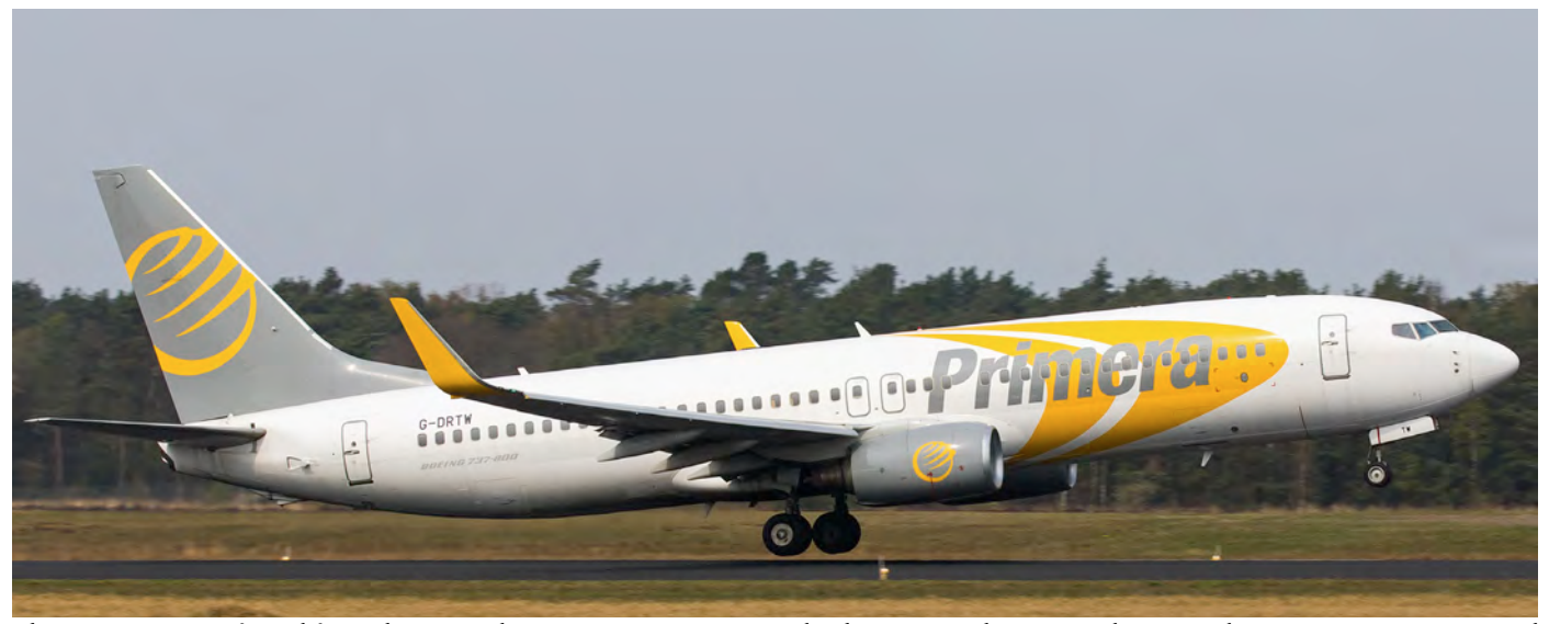
This Boeing 737 was ferried from Chania Souda Airport, Greece, to Woensdrecht on 15 October 2018 and registered as YL-PSD. It was registered LZ-GNB for a while but it never flew with that registration. Still in Primera colours but registered as G-DRTW it departed to Dublin, Ireland, for repaint into the colours of its next operator Jet2. (Woensdrecht, 9 April 2019,)