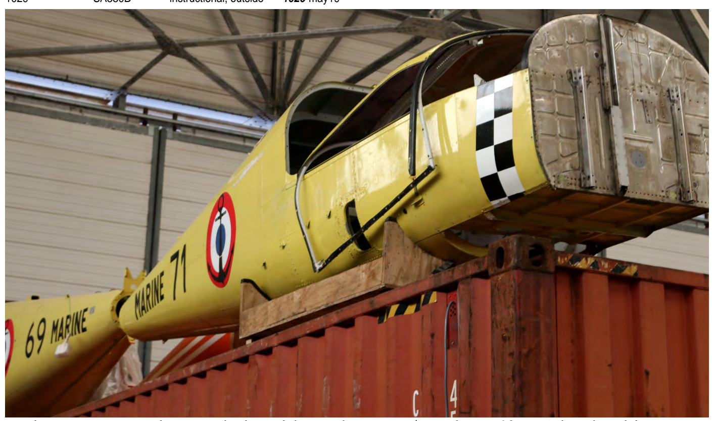
French Navy MS893-100s 69 and 71 are stored in dismantled state in the restoration/storage hangar of the Musée de Tradition de l'Aeronautique Navale at Rocheford Soubice. (18 May 2019, Phil Adkin)

All these are with base museum with is just east of the main gate and visible from outside. Other noted at the base was CM170/118-DJ (mess hall), Mirage 3E 577/330-BM (dump), Mirage 4A 43/BP (HQ building), Mirage F1C 47/12-ZM (far