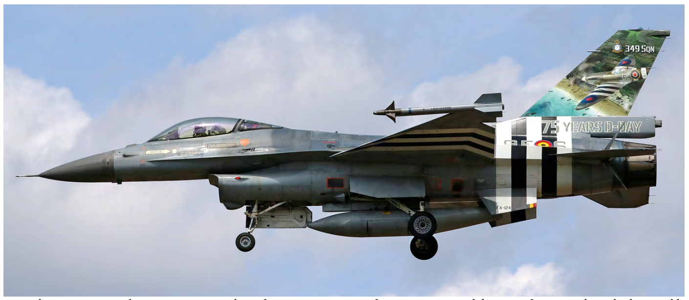
Two Belgian F-16s received commemorative markings for 75 years D-Day. One from 350sq, FA57, and this FA124 from 349sq, have this honourable task. (Kleine Brogel, 27 May 2019,)

project, and the Civil Aviation Authority in the UK has allocated G-NSFS as a temporary registration. When the aircraft's restoration is finally completed and it has been test-flown, PL258/FN-K will be transferred to the Norwegian register. On top of this, the F-16BM sports D-Day striping which is applied on the lower side of the aircraft in commemoration of the 75th anniversary of D-Day, and in commemoration of the battle of Normandy.