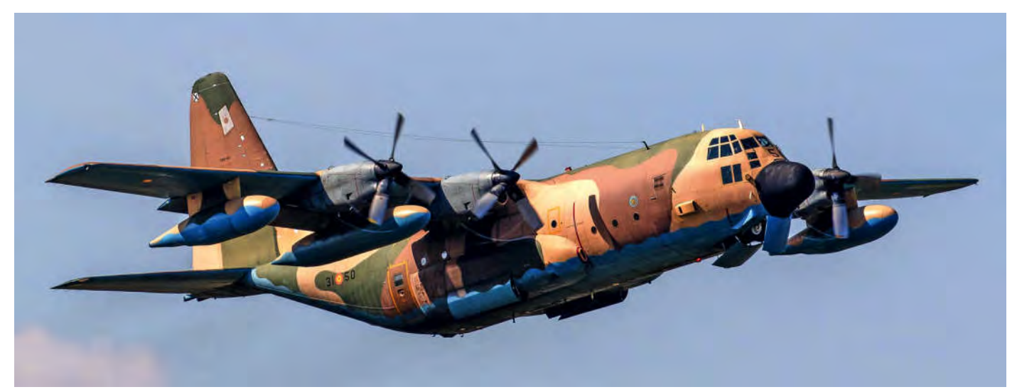
KC-130H TK.10-05 of Ala 31 did not participate in this years EART edition exercise but made a short gas stop on the fifth of April 2019. Nevertheless it was a very welcome visitor at Eindhoven.