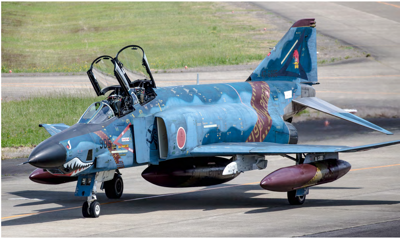
Further to last month's notes, Japan has another Phantom in special colours. The markings commemorate reconnaissance with the RF-86 and RF-4 from 1961 to 2020 and are identical on both the blue and green/brown planes. (47-6905, Hyakuri, 16 May 2019,)