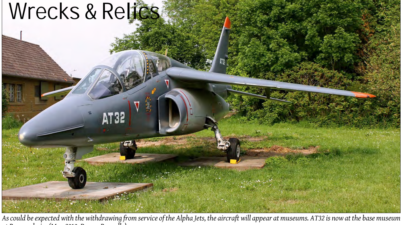
at Beauvechain.