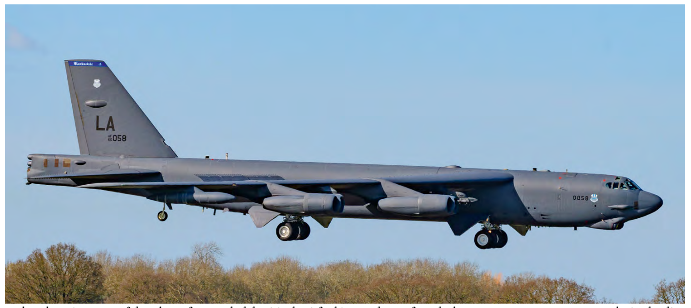
No less than six B-52Hs of the 5th BW from Barksdale visited Fairford in March 2019 for a deployment. B-52H 60-0058 was seen during landing at his temporary home base on 25 March 2019.