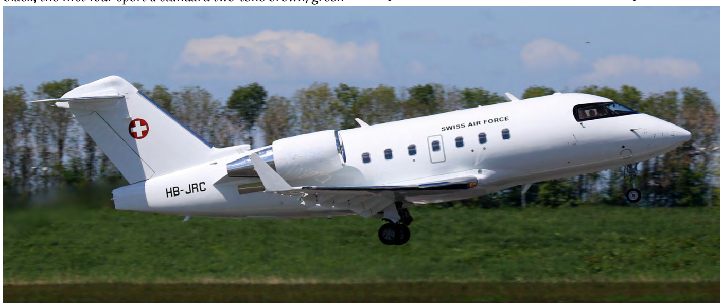
Anonymous looking CL-604 HB-JRC received a new splash of paint at Lelystad after being inducted by the Swiss Air Force. Its Swiss serial will be T-752. (13 May 2019, Leonard van Teeffelen)

During March 2019, 202sq at RAF Valley used a couple of Juno HT1s from Ascent (RAF Shawbury) on loan. First ZM532 was used by 202sq, followed by ZM518 on 18 March 2019. Both were still present throughout April 2019. It is not yet clear if this is temporary only, or if the Search and Rescue training squadron will continue to use Juno HT1 helicopters next to its