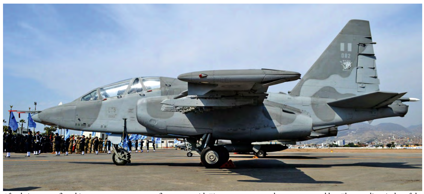
After being camouflaged in a two-tone green camouflage, some with Tiger nose art, a couple went two tone blue. The new diner jacket of the Peruvian Su-25 fleet is a distinguished grey on grey like this Su-25UB 082. (Las Palmas, 14 December 2018, Oscar Ardiles)