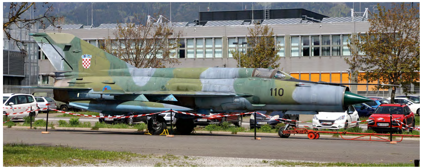
Croatia requested the return of the defected MiG-21R 26112 which was the museum at Zeltweg. The Austrians were reluctant to do this, but agreed when they got this MiG-21bis 110 in return. (8 May 2019,)