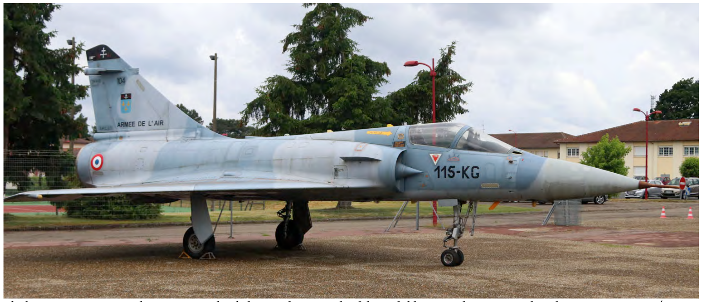
The base museum at Mont de Marsan can clearly be seen from outside of the airfield. One on the new arrivals is this Mirage 2000C 104/115-KG. (19 May 2019, Phil Adkin)