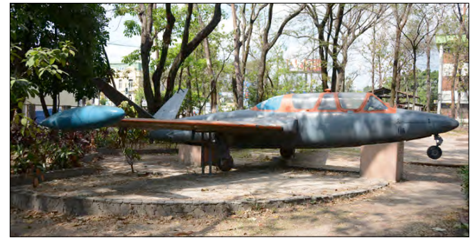
Magister serial 500 is an ex Israeli CM170. The aircraft is now preserved at San Salvador-Museo National de Aviacion. (19 February 2019)

Avianca Central America A319 (2), A320 (1), ERJ190 (4)