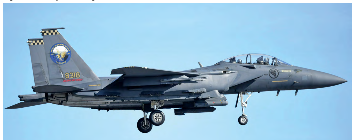
The F-15Es operated by Singapore are colourful and use the General Electric F110 engines as can be clearly seen here. (Paya Lebar, 24 May 2019, Hans Jacobs)

4639 pres SBMS ex std SBRF, I/n nov13 100 may19