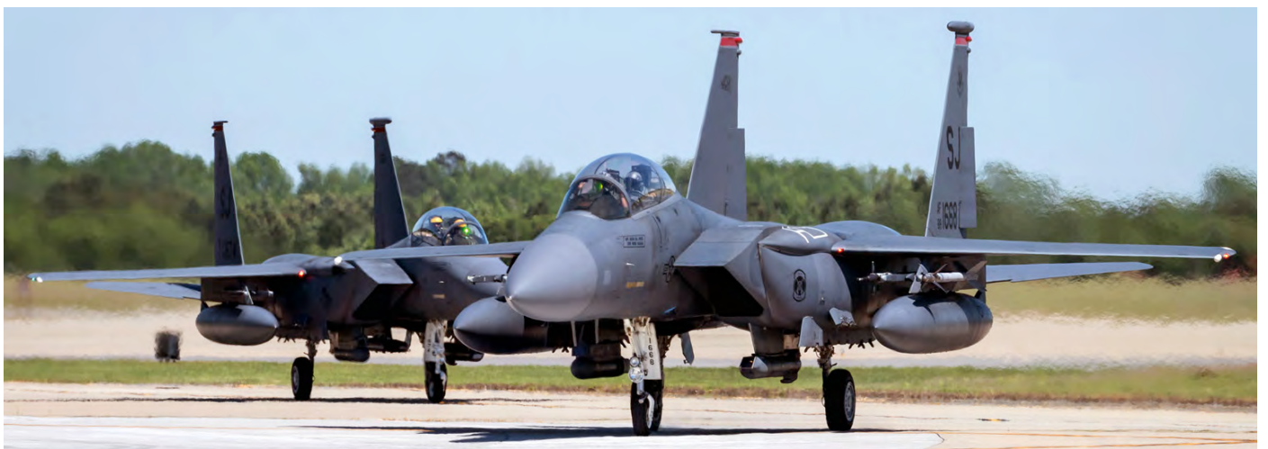
Of course there was plenty of F-15E Strike Eagle action at the Wings over Wayne Air Show at Seymour Johnson AFB. Pictured here are the 88-1668/SJ and 88-1674/SJ of the 333rd FS. (27 April 2019,)