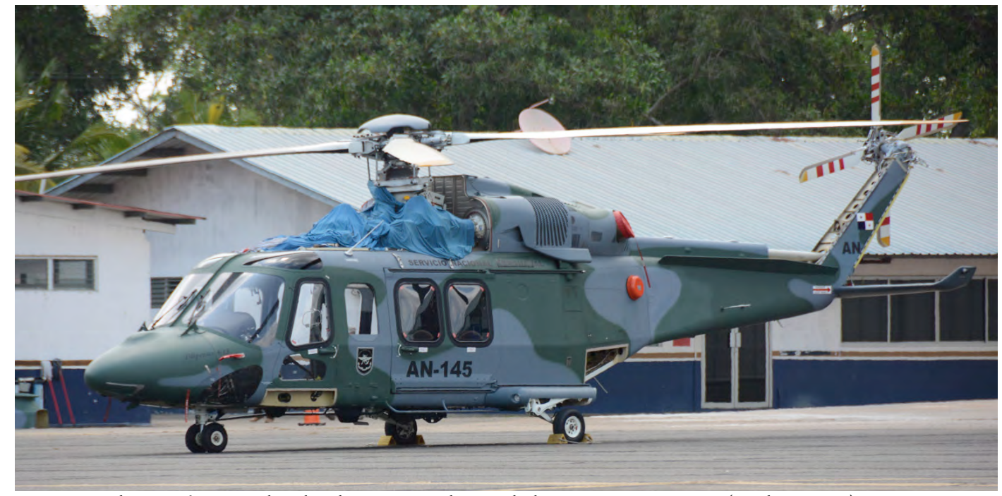
AW139M, serial AN-145, from Escuadron de Helicopteros was photographed at Panama City-Tocumen. (27 February 2019)