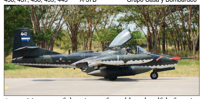
A promising start of the trip was formed by a handful of moving San Salvadorian (O)A-37s at Comalapa, with another bunch seen in hangars. This is 442 on 18 February 2019.