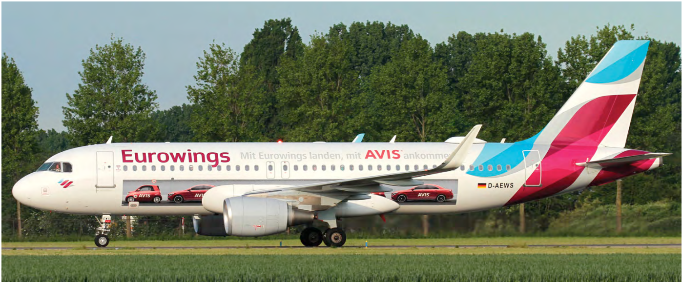
Eurowings A320 D-AEWS was painted in this special AVIS Car Rental livery in September 2018. It was the first Eurowings Airbus with special "Car Rental" colours, as in January 2019 D-ABDU was painted in special "Hertz" colours (see Scramble 477 - Page 331). We must say we prefer the more colourful Hertz livery. (Amsterdam-Schiphol, 24 May 2019, Robert Eikelenboom)

<u>Fiji Airways</u> has signed a lease-agreement with DAE for the lease of two A350-900s. Both planes will be used for expan-