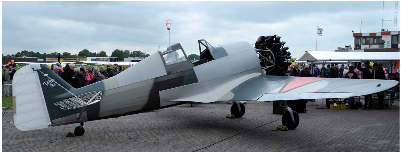
In the years before WW II in total 145 examples of the Fokker D XXI fighter were built for the Danish, Dutch, and Finnish Air Forces. Today only one complete (composite) D XXI remains in Finland and an incomplete one in Denmark. In the Netherlands one replica can be seen in the Military Museum of Soesterberg. But that was until now: as can be read below, Jack van Egmond has built a flying Fokker D XXI replica. Wim Sonneveld was present during the official roll out at Hoogeveen airport on 30 May.