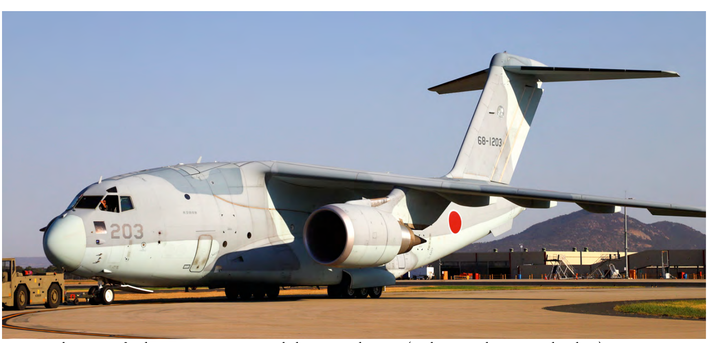
Japan is in the process of replacing its C-1 transports with this C-2, serial 68-1203. (Avalon, 1 March 2019)