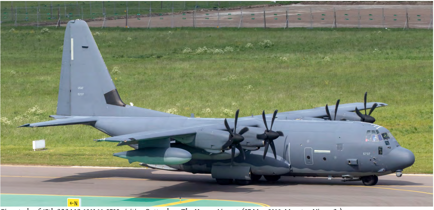
Fine study of 67th SOS MC-130J 11-5735 visiting Rotterdam-The Haque Airport. (27 May 2019, Maarten Visser Sr)

USAF's efforts to stay ahead of adversaries for years to come.