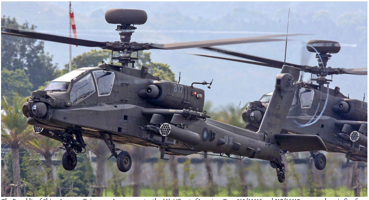
The Republic of China Army, or Taiwanese Army, operates the AH-64E out of Lungtan. Two, 815/10015 and 817/10017, are seen here in fine form at the Hsinshe air show. (30 March 2019, Reinier Scheurs)