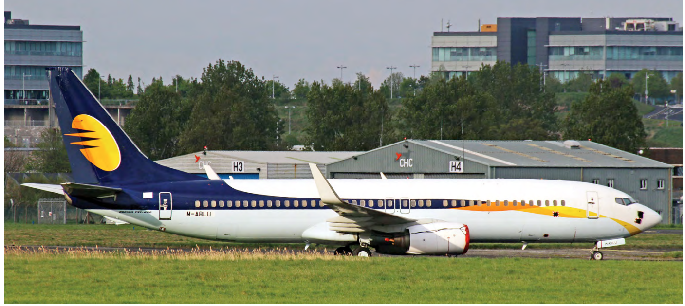
A lot of former aircraft of bankrupt Jet Airways have already found a new owner. Boeing 737 M-ABLU (ex VT-JGF) is due to become G-DRTI of Jet2. It was already registered as such on 23 May. (Shannon, 11 May 2019,)