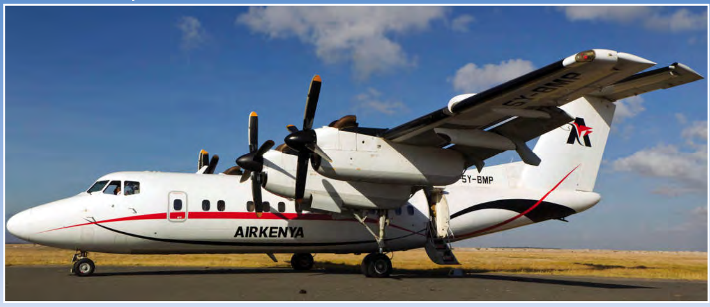
AirKenya still has two Dash 7s in their fleet.