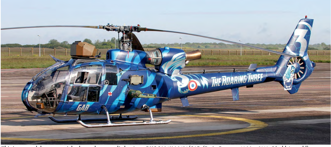
This is a very elaborate special colour scheme applied to 3eme RHC SA342M 3476/GAB. (Etain-Rouvres, 10 May 2019, Gérald Arnould)