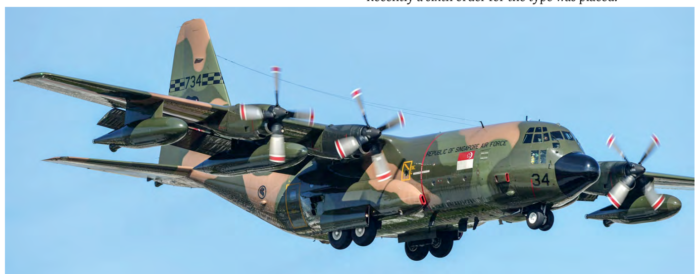
At most of Singapore's air bases it is quite difficult to take photographs from outside. Paya Lebar has always been the exception to this rule. Camouflaged KC-130H 734 comes in to land. (24 May 2019, Hans Jacobs)

... for JCG N342FJ, at Chitose 342 may19 This Falcon 2000 was seen during a stop-over at Chitose, final destination not known yet. First unit to receive this new type is 11th Region at Naha, where it will replace the Falcon 900. Recently a sixth order for the type was placed.