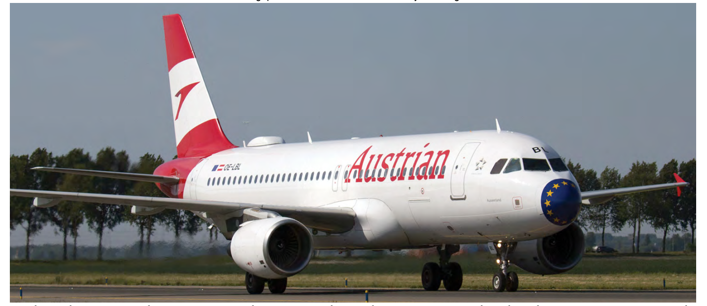
Another Airbus to support the European case is this Austrian Airlines Airbus A320 OE-LBL. To show the airlines' commitment to Europe the aircraft flies around with the EU flag painted on its nose since mid-May. This special paintwork is designed to symbolise that we as Europeans are ahead by a nose, according to Austrian's CEO Von Hoensbroech. (Amsterdam-Schiphol, 23 May 2019, Remco de Wit)