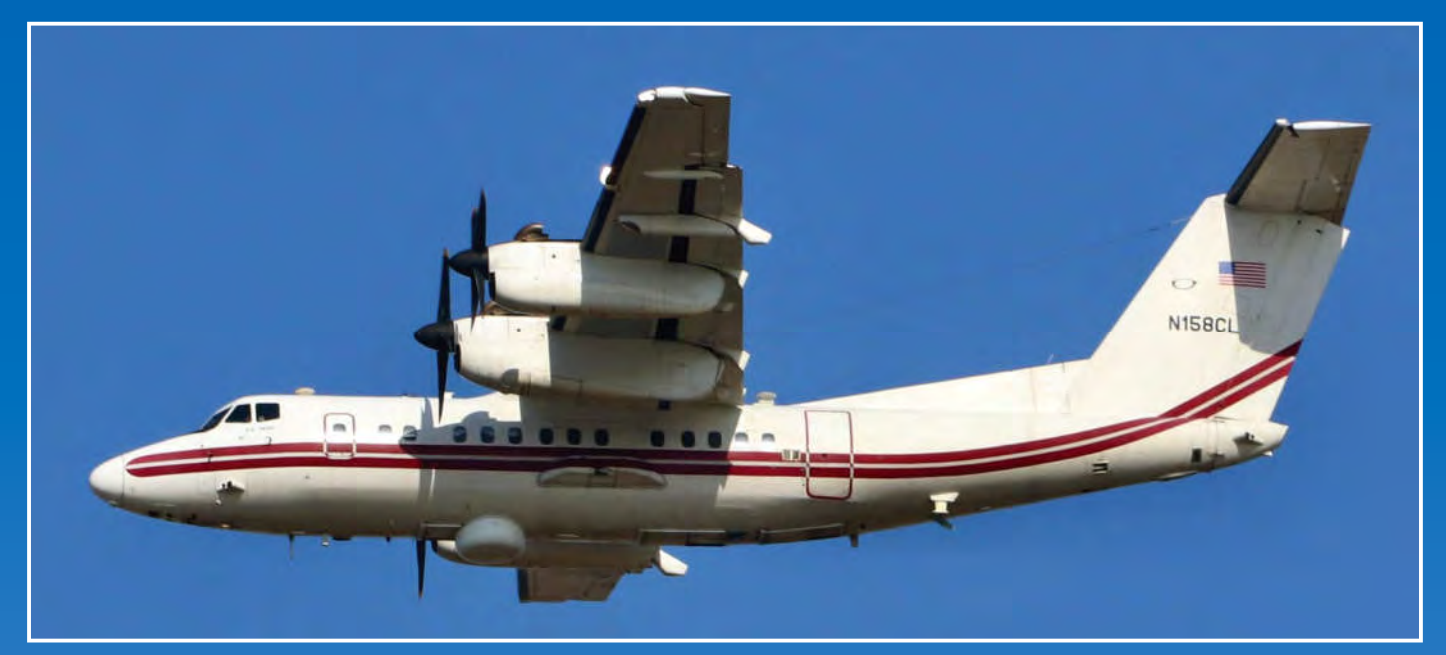
The deHavilland Canada DHC-7, also known as Dash 7, is a quite rare aircraft type these days. We start this page with a flying one, N158CL which is designated as a RC-7B, operating for the United States Army. (Osan, 20 November 2018, Robbert Snijders)