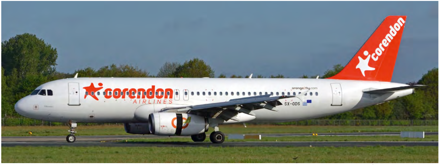
Orange2fly has leased Airbus A320 SX-ODS to Corendon this summer. SX-ODS is adorned with the appropriate colours. (Groningen - Eelde, 28 April 2019, Jaap Niemeijer)