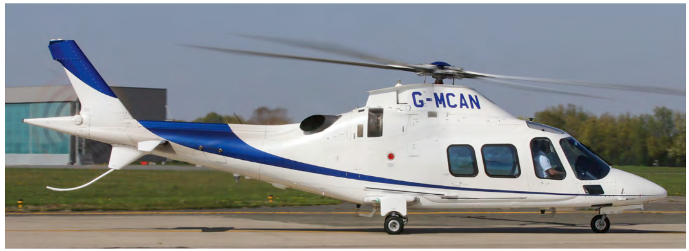
From November 2009 AgustaWestland AW109S Grand G-MCAN is being owned and operated by Castle Air. (Ostend, 22 April 2019, Nik Deblauwe)