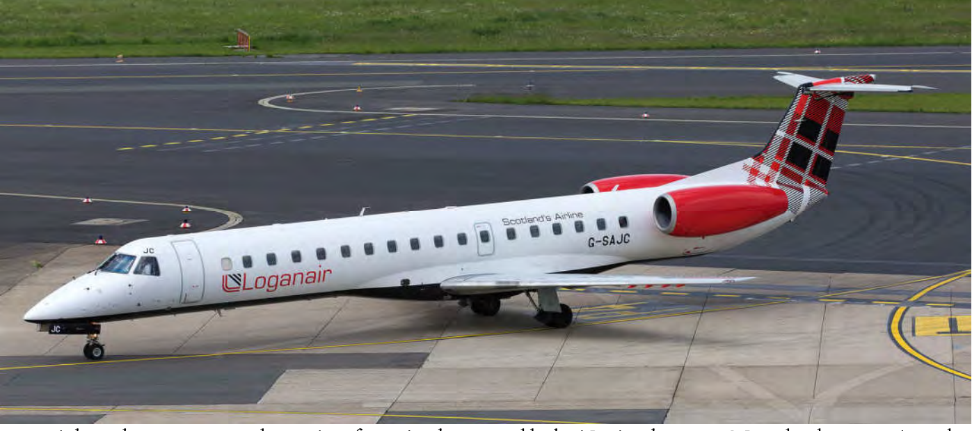
Loganair has taken over most Embraer aircraft previously operated by bmi Regional. Former G-RJXF has been reregistered to G-SAJC. (Dusseldorf, 25 May 2019,)