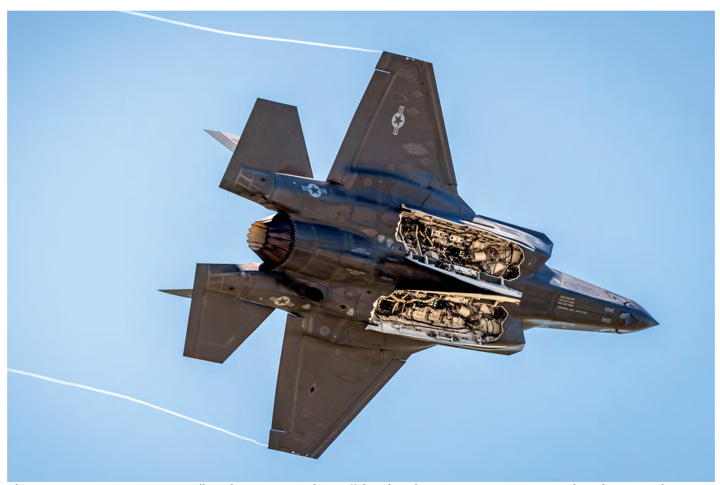
The F-35A carries its weapons internally, Luke AFB 12-5042 shows off these bays here at Wings over Wayne air show. (Seymour Johnson AFB (NC), 27 April 2019,)

helicopters are intended for a Foreign Military Sales (FMS) contract. If anyone has more details about these helicopters we would gladly hear so.