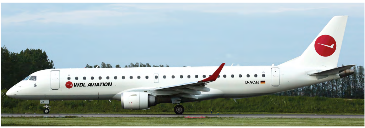
WDL Aviation has chosen the Embraer E190 as a replacement aircraft for their passenger BAe146s. The first of four ex Copa Airlines Embraers was delivered to Germany on 13 March 2019 and received registration D-ACJJ. For cargo services, WDL Aviation continues to use the BAe146. (Amsterdam-Schiphol, 24 May 2019,)