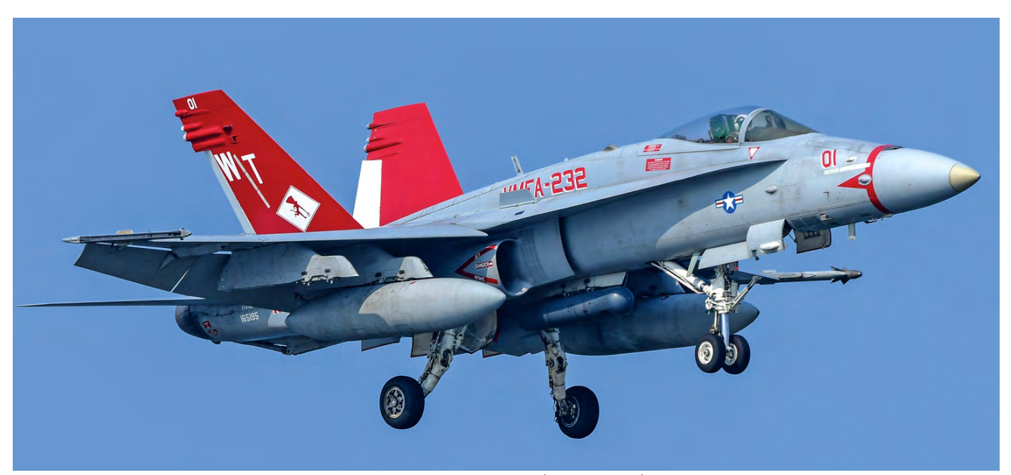
The Marines are also still to be found at Iwakuni MCAS. At least this legacy F/A-18C 165195/WT-01 is very recognisable as a VMFA-232 machine. (2 May 2019,)