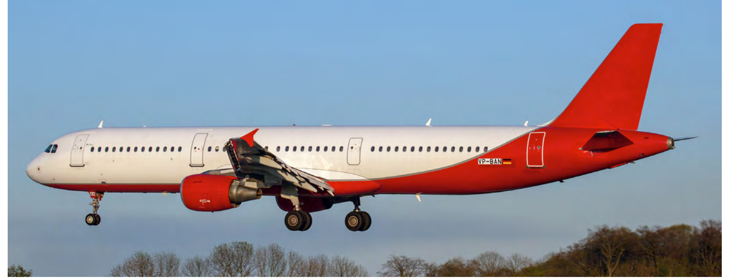
This Airbus A321 arrived at Maastricht for a repaint. Previously in service with Air Berlin it still carried the basic colours of that airline. In Scramble 480 page 40 we showed its new colours. (Maastricht - Aachen, 19 April 2019, Arjen Sleeuwenhoek)

Credits: SG Maastricht / Threshold, Flymst.nl forum.