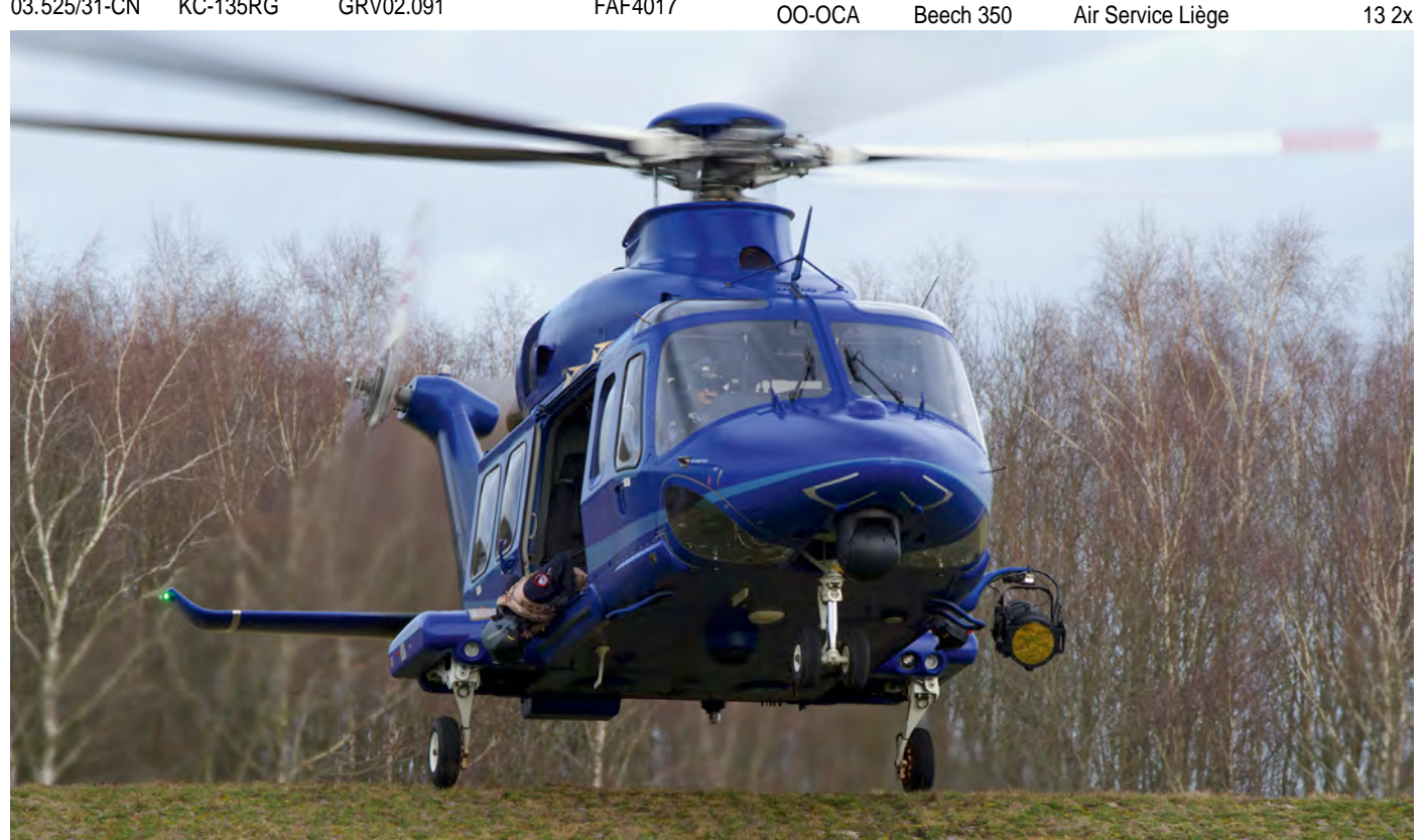
The 'slopes' is a well known photospot in several airfield guides. The Air Force practices on the slopes very regularly as do helicopters operated by the Dutch police. Many beautiful action photos can be taken here as is shown on this photo with AW139 PH-PXY as subject. (Gilze-Rijen, 4 April 2019)