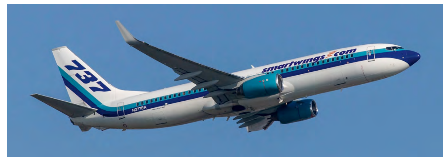
In Scramble 480, page 24, we printed a photo of this Boeing 737 taken at Brussels in full Swift Air colours. Shortly after the date it was photographed, Smartwings titles were added to the aircraft as can be seen in this photo. As such it was caught on camera. (Amsterdam - Schiphol, 19 April 2019, Maarten Visser Sr)