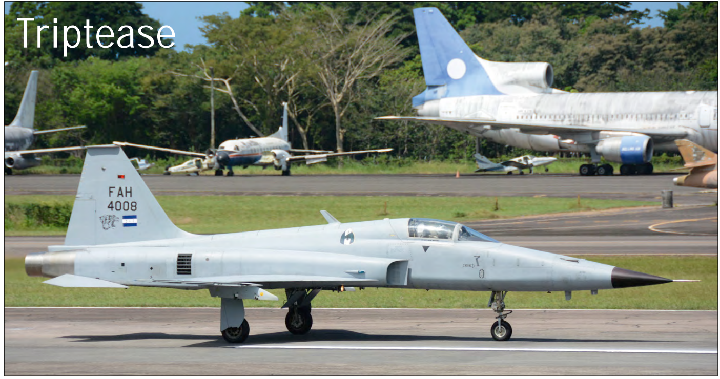
Plagued by many late cancellations by authorities, this trip was full of challenges to make it all worthwhile. One of the highlights occured at the end of the spotting day on 25 February at La Ceiba, Honduras, when an arriving flight of F-5s saved an otherwise mostly lost day in Central America. F-5E 4008 is seen here with the storage area as a backdrop.