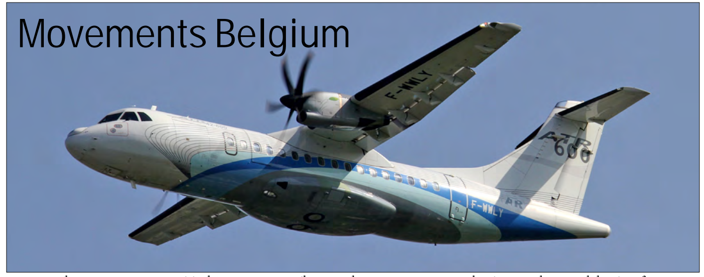
ATR42-600 demonstrator F-WWLY visited Antwerp on 1 April 2019. Walter Van Brempt was at the airport and captured the aircraft.