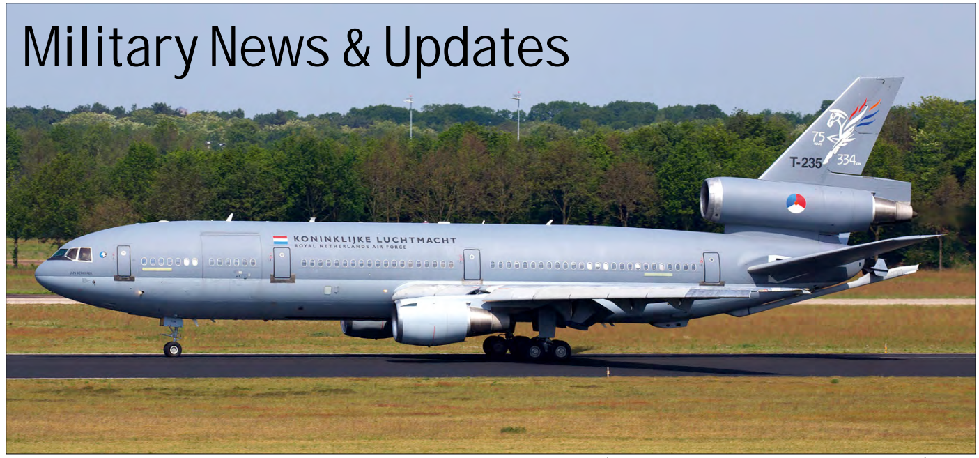
To celebrate 75 years of 334sq, KDC-10 serial T-235 received these special tail markings. (Eindhoven, 23 May 2019, Bjorn van der Velpen)

Because of our standardization we sometimes use type, unit and serial presentations that may strongly differ from those used by the manufacturer or user. It is therefore possible that the information sent by you can deviate from the information we publish.