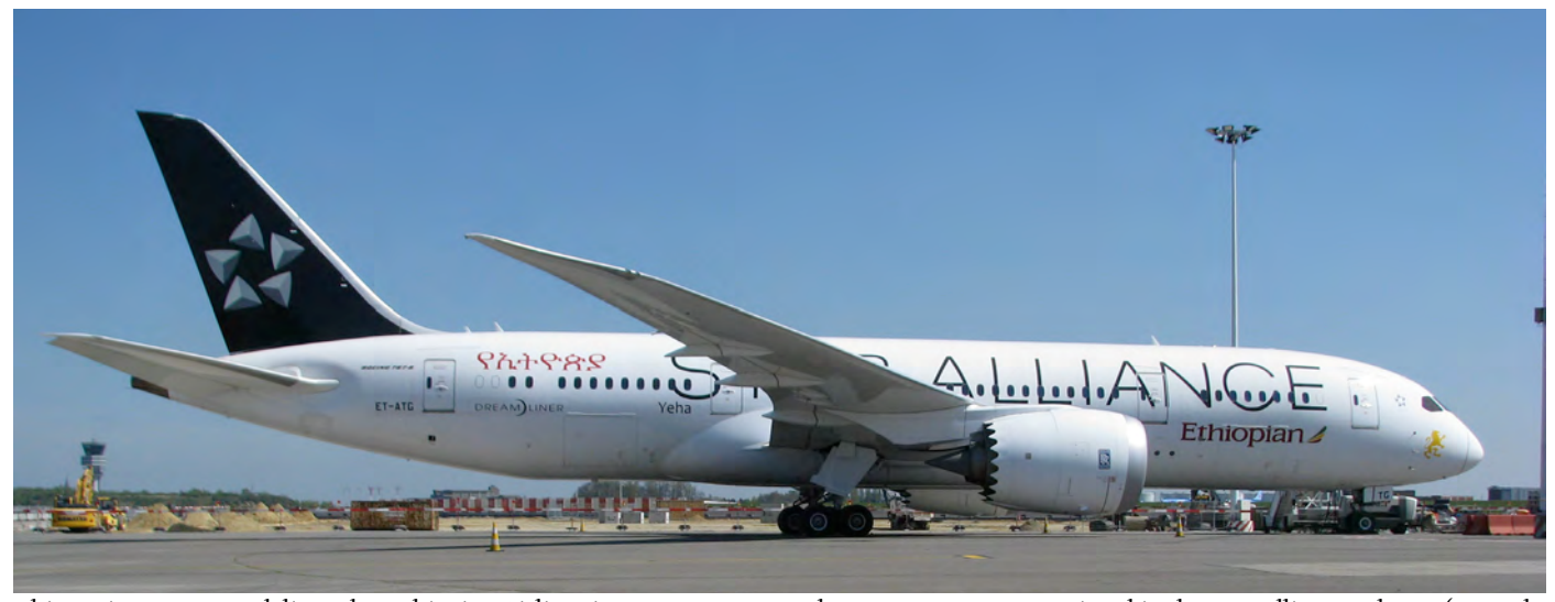
This Boeing 787-8 was delivered to Ethiopian Airlines in June 2017. In March 2019 ET-ATG was repainted in the Star Alliance colours. (Brussels, 18 April 2019,)