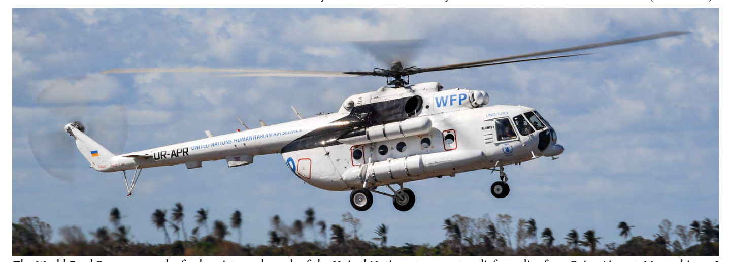
The World Food Programme, the food-assistance branch of the United Nations, transports relief supplies from Beira Airport, Mozambique, 2 April 2019, during humanitarian relief efforts in the Republic of Mozambique and surrounding areas following Cyclone Idai. Teams from Combined Joint Task Force-Horn of Africa, which is leading US Department of Defense support to relief efforts in Mozambique, began immediate preparation to respond following a call for assistance from the US Agency for International Developments Disaster Assistance Response Team. They are using Mi-8MTV-1 UR-APR of American operator Ouzinkie Aviation, with UN code UNO-128H.