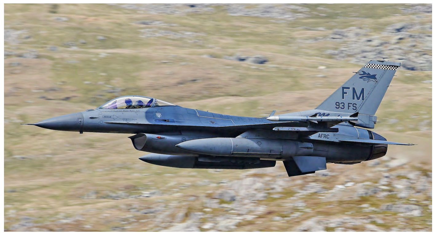
Another deployment to the UK was the visit of twelve F-16s of the 93rd FS to Lakenheath. During their deployment the pilot of F-16C 88-0405 was a bit frustated with the regular training missions over the UK and tried his luck in the Mach Loop on 13 May 2019.