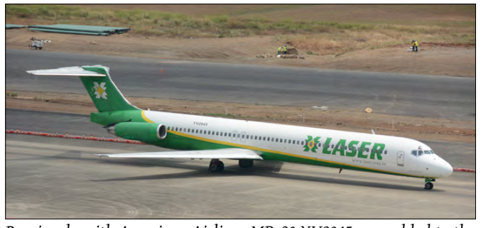
Previously with American Airlines MD-80 YV2945 was added to the LASER fleet in late 2013.