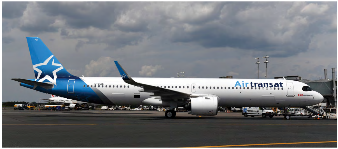
Air Transat took delivery of this Airbus A321-271NX on 3 May 2019. C-GOIE operated its first intercontinental service from Montreal to Nantes on 16 May 2019. Ton Jochems took this photo one week later at the same airport.