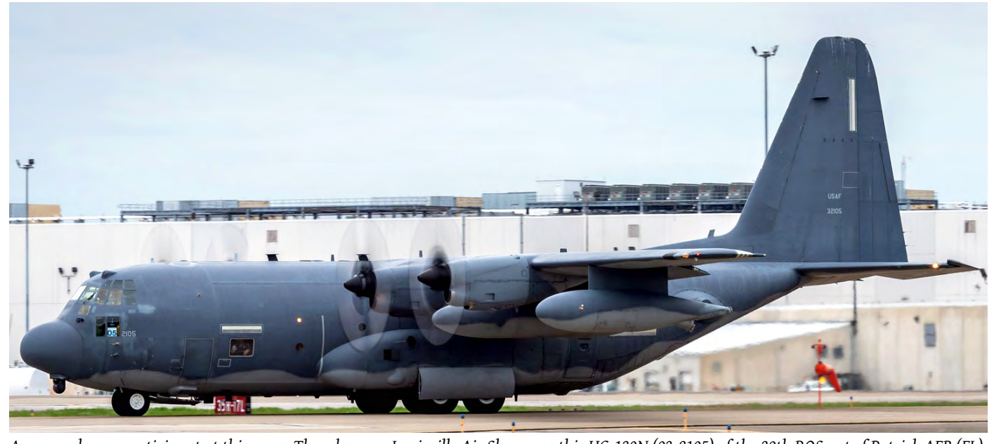
A very welcome participant at this years Thunder over Louisville Air Show was this HC-130N (93-2105) of the 39th RQS out of Patrick AFB (FL). (Louisville ANGB (KY), 13 April 2019,)