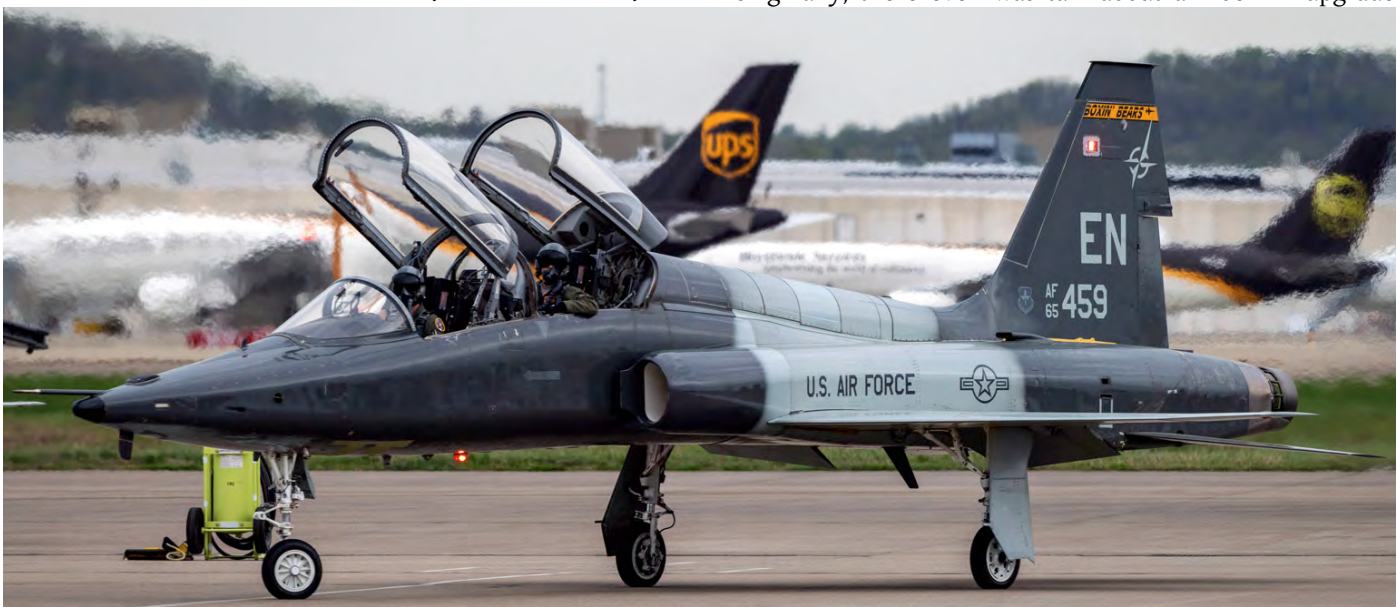
Another vistor to the Thunder over Louisville air show is this Sheppard AFB T-38C Talon, 65-10459/EN. (Louisville International-Standiford Field, 13 April 2019,)

Originally, there even was talk about a Block III upgrade