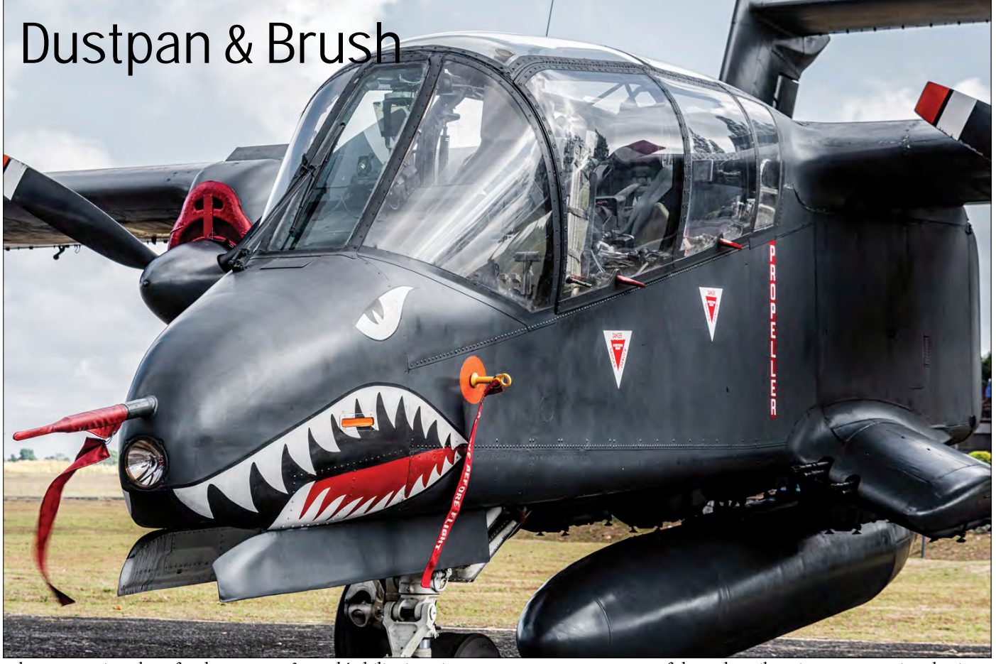
What an opening photo for the Dustpan & Brush! Philippine Air Force Bronco OV-10C 158402 of the 15th Strike Wing, means serious business with its shark mouth. It recently ditched into the Manila Bay off Danilo Atienza Air Base, Sangley Point, on 24 May 2019. Efrain Noel Morota took this picture a little more than a month before that, on 13 April.