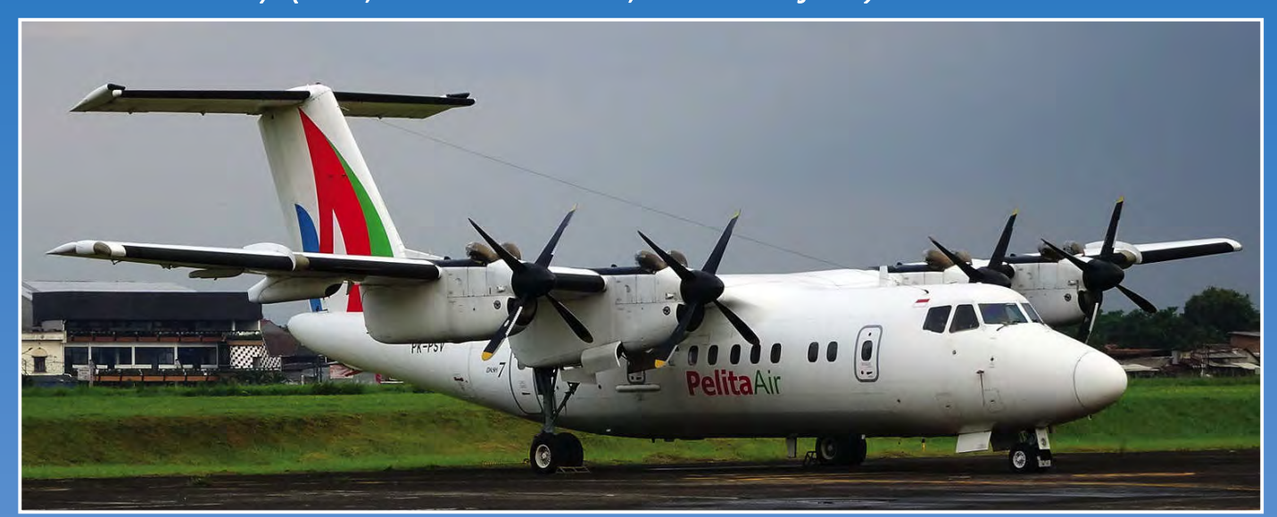
Delivered in July 1984 and still with its sole owner Pelita Air is pictured PK-PSV. (Pondok Cabe, 5 December 2018)