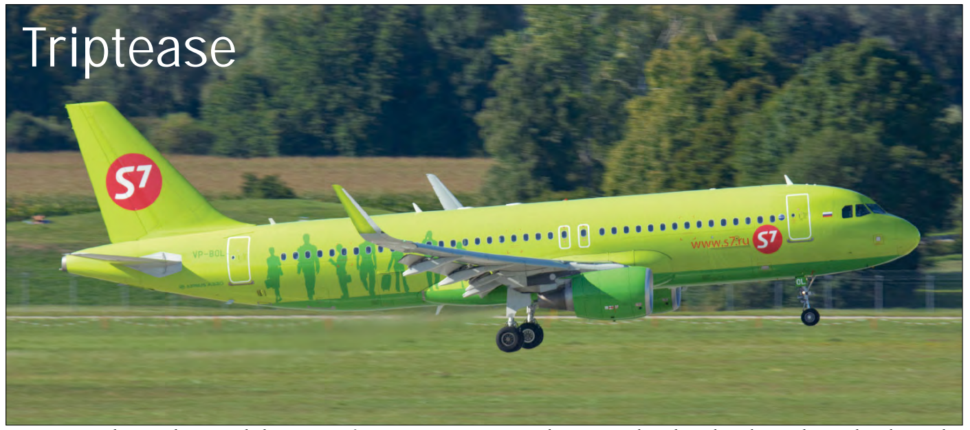
Germany's southern civil aviation hub, Franz Josef Strauss airport near Munich, was visited on three days during this combined trip. The weather was challenging at times but S7 Airbus A320 VP-BOL was caught in the afternoon sun, landing on runway 08L. Raymond van Dijkhuizen took the photo from the visitors centre spotting hill on 4 September 2019.