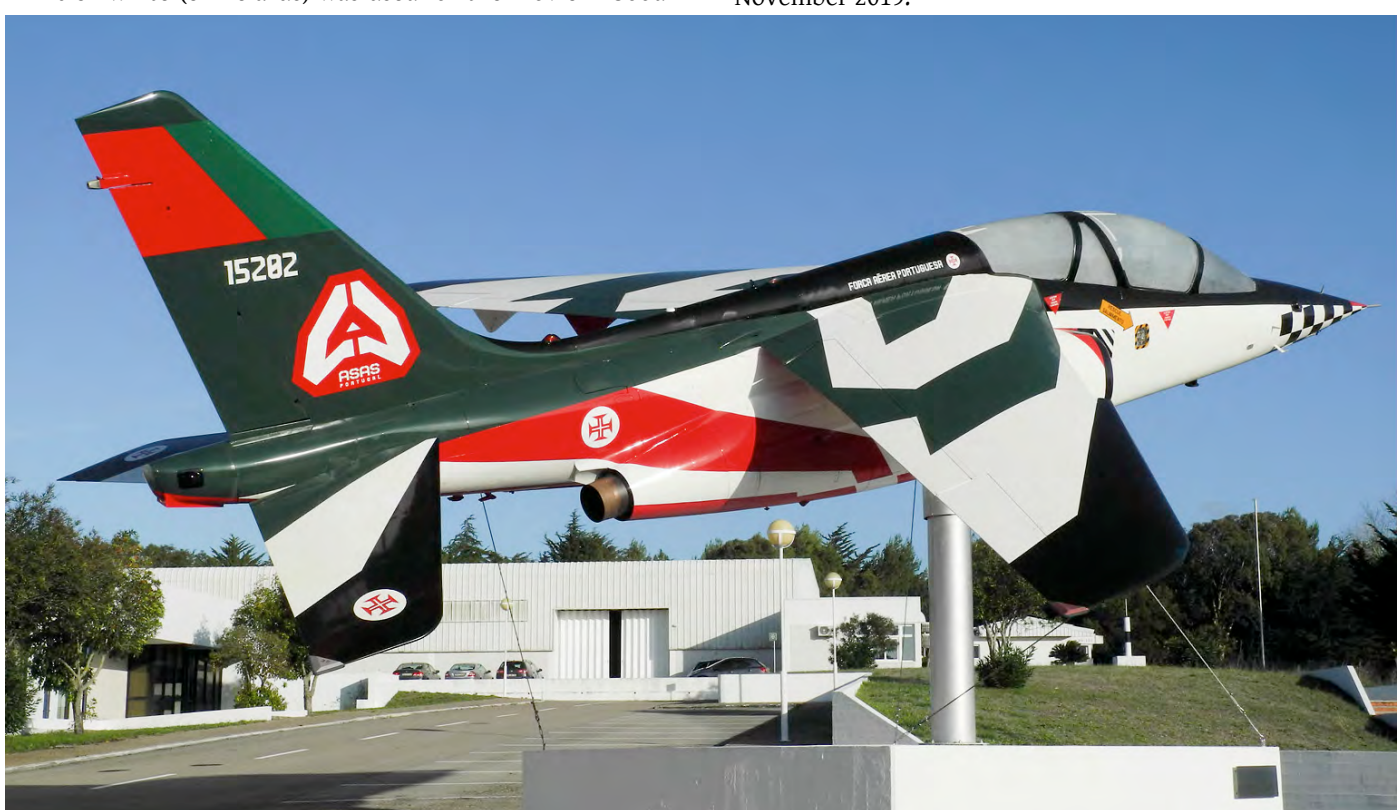
Alpha Jet 15202 is preserved on a pole at the Portuguese Air Force Academy at Sintra. It is on the same spot were G91R/3 30+79 (painted as 5457) used to be. This Gina went to Ota for restoration some two years ago. (7 November 2019, Wim Sonneveld)

This summer Sevenair for Cascais bought six CASA 212s from the Air Force. The aircraft involved are 16504, 16505, 16509, 16512, 16513 and 16517. Off these 16504 and 16509 will be based at Cape Verde. All six were still in storage at Montijo in November 2019.