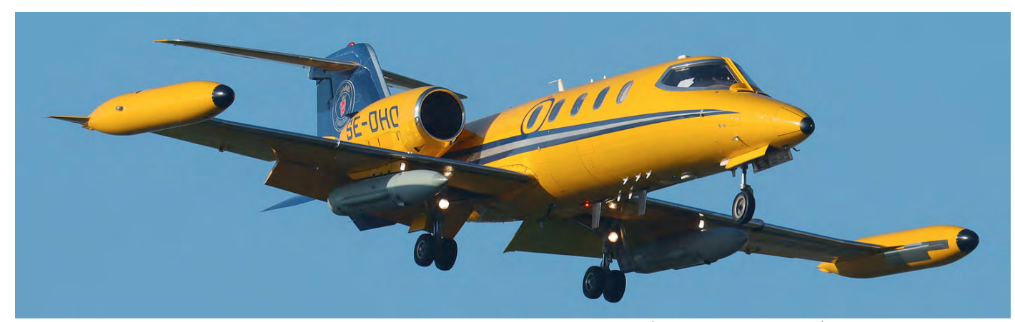
This Learjet 35A was registered in 2014 with the Swedish Defence Material Administration (Försvarets materielverk) as owner. Saab Nyge Aero is the operator for SE-DHO and is using the jet for target towing duties. (Leeuwarden, 31 October 2019,)