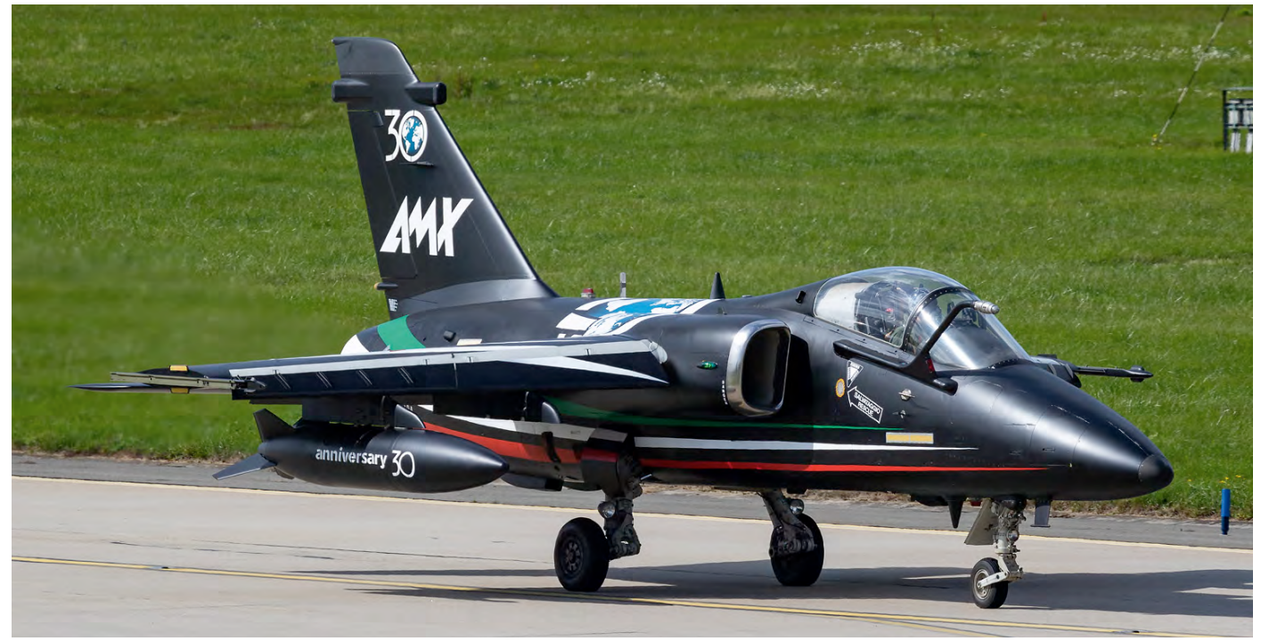
AMX ACOL MM7194 of GEA 51° Stormo has adopted a special 'AMX 30th Anniversary' livery. (Ostrava, 20 September 2019, Markus Schrader)

The Northern Ireland Universities Air Squadron (NIUAS)