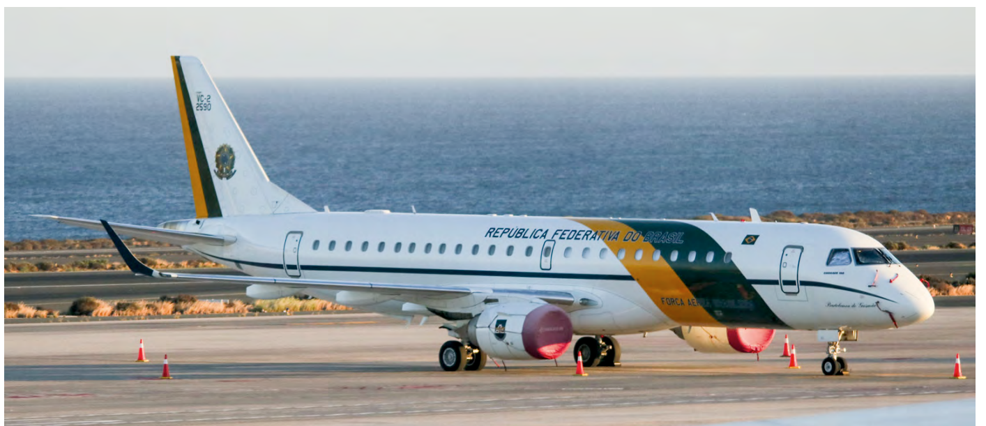
VC-2 (ERJ190AR) 2590 of GTE was a visitor from Brazil providing support to the Ocean Sky 2019 XIV multinational exercise. Next month we will provide full report. (Gran Canaria - Gando Airport, 30 October 2019, Leo de Ree)

61010 1st Aviation Brigade f/n, ex Boeing 14-61010 photo