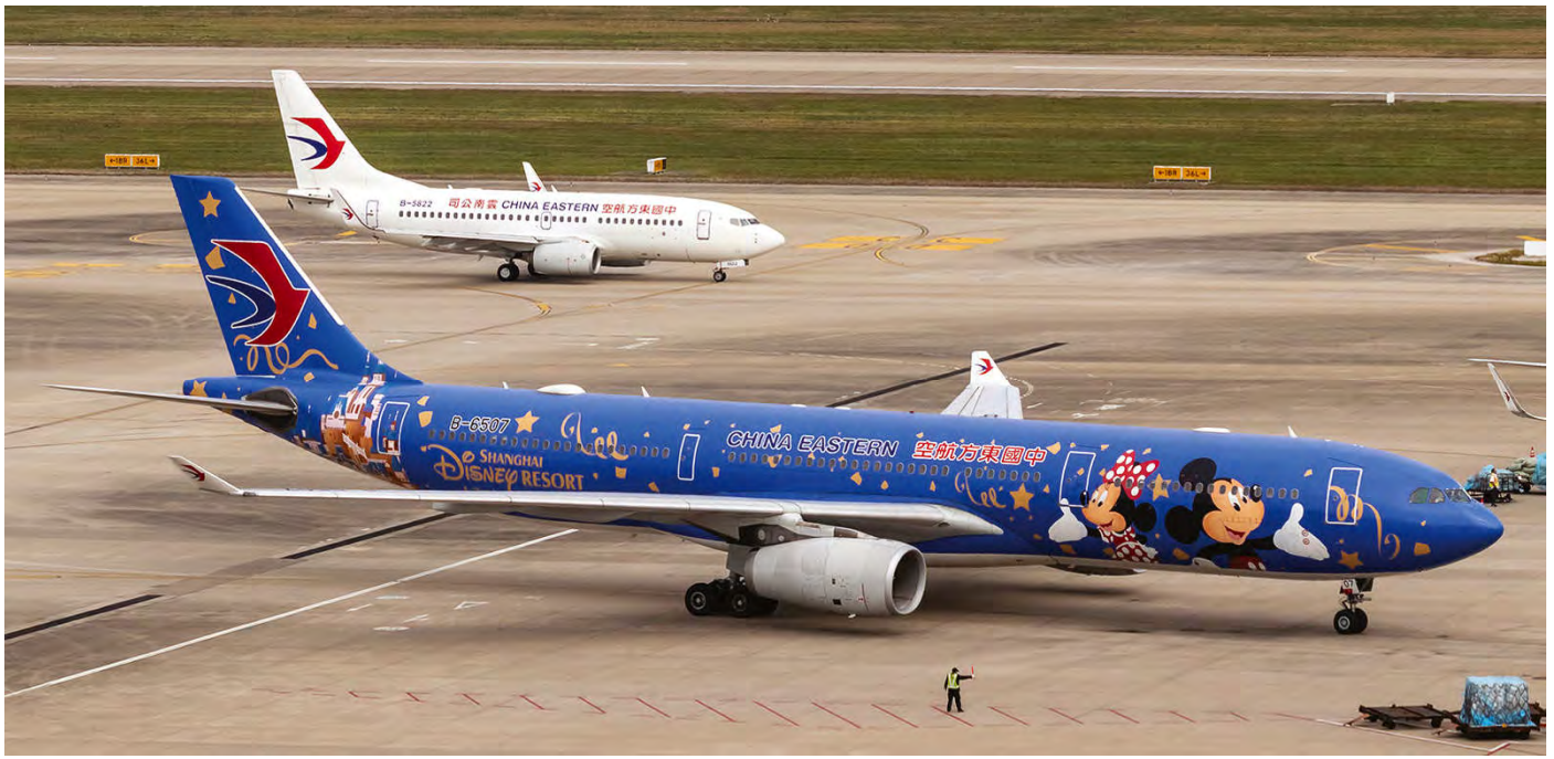
China Eastern Airlines is flying already two years with this livery on A330 B-6507 to promote the Disneyland resort in Shanghai, which opened in June 2016. (Shanghai-Pudong, 6 October 2019)