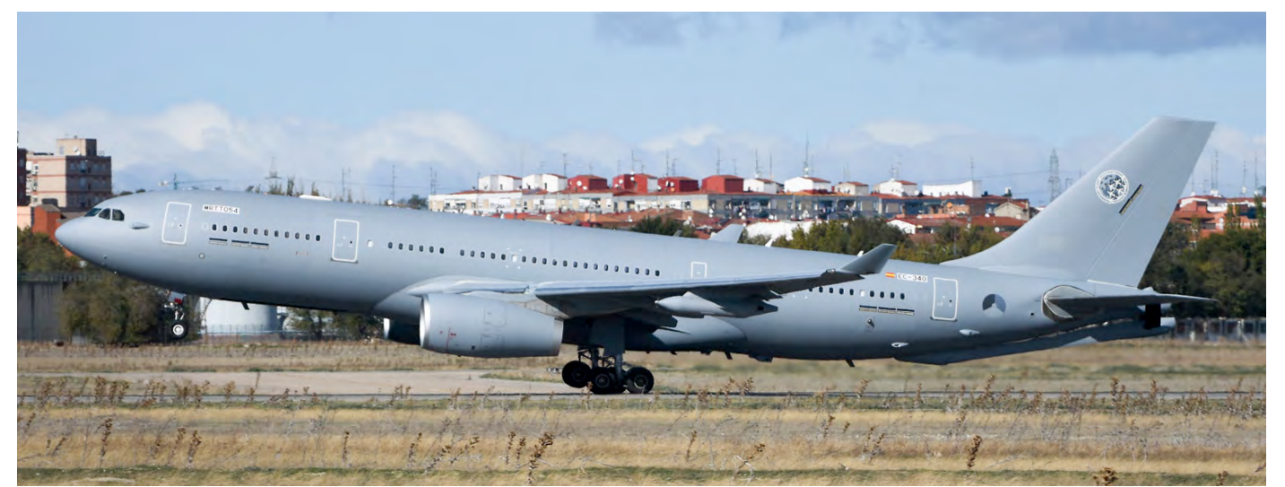
The first Multi-Role Tanker Transport Force (MMF) Airbus A330-243MRTT EC-340, the future KC-30M T-054, seen during a training flight at Getafe on 8 November 2019. It is slated to be delivered on 1 May 2020 to Eindhoven Air Base. (José Ramón Valero)