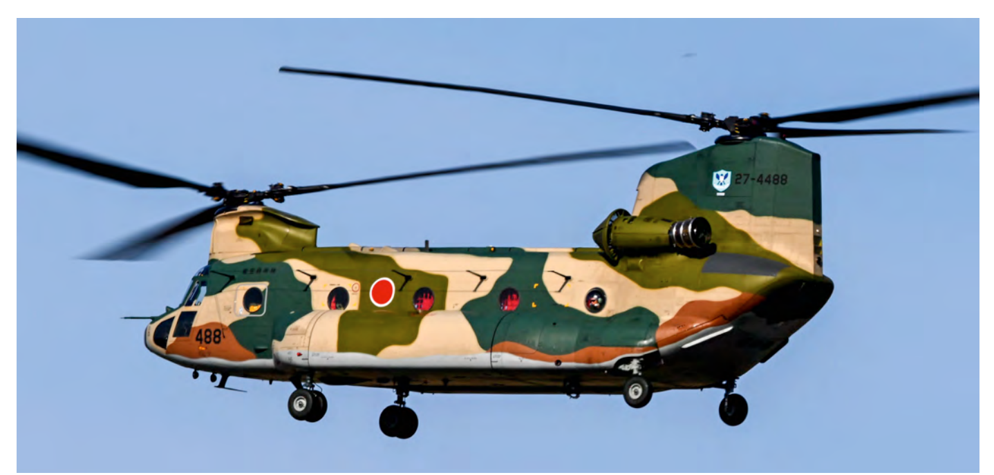
Chinook CH-47J 27-4488 is part of the Misawa Her Kuy, a rescue asset on the north Japanese Air Base.

attack by Iranian forces on Saudi oil facilities. On 11 October 2019, the Pentagon announced the following forces would move to Saudi Arabia: two fighter squadrons, one Air Expeditionary Wing (AEW), two Patriot batteries and one Terminal High Altitude Area Defense system (THAAD).