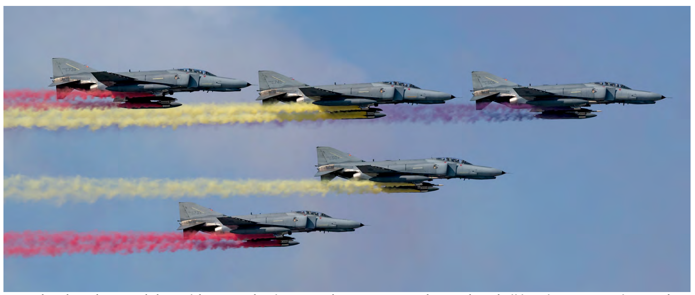
Suwon-based 153rd FS provided one of the many other formations during ADEX2019. The unit showed off five of its F-4Es out of its complement of around 25 operational Phantoms.