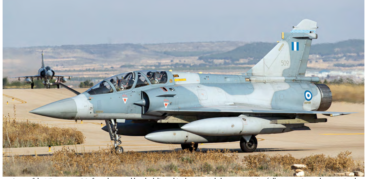
509 is one of the Mirage 2000-5BGs from the second batch, delivered in the 2000s. It belongs to 331 Mira. (Albacete, 24 September 2018, Stephan de Bruijn)