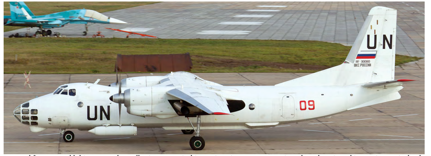
It turned forty years old this summer, but still going strong, is this Russian Air Force An-30R rain maker. The rain making equipment is clearly visible on the lower forward fuselage. It now carries 'VKS Rossii' titles and this photo re-confirmed its construction number as 1505. (Novosibirsk-Tolmachevo, 16 September 2019, Andre Alders)