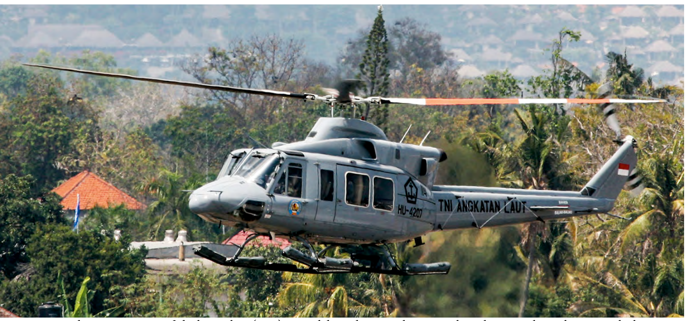
HU-4207 is a rather new NB412HP of Skadron Udara (RON) 400 with home base Surabaya-Juanda, Indonesia. Ad Jan Altevogt made this picture of the navy helicopter at Denpasar, more commonly known as Bali. (13 October 2019)