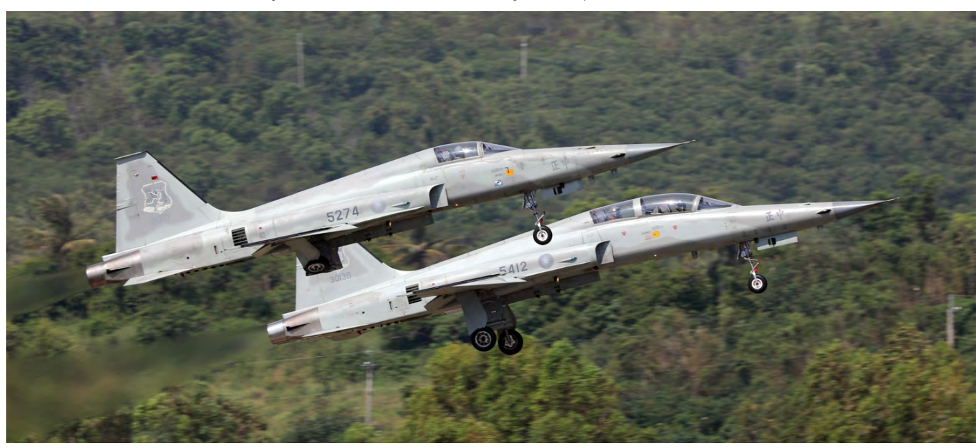
Another formation take-off of two grey coloured Tigers; 5274/91717 and 5412/30138. Hopefully both pilots know where they are going, as they are not looking to the front but to each other! (Taitung, 7 October 2019)