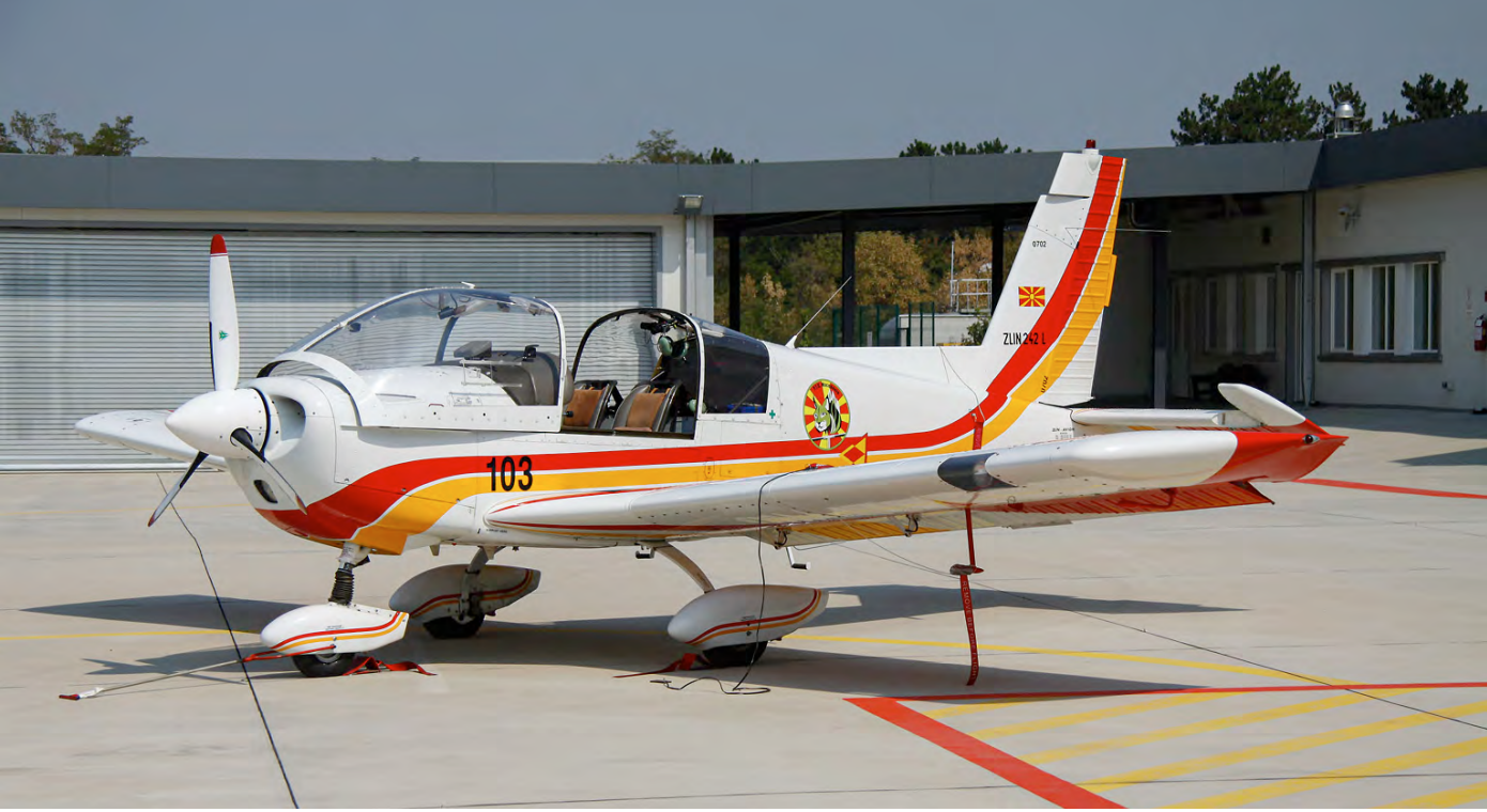
After major maintenance by Zlin in Czechia the old blue and white colours will be replaced by the colours of the Macedonian Flag. During our visit two had the old and three had the new colour scheme. (Bram Marijnissen)