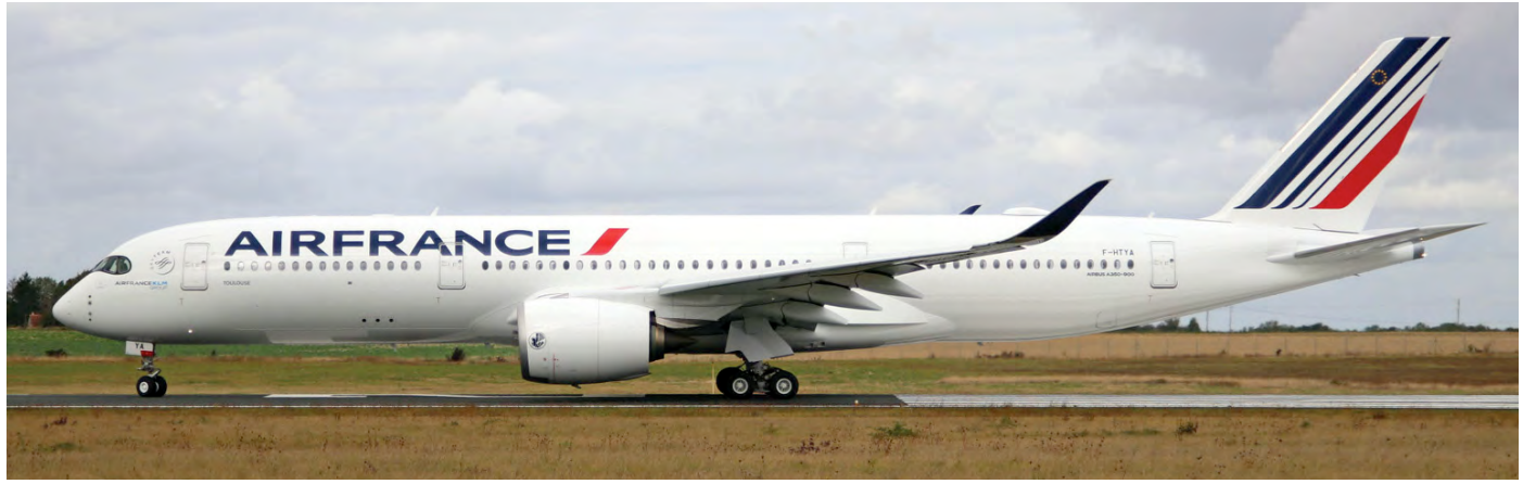
On 28 September 2019, Air France took delivery of its first Airbus A350-900 F-HTYA. It made its first commercial flight on 7 October from Paris-CDG to Bamako and Abidjan. In the weeks before it made some crew training flights between Paris-CDG, Toulouse and Chateauroux. In total Air France has ordered 28 Airbus A350-900s. (Chateauroux, 28 September 2019,)

Air Premia, one of the newest airlines from South Korea, announced it signed a deal with for five B787-9s. Earlier, the airline announced it had signed a lease agreement with Air Lease Corporation for three B787-9s, and it is planning to lease two more to have a total fleet of ten Dreamliners. Air Premia is planning to commence operations in Septem-