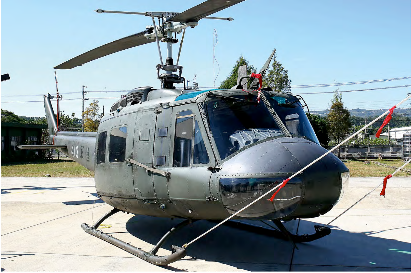
Our regular contributor Reinier Schreurs was present at the UH-1H retirement ceremony at Hsinshe on 30 October 2019. Retiree UH-1H 413 was among the helicopters on the static display.