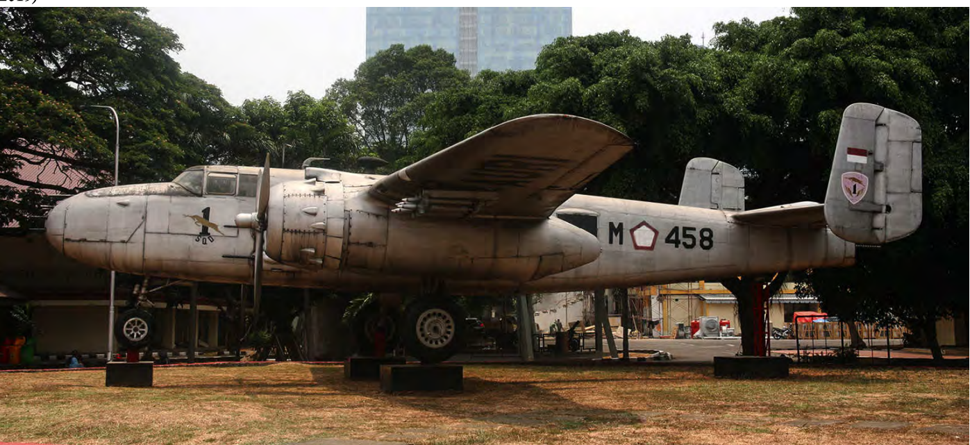
North American B-25J Mitchell M-458 was once operated by the Royal Netherlands East Indies Air Force. It later went to the Indonesian Air Force and has been preserved at Jakarta. (29 September 2019)