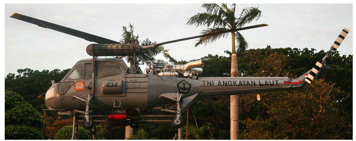
These three Indonesian preserved aircraft have two things in common: they all have ties with the Netherlands and are photographed by Ad Jan Altevogt. Westland Wasp HS-434 was once operated by the Royal Netherlands Navy as 243. (Juanda, 8 October 2019)