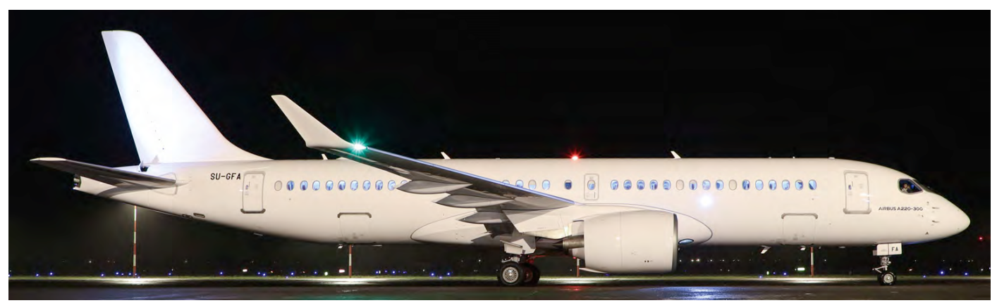
EgyptAir received three A220s in October via a delivery flight through Europe. Not all aircraft were delivered in full colours. SU-GFA was one of two aircraft being delivered via Ostend with the first being in full colours. Unfortunately the second aircraft on this photo was all white. (Ostend, 27 October 2019, Nik Deblauwe)