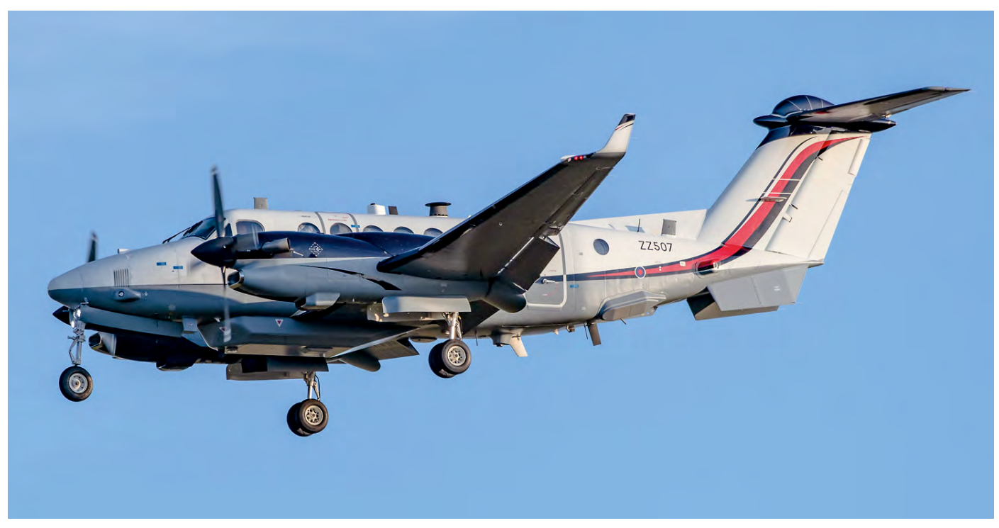
The latest Shadow R2 addition to 14sq at RAF Waddington is ZZ507. As can be seen it is sporting a semi civil scheme as a change to the normal drab grey scheme of the other aircraft. (4 November 2019, Martin Fox)