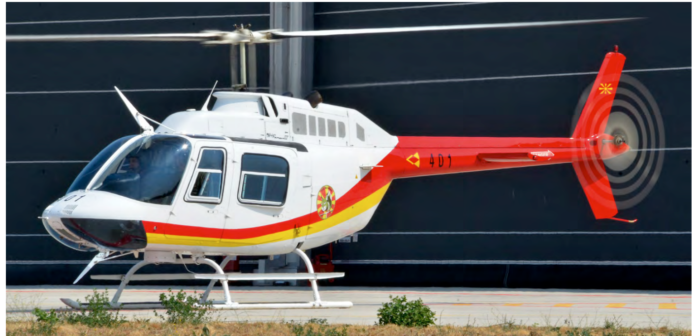
Since 2013 the Pilot Training Centre (PTC) has been operating four of these Bell 206B-3s for training pilots to operate the Mi-8, Mi-17 or Mi-24.

We would like to thank everybody within the Macedonian Ministry of Defence, Macedonian Air Force and the Pilot