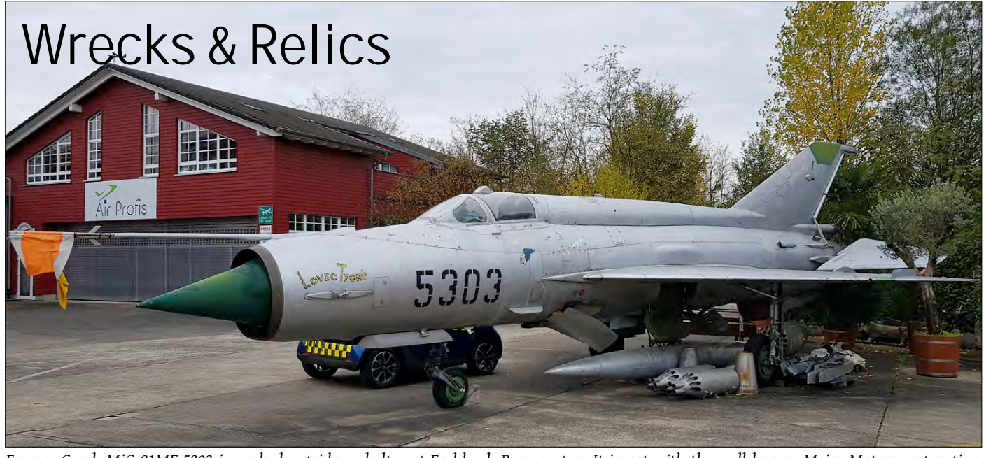
Former Czech MiG-21MF 5303 is parked outside a shelter at Eschbach Bremgarten. It is not with the well-known Meier Motors restoration company, but is privately owned. (14 November 2019,)