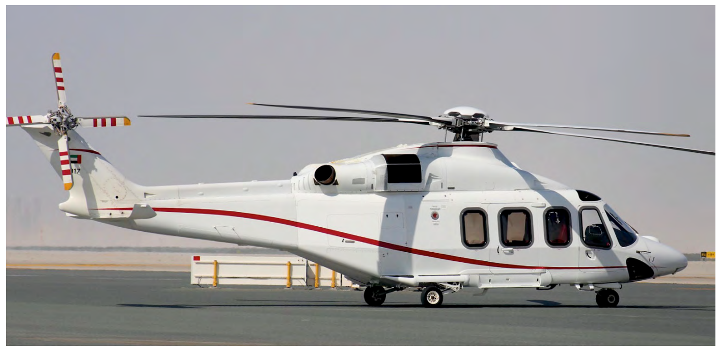
Leonardo AW139 2017 of the VIP Flight was a visitor at the recent Dubai Air Show at Al Maktoum in November 2019. Interesting for us is the serial, as we previously thought an AS365N3 Dauphin 2, F-WWOB seen in Marseille between June 2002 and November 2002, had acquired this number. This seems to have been incorrect. (Keith Doughty)

strength. Some eight older CH-47C+ variants are thought to have been withdrawn.