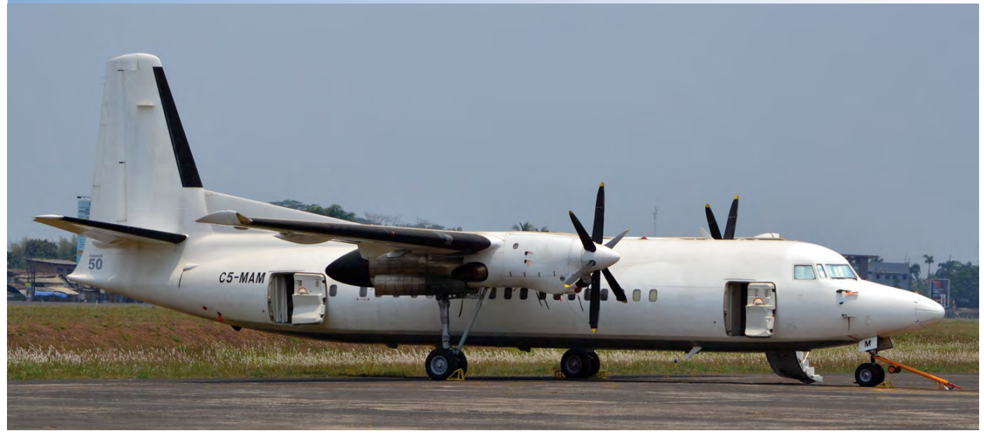
Fokker 50 C5-MAM (msn 20335) was seen in Tarco Air colours back in August 2017, while receiving maintenance at Pondok Cabe. It seems highly likely it never left Pondok Cabe as it was seen there again on 1 October 2019, in all white colours. This could mean that it has left the fleet and is awaiting a new customer. The doors are open in this picture, perhaps to let some fresh air into the Fokker as it has been there in the sweltering heat for quite some time!