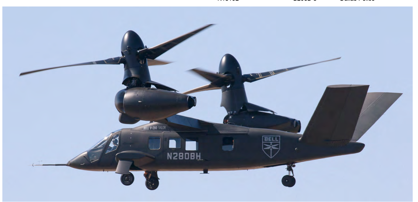
The Bell V-280 Valor is a tilt-rotor aircraft being developed for the US Army Future Vertical Lift Program. It is intended to replace various types within the US Army. (20 October 2019, Ft. Worth-Alliance (TX), Otger van der Kooij)