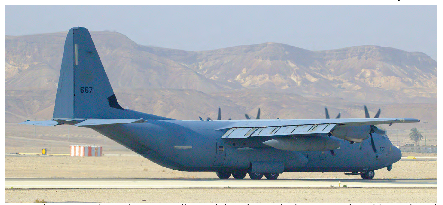
Super Hercules C-130J-30 667 of 103 squadron was captured by Jim Walg during the recent Blue Flag exercise at Ovda, Israel. (11 November 2019)

On 7 November 2019, the US State Department approved a possible Foreign Military Sale to the United Arab Emirates Air Force and Air Defense (UAE&AD) of ten CH-47F Chinooks and related equipment for an estimated cost of USD 830,3 million. Boeing Helicopters Aircraft Company is the principal contractor. The proposed sale contains spare parts, personnel training, training equipment and ground support equipment. The separate tri-service rotary force, Joint Aviation Command (JAC) formed in 2012, is the controlling command for virtually all UAE "dark grey and green" helicopters including some fixed wing assets. Group 25 is located at Sas al Nakhil-Umm an Nar (UAE) and has some twenty C-47Fs on