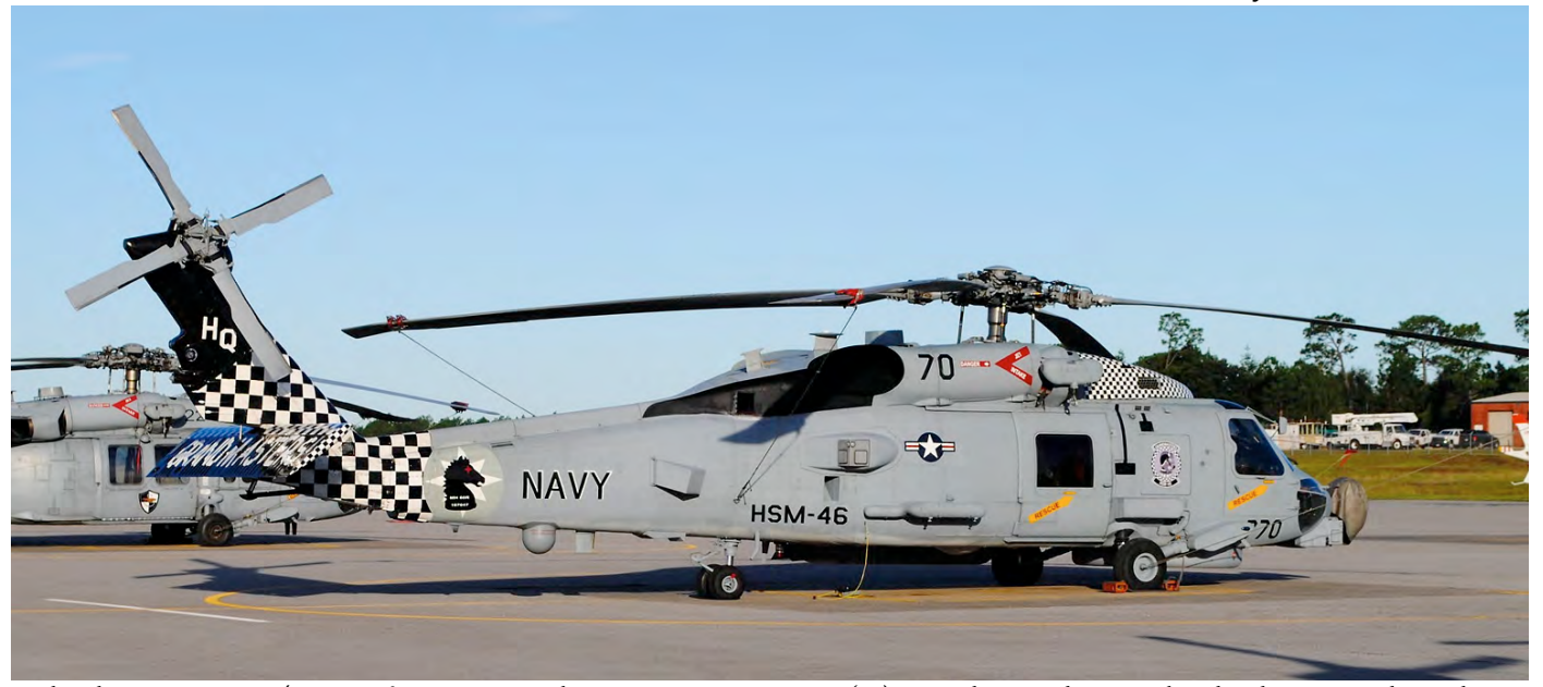
Seahawk MH-60R 167047/HQ-770 of HSM-46 "Grandmasters" at NAS Mayport (FL) was only recently painted in the above new colour scheme. (23 October 2019, Carey Mayor)

86-0416*, TE-8A, 19626/703/T-1, 330th CTS, apr19, N770JS 92-3289, E-8C-10, 19622/660/P-1, feb14, N4131G 92-3290, E-8C-10, 19295/617/P-2, feb19, 4115J 93-1097, E-8C-10, 19296/630/P-4, jan19, N6546L 94-0284, E-8C-10, 19293/546/P-5, nov16, N2178F 94-0285, E-8C-10, 19442/609/P-6, apr19, 67-30054 95-0121, E-8C-10, 20016/752/P-8, mar18, 68-11174 95-0122, E-8C-10, 20495/852/P-7, jun14, 71-1841 96-0042, E-8C-20, 20319/833/P-9, sep19, CAN 13705 96-0043, E-8C-20, 20316/825/P-10, may16, EL-AKT