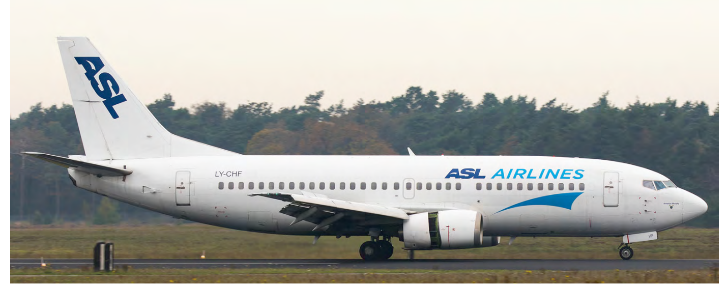
Delivered to Deutsche BA in October 1997 as D-ADBM this Boeing 737 has been added to the rapidly growing fleet of KlasJet as LY-CHF. It was acquired from ASL Airlines Ireland where it had been in service as EI-STA since March 2010. (Woensdrecht, 30 October 2019,)