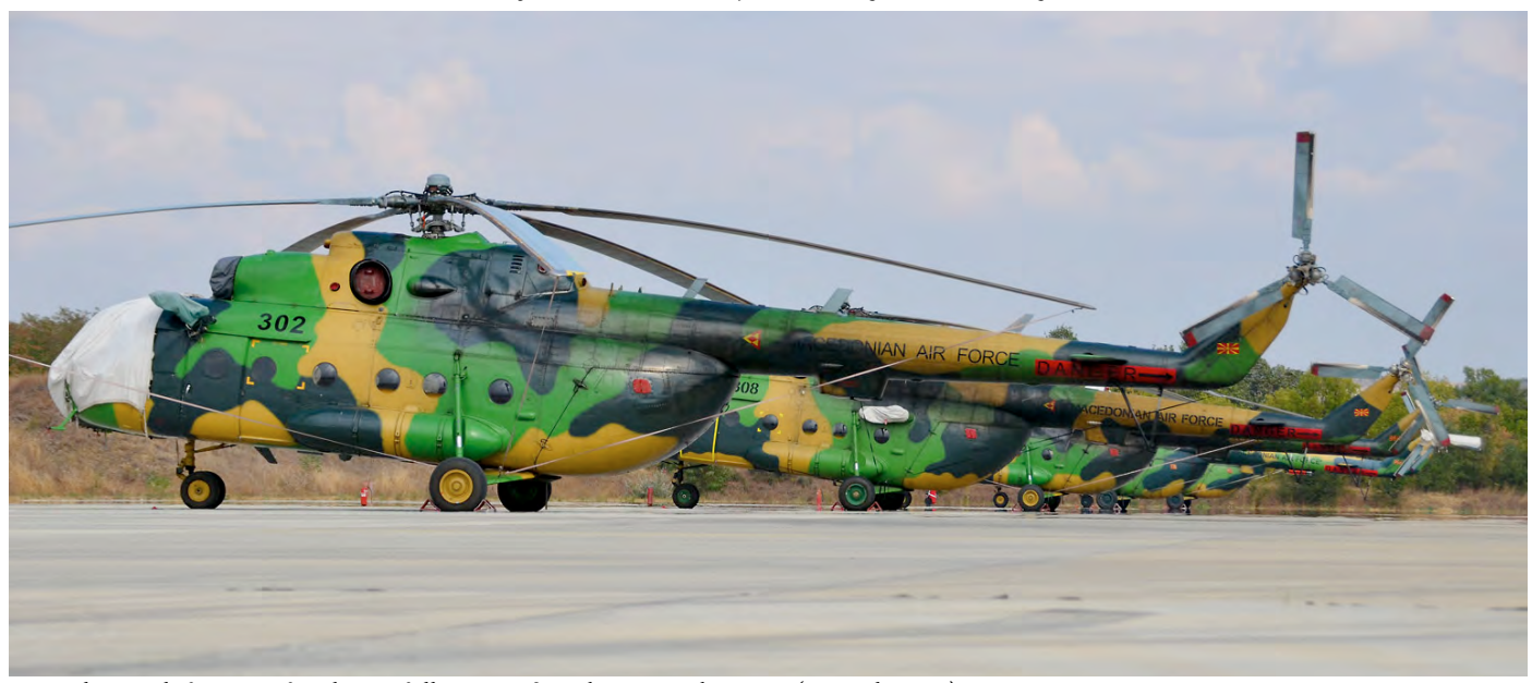
A nice line with five out of six beautifully camouflaged Mi-8s and Mi-17s. (Rene Sleegers)