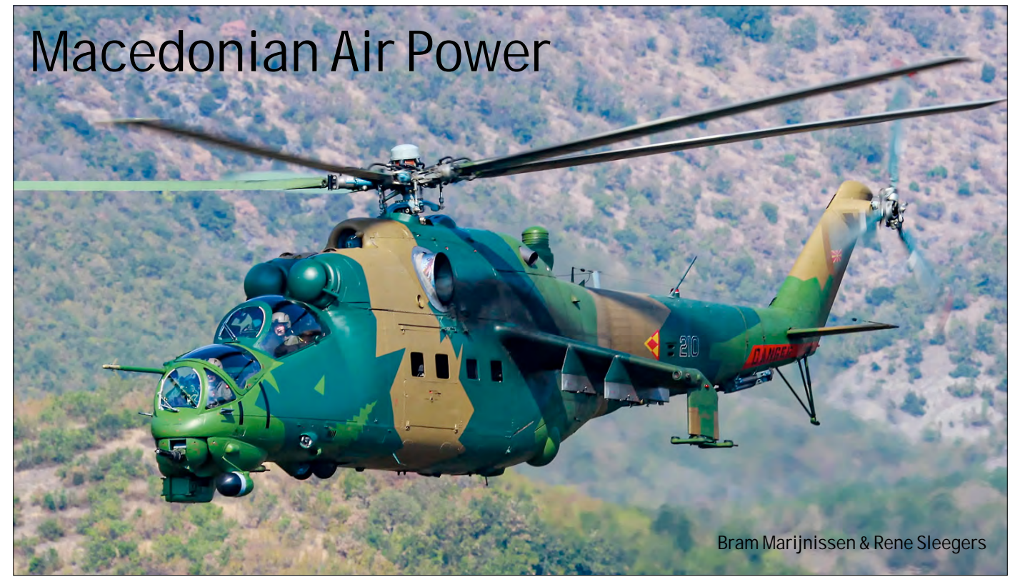
At the moment of our visit this nicely camouflaged Mi-24 was the only operational Mi-24 and was photographed during a low-level flight through the Tour Canyon, which is south of Petrovec Air Base.