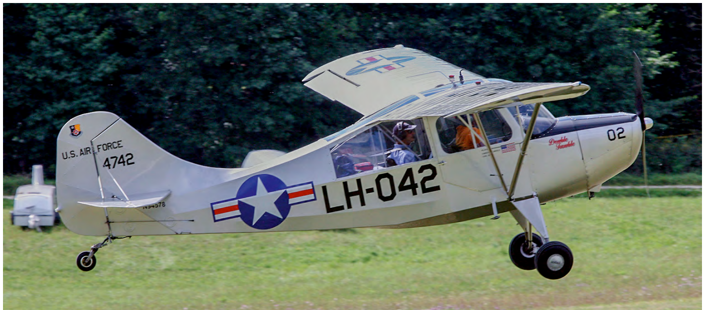
This Warbird section of Scramble is a sort of 'Hahnweide special' as all the photos shown here were taken there on 14 September, and all of them by Ad Jan Altevogt. He caught this Aeronca L-16, N94578, painted in USAF livery. The L-16 was the military version of the Aeronca 7BCM and used as an artillery observation plane during the Korean War, replacing the Piper L-4 Cub/Grashopper.

<u>Credits</u>: Flypast, Foxalphazoulou, Key Aero, Tri-State Warbird Museum