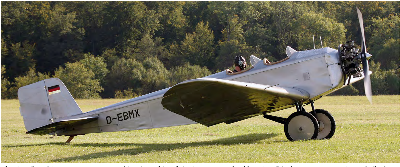
The aircraft on this page represent pre-war historic machines flying in Germany. The oldest aircraft in the German register is 1927 built Klemm L.25 D-EBMX. It is owned by Ulf Siegert of Ampfing. (All three 14 September 2019, Hahnweide, Ad Jan Altevogt)