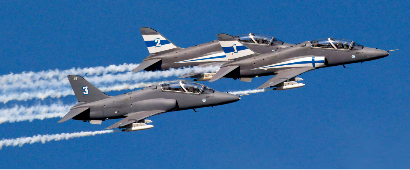
The Finnish Midnight Hawks was one of the teams seen performing during the NATO days at Ostrava on 22 September 2019. (Jochen Schrader)