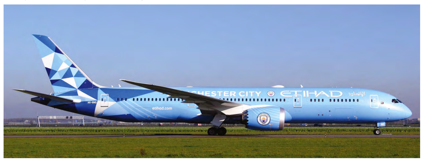
On 17 October 2019 Etihad Airways launched its brand new Boeing 787-9 Dreamliner A6-BND with a striking Manchester City colour scheme to highlight its sponsorship with Pep Guardiola's side. (Amsterdam-Schiphol, 10 November 2019,)