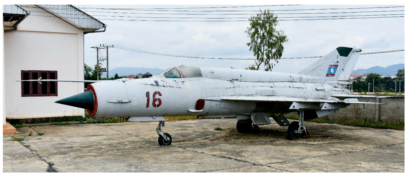
Erwin Alexander found this Fishbed with code "red 16" in a corner at the military barracks in Phonsavan, Xieng Khouang, Laos. As he was able to look in the right-hand main gear bay and he located the construction number N75081703, we can tell this is a MiG-21bis that used to be part of the Laos People's Liberation Army Air Force. (6 November 2019)

The aircraft will be used in the close air support role and as such are expected to replace SF260 aircraft with 17th Attack Squadron, which in turn are expected to return to their original role as trainer aircraft. When the option for 18 additional aircraft is taken then the future of the OV-10 aircraft will also look slim.