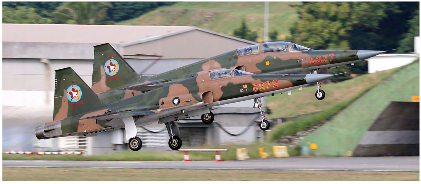
A nice formation take-off of two camo RoCAF Tigers from Taitung, on 7 October 2019. In the front is F-5E 5272/80874 and in the back 5377/80884. Both belong to TT&DC, or the Tactical Training & Development Center.