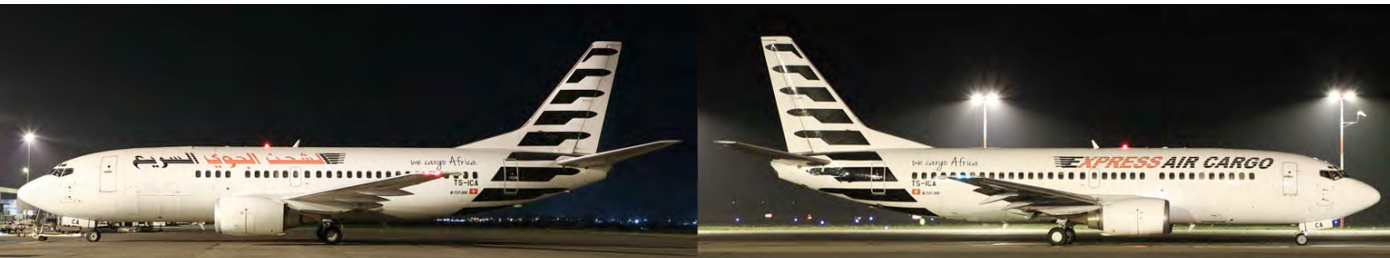
Although founded in 2015 Tunisian freighter operator Express Air Cargo operated its first commercial flight between Tunis and Paris Charles de Gaulle on 25 February 2017. Boeing 737 TS-ICA was delivered to the company in January 2017. (Ostend, 31 October 2019,)