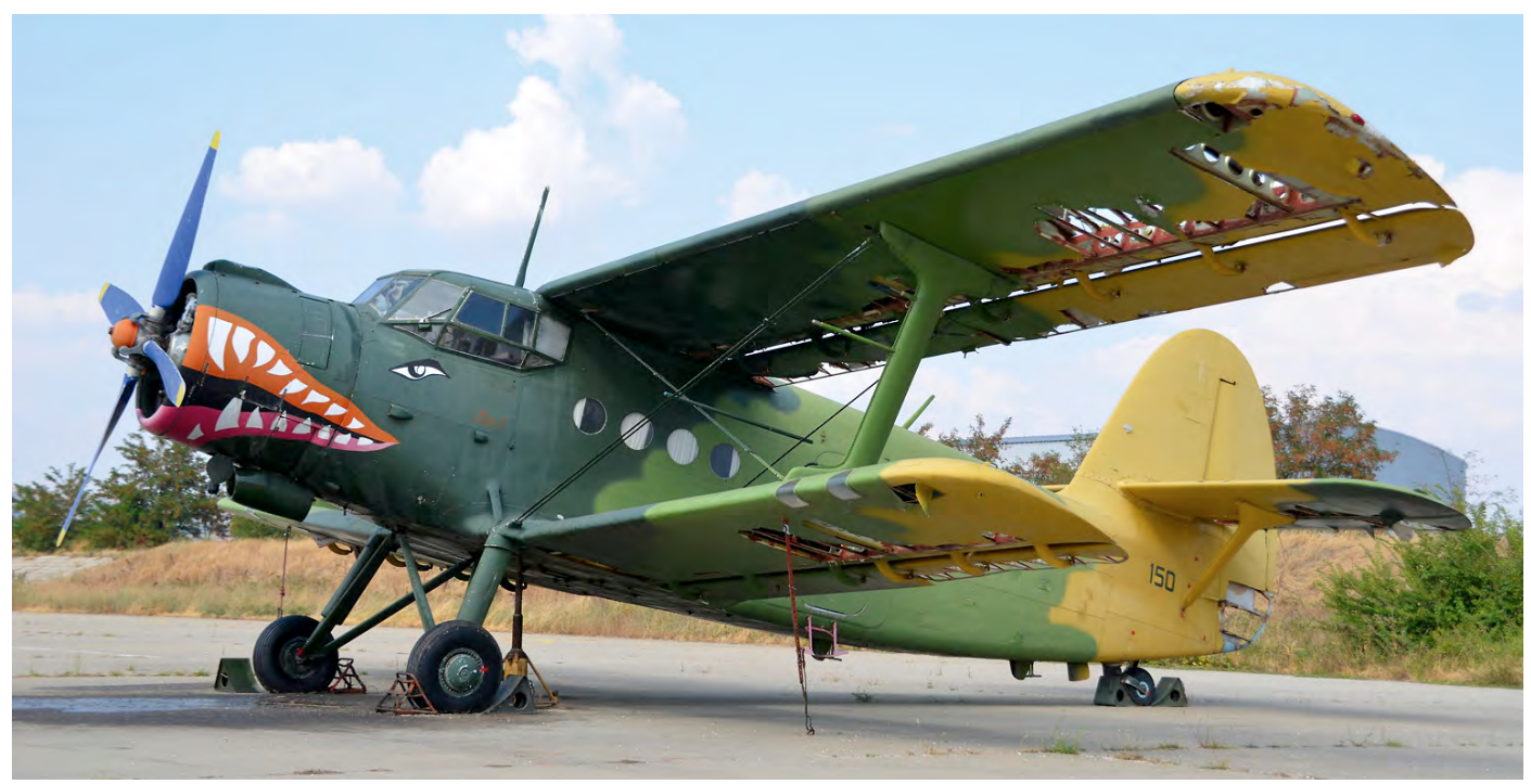
It is sad to see this nice An-2 in this state. Luckily it should become operational again. (Rene Sleegers)