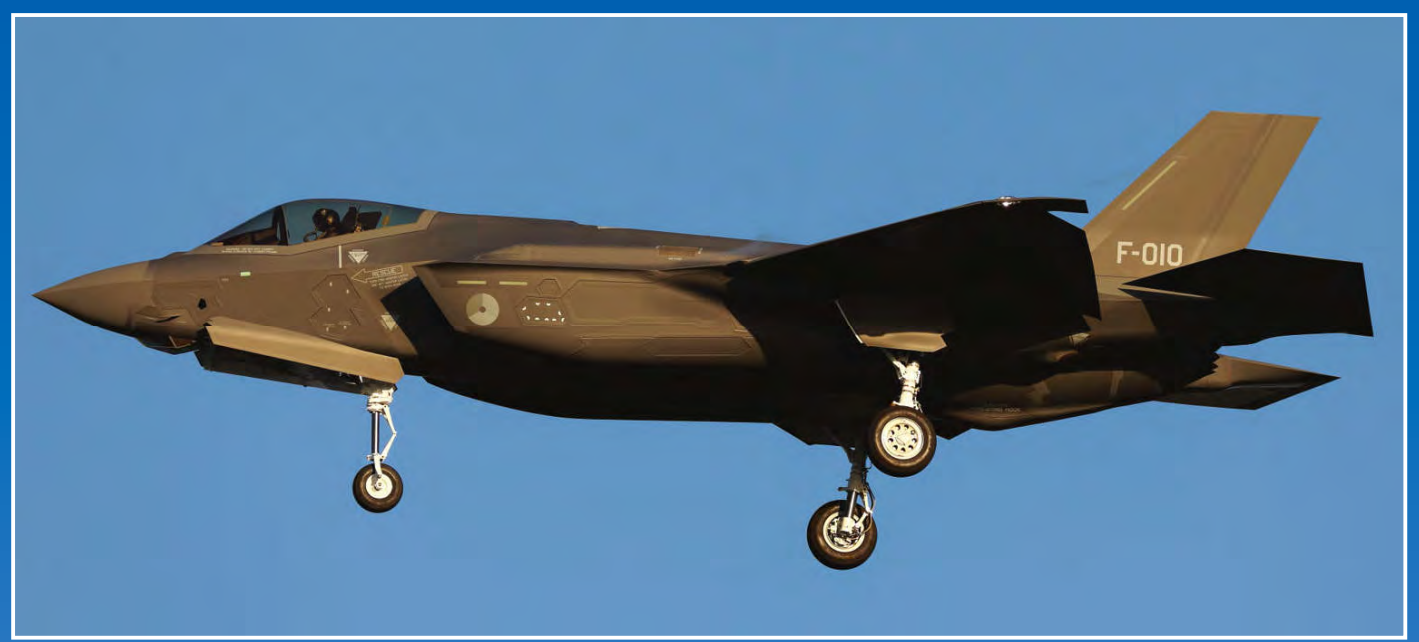
Just after the first Italian build F-35A for the Netherlands was delivered, F-010 made its first flight on 4 November 2019 from Cameri.