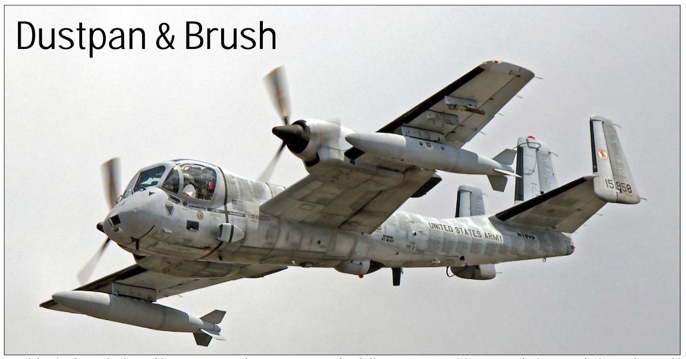
A sad day for the warbird's world, as MD Aviation lost a Grumman Mohawk (former 68-15958 of the US Army) after it crashed at Witham Field (FL), during the Stuart Air Show. The Mohawk is seen here performing during the Tyndall AFB (FL) air show on 23 April 2017