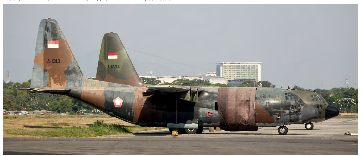
A-1313 and A-1304 are two rather weathered and derelict former Indonesian Air Force C-130Bs parked in a corner of Bandung, Husain Sastranegara International Airport, Indonesia. (4 October 2019, Fred Bronner)