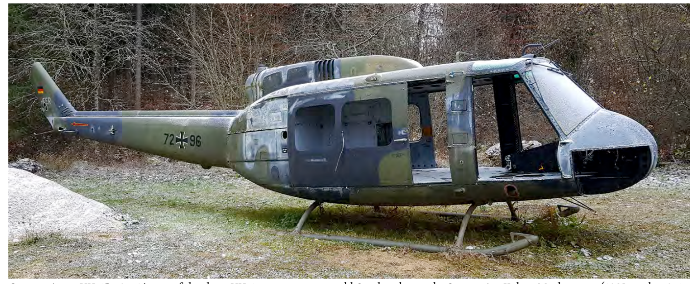
German Army UH-1D 72+96 is one of the three UH-1s seen on a very cold October day at the Stetten Am Kalten Markt range (18 November 2019)