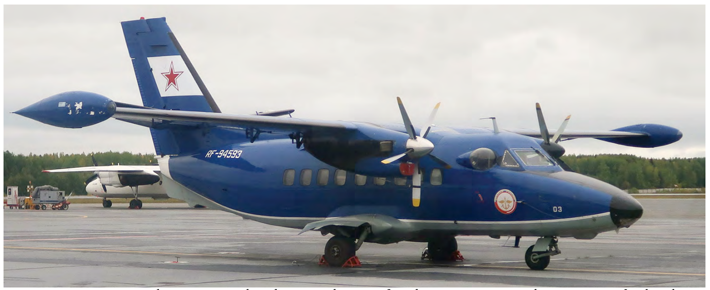
RF-94594 is a DOSAAF operated L-410UVP-E3 and was last seen in basic Aeroflot colours at Stupino 13 October 2013. It re-surfaced at Khanty-Mansisk on 12 September 2019 in this overall blue colour scheme. There is however, no confirmation of its construction number and therefore it is possible this registration has been re-used on another aircraft in addition to the one seen in 2013. (Khanty-Mansisk, 12 September 2019, Andre Alders)