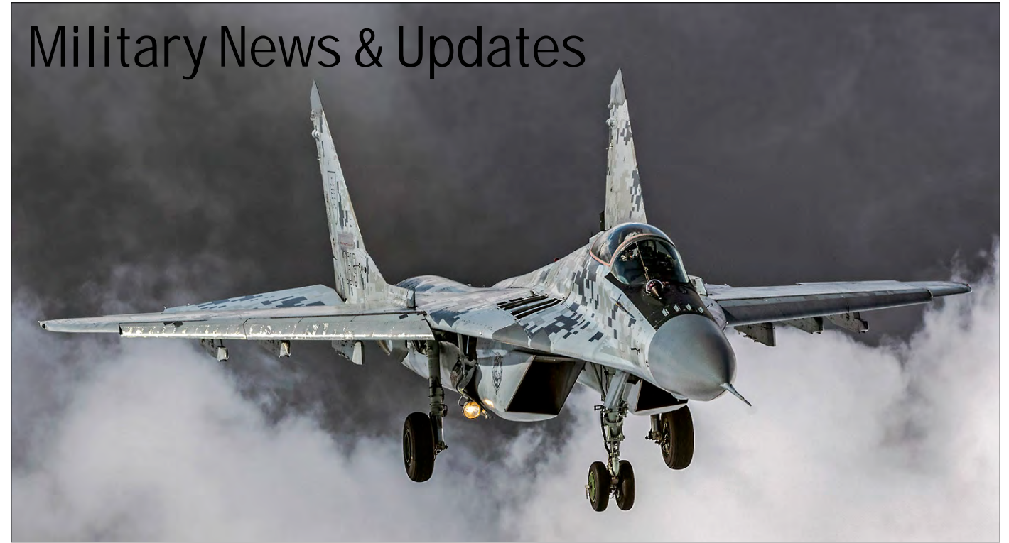
Hans Antonissen was able to make this rather spectacular air-to-air shot of Mig-29AS 0619 of Taktické krídl of the Slovak Air Force during the arrival day at the Ostrava NATO days. (20 September 2019)

Because of our standardization we sometimes use type, unit and serial presentations that may strongly differ from those used by the manufacturer or user. It is therefore possible that the information sent by you can deviate from the information we publish.