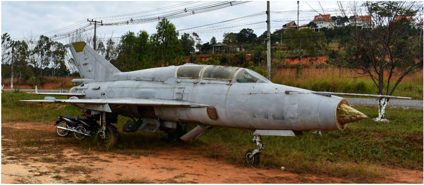
Another nice find at the military barracks in Phonsavan, Xieng Khouang, Laos. Construction number 06685136 makes this a genuine Mikoyan-Gurevich MiG-21US. The Lao People's Liberation Army Air Force had code 710 in black digits on the nose in better times. (6 November 2019, Erwin Alexander)