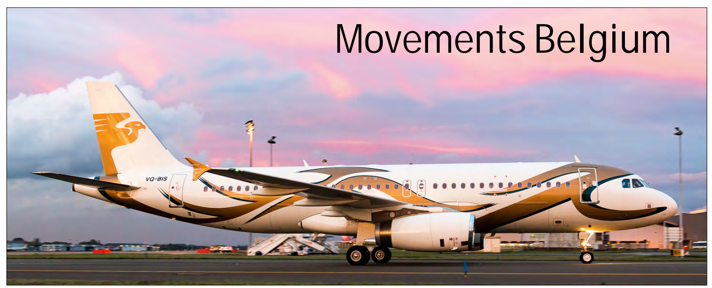
An arrival from Yekaterinburg via Charleroi Brussels-South at sundown. From June 2009 till March 2010 registration VQ-BIS belonged to a Global Express. The Airbus A320 on this photo received the registration in June 2018 when it was acquired by Meridian Air. (Brussels, 15 October 2019,)