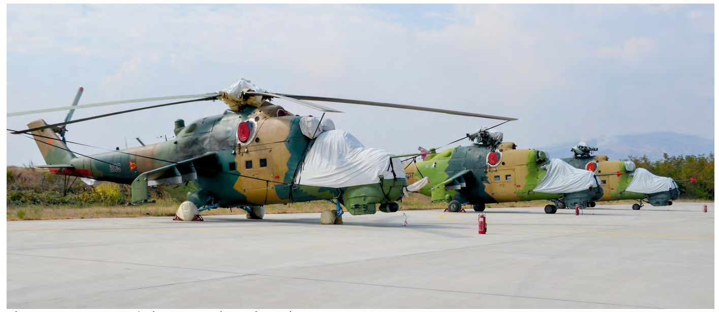
These Mi-24s are waiting for better times. (Rene Sleegers)