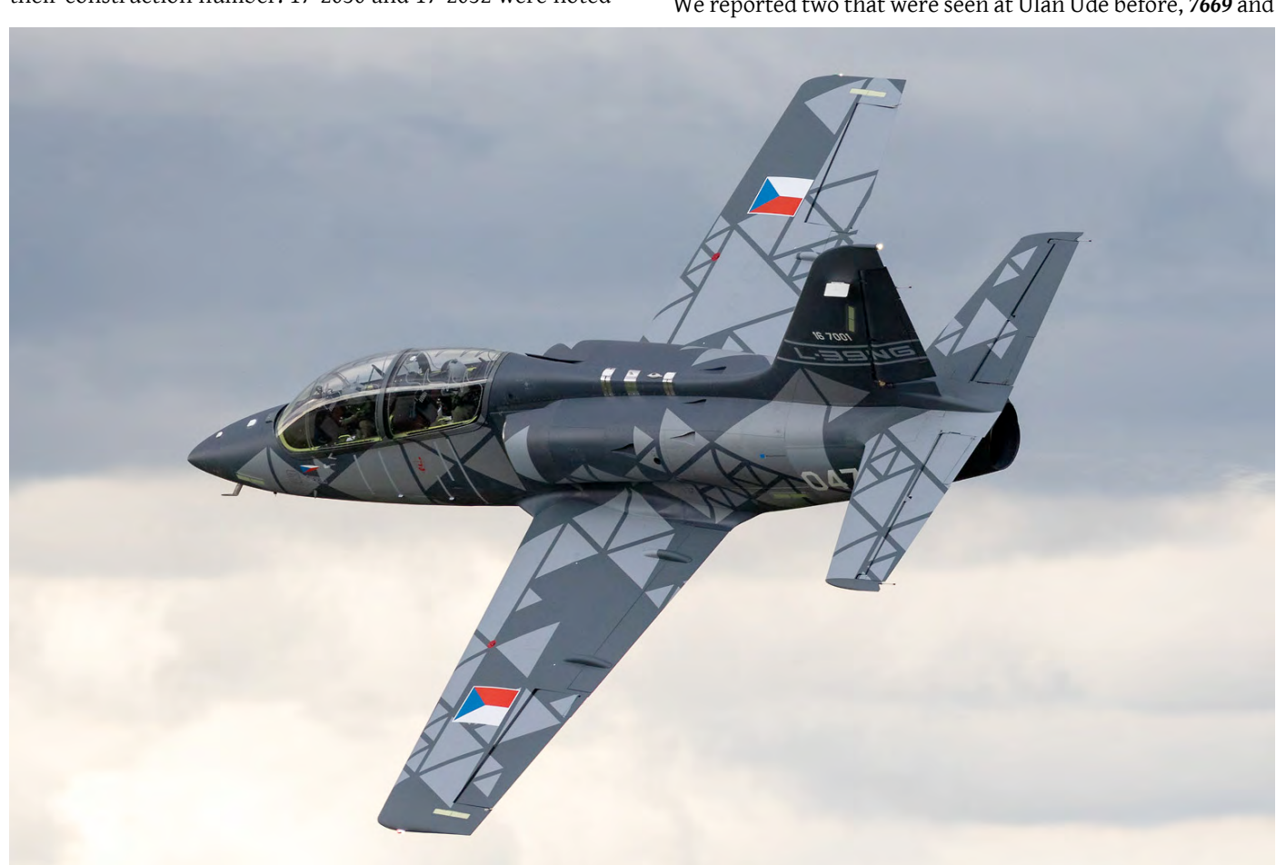
The rather non-standard colours on this L-39NG (0475) indicate it still belongs to manufacturer Aero Vodochody. (Ostrava, 20 September 2019, Markus Schrader)