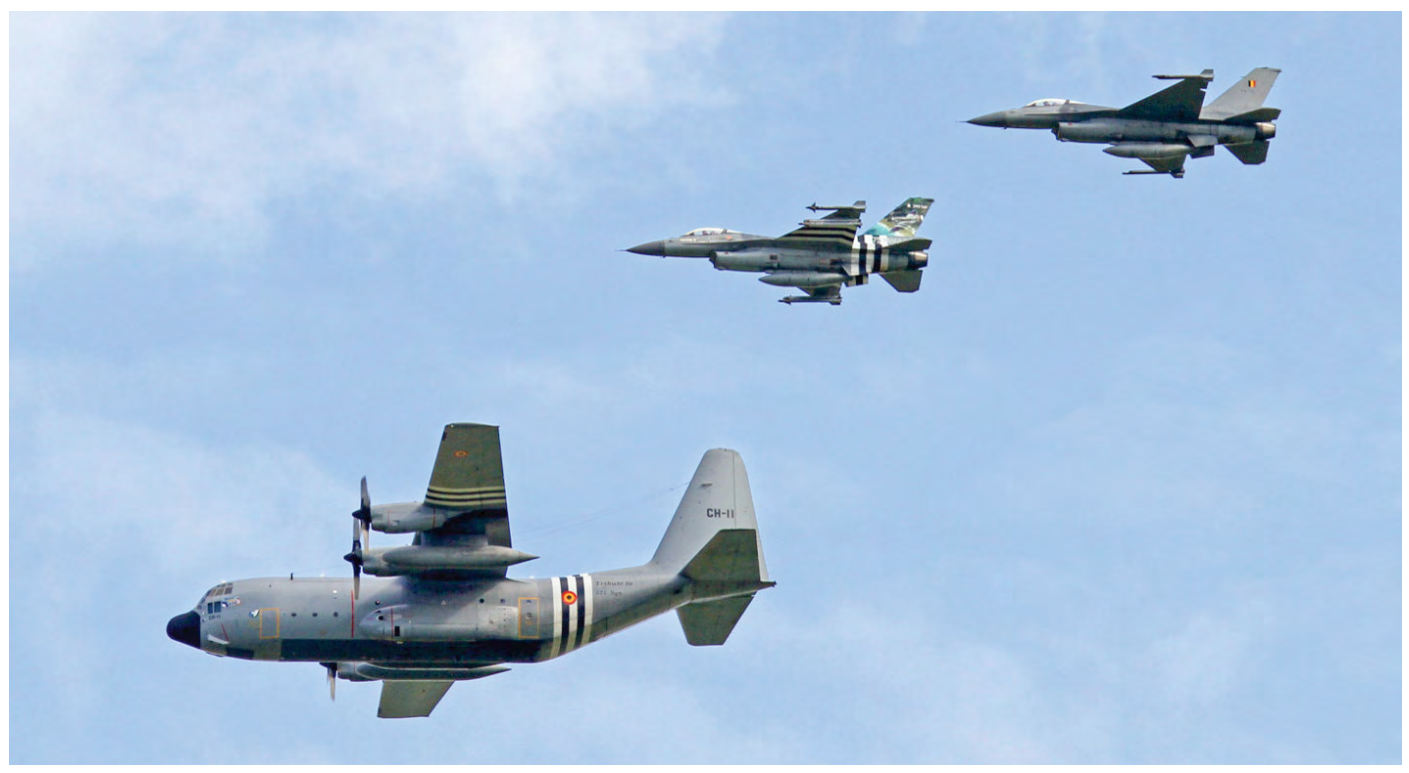
During the Antwerp Liberation Days several Belgian Air Component formations overflew Deurne airport. This formation has C-130H CH11 and F-16As FA72 and FA124. (7 September 2019, Walter van Brempt)