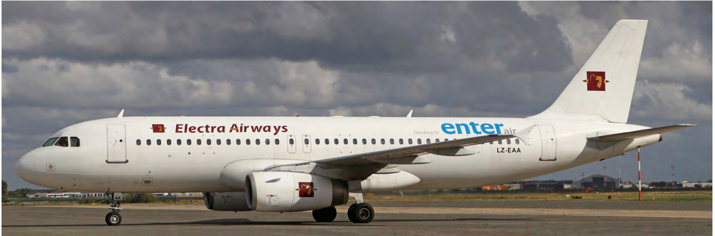
Electra Airways acquired this Airbus A320 in July 2017. LZ-EAA was leased to Enter Air in the summer of 2018. During the winter season it was returned to Electra Airways. From April 2019 the Airbus was again leased to Enter Air for the summer of 2019 until 1 November 2019 when it was returned to Electra Airways again. (Ostend, 2 October 2019, Nik Deblauwe)