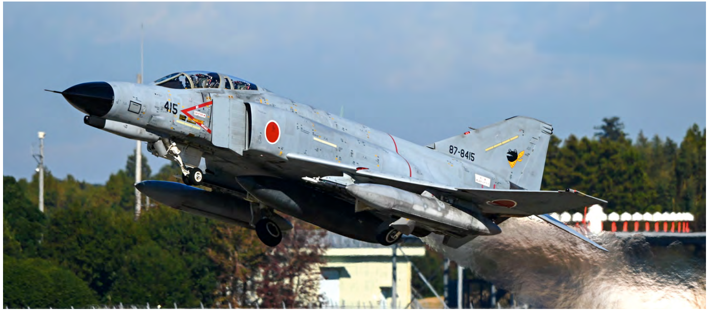
Soon this sight will be history. The Phantoms of the 301 Hikotai, including F-4EJ Kai 87-8415, will be retired from operational service. (Hiyakuri, 12 November 2019,)

additional twelve Lot 2 Whiskeys within FY19. These will be delivered in 2020. The Initial Operational Test and Evaluation programme is expected to start at Moody AFB (GA) mid fiscal year 2021. The base will be the first operational home for the new helicopter.