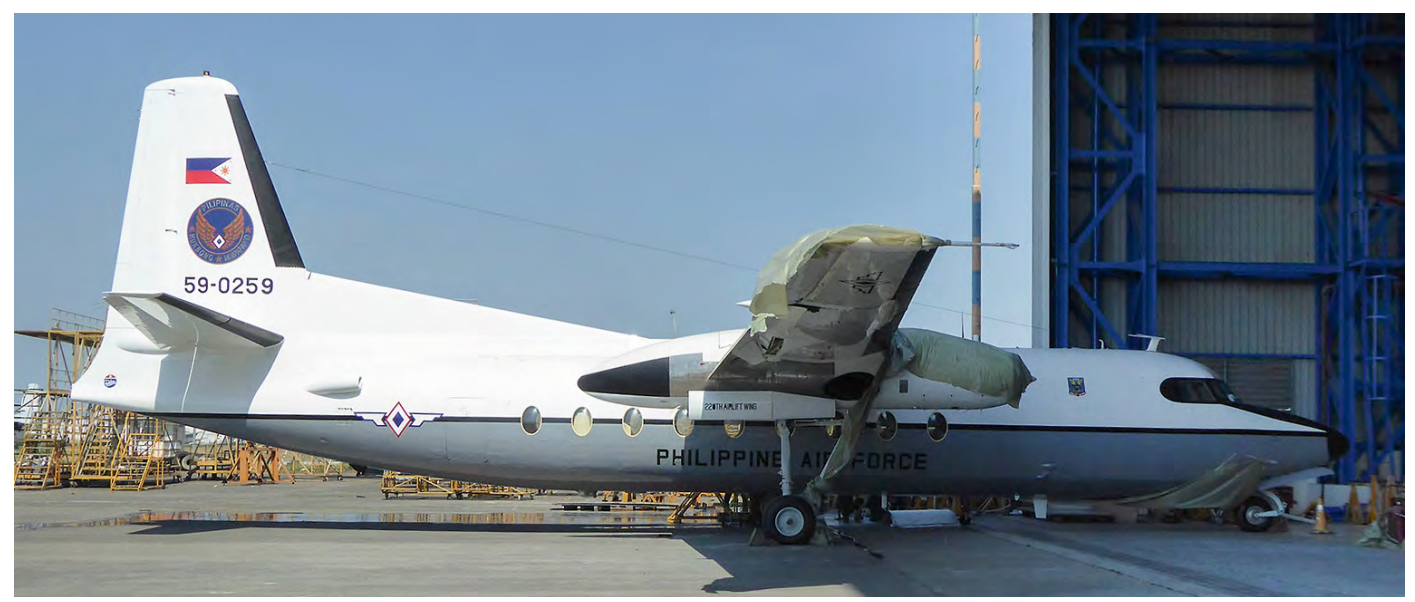
Fokker F-27-100 of 221th AS of the Philippine Air Force looks good after a recent paint job by Merpati Maintenance Facilities (MMF). MMF is located at the north-east side of Surabaya Airport, Indonesia. At that location some thirty aircraft are parked and two Fokker Friendship simulators of the training centre. (8 October 2019,)

With the eminent retirement of the OH-6D, the JGSDF seems to fall short on its observation helicopters. The successor for the OH-6D, the Kawasaki OH-1, is very slowly returning to operational status, after the grounding following a crash. However only the Homen Herikoputatais and Taisensha Herikoputatais were provided with the OH-1. It looks like the Hikotais under direct command of a Division or Brigade are