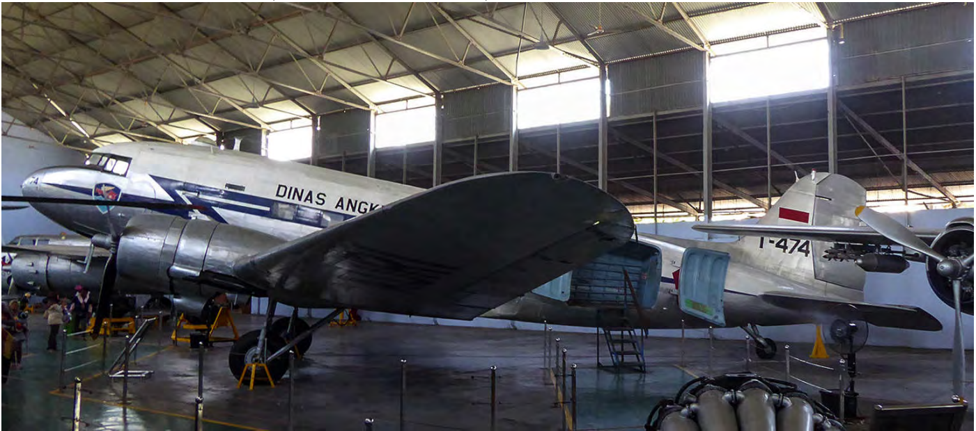
Once operated by the Dutch as NI-474, this Douglas C-47 was, for many years, displayed in camouflage colours as T-462. The Air Force museum of Yogyakarta has now given the transport the correct identity and livery: T-474. (5 October 2019)