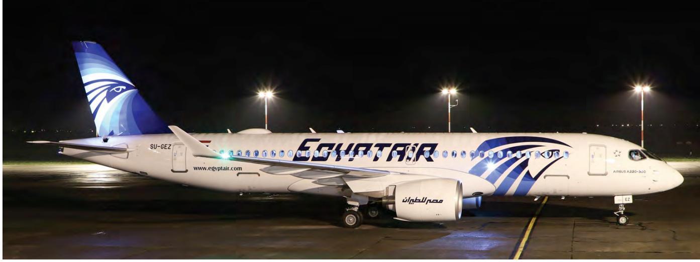
Early September Egyptair recieved its first Airbus A220-300. It was the first out of an order for twelve aircraft. As of late November six aircraft of this order have already been delivered to the Egyptians. One of them is SU-GEZ which made a fuel stop at Ostend during its delivery flight to Cairo. (Ostend, 20 October 2019, Nik Deblauwe)