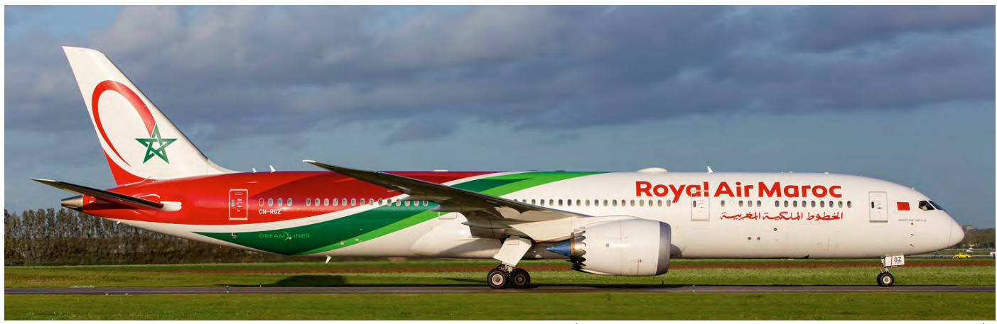
Royal Air Maroc took delivery of Boeing 787 CN-RGZ in new colours in May 2019. (Amsterdam - Schiphol, 18 October 2019,)