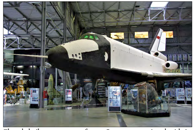
Though built as a spacecraft, one Buran was equipped with jet engines to enable autonomous test flights, and so became an aircraft. Uniquely marked as CCCP-3501002, it has been on display in Australia, stored in Bahrain and eventually preserved at the Technik Museum Speyer. (7 September 2019, Raymond van Dijkhuizen)