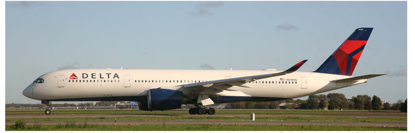
Delta Air Lines currently operates a fleet of thirteen Airbus A350 aircraft. Twelve aircraft are still on order. N510DN was delivered to Delta in May 2018. The airline recently announced to take over an additional number of A350 aircraft from partner LATAM. (Amsterdam - Schiphol, 29 October 2019,)