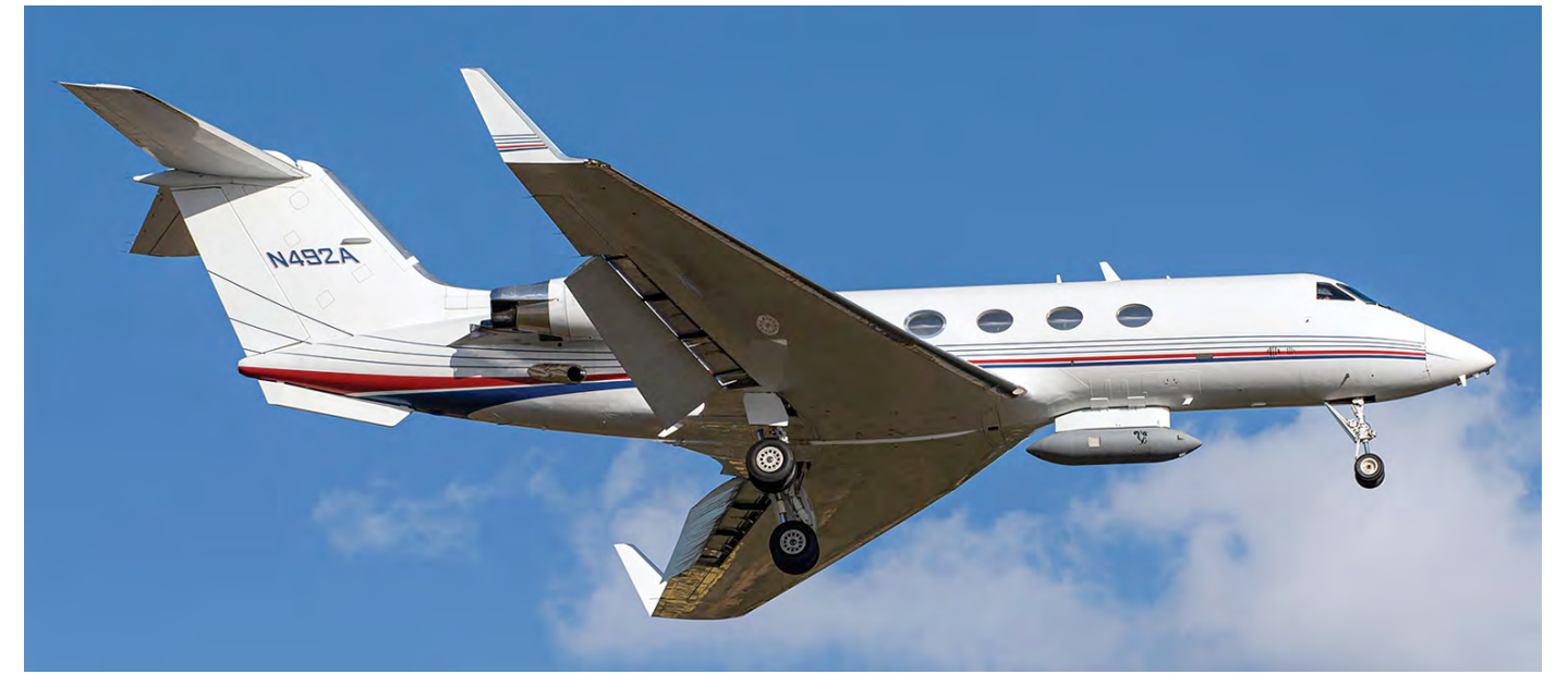
A very nice landing-shot of an aircraft type slowly disappearing from the global skies, is this Gulfstream III (N492A, msn 425) of Western Jet Aviation with measuring equipment under the fuselage, and was taken at Fort Worth NAS JRB/Carswell Field (TX). Small detail: on the measuring pod a picture is visible containing the figure of famous Lockheed Martin Skunkworks... (23 October 2019, Dylan Phelps)