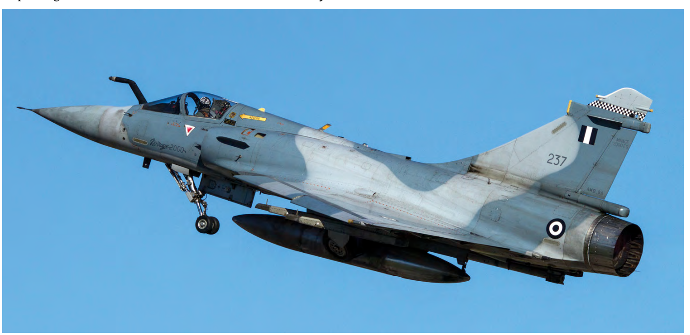
The black and white checkered finband indicates that Mirage 2000EG 237 belongs to 332 Mira. (17 January 2018, George Karavantos)

The initial forty Mirage 2000s are serialled 201-204 for the two-seaters and 210 to 245 for the single-seaters. Of these, serials 211, 214, 227, 230, 234, 235, 236, 240, 243 and 245 have been converted to Mirage 2000-5EG. The new-built Mirage 2000-5BGs have serials in the 505-509 range, whereas the new-built 2000-5EGs run from 546 to 555.