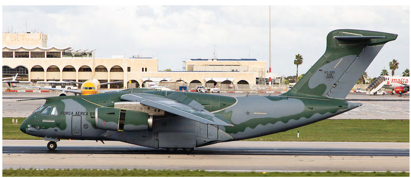
Brazilian Air Force Embraer KC-390 2853 is one of the first examples delivered to an operational unit. 1°GTT received this example, but it was used to fly halfway around the world for the Dubai Air Show for Embraer. Shaun Psaila was able to capture the aircraft on his camera while tech stopping in Malta en route to Dubai. (14 November 2019)