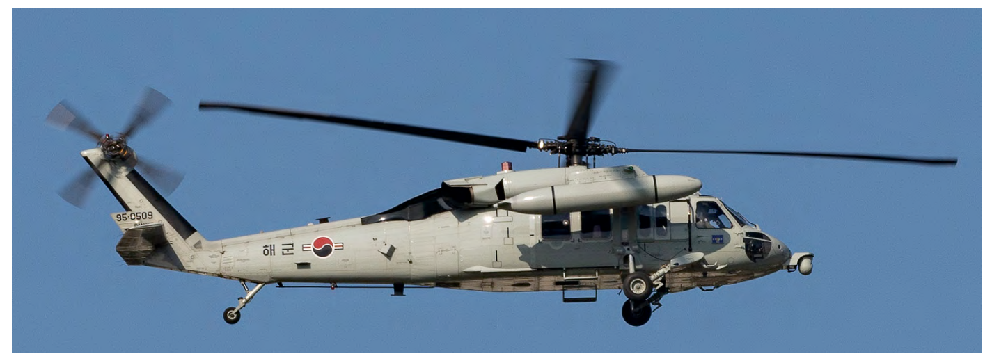
South Korean navy UH-60P 95-0509 was not part of the flying display but dropped off some navy officals during ADEX2019. (Seongnam, 15 October 2019, Paul van der Linden)

Seoul International Aerospace and Defense Exhibition 2019 was held at Seoul airbase, Seongnam, from 15 to 20 October. The report above is mostly from 14 and 15 October, with some additions from 19 and 20 October. 14 October was a day for the media, during which there was also the rehearsal for the flypast on 15 and 19 October. On 15 October the opening ceremony with the flypast took place. The trade days were from 15 to 18 October. On 19 October the gates were open to the general public. On this day again there was a flypast, but this time it was spearheaded by a formation of fifteen KT-1s in '70' formation, signifying 70 years of Republic of Korea Air Force. Unfortunately there is no complete log of the formations on this day.