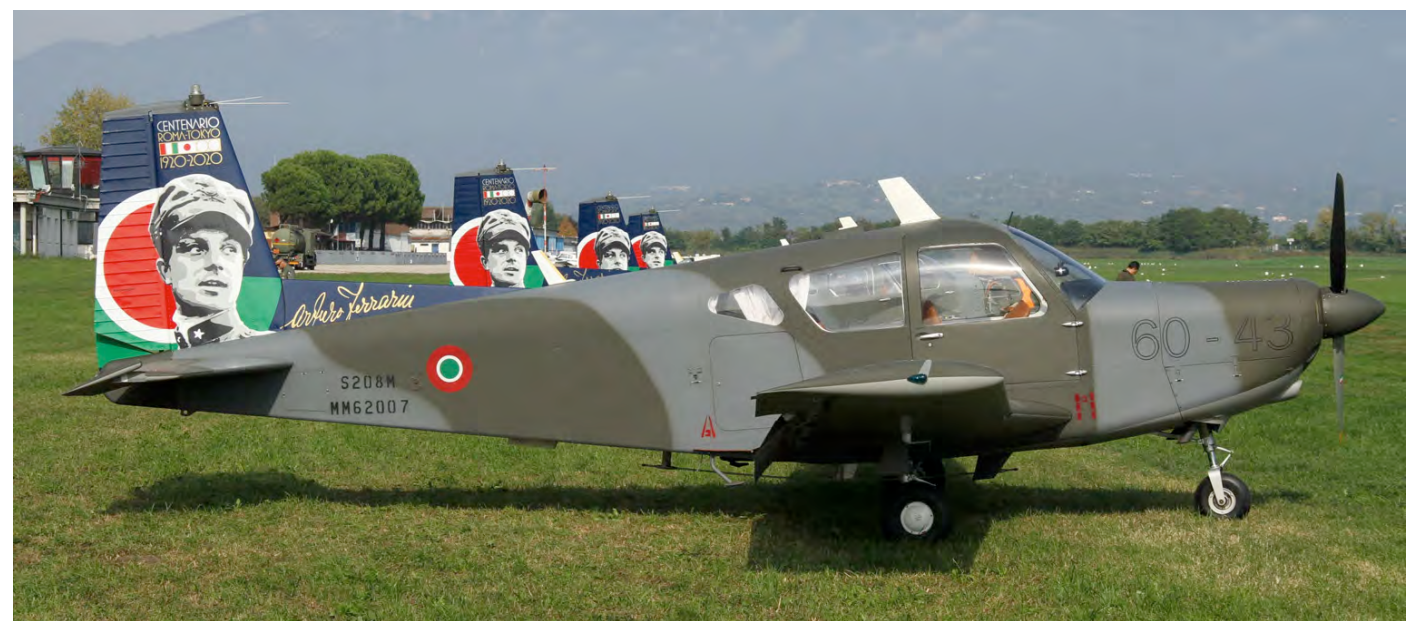
The forthcoming 100th anniversary of the flight from Roma (Guidonia) to Tokyo in 1920 by Arturo Ferrarin resulted in a special tail worn on five S208Ms of the Aeronautica Militare. Pictured is S208M MM62007/60-43 on the grass of Thiene Airport. (22 October 2019, Daniele Mattiuzzo)