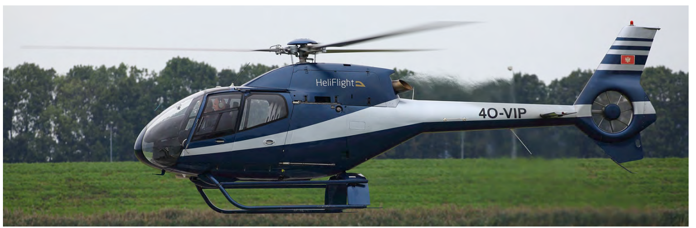
Until October 2019 Eurocopter 40-VIP was being operated by Airways Scenic & Charter. The helicopter was sold to HeliFlight in May 2019 but arrived in the Netherlands around August 2019. The helicopter was flown to Maastricht for work and re-registration at the end of October 2019 and will become PH-PDK. (Lelystad, 7 October 2019, Frank Mink)