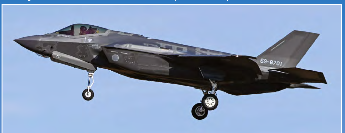
March 2019 the 302 Hikotai flying F-4s from Hyakuri was disbanded and re-established at Misawa flying F-35A, which was flying the Lightning II for almost a year with Rinji 302 Hikotai. (Misawa, 11 November 2019,)