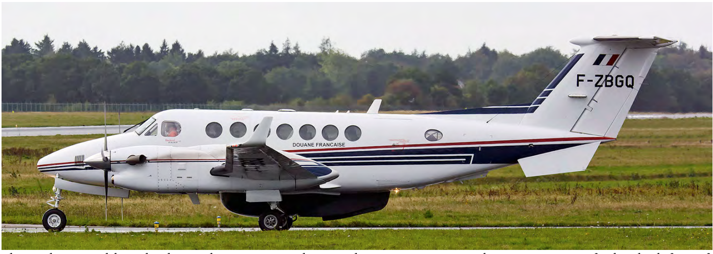
This Beech 350i was delivered to the French Customs in March 2015. Making an appearance outside France is quite rare for these kind of aircraft but Simen Dorschman was able to photograph F-ZBGQ at Groningen - Eelde airport on 1 October 2019, when it passed through on its way to Scandinavia.