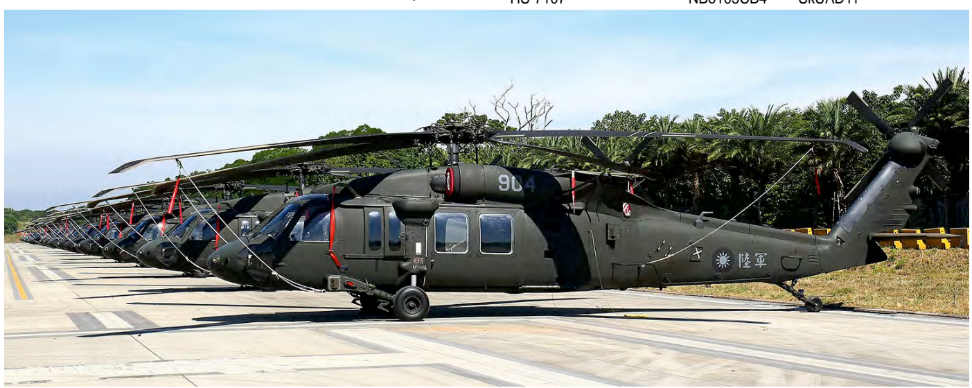
Massive line-up of RoC Army UH-60Ms at Hsinshe. This helicopter is the successor of the UH-1H fleet and reached full operational capability on 30 October 2019. (Reinier Schreurs)