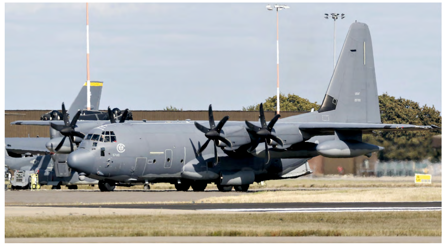
One of the Mildenhall based units is 67th SOS to which this MC-130J 12-5760 belongs (3 September 2019, Martin Uleman)