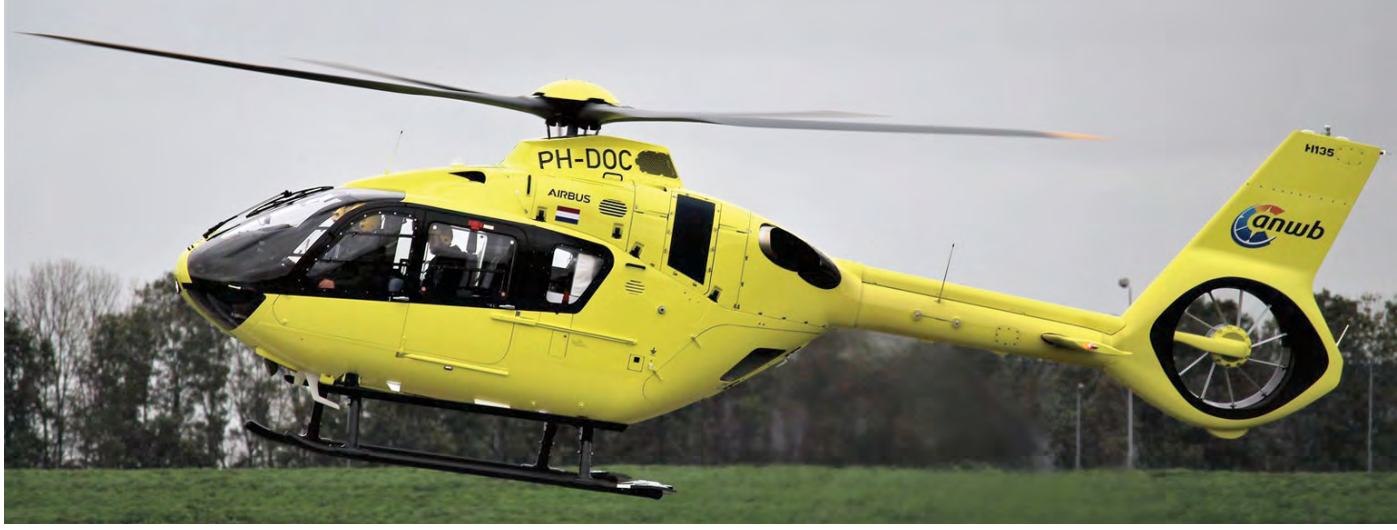
Test registration of this ANWB H135 was D-HECM. Delivered from Airbus Donauworth to Lelystad on 30 September 2019, PH-DOC is seen touching down, and will replace PH-MMT as Lifeliner 4 when the latter will be withdrawn from use in December 2019. Before that a medical kit needs to be installed first though and striping nees to be added. (Lelystad, 4 November 2019, Jan Bekker)

Credits: Inspectie Leefomgeving en Transport, ballonregister.nl.