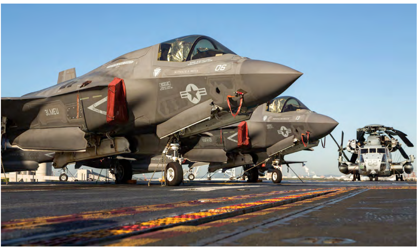
Two Marines F-35B Lightning IIs and a CH-53E of 31st Marine Expeditionary Unit (31st MEU) seen on the deck of the USS Wasp (LHD-1) on 27 July 2019. (Brisbane, Richard Ennis)

97-0100, E-8C-20, 19986/730/P-11, nov18, N707MB 97-0200, E-8C-20, 20317/826/P-12, mar19, CAN 13703 97-0201, E-8C-20, 20318/829/P-13, feb17, CAN 13704 99-0006, E-8C-20, 19998/750/P-14, mar19, 68-11072 00-2000, E-8C-20, 20043/786/P-15, sep19, 85-6973 01-2005, E-8C-20, 19382/627/P-16, mar18, N7567A 02-9111, E-8C-20, 19581/638/P-17, mar19, 81-0896 02-9111 is marked 'Let's Roll / Pride of Lake Charles'