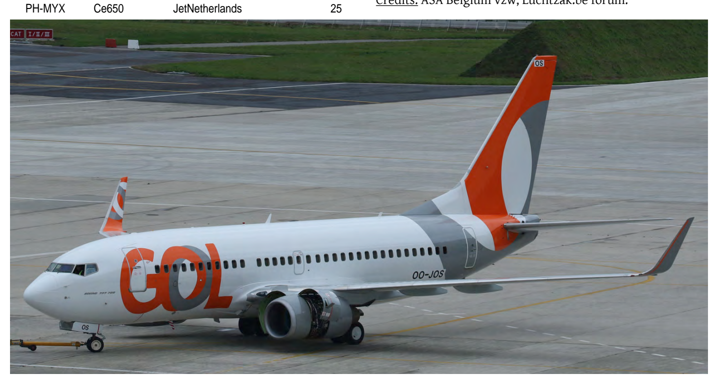
This former TUI Belgium Boeing 737 has been acquired by GOL and was photographed on the day it performed a local test flight, still registered as OO-JOS. (Brussels, 22 October 2019, Mathijs Clottens)