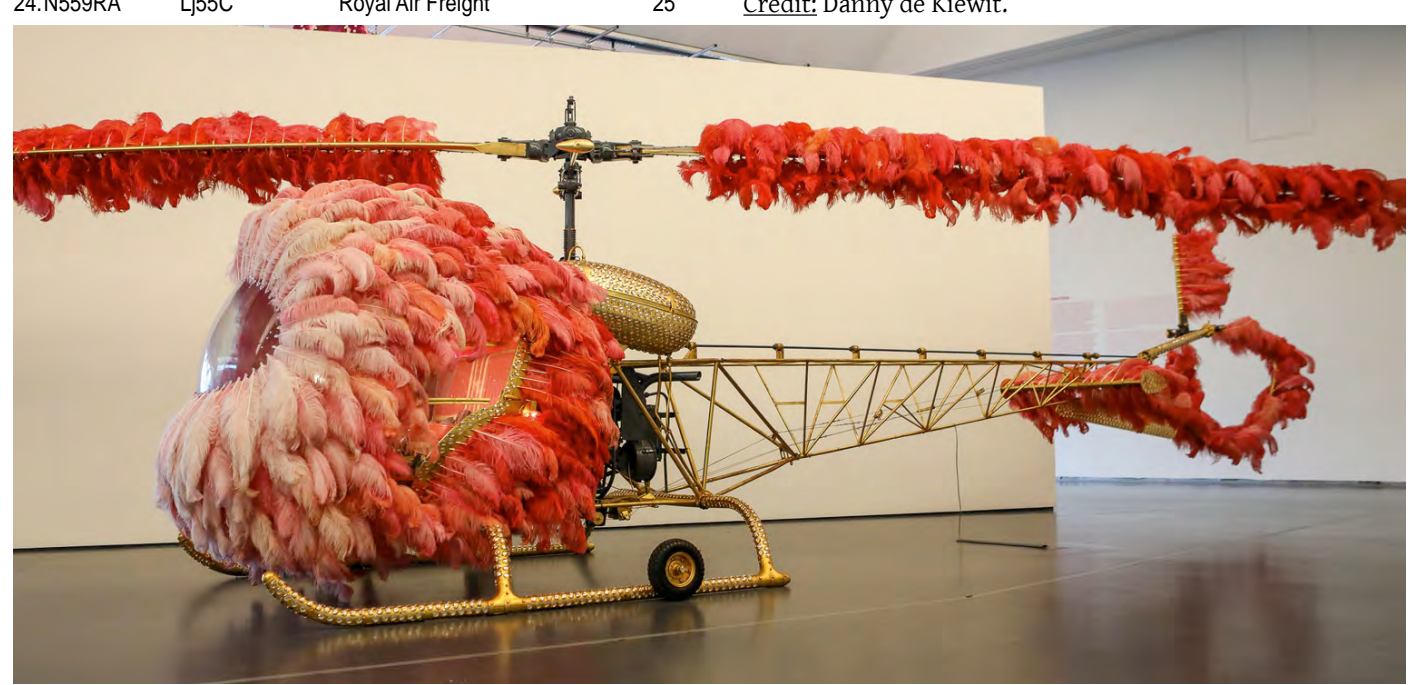
Portuguese artist Joana Vasconcelos has used a former 1951 US Army Bell H-13E-BF Sioux for an artwork called Lilicoptère. The military serial for this helicopter was 51-13973 (msn 738). It was first shown at Château de Versailles in Versailles in 2012. (Rotterdam / Kunsthal, 6 October 2019,)