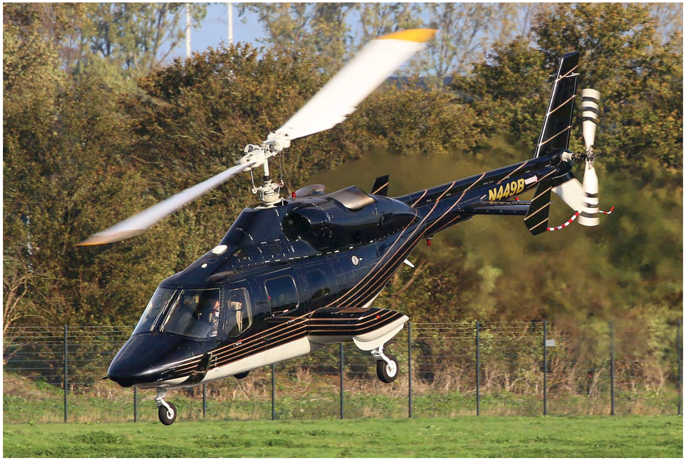
The Bell 230 is an improved development of the Bell 222, a type mostly known for its part in the 'Airwolf' TV series. Kees Harteveld captured N449B on 26 October 2019 just after lift off from Rotterdam - The Hague airport.