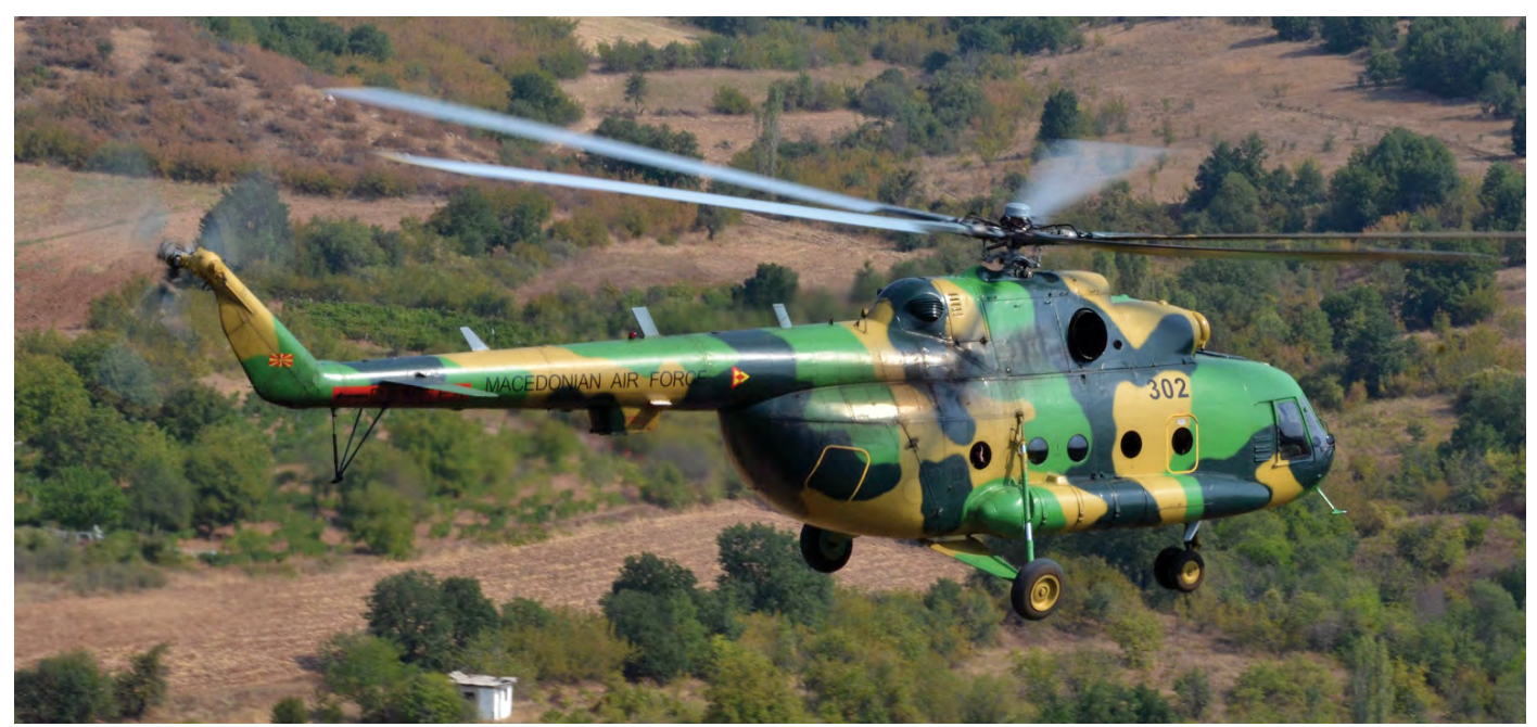
The Transport Helicopter Squadron operates four Mi-8s and two Mi-17s and all of them have this very effective camouflage. Unfortunately two Mi-17s have been lost by crashes.