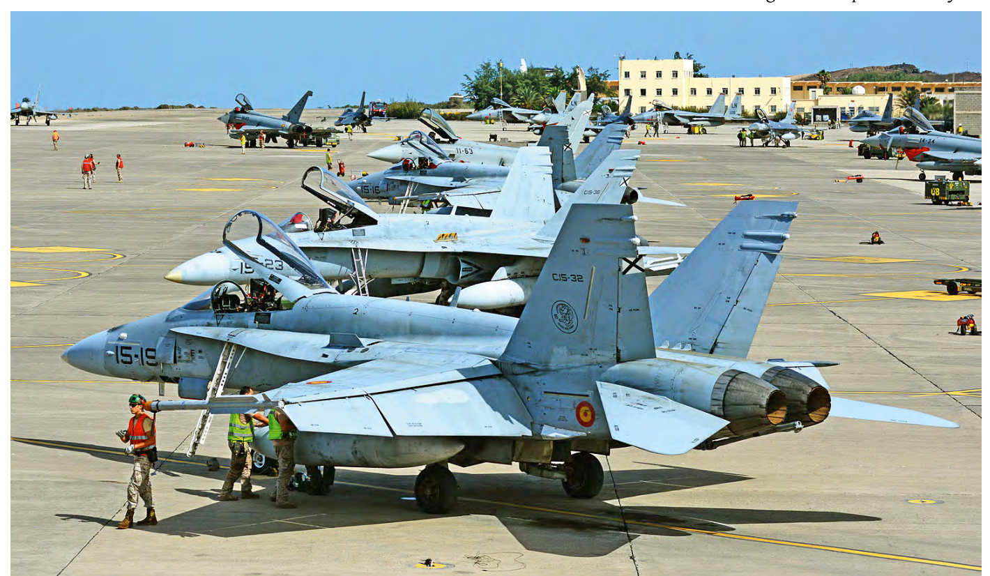
Eric Tammer captured a rather busy and full apron at Base Aérea de Gando, the military side of Gran Canaria Airport. In the front of his camera we see some Spanish Hornets and behind are multiple Spanish Tifóns. Further back are Turkish Vipers and American Eagles visible. Next month we will provide a full report. (28 October 2019)

On both 6 and 7 November 2019, a brand-new HH-60W Combat Rescue Helicopter arrived at Eglin AFB (FL), their new home with the 413th Flight Test Squadron (FLTS). They will be used in the development test programme. The HH-60Ws flew in from Sikorsky's Stratford facility (CT) and will be tested at Eglin. These two are the impulse for the USAF to purchase a total of 113 Whiskeys that will eventually replace the USAF's HH-60G Pave Hawk fleet. The USAF already purchased ten Lot 1 HH-60Ws within the FY18 budget. It is expected to buy an