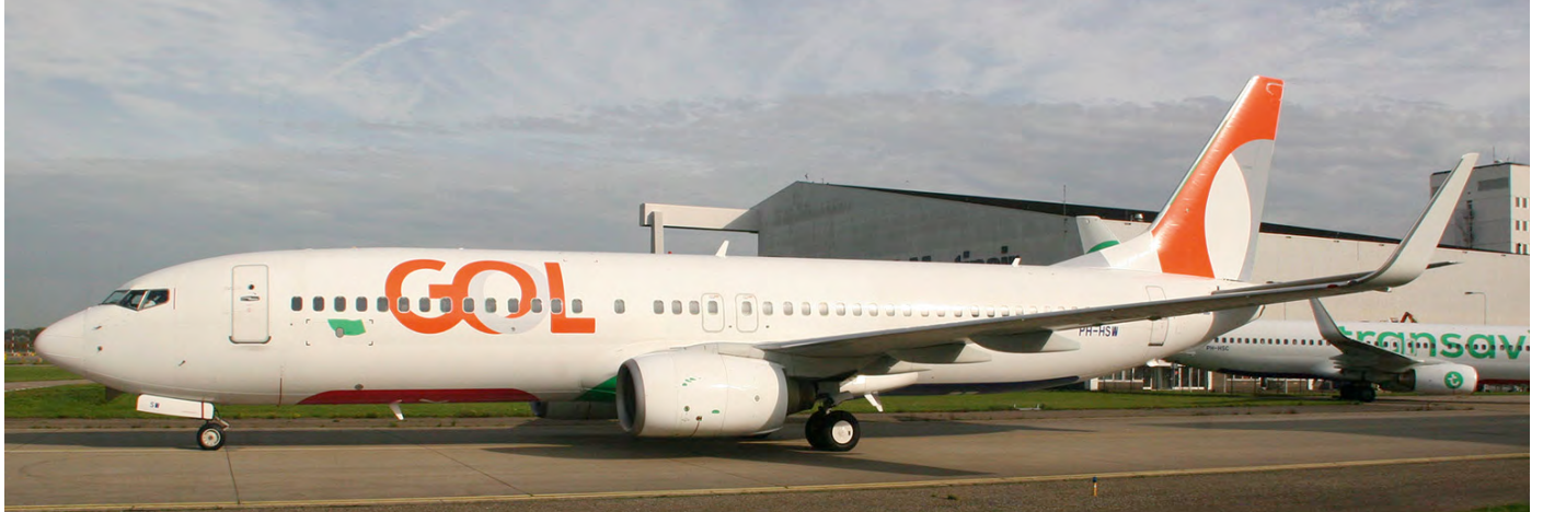
Transavia will be leasing a fair amount of Boeing 737s to GOL this winter. In November some more will venture to Brasil. PH-HSW was the second aircraft to be ferried to South America. (Amsterdam - Schiphol, 24 October 2019,)