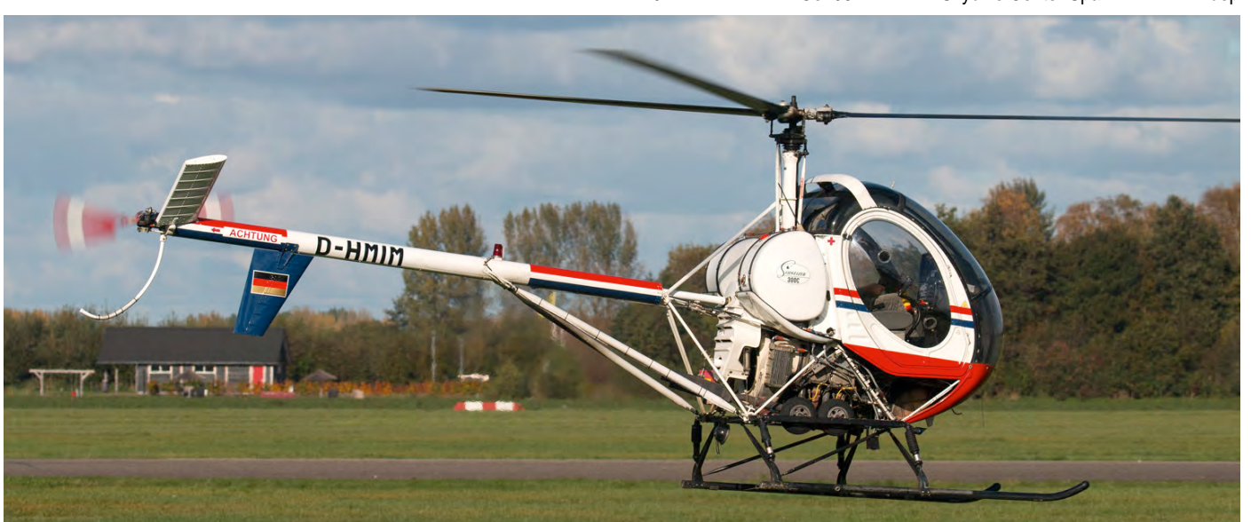
D-HMIM is based at Lelystad airport. Although owned by S.P. Luftbild this H269C is currently being used by Rotor and Wings. (Teuge, 29 October 2019)

0ctober 2019 01.D-FLIZ Ce208 Skydive Center Spa dep