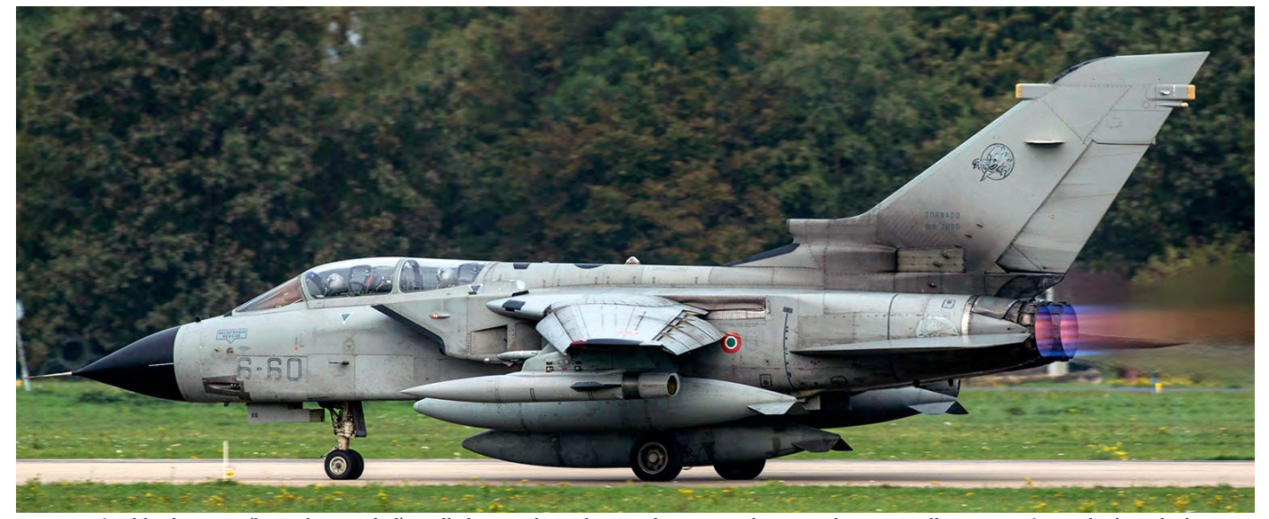
As part of Cold Igloo 2019 (hosted at Buchel), Volkel got to host three Italian Tornado IDSs. They normally operate from Ghedi with the 154st Gruppo and 6th Stormo. In the tail of MM7086 the well known 6 Stormo Demon character can be seen, preparing its departure back to Italy. (Volkel, 24 October 2019, Jeroen Jonkers)