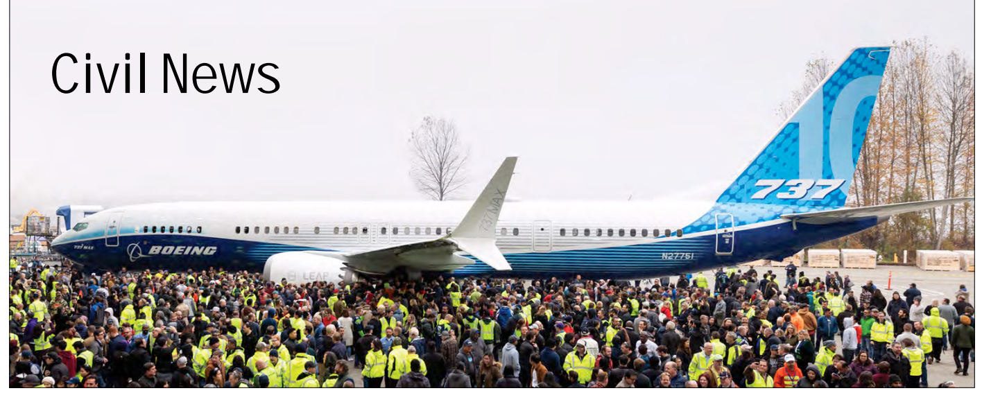
Friday 22 November 2019 was the roll-out of the newest and longest member of the plagued 737 MAX family, the 737 MAX 10 (registered N27751, msn 66122). Due to the 737 MAX crisis it was a quiet and non-media event, only attended by Boeing employees. (Renton (WA), 22 November 2019)