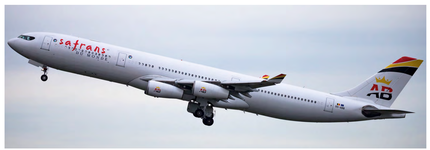
On the day this photo was taken Airbus A340 OO-ABB departed to France, to start an air cruise for the Safrans Du Monde organisation. The tour began on 26 October in Paris and ended on 16 November, again in Paris. (Brussels, 25 October 2019,)