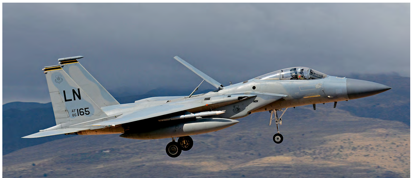
Ocean Sky 2019 XIV was a large multinational exercise that took place from the military side of Gran Canaria - Gando Airport in October 2019. Next month we will provide a full report, this month a teaser in the form of F-15C Eagle 86-0165/LN of 493rd FS. (23 October 2019, Eric Tammer)

Detachment 3 had previously operated the RQ-4 out of Guam, while Detachment 4 had also formerly operated the Global Hawk out of Sigonella AB (Italy).