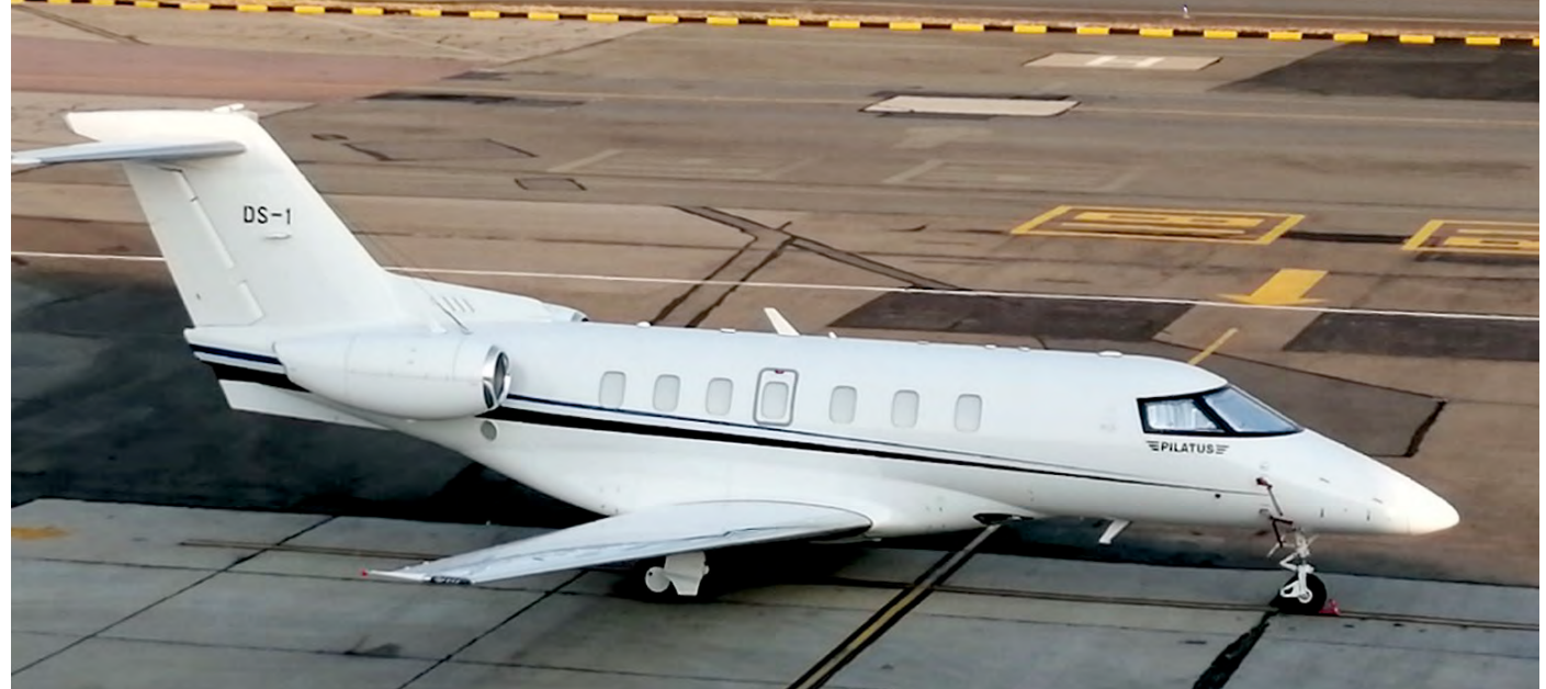
The first military customer, not counting Switzerland, for the Pilatus PC-24 is Botswana. Serial DS-1 has construction number 114 at Lanseria, South Africa. (20 September 2019)

The Lincoln Carrier Strike Group will remain on station in the Middle East while its relief carrier is still undergoing unexpected repairs on the US East Coast. USS Abraham Lincoln (CVN-72) left homeport on 1 April 2019, and is now just over eight months on deployment and is facing another extension so it could stay on station in the North Arabian Sea and the Gulf of Oman a little longer, so no "carrier-gap" is created. Extending a carrier strike group deployment is not unprecedented. But, the US Navy had wanted to get in the practice of using an Optimized Fleet Response Plan (OFRP) construct, built on a 36-month cycle involving a seven-month deployment and about 29-months of training, maintenance and surge capacity. Earlier this month, is was announced that the US was sending additional troops to Saudi Arabia at the request of US Central Command following the suspected of