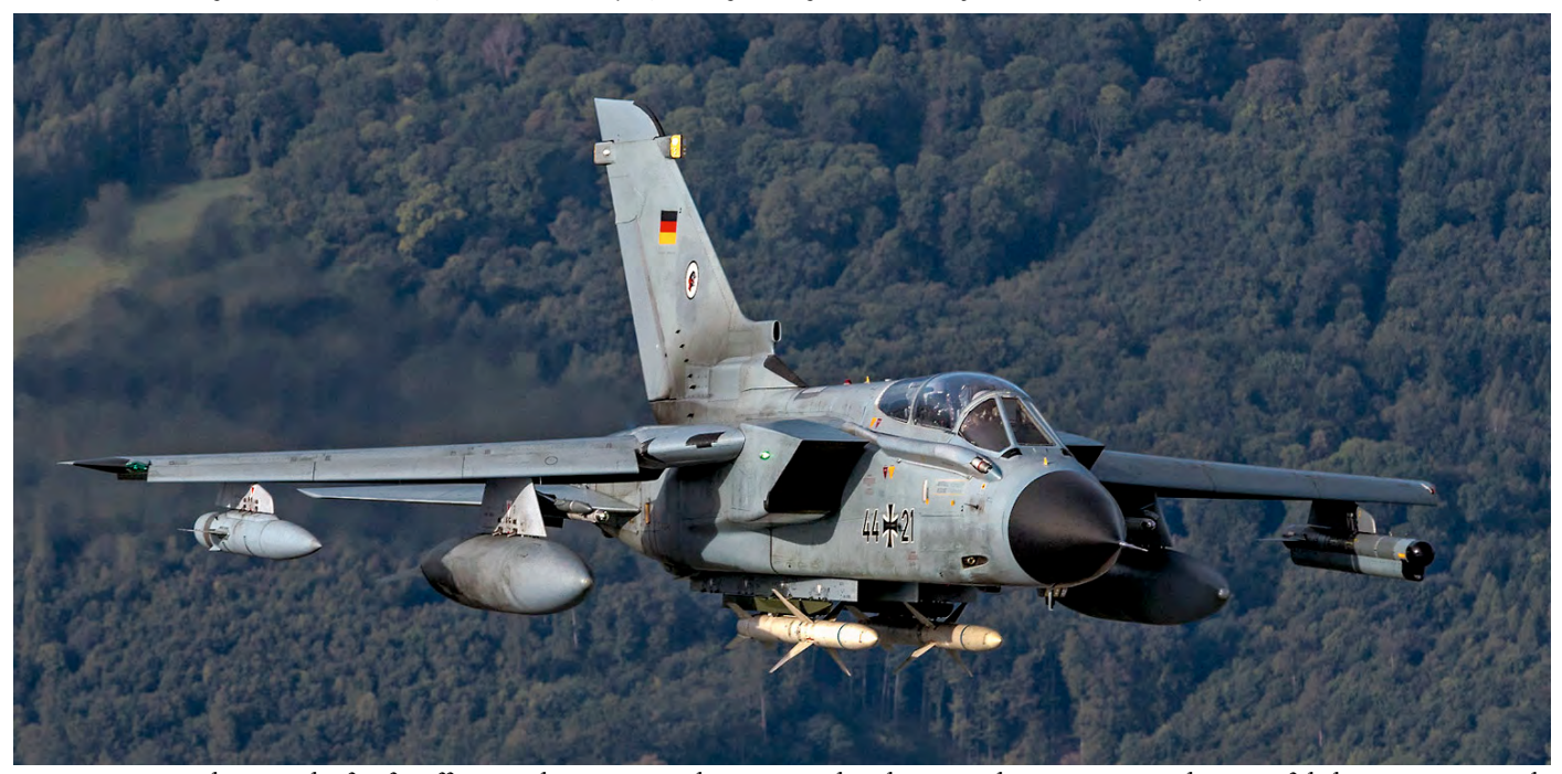
Dramatic action photograph of Luftwaffe Tornado 44+21, seen during arrival at the NATO days at Ostrava. The aircraft belongs to TLG51 and was photographed by Hans Antonissen on 20 September 2019.