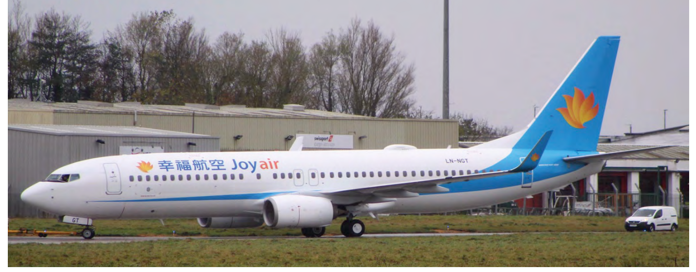
Joy Air is a Chinese regional airline majority owned by aircraft manufacturer AVIC1. It currently operates a fleet of 25 MA-60 aircraft and has outstanding orders for ten ARJ21s and twenty C919s. But besides the all Chinese aircraft fleet, it recently added its first Western built aircraft in the form of a brand new 737-800. This aircraft will get company from two ex Norwegian 737-800s. One of them is LN-NGT, which is seen here in full Joy Air colours at Shannon. It will be registered as B-20E6 upon delivery to China. (3 November 2019,)