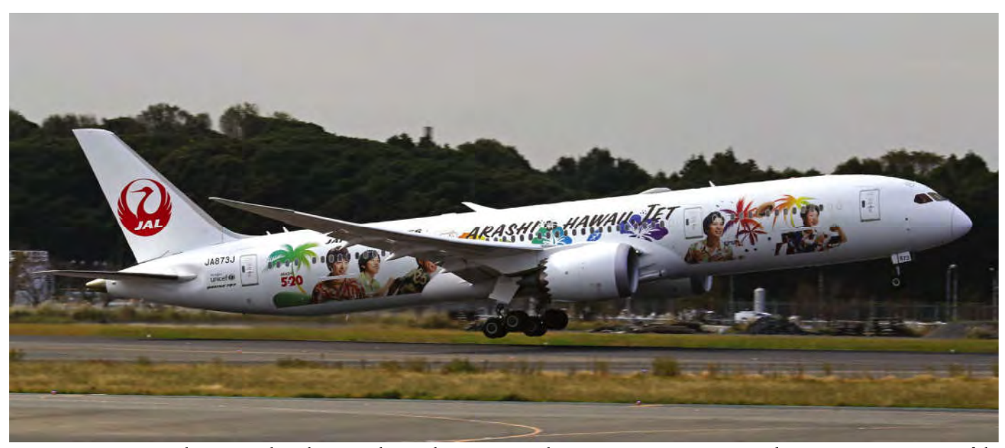
In May 2019 Japan Airlines introduced a special "Arashi Hawaii Jet" livery on Boeing 787-9 Dreamliner JA873J, in support of the boy band from Japan. The group Arashi is on their 20th anniversary tour, named the "Arashi Anniversary Tour 5×20". (Tokyo-Narita, 9 November 2019,)