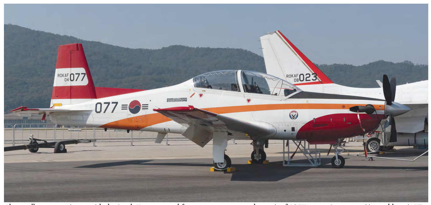
Almost all types now in use with the South Korean armed forces were present on the static of ADEX2019 at Seongnam. Pictured here is KT-1 04-077, photographed by Paul van der Linden on 14 October 2019.