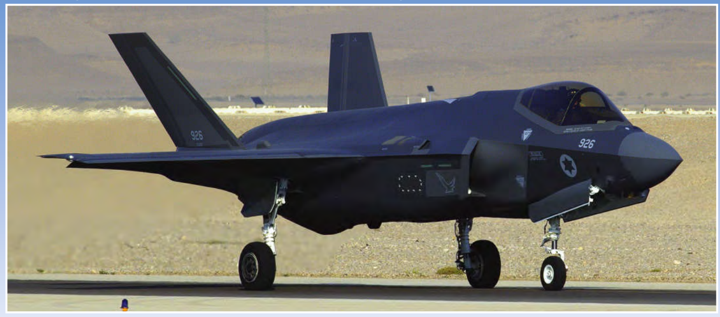
Exercise Blue Flag provided some good photo opportunities of nice aircraft, like the seventeenth Israelian F-35i, the 926 of 140th sq. (Ovda, 11 November 2019)