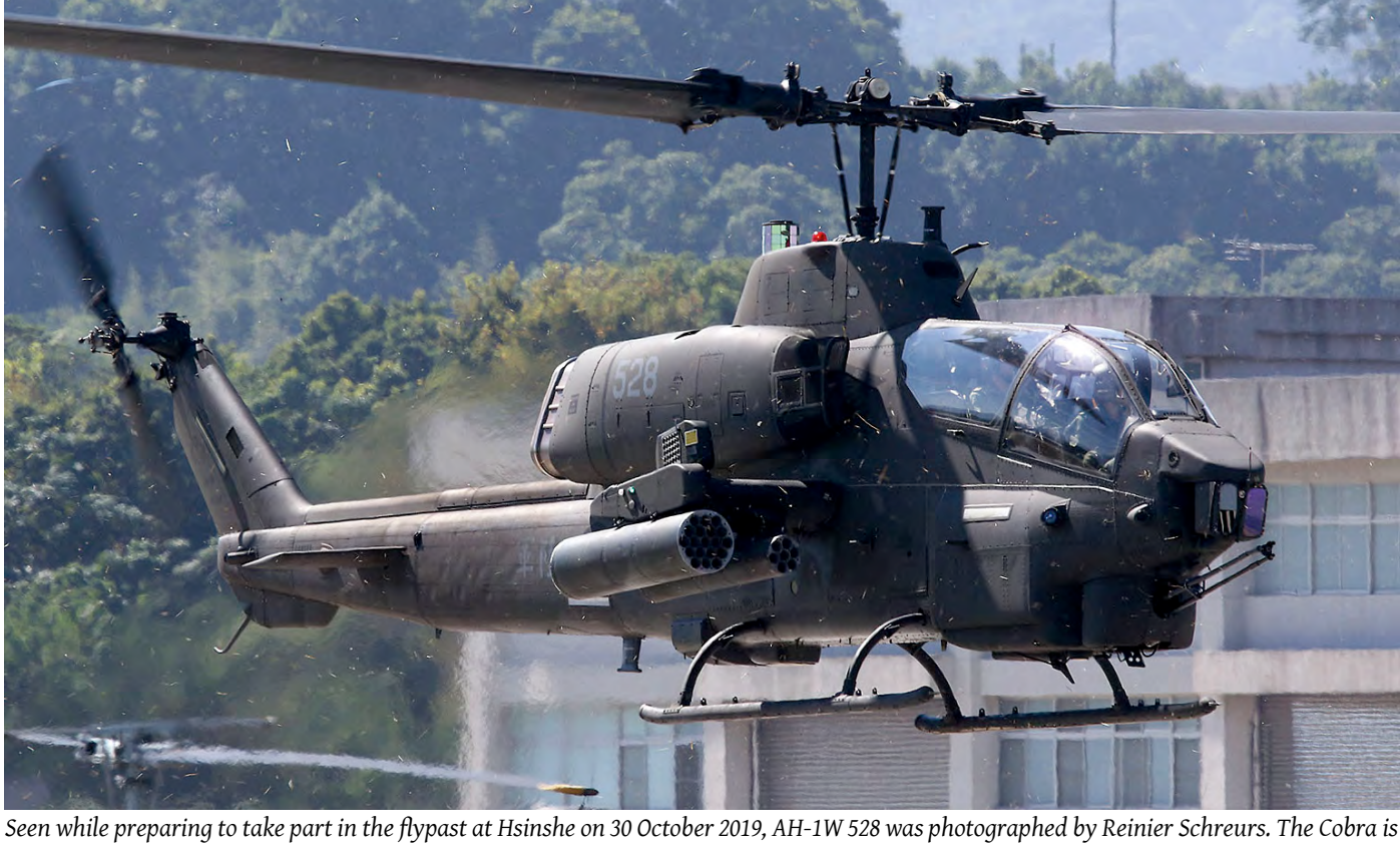
part of the 602nd Attack Helicopter Group.