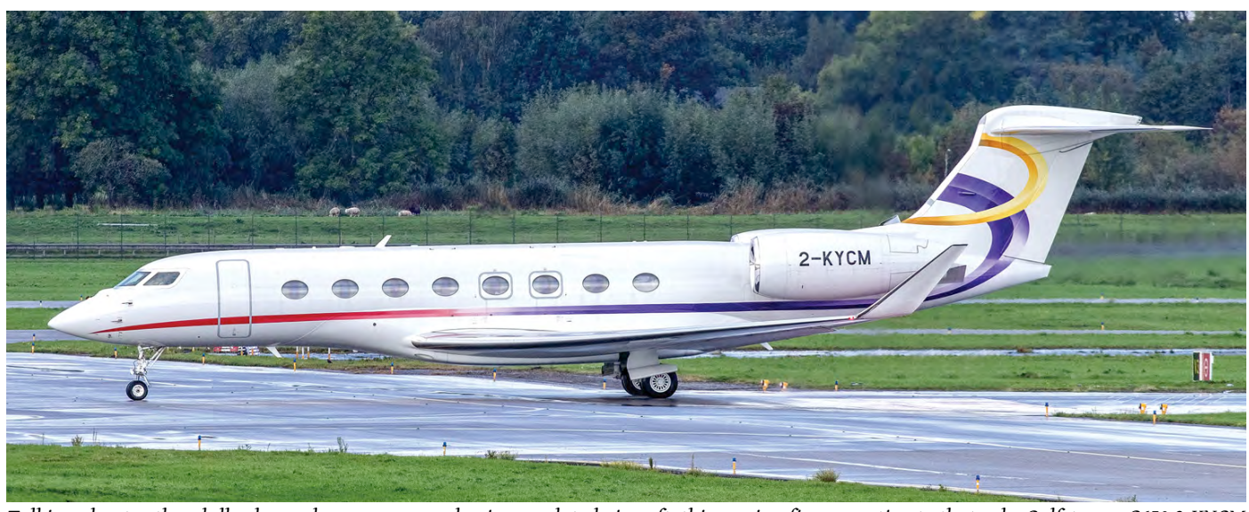
Talking about rather dull colour schemes on many business-related aircraft, this one is a fine exception to that rule. Gulfstream G650 2-KYCM belongs to Deer Jet and was registered in August 2018. (Rotterdam-The Hague, 3 October 2019,)