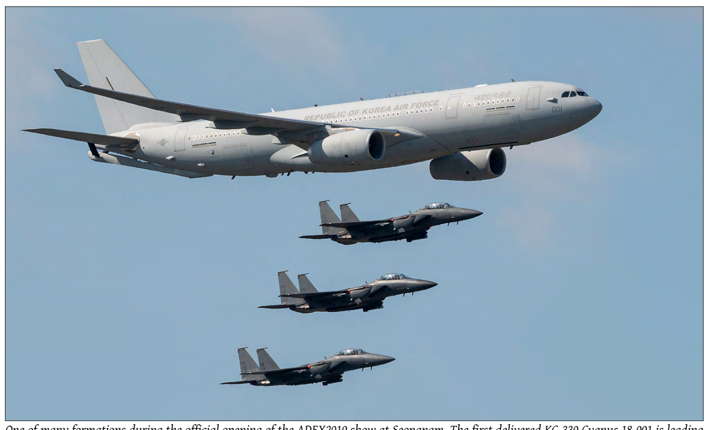
One of many formations during the official opening of the ADEX2019 show at Seongnam. The first delivered KC-330 Cygnus 18-001 is leading three F-15Ks of the 11th Fighter Wing. (15 October 2019, Paul van der Linden)